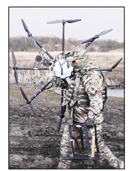
In this handout photo taken from video released by Russian Defense Ministry Press Service on March 25, a Russian soldier carries a captured Ukrainian drone restored and modernized by the military at an undisclosed location in Ukraine. (AP)

traffic and disrupt a vital shipping port. At least eight people went into the water. Two survived but the other six, part of a construction crew that had been filling potholes on the bridge, were missing and presumed dead. (AP)