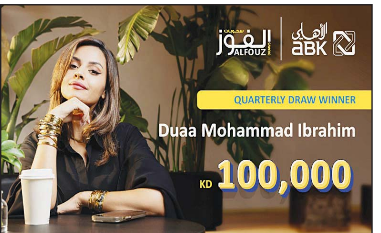
Alfouz Quarterly Winner flyer.

To learn more about the Alfouz account and its range of exciting draws and prizes, please follow the ABK's Instagram account @ abk_kuwait, visit eahli.com, contact Ahlan Ahli 1 899 899 or visit one of the Bank's branches across Kuwait.