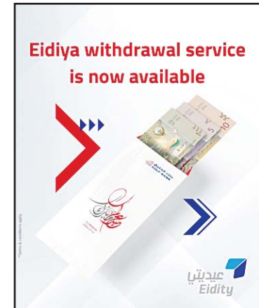
Gulf Bank Eid Fitr flyer

easy and simple steps. Gulf Bank's vision is to be the leading Kuwaiti Bank of the Future. The Bank is constantly engaging and empowering its employees as part of an inclusive and