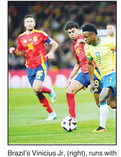
the ball during a friendly soccer match between Spain and Brazil at the Santiago Bernabeu stadium in Madrid, Spain.

the end of the match. "Yamal and Endrick are players