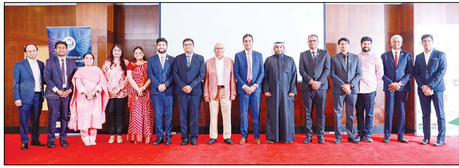
A group photo from the event.

The work of Ellenberg and his collaborators demonstrates yet another way that AI is a very powerful tool. But to solve very complex problems, at least for now, it still needs human ingenuity to guide it. (AP)