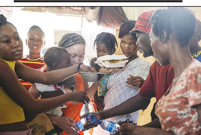
Women scuffle for plates of food for their children at a shelter for families displaced by gang violence, in Port-au-Prince, Haiti on March 22. Gangs have intensified their rampage in the downtown area of Haiti's capital, setting fire to a school and looting pharmacies across the road from the country's largest public

official told The Associated Press, vowing to recommend execution if he unsuccessfully appeals the ruling.