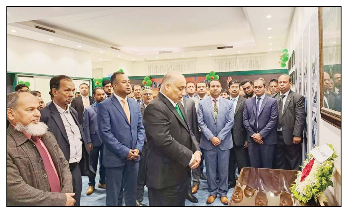
The ambassador placing floral wreath before the portrait of the Father of the Nation.

premises with the hoisting of the National