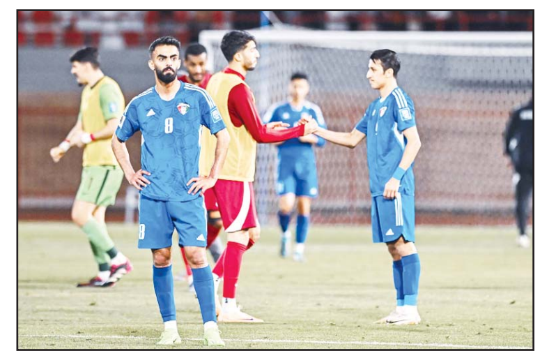
A Kuwaiti player looks dejected after Kuwait's loss to Qatar.

Kuwait pledges to address Gulf Cup Inspection Committee concerns