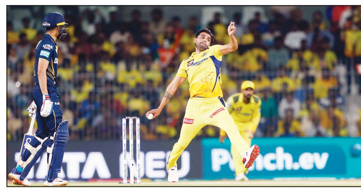
Chennai Super Kings' Deepak Chahar bowls a delivery during the Indian Premier League cricket tournament between between Chennai Super Kings and Gujarat Titans, in Chennai, India.

Chennai had defeated Royal Challengers Bengaluru by six wickets in the season opener while Gujarat notched a six-run win over Mumbai Indians.