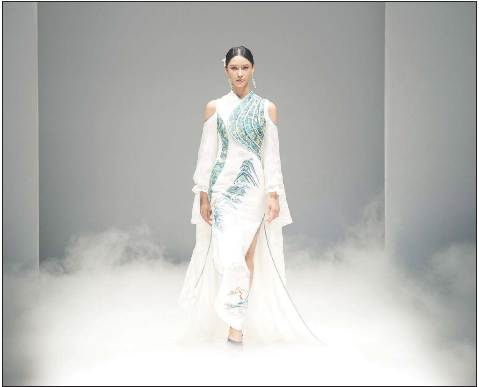
A model wears creations from Yazheng Guan during the China Fashion Week in Beijing, Wednesday, March 27. (AP)

Her new work continues in that vein with dark scenes and characters that can be difficult to read. Yet it also feels important because she gives agency to a group of girls who might not otherwise be seen and shows them to us in the full flush of youth, striving for recognition and glory. (AP)