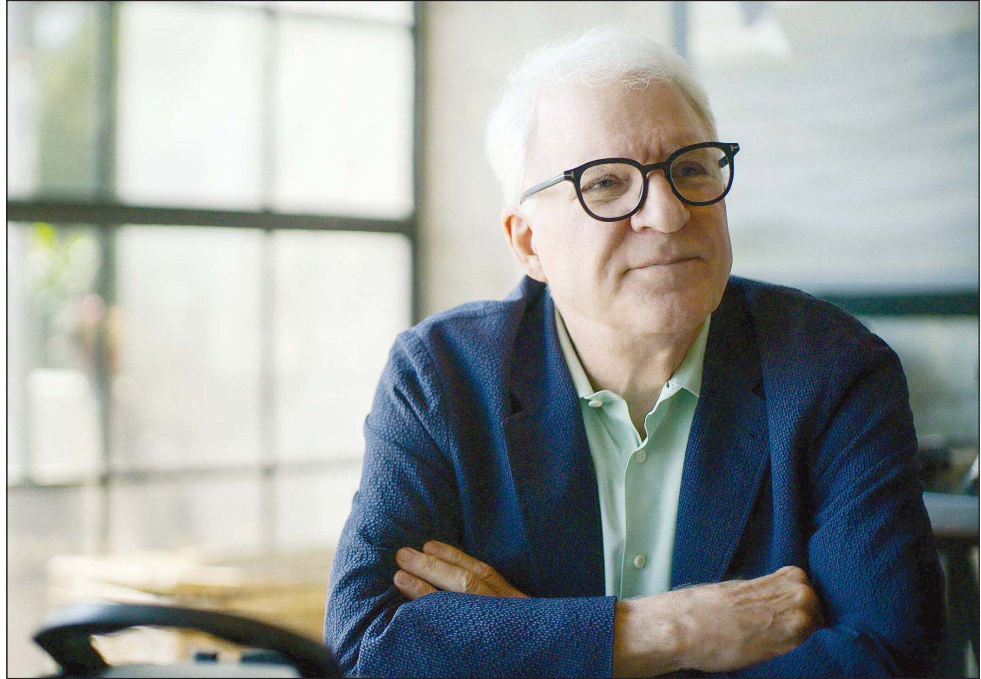
This image released by Apple TV+ shows Steve Martin in a scene from the documentary 'Steve! (Martin) a Documentary in 2 Pieces.'