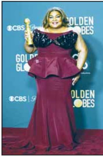
Da'Vine Joy Randolph poses with best actress award in supporting role for 'The Holdovers.'