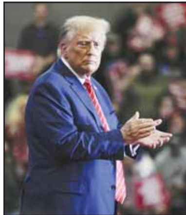
Republican presidential candidate former President Donald Trump stands on stage after speaking during a commit to caucus rally, Saturday, Jan. 6, 2024, in Clinton, Iowa.