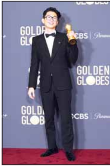
Lee Sung Jin poses with the award for best television limited series or motion picture for 'Beef.'