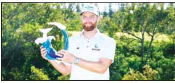
Chris Kirk holds the champions trophy after the final round of The Sentry golf event at Kapalua Plantation Course in Kapalua, Hawaii. (AP) - See Page 14