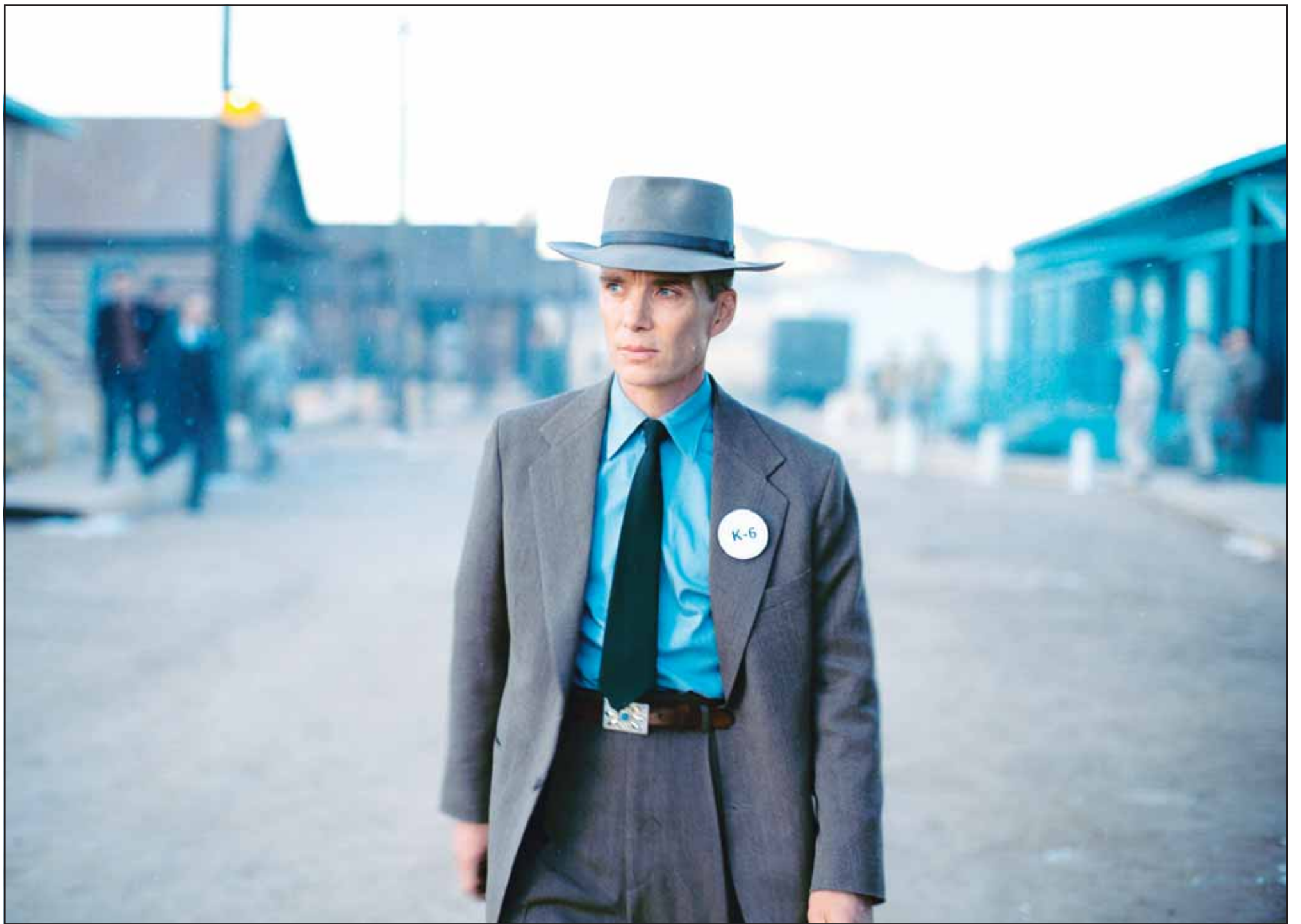
This image released by Universal Pictures shows Cillian Murphy in a scene from 'Oppenheimer.' (AP)