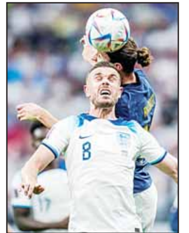
In this file photo, England's Jordan Henderson, (front), heads for the ball with France's Adrien Rabiot during the World Cup quarterfinal soccer match between England and France, at the Al Bayt Stadium in Al Khor, Qatar.

Jordan Henderson took plenty of flak when he decided to join the exodus of players moving to Saudi Arabia