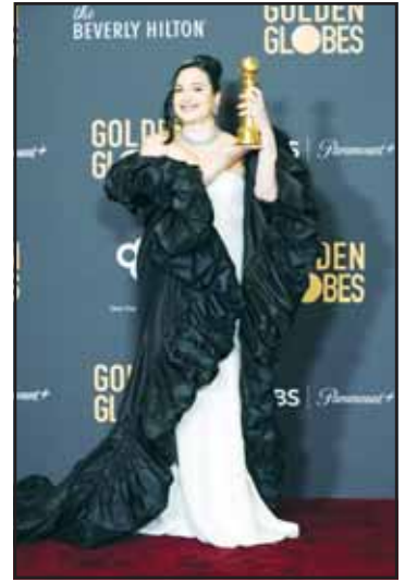
Lily Gladstone poses with best actress award for 'Killers of the Flower Moon.'