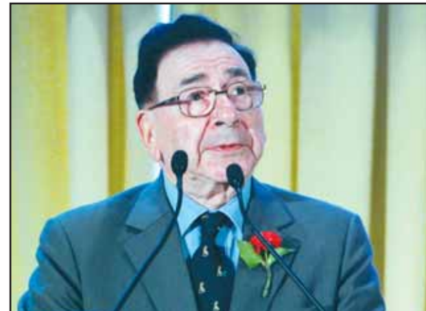
Sir Roy Calne, of Cambridge University, delivers an acceptance speech after receiving the 2012 Lasker DeBakey Clinical Medical Research Award for developing liver transplantation, an intervention that has restored normal life to thousands of patients with end-stage liver disease, Sept. 21, 2012 in New York.