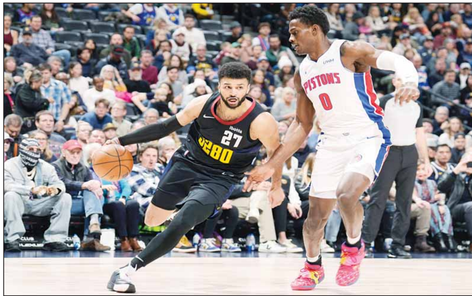
Denver Nuggets guard Jamal Murray (27) drives to the rim as Detroit Pistons center Jalen Duren (0) defends in the first half of an NBA basketball game.