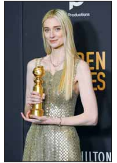
Elizabeth Debicki with her award for best supporting actor in a television series for 'The Crown.'