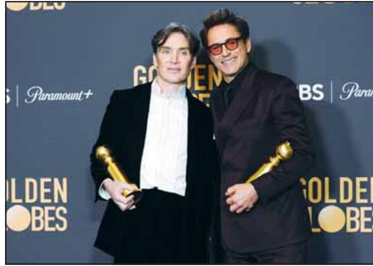
Cillian Murphy, (left), best actor award winner and Robert Downey Jr., winner of best actor in a supporting role award pose with their awards.