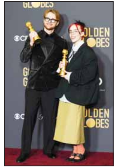
Finneas, (left), and Billie Eilish pose with award for best original song for 'What Was I Made For?'