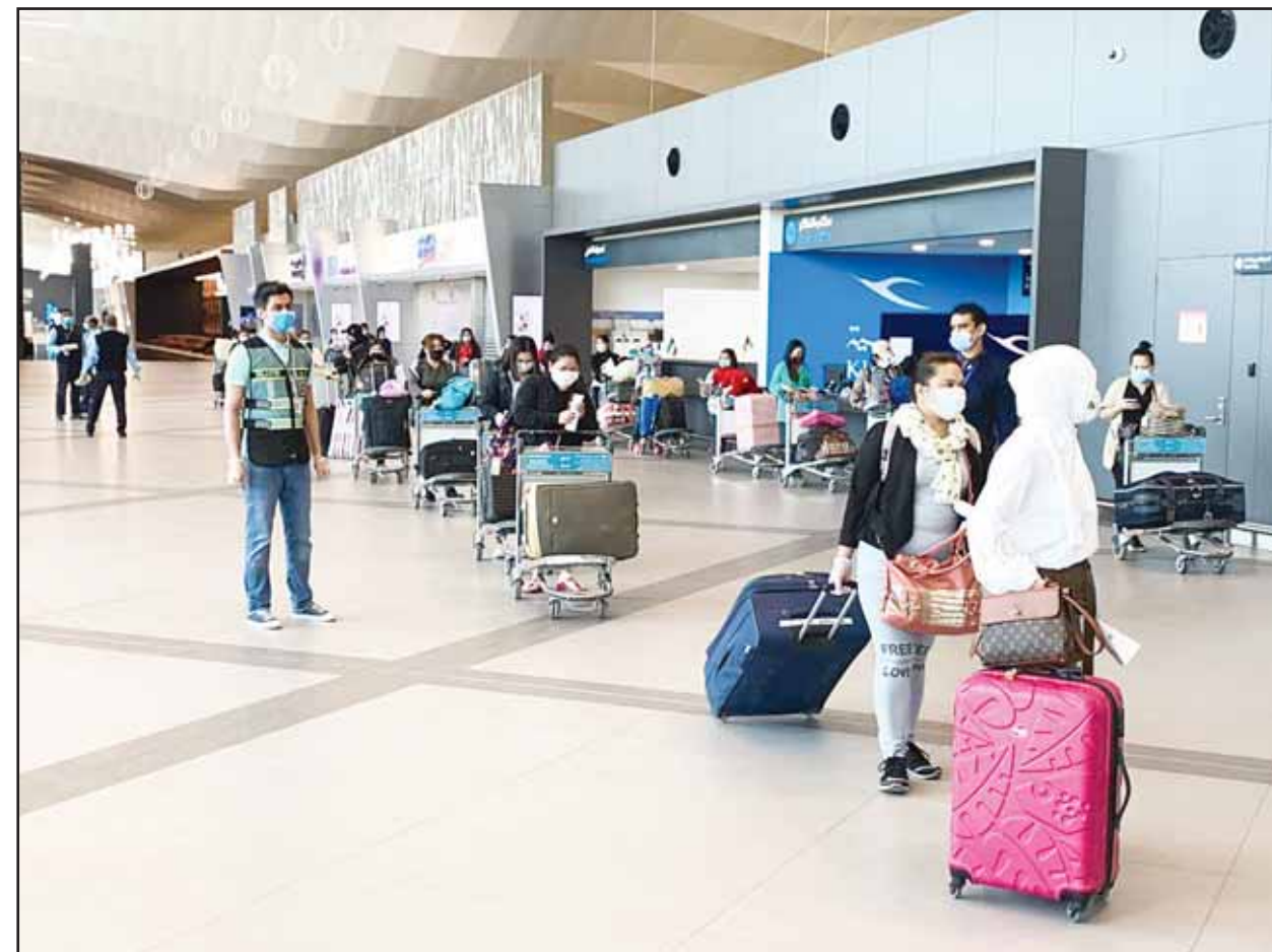
File photo shows domestic workers queue at the Kuwait airport.

KUWAIT CITY, Jan 8: Minister of Commerce and Industry and Minister of State for Youth Affairs Muhammad Al-Aiban has issued a decision setting the fees for recruiting domestic workers.