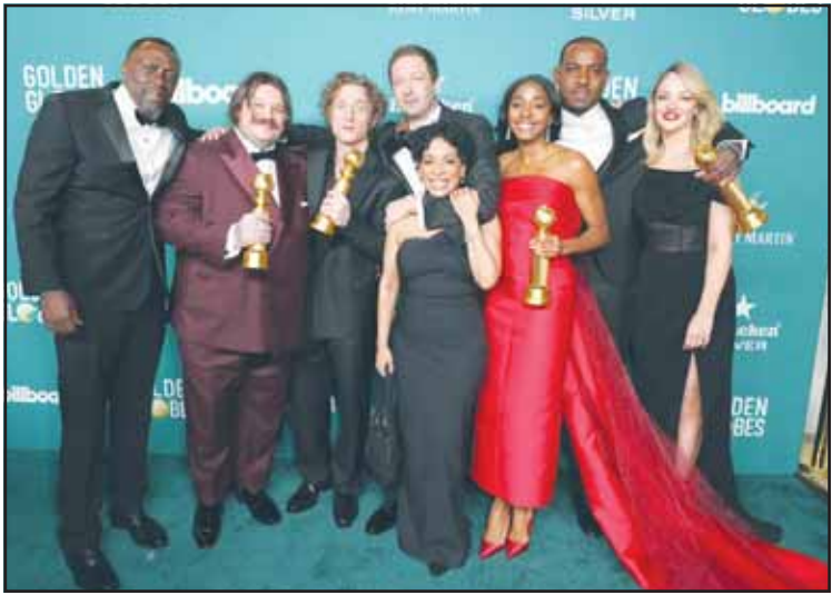
Edwin Lee Gibson, (from left), Matty Matheson, Jeremy Allen White, Ebon Moss-Bachrach, Liza Colon-Zayas, Ayo Edebiri, Lionel Boyce, and Abby Elliott, winners of the award for 'The Bear.'