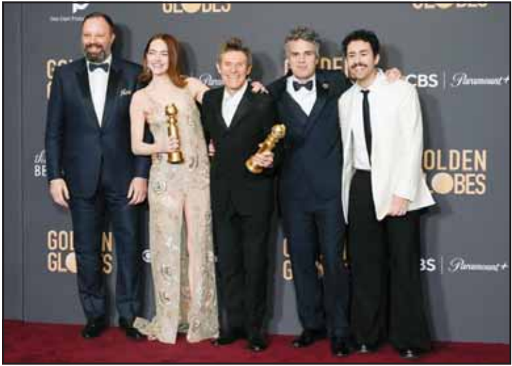
Yorgos Lanthimos, (from left), Emma Stone, Willem Dafoe, Mark Ruffalo, and Ramy Youssef pose with the award for best motion picture, musical or comedy for 'Poor Things.'