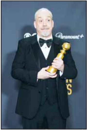
Paul Giamatti poses with best actor award in a musical or comedy for 'The Holdovers'.