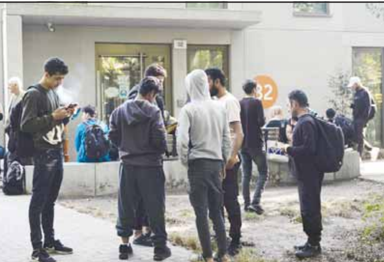
Dozens of people from all over the world line in front of the central registration center for asylum seekers in Berlin, Germany, Monday, Sept. 25, 2023. The number of people applying for asylum in Germany last year rose to 351,915, an increase of 51.1% compared with the year before.