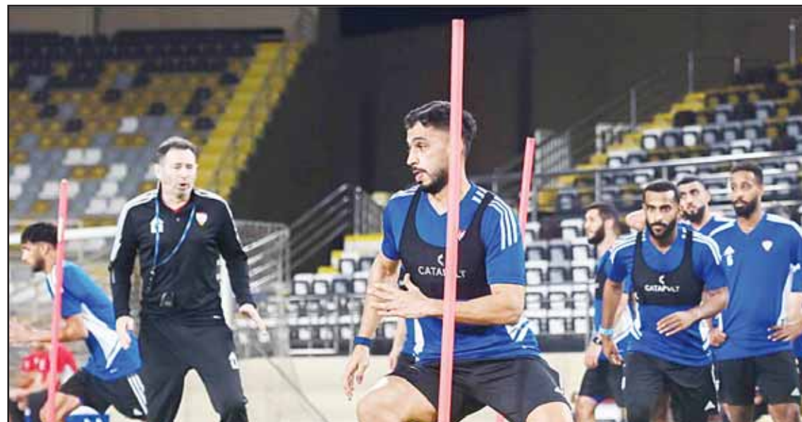
UAE coach looks on as players intensify training for the Asian Cup.

However, in the second friendly, they faced a defeat against the Omani team, with the opponent securing a single goal. The technical staff prioritized the involvement of a substantial number of players in both matches to assess their technical and physical readiness for the upcoming tournament.