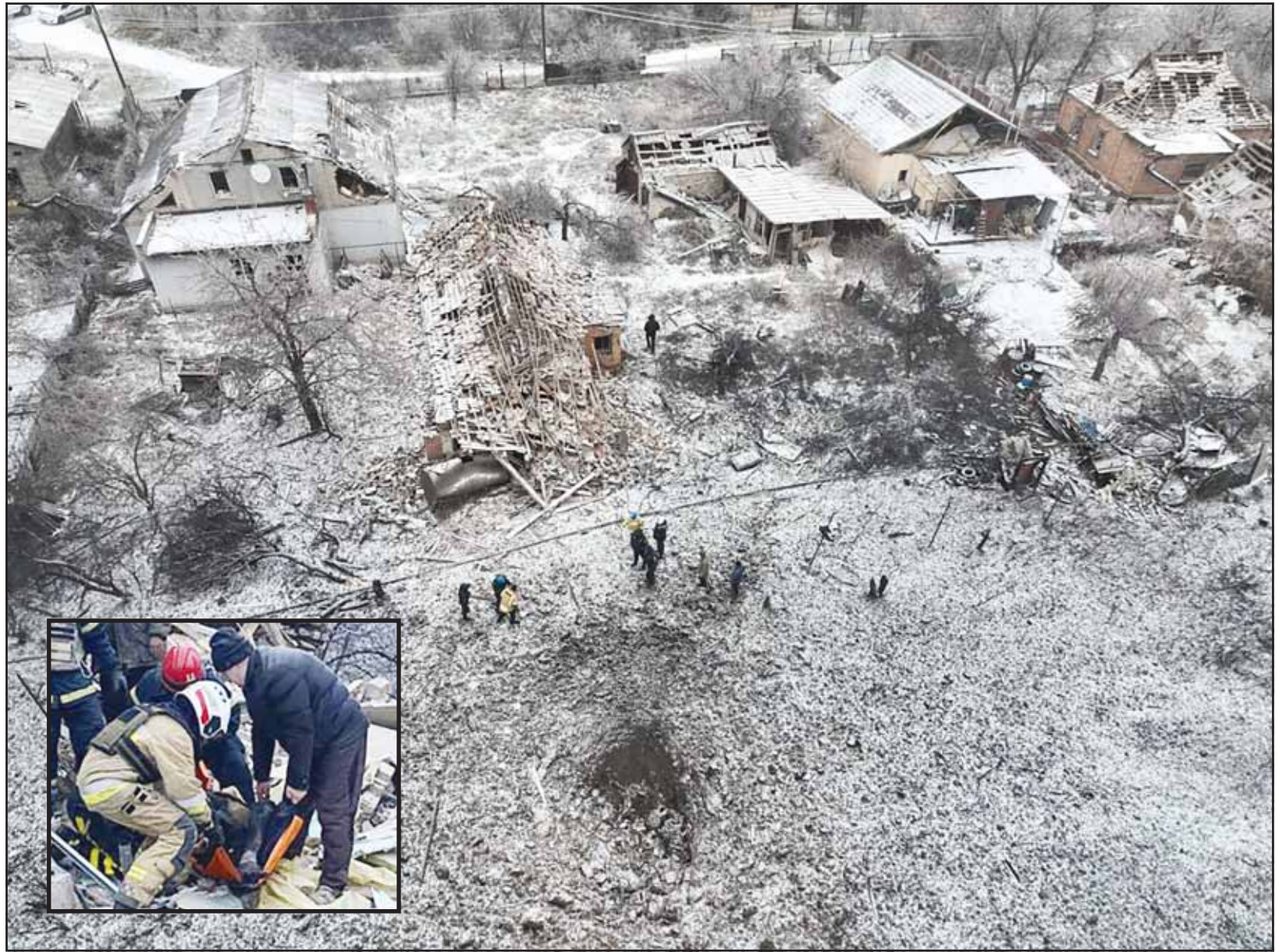
In this photo provided by the Ukrainian Emergency Service, a view of private houses damaged by a Russian missile attack in Novomoskovsk near Kryvyi Rih, Ukraine, Monday, Jan. 8, 2024. Inset: Rescuers help a wounded person after residential houses were destroyed by a Russian missile attack.

"This is a personal strength of his, and his ability to do this in an emotional way that connects with people is not to be underappreciated," Bedingfield said. "Because these are hard things to talk about. And it's hard to talk about them in a way that doesn't make people feel defeated. And he can do that."