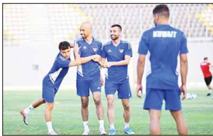
Kuwait players hold training session.

the double-header against Qatar in March for the joint qualifiers leading to the 2026 World Cup finals in the United States, Canada, and Mexico, as well as the 2027 Asian Cup in Saudi Arabia. Simultaneously, the Olympic team's delegation is also departing today for Thailand to establish an external training camp, spanning until January 22. Throughout this period, the team will participate in a series of friendly matches. This camp serves as a crucial component of the preparations for the AFC U-23 Championship, scheduled to take place in Qatar from April 13 to May 3.