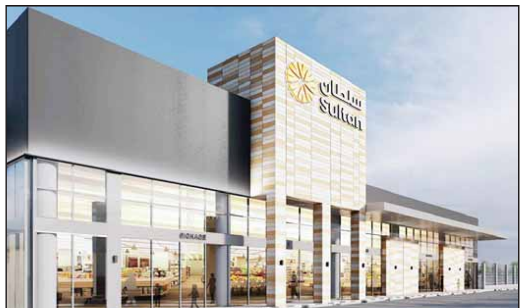
Sultan Mishref Store

We are also excited to announce that the next phase of the Sultan Mishref project will feature an additional area of 4,000 square meters, including a variety of retail spaces, facilities, essential amenities, and support programs. This is designed to further enhance the shop-