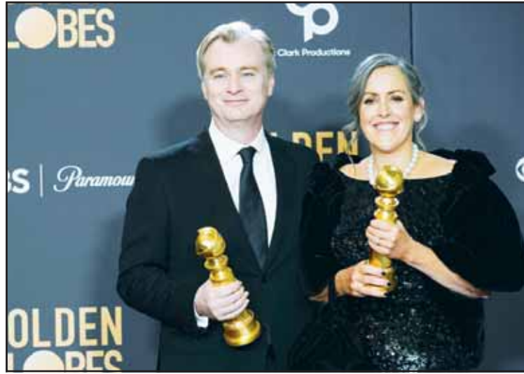
Christopher Nolan, (left), and Emma Thomas pose with the award for best motion picture, drama for 'Oppenheimer.'