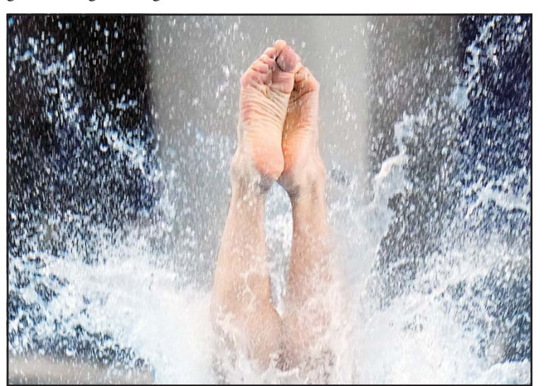
Cao Yuan of China competes during the men's 10m platform diving final at the World Aquatics Championships in Doha, Qatar, Saturday, Feb. 10, 2024.

In women's water polo Saturday, Australia, Canada, Greece and the Netherlands advanced to the quarterfinals.