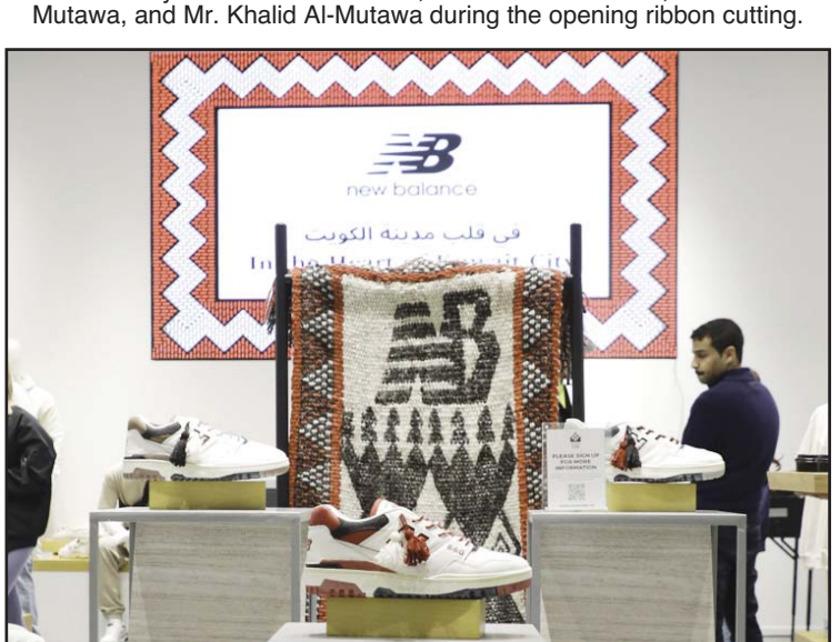
New Balance branch opened in Capital Mall.