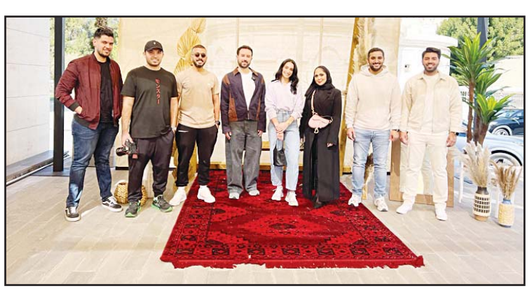
A glimpse of the event.