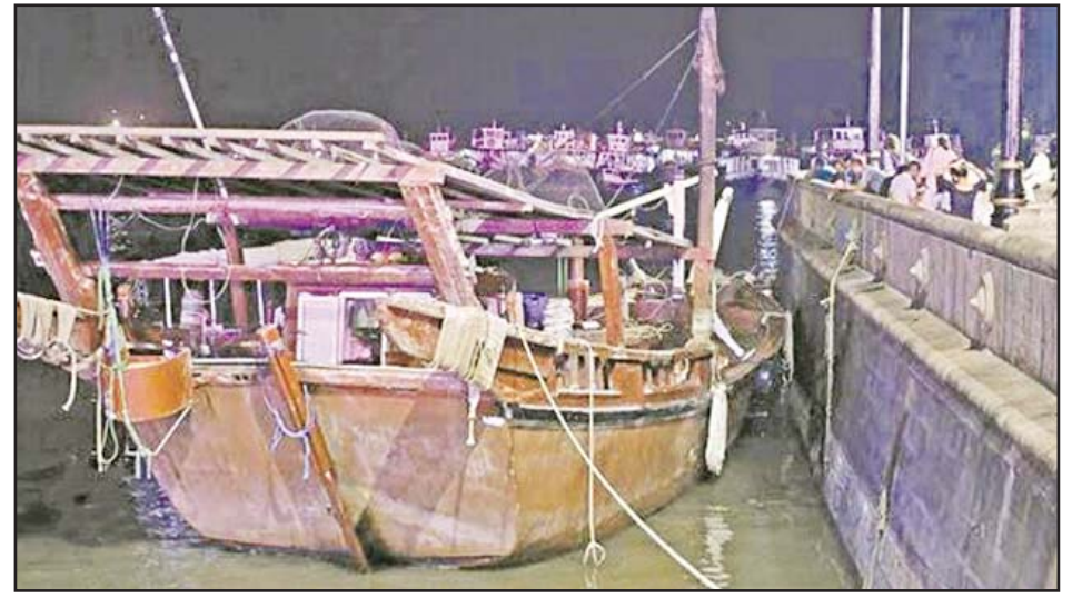
The alleged fishing boat on which the Indian workers fled to Mumbai

However, media reports, notably from India, highlighted the fugitives' allegations of mistreatment and unpaid wages, omitting Al-Sarhid's