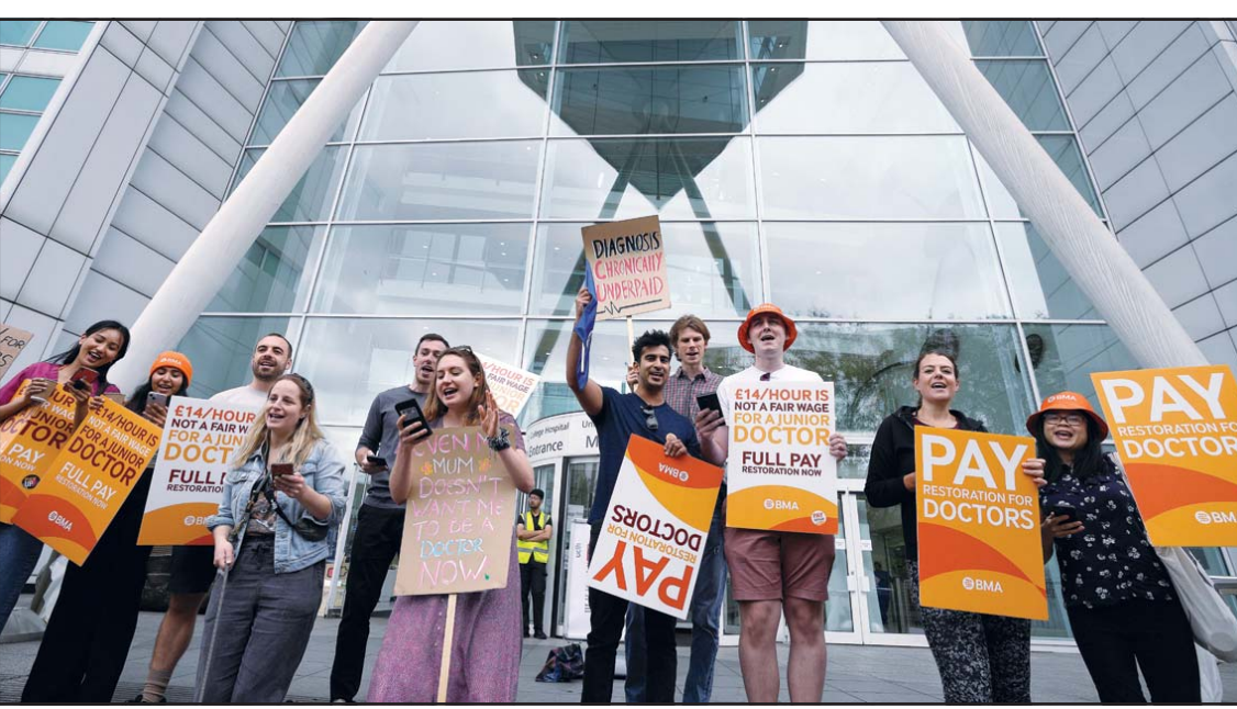
Junior doctor members of the BMA (British Medical Association) join the picket line at the University College Hospital in London, Monday, Aug. 14, 2023. Thousands of doctors in the early years of their careers in England are set to go on strike later this month for another five-day stretch as their long-standing pay dispute with the British government remains in stasis.

The upcoming strike means thousands more canceled appointments and perations, putting further pressure on the NHS to deal with a backlog that is likely to be a key issue in the general election later this year.