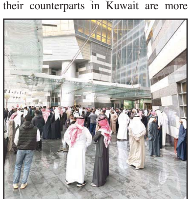
Teachers convened at the Ministry of Education headquarters on Sunday, marking the inaugural day of the implementation of the fingerprint attendance system, to express their perspectives on the decision.

He stated the parliamentary Education, Culture and Guidance Affairs Committee is working on bills aimed at developing education, but more bills are needed to protect the teachers' rights. He asserted that except Kuwait, education in all other Gulf Cooperation Council (GCC) countries has witnessed remarkable development; because their senior officials are keen on developing education, while