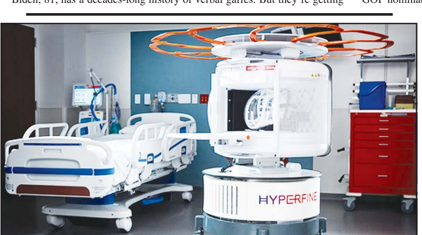
New Al-powered brain imaging software offers enhanced image quality and ease of

Kemp said several more negligence and product liability cases are pending against the company, including one scheduled to begin in May stemming from liver damage diagnoses of six children who ranged in age from 7 months to 11 years