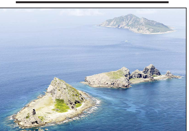
An aerial view of the tiny islands in the East China Sea, called Senkaku in Japanese and Diaoyu in Chinese are seen in Sept 2012. Chinese coast guard vessels have been passing by Japanese-claimed waters for weeks in the East China Sea and China's warships have been edging near Japan's southwestern islands in recent days, Japanese officials said on Feb 8.

The group said in a statement that "she had received threats and filed complaints, but they (authorities) did nothing! In January, gunmen burst into a home in