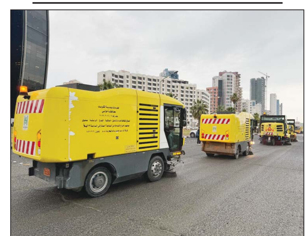
Municipality vehicles out in full force to clean up the streets and coastal areas.

The fingerprint system is linked to several regulatory bodies, including the Civil Service Commission and the State Audit Bureau