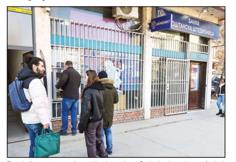
People line up at a cash machine in northern Serb-dominated part of ethnically divided town of Mitrovica, Kosovo, Thursday, Feb. 1, 2024. The European Union on Thursday called on Kosovo to postpone an effort to force ethnic Serbian-dominated areas to adopt the same currency as the rest of the country, as rules that would block use of the Serbian dinar went into effect. Most of Kosovo uses the Euro, even though the country is not part of the EU, but parts of its north populated mostly by ethnic Serbs continue to use the dinar. (AP)

"As a result, what we have is a direct risk that there will be a new outbreak of violence in the Balkans," he added