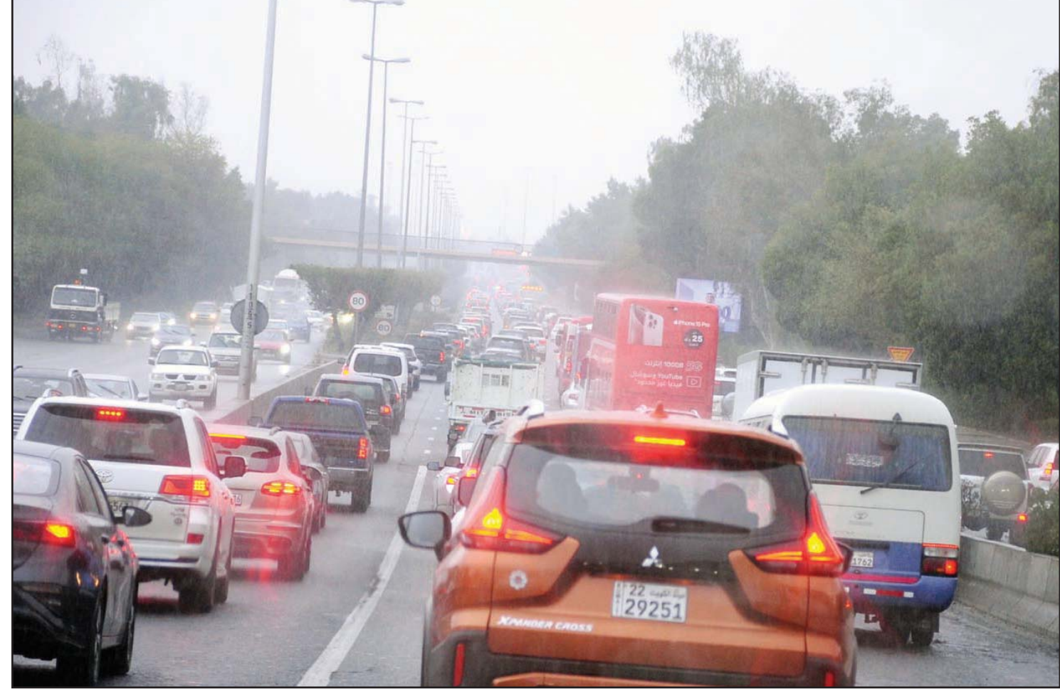
Traffic congestion grips Kuwait along the 4th Ring Road amidst thunderstorms on Sunday.