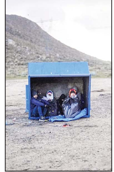
Asylum-seeking migrants from Peru and Ecuador take shelter from the wind and rain as they wait to be pro-cessed in a makeshift, mountainous campsite after crossing the border with Mexico on Feb 2 near Jacumba Hot Springs, Calif.