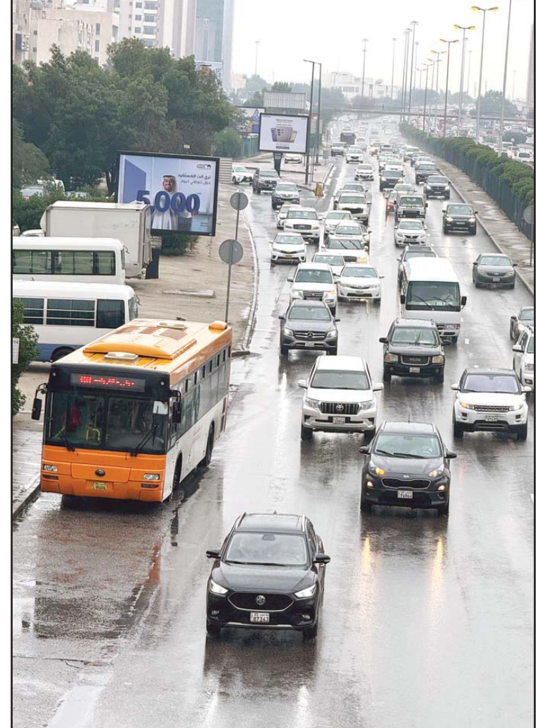
Kuwait encountered significant rainfall on Sunday, causing traffic congestion in certain areas

Given Kuwait's steadfast focus on sustainability, Sharif reiterated Kuwait Insurance Company's pledge to support the state's endeavors in alignment with Kuwait Vision 2035, which aims to realize comprehensive sustainability objectives.