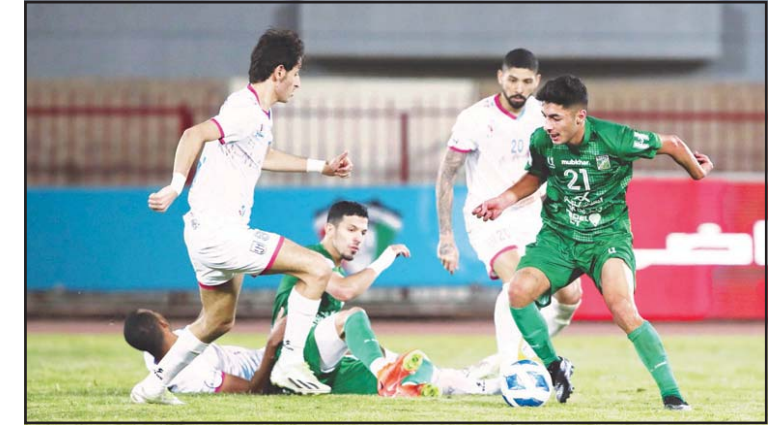
Al-Arabi dribbles past an opponent during Zain Premier League match.

Al-Arabi, currently with 33 points, approaches today's match with multiple objectives. The team aims to regain confidence following their exit from the Amir's Cup, where they suffered a 1-2 defeat to traditional rivals Al-Qadisiya in the semi-finals. Additionally, they seek to replicate their previous victory over Al-Jahra, having