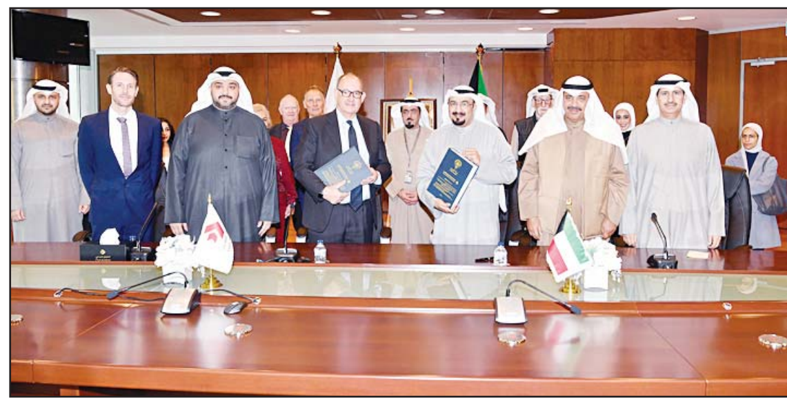
Kuwait Civil Aviation, German company sign KD 8 mln multi-projects contract.

Al-Otaibi added that the first project was an early warning system for wind shear, the second project was a disturbance detection system, while the third project was a Doppler radar