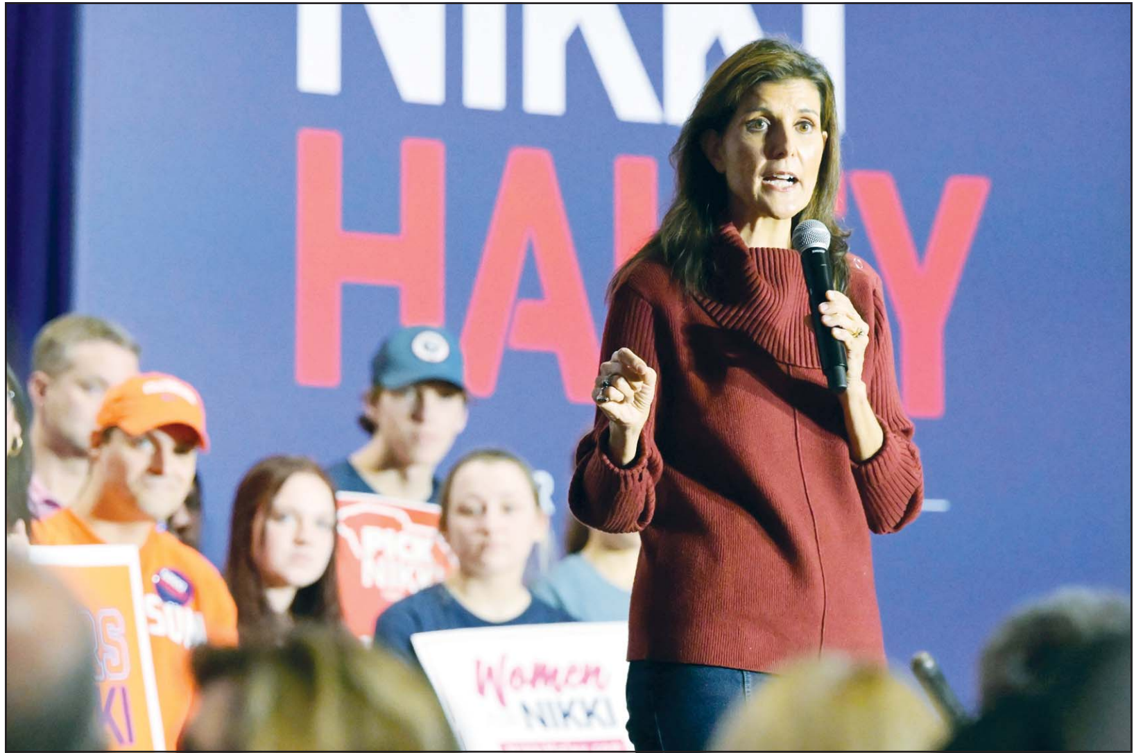
US Republican presidential candidate former UN Ambassador Nikki Haley speaks at a campaign event in Mauldin, S.C. on Jan 27.

His killing became a symbol of the long struggle for a free press in the Balkan nation that is formally seeking membership in the European Union.