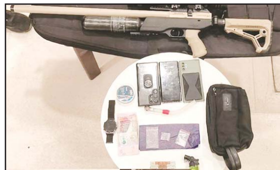
The contraband seized.