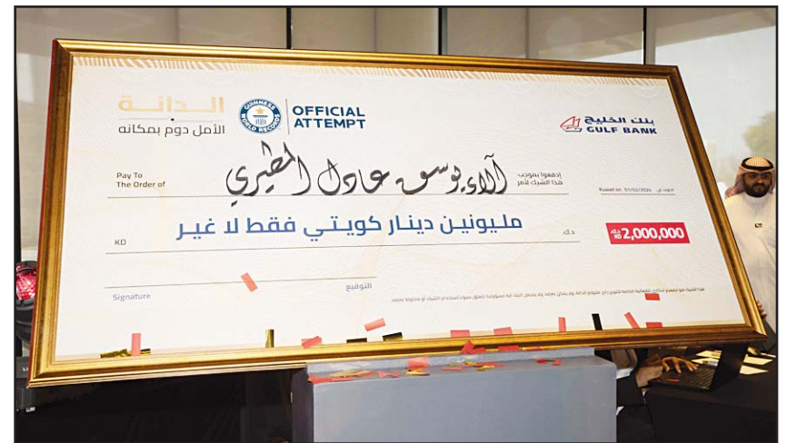
A KD 2 million cheque, representing the Grand Prize for the AIDanah Millionaire draw.