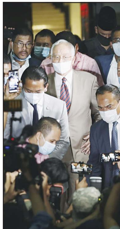
Former Malaysian prime minister Najib Razak, (center), leaves a court house in Kuala Lumpur, Malaysia on July 28, 2020. Malaysia's Pardons Board said on Feb 2, it has reduced Najib Razak's 12-year jail sentence by half and sharply cut the fine imposed after his corruption conviction.

Despite his conviction, Najib is still influential in his party, the United Malays National Organization, which is now a member of Prime Minister Anwar Ibrahim's unity government that took power after 2022 general elections.