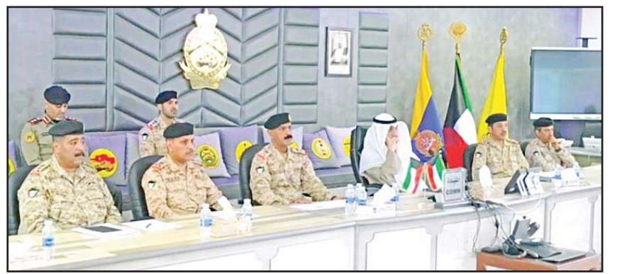
Deputy Prime Minister, Minister of Defense, and Acting Minister of Interior Sheikh Fahd Al-Yousef during the Defense Forces meeting.

Note: Only candidates with Transferable Visa 18 and proficiency in speaking Arabic and English will be considered. Deadline for applications: 15th Feb 2024.