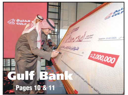
Gulf Bank Pages 10 & 11

Assembly Speaker invites government and MPs to Tuesday, Wednesday sessions