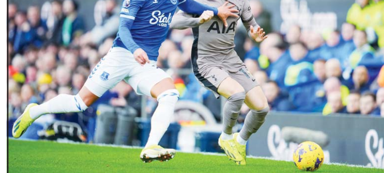
Everton's Ben Godfrey, (left), challenges for the ball with Tottenham's Timo Werner during the English Premier League soccer match between Everton and Tottenham Hotspur, at the Goodison Park Stadium, in Liverpool, England.

The stoppage-time equalizer came when a free kick into the box was headed on by Tottenham defender Cristian Romero, but only into the path of Branthwaite who had a simple header from a yard out.