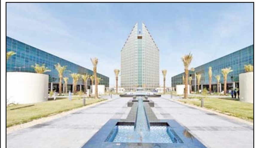
The Public Authority for Applied Education and Training.

He confirmed that the parking capacity at Jaber Hospital had been increased by 1,230 new parking spaces after parking area No. 2 entered service, thereby bringing the total capacity of parking lots in the hospital to about 5,000.