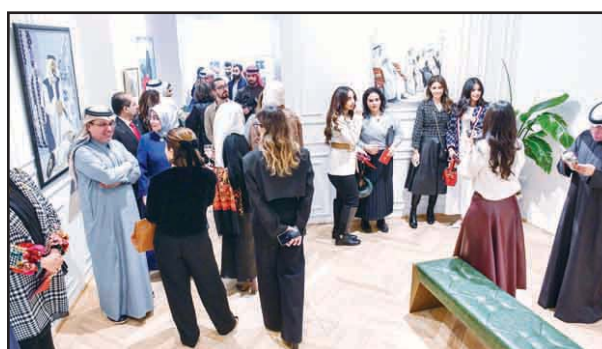
Photo during the art exhibition.