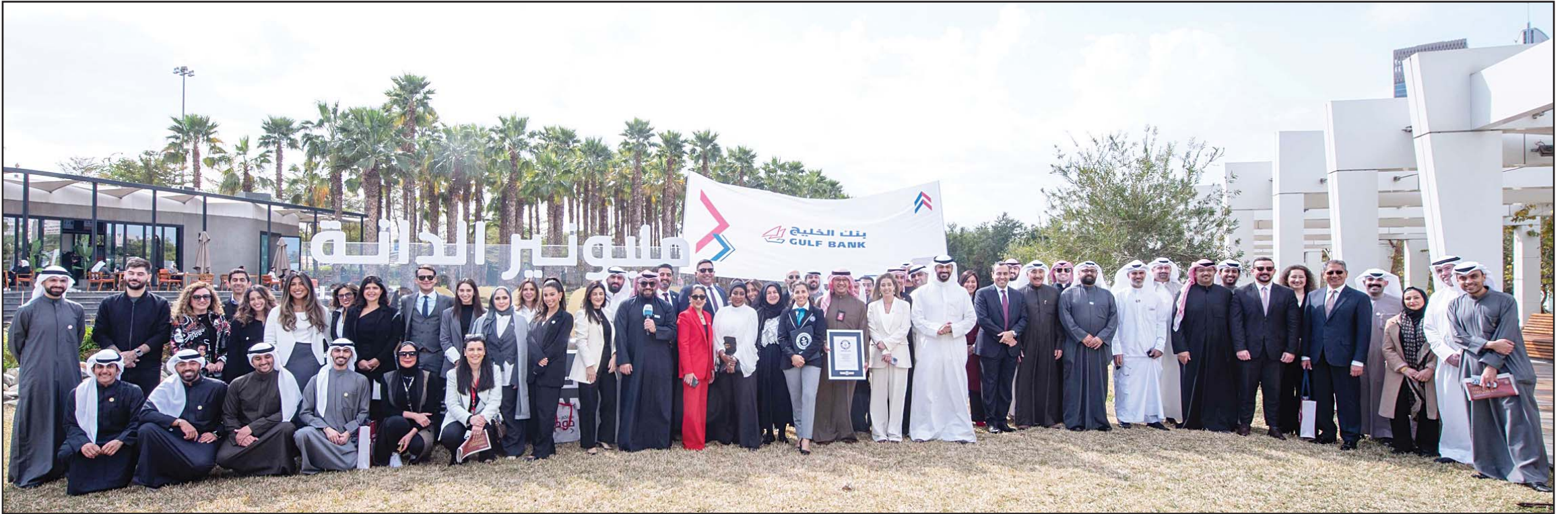
A group photo of Gulf Bank employees in Al-Shaheed Park after announcing the winner.