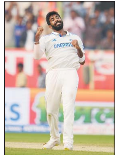
India's Jasprit Bumrah celebrates the wicket of England's James Anderson and his sixth wicket, on the second day of the second test match between India and England, in Visakhapatnam, India.

He began with Joe Root, who was caught at slip for five in the 26th over. Two overs later, Pope was bowled off a searing Bumrah yorker.