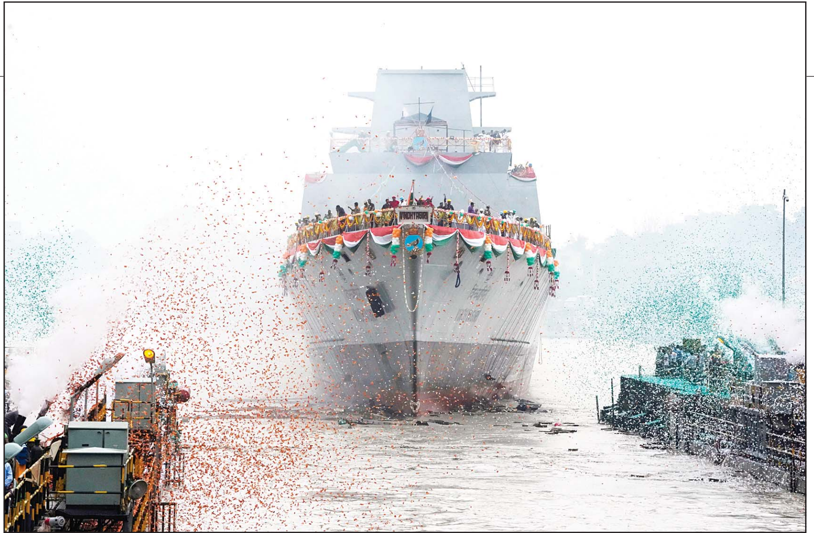
Confetti and smoke in the colors of the Indian national flag mark the entry of INS Vindhyagiri, a new warship for the Indian navy, into the Hooghly river in Kolkata, India, Aug. 17, 2023. India has long focused its defense policy on its land borders with rivals Pakistan and China but is now beginning to flex its naval power in international waters, including anti-piracy patrols and a deployment close to the Red Sea to protect ships from attacks.

Mayom said security forces had been sent to calm the situation and to move the cattle herders away from the disputed wet lands.