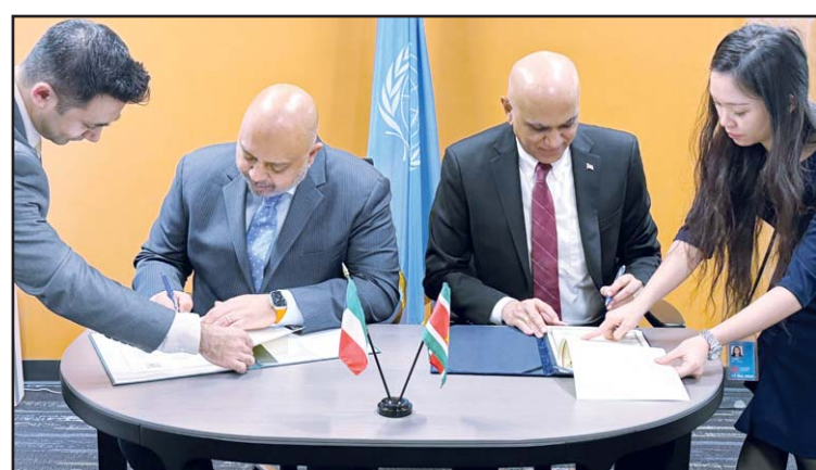
Ambassador Tariq Al-Bannai during the signing ceremony.