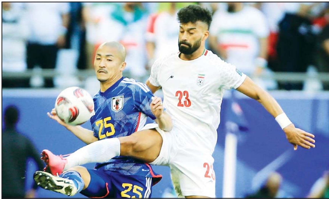
Japan's Daizen Maeda fights for the ball with Iran's Ramin Rezaeian during the Asian Cup quarterfinal soccer match between Japan and Iran at Education City Stadium in Al Rayyan, Qatar.