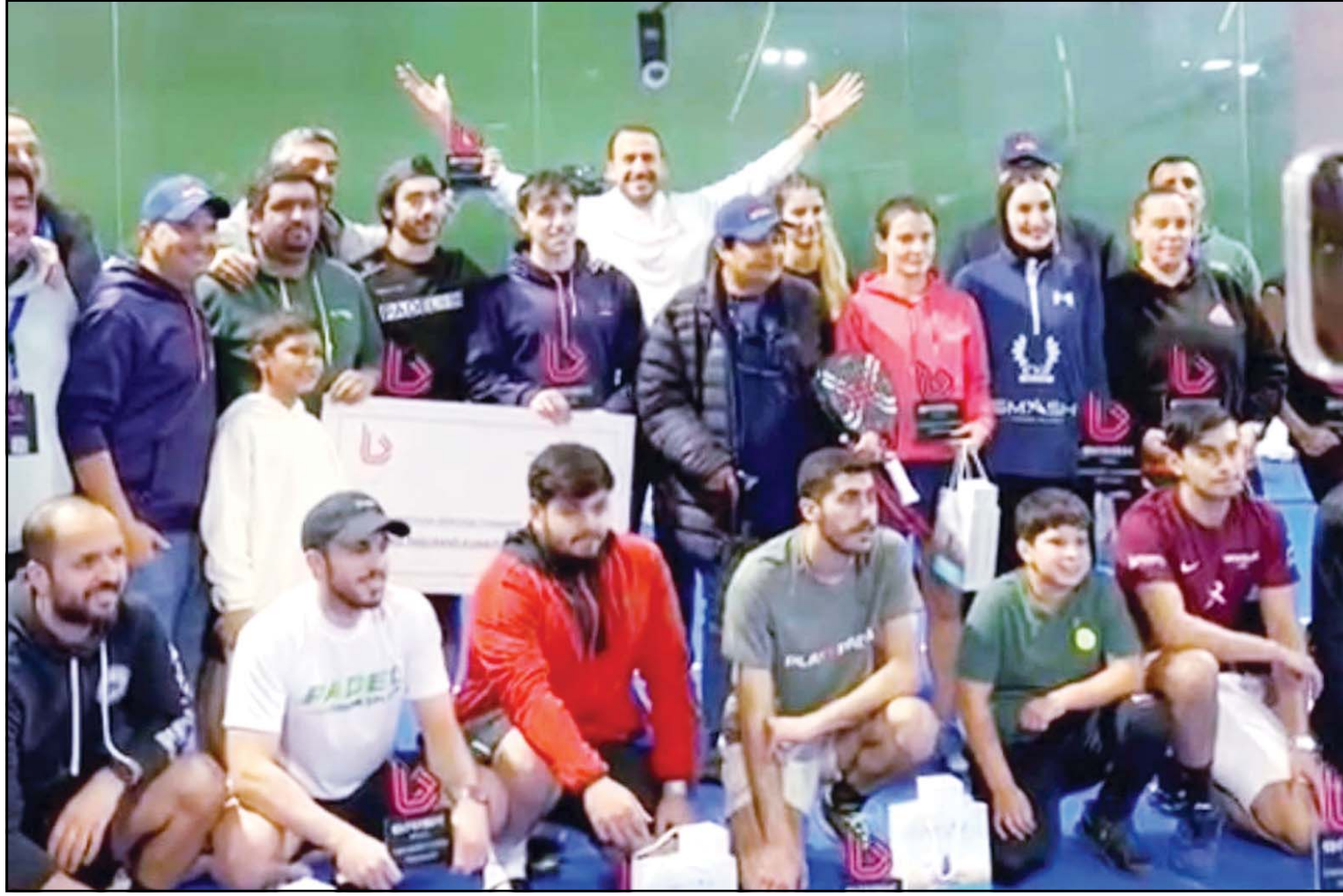
A group photo of the tournament participants and winners.

KUWAIT CITY, Feb 3: Kuwait Telecommunications Company – stc, a world-class digital leader providing innovative services and platforms to customers, announced the conclusion of its sponsorship of the Brisk World Padel tournament held at El Padel Academy in Kuwait from January 28th till the 30th. stc's sponsorship of the tournament comes as a continuation of the support the Company has shown towards the sports community in Kuwait, especially amongst the local Padel community that aims to spread a positive and sustainable impact in society