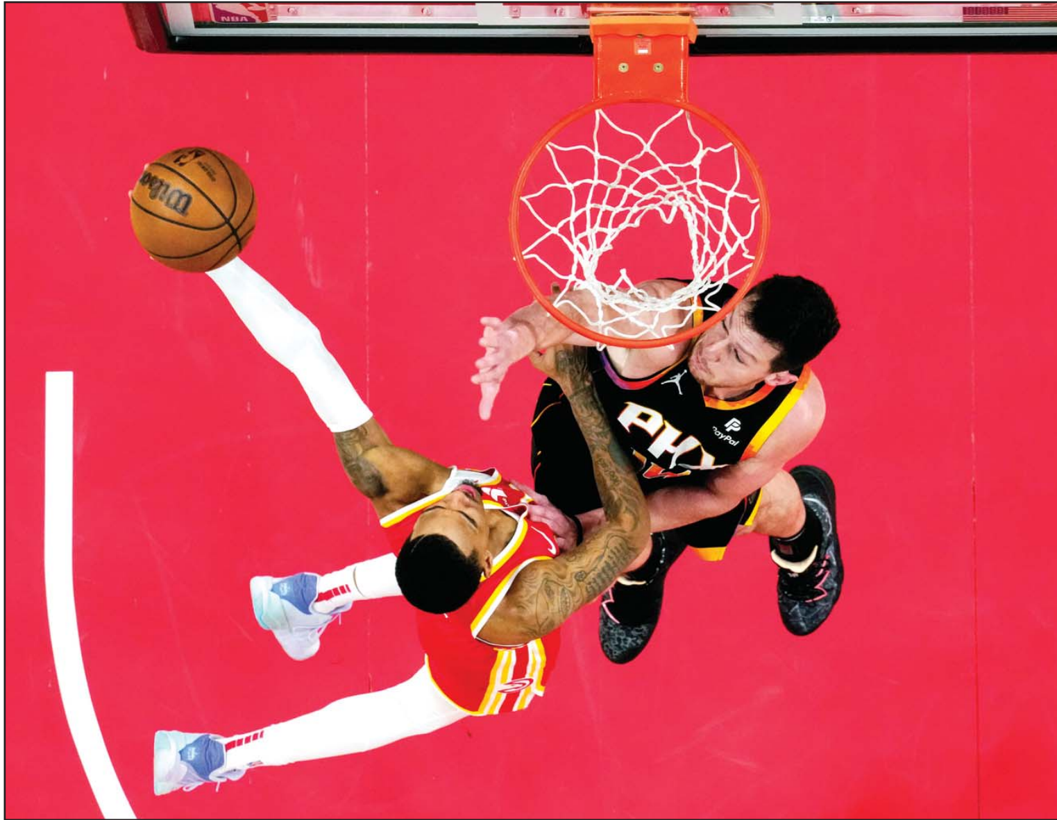
Atlanta Hawks guard Dejounte Murray (5) goes to the basket as Phoenix Suns forward Drew Eubanks (14) defends in the second half of an NBA basketball game Friday, Feb. 2, 2024, in Atlanta.