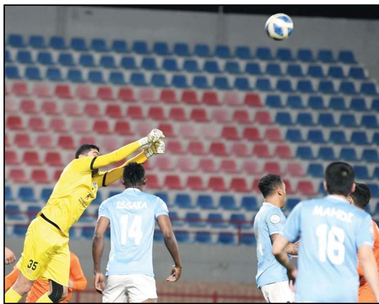
Salmiya goalkeeper punches the ball away from Kazma players.

Salmiya, in a remarkable display of resilience, faced Kazma with only ten players from the fifth minute of