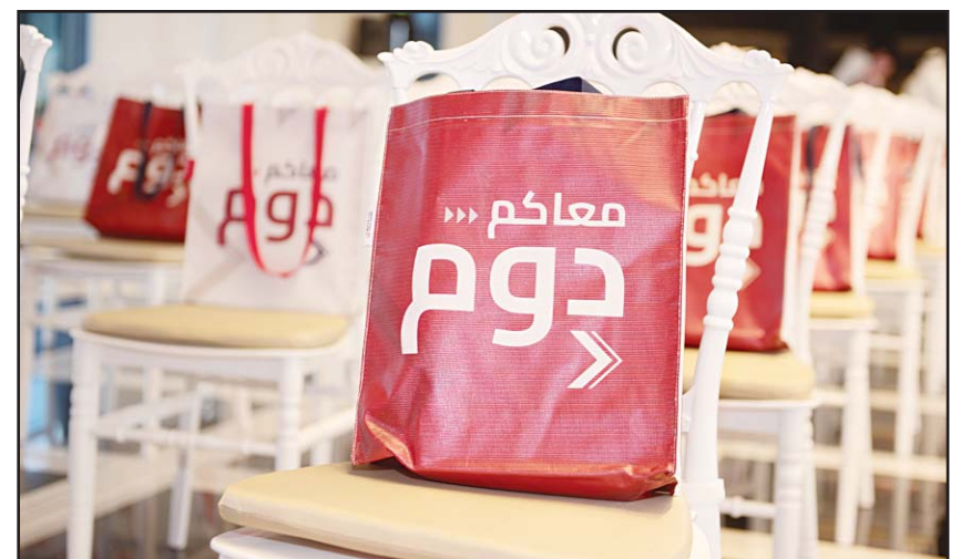
Recycling the AIDanah street advertisements and transforming them into reusable bags.

to streamline their banking operations for greater ease and convenience. Additionally, the bank consistently strives to bolster its relationship with esteemed customers, by continuously exploring and understanding their evolving banking needs and requirements.