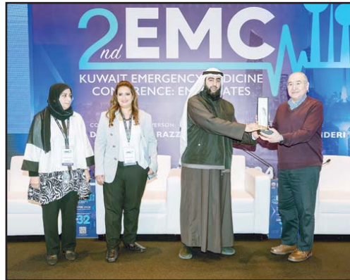
Part of the honoring ceremony during the 2nd Kuwait Emergency Medicine Conference on Saturday.

The activity is part of the authority's strategy spanning until 2035.