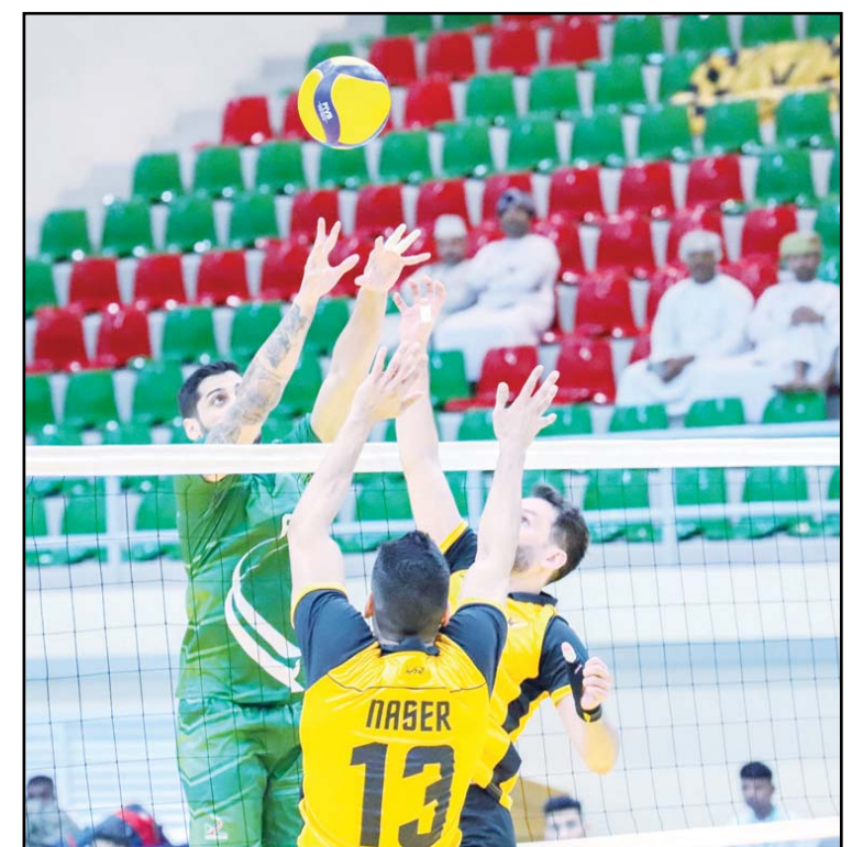
Al-Qadisiya players combine to block a shot from an opponent.

PSG was nine points ahead of second-placed Nice, which plays at Brest on Sunday.