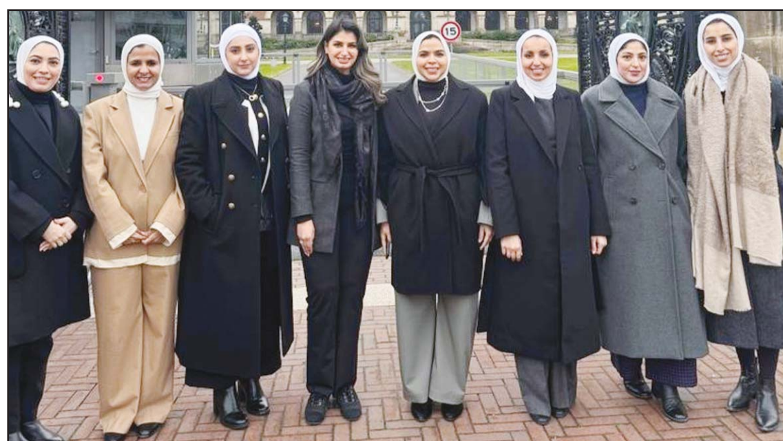
The eight Kuwaiti female judges during their visit to the Netherlands.

A reliable source told the daily that steps to empower women in the judiciary continue based on the Supreme Judicial Council's confidence in Kuwaiti female judges, considering their exemplary performance in investigating all types of cases. The source confirmed these women have proven their worth and competence through their promotion to the po-