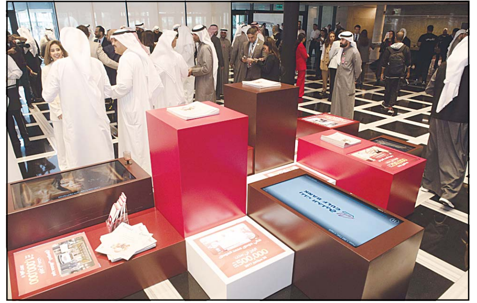
A small exhibition featuring photographs of previous millionaires from the AIDanah account.