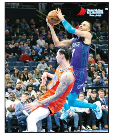
Charlotte Hornets guard Bryce McGowens (right) prepares to shoot next to Oklahoma City Thunder forward Lindy Waters III (12) during the second half of an NBA basketball game, Friday, Feb. 2, 2024, in Oklahoma City.

Young shot 7 for 11 from 3-point distance and added two steals. Bogdan Bogdanovic came off the bench to hit 4 of 7 shots from long distance and finish with 23 points for Atlanta,