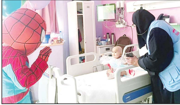
Entertainment activities for children with cancer.

The treatment approach focuses on promoting patients' well-being and self-confidence, incorporating activities such as massage, yoga, deep breathing sessions, educational lectures, and workshops to educate the public on coping mechanisms for cancer. Financial assistance is also provided