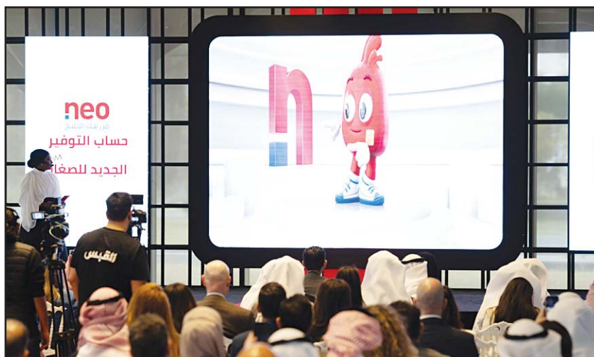
'Neo,' the newly introduced children's account.