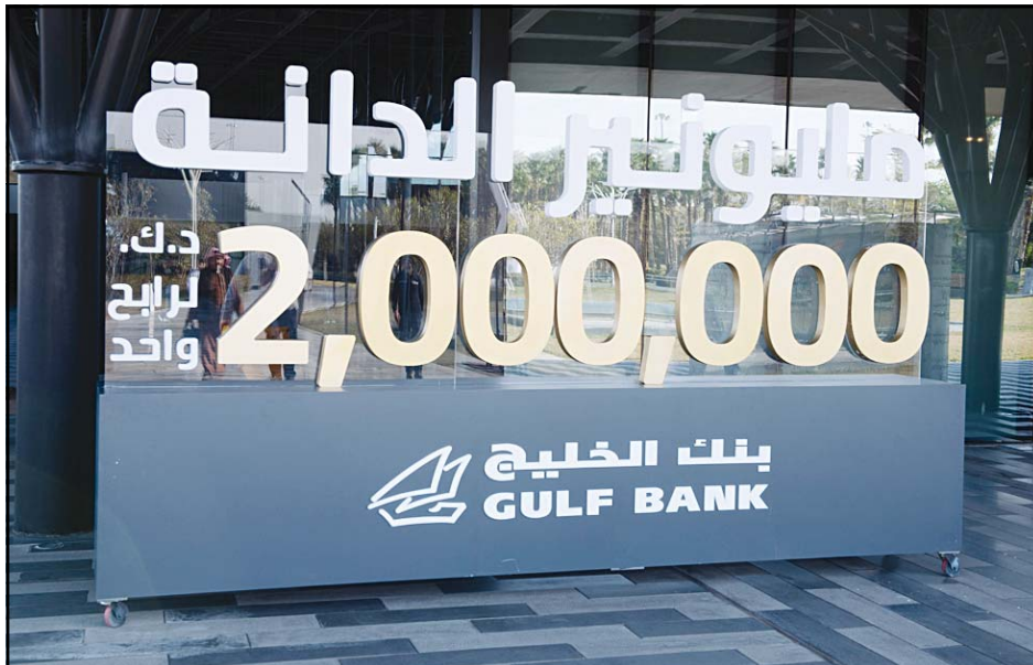
The Grand Prize for the AIDanah Millionaire draw.

Gulf Bank's AIDanah account offers monthly opportunities to win KD 1,000 to ten lucky winners, in addition to two quarterly draws with KD 100,000 prizes each, a semi-annual draw prize of KD 1 million and a grand draw prize of KD 2 million.