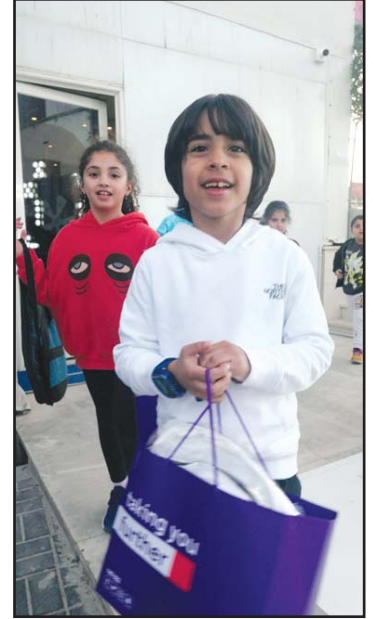
Children participating in the stc pavilion.

Additionally, stc has been a strong supporter of the sports com-