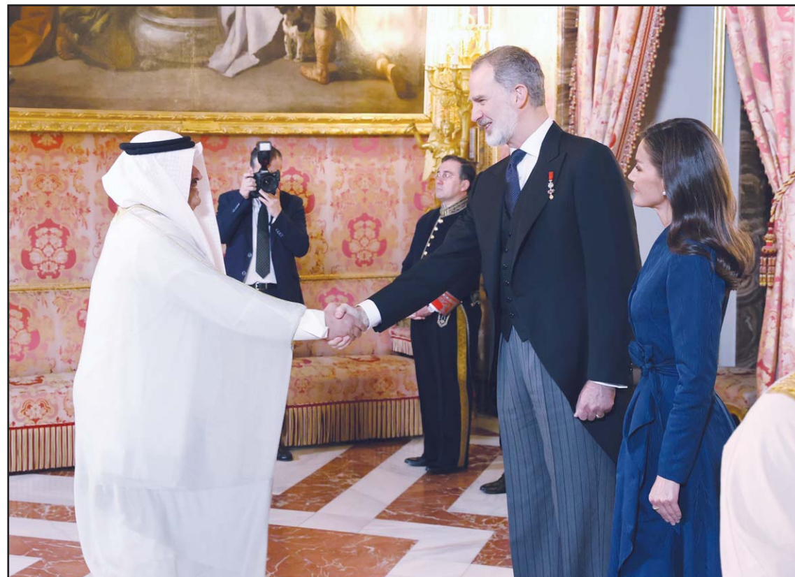
Spain's King Felipe VI receives Kuwaiti Ambassador to Spain, Khalifa Al-Kharafi.

Applying the additional burden for faculty members was one of these solutions that contributed to absorbing the number of students and offering the required courses for approximately 45,000 male and female students at the undergraduate and postgraduate levels. Calculating the additional burden in each university department and