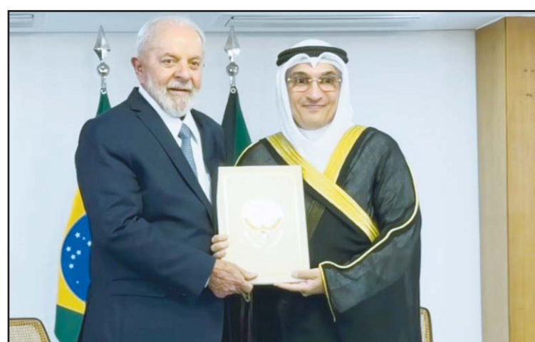
Kuwait ambassador to Brazil submits credentials to Brazilian President Luiz Inacio Lula da Silva.

tinue; stressing the selection is based on competency, not gender.