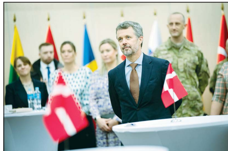
Denmark's King Frederik X meets Danish soldiers and their families at NATO's multinational corps headquarter in Szczecin, Poland on Feb 2.