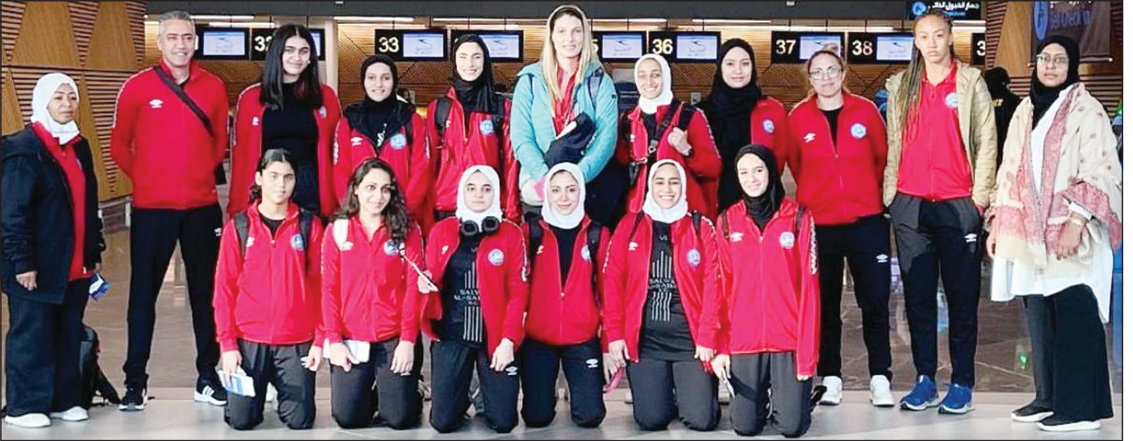
Kuwaiti players pose for a group photo before their departure.

Latest sports scores at — http://sports.arabtimesonline.com