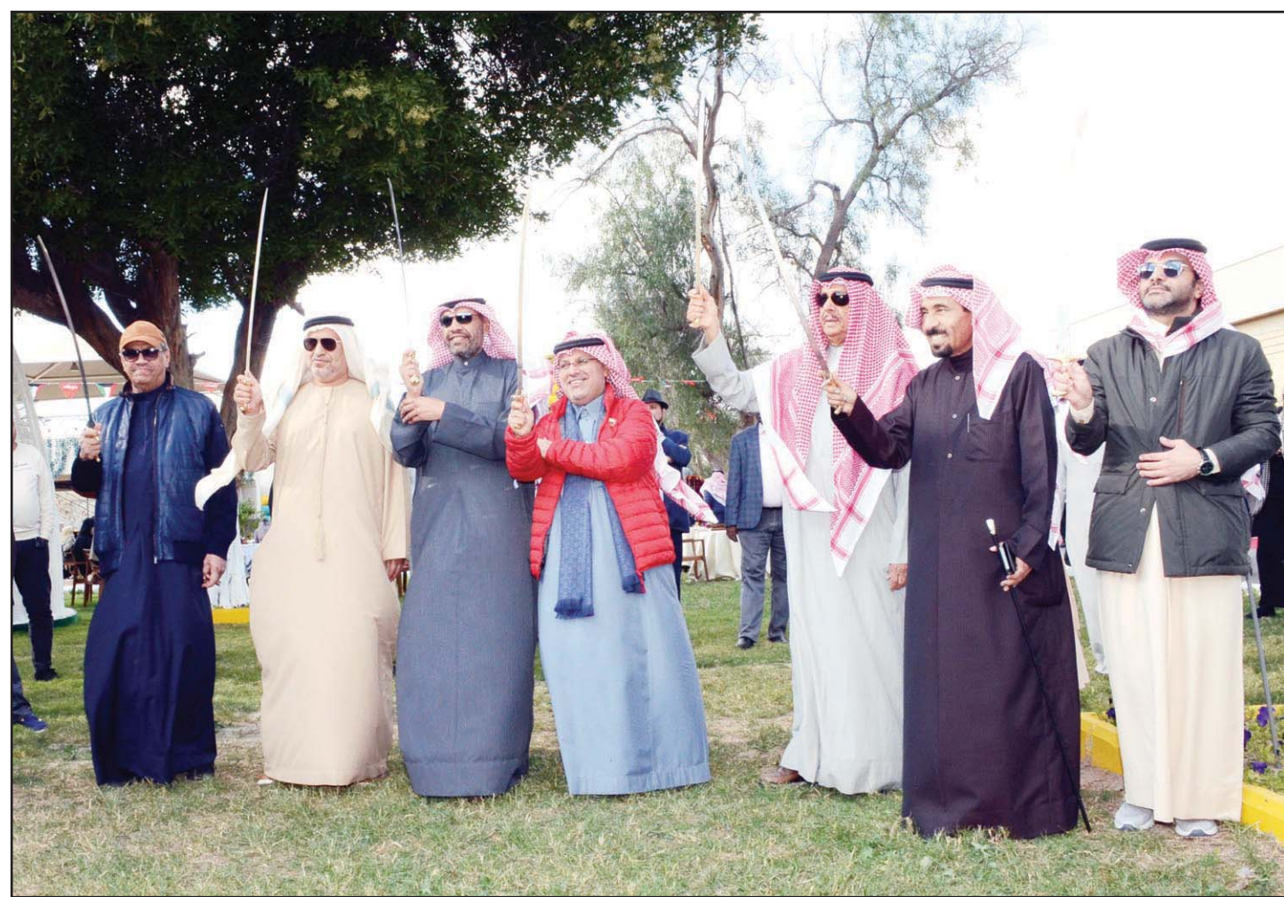
Minister of Foreign Affairs Abdullah Al-Yahya at the friendly annual gathering hosted by former governor of Al-Asima Sheikh Ali Jaber Al-Ahmad Al-Sabah for members of Foreign and Arab diplomatic missions and their families in Abdali. — See Page 2

If the specified conditions are not met, or if there are changes in the profession, especially for licenses issued after 2013, the license status will be marked as withdrawn in the "My ID" application.