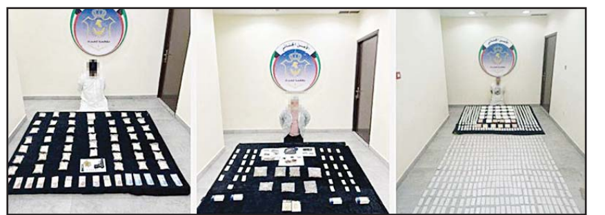
The three suspects and the contraband seized.