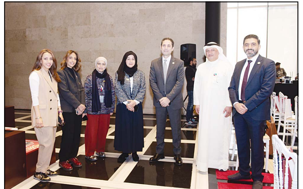
A group picture featuring several executives of Gulf Bank, with the Deputy CEO in the center.

To mark the 25th anniversary of the introduction of the AIDanah Millionaire Account, Gulf Bank has created a documentary chronicling the account's evolution from its inception. The documentary explores how the AIDanah Millionaire Account has positively transformed the lives of numerous individuals and families, propelling them to join the esteemed list of millionaires.