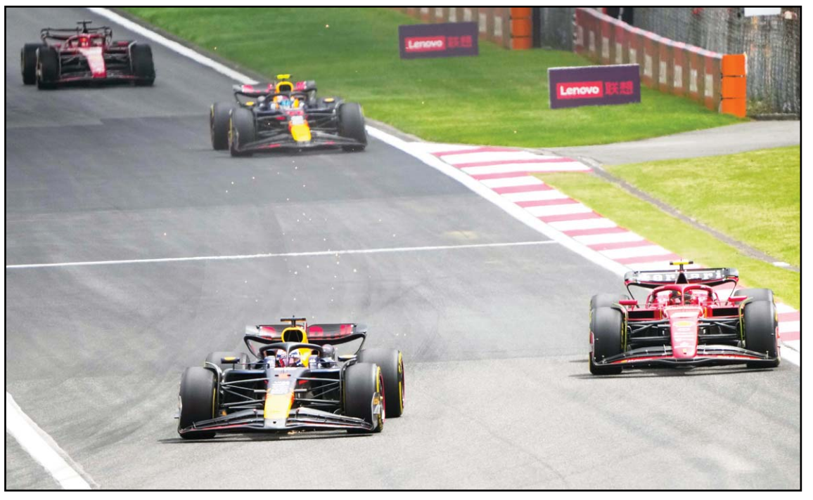
Red Bull driver Max Verstappen of the Netherlands leads Ferrari driver Carlos Sainz of Spain during the sprint race at the Chinese Formula One Grand Prix at the Shanghai International Circuit, Shanghai, China.

Adding to the intrigue, two small grass fires broke out on at the edge of the track in Friday practice. The circuit was built on a marshy area, and a methane gas leak is suspected.