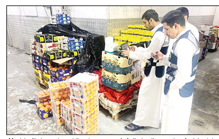
Municipality inspectors at the store accused of altering the country of origin status.

As per the surveillance cameras in the bank, the testimony of the victim's witnesses, and the investigations of the police, it was proven that the accused c rried out the crime against the victim. Earlier, the Criminal Court had sentenced the accused to five-year imprisonment, and this ruling was upheld by the Court of Appeals after hearing the defense's arguments and confirming the validity of the appealed ruling.