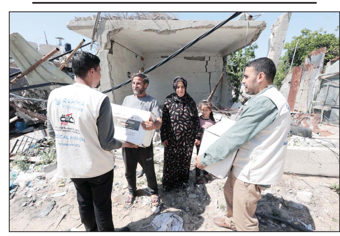
Volunteers distributing Kuwaiti aid to those affected in the northern Gaza Strip.

Although the conference was scheduled to start earlier, weather conditions in Oman delayed the arrival of Arab delegations, leading to a postponement of the conference activities.