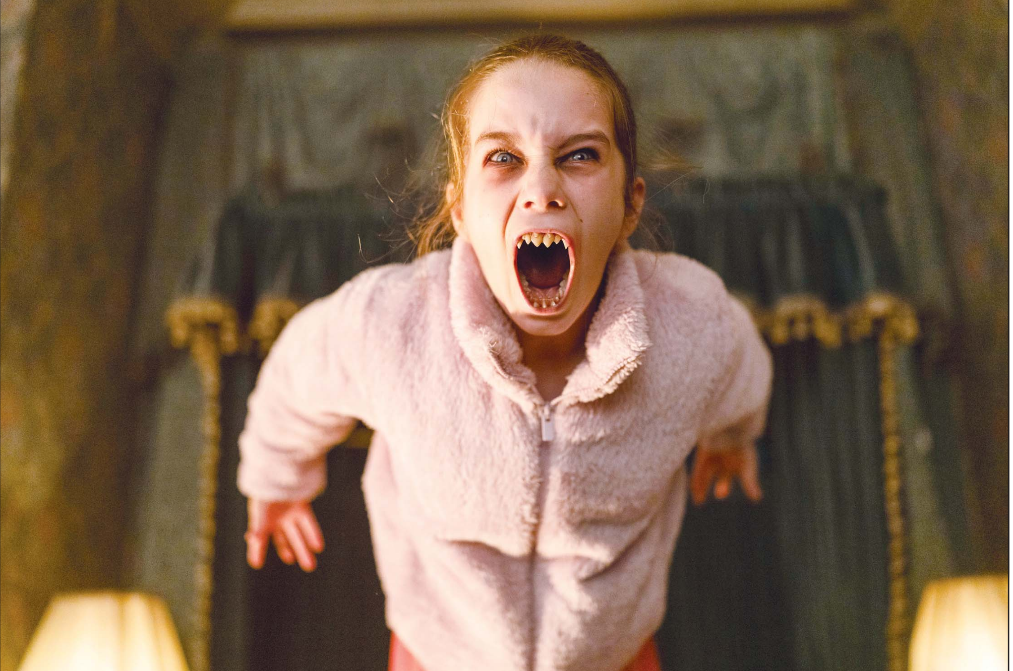
This image released by Universal Pictures shows Alisha Weir in a scene from the film 'Abigail.' (AP)