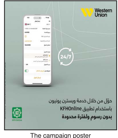
The campaign poster

KFH launched the service earlier this year with the goal of offering its customers top advantages. This includes secure, reliable, and fast transfers that meet customer expectations. The service allows customers to access the full Western Union network when sending remittances and expands digital application capabilities to ensure financial services are accessible to all.