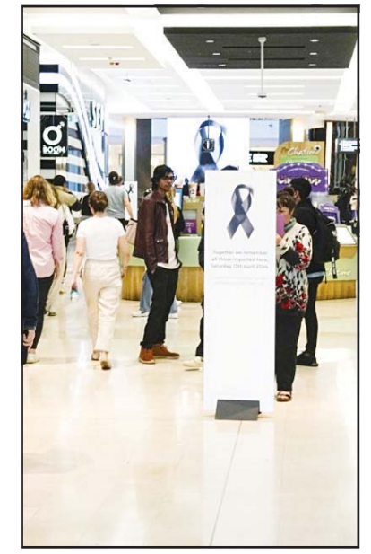
People walk inside the Westfield shopping mall at Bondi Junction in Sydney on April 19. The Sydney shopping mall reopened for business on Friday for the first time since it became the scene of a mass stabbing in which six people died on April 13.