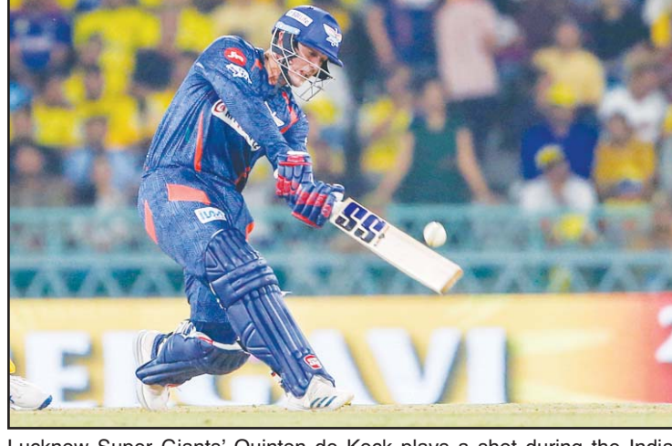
Lucknow Super Giants' Quinton de Kock plays a shot during the Indian Premier League cricket match between Chennai Super Kings and Lucknow Super Giants in Lucknow, India.

Jadeja finished 57 not out off 40 balls. Krunal Pandya took 2-16 and Marcus Stoinis 1-7.