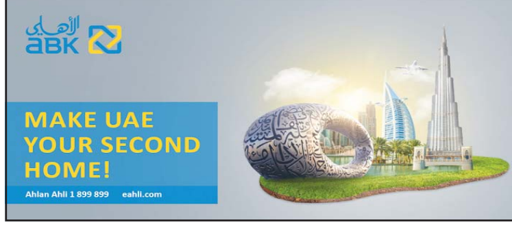
ABK unveils UAE mortgage loan program

For more information, interested applicants are encouraged to contact Ahlan Ahli 1 899 899 or visit the UAE desk at AlShaabbranch.