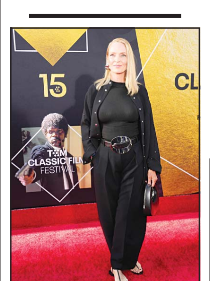
Uma Thurman, a cast member in 'Pulp Fiction,' poses at a 30th anniversary screening of the film on the opening night of the TCM Classic Film Festival at the TCL Chinese Theatre, Thursday, April 18, in Los Angeles.