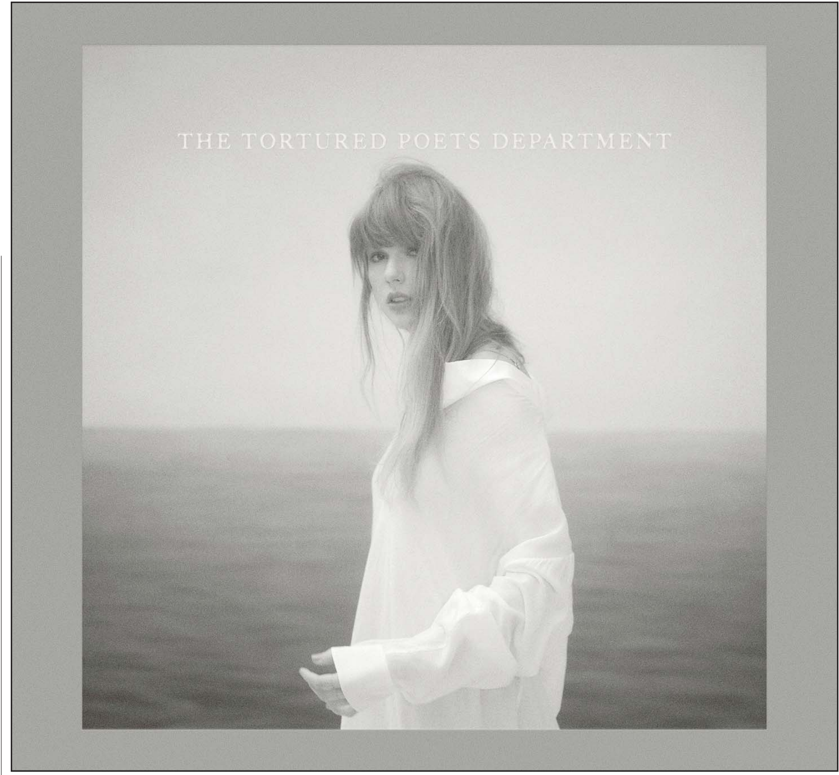
This cover image released by Republic Records show 'The Tortured Poets Department' by Taylor Swift. (AP)

The commission, his first major show in Europe, comes at a pivotal moment for Gibson. His 2023 book "An Indigenous Present" features more than 60 Indigenous artists, and he has two major new projects, a facade commission for the Metropolitan Museum of Art in New York and an exhibition at the Massachusetts Museum of Contemporary Art.