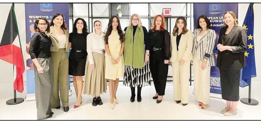
EU Ambassador to Kuwait Koistinen with promising young Kuwaiti women.

Of this figure, 23,406 individuals have been appointed through the central employment system, while the appointment procedures for an additional 2,218 candidates are currently underway. The Commission has emphasized its ongoing coordination with government agencies to address their job requirements for the fiscal year 2024/2025. This collaborative effort ensures that new batches of nominees are selected in accordance with each agency's needs and within the available vacancies outlined in their budget allocations.