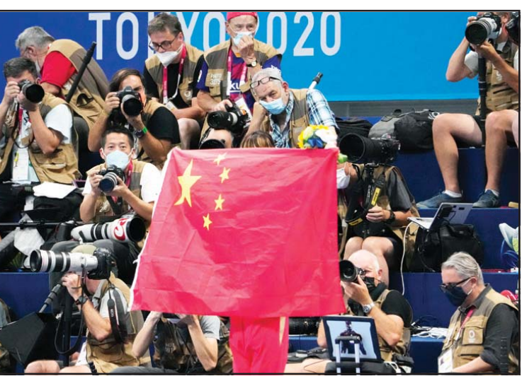
In this file photo, a Chinese flag is unfurled on the podium of a swimming event final at the 2020 Summer Olympics, on July 29, 2021, in Tokyo, Japan.

ples but that both groups agreed the results of the tests were caused by contamination and did not sanction any of the athletes who tested positive.