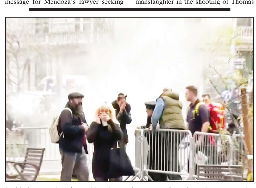
In this image taken from video, bystanders react after witnessing a man who lit himself on fire was extinguished, on April 19 in a park outside Manhattan criminal court in New York. A man who doused himself in an accelerant and set himself on fire outside the courthouse where former US president Donald Trump is on trial has died, police said.