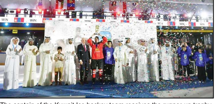
The captain of the Kuwait Ice hockey team receives the runner-up trophy.