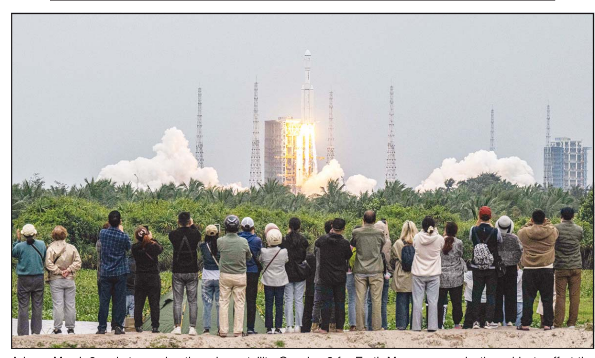
A Long March-8 rocket, carrying the relay satellite Queqiao-2 for Earth-Moon communications, blasts off at the Wenchang Space Launch Center in south China's Hainan Province, March 20, 2024.

This study has shown that the use of bacteria-colonized field mosquitoes could offer a feasible biocontrol strategy for reducing virus transmission and prevalence in nature, said the researchers.