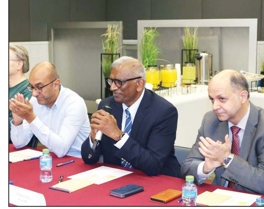
College deans during the orientation.