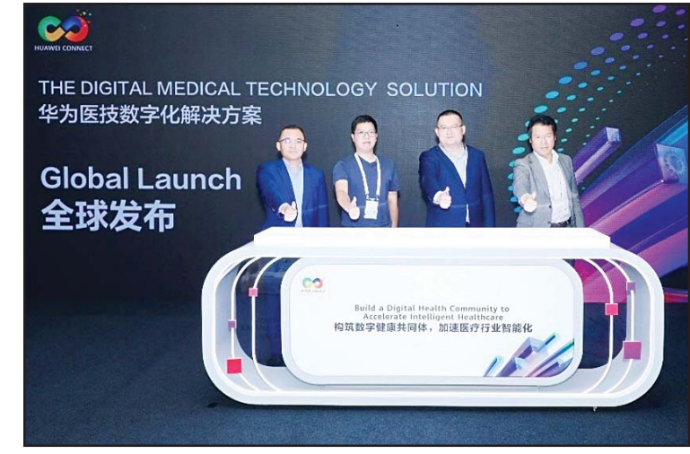
The launch of the Huawei Digital Medical Technology Solution.

nology Solution builds a unified architecture based on cloud computing, big data, and AI that benefits medical imaging services in hospitals around the world. It has five major features, namely hospital-wide data convergence, multi-protocol and copy-free, lossless compression, SmartCache 2.0 AI prefetch, and video-network collaboration. Over 1000 images and pathology slices can be viewed in seconds, saving 30% of storage space and 70% of equipment room space. It also helps deliver accurate, efficient, and