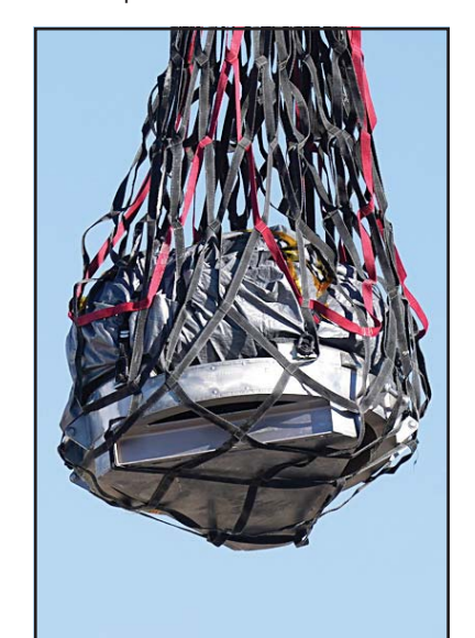
A helicopter delivers a space capsule carrying NASA's first asteroid samples on Sunday, Sept. 24, to a temporary clean room at Dugway Proving Ground, in Utah.