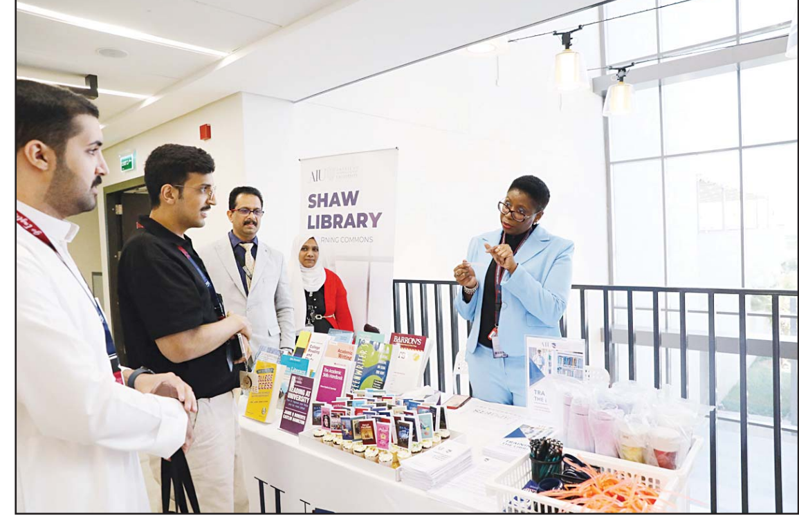
Some photos taken during the welcome ceremony