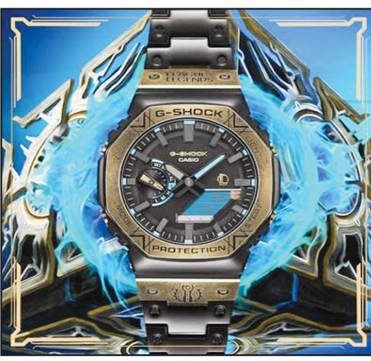
Casio's League of Legends G-SHOCK watch.

The popular and charismatic champion, Jinx, is represented on the bezel and band with a vivid color scheme. The band and the indicator hand on the inset dial at the 9 o'clock position recall the rocket that is Jinx's signature "weapon".