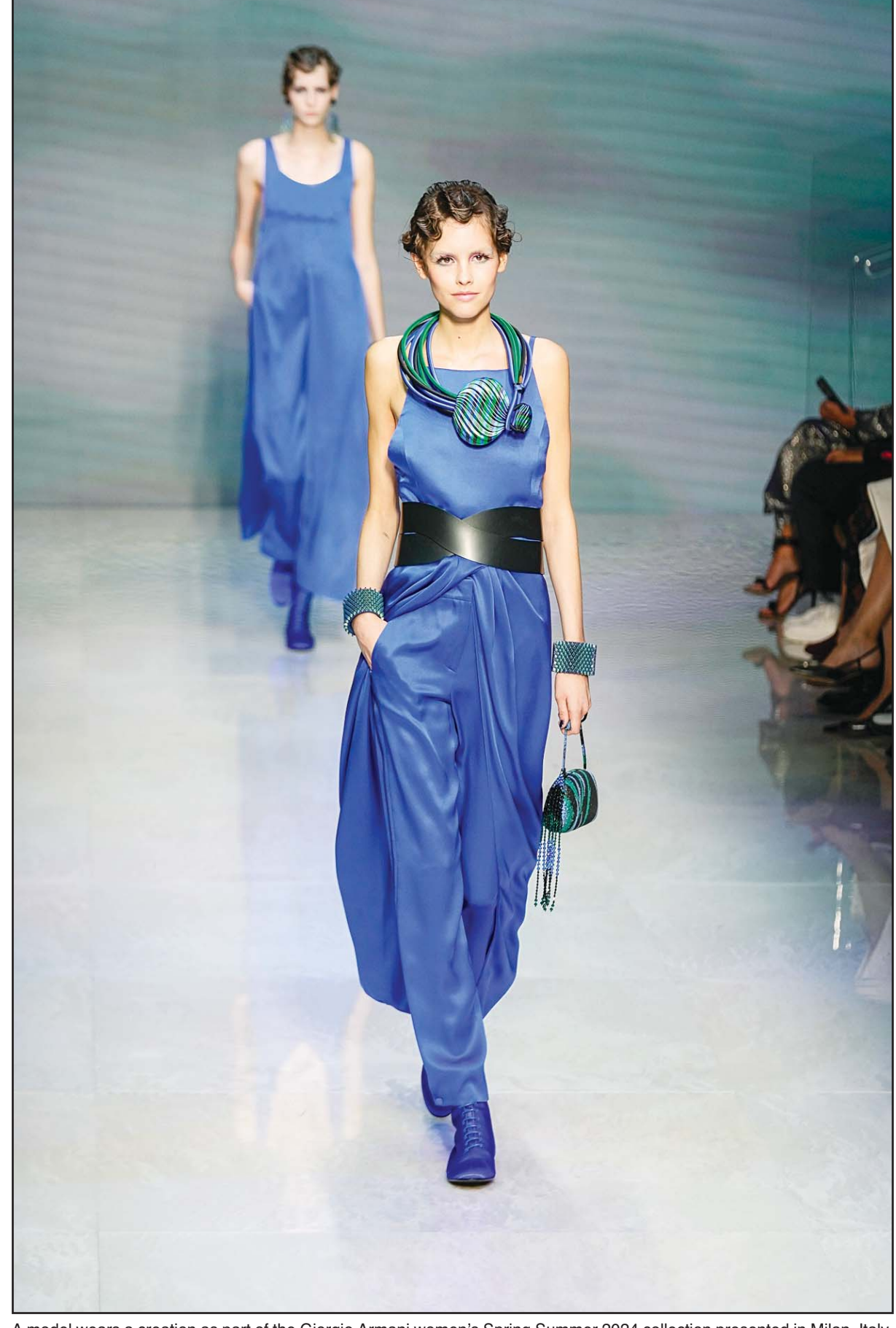
A model wears a creation as part of the Giorgio Armani women's Spring Summer 2024 collection presented in Milan, Italy, Sunday, Sept. 24.

Curators said that the idea of a display celebrating Black fashion and culture has germinated for some time. But it was only after the 2020 death of George Floyd at the hands of U.S. police - and the global eruption of protests against racial injustice that was triggered - that momentum gathered for a show that also features broader social and political context, such as the rise of anti-immigration sentiment and overt racism in Britain in the 1970s and '80s.