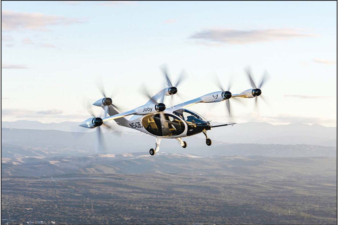
In this 2022 photo provided by Joby Aviation is Joby’s pre-production prototype aircraft in flight above the company’s facilities in Marina, Calif. The same Ohio river valley where the Wright brothers pioneered human flight will soon manufacture cutting-edge electric vertical takeoff and landing aircraft. (AP)