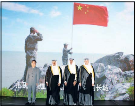
Photos during His Highness the Crown Prince Sheikh Mishal Al-Ahmad Al-Jaber Al-Sabah visit to China.