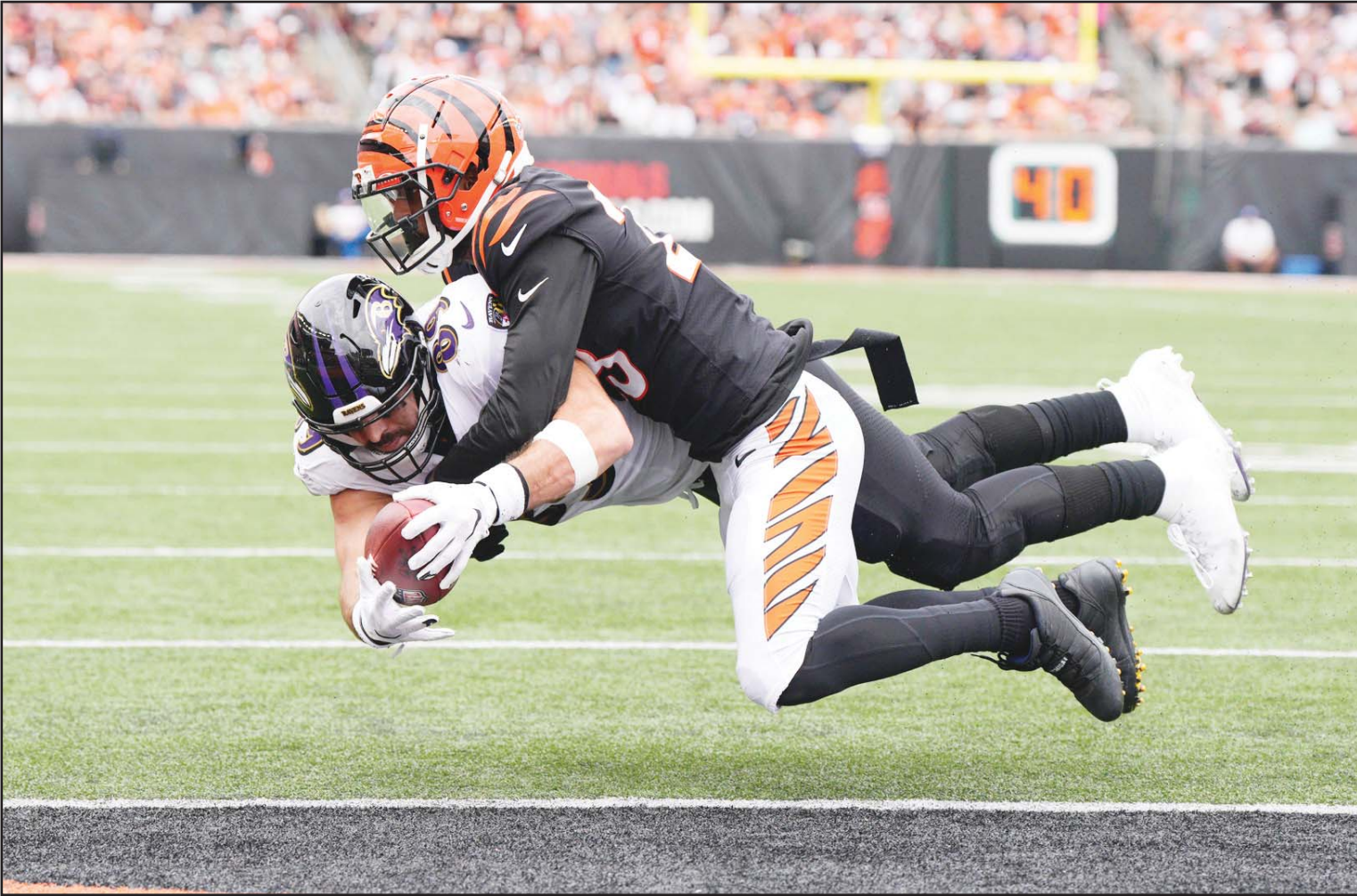
Baltimore Ravens tight end Mark Andrews scores as Cincinnati Bengals safety Dax Hill (top), defends during the second half of an NFL football game in Cincinnati.

JACKSONVILLE, Fla., Sept 18, Patrick Mahomes threw two touchdown passes, including one to returning star Travis Kelce, and the Kansas City Chiefs overcame three early turnovers to beat Jacksonville 17-9 on Sunday for their third victory against the Jaguars in 10 months.