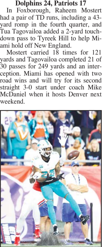
Miami Dolphins cornerback Xavien Howard (25) intercepts a pass intended for New England Patriots wide receiver DeVante Parker (1) during the second half of an NFL football game in Foxborough, Mass.

FOOTBALL It was the biggest comeback win for the Giants since a 21-point rally in 1949 - also against the Cardinals. Arizona blew its biggest lead since 2011. Dolphins 24, Patriots 17 In Foxborough, Raheem Mostert had a pair of TD runs, including a 43-yard romp in the fourth quarter, and Tua Tagovailoa added a 2-yard touchdown pass to Tyreek Hill to help Miami hold off New England. Mostert carried 18 times for 121 yards and Tagovailoa completed 21 of 30 passes for 249 yards and an interception. Miami has opened with two road wins and will try for its second straight 3-0 start under coach Mike McDaniels when it hosts Denver next weekend.