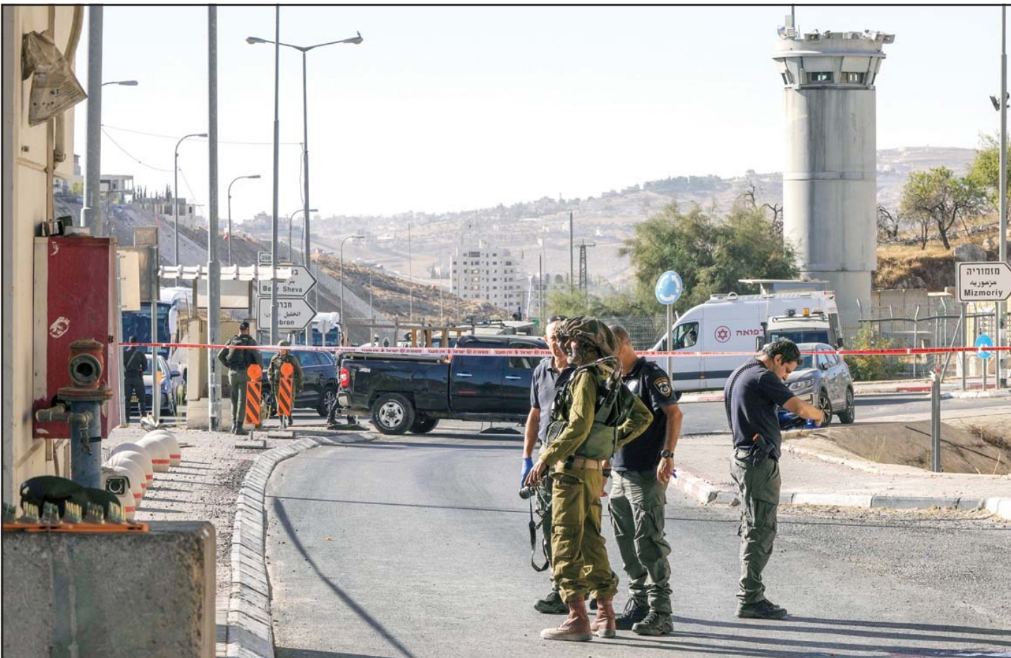
Israeli police examine the scene after forces opened fire on a man allegedly wielding a knife at an east Jerusalem checkpoint, Monday, Sept. 18, 2023.