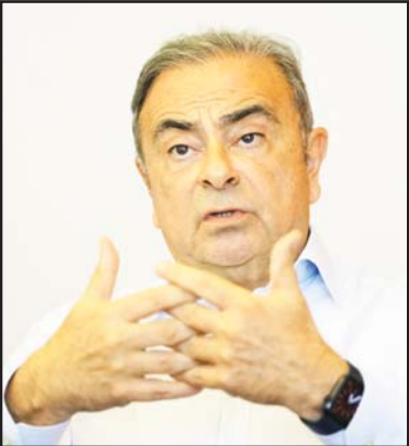
Former Nissan executive Carlos Ghosn speaks during an interview with The Associated Press in Beirut, Lebanon, on June 23, 2023.