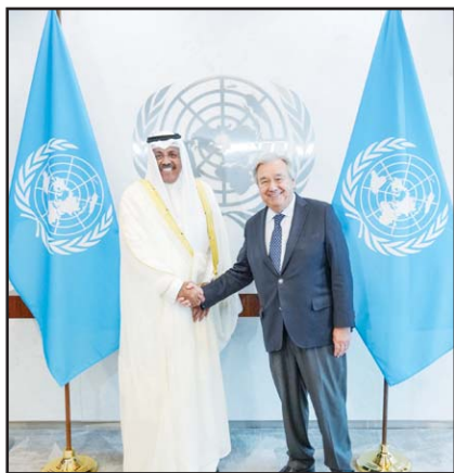
Representative of His Highness the Amir Sheikh Nawaf Al-Ahmad Al-Jaber Al-Sabah, His Highness the Prime Minister Sheikh Ahmad Nawaf Al-Ahmad Al-Sabah shakes hands with Secretary-General of the United Nations Antonio Guterres on the sidelines of the 78th session of the UN General Assembly.