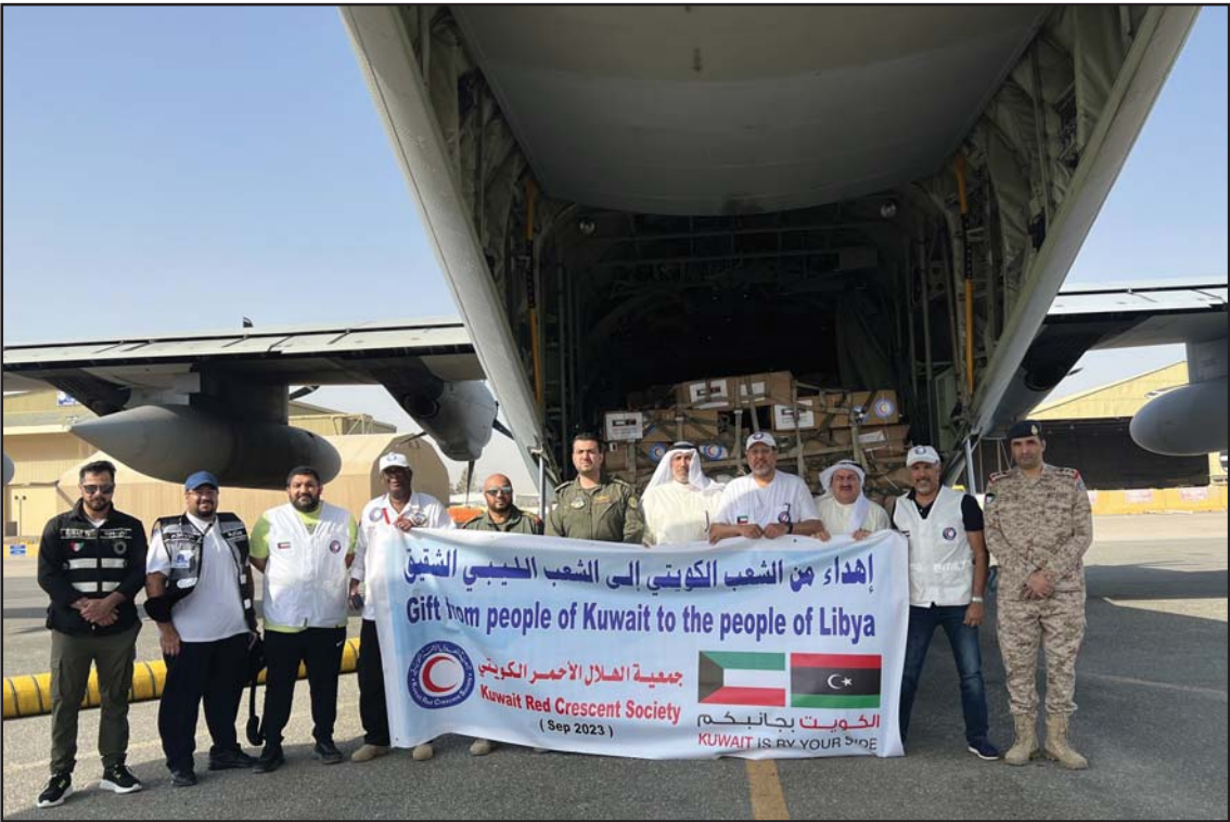
The relevant Kuwaiti authorities have made every effort to ensure that this aid arrives as soon as possible.