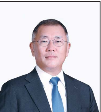
Euisun Chung, Executive Chair of Hyundai Motor Group

SEOUL, Sept 18: Hyundai Motor Group (the Group) has announced a USD 1.1 million contribution to aid Morocco and Libya in their recovery efforts following severe earthquakes and floods. The donations come from the four affiliates of Hyundai Motor Group (Hyundai Motor Company, Kia, Hyundai Engineering & Construction, and Hyundai Engineering). These funds – USD 500,000 for Morocco and USD 600,000 for Libya – will be channeled to the International Federation of Red Cross and Red Crescent Societies (IFRC) through the Korean Red Cross. In addition to the financial contribution, Hyundai Motor Company Middle East and Africa Headquarters, in cooperation with its Moroccan distributor, Kia Middle East and Africa FZE will also donate ambulance vehicles to the Moroccan government and offer support vehicles for local NGOs.