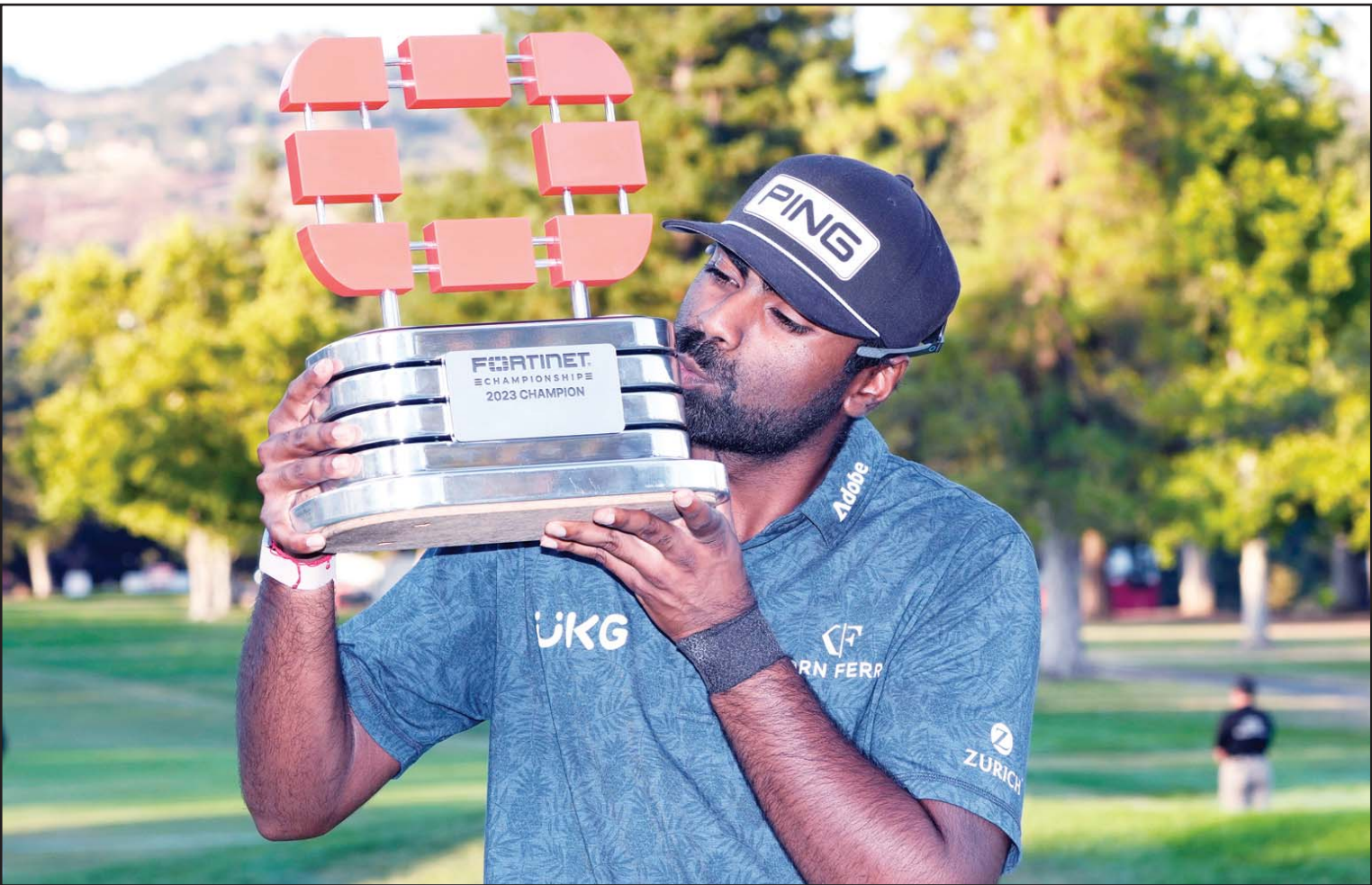
Sahith Theegala kisses his trophy on the 18th green of the Silverado Resort North Course after winning the Fortinet Championship PGA golf tournament in Napa, Calif.

through the ranks at Atalanta before leaving in 2014 for AC Milan, celebrated wildly.