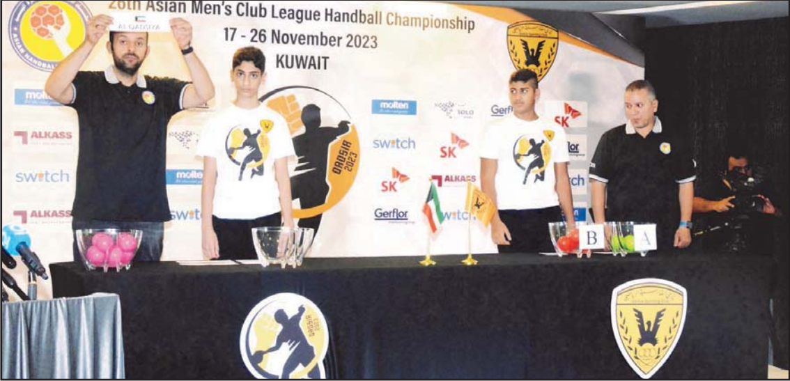
Asian Handball Championship draw in progress.