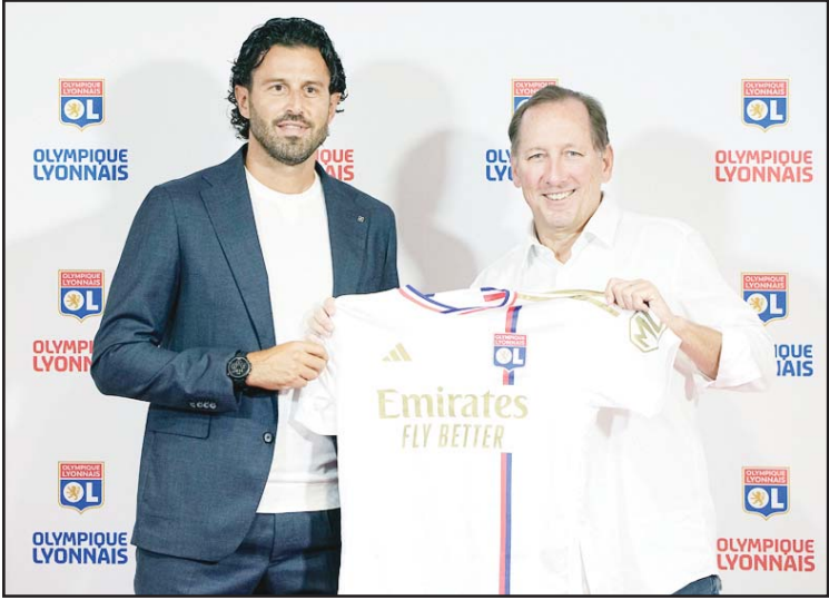
Lyon’s President John Textor, (right), and Lyon’s new head coach Fabio Grosso, from Italy, pose with a team jersey during a press conference for Grosso’s presentation, at the Groupama Stadium in Decines, near Lyon, central France. Struggling French club Lyon hired former Italy defender Fabio Grosso as its new coach on Saturday. Grosso replaces Laurent Blanc, who left by mutual consent following a terrible start to the season. Lyon is in last place with only one point from four games.

Afterward, the 26-year-old Tsegay vowed to try to go under 14 minutes next year. “Yes, I try,” she said. The Prefontaine Classic, normally run in late May, was this year’s final stop on the international Diamond League circuit. The 32 champions crowned during the two-day meet were set to earn $30,000 apiece. Canadian Andre De Grasse, the 200-meter champion at the Tokyo Olympics, won the event in 19.76 seconds to cap the season. World champion Shericka Jackson of Jamaica won on the women’s side in 21.57 for her second Prefontaine title of the weekend.