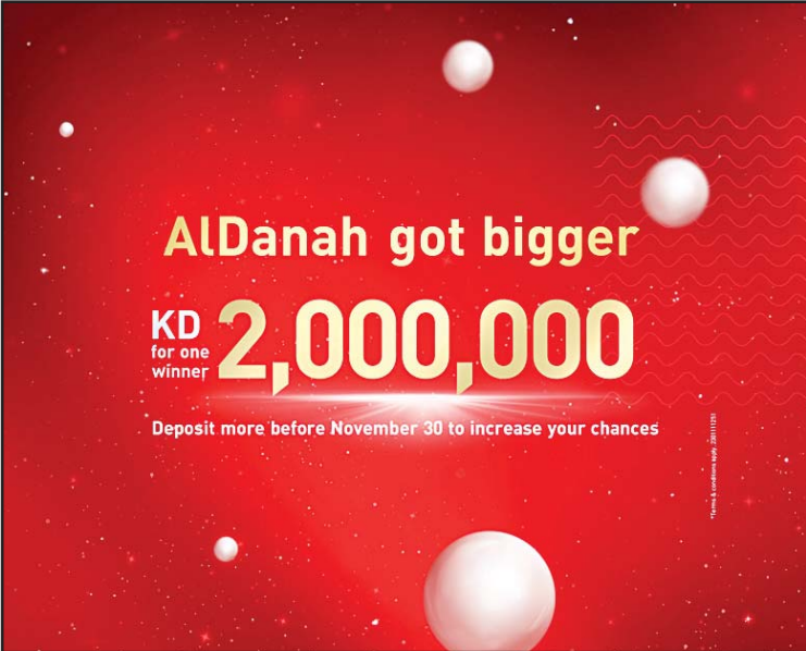
AlDanah 2M compilation banners.