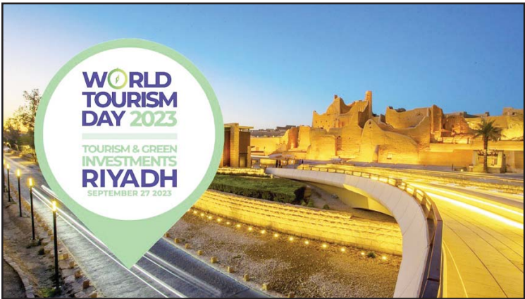
World Tourism Day 2023 logo