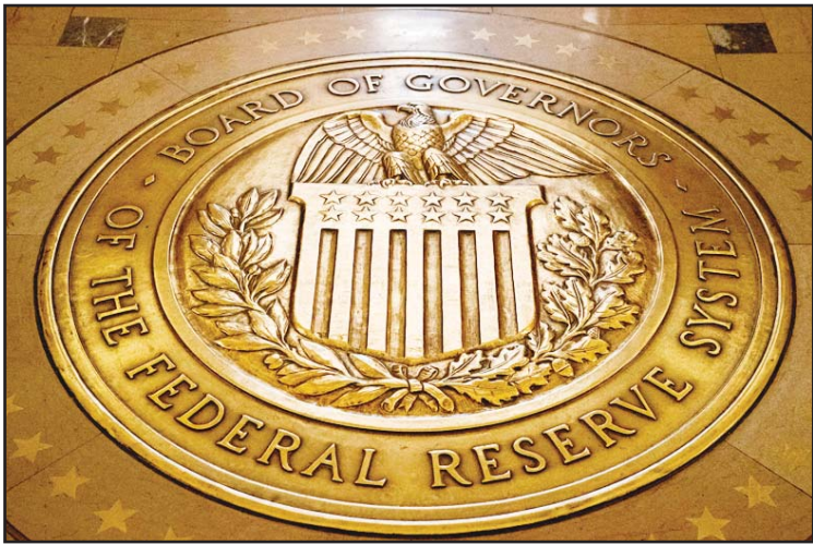
The seal of the Board of Governors of the United States Federal Reserve System is displayed in the ground at the Marriner S. Eccles Federal Reserve Board Building in Washington, Feb. 5, 2018. Since Federal Reserve officials last met in July, the economy has moved in the direction they hoped to see: Inflation continues to ease, if more slowly than before, while growth remains solid and the job market cools.

energy prices, posted its two lowest monthly readings in nearly two years. And signs have grown that the job market isn’t as robust as it had been, which helps keep a check on inflation: The pace of hiring has moderated. The number of unfilled openings fell sharply in June and July. And the number of Americans who have started seeking work has jumped. This has brought labor demand and supply into better balance and eased the pressure on employers to raise pay to attract and keep workers, which can lead them to raise prices to offset higher labor costs. “That was a hell of a good week of data we got last week,” Christopher Waller, a member of the Fed’s Board of Governors who is close to Powell, said in an interview on CNBC this month. “It’s going to allow us to proceed carefully. There is nothing saying that we need to do anything imminent anytime soon.” Powell’s own speech late last month at the Fed’s annual conference of central bankers in Jackson Hole, Wyoming, stressed his belief that the Fed can act in a measured fashion. “We will proceed carefully,” he said, “as we decide whether to