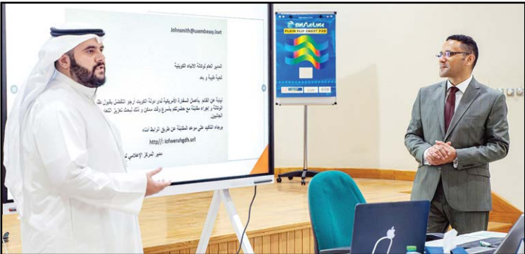
Part of the training program of the KUNA Center for Media Capacity Development entitled ‘Monitoring News on the Internet’.