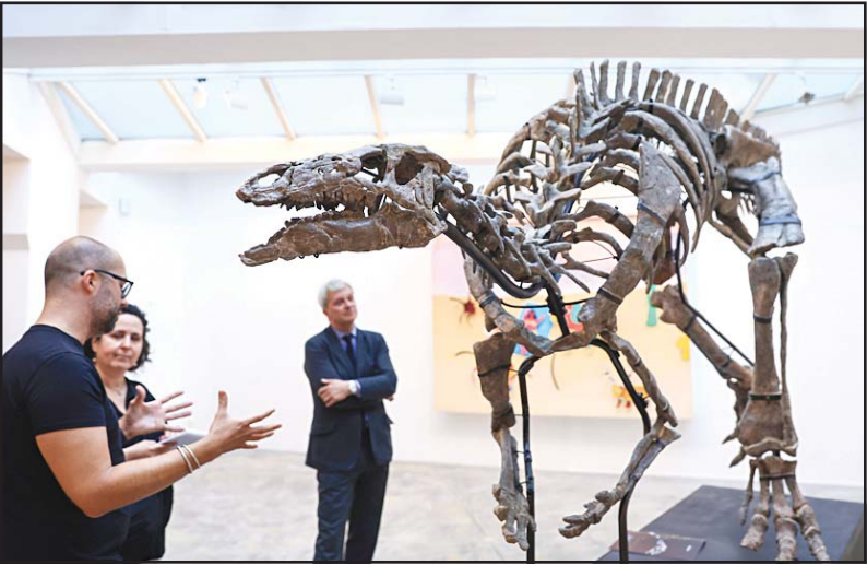
Visitors look at the skeleton of a Camptosaurus sp., of the Late Jurassic time, displayed at the Philippe Vallois gallery in Paris, Monday, Sept. 18. The Camptosaurus sp., discovered around 2000 in northeastern Wyoming (Crook County) on private property, goes under the hammer in Paris at Drouot Auction house on Sept. 20. (AP)

Direct-to-consumer PGx testing can empower patients to advocate for themselves and be an active participant in their health care by increasing access to and knowledge of their genetic information. (AP)