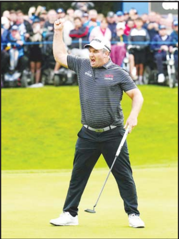
Ryan Fox of New Zealand celebrates his putt on the 18th green during day four of the 2023 PGA Championship at Wentworth Golf Club in Virginia Water, Surrey, England.