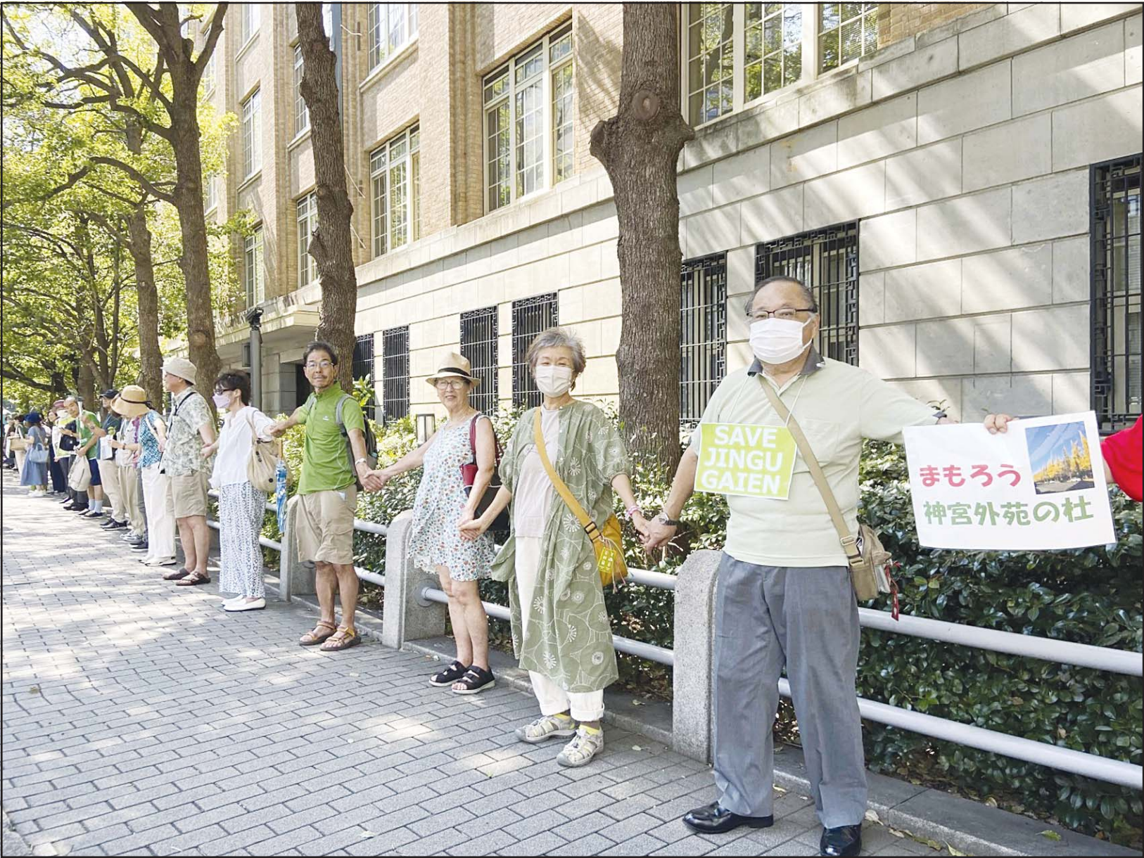
People gather outside of the Ministry of Education, Culture, Sports, Science and Technology on Sunday, Sept. 17, demanding it scrap a controversial redevelopment of Tokyo’s beloved Jingu Gaien park area, part of whose land is owned by an independent sports promotion unit overseen by the ministry, in Tokyo, Japan.

The Congo Basin forest absorbs 1.5 billion tons of carbon dioxide - about 4% of global emissions - some of which would be released into the atmosphere if the areas are cleared for oil and gas drilling.