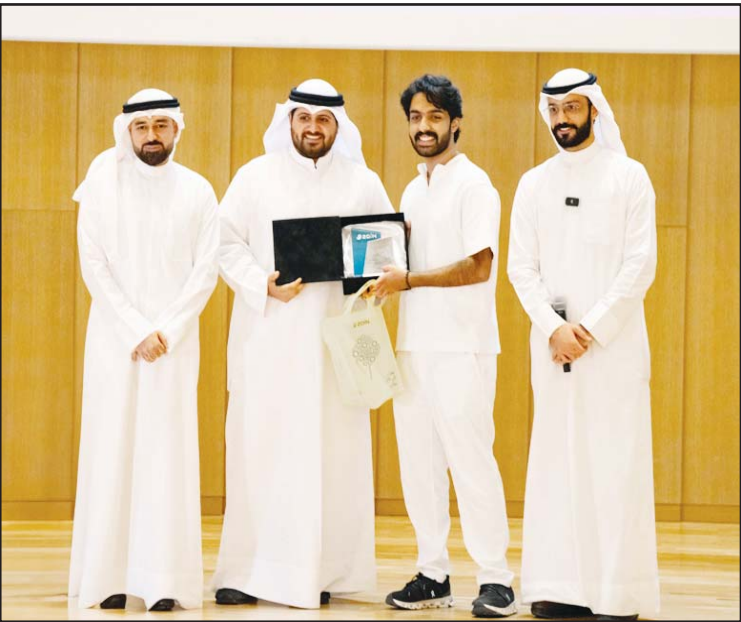
Zain CODED Graduation 2023 photos.