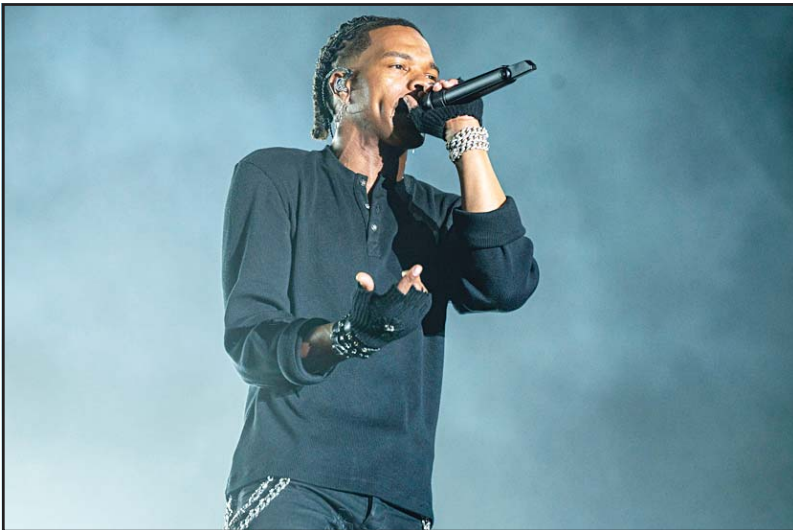
Lil Baby performs at Music Midtown, Sunday, Sept. 17, at Piedmont Park in Atlanta.