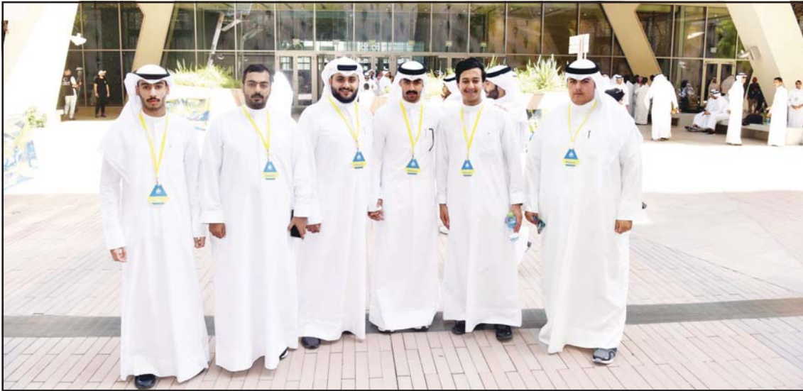
A group of students at the Kuwait University protest.