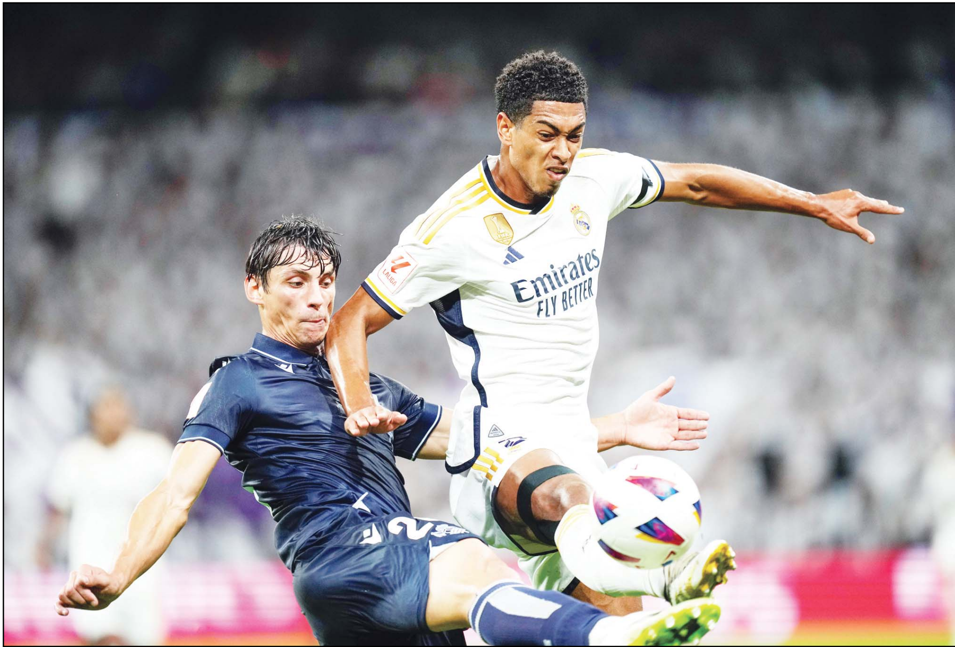
Real Madrid's Jude Bellingham (right), and Real Sociedad's Robin Le Normand fight for the ball during Spanish La Liga soccer match between Real Madrid and Real Sociedad at the Santiago Bernabéu stadium in Madrid, Spain.