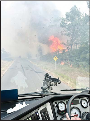
A wildfire is seen on the side of the road from a fire truck on Fire Stewart Rd on Aug. 26, 2023 at the Lions Camp fire a few miles north of Leesville, La. Louisiana has had an unprecedented wildfire season, exacerbated by extreme heat and dry conditions. In August alone, there were more than 550 fires across the state, and officials say the season is far from over.