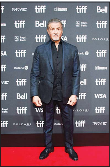
Sylvester Stallone arrives at the premiere of 'Sly,' at Roy Thomson Hall during the Toronto International Film Festival, Saturday, Sept. 16, in Toronto.

"NCIS: Sydney" will begin airing on CBS Nov. 13. It's the first international edition of the franchise that originated in the United States.