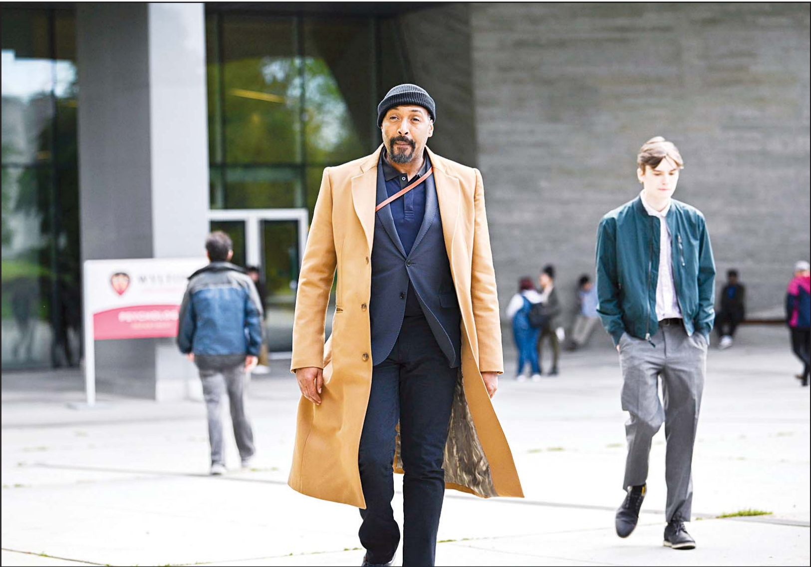
This image released by NBC shows Jesse L. Martin as Alec Mercer in a scene from 'The Irrational.'

The ongoing strike pits Writers Guild of America and the Screen Actors Guild-American Federation of Television and Radio Artists against the Alliance of Motion Picture and Television Producers, which represents Disney, Netflix, Amazon and others.