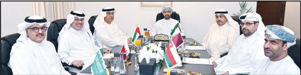
Ambassadors of the Gulf Cooperation Council countries hold the third coordination meeting between diplomatic missions and the Kuwaiti Ministry of Foreign Affairs.

KUWAIT CITY, Sept 18, (KUNA): The ministry of Finance revealed on Monday that it had encountered a cyberattack targeting one of its systems early Monday morning, which triggered its security and protection protocol system, and also disconnected and isolated hardware devices. The ministry affirmed in a press release that salary transfer procedures are not effected by the attempted hack, pointing out that the government financial servers are isolated and work within the ministry is continuing without disruption. The ministry has been in contact with the National Cybersecurity Center for updates and assessment of the hack. Meanwhile, the Ministry of Commerce and Industry denied reports on hacking the ministry’s system, affirming that it is still providing online services to the public.