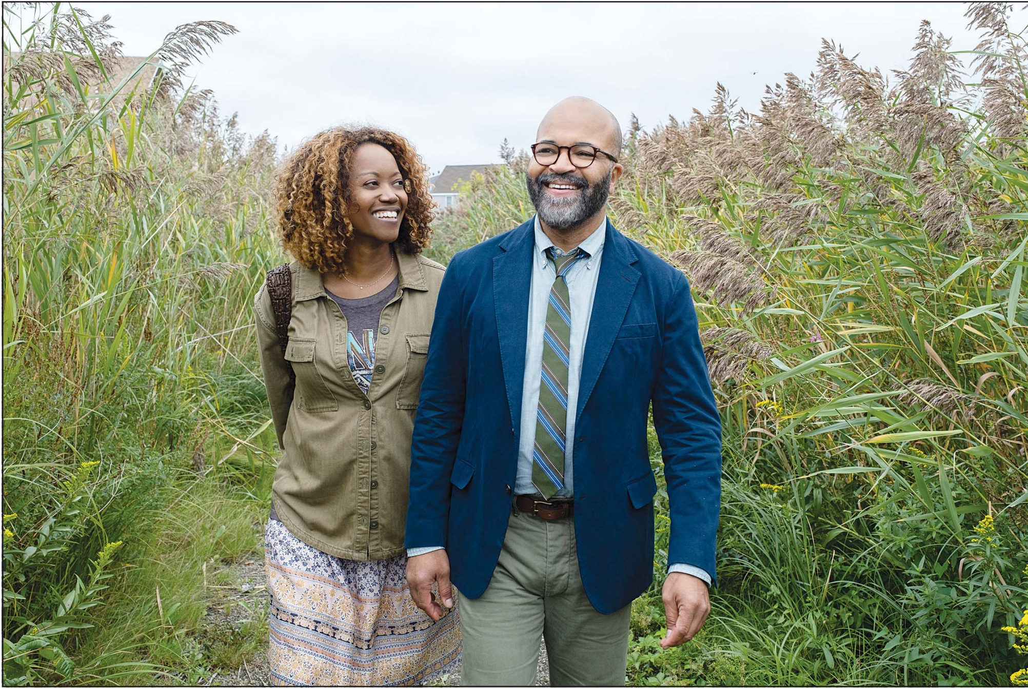
This image released by MGM shows Erika Alexander, (left), and Jeffrey Wright in a scene from 'American Fiction.'