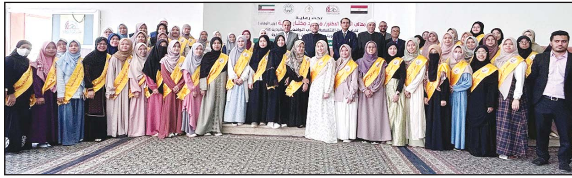
A group photo of foreign female students studying at Al-Azhar University.