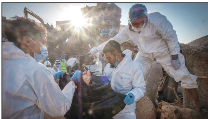
Rescuers recover the body of a victim killed during flooding in Derna, Libya, Friday, Sept. 15, 2023.