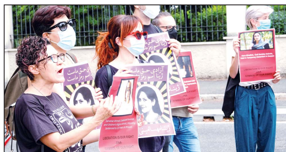
Protesters stage a demonstration near the Iranian embassy on the occasion of the one-year anniversary of the death of 22-year-old Mahsa Amini, in Rome, Sept. 16, 2023.