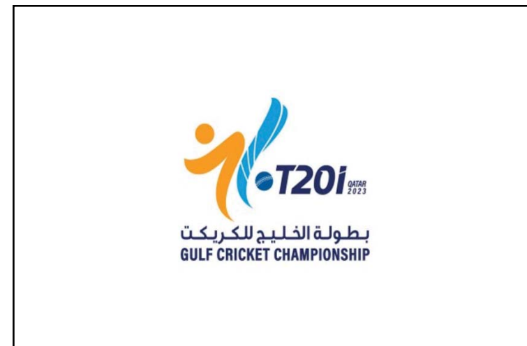
The championship logo.