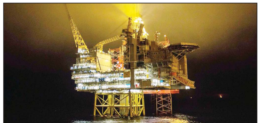
Gina Krog offshore platform