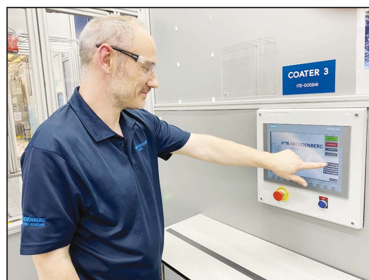
A Freudenberg Medical operator in Galway initiating the automated coating process for hypotubes.

The coating material and associated chemical use has been cut in half with