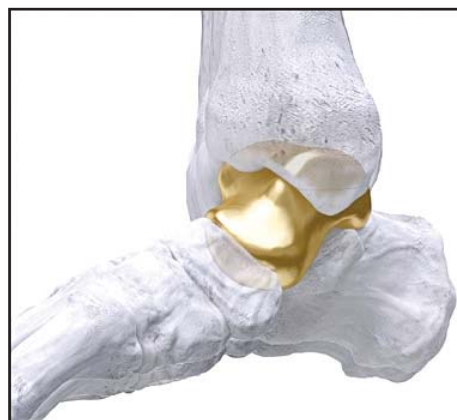
Paragon 28's first in the world 3D-printed Patient Specific Talus Spacer.