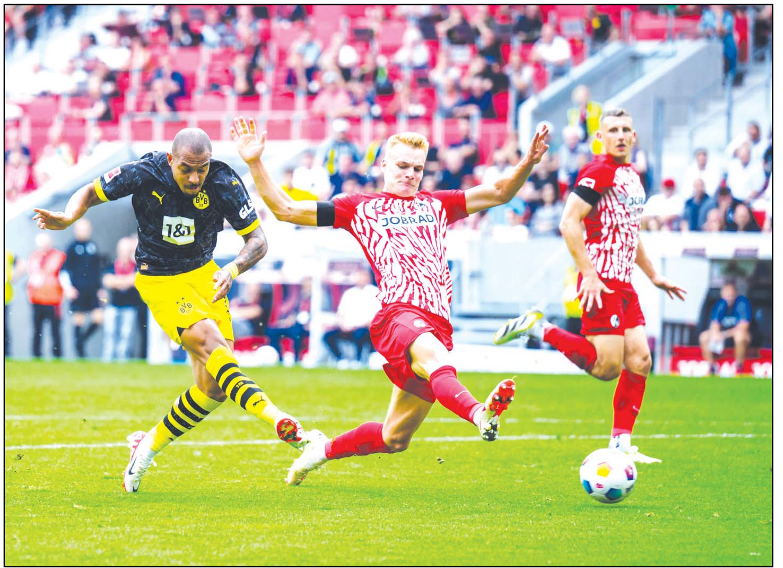
Dortmund's Donyell Malen (left), scores his side's second goal of the German Bundesliga soccer match between SC Freiburg and Borussia Dortmund in Freiburg, Germany.