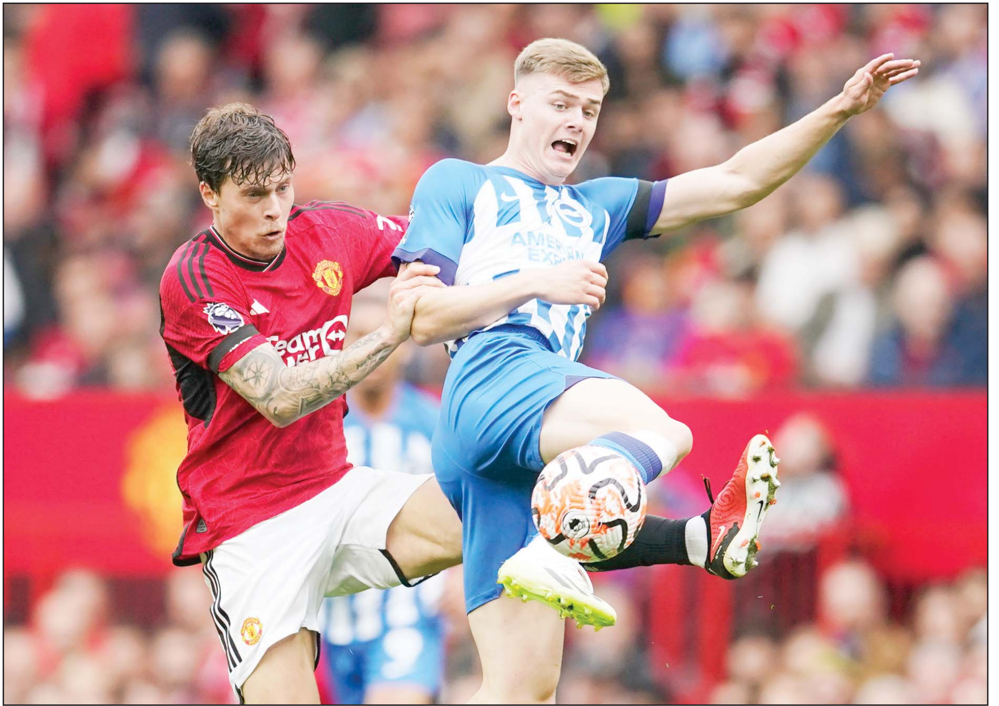
Manchester United's Victor Lindelof (left), challenges Brighton's Evan Ferguson during the English Premier League soccer match between Manchester United and Brighton and Hove Albion at Old Trafford stadium in Manchester, England.

Hojlund missed the start of the season while recovering from injury and that might have been a reason for his substitution. But the crowd appeared unimpressed and vociferously made its feelings known before showing their appreciation for the striker's efforts by applauding him as he left the field.