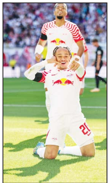
Leipzig's Xavi Simons celebrates scoring their side's first goal of the game during the German Bundesliga soccer match between RB Leipzig and FC Augsburg at the Red Bull Arena in Leipzig, Germany.

It seemed like Leon Goretzka had earned Bayern a late win to maintain the champion's perfect start.