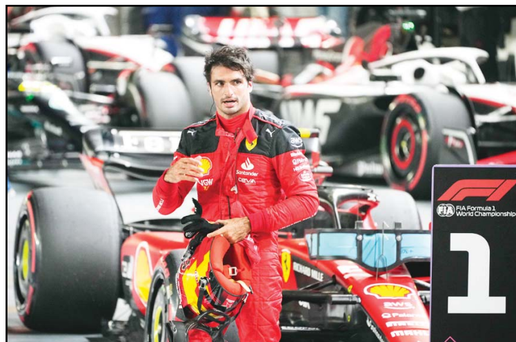
Ferrari driver Carlos Sainz gestures after the qualifying session of the Singapore Formula One Grand Prix at the Marina Bay circuit, Singapore, Saturday, Sept. 16, 2023. Sainz took pole position.

With Alonso qualifying seventh, the incident was a reminder of Stroll's underwhelming record this season at the team headed by his father, Lawrence Stroll. Alonso has racked up 170 points to Stroll's 47 and the Canadian has not reached the podium this season.