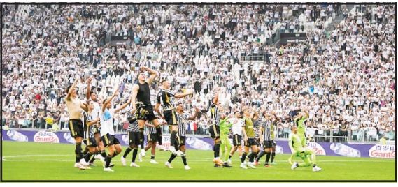
Juventus' team celebrates after defeating 3-1 Lazio during a Serie A soccer match between Juventus and Lazio, at Turin's Juventus Stadium, northern Italy.