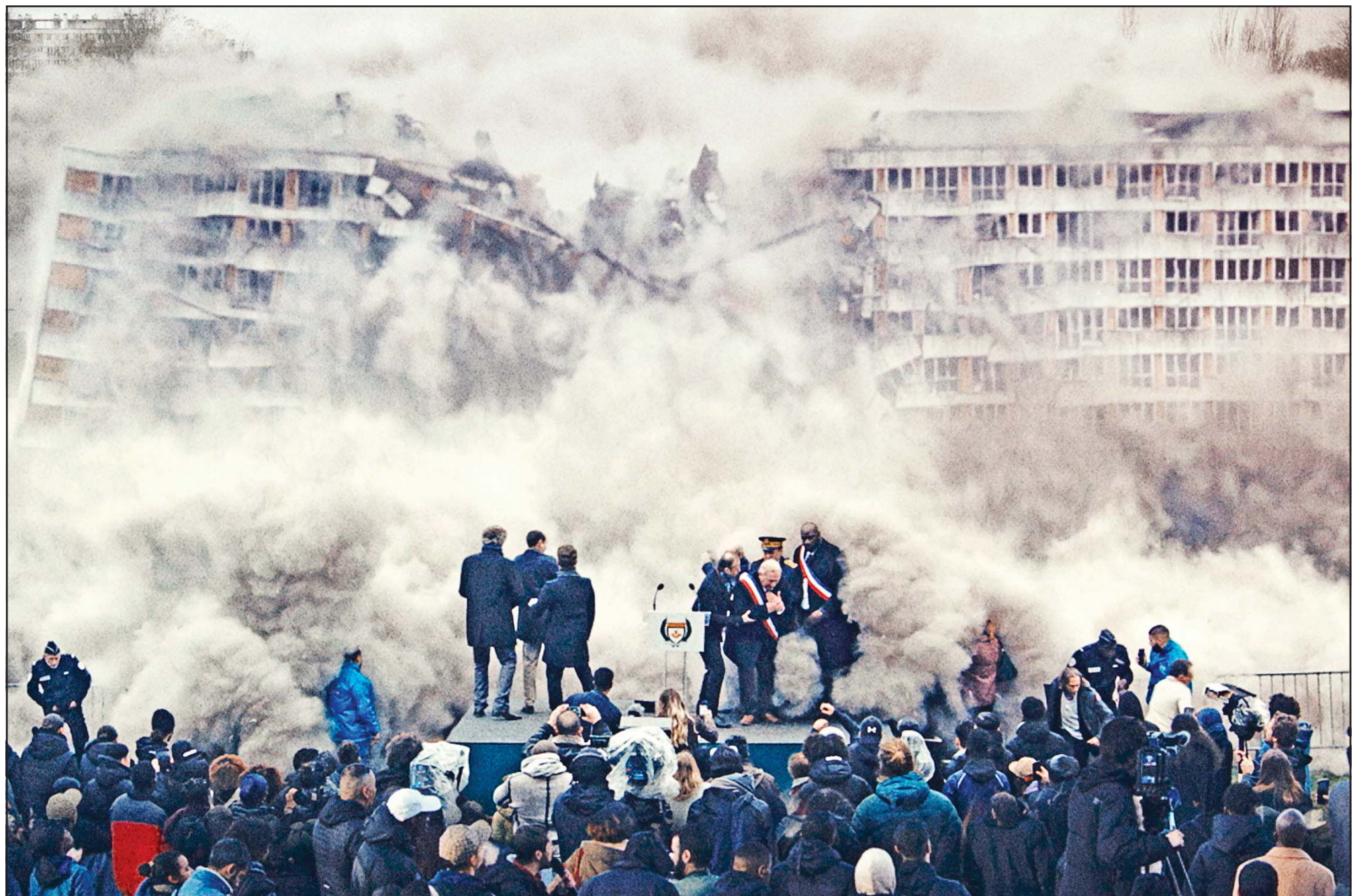
This image released by the Toronto International Film Festival shows a scene from the film 'Les Indésirables.'