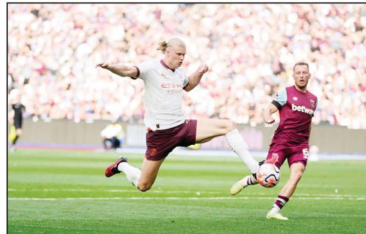
Manchester City's Erling Haaland attempts a shot at goal during the English Premier League soccer match between West Ham United and Manchester City at London Stadium in London.

The players, through the FUT-PRO players' union, issued a statement Friday signed by 21 of its 23 World Cup winners, and 18 other players, explaining that "the changes that have been made are not sufficient."