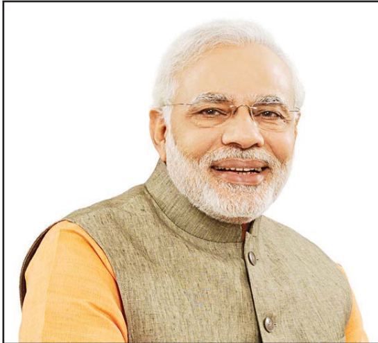
Prime Minister of India H.E. Narendra Modi

By H.E. Narendra Modi Prime Minister of India