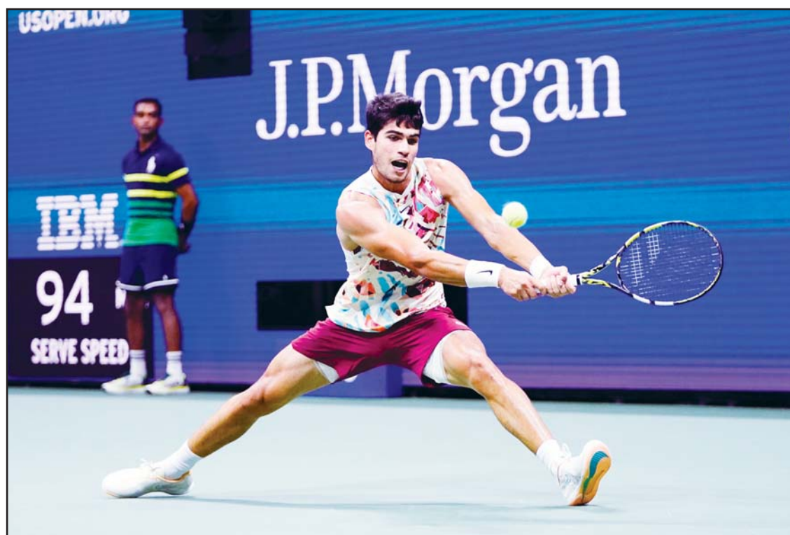
Carlos Alcaraz, of Spain, returns a shot to Alexander Zverev, of Germany, during the quarterfinals of the U.S. Open tennis championships in New York.

balenka will meet 2017 U.S. Open finalist Madison Keys, an American who saved all nine break points