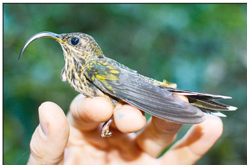
This photo provided by researchers shows a white-tipped sicklebill ( Eutoxeres aquila ) in San Vito, Costa Rica, in February 2018. Though a forest specialist, this bird often ventures into diversified farms in search of specific flower species that match the shape of its bill.

British scientists expressed relief at the decision, the latest sign of thawing rela-