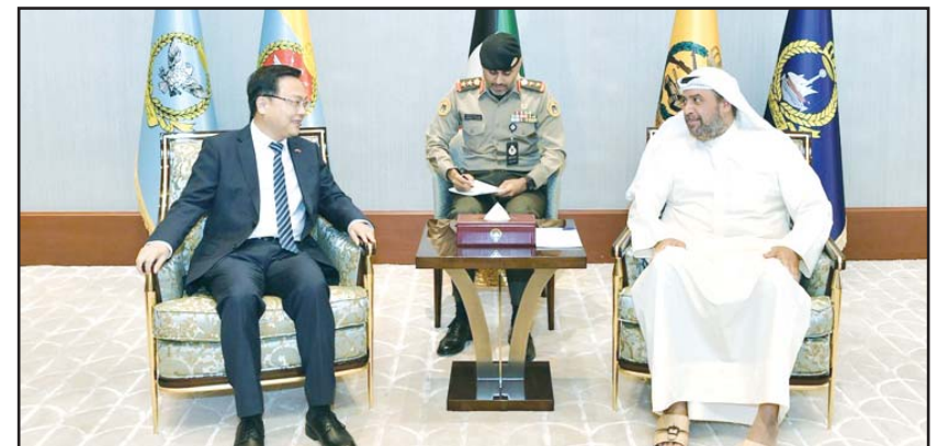
Deputy Prime Minister and Minister of Defense Sheikh Ahmad Fahad Al-Ahmad Al-Sabah, Chinese Ambassador discuss upcoming visit arrangements of Kuwait Deputy Amir to China.

The Council of Ministers worked to develop a project that includes controls, rules and conditions for naming streets and areas in Kuwait. It was submitted to the Municipal Council to discuss and decide on its articles, and to vote on it, as the Municipal Council is the main body concerned with the naming of streets and areas.