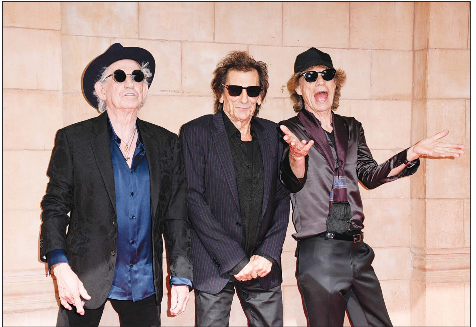
Keith Richards, (from left), Ronnie Wood, and Mick Jagger pose for photographers upon arrival at the Rolling Stones Hackney Diamonds launch event on Wednesday, Sept. 6, in London.