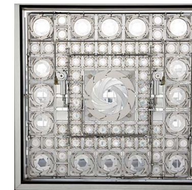
A window of IMA.