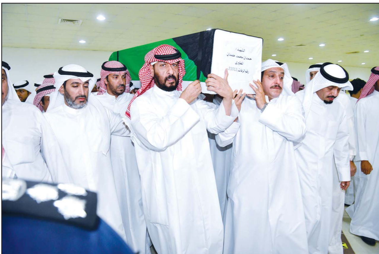
Minister of Interior Sheikh Talal Khaled Al-Ahmad Al-Sabah leads the funeral procession of martyr Hamdan Mohammad Al-Mutairi.

The Arab World Institute in Paris inaugurated in 1987 it is definitely an institute that promotes Arab culture and arts but thanks to the building designed by Jean Nouvel it does it in an extremely modern and captivating way.