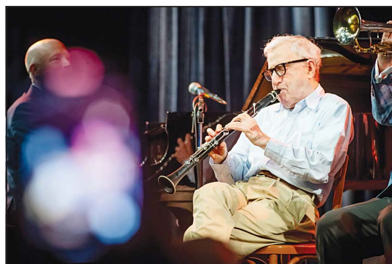
Director Woody Allen and his New Orleans Jazz Band perform at the Blue Note, in Milan, Italy, Wednesday, Sept. 6.

The Carroll case is part of a lineup of legal woes that Trump is facing as he campaigns to return to the White House.