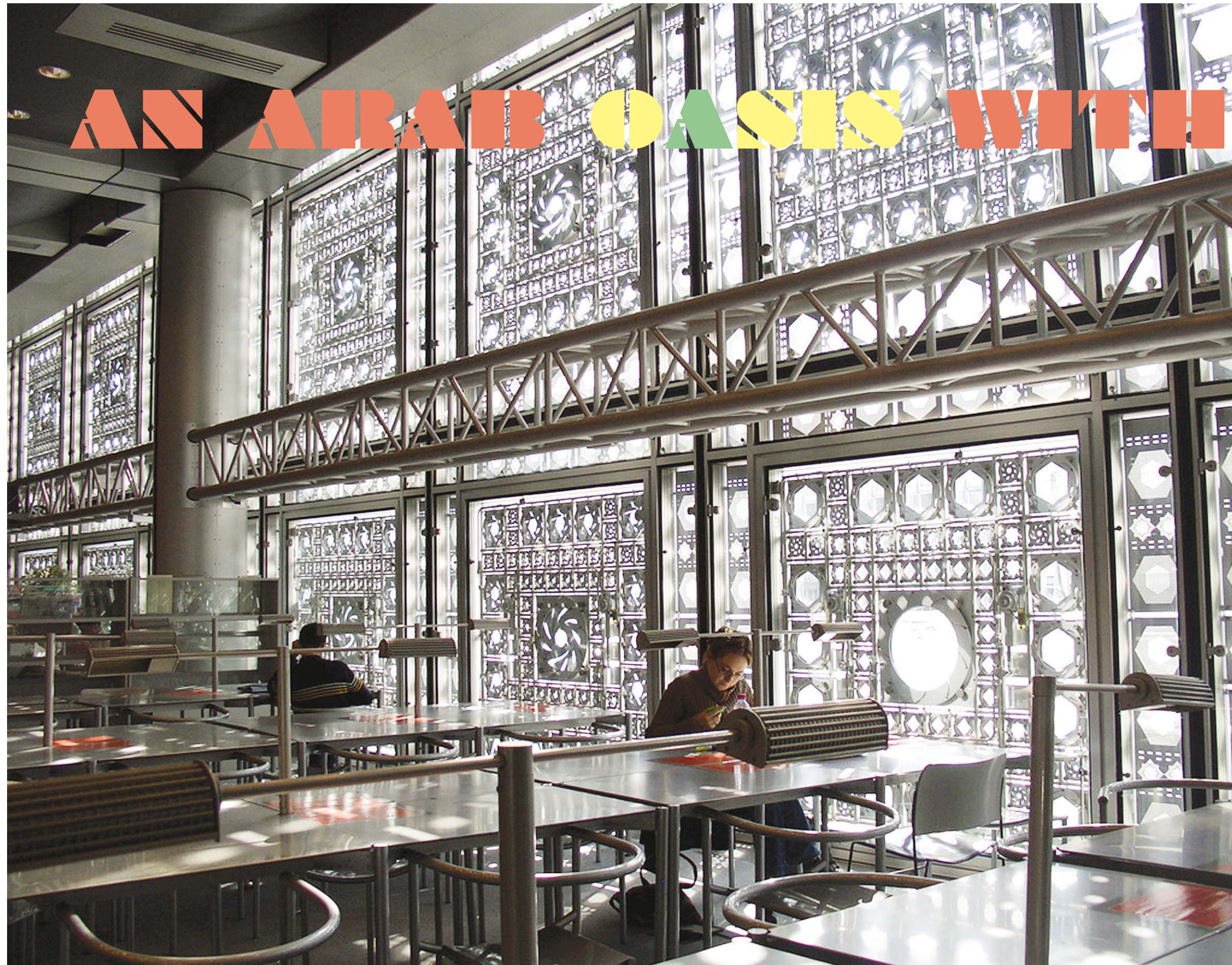
Interior view of the Institut du Monde Arabe (IMA).