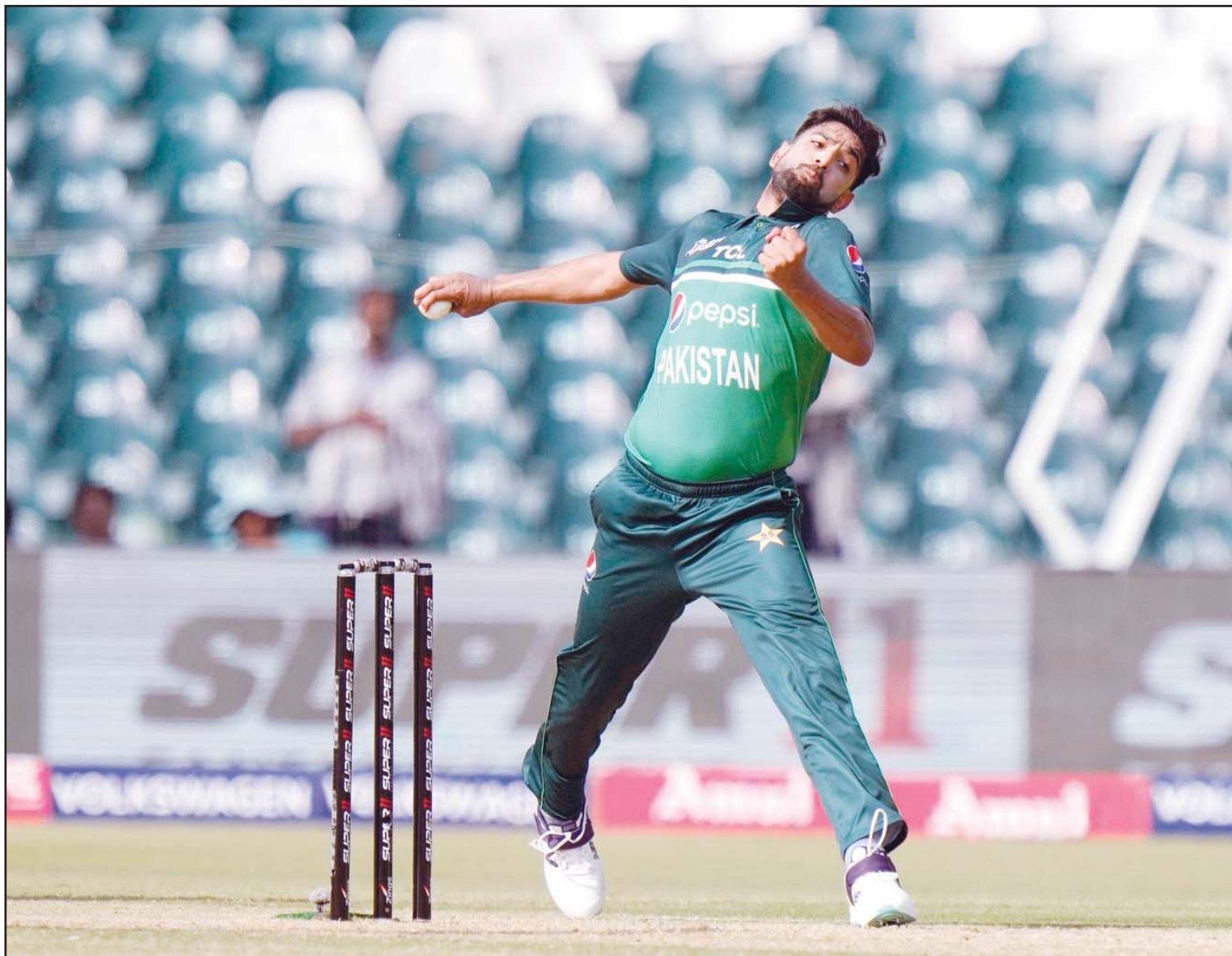
Pakistan's Haris Rauf bowls during the Asia Cup cricket match between Pakistan and Bangladesh in Lahore, Pakistan.