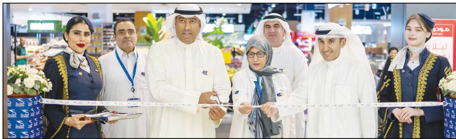
Inaugurating Kuwait Airways sales office at Assima Mall.

The U.S. Department of Energy has cited independent estimates that indicate transmission systems need to expand by 60% by 2030 and may need to triple by 2050. The agency is working with two national laboratories on a transmission planning study, with findings and recommendations expected later this year.