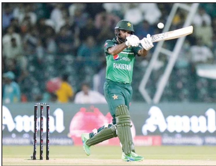
Pakistan's Fakhar Zaman bats during the Asia Cup cricket match between Pakistan and Bangladesh in Lahore, Pakistan.

"On a wicket like this we shouldn't lose four wickets in the first 10 overs," Al Hasan said. "Very poor batting display on a surface like this, but we have to move on to the next one."