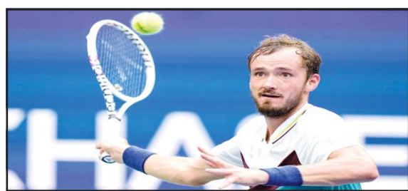
Daniil Medvedev, of Russia, returns a shot to Andrey Rublev, of Russia, during the quarterfinals of the U.S. Open tennis championships in New York.