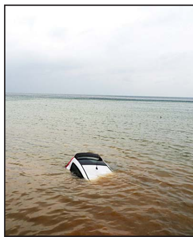
A car is half sunk in the sea after a record rainfall in Milina village, Pilion region, central Greece, Wednesday, Sept. 6, 2023. Rescue teams in Turkey, Greece and Bulgaria have recovered more bodies following floods after fierce rainstorms. (AP)

Interest in traditional medicine is growing among those who have mainly used conventional medicine in the past. More research and collaborative efforts to develop safety standards can make traditional medicine accessible to all who seek it. (AP)