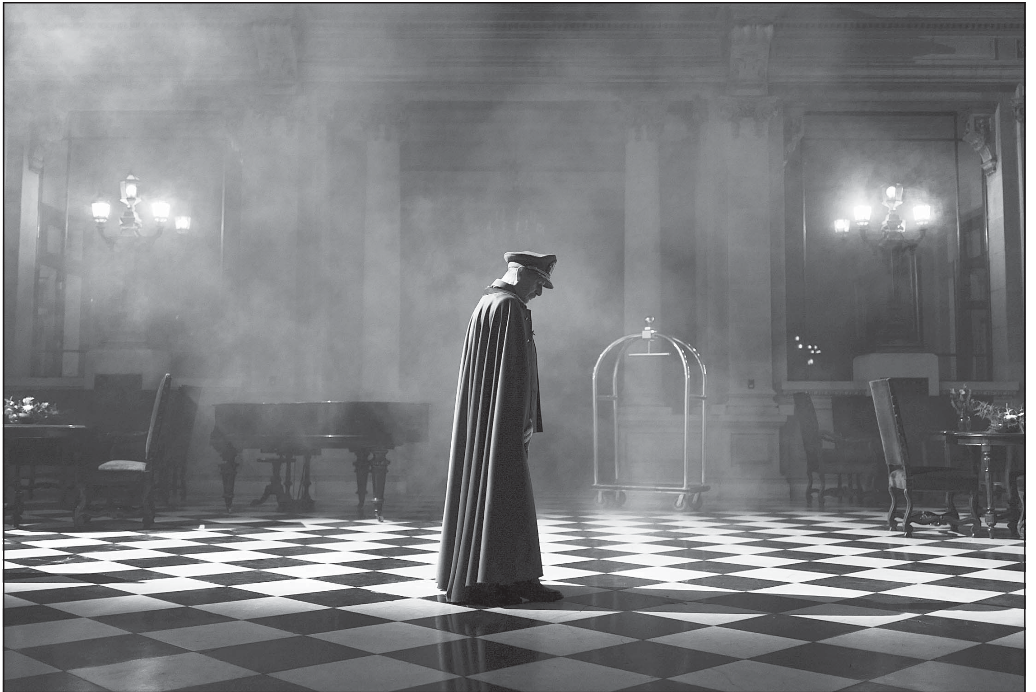
This image released by Netflix shows a scene from 'El Conde.'