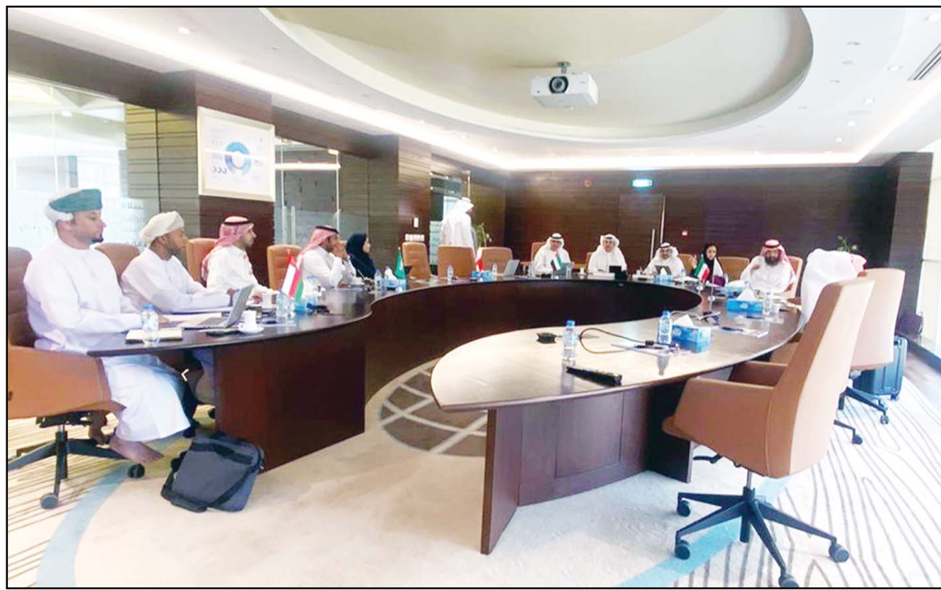
The 19th Air Transport Committee meeting of the General Secretariat of the Arab Gulf States.

The Central Bank of Kuwait plays a pivotal role in KECCS, overseeing its operation and serving as the government bank, collecting checks for government agencies. Regulatory rules have been established to govern KECCS, ensuring a structured framework for all participating entities and their interactions within the system.