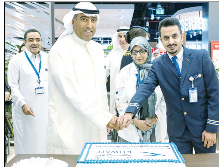
Cutting the inaugural cake.

receiving enquiries and comments from customers, including Oasis Club members.