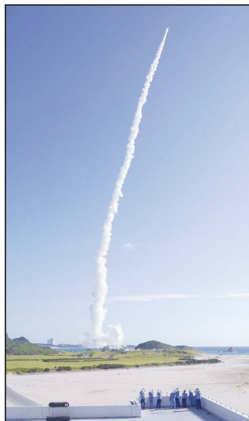
An HII-A rocket lifts off from the launch pad at Tanegashima Space Center in Kagoshima, southern Japan Thursday, Sept. 7, 2023.

TOKYO: Japan launched a rocket Thursday carrying an X-ray telescope that will explore the origins of the universe as well as a small lunar lander.