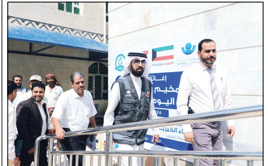
Kuwait's Namaa Charity launches several relief and development projects in Ma'rib, Yemen.