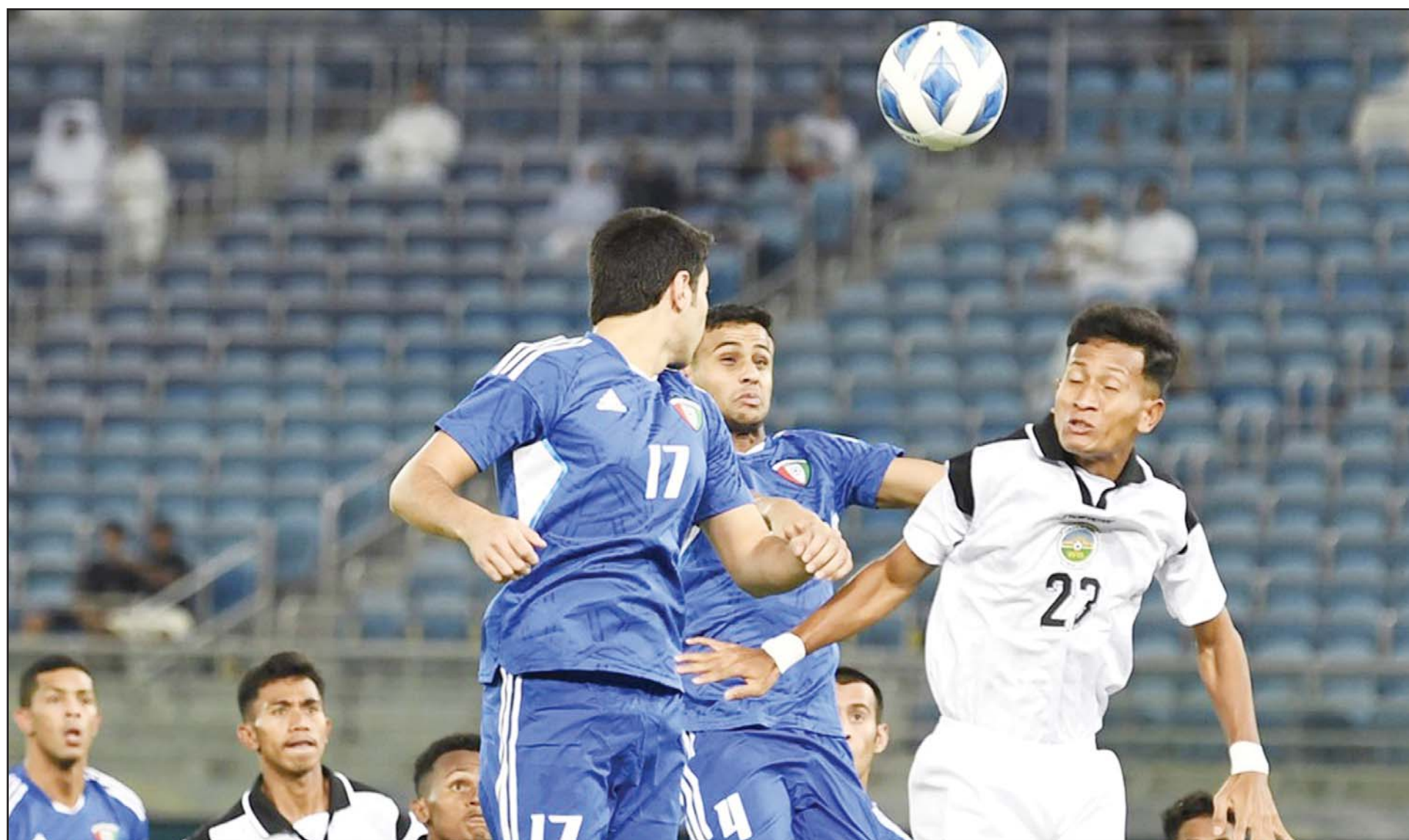
Kuwaiti players vie for the ball during the U-23 Asian Cup qualifier between Kuwait and Timor-Leste.

"I'm not sure what can we do. Because probably we cannot stop the tournament for four days - because it's been, what, three, four days it's been brutal like this? - because then it basically ruins everything: the TV, even the tickets, everything. It ruins everything," said Medvedev, who said he needed an ice bath and some-