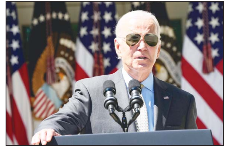
President Joe Biden speaks about the August jobs report in the Rose Garden of the White House, Friday, Sept. 1, 2023, in Washington.

WASHINGTON, Sept. 2, - America's employers added 187,000 jobs in August, evidence of a slowing but still-resilient labor market despite the high interest rates the Federal Reserve has imposed.