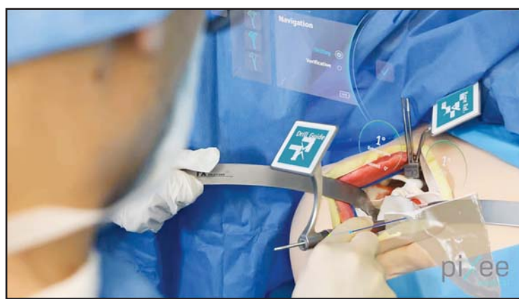
Shoulder+, precise 3D navigation of instruments.

Stemline Therapeutics, Inc. ("Stemline") a wholly-owned subsidiary of the Menarini Group, is a commercial-stage biopharmaceutical company focused on the development and commercialization of novel oncology therapeutics.