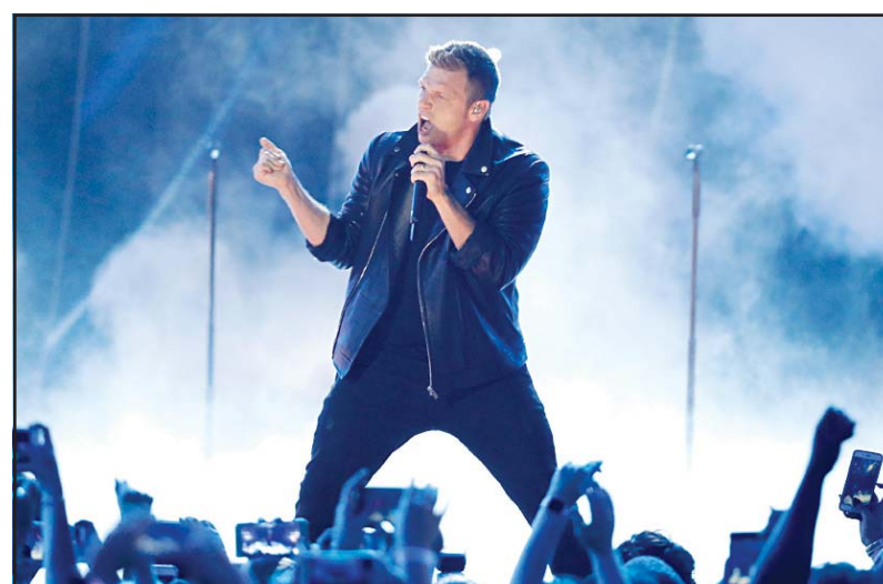
Nick Carter of Backstreet Boys performs 'Don't Go Breaking My Heart' at the CMT Music Awards at the Bridgestone Arena, June 6, 2018, in Nashville, Tenn. Carter is facing two civil lawsuits in Las Vegas brought separately by women who allege he sexually assaulted them in 2003 and 2001. — Details Page 11