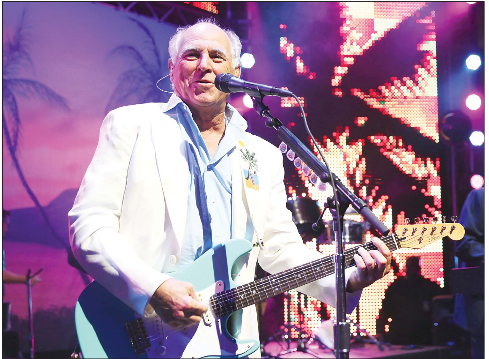
Jimmy Buffett performs at the after party for the premiere of 'Jurassic World' in Los Angeles, on June 9, 2015. 'Margaritaville' singer-songwriter Jimmy Buffett has died at age 76. A statement on Buffett's official website and social media pages says the singer died Friday, Sept. 1, 2023 'surrounded by his family, friends, music and dogs'.