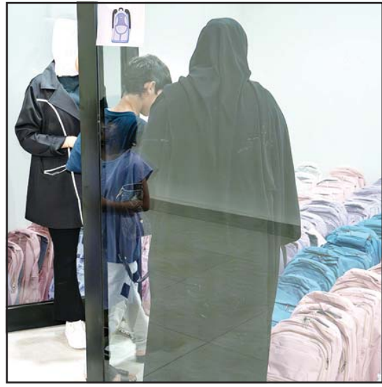
Limited income families choose schoolbags for their children.