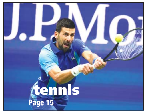
tennis Page 15