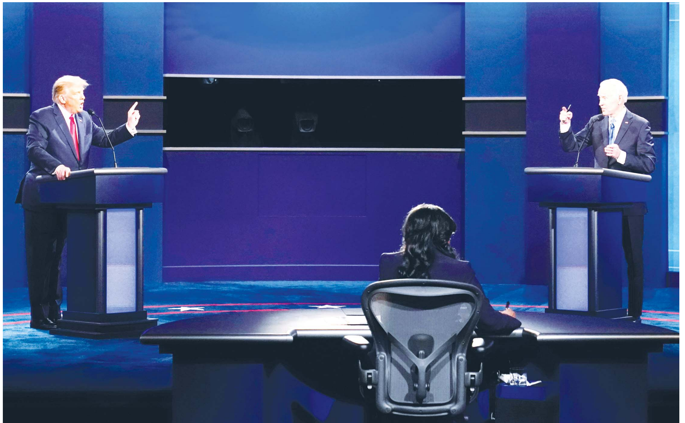
President Donald Trump, left, and Democratic presidential candidate former Vice President Joe Biden during the second and final presidential debate Oct. 22, 2020, at Belmont University in Nashville, Tenn. Unflattering portraits of both President Joe Biden and former President Donald Trump emerge clearly in a new poll by The Associated Press-NORC Center for Public Affairs Research, which asked an open-ended question about what comes to mind when people think of them.