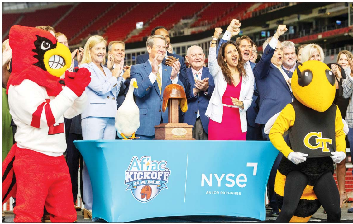
Georgia Gov. Brian Kemp claps after remotely ringing the New York Stock Exchange opening bell from Mercedes-Benz Stadium in Atlanta on Friday, Sept. 1, 2023, ahead of the inaugural Aflac Kickoff Game. It's the first time the NYSE opening bell has been rung from the state of Georgia.