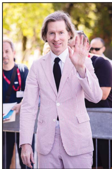
Director Wes Anderson arrives to the photo call for the film 'The Wonderful Story of Henry Sugar' during the 80th edition of the Venice Film Festival in Venice, Italy, on Friday, Sept. 1.