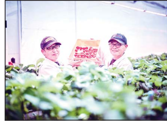
Toyota cultivates strawberries

The strawberries and cherry tomatoes are now being served up to Toyota employees free of charge, a testament to the company's interest in employing novel methods to achieve carbon neutrality across all its factories by 2035.