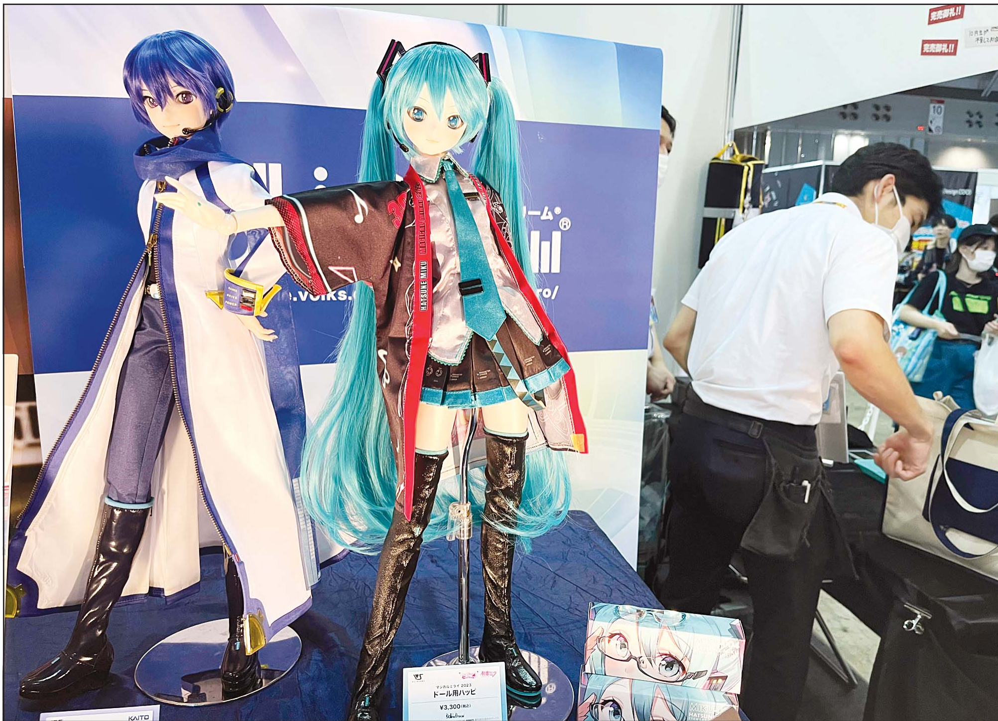
A figure of Hatsune Miku is displayed at an event at a Tokyo suburban hall, Makuhari Messe, in Chiba, Japan, Friday, Sept. 1, in celebration of her 16th birthday. Hatsune Miku has always been 16 years old and worn long aqua ponytails. She is Japan's most famous Vocaloid, a computer-synthesized singing voice software that, in her case, comes with a virtual avatar.