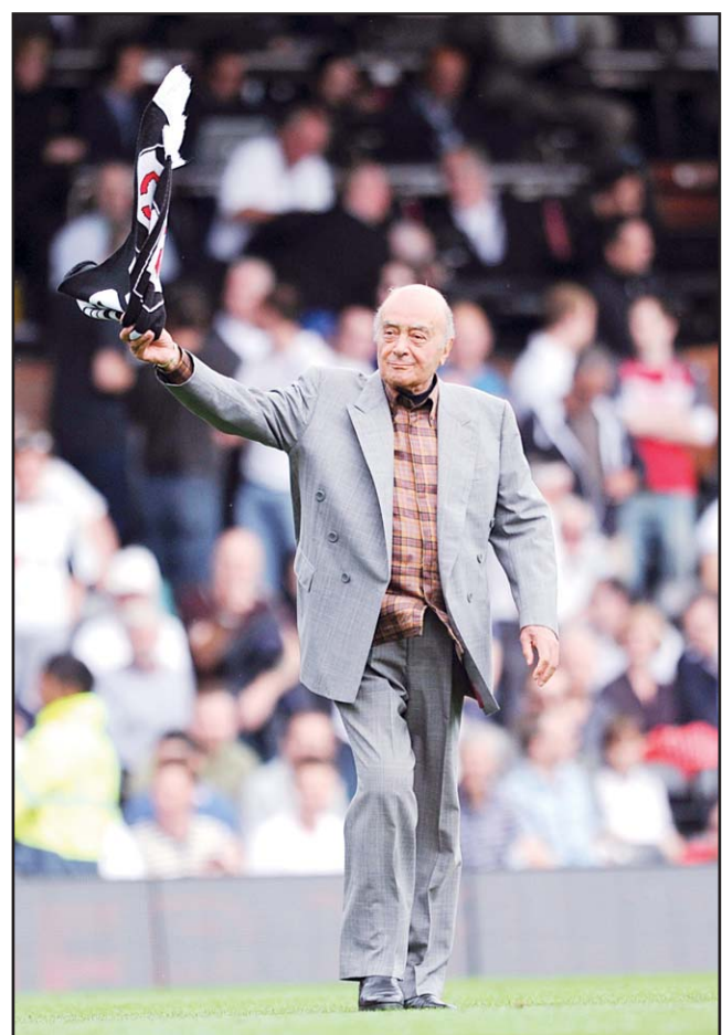
Fulham chairman Mohamed Al Fayed on Aug. 13, 2011, in London. Al Fayed, the former Harrods owner has died at age 94. His death was announced Friday, Sept. 1, 2023, by Fulham Football Club, which Al Fayed once owned.

"Let us continue to meet our sacred obligation to our service members, veterans, and their families, caregivers, and survivors who gave so much over so many years in Afghanistan."