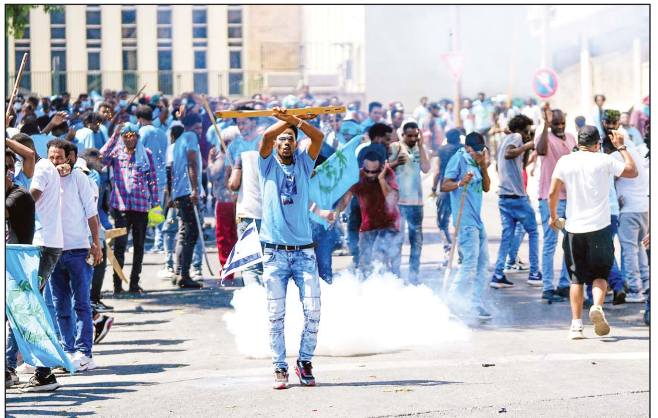
Eritrean protesters clash with Israeli riot police in Tel Aviv, Israel, Saturday, Sept. 2, 2023. Hundreds of Eritrean asylum seekers smashed shop windows and police cars in Tel Aviv on Saturday and clashed with police during a protest against an event organized by the Eritrea Embassy.