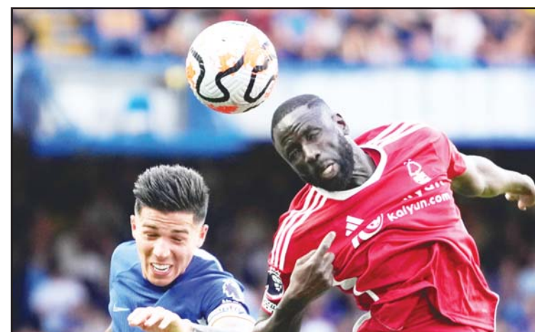
Nottingham Forest's Cheikhou Kouyate (right), and Chelsea's Enzo Fernandez (left), jump for a header during the English Premier League soccer match between Chelsea and Nottingham Forest at Stamford Bridge Stadium in London.

West Ham claimed its third straight win and ensured at least one night atop the English Premier League by beating Luton 2-1 thanks to headers by Jarrod Bowen and Kurt Zouma.