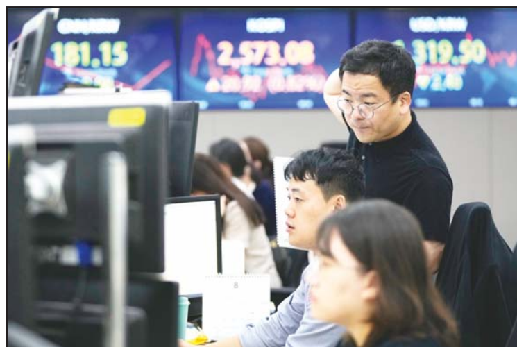
Currency traders watch monitors at the foreign exchange dealing room of the KEB Hana Bank headquarters in Seoul, South Korea, on Aug 30, 2023. Asian shares were trading mixed Friday, Sept. 1 as investors looked toward a United States jobs report which was released later in the day.

Wall Street welcomed the latest monthly labor market snapshot, as it roots for the economy to show signs of lower inflation and cooling job growth so that the Fed will be able to ease up on its rate hike campaign.