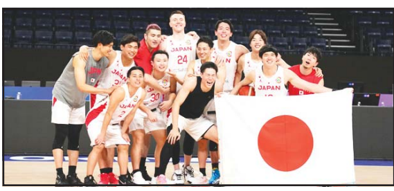
Japan's team has their group photo taken after they defeated Cape Verde in their Basketball World Cup classification match in Okinawa, southern Japan.