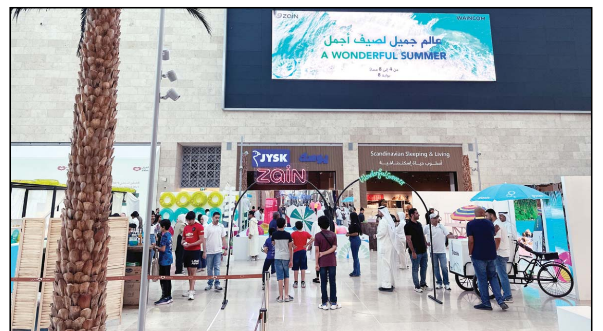
A photo from Zain's summer event 2023