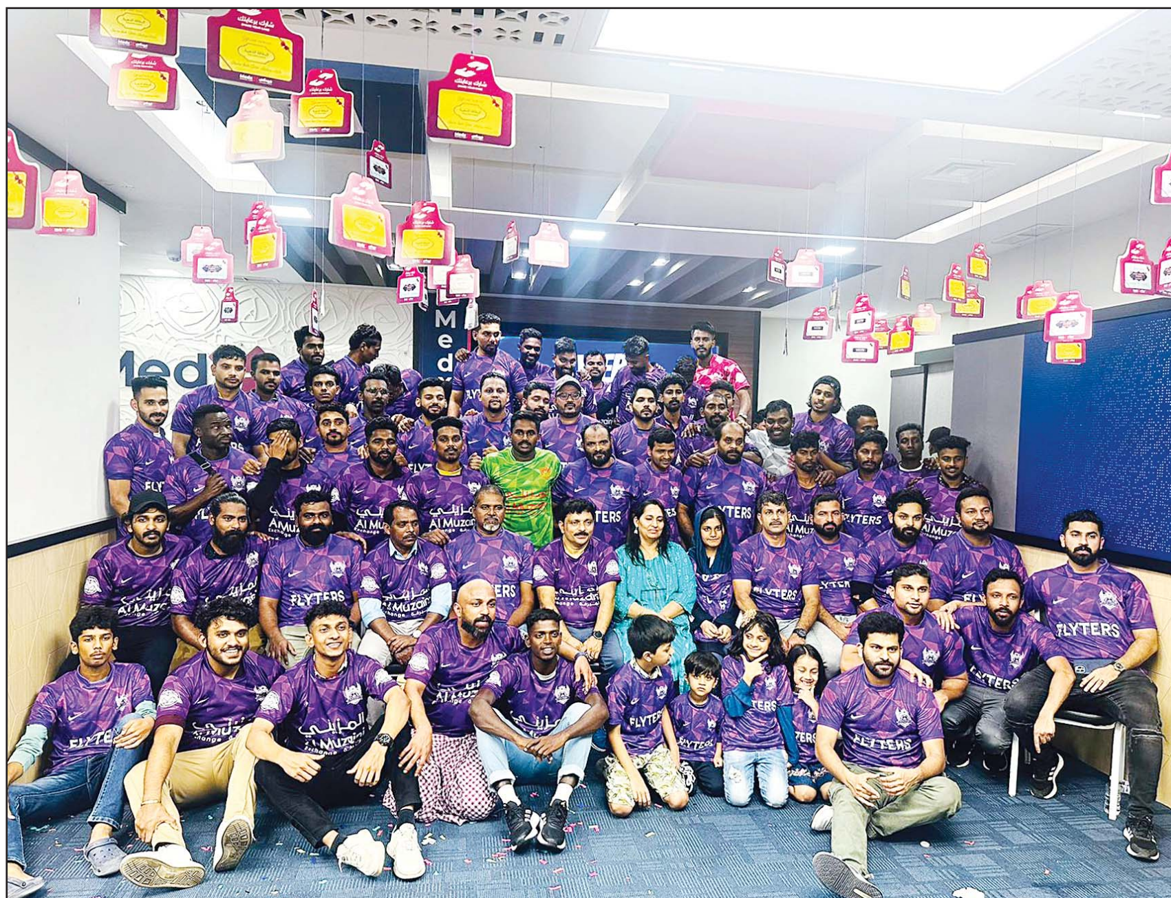
A group photo from the FFC's new jersey launch ceremony.

By exploring math and poetry, I believe they, as aspiring teachers, will begin to question how they were taught – for example, the use of timed tests and learning with no real-world connections. A lot of people say they don't like math, when, in truth, they have never knowingly experienced math connected to their culture, values, desires and dreams. Math and poetry work to reclaim how we all see, experience and live with math every day.