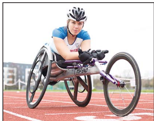
7-time Paralympic Champion Hannah Cockroft.