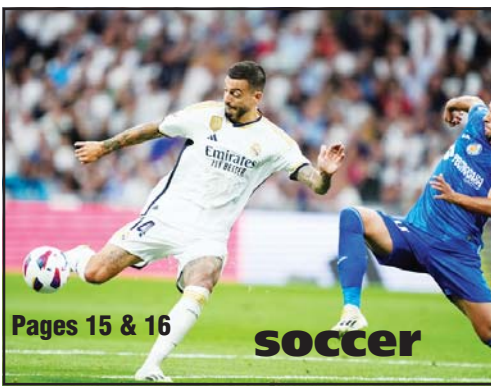
Pages 15 & 16 soccer