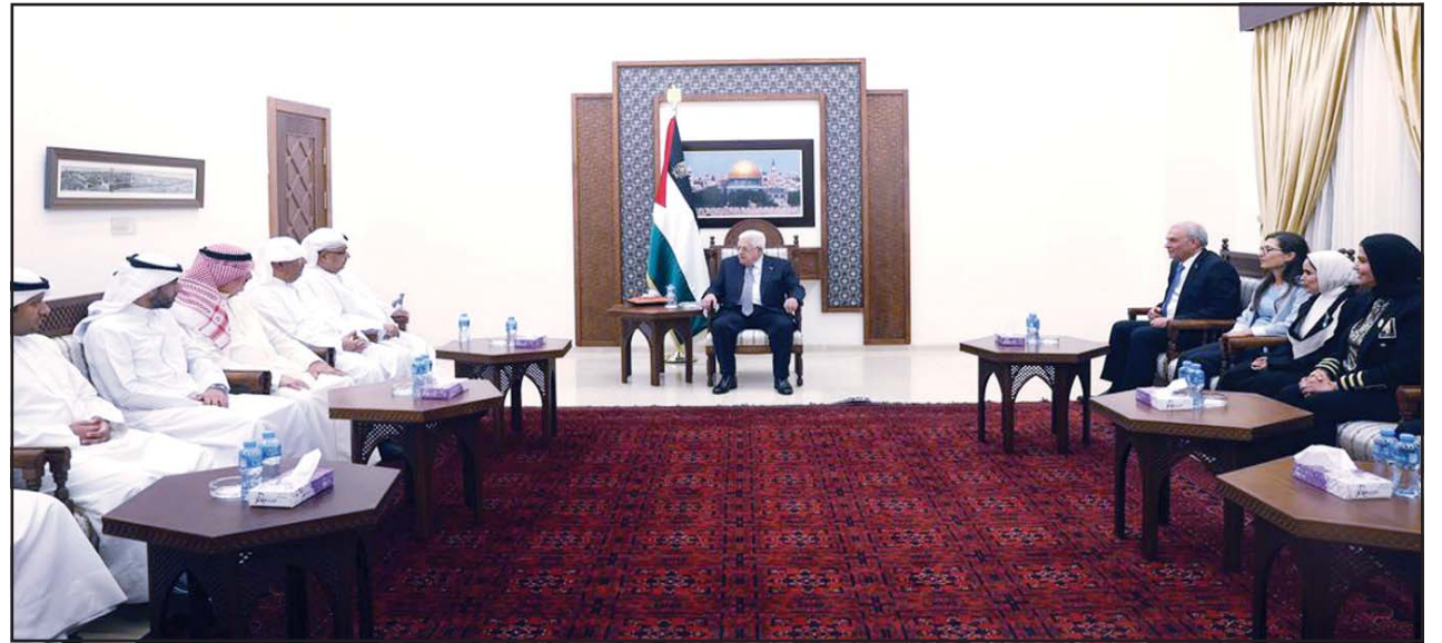
Palestinian President Mahmoud Abbas receives a teacher-contracting delegation from the Kuwaiti Ministry of Education.