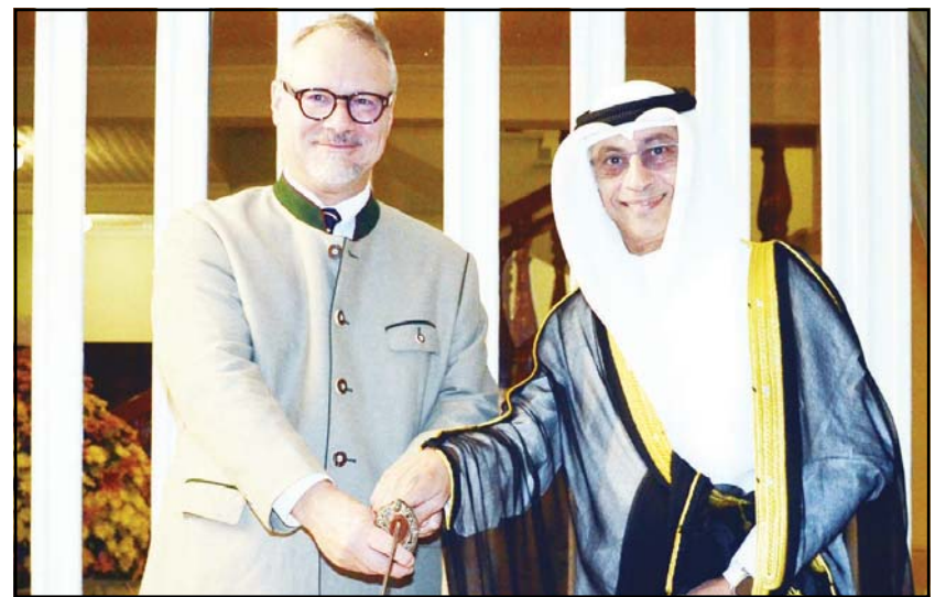
The cake-cutting ceremony.

The index comprises eight primary factors, which are divided into 44 sub-factors. These primary factors encompass "limitations on government authority," "absence of corruption," "transparent governance," "fundamental rights," "public order and security," "regulatory enforcement," and "civil and criminal justice."