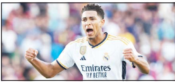
Real Madrid's Jude Bellingham celebrates after scoring his side's second goal during the La Liga soccer match between Barcelona and Real Madrid at the Olympic Stadium in Barcelona, Spain.