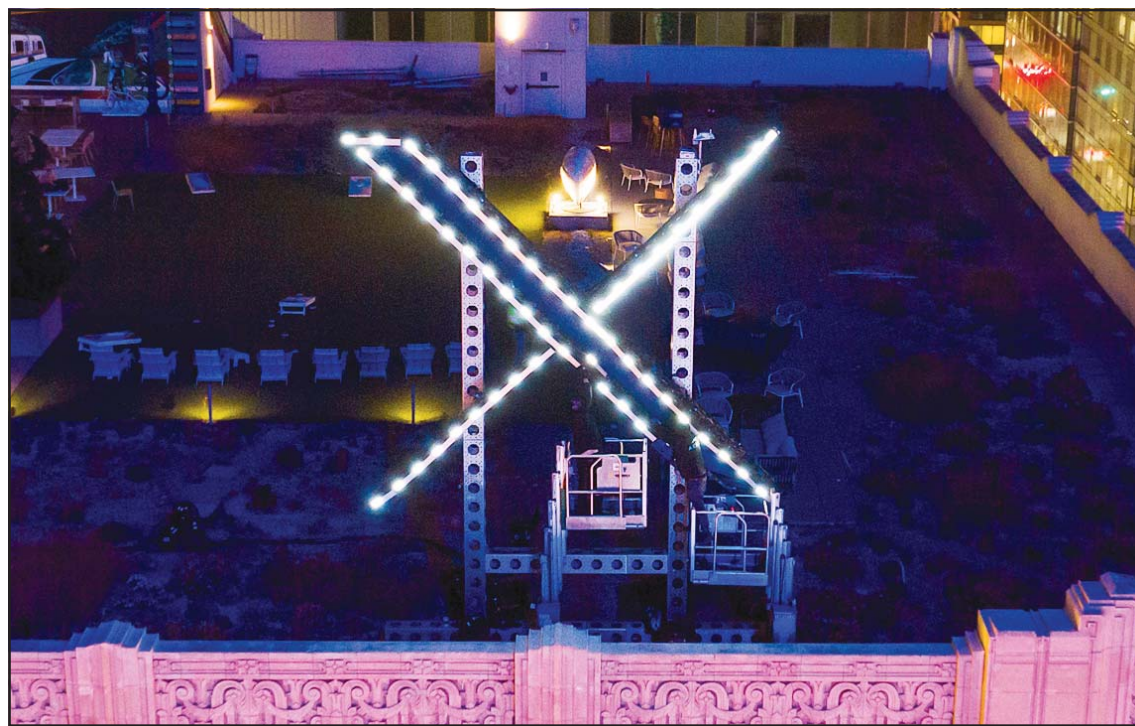
Workers install lighting on an 'X' sign atop the company headquarters, formerly known as Twitter, in San Francisco, on July 28, 2023. One year ago, Elon Musk began transforming the social media platform into what is now known as X.

On Thursday, for instance, a new report from the left-leaning nonprofit Media Matters found that numerous blue-checked X accounts with tens of thousands of followers