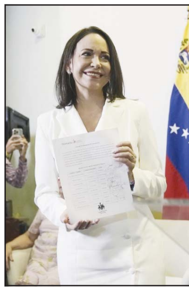
Maria Corina Machado attends a ceremony with the Opposition Primary Commission that recognizes her electoral win in the opposition-organized primary election to choose a presidential candidate in Caracas, Venezuela on Oct 26.