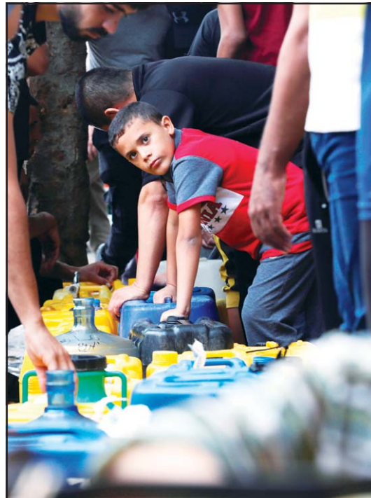
Palestinians arrive to collect drinking water during the ongoing Israeli bombardment of the Gaza Strip in Rafah on Saturday, Oct. 28, 2023.