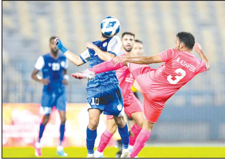
Al-Salmiya and Al-Shabab players challenge for the ball during the Zain Premier League game.

This round carries the potential for a change in leadership. A defeat for "Al-Abyad" could cost them their top position, paving the way for a new contender to ascend to the throne.