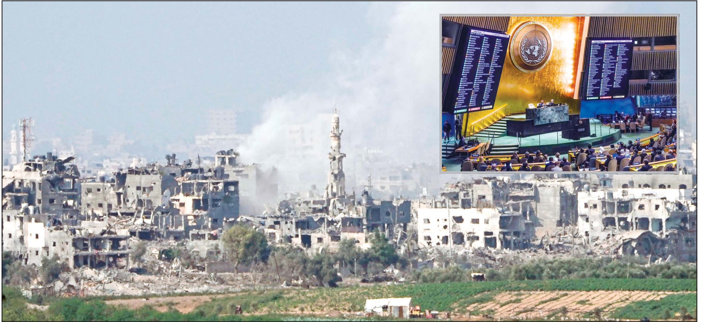
Smoke rises following an Israeli airstrike in the Gaza Strip, as seen from southern Israel, Saturday, Oct. 28, 2023. Inset: Results are displayed as the U.N. General Assembly voted for a non-binding resolution calling for a 'humanitarian truce' in Gaza and a cessation of hostilities between Israel and Gaza's Hamas rulers, Friday, Oct. 27, 2023 at U.N. headquarters.