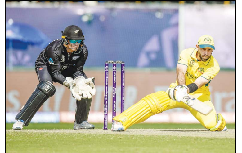
Australia's Glenn Maxwell (right) plays a shot during the ICC Men's Cricket World Cup match between Australia and New Zealand in Dharamshala, India.

In reply, Rachin Ravindra scored his second World Cup century and almost helped his team chase down the tall target in an epic last game of the tour-