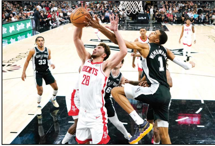
Houston Rockets center Alperen Sengun (28) has his shot blocked by San Antonio Spurs center Victor Wembanyama (1) during the first half of an NBA basketball game in San Antonio.

Brunson made 11 of 21 shots from the field, including 8 of 12 from be-