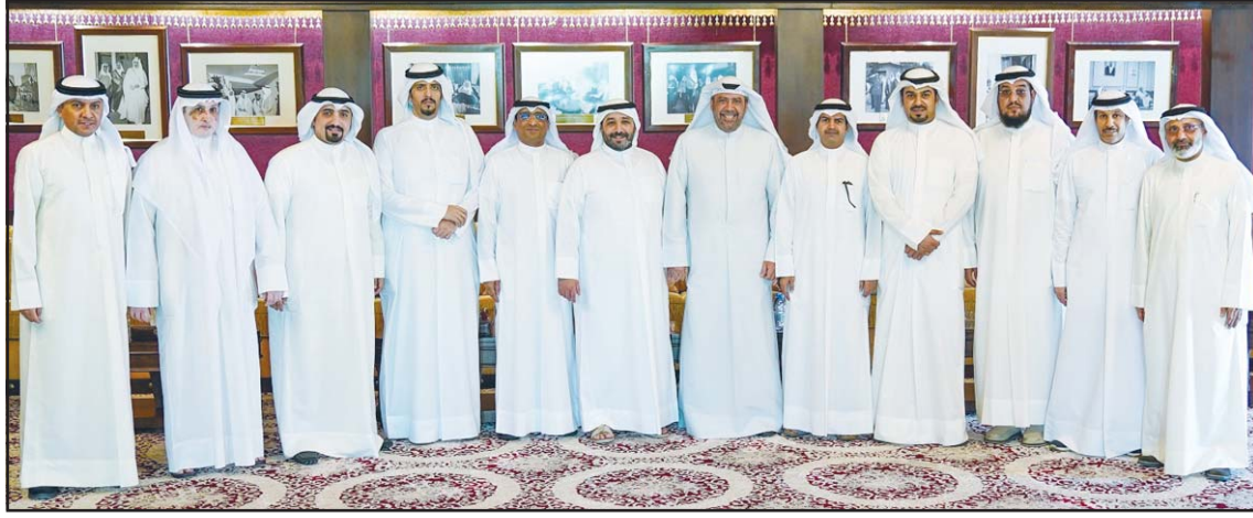
Deputy PM and Minister of Defense Sheikh Ahmad Fahad during his visit to Kuwait Embassy's HQ.