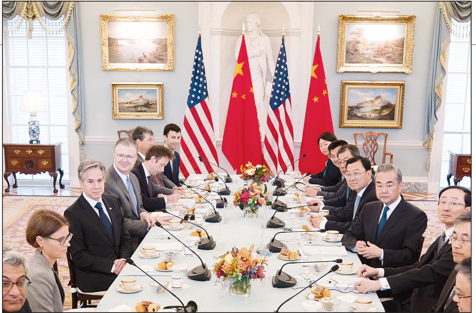
US Secretary of State Antony Blinken, (third from left), and China's Foreign Minister Wang Yi, (fourth from right), with their delegations hold a bilateral meeting at the US State Department in Washington on Oct 27.

Major coordinated attacks initiated by opponents of Myanmar's military government are relatively rare, partly because the army has a great advantage in weaponry and trained manpower.