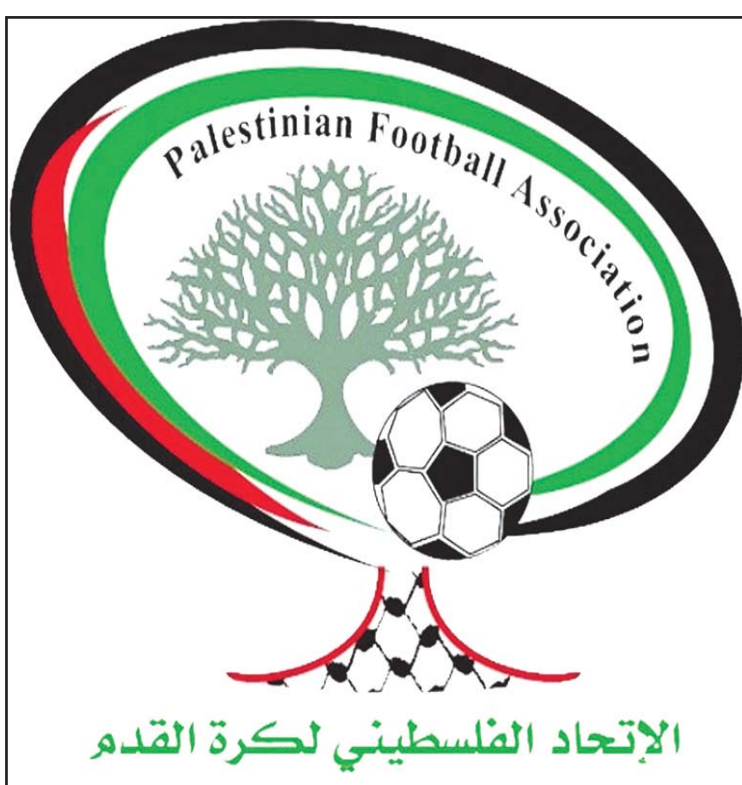
Palestinian FA logo.