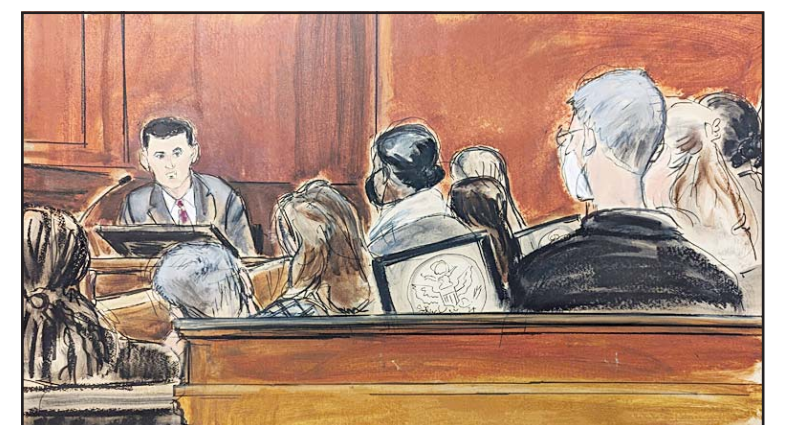
In this courtroom sketch, Sam Bankman-Fried testifies on the witness stand in Manhattan federal court, Friday, Oct. 27, 2023, in New York.

The defendant was extradited from the Bahamas to New York in December to face fraud charges.