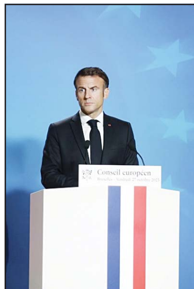
French President Emmanuel Macron speaks during a media conference at an EU summit in Brussels on Oct 27. European Union leaders concluded a second day of meetings on Friday in which they discussed, among other issues, migration.