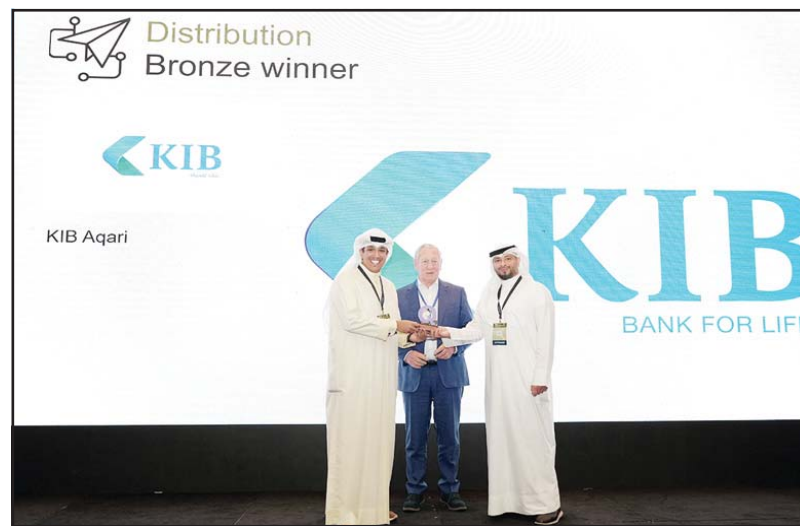
KIB Aqari wins an award.

It is worth highlighting that the Council of Ministers assigned the project to the Ministry of Public Works through Resolution No. 838 issued during its meeting No. 234/2022 held on 29/08/2022.