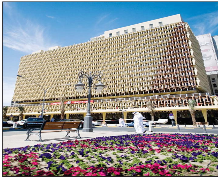
Gulf Bank Headquarters.

Joint Real Estate Deal Furthermore, Markaz offered Gulf Bank clients the opportunity to invest in