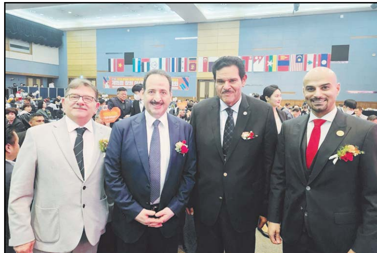
Sheikh Salman Al-Hamoud with other officials during the opening of the tournament.

ment to a comprehensive plan aimed at nurturing new generations of fencing talents, uncovering potential, and hon-