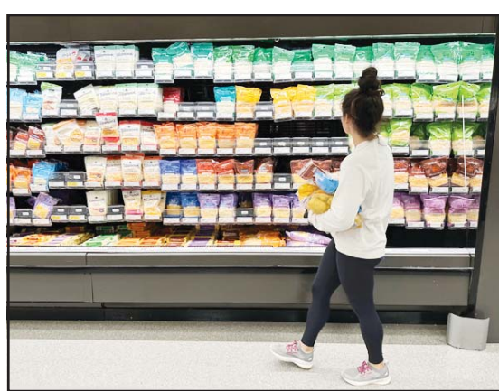
A shopper peruses cheese offerings at a Target store on Oct. 4, 2023, in Sheridan, Colo. On Thursday, the Labor Department issues its report on inflation at the consumer level.

Since March 2022, the central bank has raised its key rate from