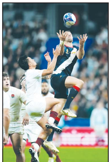
Argentina's Emiliano Boffelli catches the ball against England's Marcus Smith during the Rugby World Cup third place match between England and Argentina at the Stade de France in Saint-Denis, outside Paris.

after halftime when, out of nothing, Pumas flyhalf Santiago Carreras slipped front-rowers Theo Dan and Ellis Genge and glided around Smith to score between the posts.