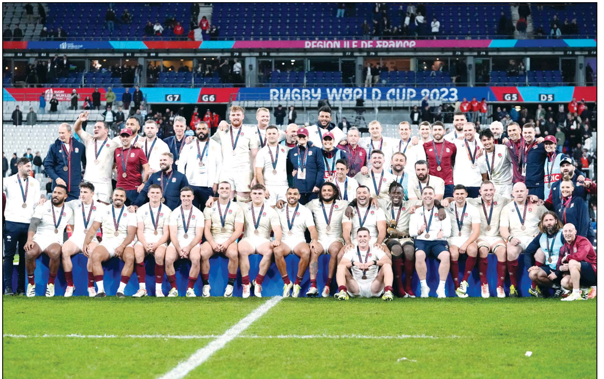
England players pose after winning the Rugby World Cup third place match between England and Argentina at the Stade de France in Saint-Denis, outside Paris.