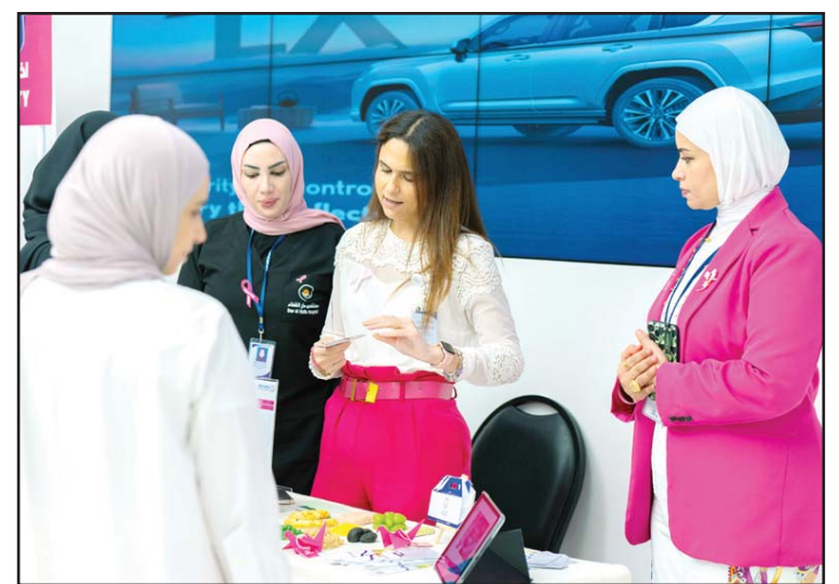
A photo from the event.

As a gesture of appreciation to the ladies who visited the boutique and