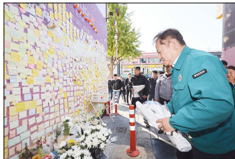
South Korean Interior and Safety Minister Lee Sang-min places flowers to pay his condolence to the victims of the Oct 29, 2022 crush, in front of the messages for condolences in Seoul, South Korea on Oct 28. South Koreans are holding highly subdued Halloween celebrations this weekend amid tight police security, as the country marks the first anniversary of the harrowing party crush that killed about 160 people. (AP)

But despite some assurances by Maduro's government that the opposition would be allowed to choose a candidate, it has cast heavy doubt on any outcome of the weekend primary. Prosecutors have opened a criminal investigation into primary organizers on charges including identity fraud and usurping authority, and on top of that the government has maintained a ban on Machado running for office. (AP)