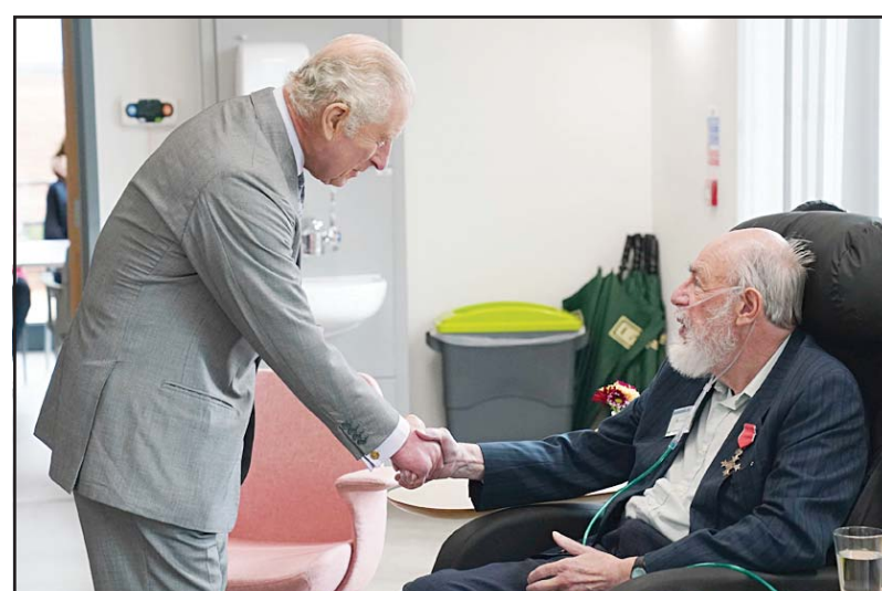
Britain's King Charles III meets residents whilst opening the Priscilla Bacon Lodge hospice in Norwich, England on Oct 26.

The August riverfront melee in Montgomery drew national attention after white boaters were filmed hitting a Black riverboat co-captain and crew members rushing to his defense. Video of the fight was shared widely online, sparking countless memes and parodies.