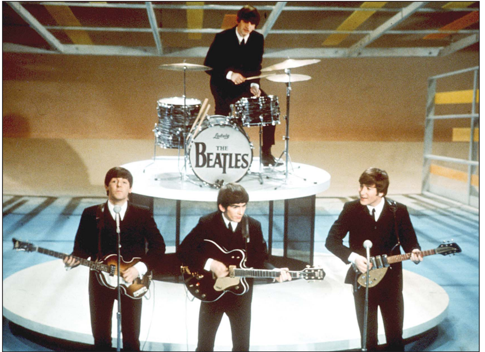
The Beatles, (foreground from left), Paul McCartney, George Harrison, John Lennon and Ringo Starr on drums perform on the CBS 'Ed Sullivan Show' in New York on Feb. 9, 1964. Sixty years after the onset of Beatlemania and with two of the quartet now dead, artificial intelligence has enabled the release of a 'new' Beatles song. 'Now And Then,' will be available Thursday, Nov. 2.