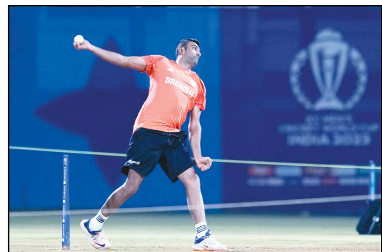
India's Ravichandran Ashwin bowls during a practice session ahead of their match against England at the ICC Men's Cricket World Cup, in Lucknow, India.

The off-spinner's return will mean a three-spinner attack and it will only make the task tougher for beleaguered England.