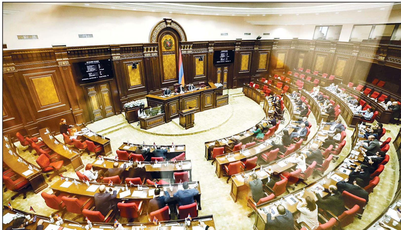
Armenian lawmakers attend the session of the National Assembly of the Republic of Armenia in Yerevan, Armenia on Oct 3. The Armenian parliament on Tuesday voted to join the International Criminal Court, which earlier this year indicted Russian President Vladimir Putin for war crimes connected to the deportation of children from Ukraine.

Bavaria's top security official, state Interior Minister Joachim Herrmann , said that the dead included a young child. The injured were taken to nearby hospitals.