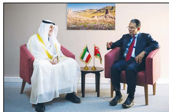
Kuwaiti Finance Minister Fahad Al-Jarallah meets with Secretary-General of the Omani Minister of Finance Nasser Al-Jashmi.