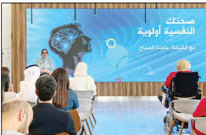
A photo from the session.