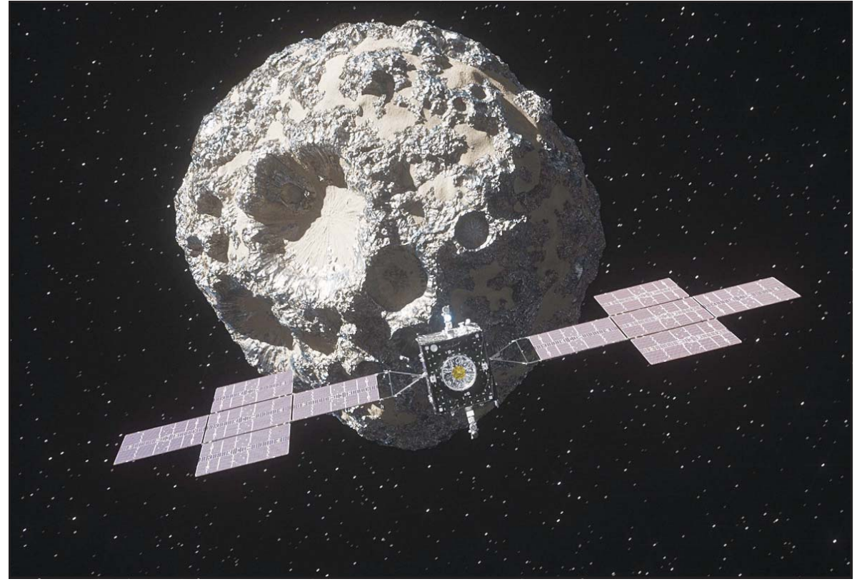
This image from a video animation provided by NASA in October 2023 depicts the spacecraft Psyche approaching the asteroid Psyche. A NASA spacecraft has rocketed away on a six-year journey to a rare asteroid made of metal.

Astronomers know from radar and other observations that the asteroid is big - about 144 miles (232 kilometers) across at its widest and 173 miles (280 kilometers) long. They believe it's brimming with iron, nickel and other metals, and quite possibly silicates, with a dull, predominantly gray surface likely covered