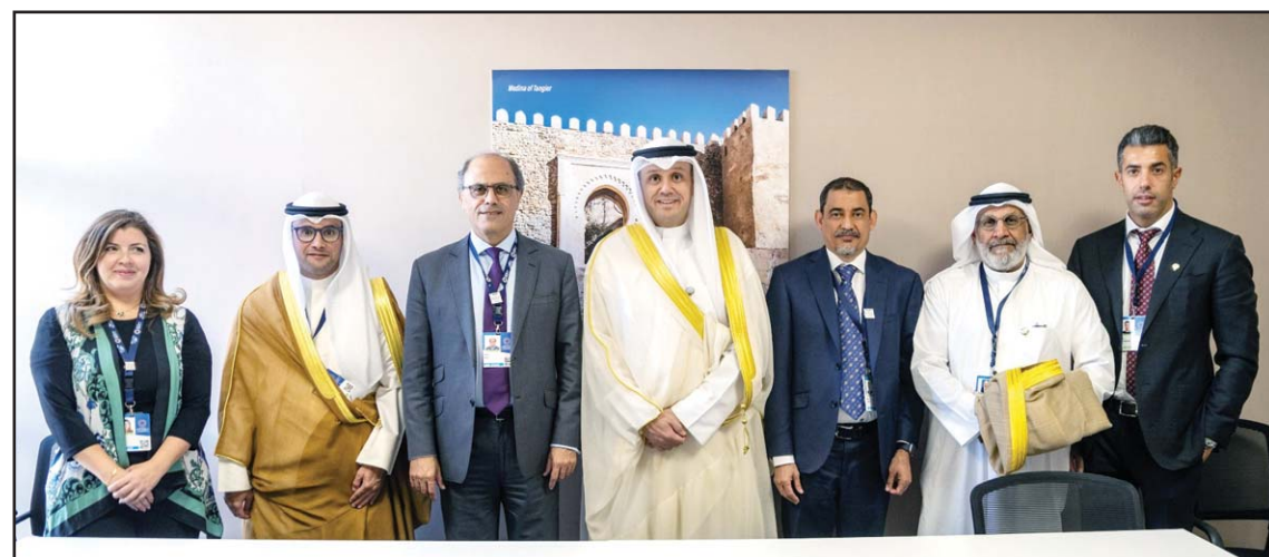
Kuwaiti Finance Minister Fahad Al-Jarallah meets with Director of the Middle East and Central Asia Department at the International Monetary Fund Jihad Azour.