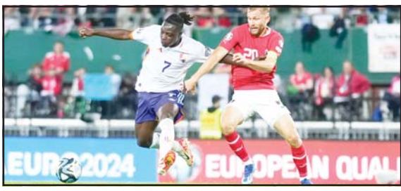
Belgium's Jeremy Doku (left), challenges for the ball with Austria's Konrad Laimer during the Euro 2024 group F qualifying soccer match between Austria and Belgium at the Ernst Happel stadium in Vienna, Austria.