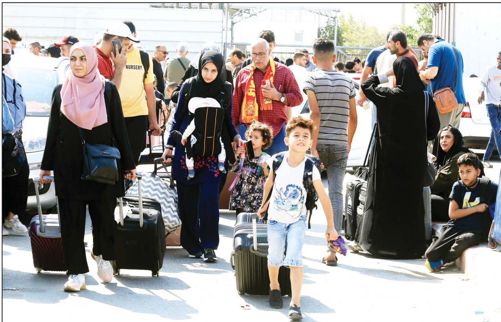
Palestinians wait at the Rafah border crossing between the Gaza Strip and Egypt on Saturday, Oct. 14, 2023. Israel carried out some limited ground operations ahead of an expected broader land offensive against Gaza's militant Hamas rulers following their attack into southern Israel a week ago.