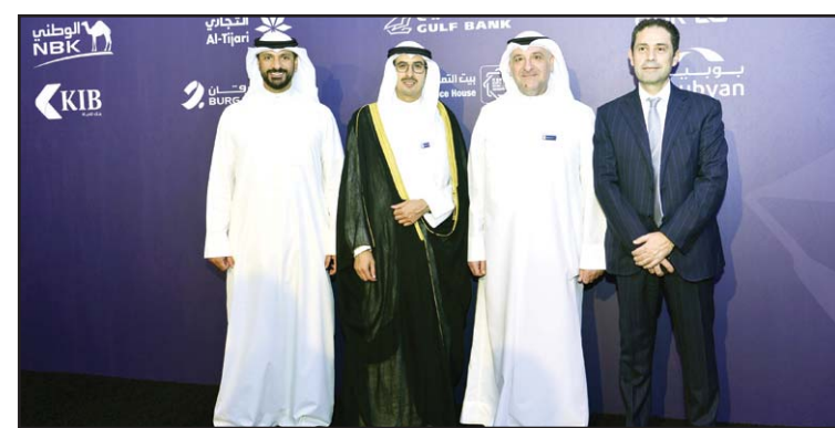
Group photo from the event.

Additionally, the International Monetary Fund meeting comprises several key committees, notably the Development Committee, the International Monetary and Financial Committee, the Group of Ten, the Group of Twenty-Four, and the Group of Thirty. The Monetary and Financial Committee's session is scheduled to focus on evaluating global economic performance, forecasting future trends, and examining developments in interna-