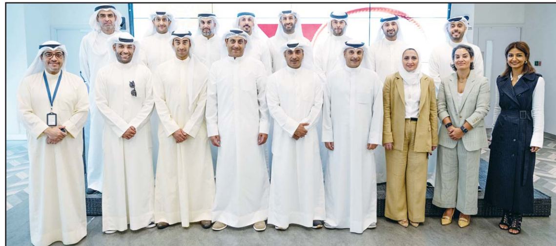
Photos during 'Financial Asset Managers Day' organized by Boursa Kuwait.

Organizing these initiatives forms part of Boursa Kuwait's efforts to positively impact the capital market apparatus as part of its Corporate Sustainability strategy. The exchange launched several initiatives with investment institutions from around the world to develop the Kuwaiti capital market and highlight the opportunities it offers to the international investment community. The bourse is steadfast in its dedication to develop a more sustainable, brighter future for the Kuwaiti capital market and its participants.