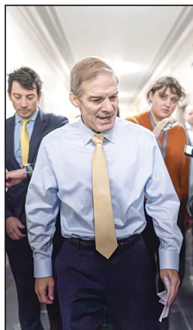
US Rep Jim Jordan, R-Ohio, chairman of the House Judiciary Committee and a staunch ally of former President Donald Trump, talks with reporters as House Republicans meet again behind closed doors to find a path to elect a new speaker after House Majority Leader Steve Scalise, R-La., dropped out of the race Thursday night, at the Capitol in Washington on Oct 13.