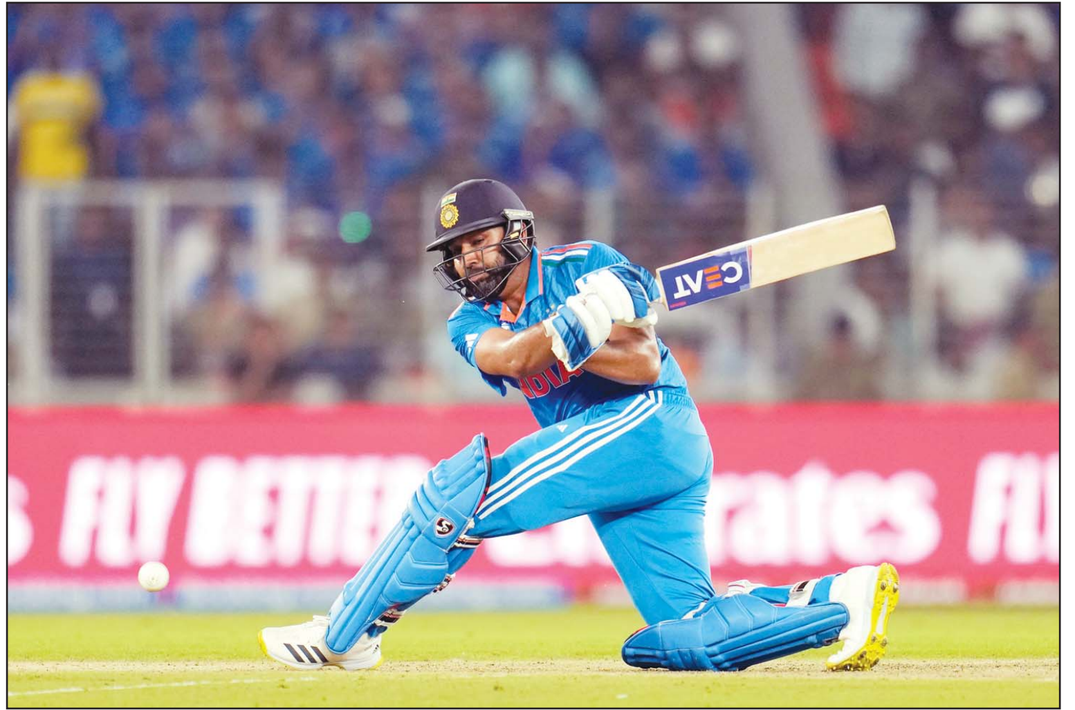
India's captain Rohit Sharma plays a shot during the ICC Men's Cricket World Cup match between India and Pakistan in Ahmedabad, India.

Hardik Pandya had Imam caught behind, which brought Azam and Mo-