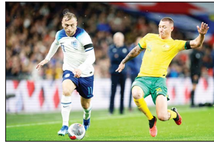
England's Jarrod Bowen (left), duels for the ball with Australia's Mitchell Duke during the international friendly soccer match between England and Australia at Wembley Stadium, London.

Watkins might have added another goal when he was fractions away from opening the scoring in the first half after taking the ball around Australia goalkeeper Mathew Ryan and hitting the post.