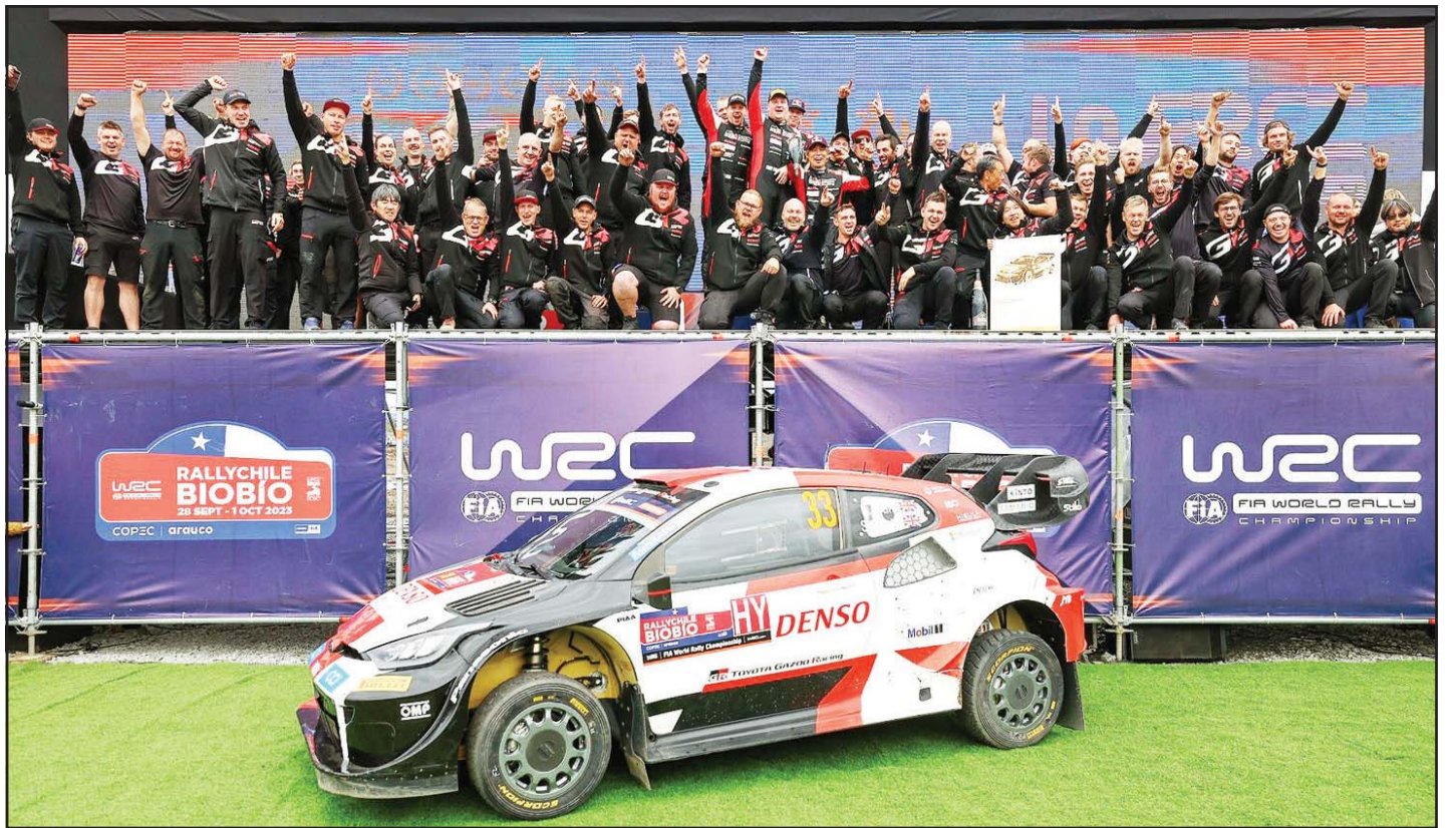
TOYOTA GAZOO Racing defended Toyota's FIA World Rally Manufacturers' Championship title after clinching a podium finish at Rally Chile.