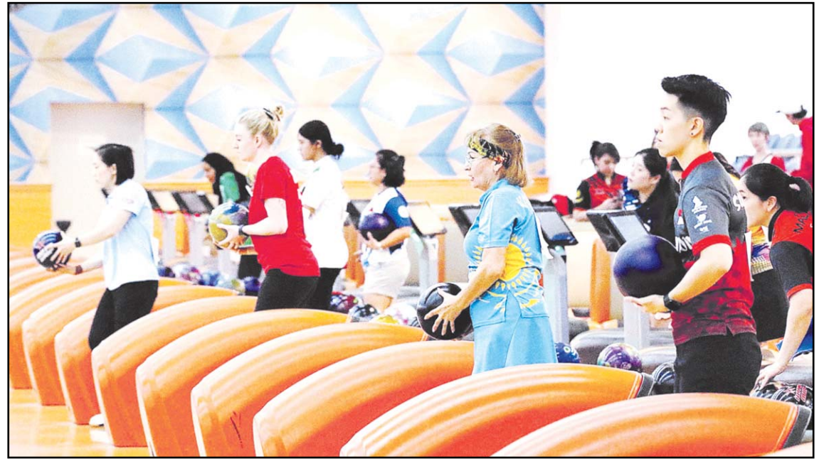
Bowlers take part in the competition.