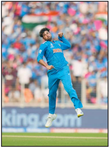
India's Kuldeep Yadav celebrates the wicket of Pakistan's Iftikhar Ahmed during the ICC Men's Cricket World Cup match between India and Pakistan in Ahmedabad, India.

Sharma scored 86 runs off 63 balls, including six fours and six sixes, as