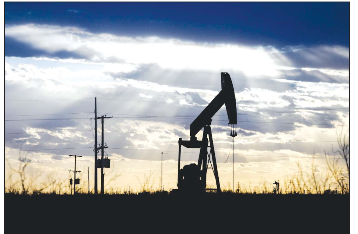
The sun shines through the clouds as it begins to set behind a pumpjack, March 30, 2022, outside of Goldsmith, Texas. United States domestic oil production has hit an all-time high, contrasting with efforts to slice heat-trapping carbon emissions by the Biden administration and world leaders.

The Biden administration has committed several hundred billions of dollars in government incentives for mov-