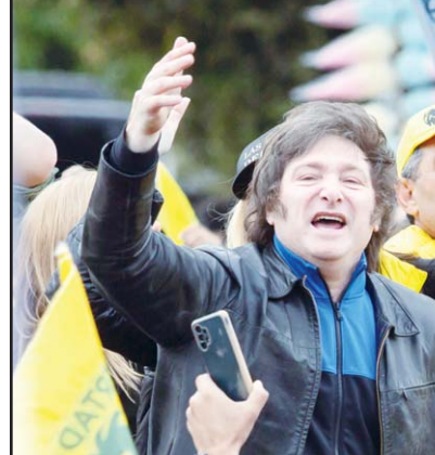
Presidential hopeful of the Liberty Advances coalition Javier Milei waves to supporters during a campaign rally in Salta, Argentina on Oct 12. Elections are set for Oct 22.

The police department blamed a "fight between groups" from different cell