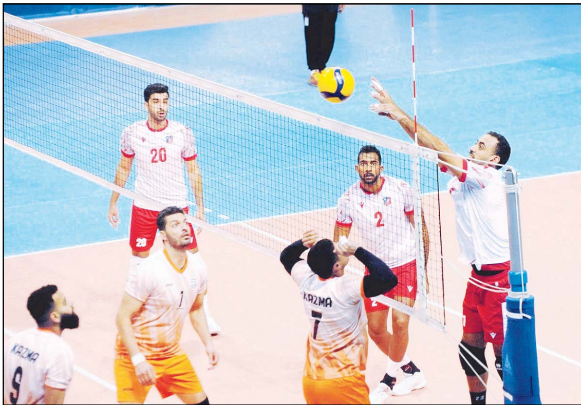
Al Kuwait player returns as Kazma players look on.

In the bigger scheme, it's only a last-eight game and whoever wins at Stade de France is still two massive matches from lifting the Rugby World Cup.