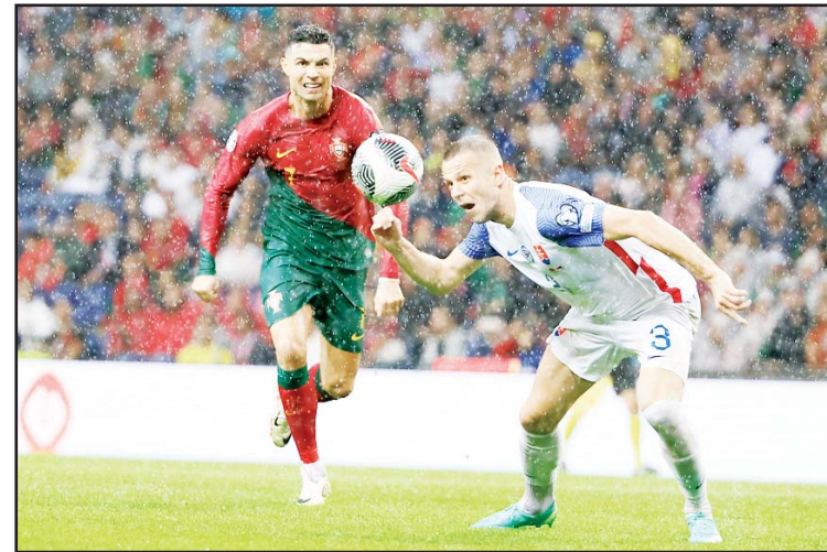
Slovakia's Denis Vavro heads the ball in front of Portugal's Cristiano Ronaldo during the Euro 2024 group J qualifying soccer match between Portugal and Slovakia at the Dragao stadium in Porto, Portugal.

After David Hancko pulled one back for Slovakia in the second half, Ronaldo restored a two-goal advantage off a low cross from Bruno Fer-