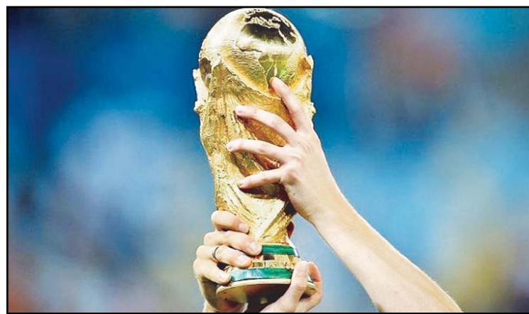
A file photo of the World Cup.

Saudi Arabia's commitment to the continued growth and progress of football. It reflects the nation's passion for the sport and its aspiration to host this remarkable event, aligning with the dynamic developments taking place in the Kingdom of Saudi Arabia."