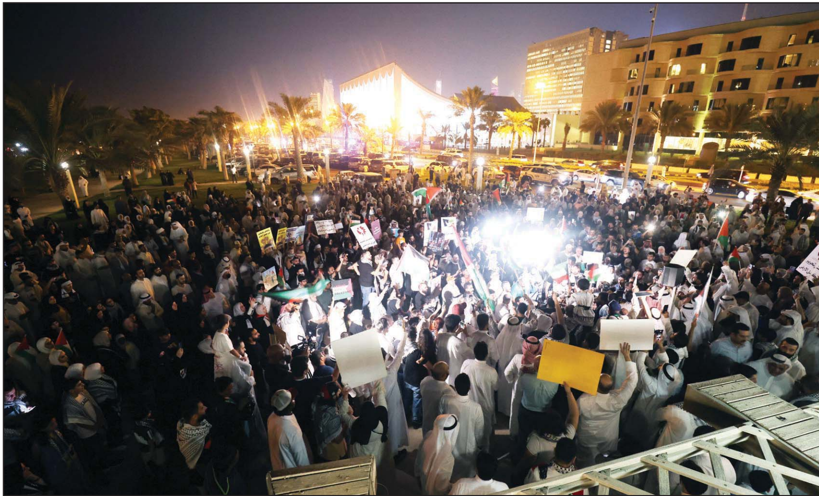
A demonstration in support of the Palestinians held at Al-Erada Square on Friday, October 13, 2023, witnessed the attendance of parliament members. Photo by Samer Shaker

Taliban footage from the mosque in the city of Pol-e-Khormri, the provincial capital of Baghlan, showed debris strewn over a red-carpeted floor, scattered personal items and bodies covered with shrouds. (AP)