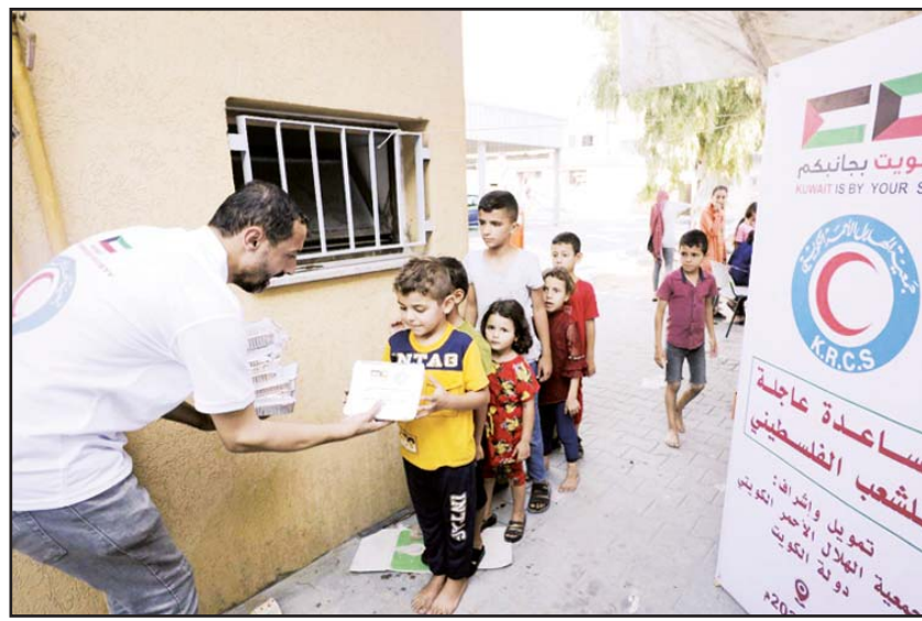
A KRCS volunteer distributes food parcels to children in the Gaza Strip.