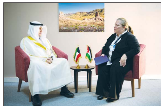
Kuwaiti Finance Minister Fahad Al-Jarallah meets with Jordanian Minister of Planning and International Cooperation Zeina Toukan.

Gulf Bank is committed to maintaining robust developments in sustainability at environmental, social and governance levels through diverse sustainability initiatives, strategically selected to benefit the Bank both internally and externally. Gulf Bank supports Kuwait Vision 2035 "New Kuwait" and works with various parties to achieve it.