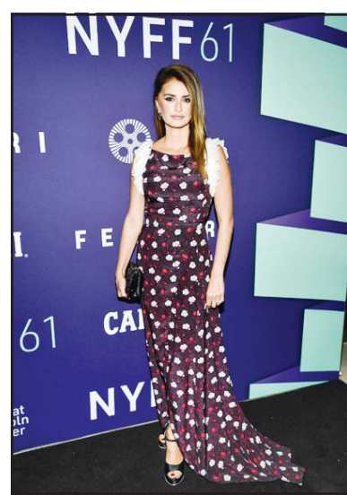
Penelope Cruz attends the 'Ferrari' premiere during the 61st New York Film Festival at Alice Tully Hall on Friday, Oct. 13, 2023, in New York.

"I've always had this sort of magical-thinking way of detesting my previous books as a way of pushing myself forward," she told the Washington Square Review in 2015. "And I realized that I had this feeling of sneaking-up pride in accomplishment. Sometimes I would just stack my books together and think, 'Wow, you haven't wasted all your time.' But then I was very afraid because it was a completely new sensation, that pride, and I thought, 'Oh, this means really bad things.'"