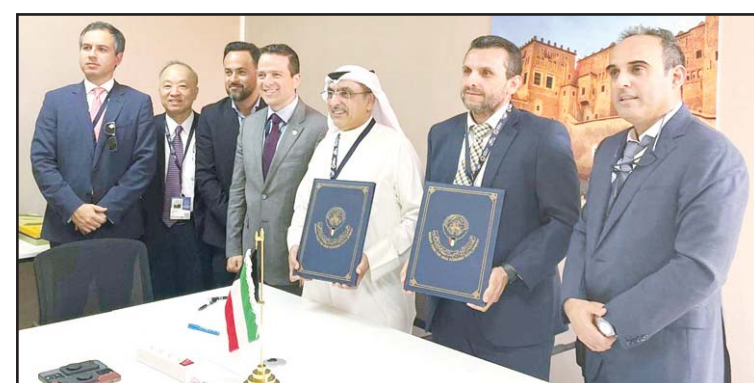
Photo during the Kuwait Fund and Central American Bank signing of MoU.

It is mainly aimed at bilateral coordination for response to humanitarian crises and natural disasters and as well as the exchange of information and technical expertise, it added in a press release.