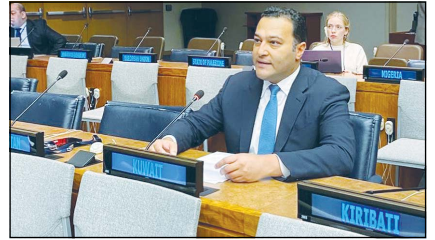
Minister Plenipotentiary and UN's Deputy Permanent Representative Faisal Al-Enezi.

It is noteworthy to make a mention that Al-Shoula had recently issued a decision to organize and determine the mechanism for disbursing housing allowance and updating the data of the municipality employees.