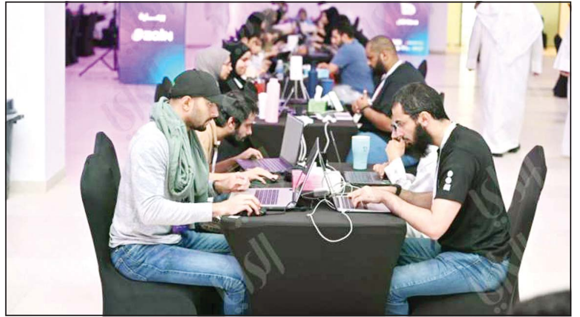
View of contestants in the 'Kuwait Hackathon'.