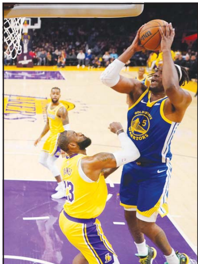
Golden State Warriors forward Kevon Looney (right), shoots as Los Angeles Lakers forward LeBron James defends during the first half of an NBA preseason basketball game in Los Angeles.

go-ahead basket on a tip-in with 32 seconds left, then blocked a shot by his former Indiana Hoosiers teammate Jalen Hood-Schifino at the other end to rally visiting Golden State over Los Angeles.