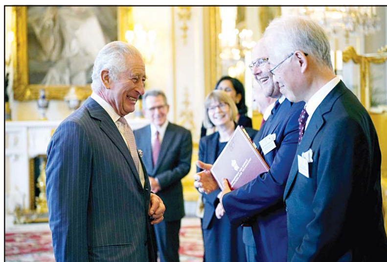
Britain's King Charles III talks to guests during a reception the 2022 and 2023 Queen Elizabeth Prize for Engineering during a reception at Buckingham Palace in London, on Oct 12.

Emails sent to van der Sloot's attorney and a spokeswoman for federal prosecutors were not immediately returned Friday