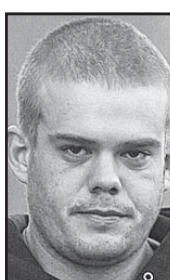
Van der Sloot