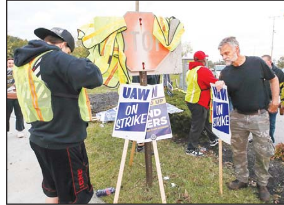
Workers hang their safety vests on a shipping and receiving sign as they change shifts on the picket line. UAW local 862 members strike outside of Ford's Kentucky Truck Plant in Louisville, Ky. on Thursday, Oct. 12, 2023.

ting raises for a decade and giving up what he called retirement security. His statements came four weeks after the union began its walkouts against the Detroit automakers on Sept. 15. The strikes started with one assembly plant from each company. The union later added 38 parts warehouses at GM and Stellantis, and then one assembly factory each from Ford and GM. The UAW then made a surprise move on Wednesday, escalating the strikes by adding a huge Ford pickup truck and SUV plant in Kentucky.