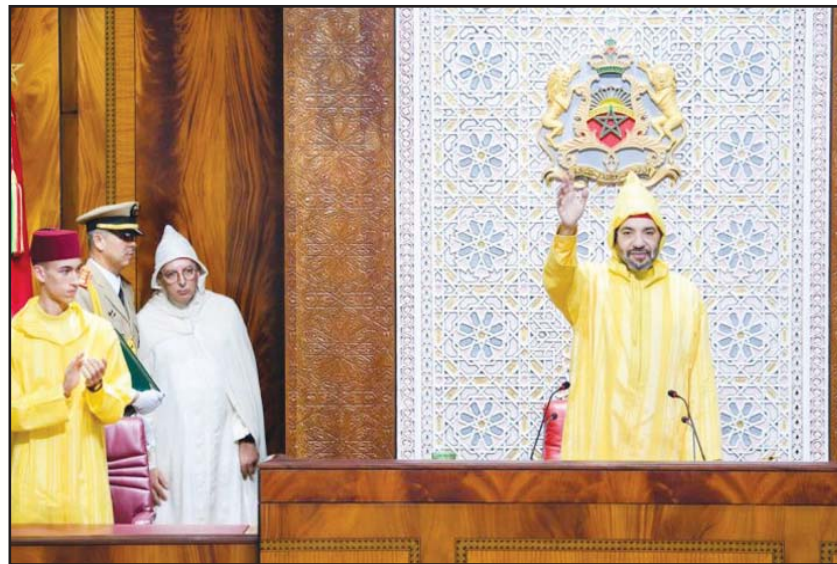
King Mohammed VI declares the opening of the third legislative term.

Our will is to build and rebuild: King Mohammed VI