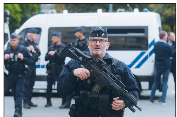
A riot police officer stands guard after a man armed with a knife killed a teacher and wounded two others at a high school in northern France, Friday, Oct. 13, 2023 in Arras.

The suspect in this week's attack had been under surveillance since the summer on suspicion of Islamic radicalization, French intelligence services told AP. He was detained Thursday for questioning based on the monitoring of his phone calls in recent days, but investigators found no sign that he was preparing an attack, Interior Minister Gerald Darmanin said.