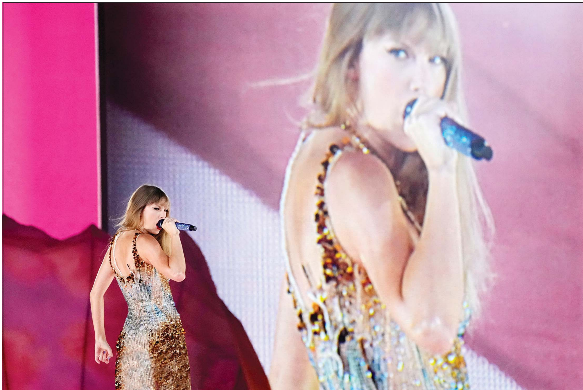
Taylor Swift performs during 'The Eras Tour' in Los Angeles on Aug. 7, 2023. Swift is releasing her 'Taylor Swift: The Eras Tour' concert film on Oct. 13.