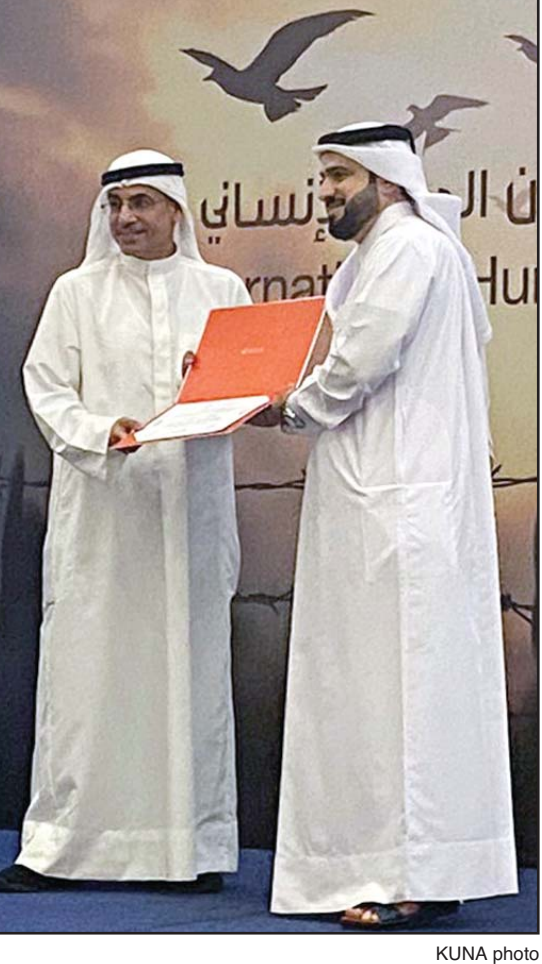
Head of the public relations and media department at KRCS

He further commented saying that in this day and age media and diplomacy became closely intertwined, as the instrument of media is quite influential on public opinion.