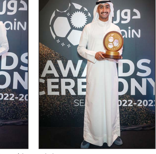
Some of the award winners.

This partnership with Kuwait's top football competition comes to strengthen the leadership role Zain plays in the local sports scene and is perfectly in line with the company's sustainability and social responsibility strategy towards the sports and youth sectors.