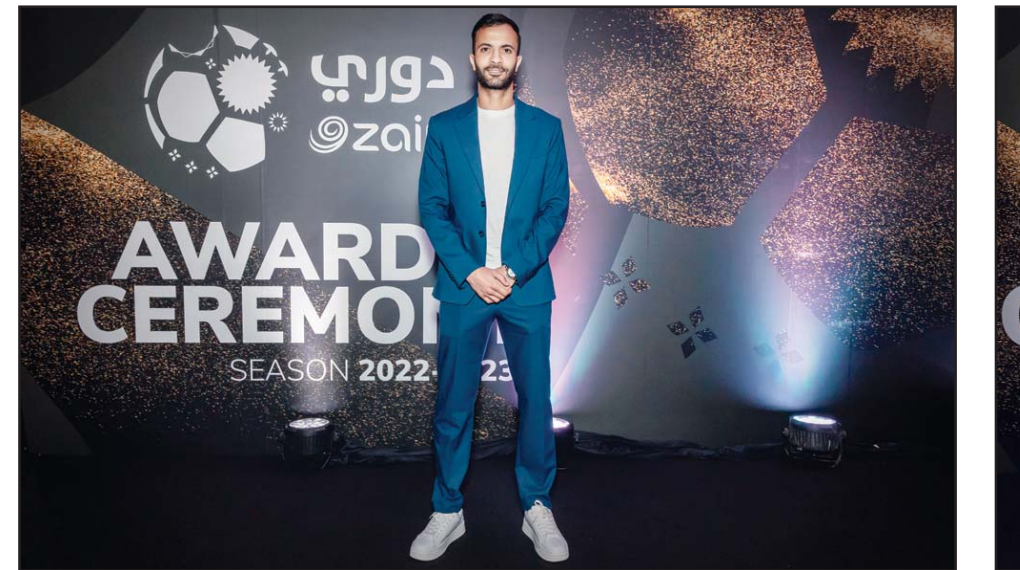
League in Kuwaiti football's history. These contributions and more went in line with the KFA's vision to further enrich the local football scene, given that it is the most beloved sports among Kuwaitis. Zain firmly believe that the private

Zain firmly believe that the private sector has a vital and active role in developing the local sports and youth sectors, and it makes this belief a real-