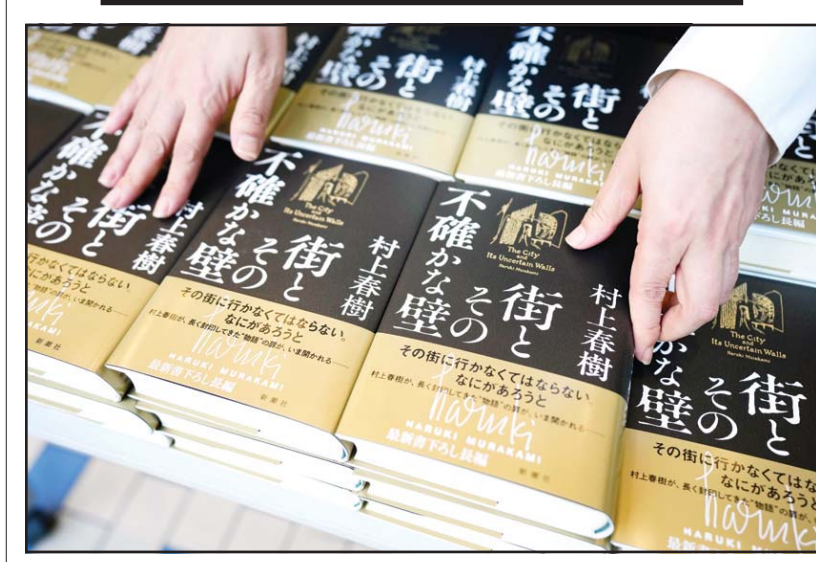
A shop clerk arranges a Japanese writer Haruki Murakami's new novel 'The City and Its Uncertain Walls' on the first day for sale at Kinokuniya bookstore in Tokyo, on April 13, 2023. In a speech released June 7, Murakami says walls are increasingly built and dividing people and countries as fear and skepticism flourish following Russia's invasion of Ukraine and the COVID-19 pandemic. (AP) — Details Page 11

are shedding new light on the financier's time behind bars and a frantic response by federal corrections officials to his death.