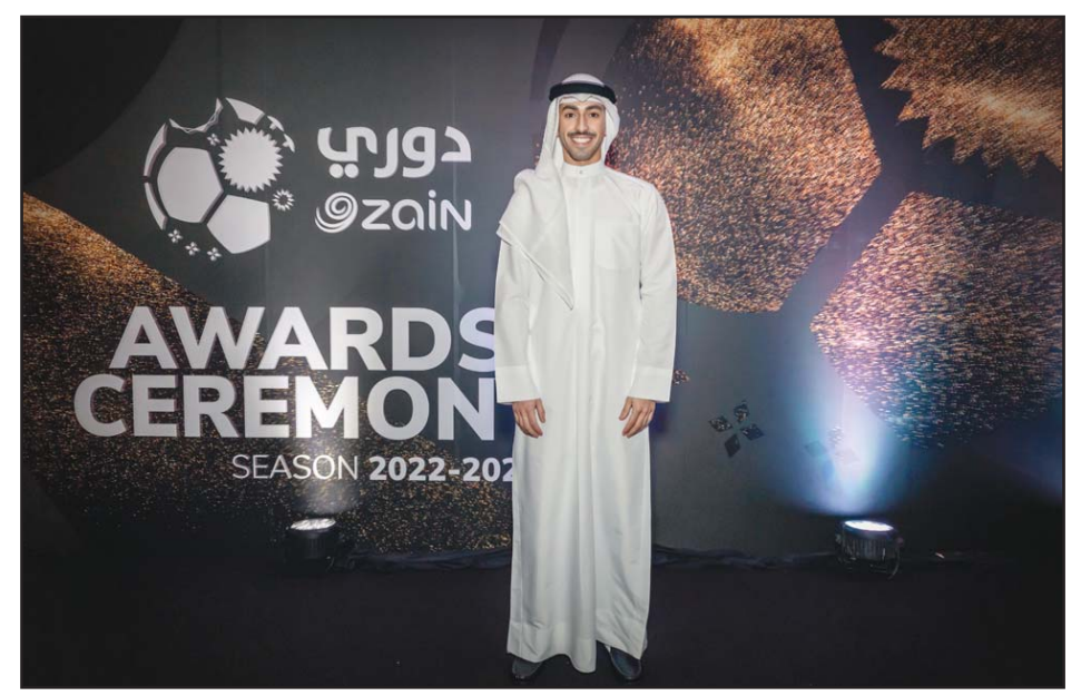
An attendee poses for a photo.