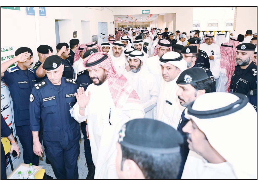
Kuwaitis search for their names to cast their votes in National Assembly elections on June 6, 2023.

First Deputy Prime Minister, Minister of Interior, and Acting Defense Minister Sheikh Talal Khaled Al-Ahmad Al-Sabah arrives for an inspection tour of polling stations involved in the 2023 National Assembly elections on Tuesday, June 6, 2023.