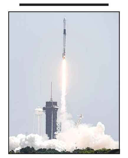
A SpaceX Falcon 9 rocket lifts off from Kennedy Space Center in Florida, on Monday, June 5. The rocket, carrying supplies for the International Space Station, is scheduled to dock with the station Tuesday.