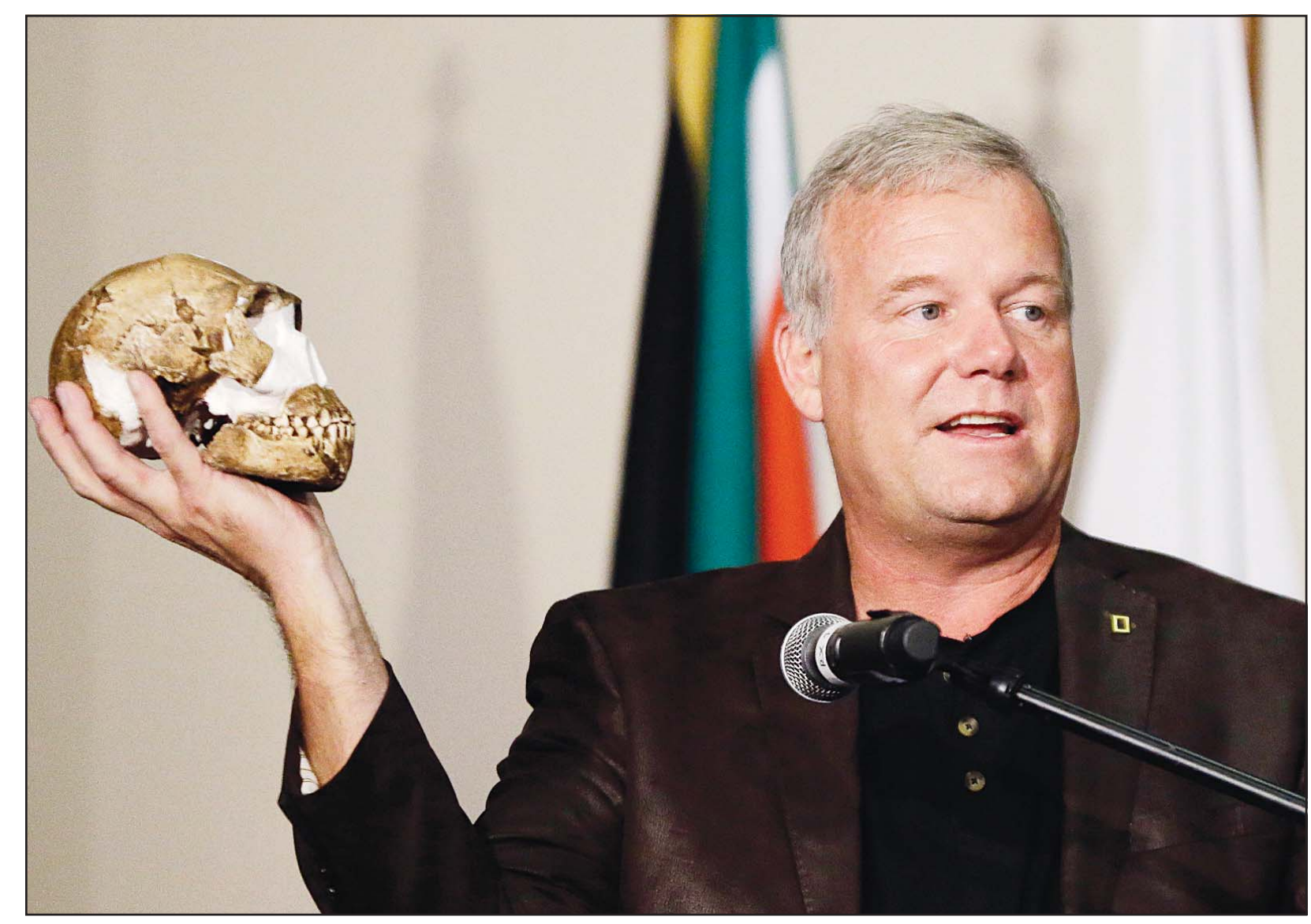
Researcher Lee Berger holds a reconstruction of the skull of Homo naledi at Magaliesburg, South Africa, Thursday, Sept. 10, 2015. In research released on Monday, June 5, scientists say they've found evidence that the ancient human cousin buried its dead and carved symbols into cave walls, actions previously tied only to bigger-brained species.