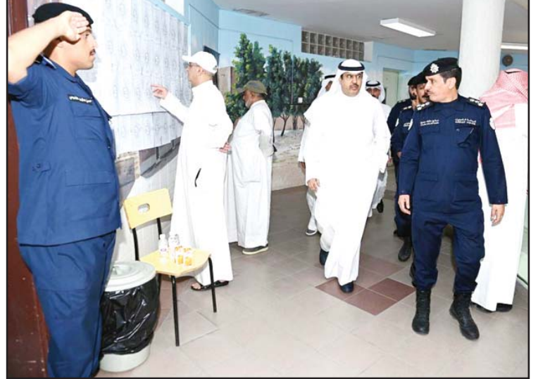
Hawalli Governor and during an inspection tour.