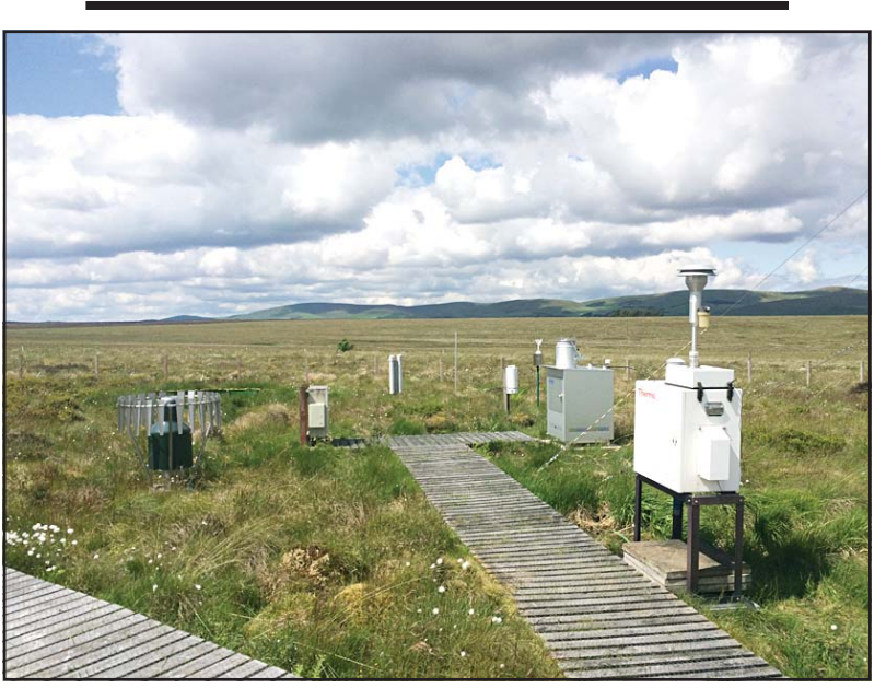
This photo provided by the National Physical Laboratory in June 2023 shows air sampling filters stationed at the Auchencorth Moss research facility in Scotland. In a study published Monday, May 5, 2023, in the journal Current Biology, researchers found that air quality monitoring stations - which pull in air to test for pollution - also pick up lots of DNA that can identify local wildlife. The method could help solve the tricky challenge of keeping tabs on biodiversity.

project, a decision the company is challenging in court. Then the administration moved in January to ban new mining projects upstream from the Boundary Waters in the Ely area for 20 years.