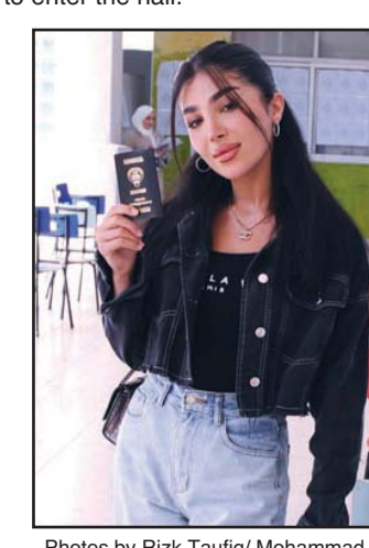
Women turned out to vote in large numbers.