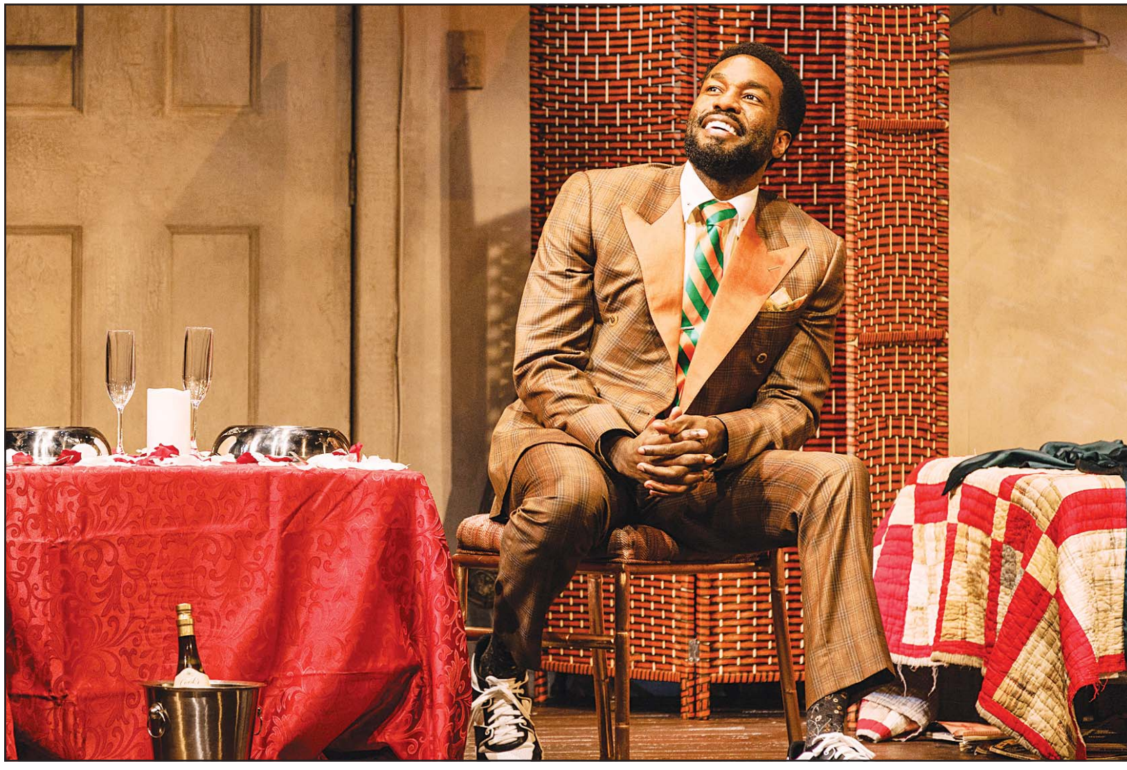
This image released by Polk & Co. shows Yahya Abdul-Mateen II during a performance of the play 'Topdog/Underdog.'