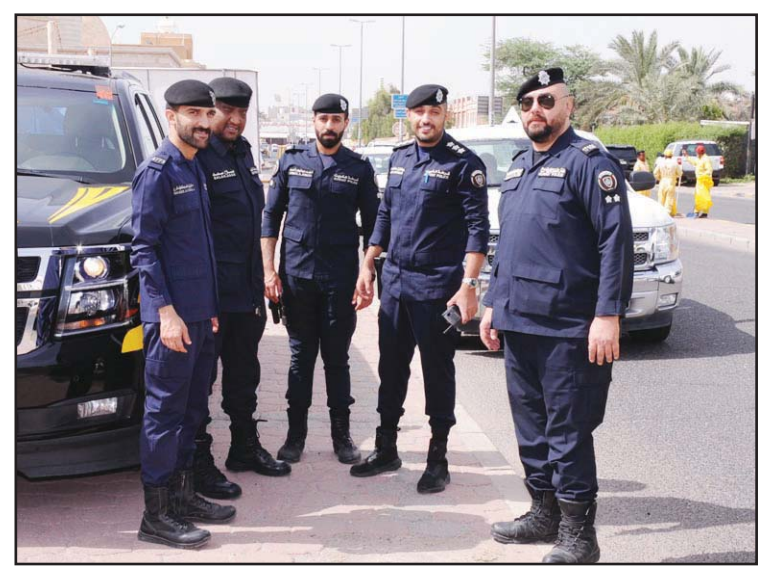
Securitymen stationed at one of the polling stations

BIOMETRIC/FINGERPRINT APPOINTMENT: https://meta.e.gov.kw/En/