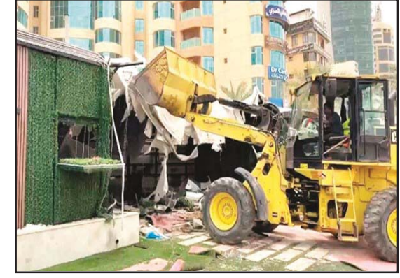
Encroachments on state property being removed

He stated that the committee also approved the request of PART to allocate open collection basins, open water channels, underground water connections, earth