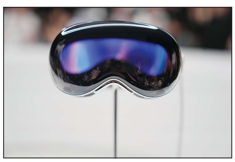
The Apple Vision Pro headset is displayed in a showroom on the Apple campus on June 5, in Cupertino, Calif.

Even so, analysts are not expecting the Vision Pro to be a big hit right away. That's largely because of the