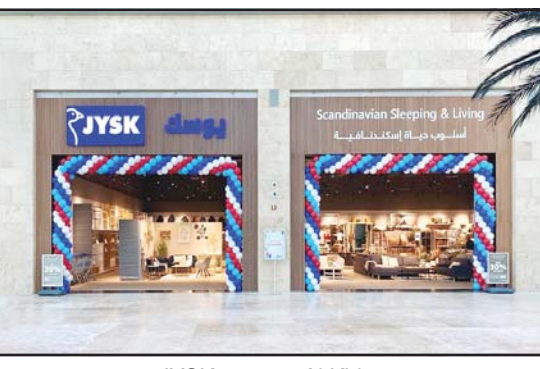
JYSK store at Al Khiran

The JYSK Al Khiran branch is open from 10:00 a.m. to 10:00 p.m. on Sundays through Wednesdays and from 10:00 a.m. to 11:00 p.m. on Thursdays through Saturdays.