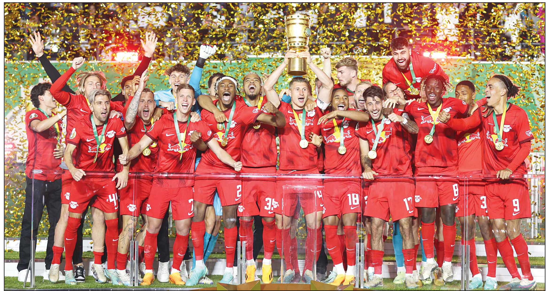
RB Leipzig players celebrate after winning the trophy in the German soccer cup, DFB Pokal, final match between RB Leipzig and Eintracht Frankfurt at Olympiastadion in Berlin, Germany.

Stuttgart take 3-goal lead into 2nd leg of Bundesliga playoff at Hamburg