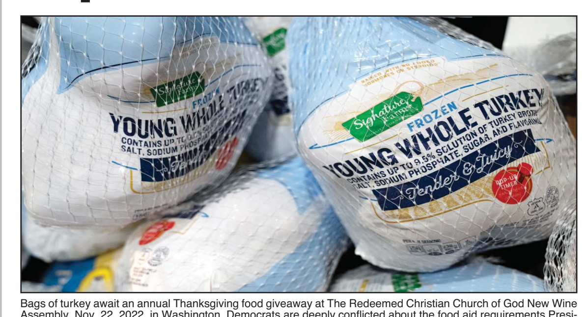
Assembly, Nov. 22, 2022, in Washington. Democrats are deeply conflicted about the food aid requirements President Joe Biden negotiated as part of the debt-ceiling deal.