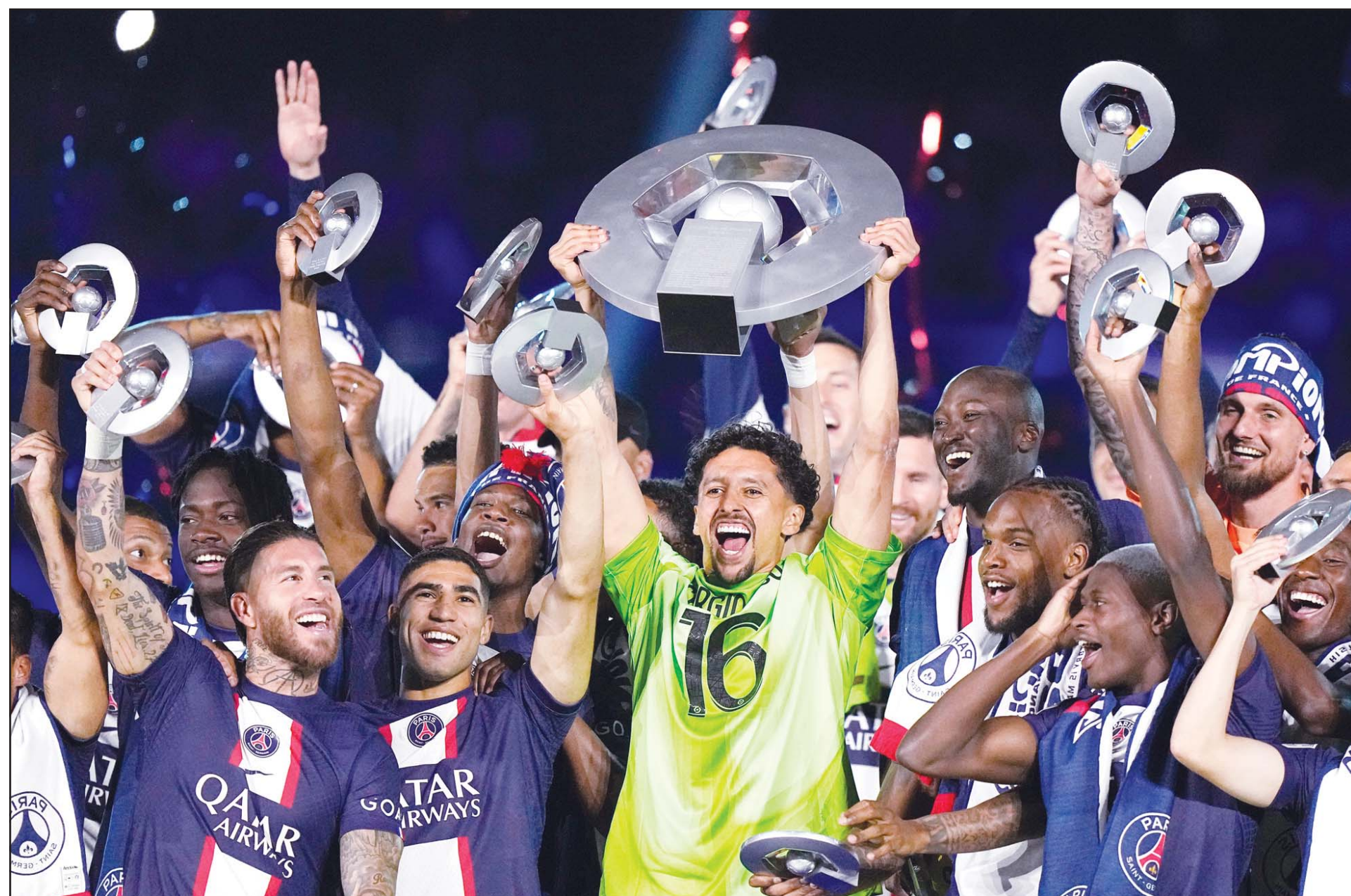
PSG players celebrate their title after the French League One soccer match between Paris Saint-Germain and Clermont at the Parc des Princes in Paris, France.