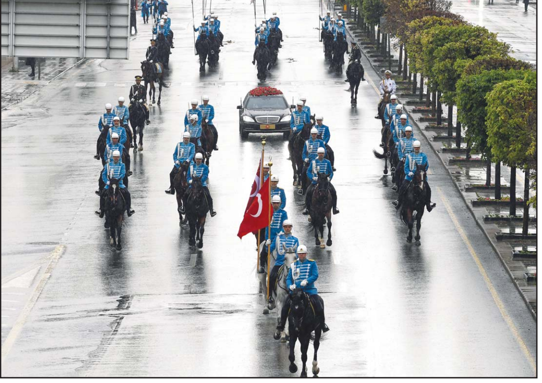
Turkish President Recep Tayyip Erdogan, with a mounted ceremony on the way to the presidential complex following his visit to the Anitkabir, the mausoleum of Mustafa Kemal Ataturk, in Ankara, Turkey, Sat-

Libya is the dominant transit point for migrants from Africa and the Middle East trying to make it to Europe. The country plunged into chaos following a NATO-backed uprising that toppled and killed longtime autocrat Muammar Gaddafi in 2011. Oil-rich Libya has been ruled for most of the past decade by rival governments in eastern and western Libya, each backed by an array of militias and foreign