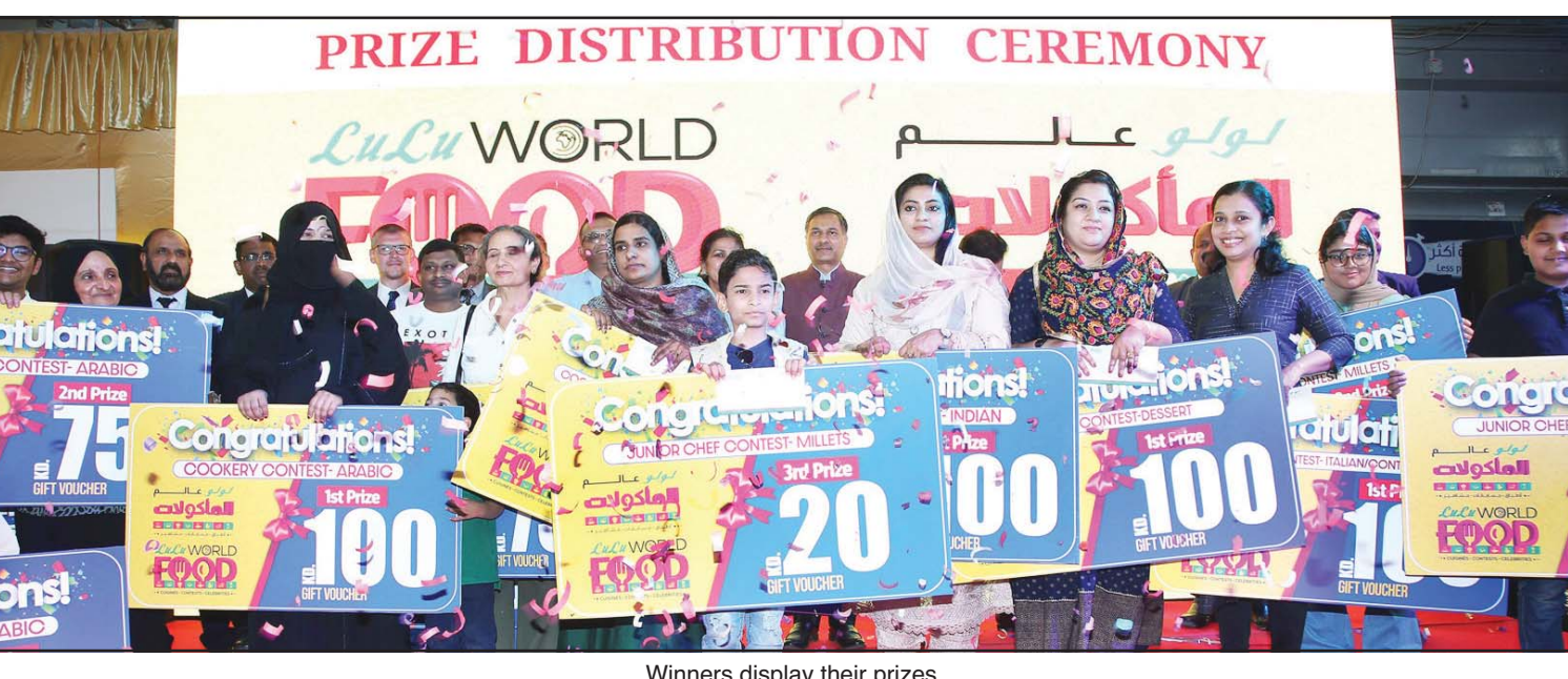
Winners display their prizes.

our services.' Regarding financial inclusion, a key - our initiatives have been holistic and