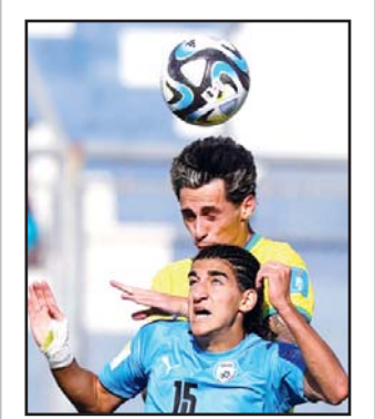
Israel's Tay Abed (front), and Brazil's Marlon Gomes battle for the ball during a FIFA U-20 World Cup quarterfinal soccer match at the Bicentenario stadium in San Juan, Argentina.

It took a stroke of fortune for Nkunku to score in the 71st minute as the French forward's shot from the edge of the penalty area bounced off two different Frankfurt