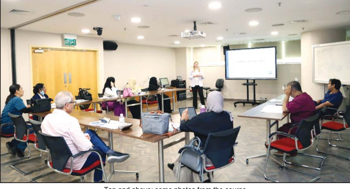
Top and above: some photos from the course