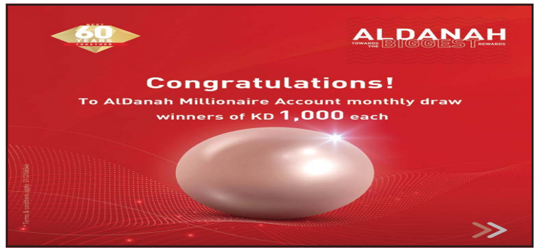
Al Danah - winner announcement