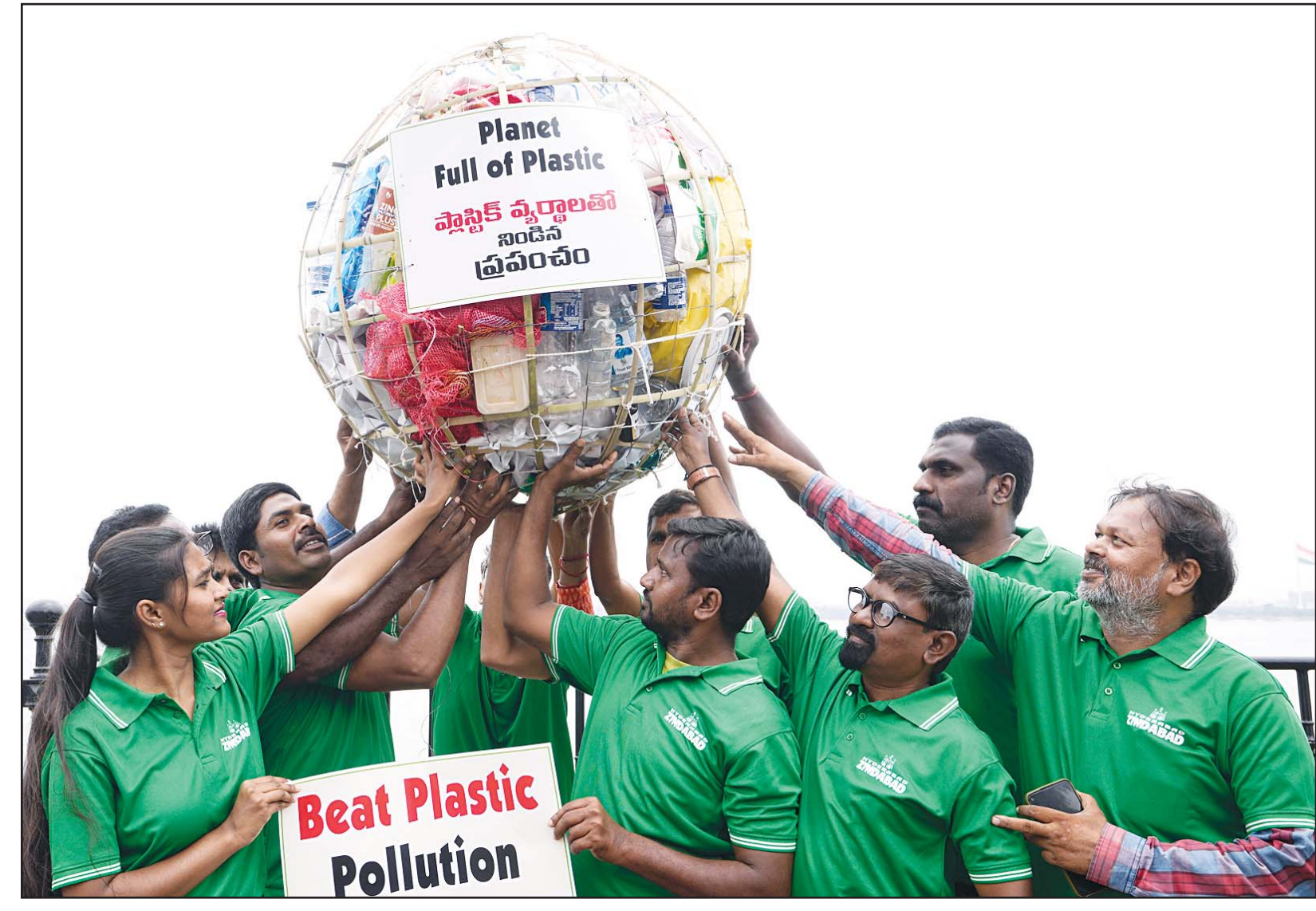
Members of a non-governmental organization display a model of a globe filled with plastic during a demonstration to create awareness on plastic pollution on the eve of World Environment Day in Hyderabad, India, Sunday, June 4.

That would mean goatherders would be entitled to ever higher pay - up to $14,000 a month. Last year a budget trailer bill delayed that pay requirement for one year, but it's set to take affect on Jan. 1 if nothing is done to change the law.