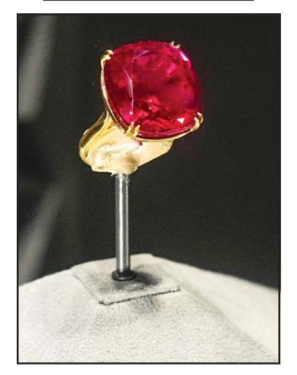
The Estrela de FURA ruby ring is displayed at Sotheby's, Thursday, June 1, in New York. At 55.22 carats, Estrela de FURA will highlight Sotheby's Magnificent Jewels auction in June of 2023.