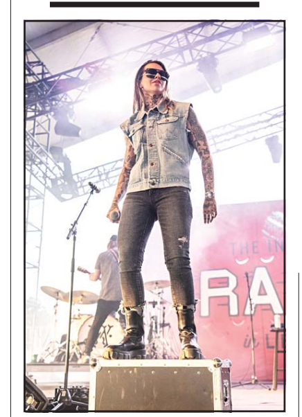
Morgan Wade performs at Railbird Music Festival, June 3, at The Infield at Red Mile in Lexington, Ky.