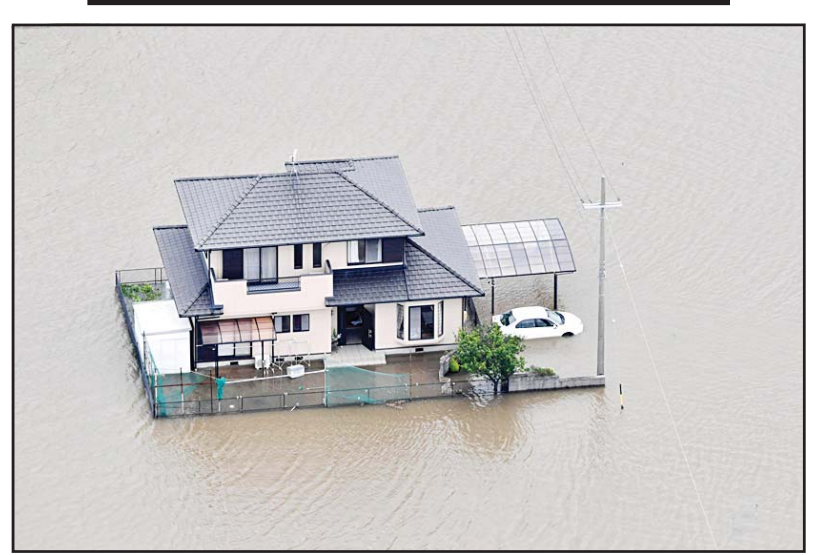
This aerial photo shows a house flooded due to heavy rain in Toyokawa, Aichi prefecture, central Japan Saturday, June 3. Heavy rains intensified by Tropical Storm Mawar fell on Japan's main archipelago Friday, halting trains and triggering floods and mudslides in central and western regions where residents were urged to use caution or evacuate.