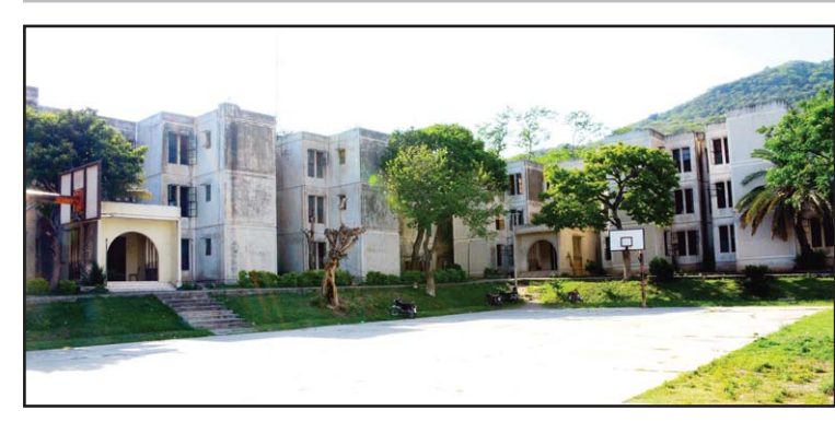
Residential blocks for Kuwait students in the Hostel in Islamabad.

She added that proposals had been discussed, referring to communication with the concerned bodies in the area in this matter. (KUNA)