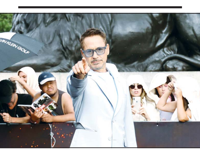
Robert Downey Jr. poses for photographers at the photo call for the film 'Oppenheimer' on Wednesday, July 12, in London. (AP)

suspended a male star over the allegations. He last appeared on air a week ago in Edinburgh for a special broadcast on Scottish celebrations of the coronation of King Charles III . (AP)