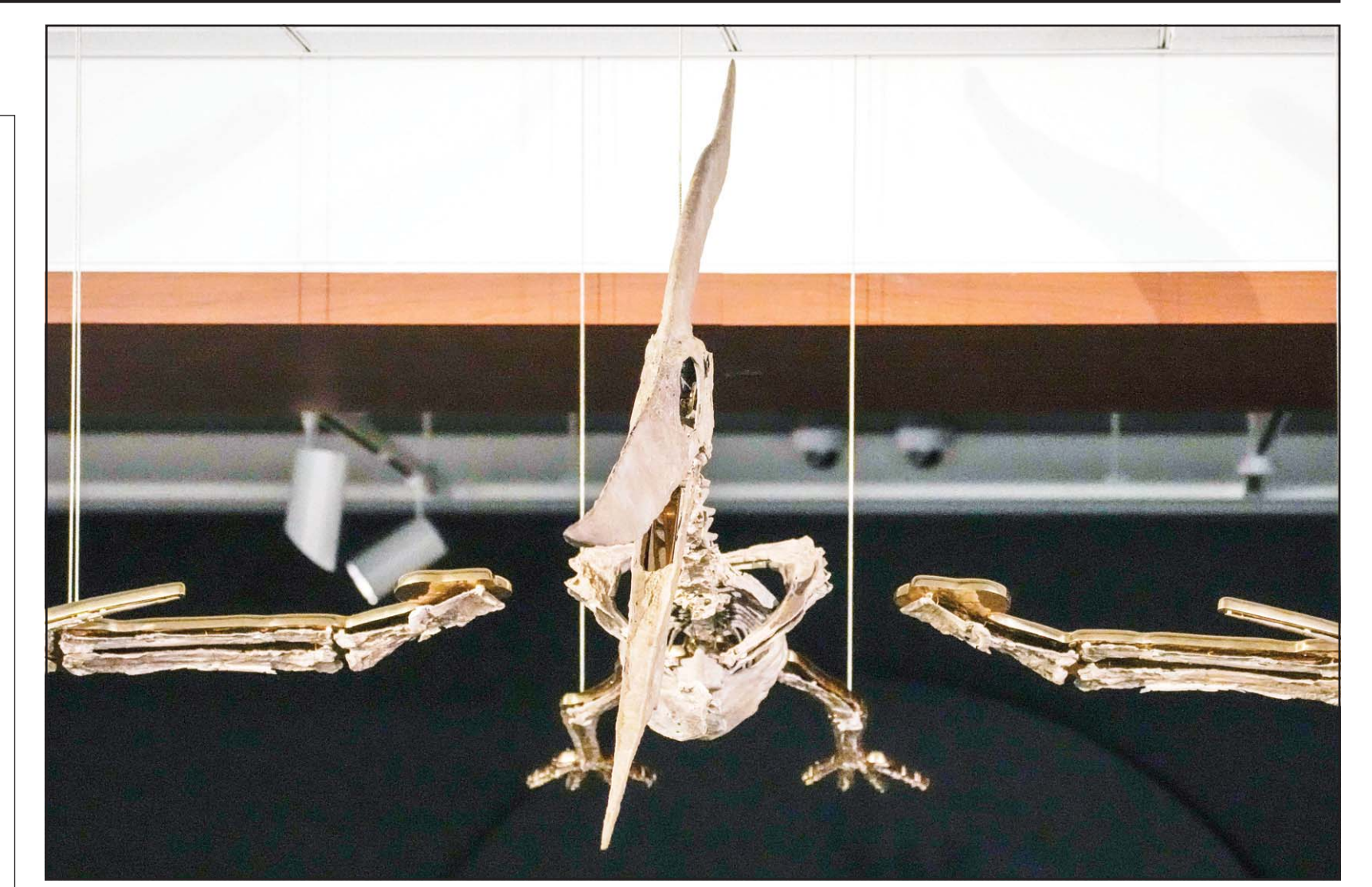
A Pteranodon skeleton is displayed at Sotheby's during a media preview, Monday, July 10, 2023, in New York. The prehistoric predator will headline Sotheby's Live Natural History Auction, Wednesday, July 26th.

The US and UN have not said who was involved in the theft, which was first discovered in March in the northern Tigray region when tons of food meant for needy people were instead found for sale in sacks branded with the US