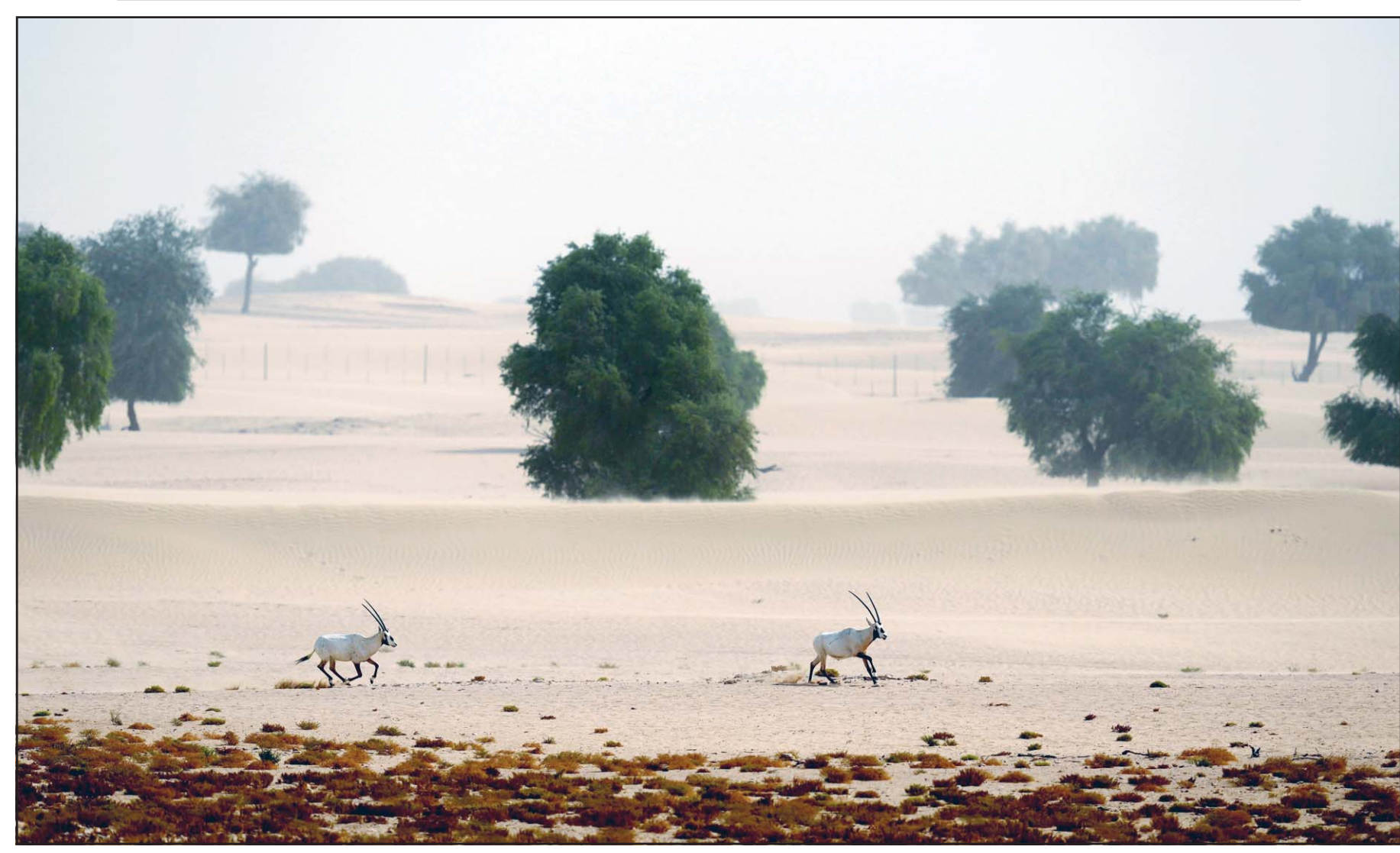
Arabian Oryx run during a dusty hot day at a conservation area in Dubai, United Arab Emirates, last week.

The resolution reiterates the EU's strong support for the International Criminal Court's (ICC) work and its impartiality and neutrality.