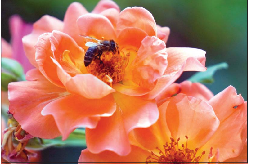
A bee searches for pollen on a flower during a sunny day in Belgrade, Serbia, Thursday, July 13. Hot weather has set in with temperatures rising up to 38 Celsius (100,4 Fahrenheit) in Belgrade.

nounced that it will return 478 objects of cultural significance to Indonesia and to Sri Lanka. It said the objects were wrongfully brought to the Netherlands during the colonial period, acquired under duress or by Under the plan, Sri Lanka is to receive