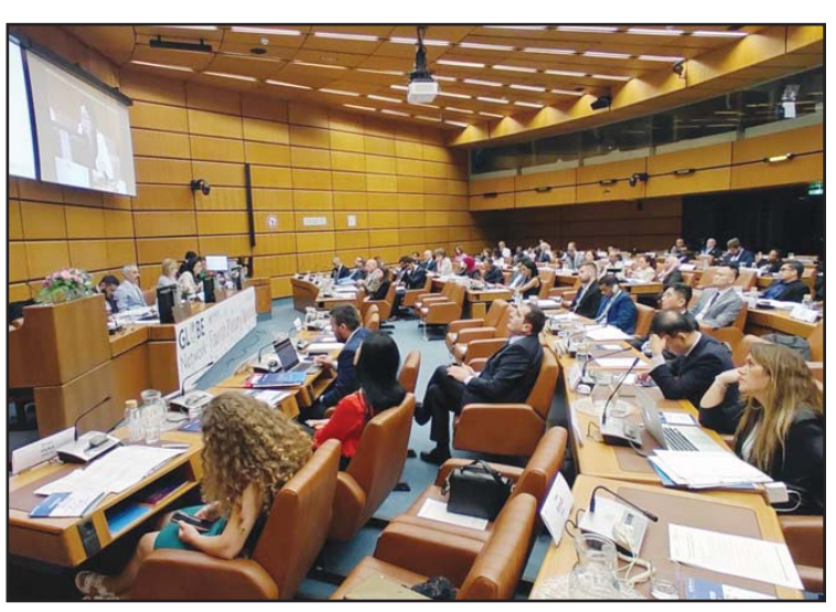
4th meeting of the (GlobE Network) in Vienna