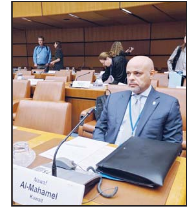
d of Kuwait delegation to (GlobE Network) meeting.

The statement also said that the Nazaha delegation participated in many discussions and technical sessions aimed at enhancing methods and techniques for exchanging