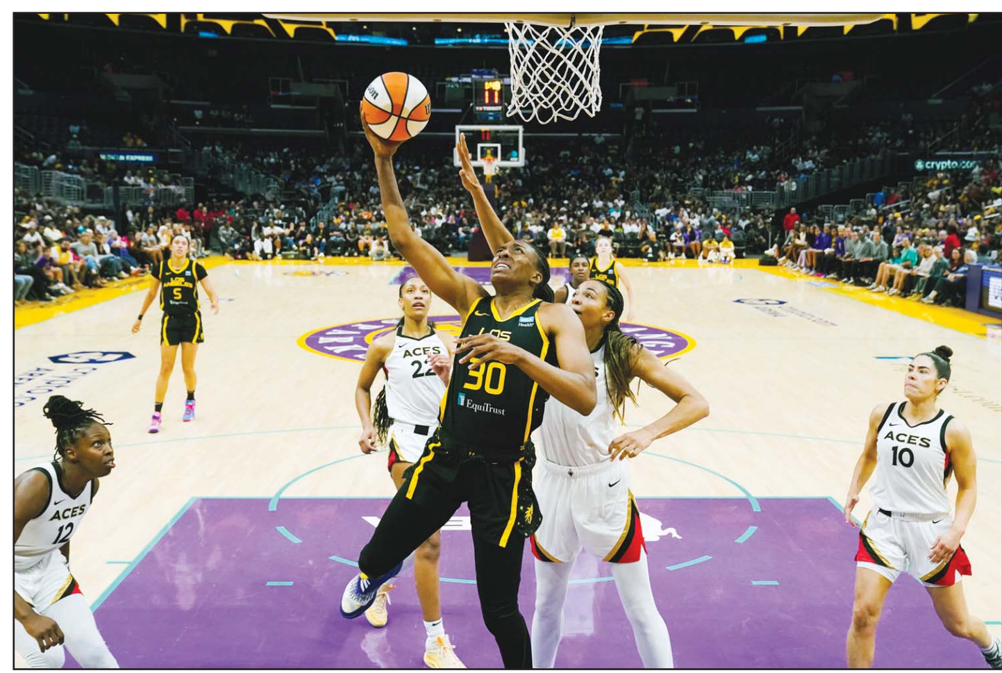
Los Angeles Sparks forward Nneka Ogwumike (30) lays the ball up against the Las Vegas Aces during the first half of a WNBA basketball game in Los Angeles.