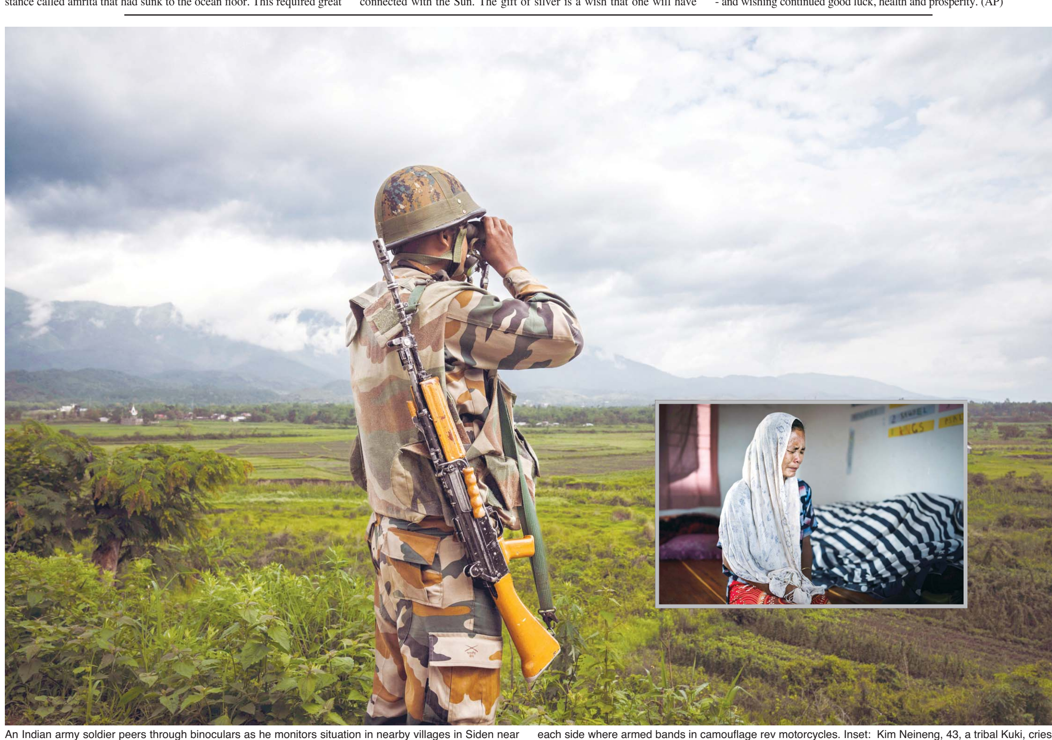
An Indian army soldier peers through binoculars as he monitors situation in nearby villages in Siden near Churachandpur, in the northeastern Indian state of Manipur, Tuesday, June 20, 2023. Two months since an ethnic conflict began, despite the army's presence, hundreds of roadblocks and sandbag bunkers dot highways across the torn Manipur lands. Most of these imaginary borders are controlled by the warring communities. Those left unattended have been taken over by Indian forces who peep from binoculars into

The ceremony is typically performed for someone who is between the ages of 81 and 84, though Modi gave the 10 gifts to Biden on the occasion of his reaching the age of 80. Giving these gifts amounts to congratulating the recipient for having lived a long life - itself a sign of virtue and wisdom - and wishing continued good luck, health and prosperity. (AP)