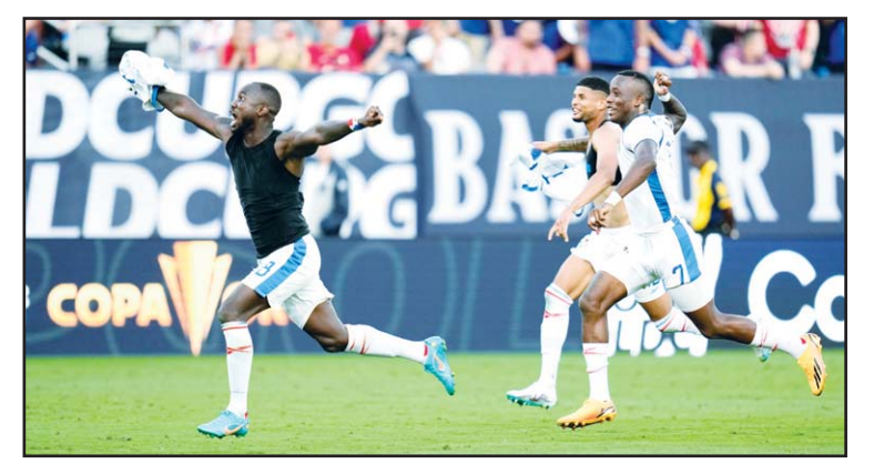
Players celebrate after defeating the United States in a CONCACAF Gold Cup semifinal soccer match in San Diego.