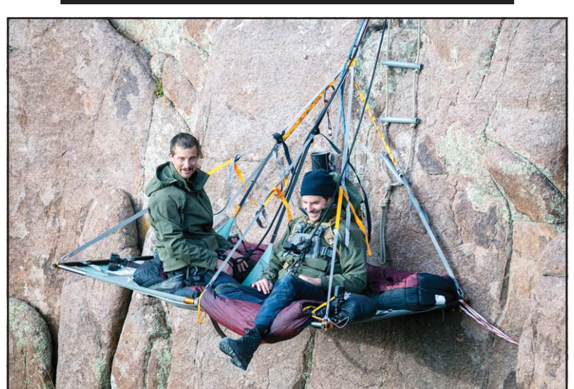
This image released by Nat Geo shows Bradley Cooper, (right), and Bear Grylls on a paraledge hung off the edge of Pathfinder Canyon in Wyoming, in a scene from 'Running Wild with Bear Grylls: The Challenge,' premiered on July 9.