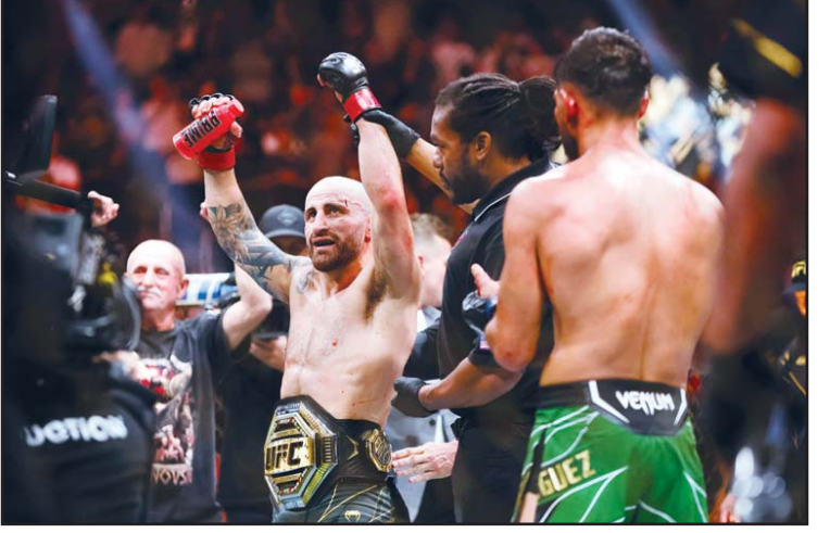
Alexander Volkanovski reacts after defeating Yair Rodríguez during a featherweight mixed martial arts bout during UFC 290 in Las Vegas.

Volkanovski, a minus-390 favorite according to FanDuel Sportsbook, took Rodriguez (16-4) to the mat near the 2-minute mark of the first round and kept him there to dictate the pace. That became a theme as the second round played out much the same way,