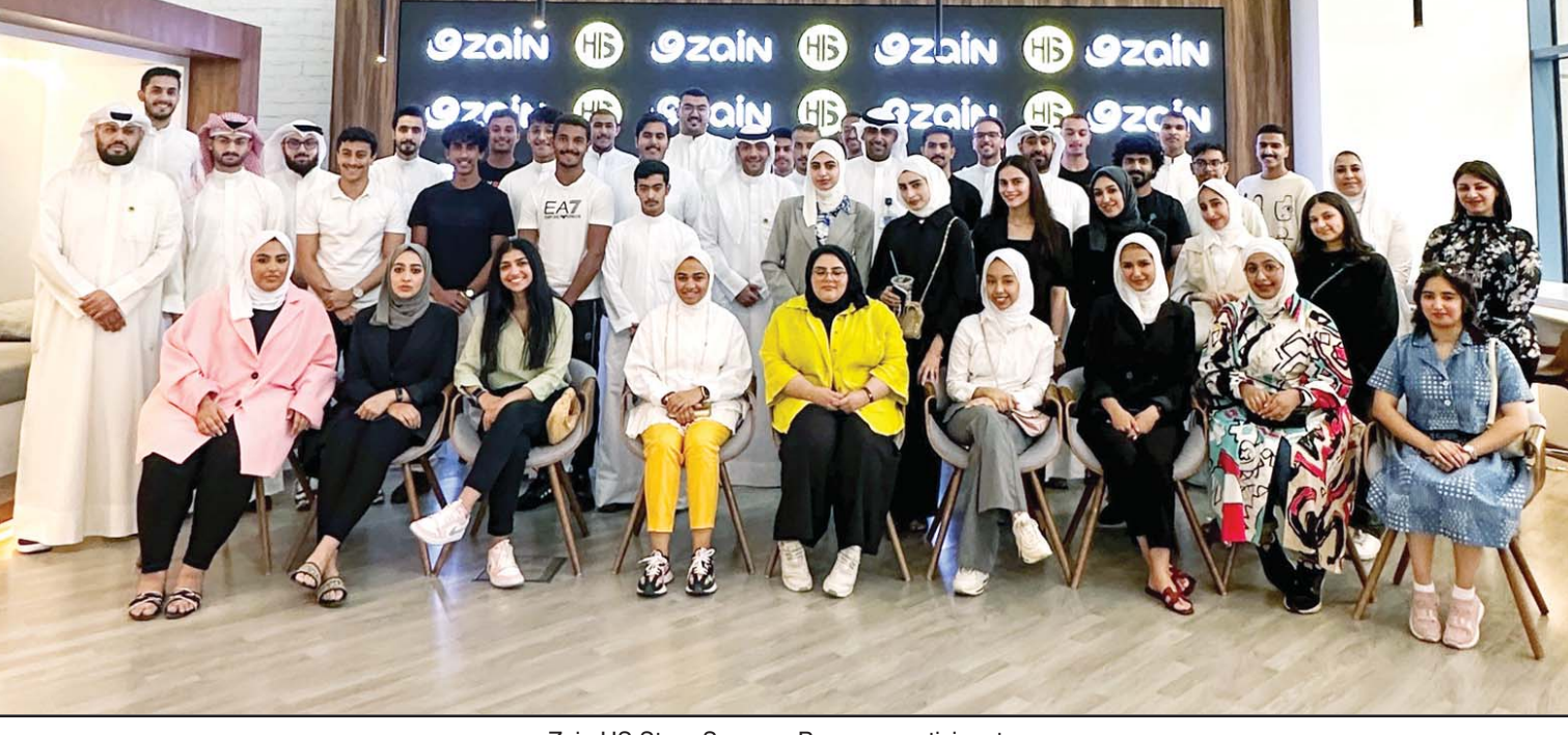
Zain HS Store Summer Program participants.

Internship program kicks off to upskill youth