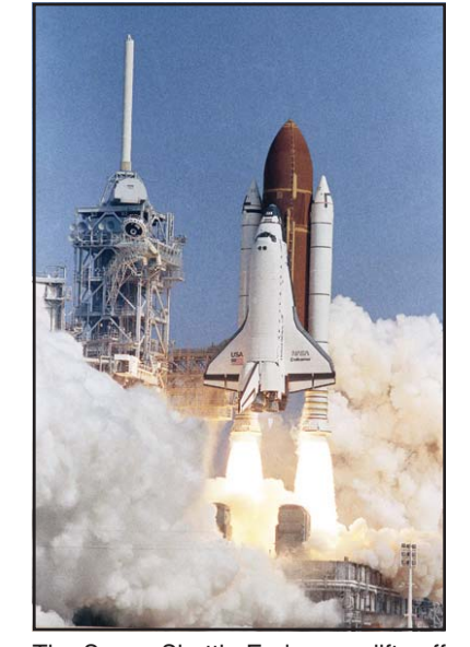
The Space Shuttle Endeavour lifts off pad 39-B with a crew seven at Kennedy Space Center, Fla., Sept. 12, 1992. The lengthy process of putting the retired space shuttle Endeavour on display in the vertical launch position will begin this month in Los Angeles. The California Science Center announced Thursday, July 6, that the six-month process will get underway July 20 at the future Samuel Oschin Air and Space Center currently under construction in Exposition Park. (AP)

ed States' only living coral barrier reef. The four-hour musical event was staged by local radio station 104.1 FM and the Lower Keys Chamber of Commerce. (AP)