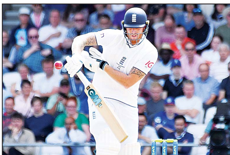
England's Ben Stokes plays a shot during the fourth day of the third Ashes Test match between England and Australia at Headingley, Leeds, England.

Earlier, England's openers resumed in cautious mood at 27 without loss, adding 15 careful runs to the score before Ben Duckett (23) was trapped in the crease by Starc, lbw to a ball destined for leg stump.