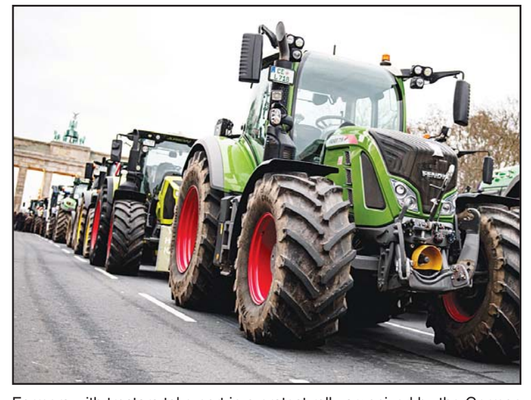
Farmers with tractors take part in a protest rally organized by the German Farmers' Association in Berlin, Germany, Monday, Dec. 18, 2023. Farmers are gathering in Berlin to protest against planned cuts to tax breaks for diesel used in agriculture, part of a deal reached by the government to plug a hole in the country's budget.

The reform will now be signed into law in a joint session of Congress expected to take place next week.