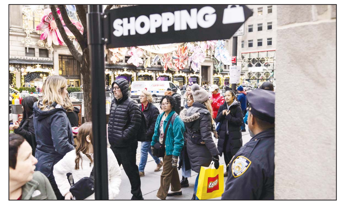
Shoppers and sightseers walk on the 5th Avenue, Monday, Dec. 11, 2023, in New York. Last Thursday, the Com-merce Department released U.S. retail sales data for November.