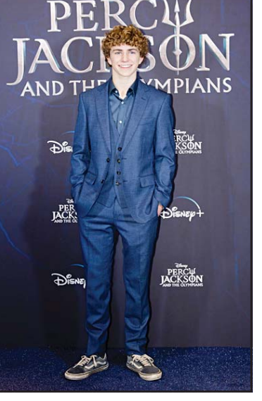
Walker Scobell poses for photographers upon arrival at the premiere of the television series 'Percy Jackson and the Olympians' in London Saturday, Dec. 16.