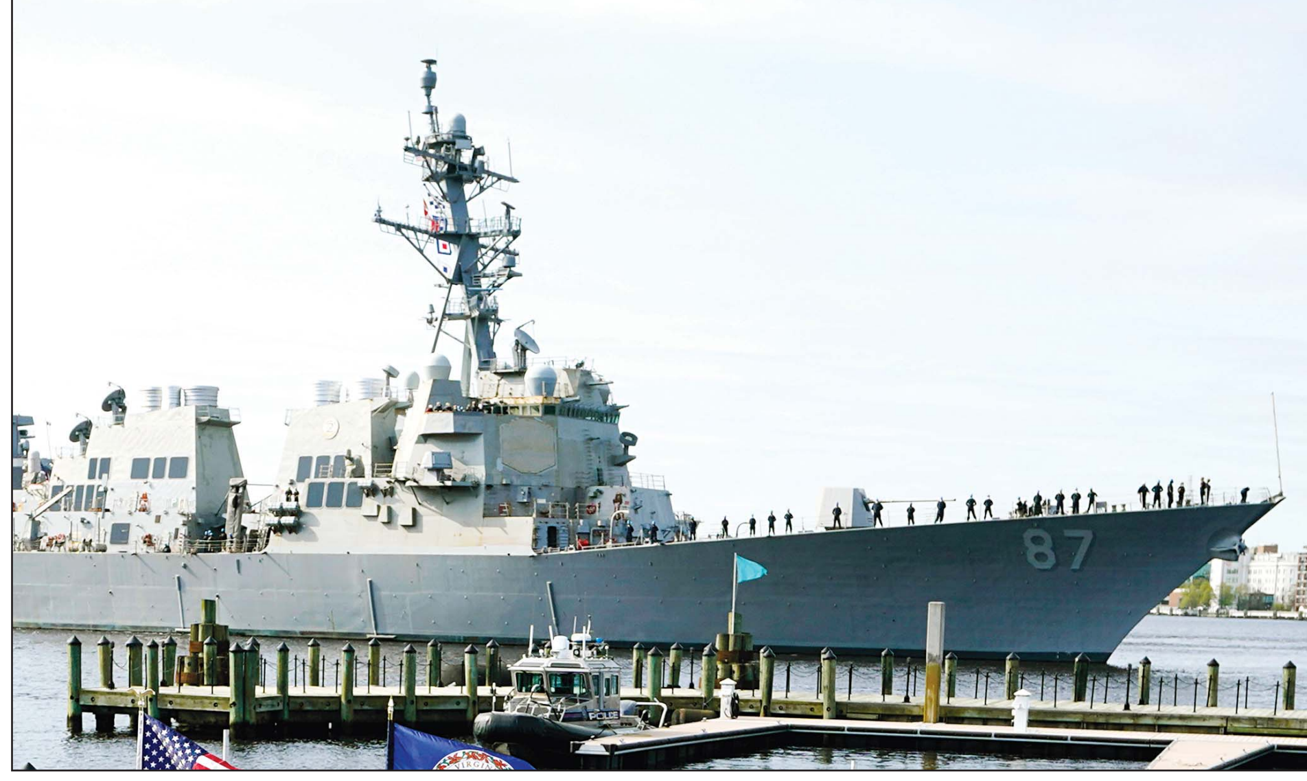
The USS Mason, an Arleigh Burke-class destroyer, passes a dock in Norfolk, Va., April 8, 2021. Officials said the USS Mason shot down a suspected Houthi drone flying in its direction during an incident in which two missiles fired from territory held by Yemen's Houthi rebels missed a commercial tanker loaded with jet fuel near the key Bab el-Mandeb Strait last week.

Houthi interference with navigational rights and freedoms in the waters around the Arabian Peninsula, particularly the Red Sea, is unacceptable