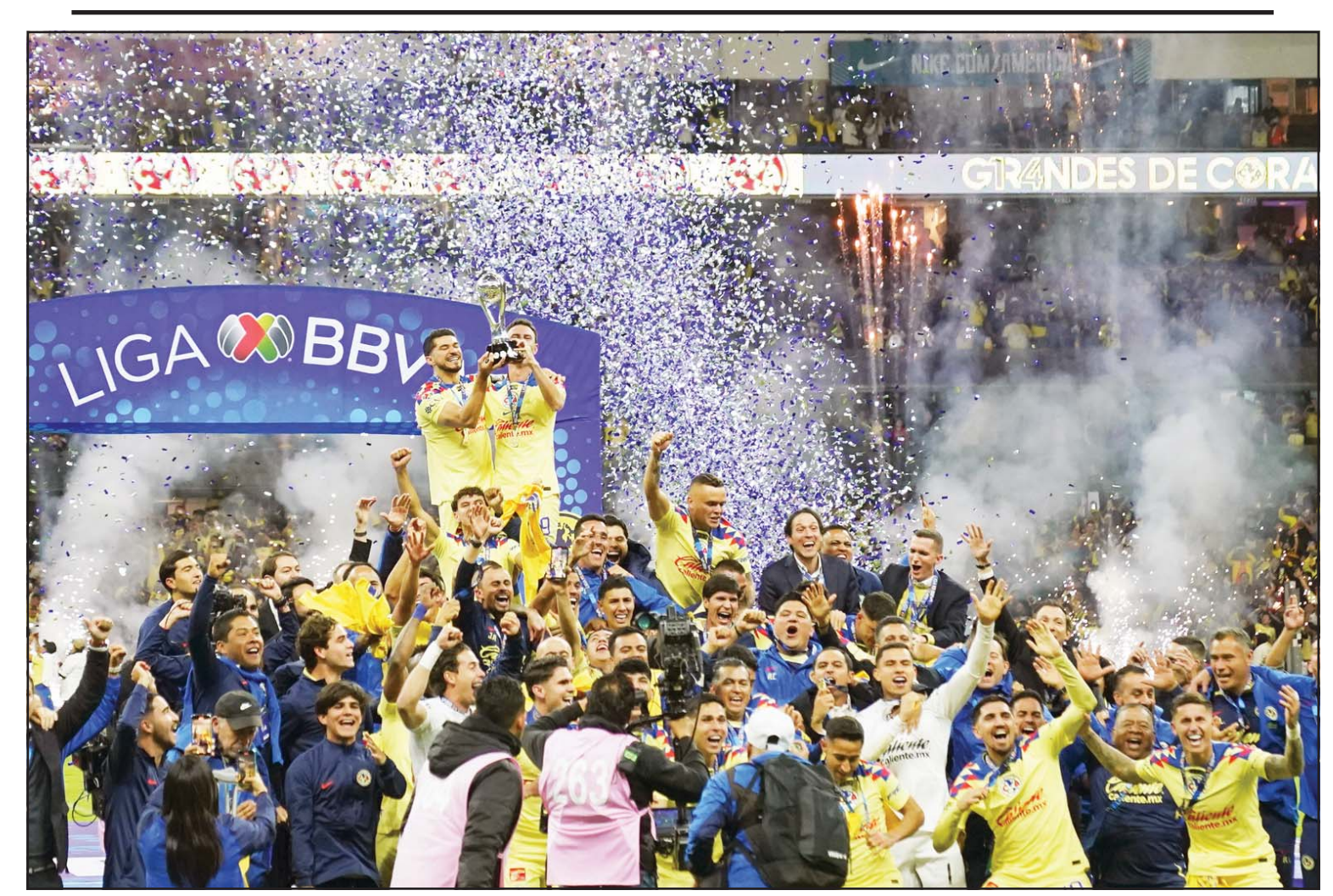
America's players celebrate with the trophy after defeating Tigres in the Mexican soccer league second leg final match at Azteca stadium in Mexico City. America won 4-1 on aggregate.