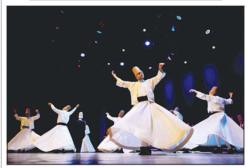
Whirling dervishes of the Mevlevi order perform during a Sheb-i Arus ceremony in Istanbul, Turkey, Sunday, Dec. 17. Every December a series of events are held to commemorate the death of 13th century Islamic scholar, poet and Sufi mystic Jalaladdin Rumi in different cities of Turkey.

Fran Drescher, SAG-AFTRA president, called Streisand "an icon and unparalleled