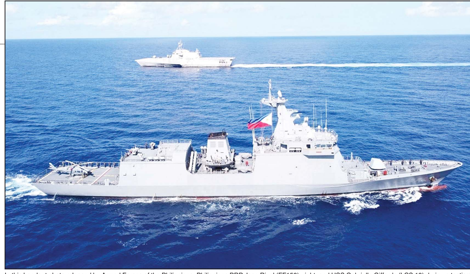
In this handout photo released by Armed Forces of the Philippines, Philippines BRP Jose Rizal (FF150), right, and USS Gabrielle Giffords (LCS 10) during a tactical exercise between Philippines and the United States in the West Philippine Sea on Nov 23. The Chinese military said on Dec 4 that American naval ship USS Gabriel Giffords had 'illegally intruded' on Monday into waters near the Second Thomas Shoal, the site of a hot territorial dispute between China and the Philippines in the South China Sea.

The buses were allowed through on the Zimbabwean side of the Beitbridge border post, South African border officials said.