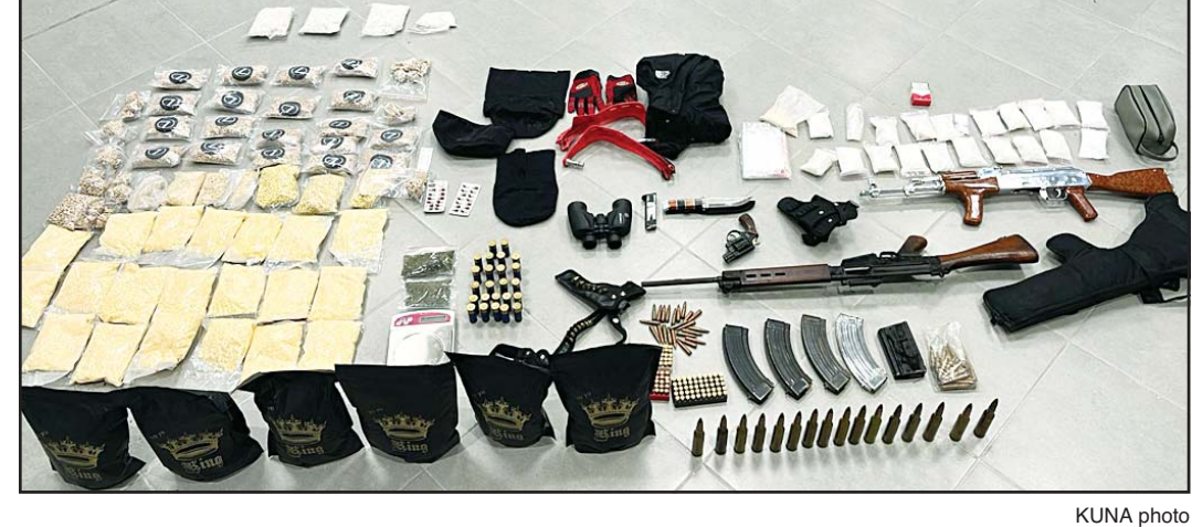
Drugs, firearms, cash found in possession of criminals.

Al-Salem pointed out as well that in recent years, the Public Prosecution investigated dozens of cases suspected