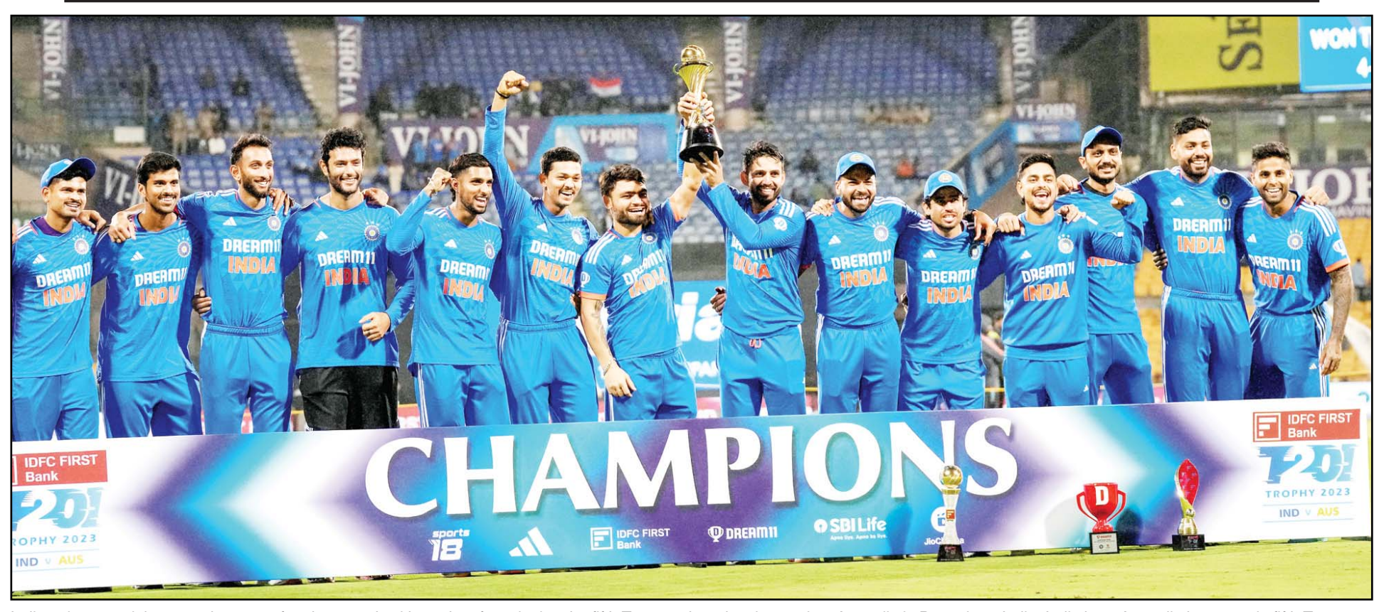
Indian players celebrate as they pose for photograph with trophy after winning the fifth T20 match and series against Australia in Bengaluru, India. India beat Australia by 6 runs in fifth Twenty20 cricket match to win the series 4-1.

Atletico drop to fourth; Sevilla's struggles continue