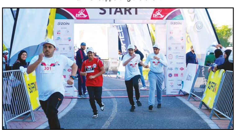
The run coincided with the International Day for Persons with Disabilities.

intellectual disabilities, helping them reach their full potential and grow their skills by organizing various sports activities throughout the year. Such contributions help improve their health and fitness and raise their spirits. Similarly, Al Tomooh Sports Club works to create a more inclusive community by supporting people with intellectual disabilities through social, cultural,