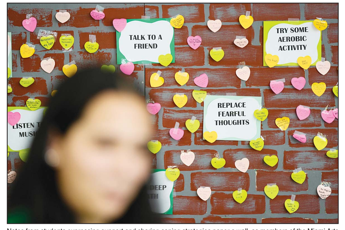
Notes from students expressing support and sharing coping strategies paper a wall, as members of the Miami Arts Studio mental health club raise awareness on World Mental Health Day, Tuesday, Oct. 10, 2023, at Miami Arts Studio, a public 6th-12th grade magnet school, in Miami.

Until we analyze that data, our message to these parents is short and sweet: Go easy on yourselves. Also, go ahead and