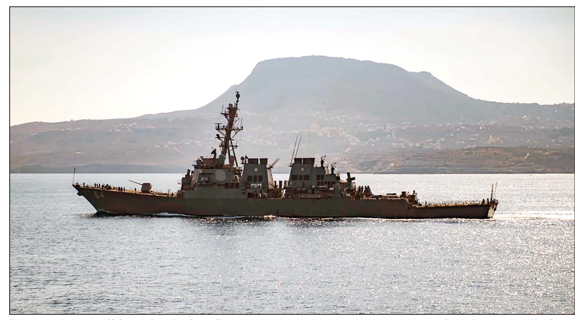
The guided-missile destroyer USS Carney in Souda Bay, Greece. The American warship and multiple commercial ships came under attack Sunday, Dec. 3, 2023 in the Red Sea, the Pentagon said, potentially marking a major escalation in a series of maritime attacks in the Mideast linked to the Israel-Hamas war.