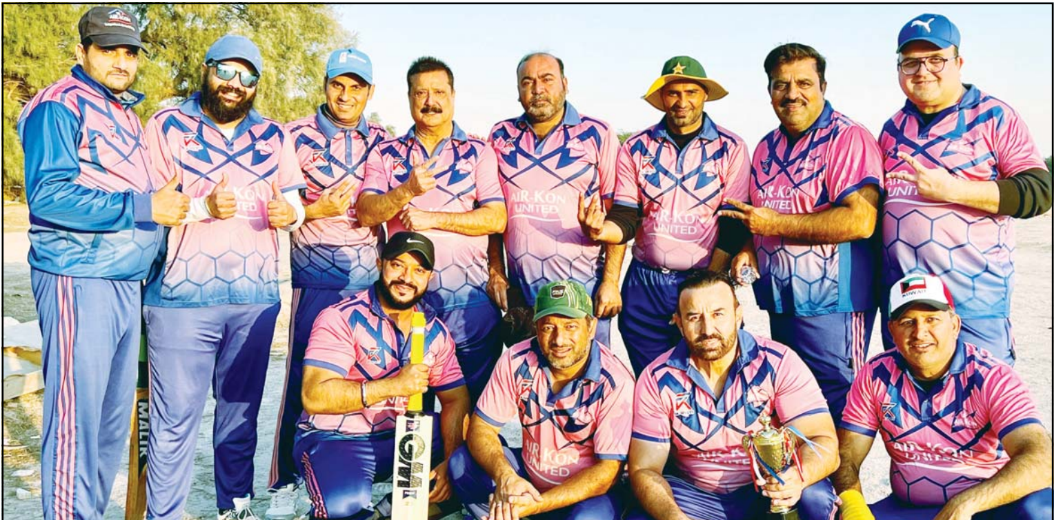
Airkon United pose for a group photo

Following this triumph, Al-Arabi elevated its point tally to 10, claiming the fourth position in the league standings. Al-Nasr, despite the loss, holds strong in fifth place with 9 points. Meanwhile, Yarmouk's victory propelled them to 8 points, securing the seventh position. In contrast, Al-Tadamon maintained their position in ninth place with a total of 7 points. The results set the stage for further excitement in the ongoing basketball league competition.