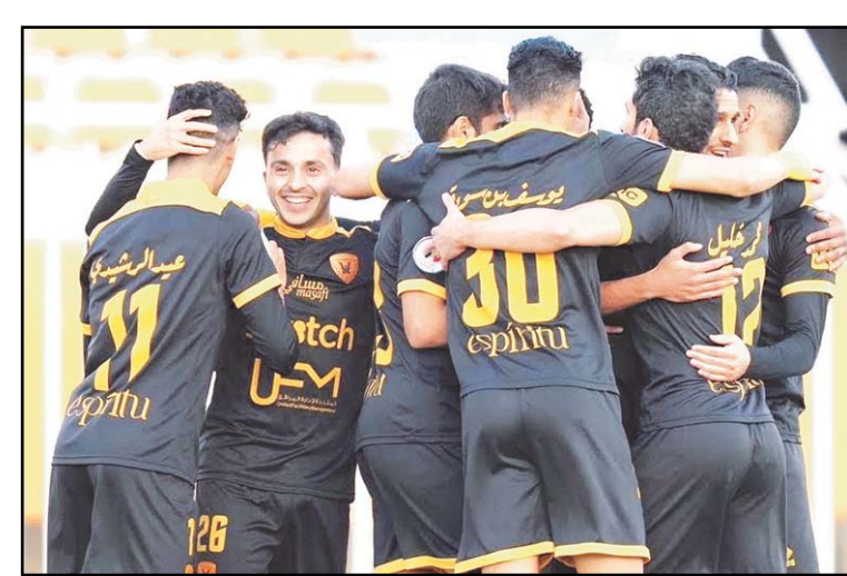
A file photo of Al-Qadsia players celebrating.