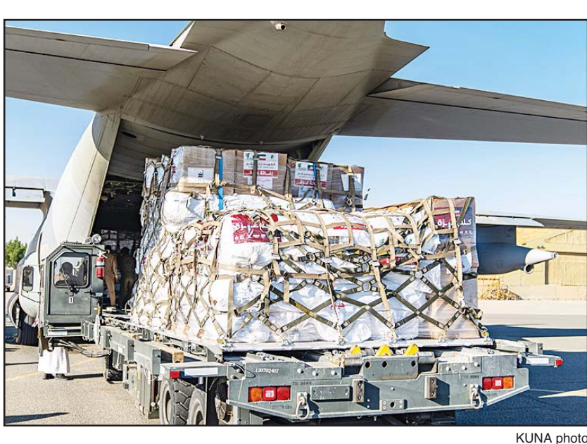
Aid supplies loaded on cargo plane destined for Gaza

The source stated that the Ministry is working during the current period to find solutions to avoid this crisis, by purchasing or exchanging energy with countries in the Gulf electrical interconnection system or activating the rationalization plan at the level of all sectors, stressing the necessity of accelerating procedures and removing obstacles to projects related to raising production capac-