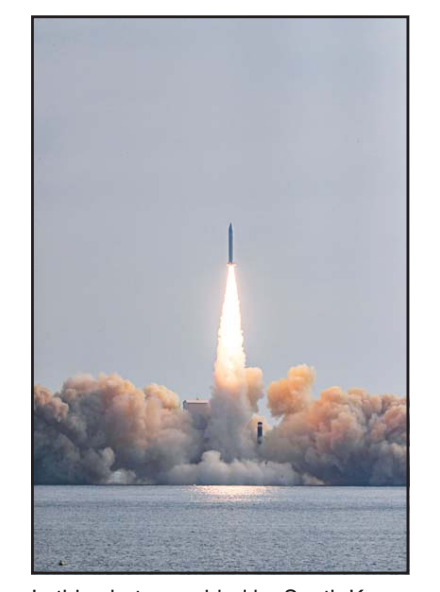
In this photo provided by South Korea Defense Ministry, the third test flight of solid-fuel space rocket is launched from a barge in waters near Jeju Island, South Korea, on Dec 4. (AP)