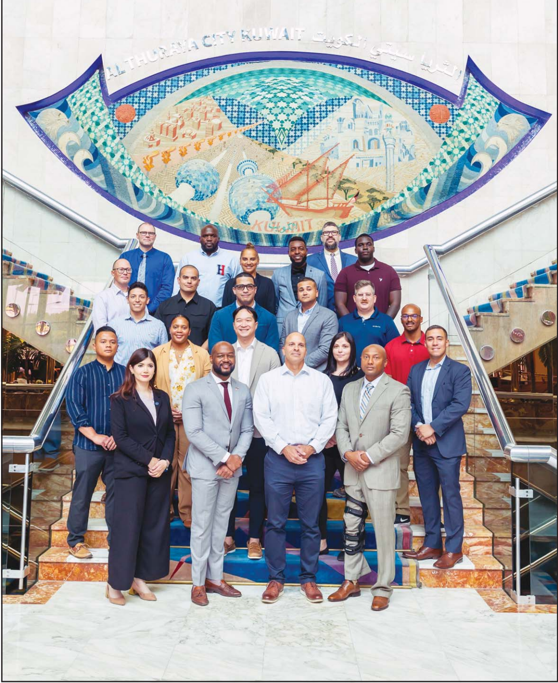
Participants in the event.

ABCK-AmCham Kuwait is a nonprofit organization operating since 1985 and is composed of Fortune 500 corporations, small and medium-sized companies, and prominent business leaders and entrepreneurs, both American and Kuwaiti. ABCK-AmCham Kuwait acts as an advocate for American interests in the state of Kuwait. For More Information, please visit our website at www.amchamkuwait.org or follow us on the social media channels @abck1985.