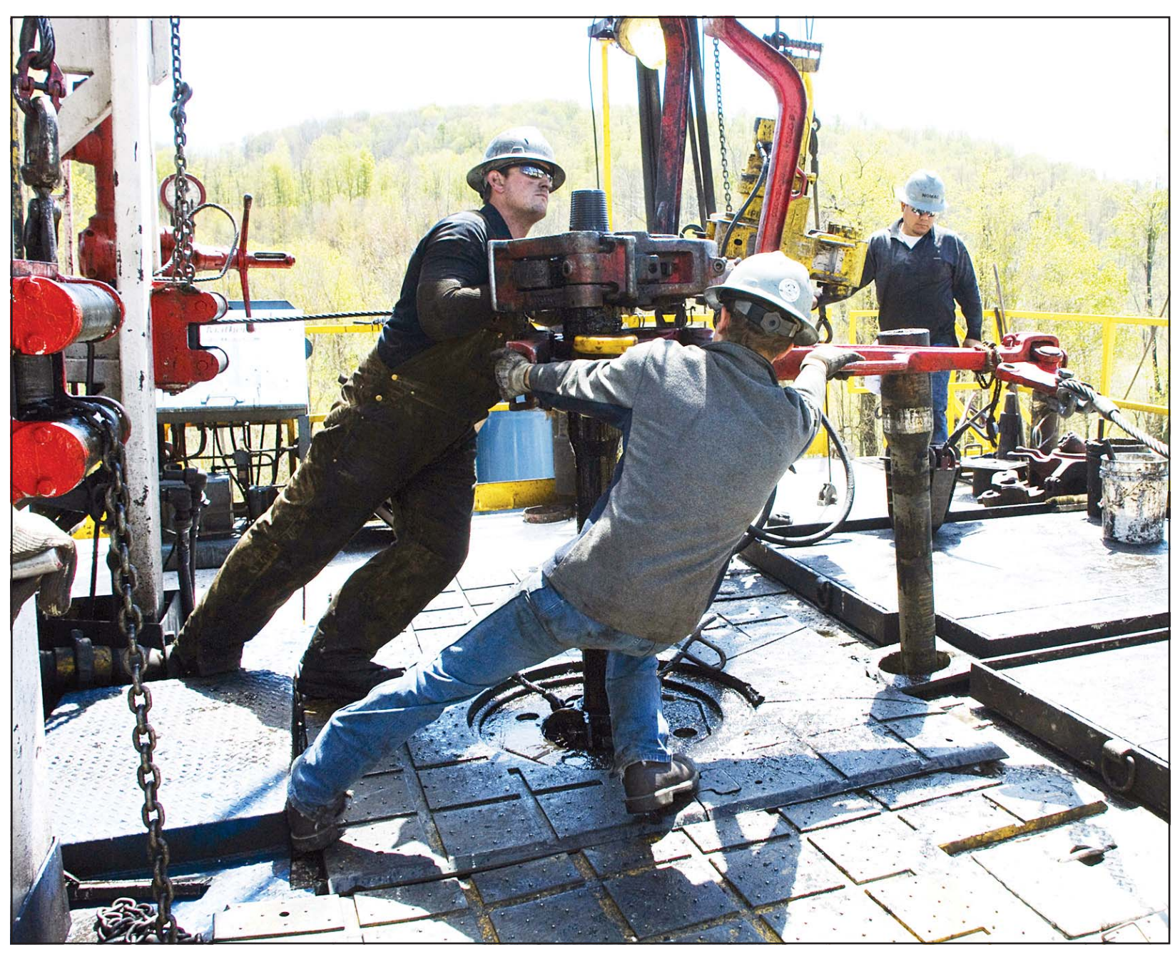
Workers move a section of well casing into place at a Chesapeake Energy natural gas well site near Burlington, Pa., in Bradford County, on April 23, 2010. A team of that has spent four years studying the health effects of natural gas fracking in southwestern Pennsylvania is set to present its findings Tuesday, Aug. 15.