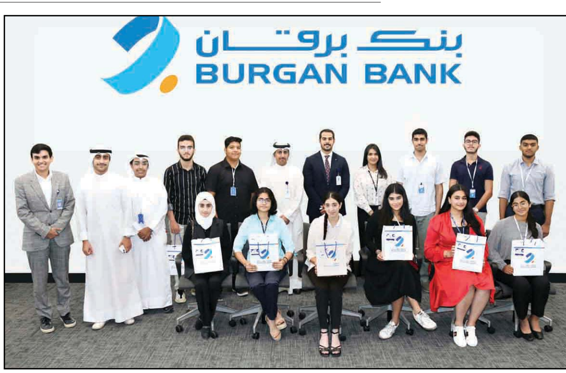
Participants of Burgan Bank's summer programme.