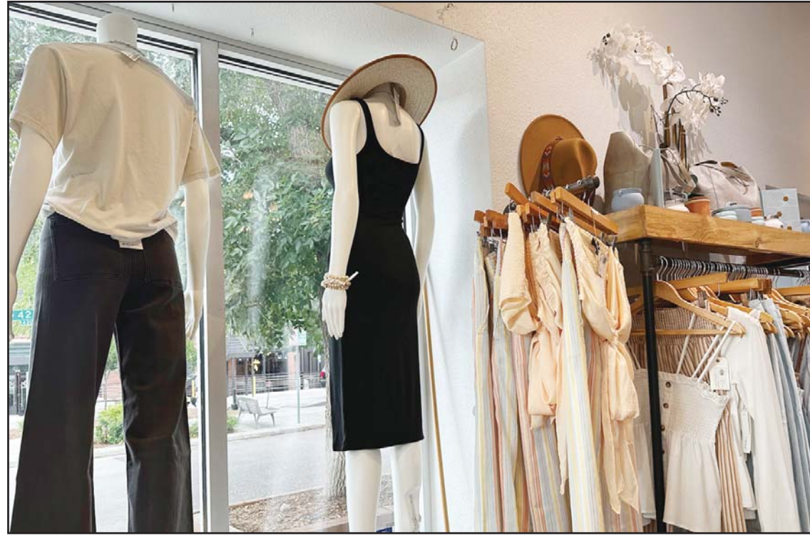
Items are displayed in a boutique along Tennyson Street Saturday, Aug. 5, 2023, in northwest Denver. On Tuesday, the Commerce Department released U.S. retail sales data for July.

while online sales increased 1.9%. But higher interest rates are