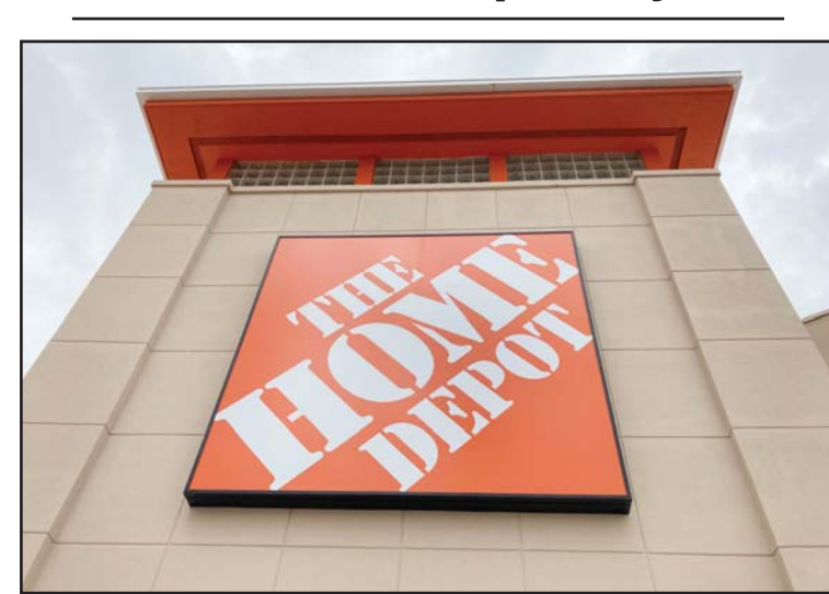
In this file photo, a Home Depot logo is shown on a store on May 14, 2021, in North Miami, Fla. Home Depot reports earnings on Tuesday.

Wells Fargo & Company (NYSE: WFC) is a leading financial services company that has approximately $1.9 trillion in assets, proudly serves one in three U.S. households and more than 10% of small businesses in the U.S., and is a leading middle market banking provider in the U.S. We provide a diversified set of banking, investment and mortgage products and services, as well as consumer and commercial finance, through our four reportable operating segments: Consumer Banking and Lending, Commercial Banking, Corporate and Investment Banking, and Wealth & Investment Management. Wells Fargo ranked Investment No. 47 on Fortune's 2023 rankings of America's largest corporations. In the communities we serve, the company focuses its social impact on building a sustainable, inclusive future for all by supporting housing affordability, small business growth, financial health, and a low-carbon economy. News, insights, and perspectives from Wells Fargo are also available at Wells Fargo Stories.