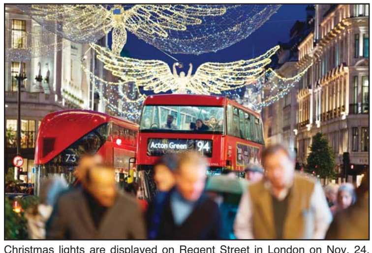
Christmas lights are displayed on Regent Street in London on Nov. 24, 2022. The rate of inflation in the U.K. fell sharply in July to a 17-month low largely on the back of lower energy prices, official figures showed Wednesday, Aug. 16, 2023, a welcome development for hard-pressed households struggling during the cost of living crisis.

But he said being president is more challenging than many people think in a social media era in which every problem can reach the president, including anger, mockery, derision and slander. "Everything can be easily conveyed,"