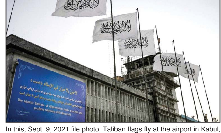
Afghanistan. Two years on from the Taliban takeover of Afghanistan, the United States has begun easing rules that could allow commercial airlines to fly over the country in routes that cuts time and burned fuel for East-West travel.

advisory, using an acronym for air traffic control. Still, the possibility of overflights resuming would have a major impact on carriers.