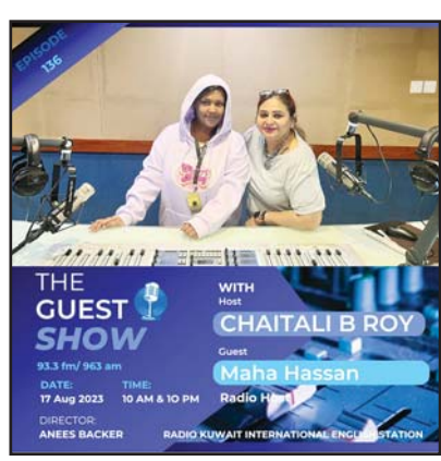
The Guest Show poster.

Moreover, sources indicated that the informational predicament faced by the Capital Markets Authority predominantly pertains to companies temporarily suspended from trading or those delisted, as well as companies suspended from trading due to outstanding fees. These decisions fall under the purview of Capital Markets Authority regulations but do not equate to revoking the companies' licenses. Instead, these companies remain legally operational entities under the Ministry of Commerce, updating their records in line with established conditions and resolutions passed by their general assemblies.