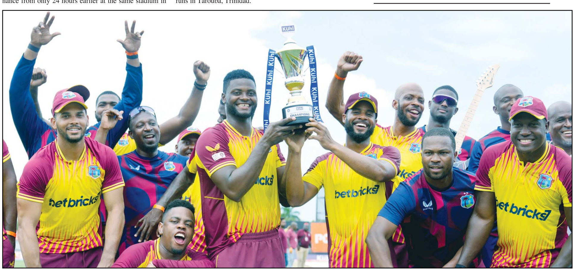
Players of West Indies celebrate with the trophy after beating India in the fifth and last T20 cricket match at Central Broward Regional Park in Lauderhill, Fla.