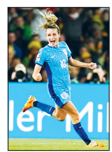
England's Ella Toone celebrates after scoring the opening goal during the Women's World Cup semifinal soccer match between Australia and England at Stadium Australia in Sydney, Australia.

more clinical when it counted and played a game that deprived Australia of possession for long periods. The Australians seem to have played