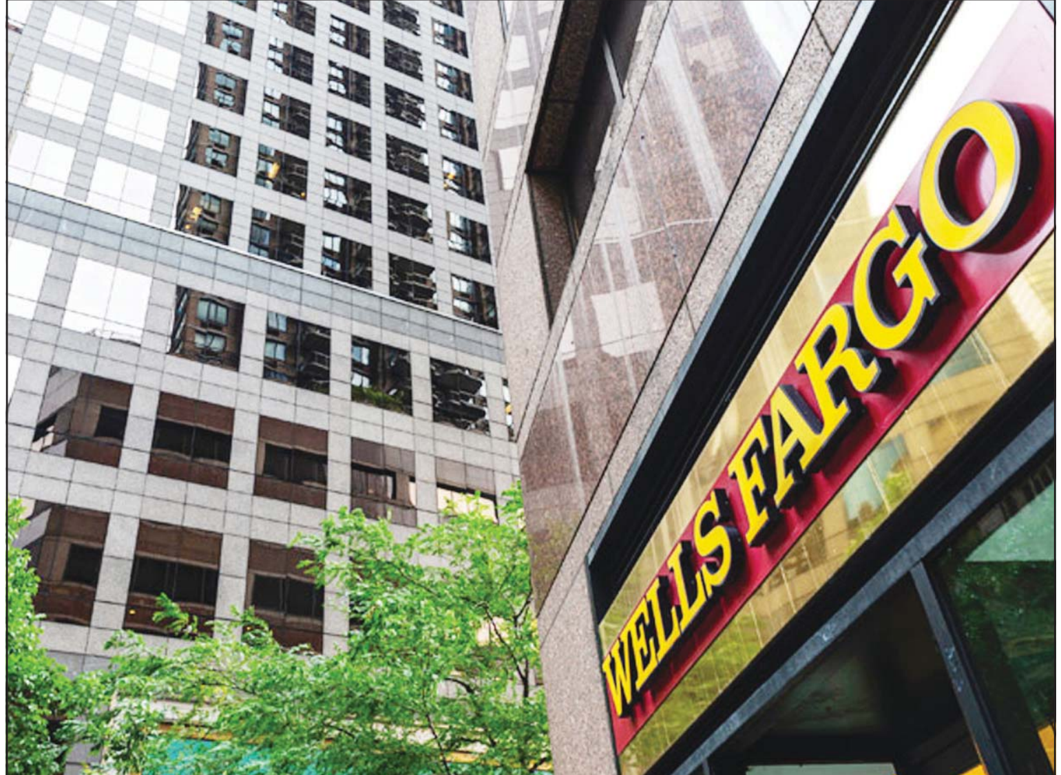
Facade of a Wells Fargo bank branch in Manhattan.

Founded in 1901, United States Steel Corporation is a leading steel producer. With an unwavering focus on safety, the Company's customercentric Best for All® strategy is advancing a more secure, sustainable future for U. S. Steel and its stakehold-