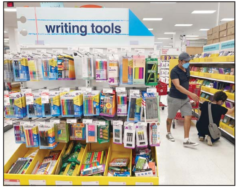
In this file photo, Shoppers look for school supplies deals at a Target store, July 27, 2022, in South Miami, Fla.

Target now expects comparable sales in a wide range around a mid-single digit decline for the remainder of the year. It also now projects full-year adjusted earnings per share of $7 to $8, compared with the prior range of $7.75 to $8.75. Analysts were expecting $7.72 per share for the year, according to FactSet.