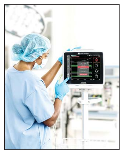
EU-HyProtect registry demonstrates reduced time in hypotension during surgery using Acumen HPI software.

non-cardiac surgery. In Europe, of the 2.5 million patients undergoing high-risk surgery annually, one in four develops serious postoperative complications 1,2. Throughout the hospital patient journey, anaesthetists and intensivists need to analyse large amounts of data to make life-critical decisions for patients. One