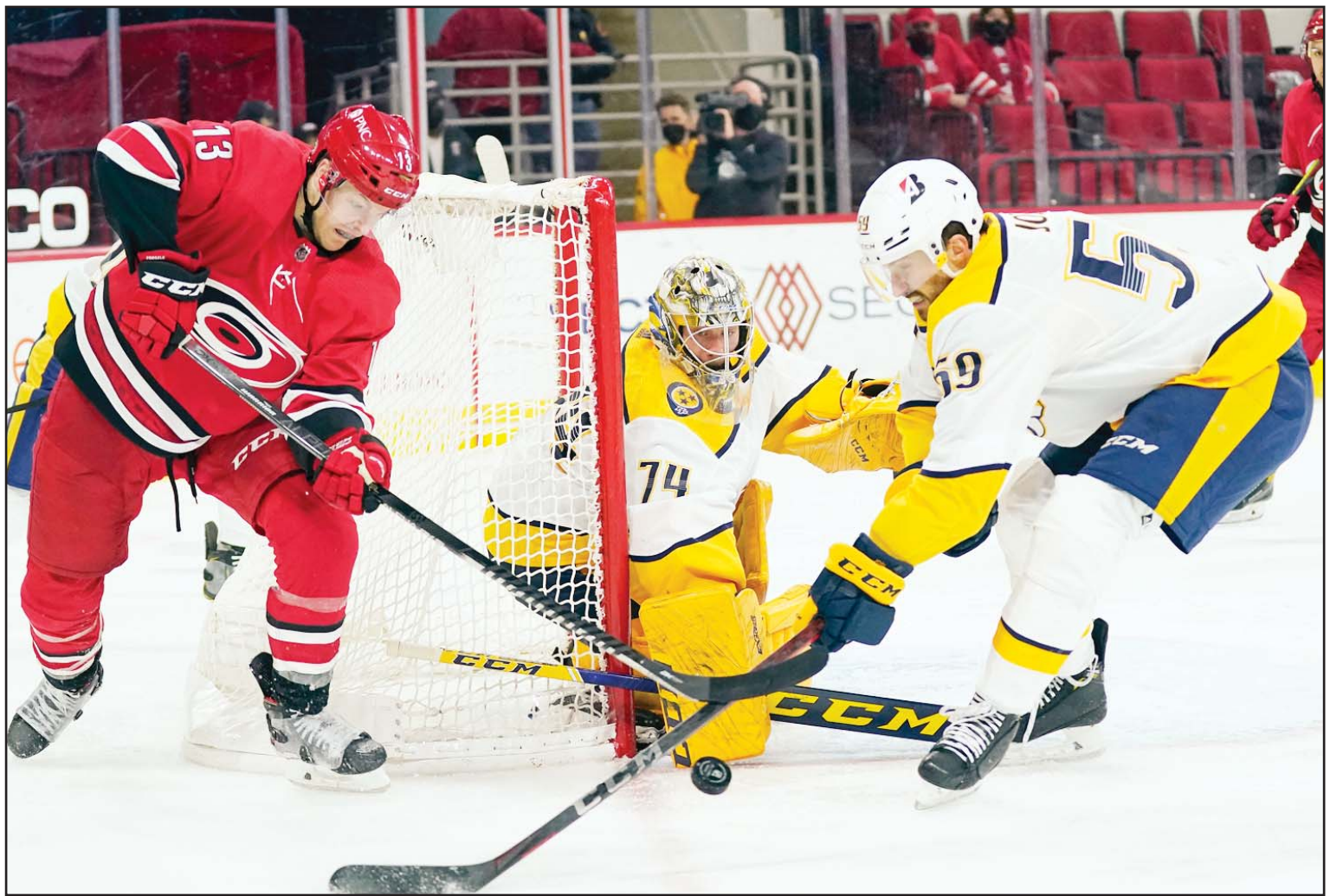
Nashville Predators goaltender Juuse Saros (74) and defenseman Roman Josi (59) defend against Carolina Hurricanes left wing Warren Foegele (13) during the second period of an NHL hockey game in Raleigh, N.C., on April 17.