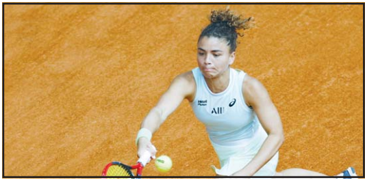
Italy's Jasmine Paolini plays a shot against Poland's Iga Swiatek during the women's final of the French Open tennis tournament at the Roland Garros stadium in Paris, France.