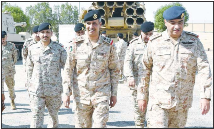
Chief of Staff of Kuwait Army during the inspection of the Artillery and Land Force Institute.