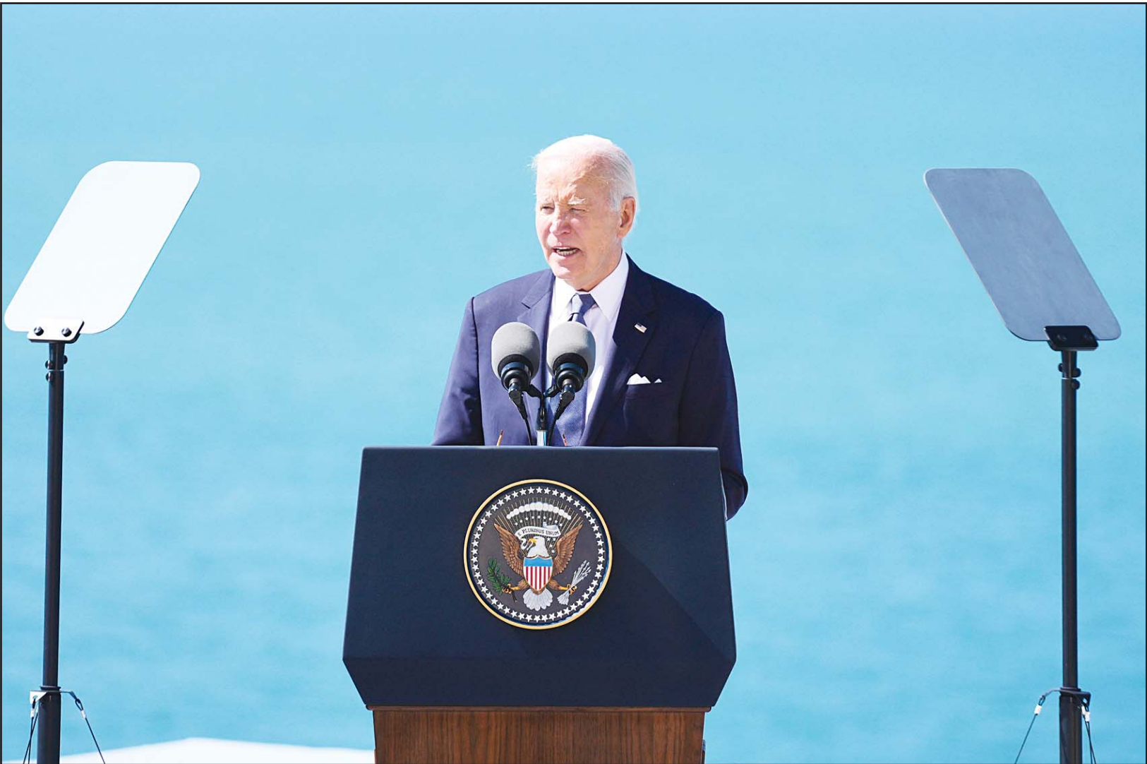
US President Joe Biden delivers a speech on the legacy of Pointe du Hoc, and democracy around the world, on June 7 as he stands next to the Pointe du Hoc monument in Normandy, France.

Knox vows to 'fight for truth': Amanda Knox told Italian TV that she was surprised by a Florence appeals court's decision to find her guilty of slander in light of a European court ruling that police who took her confession had violated her human rights. "I will fight for the truth," Knox told Sky TG24 in her first public comments since the guilty verdict on Wednesday. "It's been 17 years that I have been unjustly accused." Knox was a 20-year-old exchange student in the university town of Perugia when she and her then-Italian boyfriend were accused of murdering her housemate, 21-year-old Meredith Kercher, who was found dead in the apartment they shared on Nov. 2, 2007.