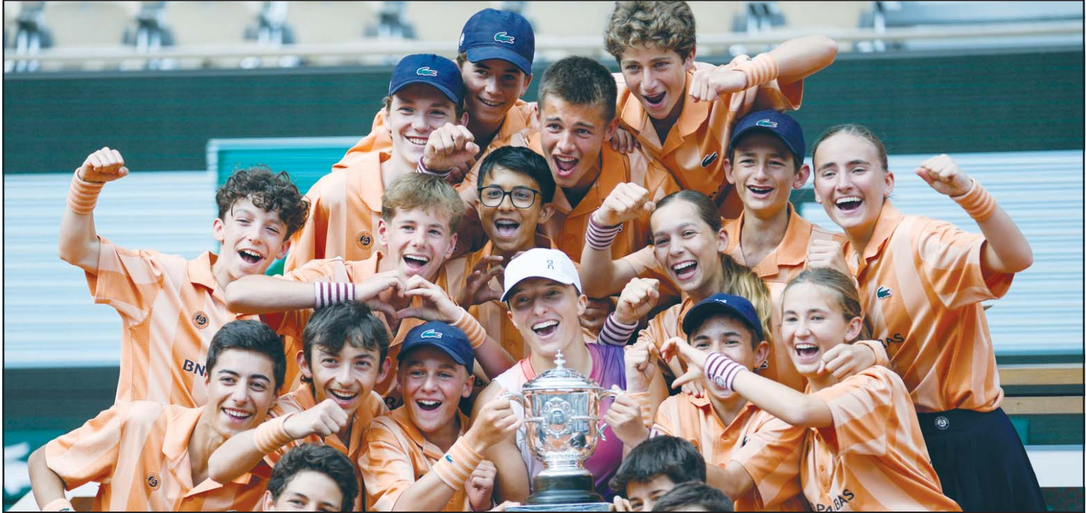
Ball kids pose with Poland's Iga Swiatek who holds the trophy after winning the women's final of the French Open tennis tournament against Italy's Jasmine Paolini at the Roland Garros stadium in Paris, France.

from two rows of Paolini's supporters in the lower bowl of the stands, each one wearing a T-shirt in one of the colors of the Italian flag: green, white or red. They would reprise that song, in English, interspersing it with claps. After Swiatek got the match's first point, a fan yelled in French, "Jasmine, it's not over!" Swiatek briefly went through a shaky stretch, failing to convert a break point in the second game, then getting broken to trail 2-1 after 13 minutes when she flubbed a forehand, sending it way long. It was Swiatek's seventh unforced error of the afternoon; Paolini had made only one by then. But the rest of the way, those numbers were six unforced errors by Swiatek, 17 by Paolini. That's because Swiatek, who heard plenty of "Iga!" chants, immediately reset herself and began playing the sort of tennis that has kept her ranked No. 1 for nearly every week since April 2022. The instincts and footwork to get to almost any shot an opponent can offer. The intimidating, heavy-spin forehands. The prematch strategy and midmatch adjustments that can shift things her way.