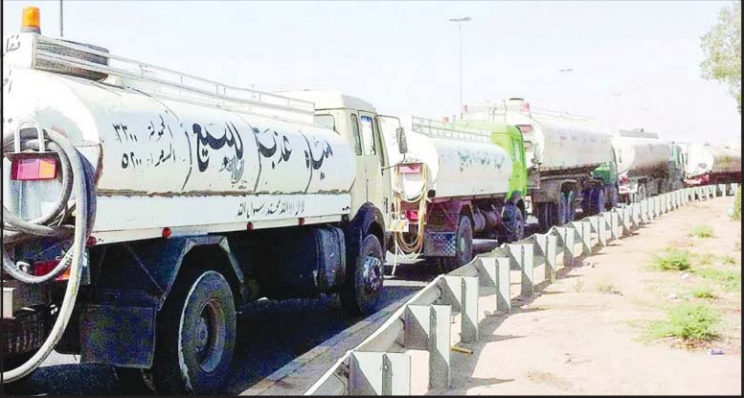
A long line of tankers waiting to be filled due to low water pressure during filling process.

KUWAIT CITY, June 8: Residents of Al-Mutla’a city are grappling with a severe scarcity of fresh water, exacerbated by the closure of the Amghara water station, reports Al-Seyassah daily. The closure has led to increased pressure on the Jahra water station, resulting in extended waiting times for water tanker fill-ups, now reaching up to 6 hours. Consequently, the price of a single tanker load