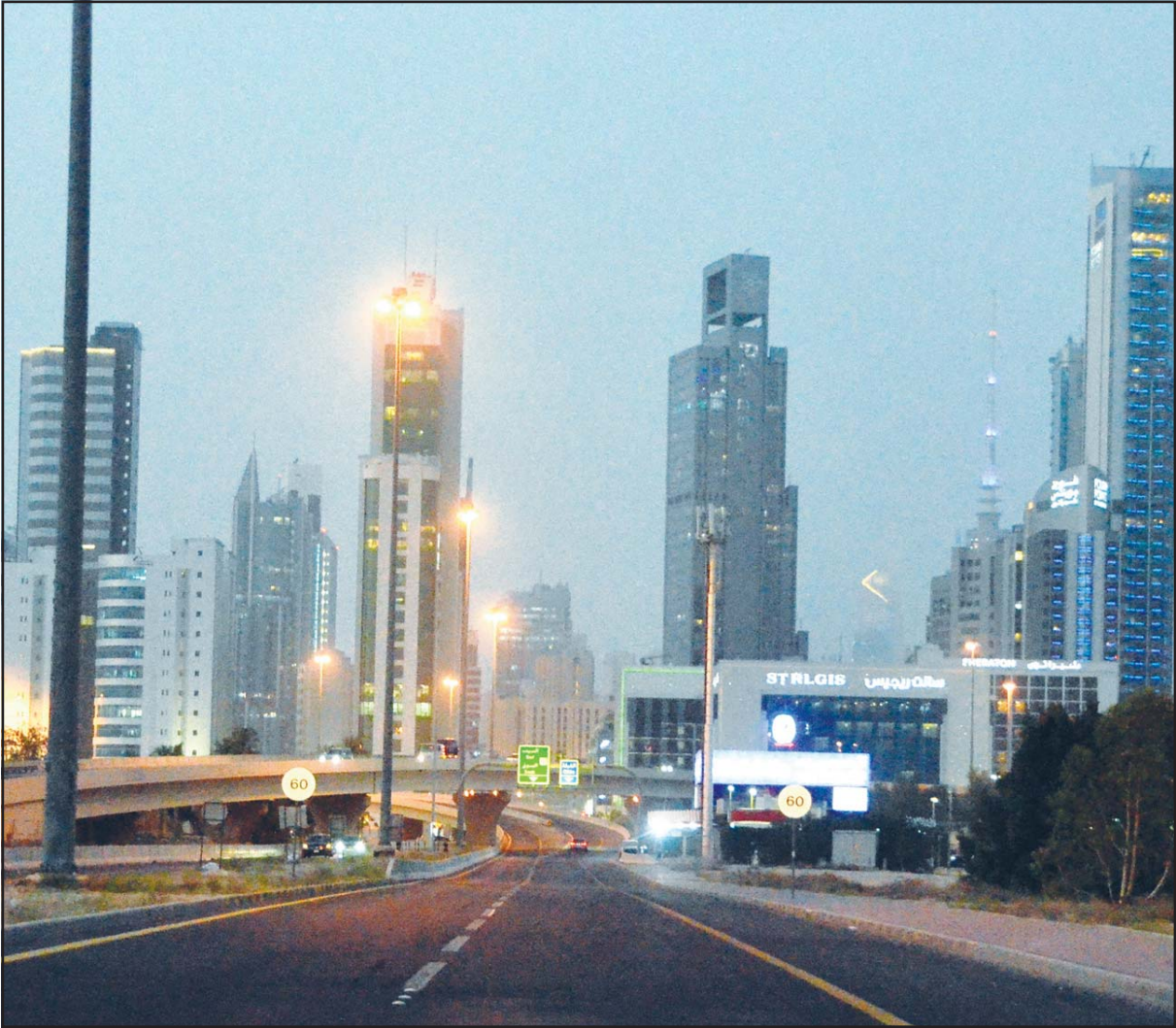
Kuwait's skyline glows under a clear Friday evening sky, amidst record-breaking temperatures reaching 49°C.

He reiterated the wise leadership's unwavering commitment to ensuring a successful Hajj season. This manifested in early preparations, including diligent reviews of plans, projects, and initiatives. (KUNA)