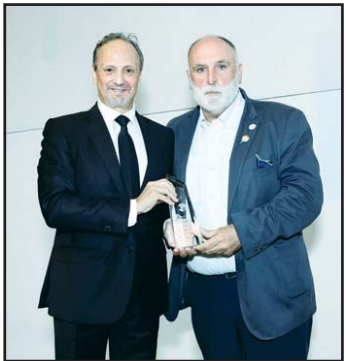
Former Kuwait Minister of Foreign Affairs Sheikh Salem Al-Sabah honors World Central Kitchen (WCK) founder Jose Andres at the Kuwait-America Foundation and UNHCR annual charity dinner.