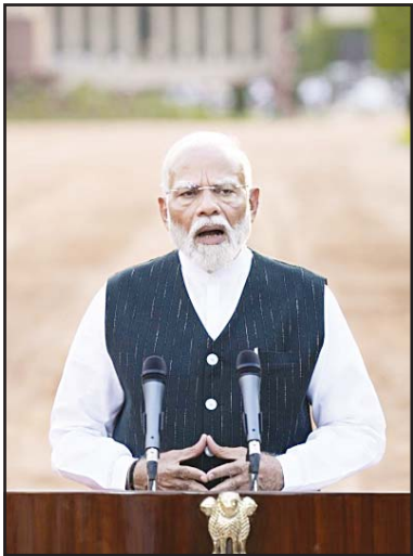
Indian Prime Minister Narendra Modi speaks to the media at the forecourt of the Indian presidential palace after receiving a letter from the President of India, Droupadi Murmu, inviting him to form the next central government, in New Delhi, India on June 7. Modi on Friday was formally elected leader of the National Democratic Alliance coalition, which won the most seats in the national election after his political party failed to win a majority on its own. (AP)

There used to be an office of the Mexican Commission on Refugee Aid, COMAR, nearby, but that office was closed on May 29. (AP)