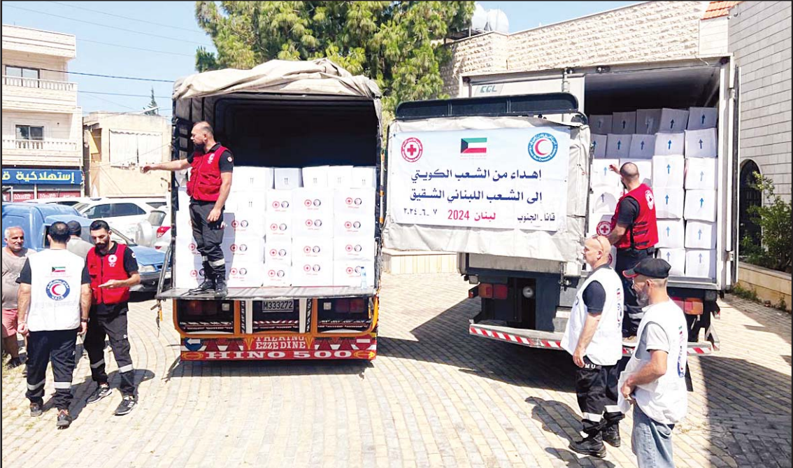
The Kuwait Red Crescent Society begins the second phase of distributing aid to the people of southern Lebanon.