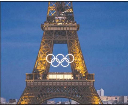
The Olympic rings are seen on the Eiffel Tower Friday, June 7, 2024, in Paris. The Paris Olympics organizers mounted the rings on the Eiffel Tower on Friday as the French capital marks 50 days until the start of the Summer Games. The 95-foot-long and 43-foot-high structure of five rings, made entirely of recycled French steel, will be displayed on the south side of the 135-year-old historic landmark in central Paris, overlooking the Seine River. (AP)

Thousands of athletes will parade through the heart of the French capital on boats on the Seine along a 6-kilometer (3.7-mile) route in the opening ceremony at sunset on