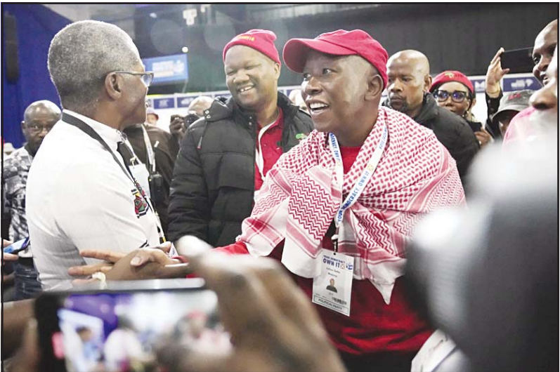
Economic Freedom Fighters (EFF) leader, Julius Malema, front center, arrives at the Results Operation Centre (ROC) in Midrand, Johannesburg, South Africa on June 1. South African opposition parties were meeting Friday and will continue crunch talks into next week to consider the ruling African National Congress’ offer to become part of a government of national unity.

The announcement came a day after US officials said that Washington had been tracking Russian warships and aircraft that were expected to arrive in the Caribbean for a military exercise. They said the exercise