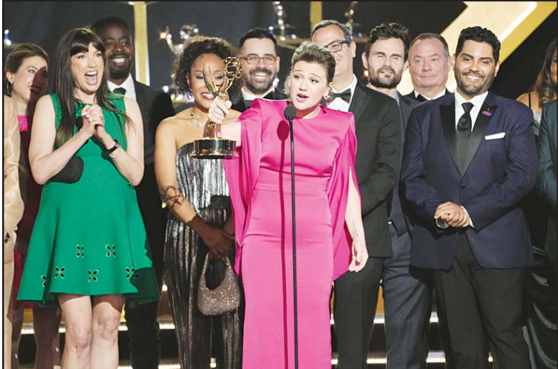
Kelly Clarkson, (center), and the team from ‘The Kelly Clarkson Show’ accept the award for outstanding daytime talk series.