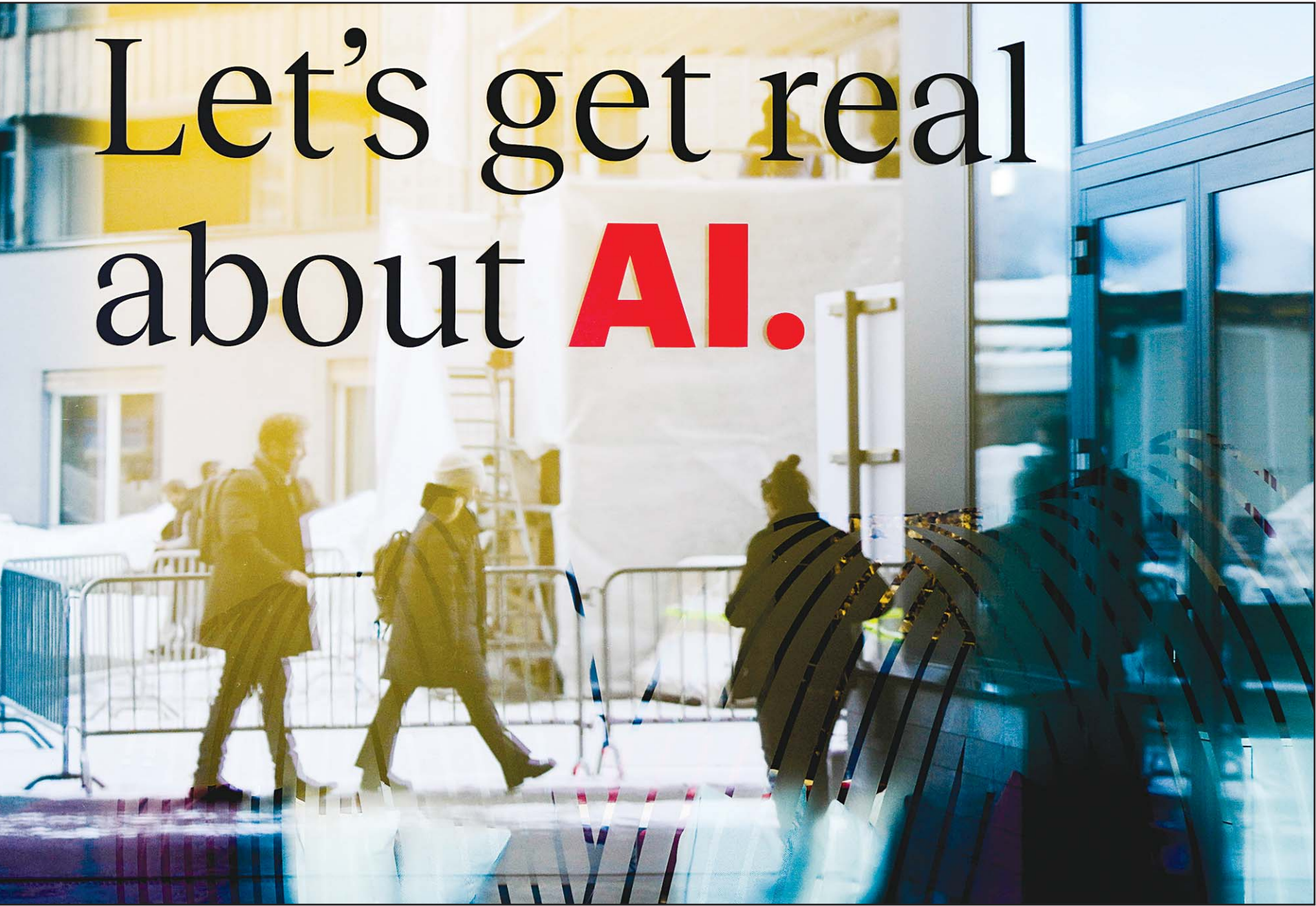
People are reflected in a window of a hotel at the Davos Promenade in Davos, Switzerland, Jan. 15, 2024. Voters in the European Union are set to elect lawmakers for the bloc’s parliament, in a major democratic exercise that’s also likely to be overshadowed by online disinformation. Experts have warned about that artificial intelligence could supercharge the spread of fake news to disrupt the election in the EU and many other countries this year.

‘Research suggests that even when presented with particular scenarios or case studies, engineering students often struggle to recognize ethical dilemmas.’