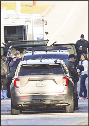
Law enforcement officers maintain their presence at Schemengees Bar and Grille in the aftermath of a mass shooting in Lewiston, Maine on Oct 28, 2023. Thousands of pages Maine State Police documents released on June 7 include detailed descriptions of the chaos and carnage surrounding the state's deadliest mass shooting.