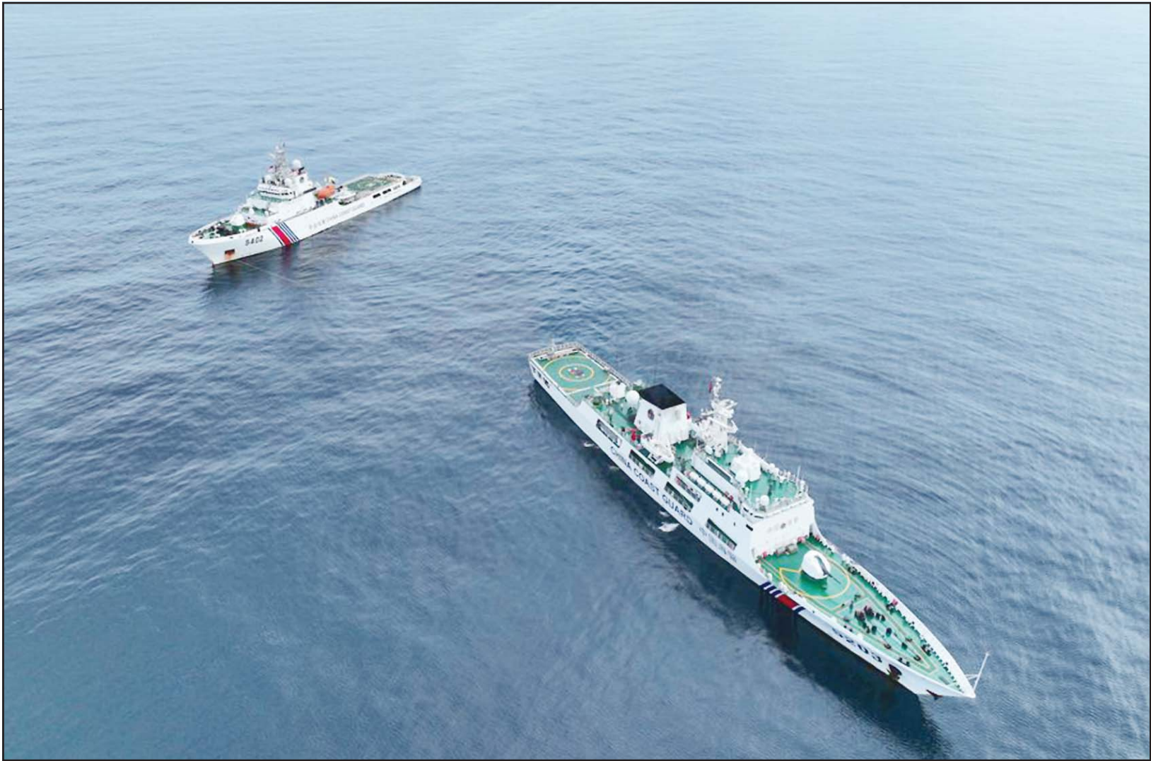
An aerial drone photo taken on May 21, 2024 shows China Coast Guard (CCG) vessel Huayang (R) conducting a drill with another CCG vessel in the South China Sea. Malaysian Prime Minister Anwar Ibrahim has called for diplomatic engagement to resolve the South China Sea disputes, stressing that interference from external parties will only make things worse.

The defendants face a number of charges, many punishable by death, including terrorism, murder and criminal association. The court said there were 53 names on the list, but the names of Malanga and one other person were removed after death certificates were produced.