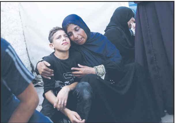
Palestinians mourn their relatives killed in the Israeli bombardment of the Gaza Strip at al-Aqsa Hospital in Deir al-Balah, central Gaza Strip, Saturday, June 8, 2024.