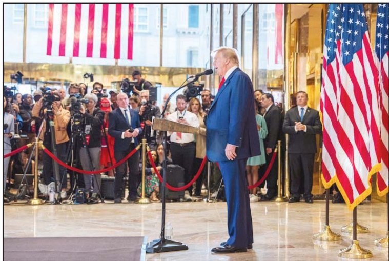
Former US president Donald Trump speaks during a news conference at Trump Tower, Friday, May 31, 2024, in New York. A day after a New York jury found Trump guilty of 34 felony charges, the presumptive Republican presidential nominee addressed the conviction and likely attempt to cast his campaign in a new light. - See Page 6