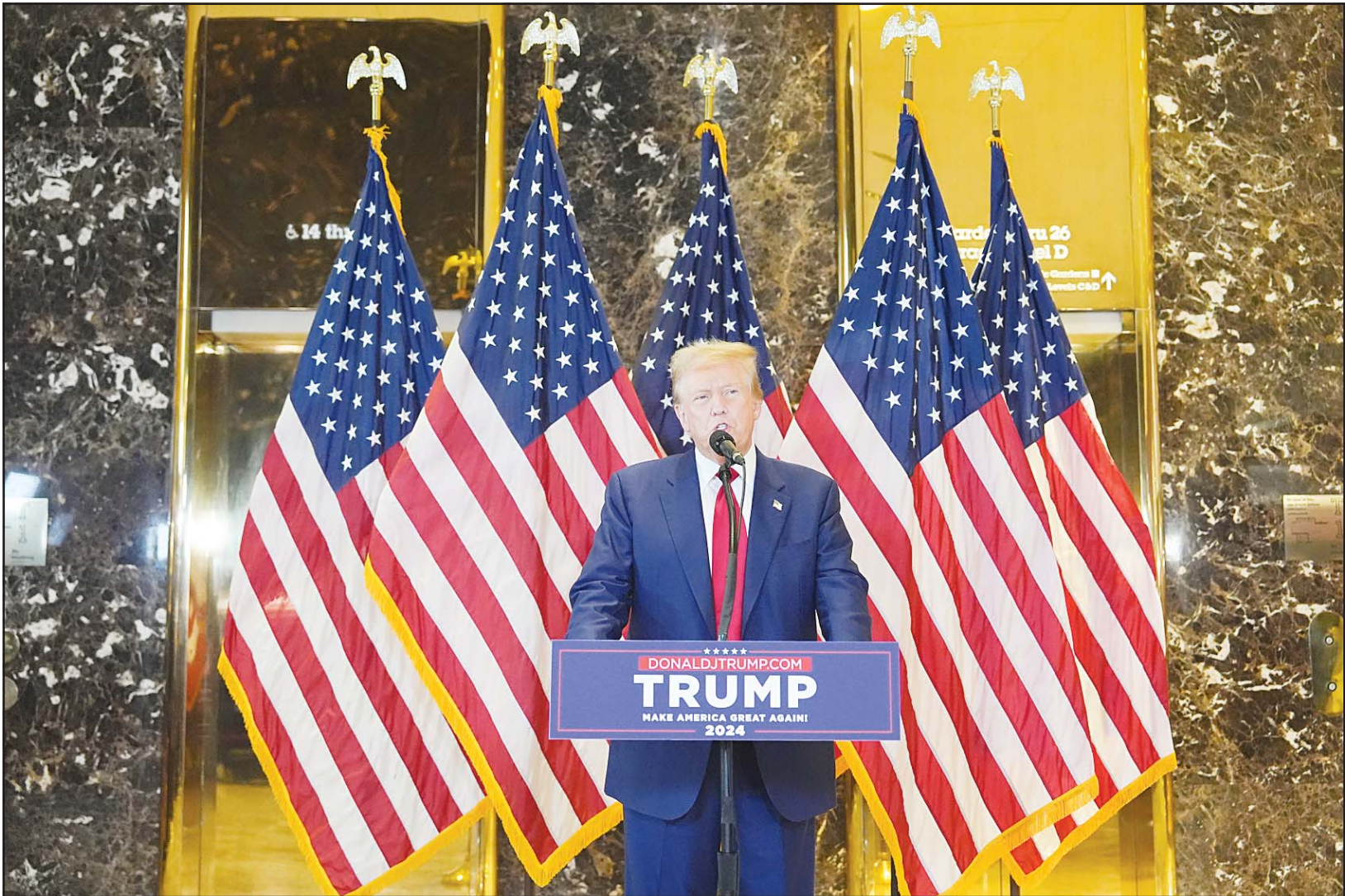
Former US president Donald Trump speaks during a news conference at Trump Tower on May 31 in New York. A day after a New York jury found Trump guilty of 34 felony charges, the presumptive Republican presidential nominee addressed the conviction and likely attempt to cast his campaign in a new light.

France files preliminary charges against teen: French authorities on Friday raised preliminary terrorism charges against an 18-year-old accused of a plot targeting spectators attending soccer games at the upcoming Paris Olympics. The interior minister said it was the first such thwarted plot targeting the Games, which start in eight weeks as France is on its highest threat alert level. The man is accused of planning a "violent action" on behalf of the Islamic State group's jihadist ideology, the national counterterrorism prosecutor's office said in a statement Friday. The man, who was not identified, is behind held in custody pending further investigation.