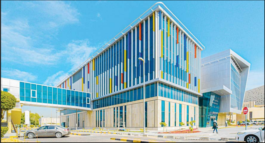
Architectural design of the new facility.

transplants, dialysis, chemotherapy, and post-operative therapies. To enhance patient, staff, and equipment movement, the center is linked to the existing hospital by an elevated causeway. The extension primarily consists of an intensive care unit and dialysis wing, separate floors for male and female wards, an emergency department, diagnostic laboratories, radiology, and an outpatient clinic. The remarkable story of this new center, like many exceptional medical care specialty centers in Kuwait, is that it has been funded and built through the generosity of the caring people of Kuwait. The center's realization came from private donations and was built in collaboration with the Ministry of Health. Kuwait uniquely organizes such exceptional privately funded medical facilities under the guiding care of the Public Committee for Collecting Contributions. The Center includes impressive medical facilities with state-