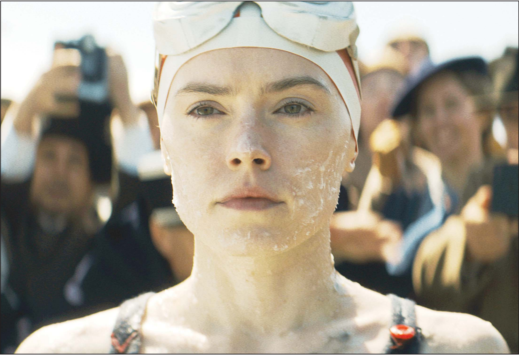
This image released by Disney shows, Daisy Ridley, as Trudy Ederle, in a scene from ‘Young Woman and the Sea.’

room with brick walls. Why keep going back there to celebrate a figure who opposed formality? Frank Oz, the voice of Miss Piggy and Ernie who was Henson’s puppeteering partner in crime for decades, is wonderfully honest about his yin-and-yang relationship with Henson - “it was both a joy and a grind” - as are Henson’s children about their father, who died in 1990. “There’s an honesty and an integrity to what he was creating. He was creating it because he needed to create it,” one says. Another concludes: “He showed that creativity, artistry, metaphor can be used as a great power of good.” There are fascinating moments - like when we learn that Kermit wasn’t originally a frog at all - to ones more sublime, like how Miss Piggy made her dramatic entrance as a star in her own right. (A clip of her flirting with Morley Safer is priceless.) Viewers may shake their head when learning that all the networks initially passed on “The Muppet Show” and it had to be made in England. It’s a documentary, ultimately, about creativity and a singular mind, one who dreamed up a gaggle of friends for life: Big Bird, Cookie Monster, the Count and, of course, Kermit, stitched from an old coat. “Jim Henson Idea Man,” a Disney+ release that starts streaming Friday, is rated TV-PG. Running time: 108 minutes. Three and a half stars out of four.