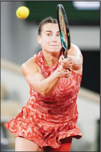
Aryna Sabalenka of Belarus plays a shot against Spain's Paula Badosa during their third round match of the French Open tennis tournament at the Roland Garros stadium in Paris.