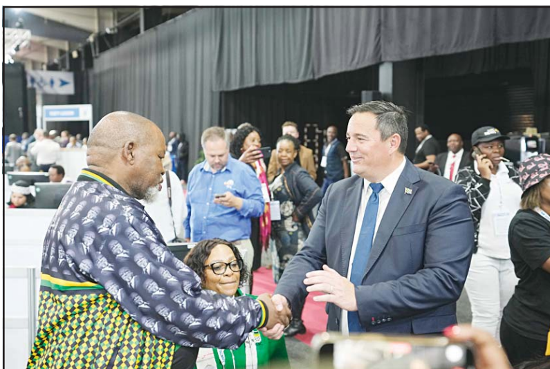
Leader of the main opposition Democratic Alliance John Steenhuisen, (right), shakes hands with ANC’s Chairman. Gwede Mantashe, (left), on a visit to the Results Operation Centre (ROC) in Midrand, Johannesburg, South Africa on May 31.