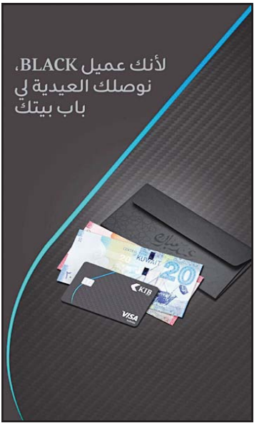
KIB’s Eidiya service for Black segment.

lifestyles. We are fully aware of the importance of making the Eidiya service available for our customers no matter where in Kuwait they are, noting that this initiative is one of many that bring us closer to our community as it allows us to share