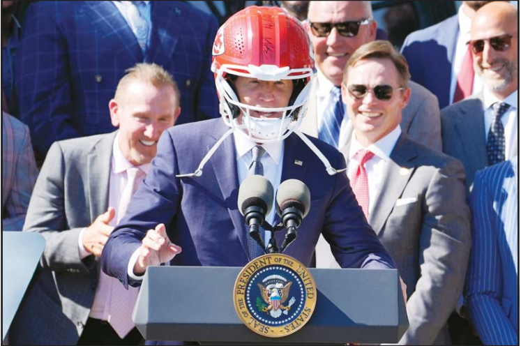
President Joe Biden wears a Chiefs helmet as he speaks during an event with the Super Bowl-champion Kansas City Chiefs on the South Lawn of the White House to celebrate their championship season and victory in Super Bowl LVIII.

WASHINGTON, June 1, President Joe Biden welcomed the Kansas City Chiefs to the White House on Friday, lauding the back-to-back Super Bowl champion team for its sportsmanship on and off the field, and breaking an unofficial political rule about headwear. He tried on a Chiefs helmet the team gave him as a gift. "It was cool to see him put the helmet on," quarterback Patrick Mahomes told reporters after the celebration on the South Lawn. "We didn't expect that." Coach Andy Reid speculated that Biden might have been the first president to wear an NFL helmet. "You all witnessed it. It's history being made," said Reid, who appeared with Mahomes.