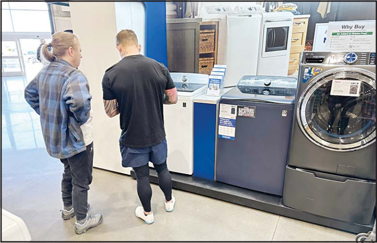
Shoppers consider appliances on display in a Costco warehouse March 6, 2024, in Sheridan, Colo. On Friday, May 31, 2024, the Commerce Department issues its report on consumer spending for April.

Many Americans, particularly lower-income workers, have been pulling back on spending as they struggle to keep up with rising expenses, leading some businesses to rein in prices. In recent weeks, chains including McDonald's, Target and Walmart have announced price reductions or temporary discount deals.