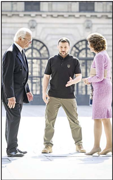
Sweden's King Carl Gustaf and Queen Silvia meet Ukrainian President Volodymyr Zelenskyy outside Stockholm Palace, in Stockholm, Sweden on May 31. (AP)

Boeing agreed in 2021 to pay $2.5 billion - mostly compensation to airlines - to avoid prosecution on a fraud charge. Relatives of some of the 346 people who died in the 2018 and 2019 crashes have tried ever since to scuttle the settlement. (AP)