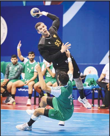
A file photo of Al-Arabi and Al-Qadisiya players in action.

Meanwhile, Kazma is determined to reclaim second place in what has become a closely contested battle between the two teams. The competition for the runner-up position has been likened to a “game of chairs,” with both teams vying for dominance. In other matches today, fifth-placed Al-Arabi (23 points) will face league leaders Kuwait (36 points) at 6:00 pm, followed by a clash between fourth-placed Al-Salmiya (25 points) and sixth-placed Burgan (18 points) at 7:30 pm. These matches will take place at the Sheikh Saad Al-Abdullah Complex. In the previous round held two days