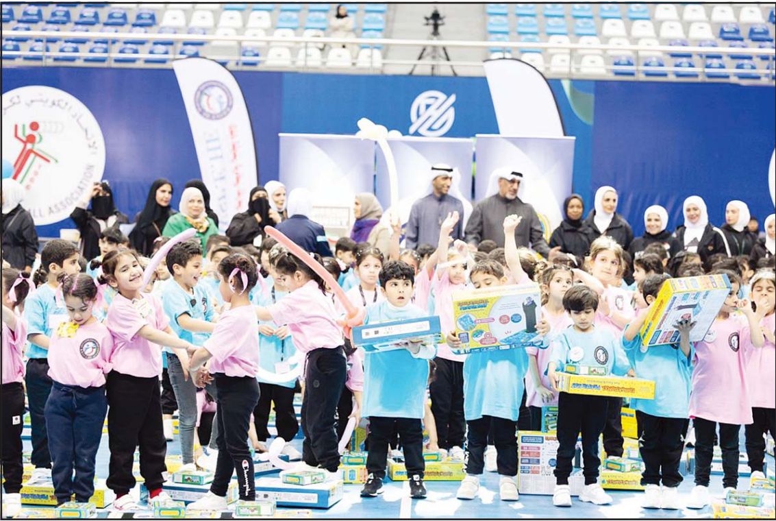
A file photo of school kids displaying their prizes.