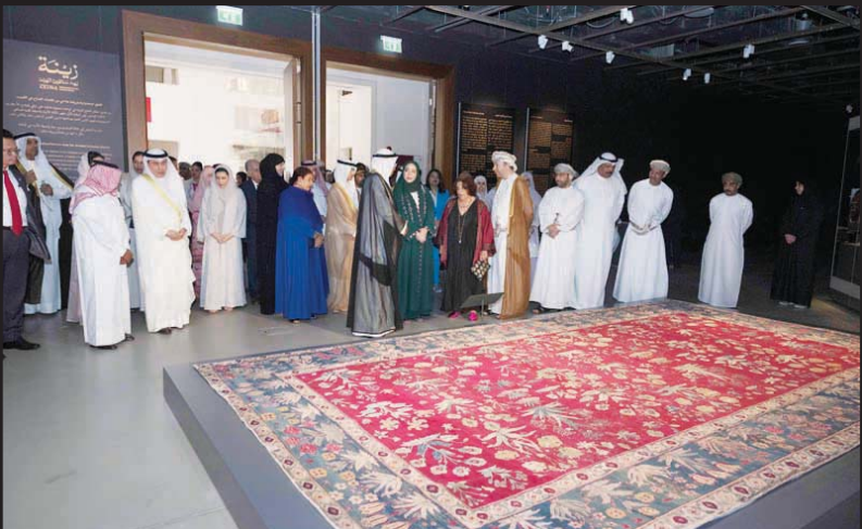
Some photos from the 'Zeina' exhibition in Oman.