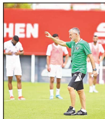
Kuwait coach supervises the Blues training session.

BANKOK, June 1: The Kuwaiti national team is currently undergoing training sessions at STP Stadium in Bangkok, Thailand, as part of its preparatory camp which commenced last Wednesday. It is set to depart for the Indian city of Kolkata the day after tomorrow, Tuesday, to face the India next Thursday in the fifth round of the