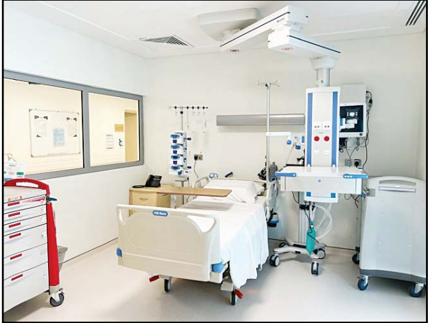
Facilities with state-of-the-art medical equipment.