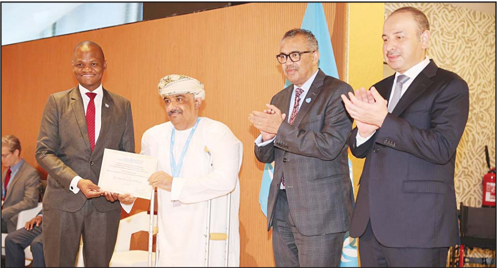
A memorial photo featuring the recipients of the prestigious award in memory of the late His Highness the Amir of the State of Kuwait, Sheikh Sabah Al-Ahmad Al-Jaber Al-Sabah, may he rest in peace, for their outstanding research contributions in elderly healthcare and health promotion in the year 2024.