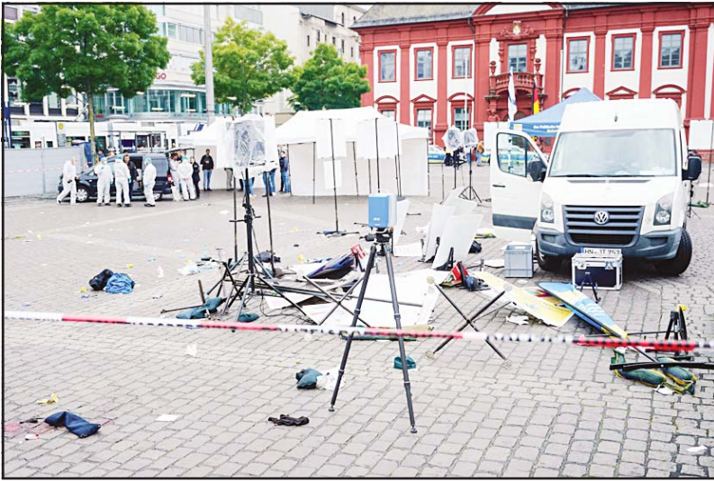
Forensics officers stand behind a smashed stall on the market square in Mannheim, Germany on May 31. An assailant with a knife attacked and wounded several people in a central square in the southwestern German city of Mannheim on Friday, police said. Police shot the attacker, who also was hurt.

'Defendants must be released': A federal appeals court on Friday upheld a ruling that Oregon defendants must be released from jail after seven days if they don't have a defense attorney. In its decision, the 9th US Circuit Court of Appeals called Oregon's public defense system a "Sixth Amendment nightmare." OPB reported, referring to the part of the US Constitution that guarantees people accused of crimes the right to a lawyer. The opinion said Oregon is responsible for upholding legal protections for criminal defendants. Oregon has struggled for years to address its public defender crisis. As of Friday, more than 3,200 defendants did not have a public defender, a dashboard from the Oregon Judicial Department showed. Of those, about 146 people were in custody, but fewer people were expected to be impacted by Friday's ruling, according to OPB. An Office of Public Defense Services draft report from March found that Oregon needs 500 additional attorneys to meet its obligations, OPB reported. State officials have sought to address the issue, including by taking such steps as providing additional funding, but structural issues remain.