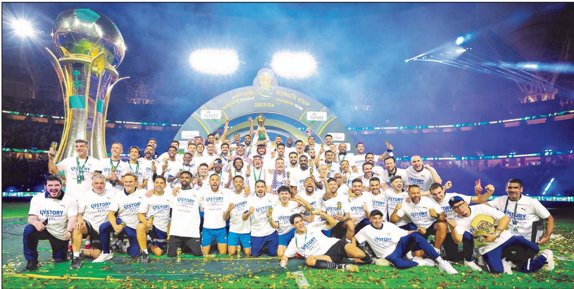
The winners of the King's Cup Al Hilal.