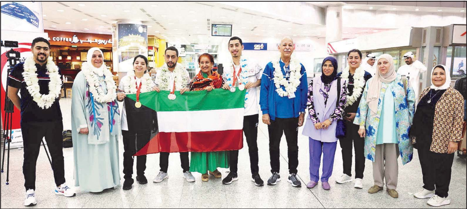
The Special Olympics badminton delegation.

The delegation of the Kuwait badminton team for the disabled received a distinguished reception after winning three medals (gold, silver, and bronze) at the Gulf Badminton Competition for the Special Olympics. This event was organized by the UAE Special Olympics in collaboration with the Regional Presidency of the Special Olympics for the Middle East and North Africa and supervised by the International Federation of Badminton.