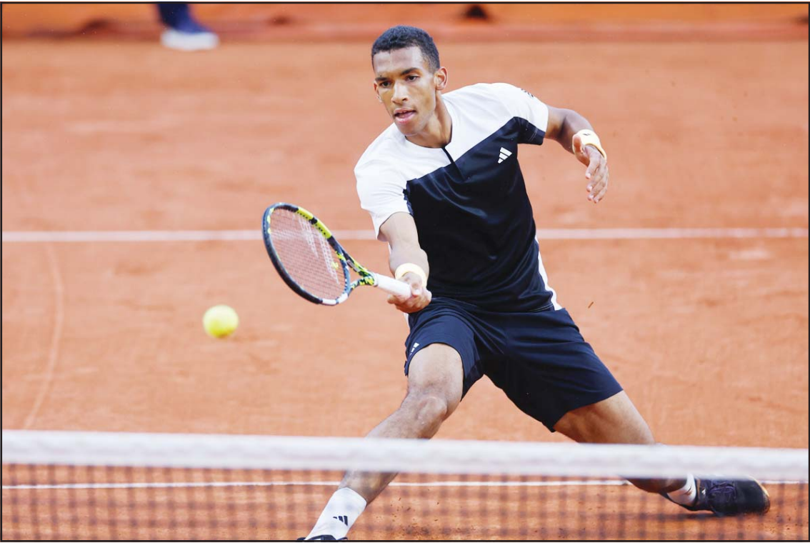
Canada’s Felix Auger-Aliassime plays a shot against Ben Shelton of the U.S. during their third round match of the French Open tennis tournament at the Roland Garros stadium in Paris.