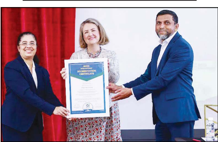
A photo from the event.