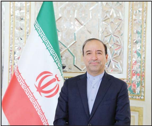
Mohammad Toutounchi, Ambassador of the Islamic Republic of Iran to the State of Kuwait.