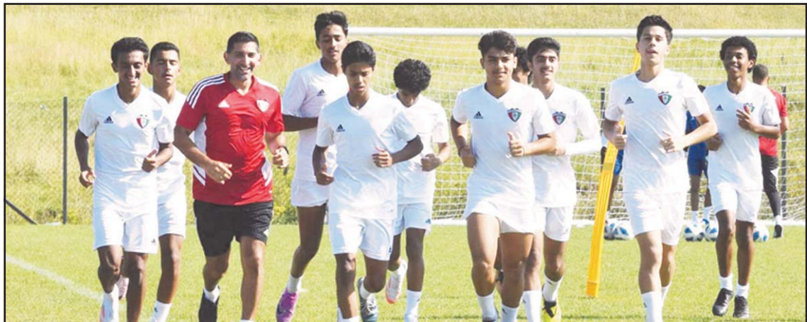
Players intensify training session.

BELGRADE, July 6: The Kuwaiti U-17 national team has commenced training at its external camp in Serbia, in preparation for the Asian Junior Cup qualifiers.