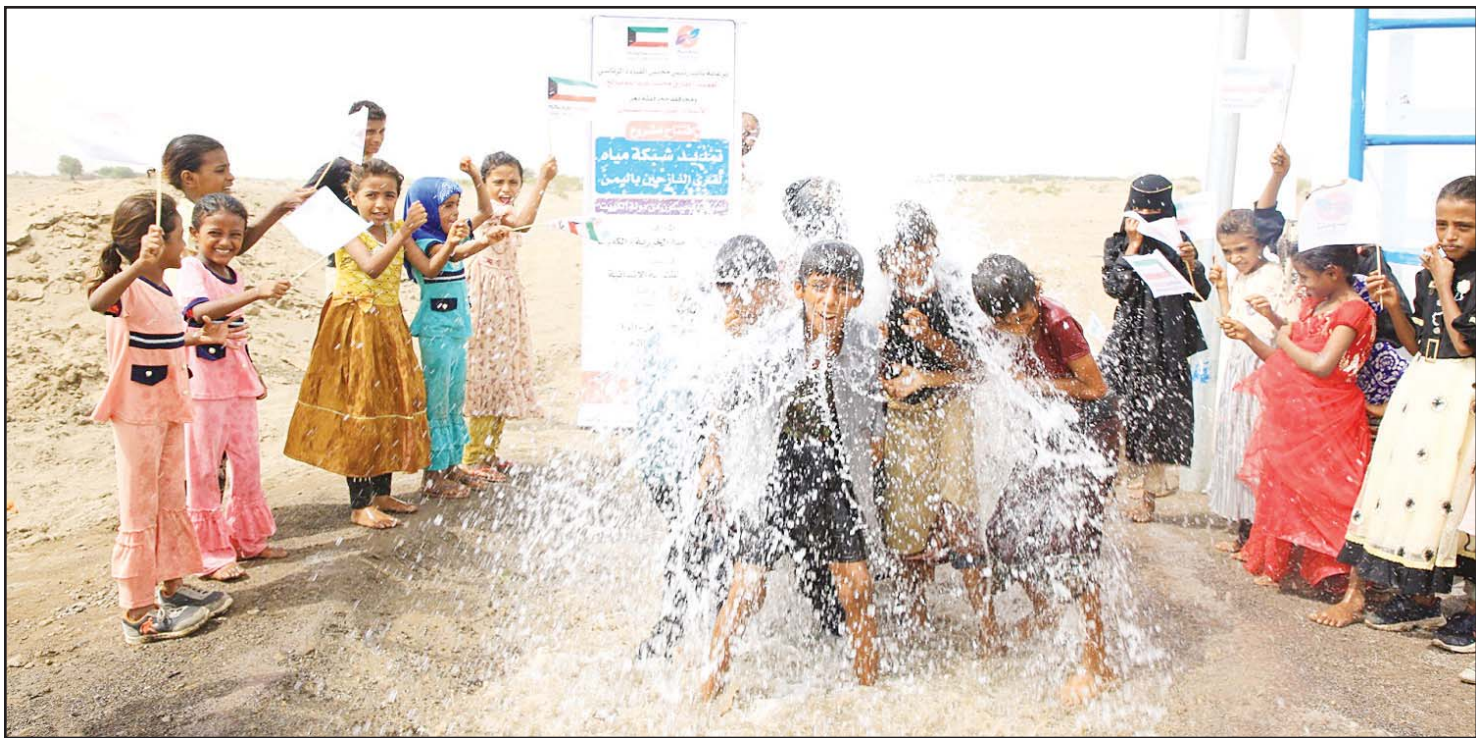
Yemeni children celebrate the launch of a Kuwait-funded water project in their village.

of Defense and Interior Sheikh Fahad Al-Yousuf Al-Sabah issued a decision regulating the transfer of domestic workers (Visa 20) to the private sector (Visa 18).