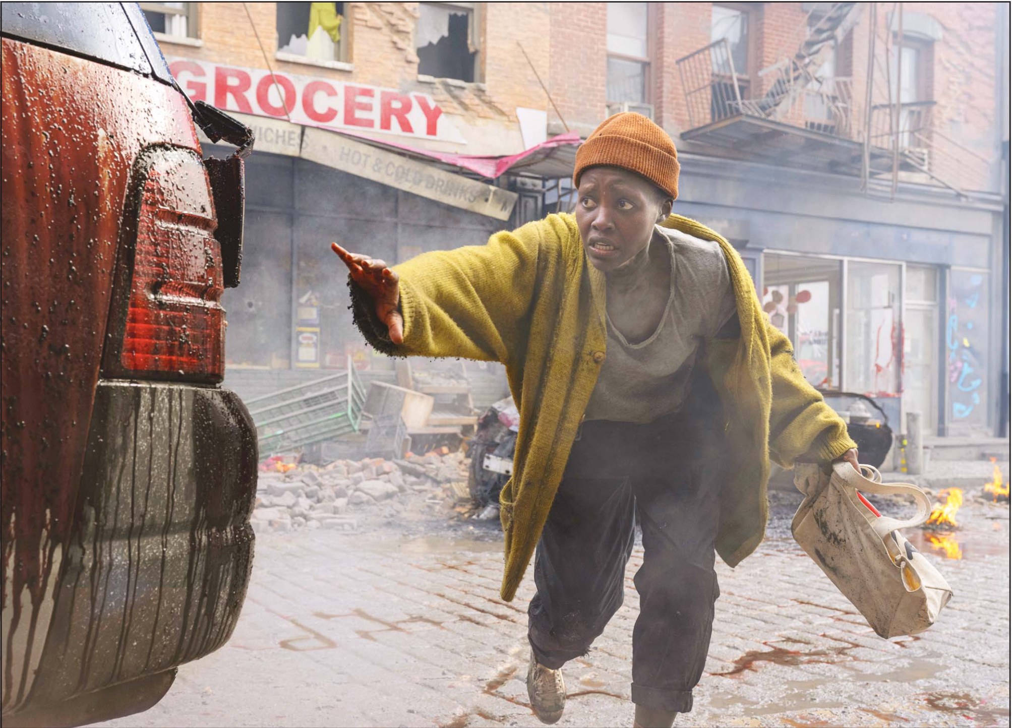
This image released by Paramount Pictures shows Lupita Nyong'o in a scene from 'A Quiet Place: Day One.'