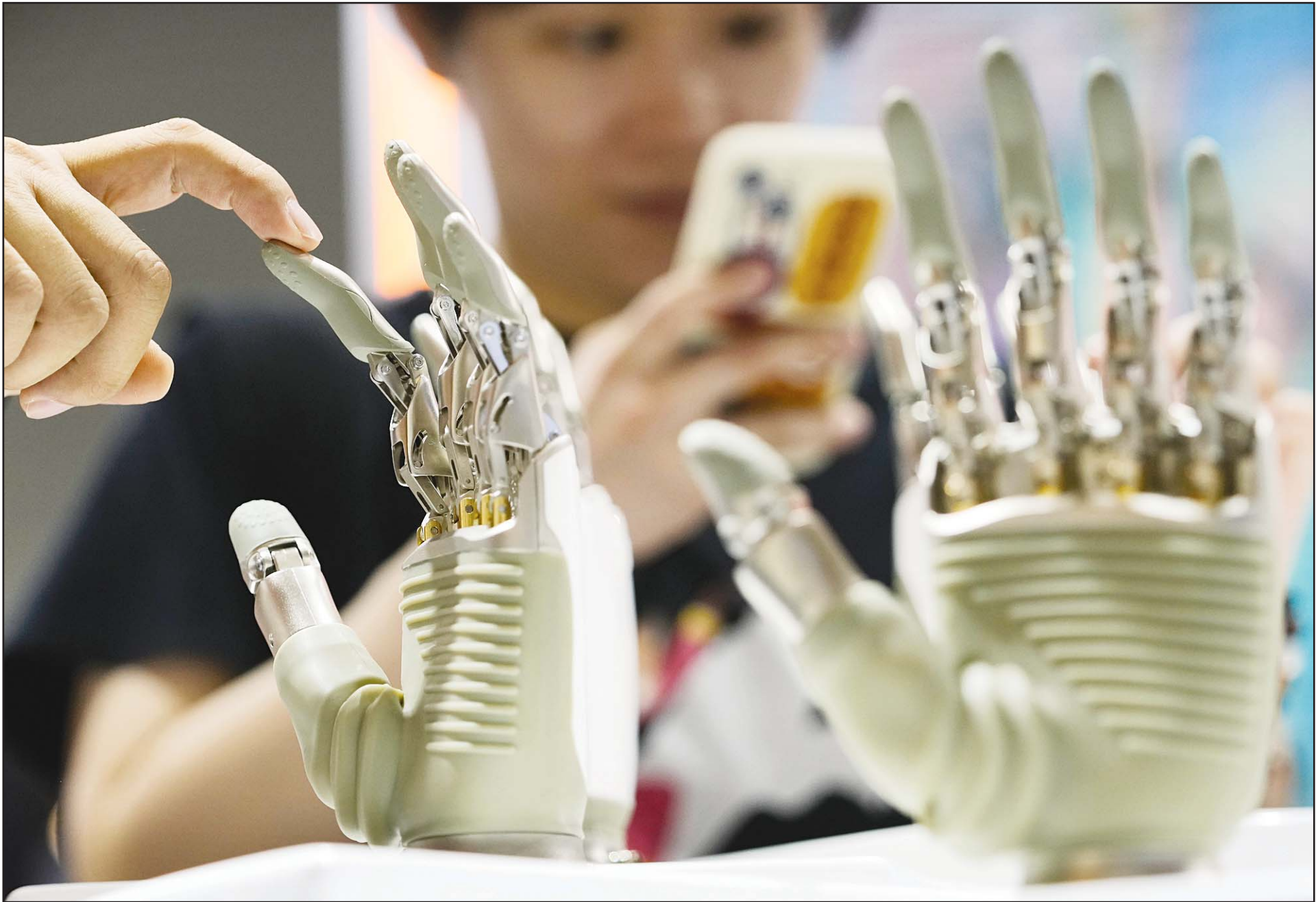
A visitor touches a humanoid robot hand on display at an AI exhibition booth during The World Artificial Intelligence Conference & High-Level Meeting on Global AI Governance, in Shanghai, China, July 4, 2024.

‘ Disabled people are well experienced in receiving and giving social and technical assistance, which makes them a valuable source of insight into how everyone might relate to AI systems in the future. ’