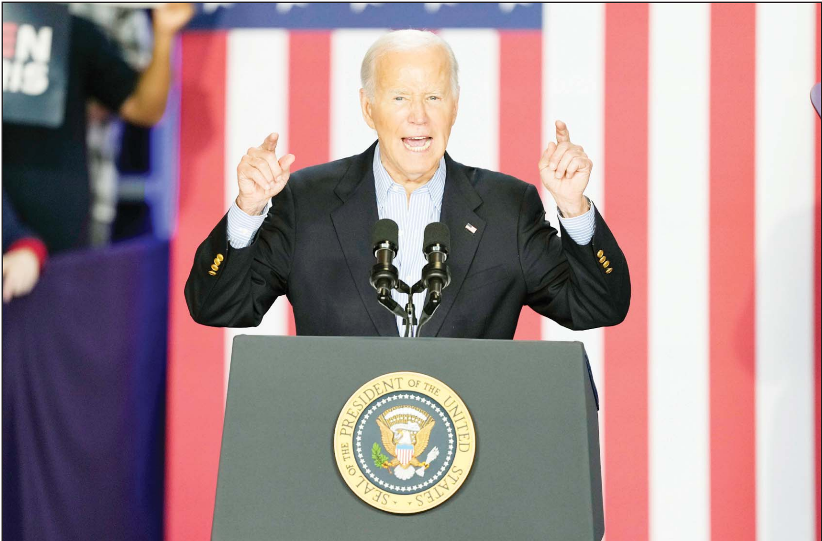
US President Joe Biden speaks at a campaign rally at Sherman Middle School in Madison, Wisconsin on July 5.

The Hungarian prime minister, widely seen as having the warmest relations with Vladimir Putin among all European Union leaders, has routinely blocked, delayed or watered down EU efforts to assist Kyiv and impose sanctions on Moscow for its actions in Ukraine.