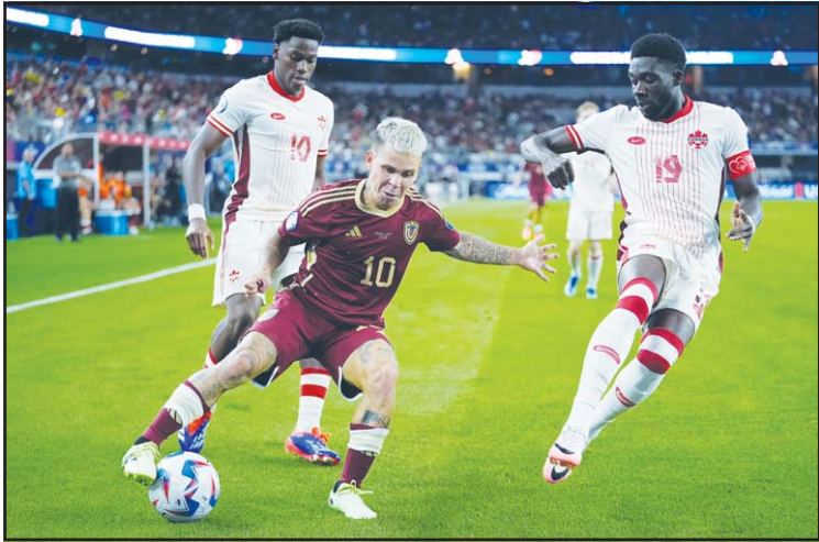
Venezuela’s Yeferson Soteldo, (center), controls the ball against Canada’s Jonathan David, (left), and Alphonso Davies (19) during a Copa America quarterfinal soccer match between Venezuela and Canada in Arlington, Texas.

Shaffelburg scored on an assist from Jonathan David after David scored Canada’s previous goal in a 1-0 victory over Peru on a helper from Shaffelburg, who right-footed a pass from David between the right post and Romo. After scoring, Shaffelburg held over his head the No. 17 jersey of Tadjon Buchanan, who broke the tibia in