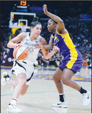
Las Vegas Aces guard Kelsey Plum (10) drives against Los Angeles Sparks guard Aari McDonald during the second half of a WNBA basketball game in Los Angeles.

Las Vegas scored 15 of the first 19 fourth-quarter points to make it 75-74 and give the Aces their first lead of the second half with 5:44 to play. Hamby grabbed an offensive rebound off a missed 3 by McDonald and made the putback to make it 81-81 with 2:01 to play but Los Angeles coach Curt Miller was called for a technical foul and Kelsey Plum hit the free throw to put Las Vegas back in front. Hamby made 1-of-2 free throws with 37 seconds left to tie it 82-all and Wilson made a layup with 15 seconds left before Talbot scored in the lane with about 3 seconds left in regulation to force OT. Sky 88, Storm 84 In Seattle, Chennedy Carter scored a season-high 33 points and rookie Angel Reese extended her WNBA record for consecutive games with a double-double to 12 to help the Chicago sky beat the Seattle Storm. Carter shot 15 for 24 and Reese finished with a career-high 27 points and 10 rebounds. Reese, who went into the game leading the WNBA in rebounds (11.8 per game) and offensive rebounds (4.8), made 8 of 13 from the field, 2 of 2 from 3-point range and 9 of 10 from the free-throw line - including 4 of 4 in the final 20 seconds. Reese hit a 3-pointer that gave Chi-