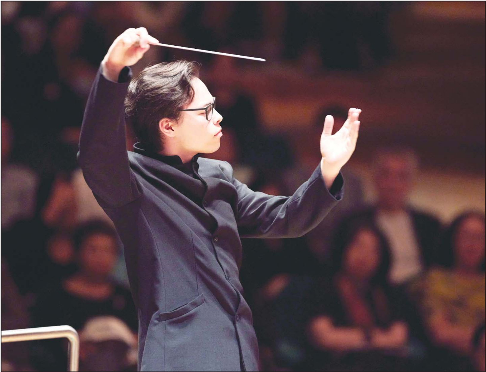
This image released by the Hong Kong Philharmonic shows Tarmo Peltokoski, who was hired Thursday to succeed Jaap van Zweden as music director of the Hong Kong Philharmonic.