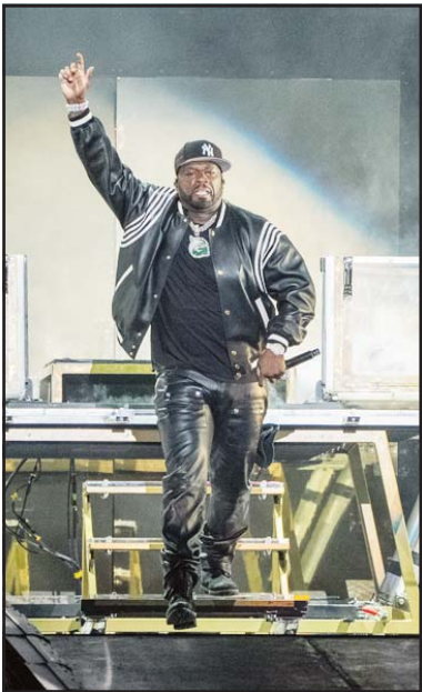
50 Cent performs during Festival d’ete de Quebec on Friday, July 5, 2024, in Quebec City.

“The musicians feel he gives them a lot more freedom to achieve the common goal,” Fohr said, “where Jaap expects from everybody to be 100% following his speed and his instructions.”