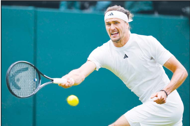
Alexander Zverev of Germany plays a forehand return to Cameron Norrie of Britain during their third round match at the Wimbledon tennis championships in London.

LONDON, July 6, Alexander Zverev overcame a knee problem, a marathon tiebreaker and nerves from seeing one of his sporting idols in the Royal Box in order to book a spot in Wimbledon’s fourth round. Zverev beat Cameron Norrie - the last British man in the tournament - 6-4, 6-4, 7-6 (15) on Saturday after converting his sixth match point in the tiebreaker on Centre Court. He’d needed treatment several times on his left knee following a tumble in the second set. He was also a bit starstruck from seeing