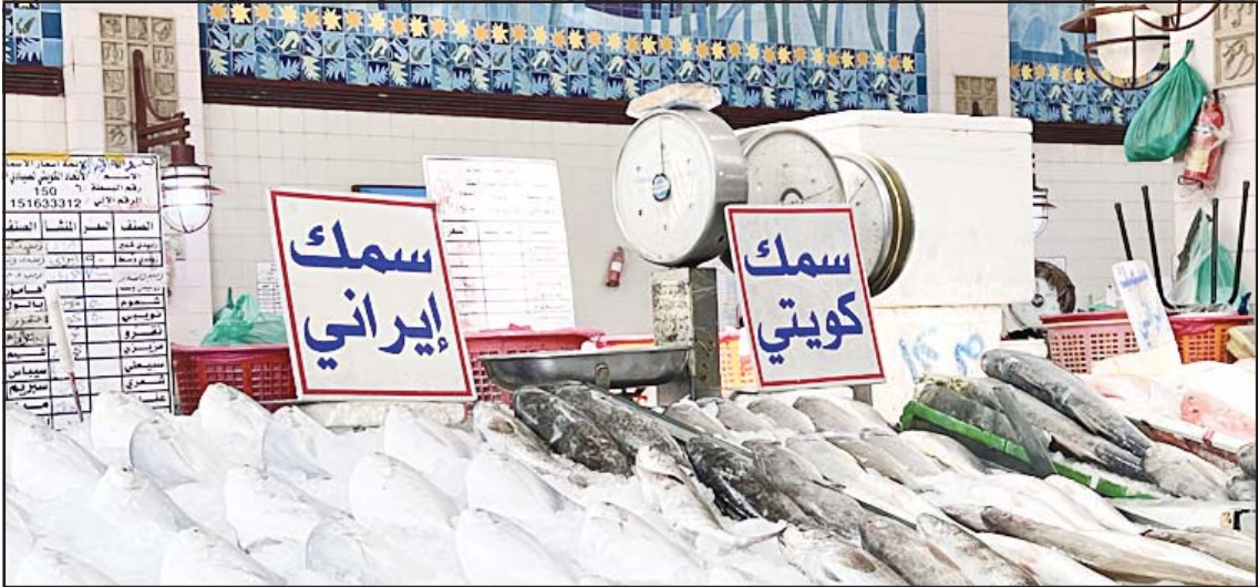
Fish prices at the Sharq Market Center.

The two officials, who spoke on conditions of anonymity to discuss the ongoing negotiations, said Washington’s phased deal will first include a “full and complete” six-week cease-fire that would see the release of a number of hostages, including women, the elderly and the wounded, in exchange for the release of hundreds of Palestinian prisoners. During these 42 days, Israeli forces would also withdraw from densely populated areas of Gaza and allow the return of displaced people to their homes in northern Gaza, the pair said. Over that period, Hamas, Israel and the mediators would also negotiate the terms of the second phase that could see the release of the remaining male hostages, both civilians and soldiers, the officials said. In return, Israel would free additional Palestinian prisoners and detainees. The third phase would see the return of any remaining hostages, including bodies of dead captives, and the start of a yearslong reconstruction project. Hamas still wants “written guarantees” from mediators that Israel will continue to negotiate a permanent cease-fire deal once the first phase goes into effect, the two officials said.