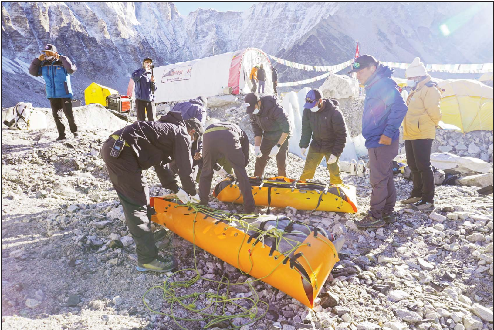
This image provided by the Peak Promotion shows recovered bodies of climbers being prepared to be airlifted from Everest base camp in Nepal on May 29. The Nepal government-funded team of soldiers and Sherpas removed 11 tons (24,000 pounds) of garbage, four dead bodies and a skeleton from Everest during this year's climbing season.

Following military coups in all three nations in recent years, the ruling juntas have expelled French forces and have sought military help instead from Russia's mercenary units, such as the private security company Wagner and its likely successor, Africa Corps.