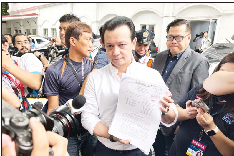
Former Sen. Antonio Trillanes holds documents to reporters after filing at the Department of Justice in Manila, Philippines on July 5. Trillanes filed criminal complaints of economic plunder against ex-president Rodrigo Duterte Friday over alleged anomalies in the awarding of large numbers of government infrastructure projects worth billions of pesos (millions of dollars) to two companies when he was a southern city mayor and later as president.

As expected, Omar García Harfuch - who served as Mexico City police chief when Sheinbaum was mayor - was appointed to head Mexico's increasingly powerless Pub-