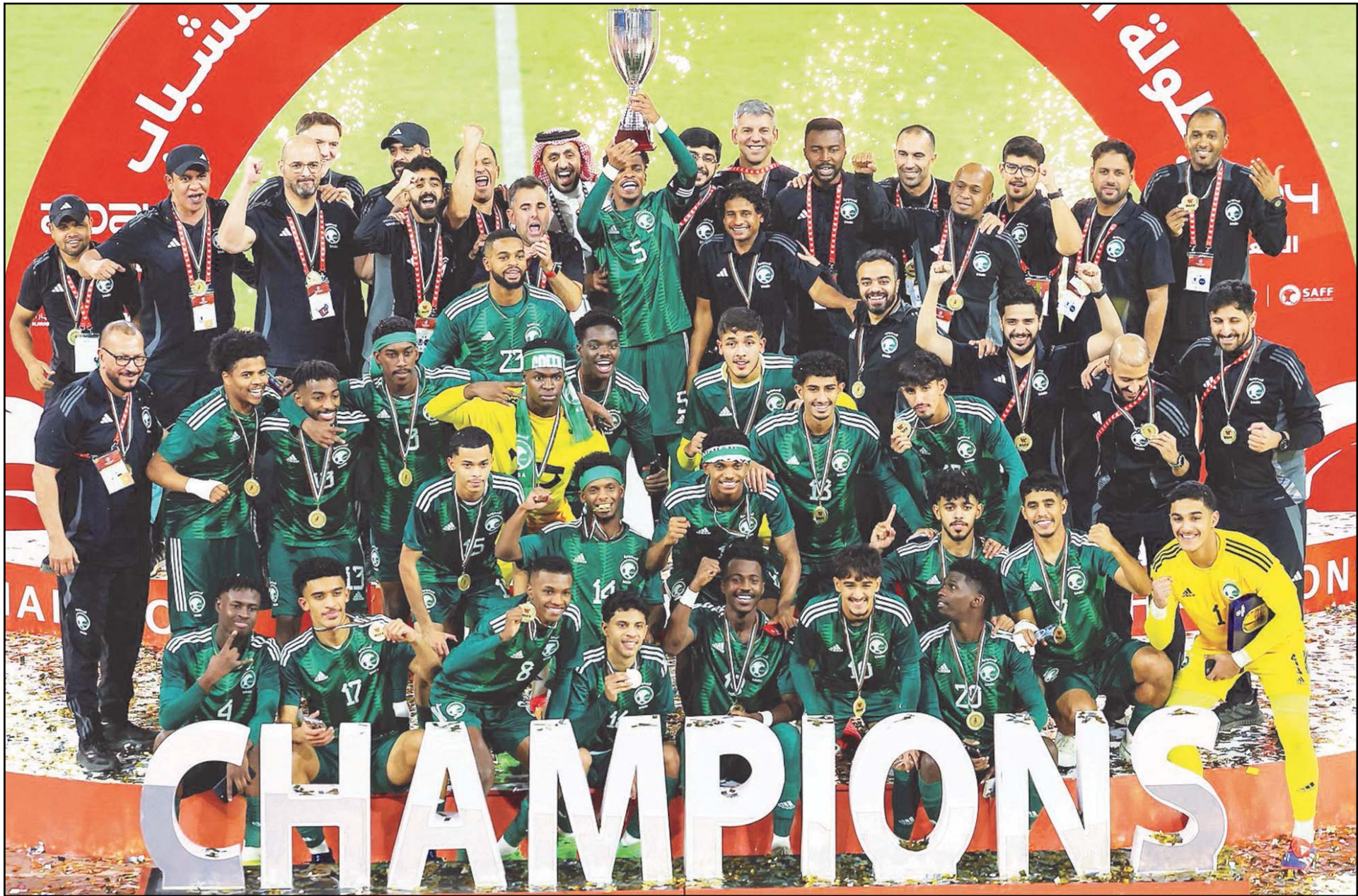
The victorious Saudi team celebrates on the podium.

TAIF, July 6: The Saudi national team clinched the "West Asia Youth" Championship by defeating the UAE 1-0 at the King Fahd Sports City Stadium in Taif.