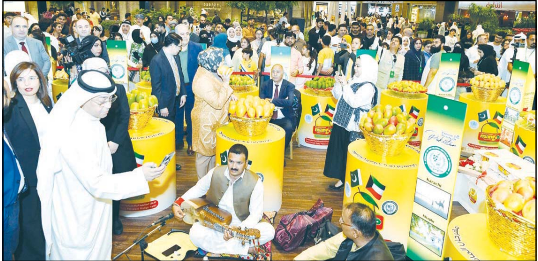
Top and above: Some photos from the Pakistani Mango Festival.