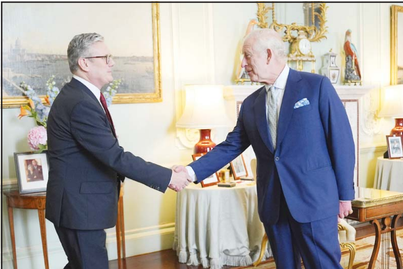
Britain’s King Charles III, (right), shakes hands with Keir Starmer following the landslide general election victory for the Labour Party, in London on July 5. Britain’s new prime minister vowed on Friday to reverse the hopelessness that grew over 14 years of Conservative rule and said he would lead an urgent mission of national renewal.

Man pleads guilty to murder: Less than a week after an Arizona man reported his wife missing, launching an expansive search that quickly turned into a criminal