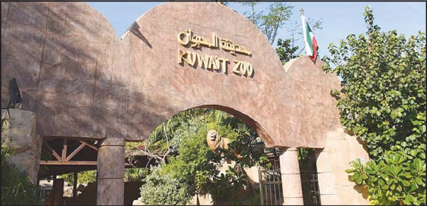
Kuwait Zoo entrance.

The Municipality has stressed the need for citizens and expatriates to fully cooperate with the field teams to address violations and guarantee strict compliance with the law.