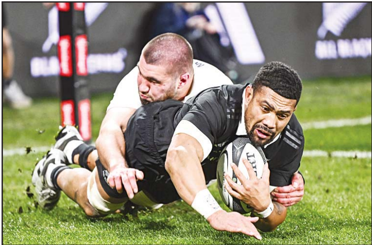
New Zealand's Ardie Savea, (right), scores a try against England during their rugby union test match in Dunedin, New Zealand.

half with accurate kicks from Alex Mitchell and Marcus Smith and with fast, flat defense. New Zealand handled often but inside its own territory.