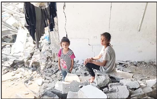
This image from video shows children sitting amongst rubble in Yarmouk Sports Stadium Friday, July 5, 2024 in Gaza City, Gaza Strip. Yarmouk Sports Stadium, once Gaza's biggest soccer arena, is now sheltering thousands of displaced Palestinians who are scraping by with little food or water.