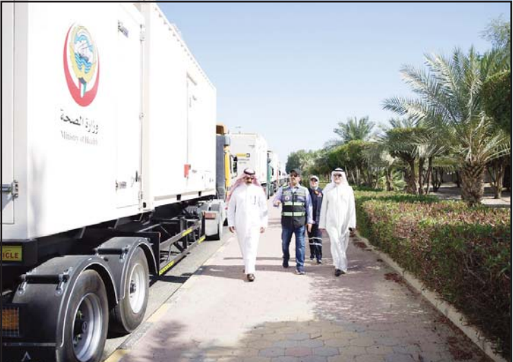
Ministry of Health mobile generators for emergency use.

and use of modern equipment will be confirmed during implementation. In addition, sources said the Ministry of Public Works has developed 520 services and is moving steadily towards comprehensive digital transformation to improve its services. It has prepared a comprehensive ‘Business Manual’ (business guide) for all stages of its projects -- from the presentation of the idea up to the final handover. They said the ‘Business Manual’ is a tool for ensuring smooth digital transformation such that transactions and procedures are completed in a swift and accurate manner. They added the ministry’s projects will be monitored and followed up online under the new system that will be implemented soon. They also affirmed that the ministry is keen on strengthening infrastructure and guaranteeing proper maintenance, while focusing on the digital transformation of all sectors.