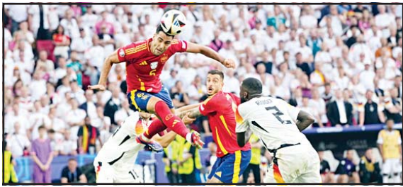
Spain's Mikel Merino (6) scores his side's second goal during a quarter final match between Germany and Spain at the Euro 2024 soccer tournament in Stuttgart, Germany.