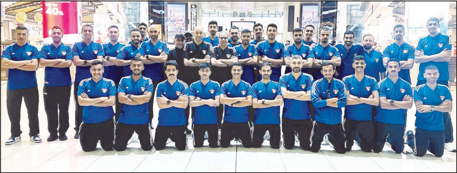
Kuwaiti referee delegation.