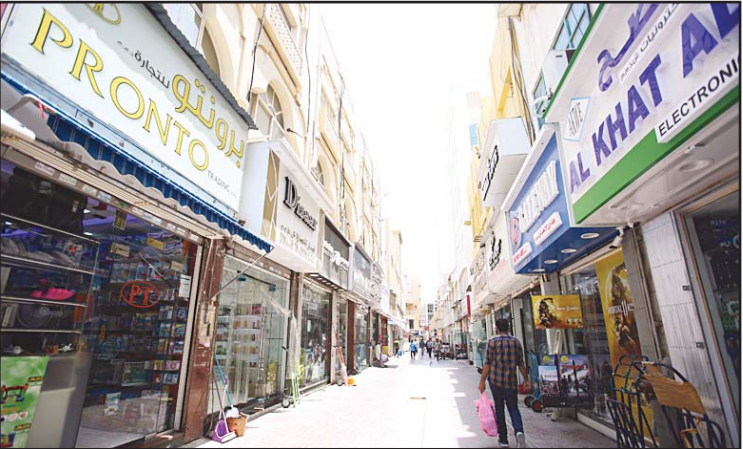
Marshad Market in Dubai includes many facilities and shops that are important to all residents and visitors of the emirate.