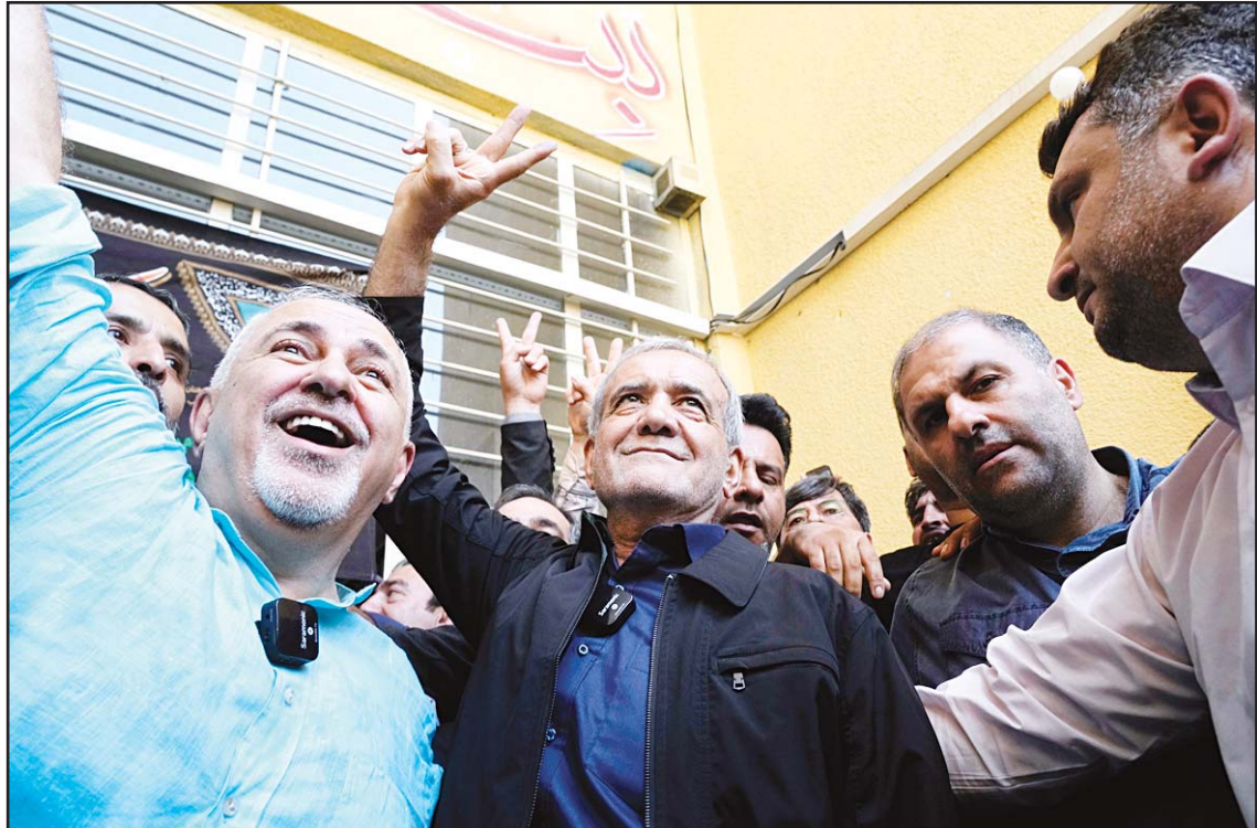
Reformist candidate for Iran's presidential election Masoud Pezeshkian, center, flashes a victory sign after casting his vote as he is accompanied by former Foreign Minister Mohammad Javad Zarif, left, at a polling station in Shahr-e-Qods near Tehran, Iran, Friday, July 5, 2024.