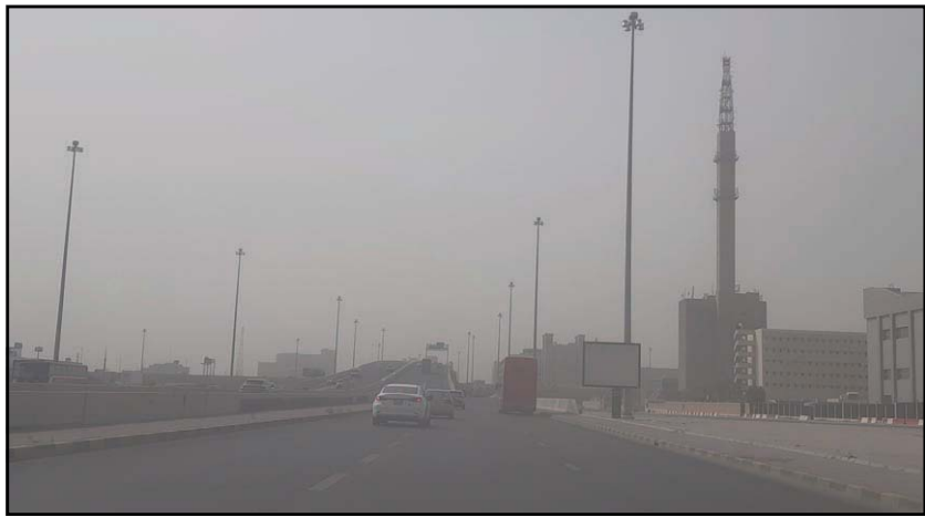
Kuwait witnessed very hot weather during the day with light to moderate freshening at times northwesterly wind, with speeds of 12-45 km/h with rising dust, which reduced the visibility to a few hundred meters.