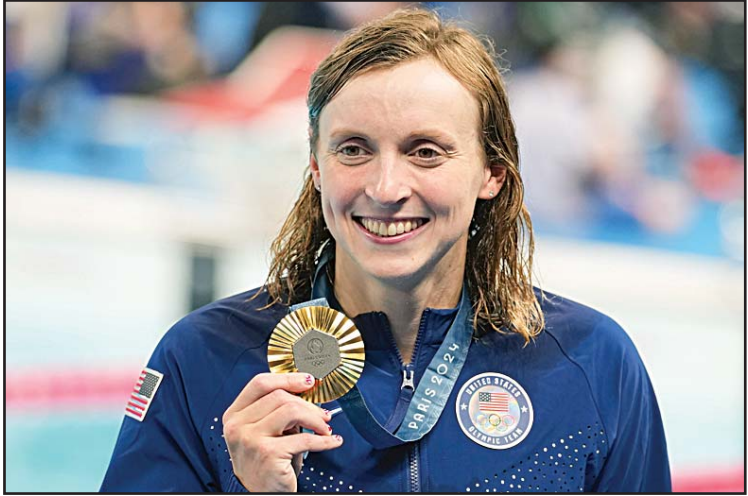
United States' Katie Ledecky celebrates with the gold medal during the awards ceremony for the women's 800-meter freestyle at the Summer Olympics in Nanterre, France.

It is the third doping case announced at the Paris Games.