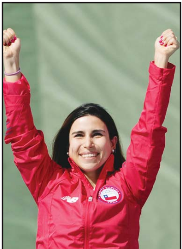
Chile’s Francisca Crovetto Chadid celebrates after winning the gold medal in the Skeet women’s final at the 2024 Summer Olympics in Chateauroux, France.

CHATEAUROUX, France, Aug 4, Chile won its first Olympic gold medal in 20 years when Francisca Crovetto took victory in the women’s skeet, while Britain’s Amber Rutter took silver just over three months after becoming a mother. Crovetto won the gold in a shoot-off, hitting her last two targets for the win after a disputed call to give Rutter a miss for a shot which, TV replays showed, had seemed to clip the target. Crovetto and Rutter had finished equal on 55 out of 60 to force the shoot-off. Crovetto is the first Chilean gold medalist since the 2004 Athens Olympics, when Nicolás Massú won men’s tennis gold in singles and in doubles with Fernando González. Chile had not won an Olympic medal of any kind since 2008 and its only shooting medal was a skeet silver in 1988 for Alfonso de Iruarizaga, when skeet was a mixed-gender event. Rutter reached the Olympic final in Rio de Janeiro in 2016 at the age of 18 and was a favorite for a medal in the pandemic-delayed Tokyo Olympics in 2021 until a positive test for COVID-19 two days before the opening ceremony. Rutter had to abandon her plans to fly to Japan and has spoken of struggling with depression after missing the Olympics. She gave birth in April to a son