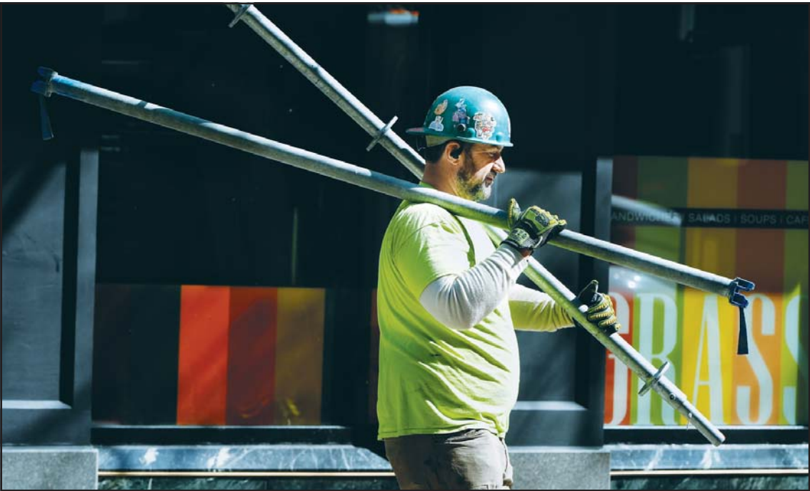
A construction worker carries scaffolding parts on March 14, 2024, in Boston. On Friday, August 2, 2024, the U.S. government issues its July jobs report.