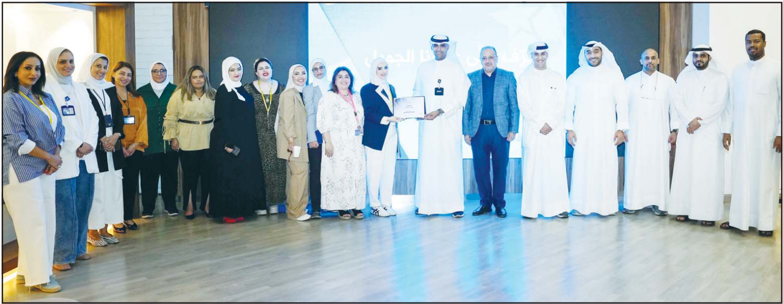
Zain officials with the program's participants.

KUWAIT CITY, Aug 4: Zain hosted a special session for participants of the Media Pathway program, organized by the Integrated Media Academy (IMA). The company shared its expertise in media, public relations, community service, corporate sustainability, and customer service, showcasing its success stories and strategies for effective communication through traditional and digital channels. This initiative aligned with Zain's belief in the significant impact media has on community development and its support of the local media industry. By sharing its expertise, Zain aimed to introduce the program's participants to its experience as one of Kuwait's most socially active private sector organizations. The session provided participants with new insights, skill development opportunities, and enriched the program's overall outcomes. The session took place at the Zain Innovation Campus (ZINC), where the company discussed the strategies it uses to effectively communicate with the community through both traditional and digital channels. Zain also highlighted its social responsibilities, including support