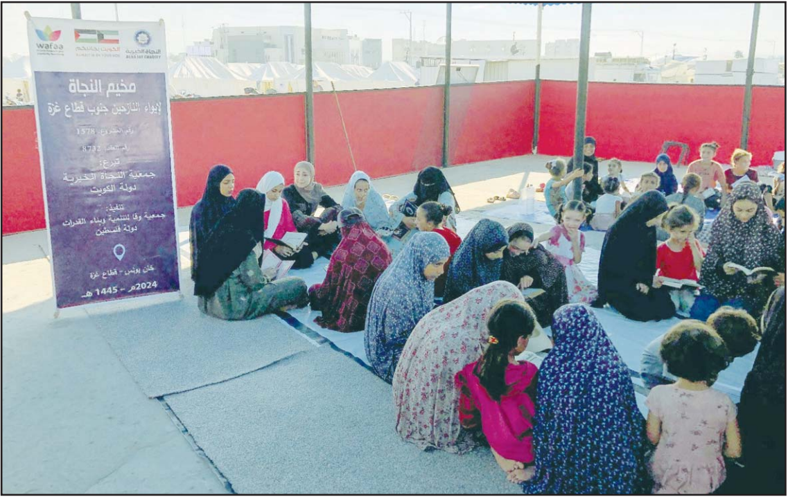
A number of Palestinian families at the Al-Najat Charity camp.

In related news, the Ministry is currently addressing grievances from companies regarding the draft study and detailed design work for the "First Phase" railway tender. This follows the completion and approval of the Technical Tenders Study Committee's report. Once grievances are addressed, the envelopes for companies meeting the tender requirements will be opened. The Central Tenders Committee has confirmed that five companies have met the conditions for the railway tender. The Ministry remains committed to overcoming any obstacles to ensure the successful implementation of the project, which is crucial for supporting the country's economic development goals.