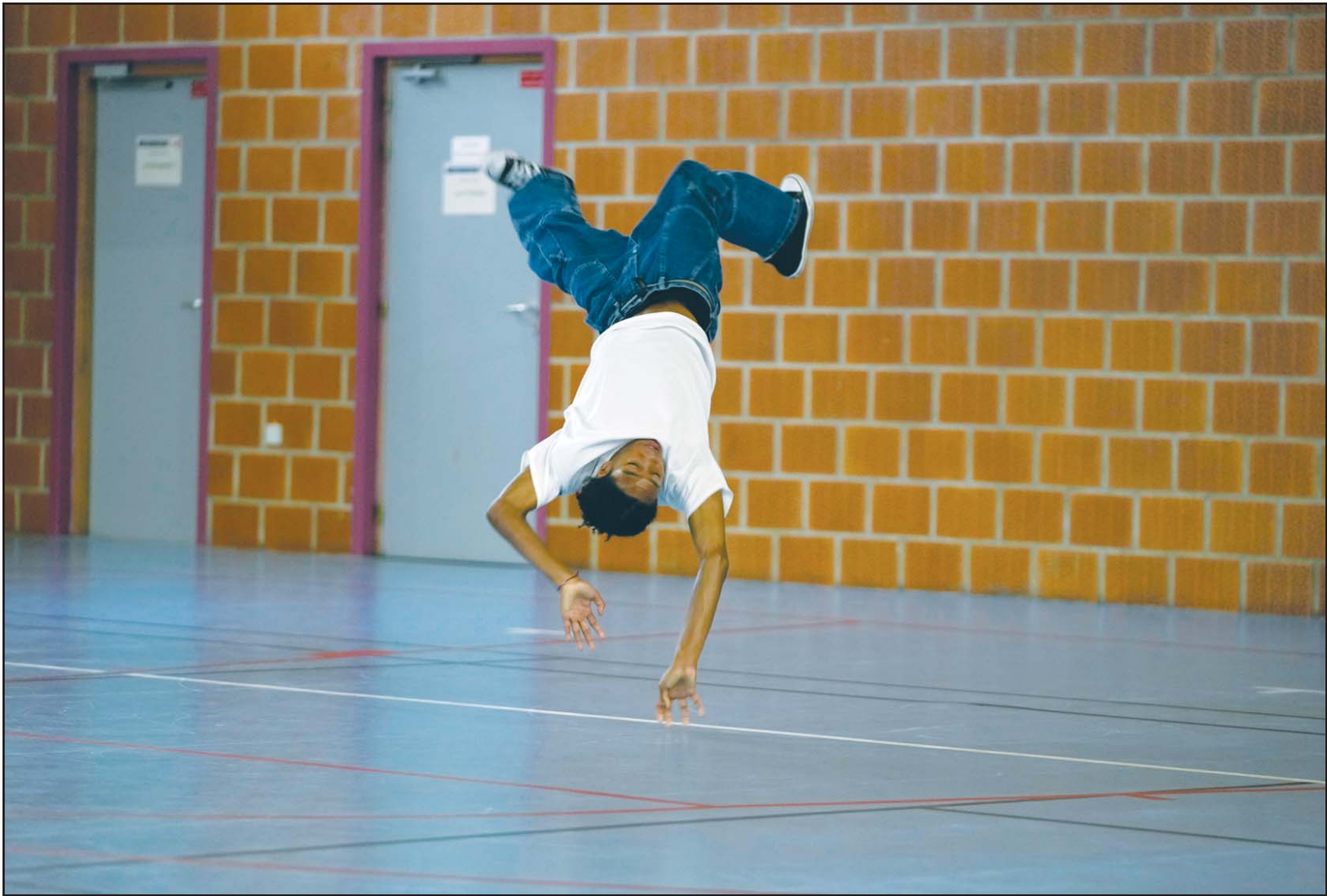
Keith Kanga breakdances in a gymnasium at the 2024 Summer Olympics, Tuesday, July 30, 2024, in Paris, France.

“From cashless payments to traffic guidance systems, almost every aspect of China’s society has been digitized. The streets are clean and the cityscape is beautiful,” he added.