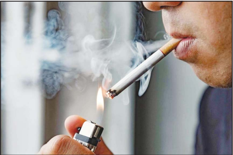
Kuwaiti summer brought an increase in the number of people wishing to quit smoking.