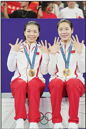
Gold medalists China's Chen Qingchen, (left), and Jia Yifan celebrate on the podium during the medal ceremony for women's doubles badminton at the 2024 Summer Olympics in Paris, France.

Douglass grabbed the silver in the star-studded final at 2:06.92, but the Americans lost the bronze when Walsh, the silver medalist in this event at Tokyo who recorded a time of