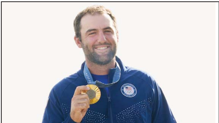
Gold medalist Scottie Scheffler, of the United States, poses with his medal following the medal ceremony for men’s golf during the medal ceremony at the 2024 Summer Olympics, Sunday, Aug 4, 2024, at Le Golf National in Saint-Quentin-en-Yvelines, France.

SAINT-QUENTIN-EN-YVELINES, France, Aug 4, Scottie Scheffler delivered the best performance of his greatest year by rallying from four shots behind on Sunday with a 9-under 62 to win the Olympic gold medal in men’s golf in a thriller at Le Golf National. Already a six-time winner on the PGA Tour this year, including his second Masters title, Scheffler added Olympic gold to an astonishing season with a round that kept some 30,000 fans on edge for a wild final two hours. The world’s No. 1 player had plenty of help. Jon Rahm of Spain had a four-shot lead over Tommy Fleetwood when he stepped on the 11th tee. Fleetwood caught him in two holes as the Spaniard had a stunning collapse.