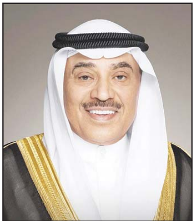
HH the Crown Prince