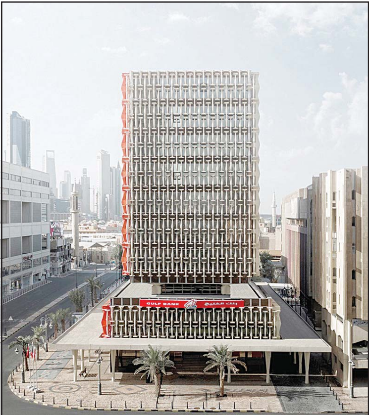
Gulf Bank building