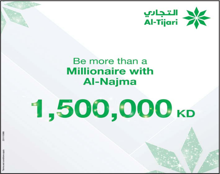
Al Najma account.