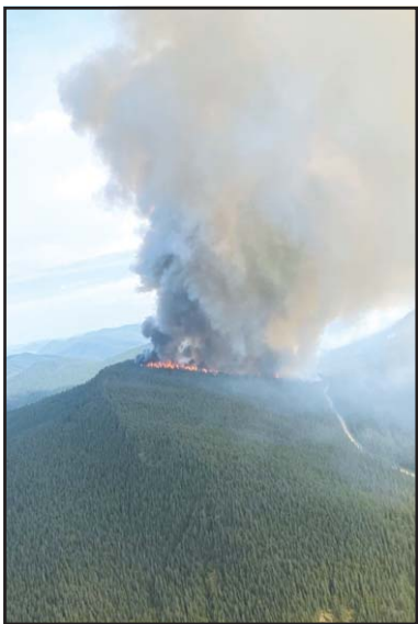
This photo taken on Aug 2, 2024 shows smoke billowing from wildfires in west-central Alberta, Canada.

WISN-TV in Milwaukee reported that the shooting happened outside of a bar.