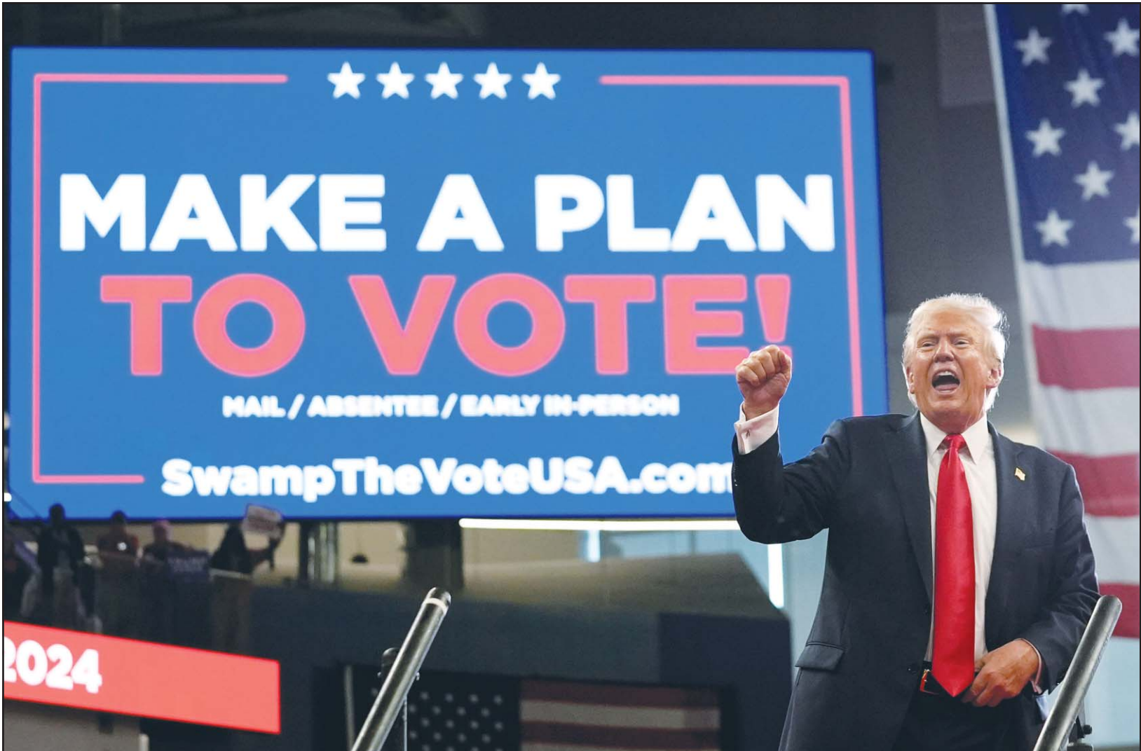
US Republican presidential candidate former president Donald Trump cheers as he departs after speaking at a campaign rally at Georgia State University in Atlanta on Aug 3.