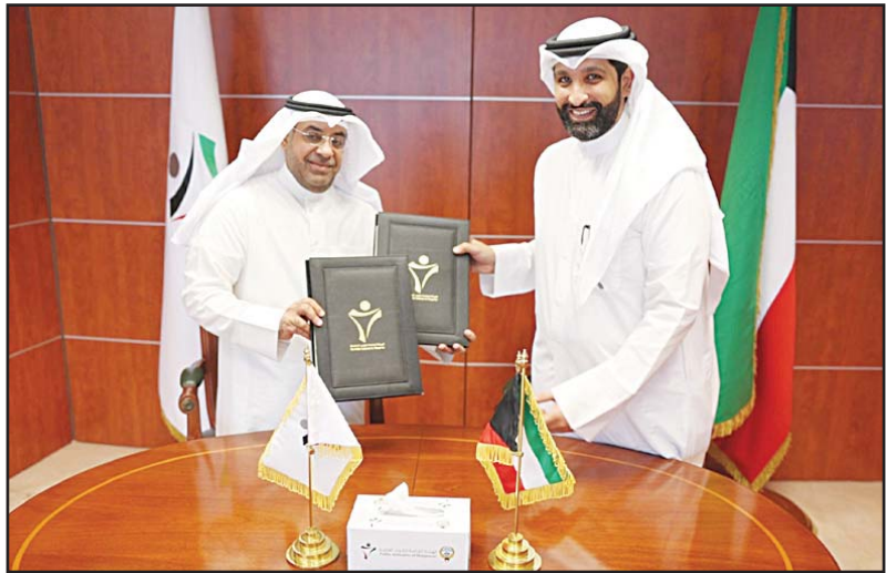
Documents exchanged after signing the agreement.

Al-Ghanim emphasized the need for further governmental action to address these remaining gaps, as ongoing money laundering can lead to increased social disparities, with individuals rapidly amassing wealth under suspicious circumstances.