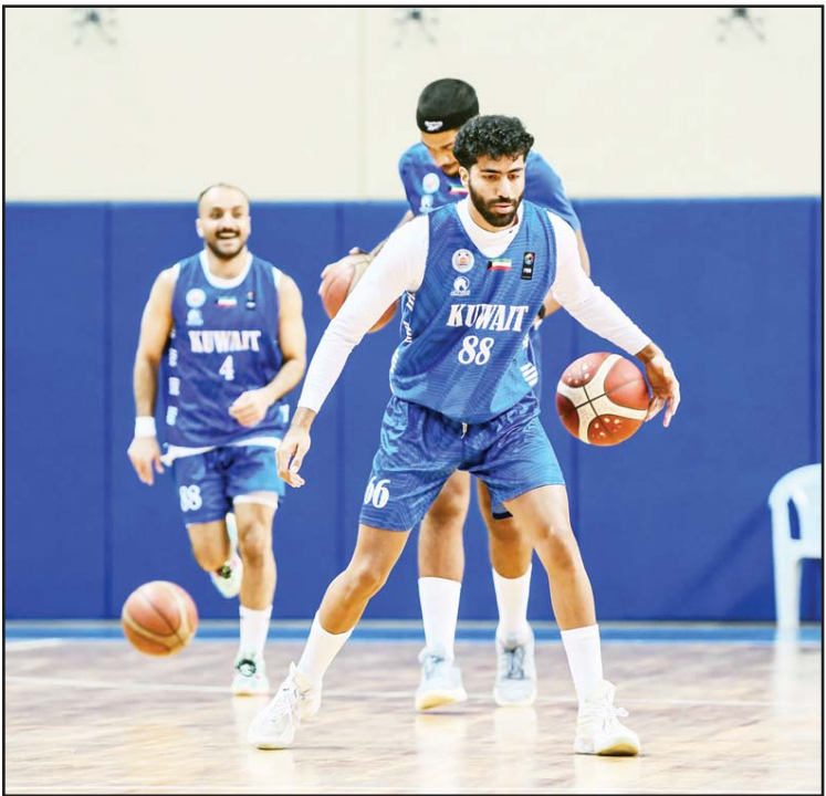
Kuwaiti players practicing.

session saw the attendance of 12 players, while six players were absent due to special circumstances. During the initial phase of preparation, the technical staff focused on enhancing the players’ physical fitness. The second phase will involve an external training camp in Serbia from August 17-31. Before the start of the first local