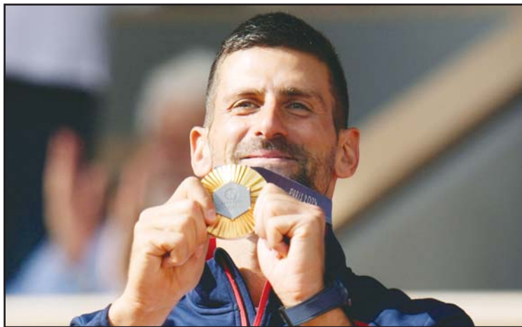
Serbia's Novak Djokovic shows his gold medal after defeating Spain's Carlos Alcaraz in the men's singles tennis final at the Roland Garros stadium during the 2024 Summer Olympics in Paris, France.