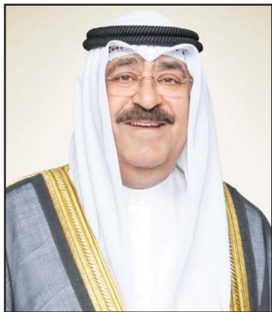
HH the Amir