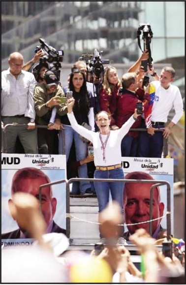
Opposition leader Maria Corina Machado cheers with supporters during a rally in Caracas, Venezuela on Aug 3.