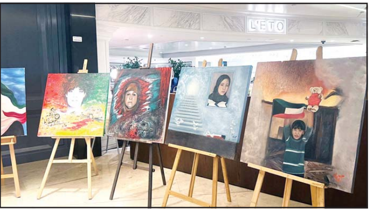
Photos from the event.