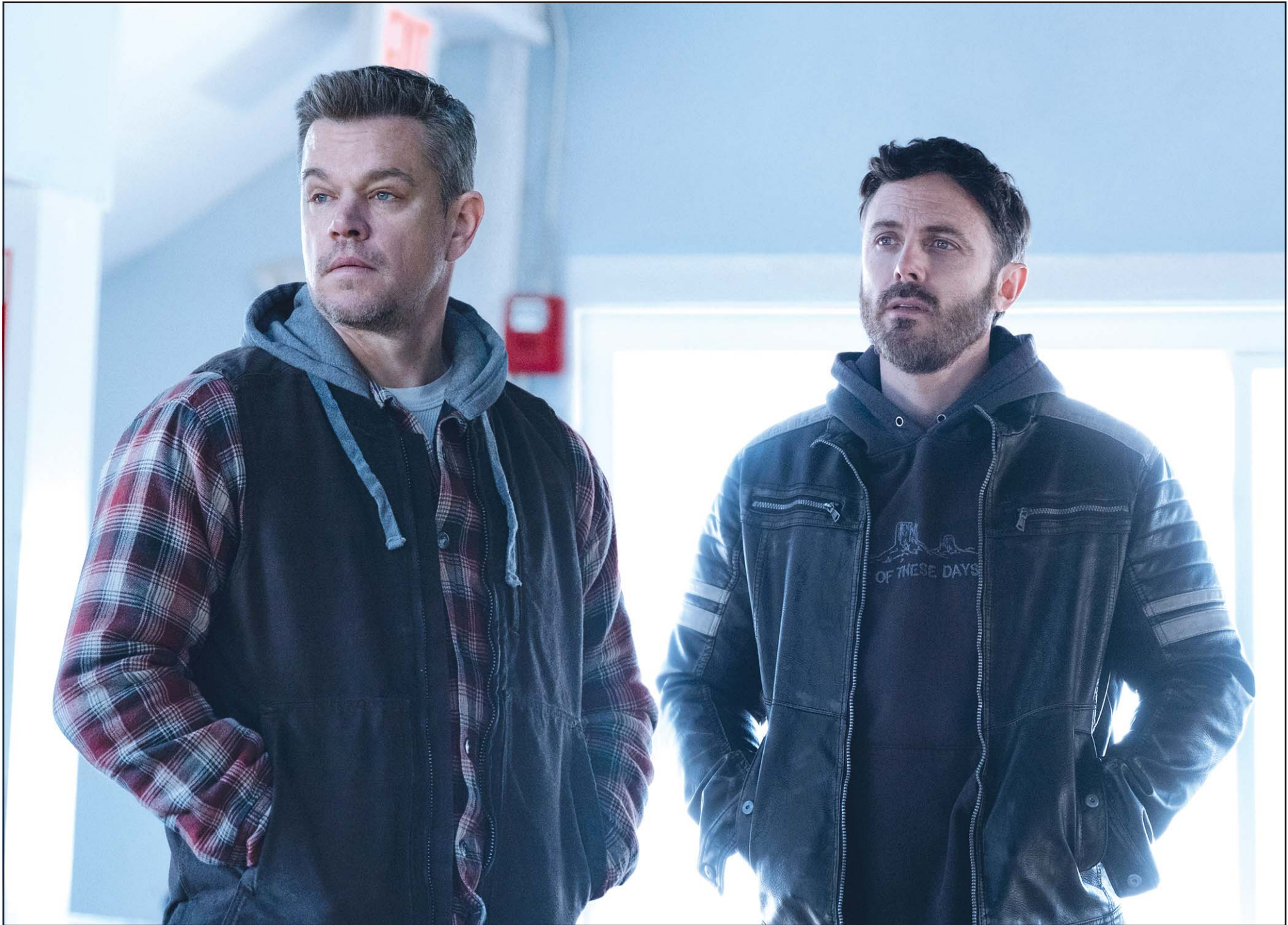
This image released by Apple TV shows Matt Damon, (left), and Casey Affleck in a scene from ‘The Instigators.’