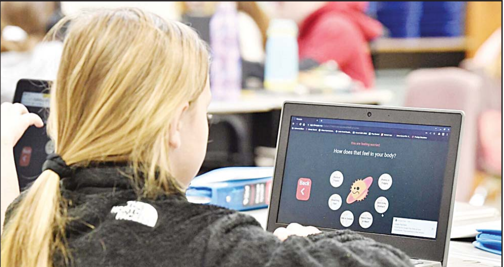
File photo shows a student at Lakewood Elementary School in Cecilia, Ky., uses her laptop to participate in an emotional check-in at the start of the school day on Aug. 11, 2022.

that they won't have friends in school, even though they do have friends from their class last year; or concerns that while they're at school, something extremely unlikely will happen, such as the house being hit by lightning. What's tricky, of course, is that any of these behaviors can be an indication of many different problems, so probe further. Talking to your kids about their thoughts may help you unravel whether they're feeling anxious. Playing outside, playing with friends or even just "hanging out" can be powerful ways to reduce negative feelings. Outdoors, people often feel more relaxed. Playing in an unstructured way - that is, without someone else telling them what or how to play - allows kids to work through their feelings and reduce anxiety. Researchers have found that, post-pandemic, more children are using different types of digital devices, along with more social media apps. The significant body of evidence finding a link between excessive digital device use and anxiety suggests that these