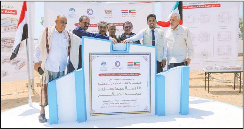
Foundation stone laying for the construction of the Falcon Ghanima Complex in Al-Mahra, eastern Yemen.

participants has reached the maximum allowed for each of the four ships involved. These ships, lowered into the sea on Saturday morning, are a gift from His Highness the late Amir Sheikh Sabah Al-Ahmad. The trip's activities include a "Dashha" Day ceremony on August 10 at 8:30 am on the club's coast, marking the departure of the diving teams from Al-Nawakhatha, Al-Mujamadiyah, and Al-Ghassa as they head to the Al-Khairan area for traditional diving. Media reporters and photographers will have access to cover the trip closely, particularly during a visit to Bandar Al-Safan Diving in Al-Khiran on August 13. The journey will conclude with the "Al-Qaffal" Day ceremony on August 15 at 5:30 pm on the club's coast, celebrating the return of the ships with a large public celebration and presentations of marine arts. Al-Qabandi highlighted the trip's national significance and the high level of parental care and popular interest it garners.