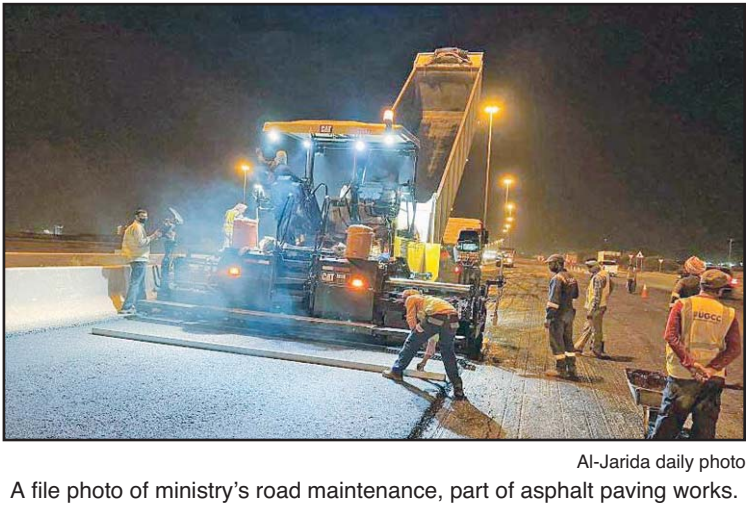
A file photo of ministry's road maintenance, part of asphalt paving works.