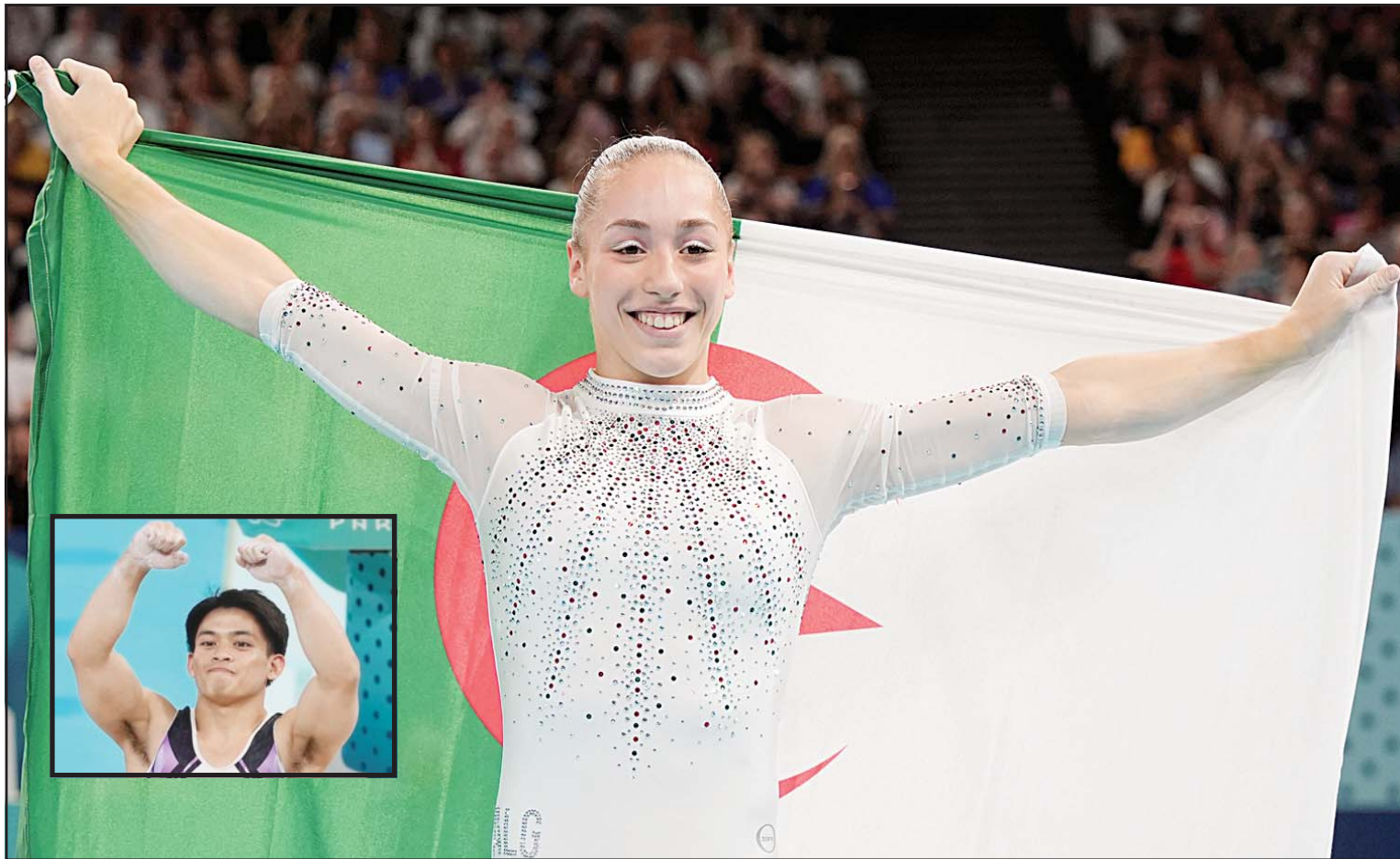
Kaylia Nemour, of Algeria, celebrates after winning the gold medal during the women's artistic gymnastics individual uneven bars finals. (Inset): Carlos Yulo, of the Philippines, celebrates after winning the men's artistic gymnastics individual vault finals.

He highlighted his pride in Kuwait's participation in the 33rd Olympic Games, commending the champions for their professional dedication and determination in representing their country admirably, even if some exited the competitions early.