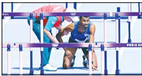
Yaqoub Al-Youha fails to finish the 110m hurdles after suffering an injury at the Paris Olympics.