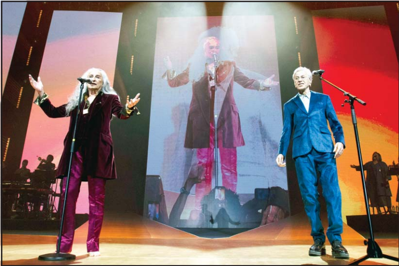
Brazilian sibling singers Caetano Veloso, (right), and Maria Bethania perform on stage during their ‘Caetano & Bethania’ tour in Rio de Janeiro, Saturday, Aug. 3.

AL-JADIDA, Morocco: Al-Jadid, also known as Mazagan, is an Atlantic Ocean