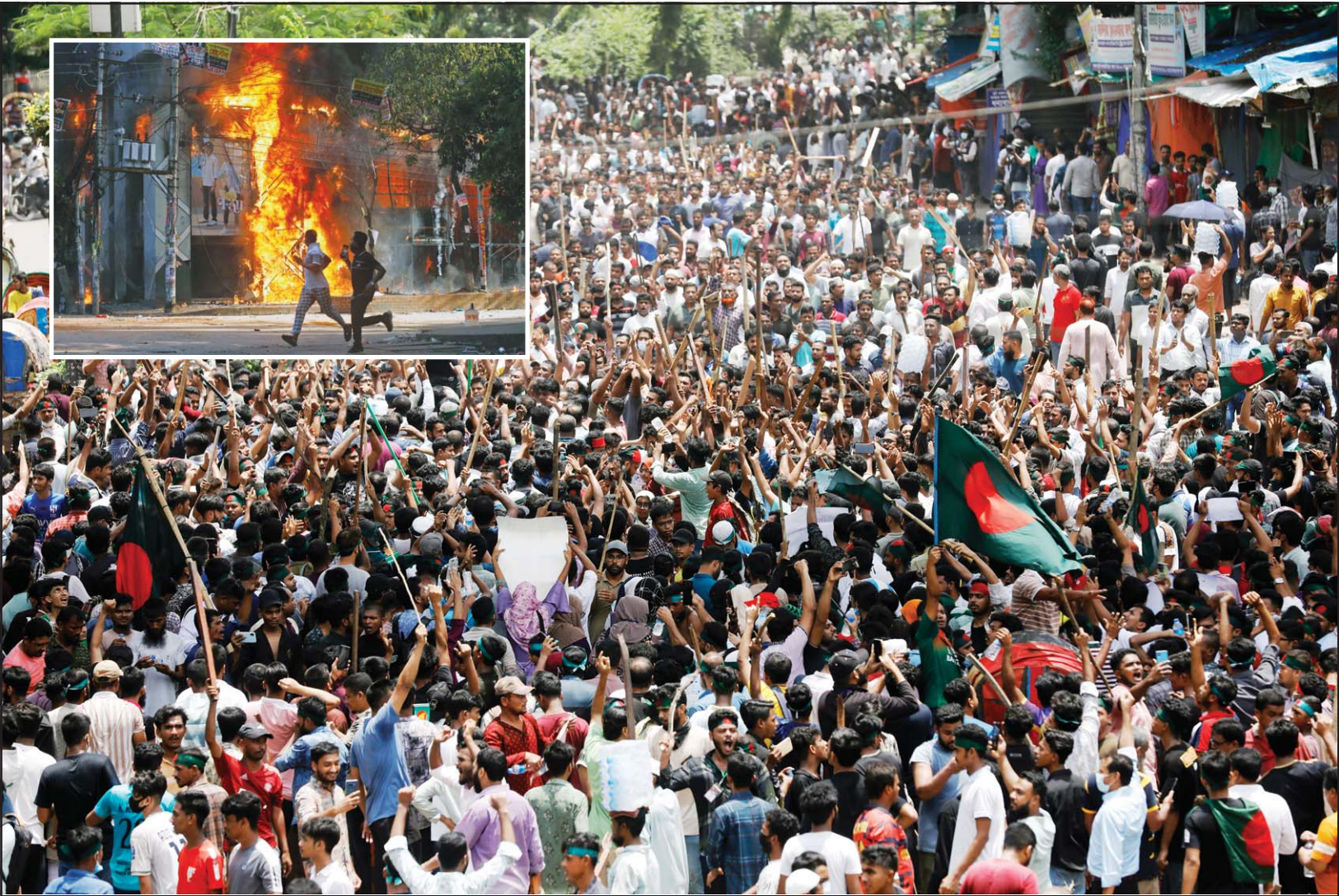
People participate in a rally against Prime Minister Sheikh Hasina and her government demanding justice for the victims killed in the recent countrywide deadly clashes, in Dhaka, Bangladesh on Aug 4. Inset: Men run past a shopping center which was set on fire by protesters.

Famine conditions have prevailed as of June and July in Zamam camp, 12 km south of Al Fasher -the capital of North Darfur - where internally displaced people are living, according to the IPC report.