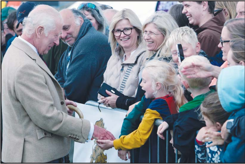
Britain’s King Charles III, (left), meets well wishers during the Mey Highland Games at the John O’Groats Showground in Caithness, Scotland on Aug 3.

Firefighters found burned remnants of the statue five days later while responding to a