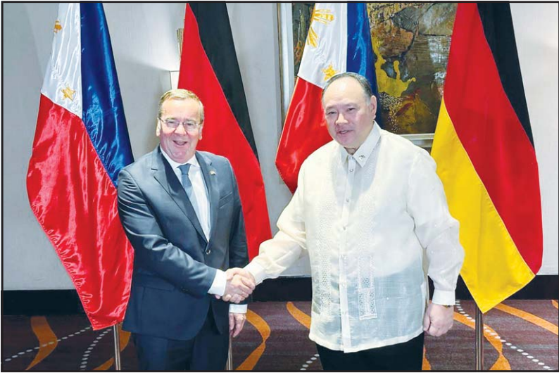
German Defense Minister Boris Pistorius, (left), meets with his Philippine counterpart Gilberto Teodoro, Jr in Manila, Philippines on Aug 4. Germany and the Philippines agreed Sunday to rapidly finalize a defense pact that would allow joint military training and possible sale of German weapons to address security threats, including China’s growing aggression in the South China Sea, which Manila’s defense chief said was ‘the sole cause of tensions’ and conflicts in the disputed waters.