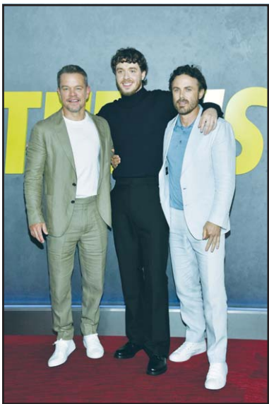
Matt Damon, (from left), Jack Harlow, and Casey Affleck attend the Apple Original Films premiere of ‘The Instigators’ at Jazz at Lincoln Center on Wednesday, July 31, in New York. — Details Page 11

Organizers of the breaking competition at the Olympics are adamant that they are paying homage to the roots of breaking. The official website details the history of the movement and the art from originating in the Bronx. Flyers in the media press center document the introduction of hip-hop and breaking in France, describing Seine-Saint-Denis as “the birthplace of breaking in France” with battles still regularly organized in the suburb. Some breakers from Paris’ larger hip-hop scene have also been brought into the fold, with many benefiting from opportunities to show off their skills.