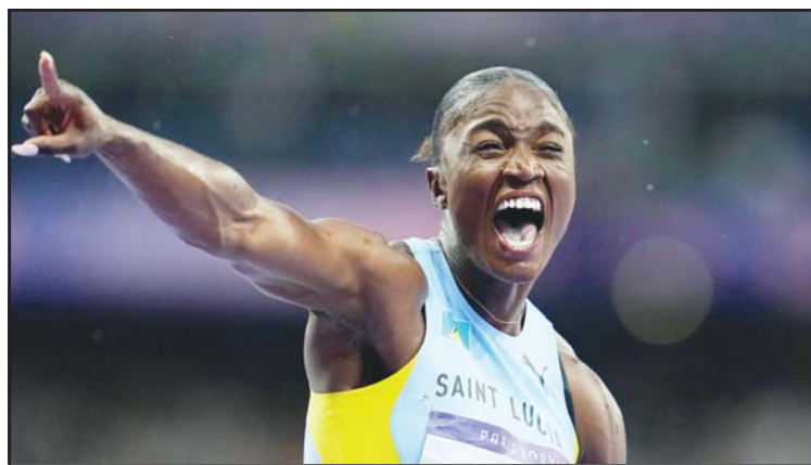
Julien Alfred, of Saint Lucia, celebrates after winning the gold medal in the women's 100 meters final at the 2024 Summer Olympics in Saint-Denis, France.

It required long exchanges filled with superb ball-striking at the baseline, deft drop shots - Alcaraz's tended to be more successful, sometimes so good Djokovic declined to even give