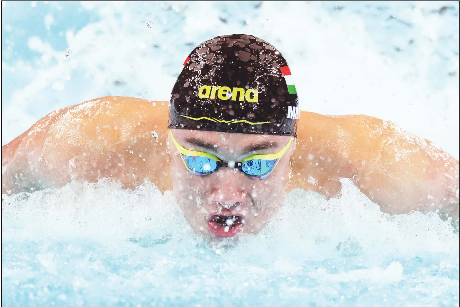
Hungary's Kristof Milak competes in the men's 100-meter butterfly final at the Summer Olympics in Nanterre, France.

NANTERRE, France, Aug 4, Every year on Aug. 3, Katie Ledecky is reminded of her first Olympic gold medal.