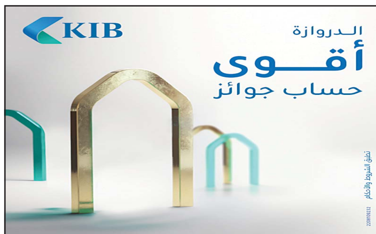
Al Dirwaza account

Gulf Bank is committed to maintaining robust developments in sustainability at environmental, social and governance levels through diverse sustainability initiatives, strategically selected to benefit the Bank both internally and externally. Gulf Bank supports Kuwait Vision 2035 "New Kuwait" and works with various parties to achieve it.