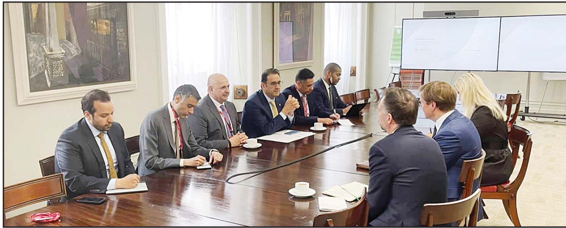
Part of the UK-Kuwait meeting.