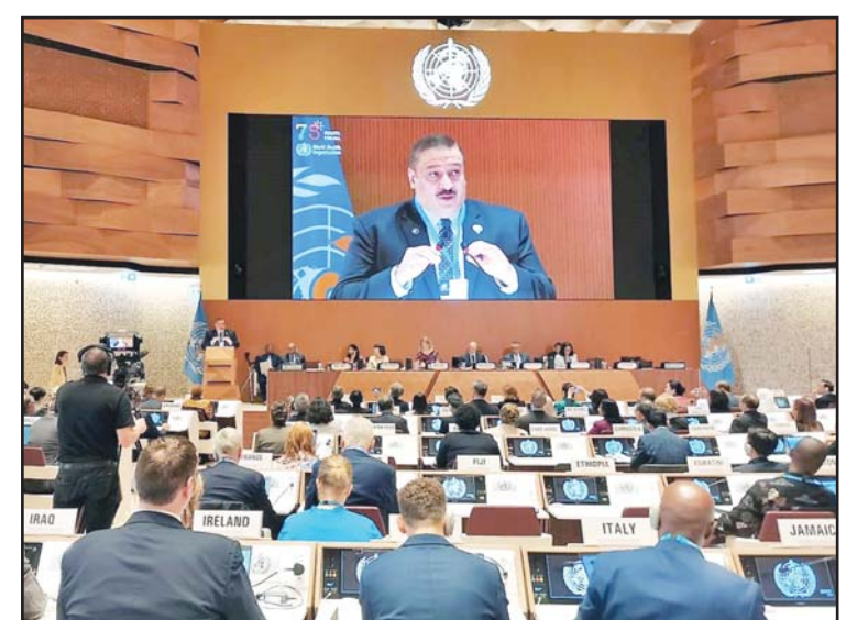
The Kuwaiti health minister addresses his statement at inauguration of the awards ceremony