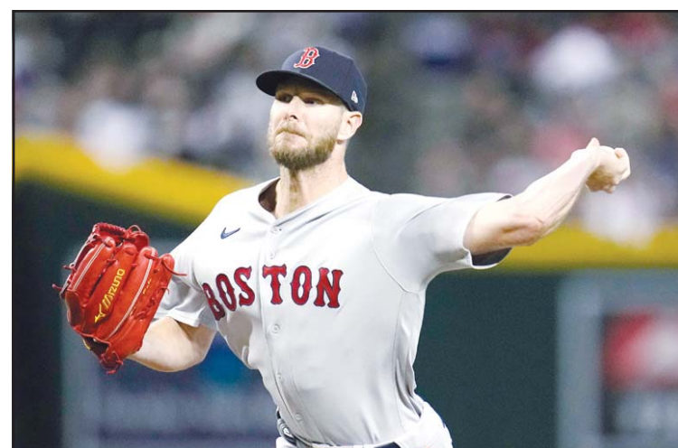
Boston Red Sox starting pitcher Chris Sale throws to an Arizona Diamondbacks batter during the first inning of a baseball game in Phoenix.

Soler became the first Marlins player in six years to homer in four consecutive games with a solo shot in the third. The outfielder crushed a changeup down the middle by Reid