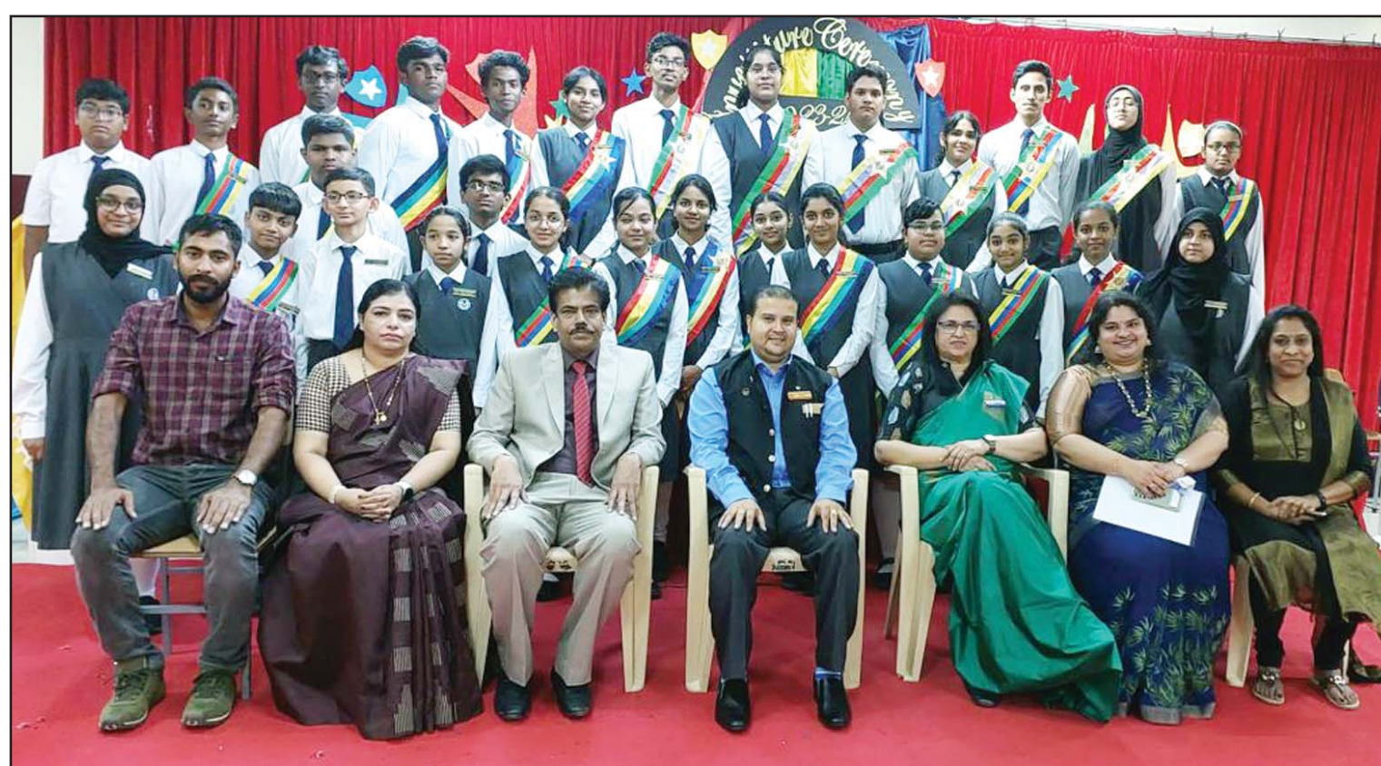
A photo from the event.