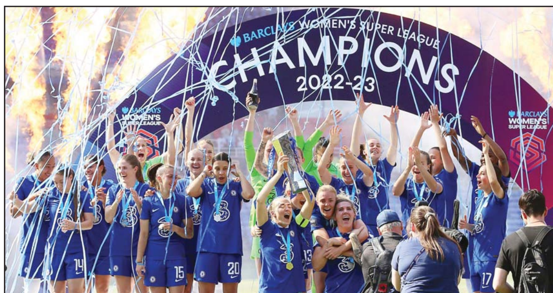
Chelsea players celebrate becoming WSL champions after the Barclays Women's Super League match at the Select Car Leasing Stadium, Reading.

"I think anyone who's interested in soccer, particularly German soccer, will say we don't deserve it, and I understand, because our second half of the season was so chaotic, on the field, off the field," Bayern veteran Thomas Müller said. "But this moment is still