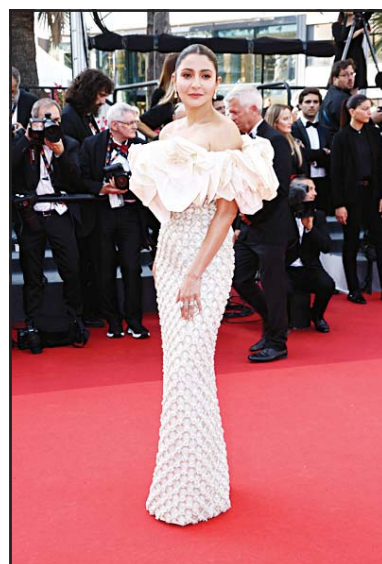
Anushka Sharma poses for photographers upon arrival at the premiere of the film 'The Old Oak' at the 76th international film festival, Cannes, southern France, May 26.

Armstrong has left open revisiting his character in another fashion, and the possibilities for doing so are endless. A Tom and Greg buddy comedy? Or maybe a Logan Roy origin story, just to reveal the first time he said his signature vulgar phrase.