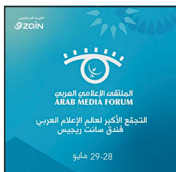
Zain Arab Media Forum 2023

It serves to note that Al Dirwaza account is the best-in-class savings account in the sector, with annual expected profits up to 2% disbursed on monthly basis, where the customer gets an expected profit of 2% for the first 3 months from the account opening date and up to 1% expected rate onward. The expected profits are automatically deposited into the customer's account within the first day of the beginning of each month.