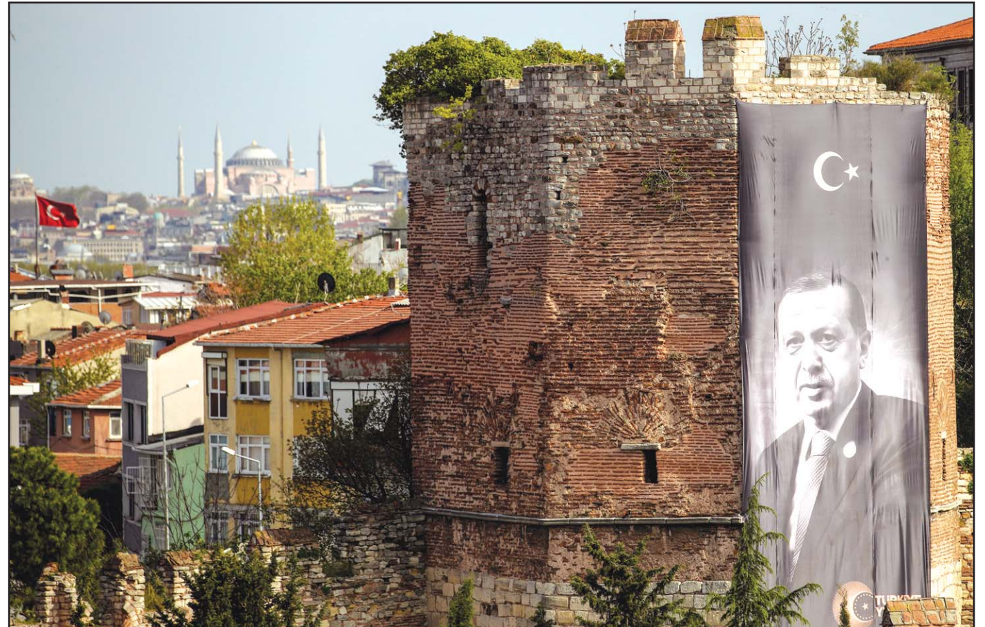
A giant banner of Turkish President and People's Alliance's presidential candidate Recep Tayyip Erdogan is displayed on an historical city wall, in Istanbul, Turkey, Saturday, April 22, 2023. Turkish President Recep Tayyip Erdogan is favored to win re-election in a presidential runoff Sunday, May 28, 2023, despite a host of domestic issues.

Turkiye is witnessing Sunday decisive presidential run-off between incumbent President Recep Tayyip Erdogan and main rival Kemal Kilicdaroglu amidst a number of challenges like refugees and the daunting task of recovery from the devastating earthquake.