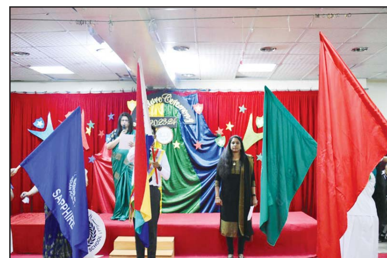
A photo from the event.

The grand success of this Blood Donation Camp serves as a reminder that, together, we can make a significant impact and bring hope to those facing medical emergencies.