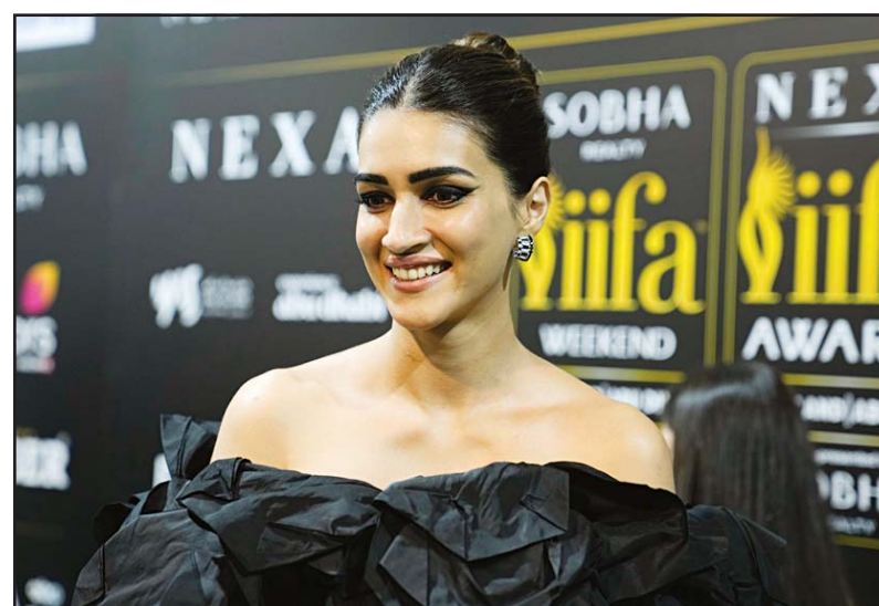
Bollywood actress Kriti Sanon arrives to attend the 23rd International Indian Film Academy (IIFA) awards in Abu Dhabi, United Arab Emirates, May 26. — Details Page 11