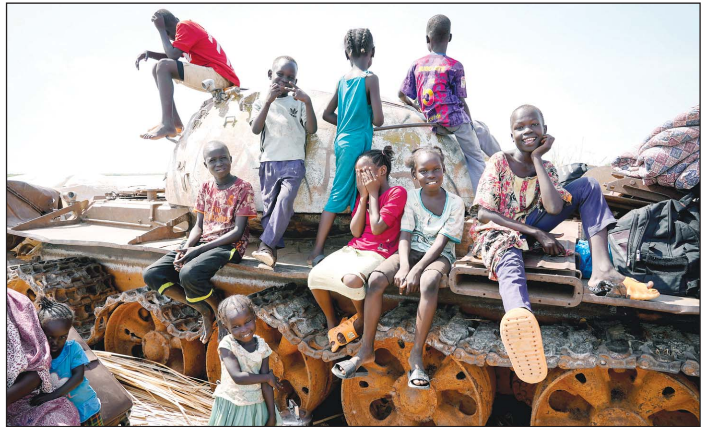
Children sit and play on the remains of a tank, at the river port in Renk, South Sudan Wednesday, May 17, 2023. Tens of thousands of South Sudanese are flocking home from neighboring Sudan, which erupted in violence last month. Saudi Arabia and the United States said Friday the warring sides in Sudan's conflict are adhering better to a new, week-long cease-fire following days of sporadic fighting.

Turkiye is witnessing Sunday decisive presidential run-off between incumbent President Recep Tayyip Erdogan and main rival Kemal Kilicdaroglu amidst a number of challenges like refugees and the daunting task of recovery from the devastating earthquake.