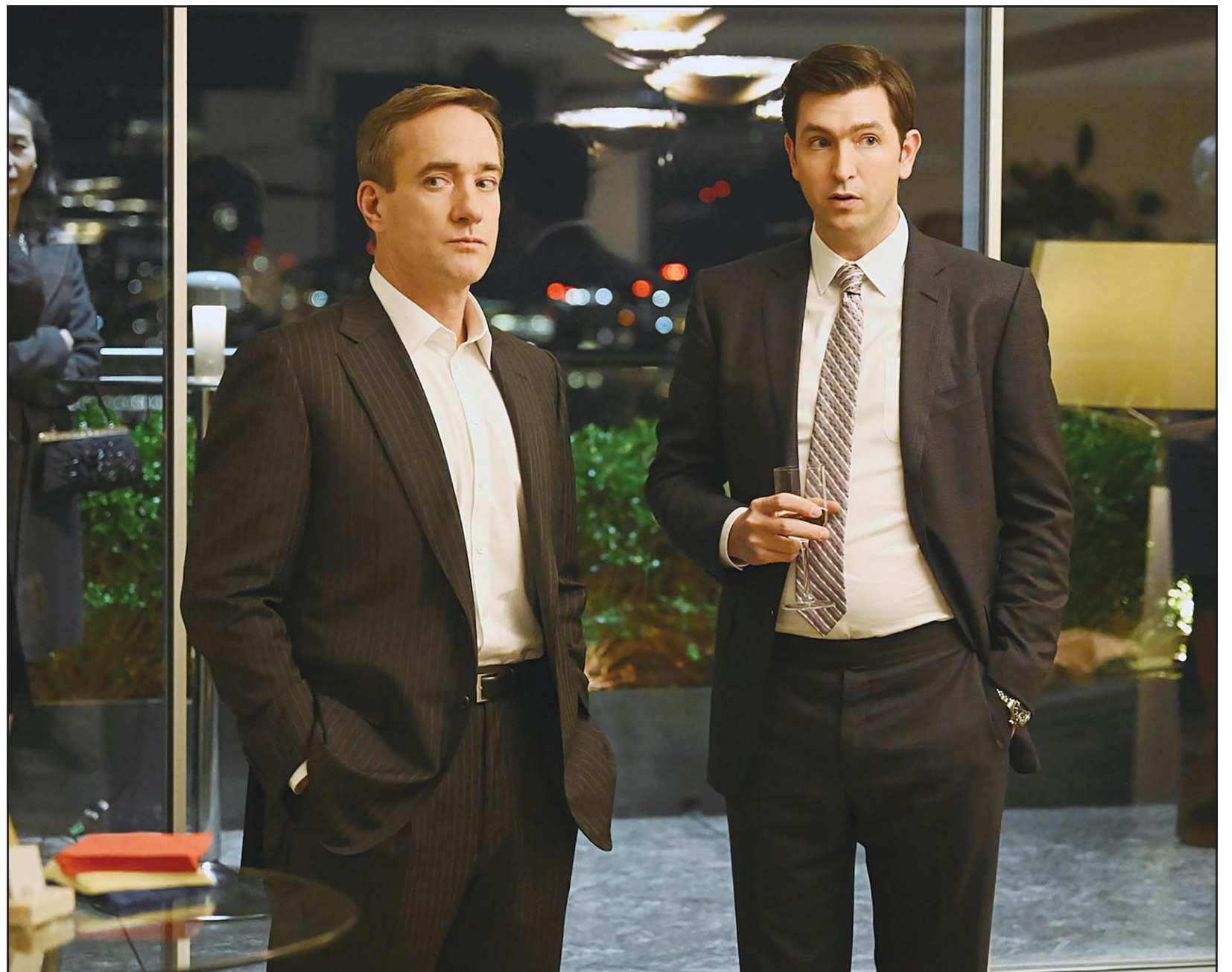
This image released by HBO shows Matthew Macfadyen as Tom Wambsgans, (left), and Nicholas Braun as Greg Hirsch in a scene from the series 'Succession.'