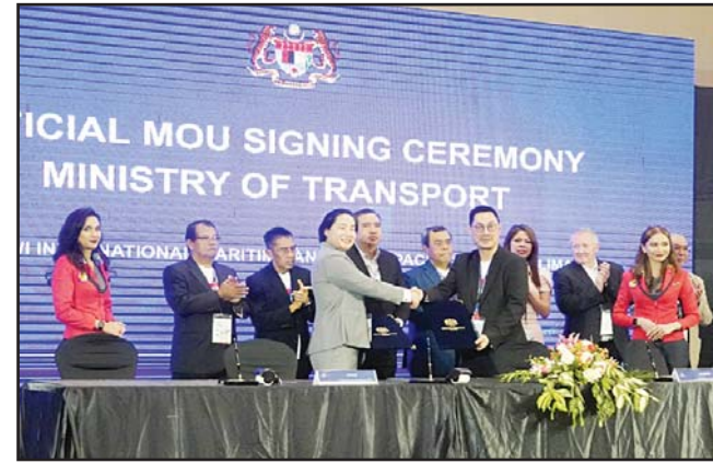
Menzies Aviation and MYAirline announce joint venture partnership.

Aviation said: "We are delighted to be entering Malaysia through this new partnership with MYAirline. Kuala Lumpur International Airport is the largest and busiest airport in Malaysia and will provide an excellent base for our Malaysian operation. We're focused on accelerating growth in the region through partnerships that will contribute to this rapidly developing aviation market and offering our global standards to deliver the safest, most secure and sustainable aviation services."