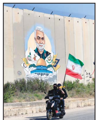
Hezbollah supporters riding on a scooter, wave an Iranian flag as they drive past a graffiti depicting slain Iran's Quds force General Qassem Soleimani, seen on a wall that was built by Israel, while they mark the 'Liberation Day', the 23rd anniversary of Israel's withdrawal from southern Lebanon on May 25, 2000, at the southern Lebanese-Israeli border village of Kfar Kila, Thursday, May 25, 2023.