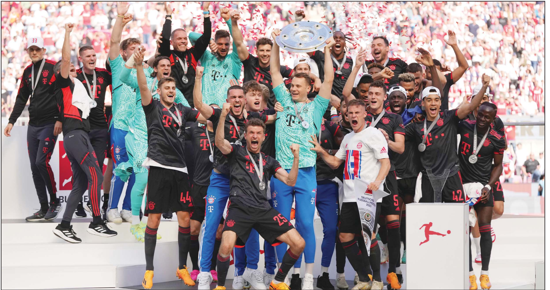
Bayern Munich players celebrate winning the German championship after the German Bundesliga soccer match between 1.FC Cologne and FC Bayern Munich in Cologne, Germany.

Latest sports scores at — http://sports.arabtimesonline.com