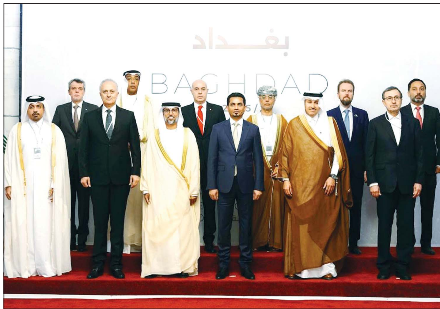
Participants of the 'development road' conference.

The sources affirmed that the implementation of the decision signifies the commitment of business owners to the health and safety of their workers, as well as the keenness to adhere to the controls and regulations of the private sector labor law, and the decisions regulating it.