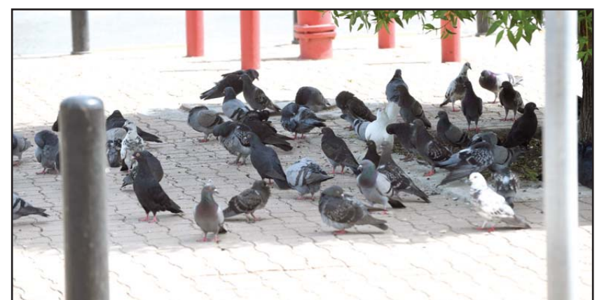
Pigeons take shelter under a tree in Salmiya as temperature rose to 45 C on Saturday, May 27.

The prosecution then thanked its counterpart in Egypt, headed by Attorney General Hamada El-Sawy, for exerting tremendous efforts to complete the extradition process.