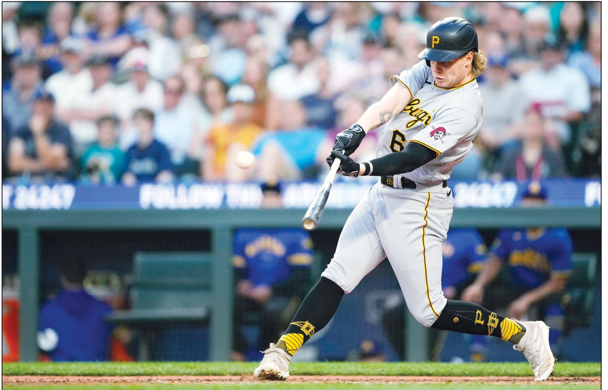
Pittsburgh Pirates' Jack Suwinski hits a two-run home run against the Seattle Mariners during the fifth inning of a baseball game in Seattle.

Soto put the Padres ahead in the fifth inning against Randy Vásquez (0-1), who was making his big league debut. Tatis boosted the lead to 4-0