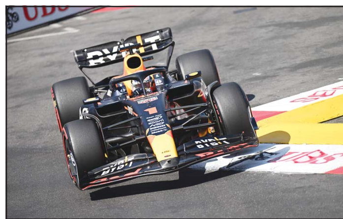
Red Bull driver Max Verstappen of the Netherlands steers his car during the Formula One qualifying session, at the Monaco racetrack, in Monaco.

Hamilton climbed out and slid under a barrier before walking back pensively with his hands behind his back as the car was hoisted high in the blue sky air by a crane.