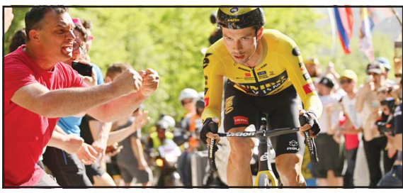
Fans cheer on Slovenia's Primoz Rogli during the 20th stage of the Giro d'Italia cycling race, an individual mountain time trial from Tarvisio to Monte Lussari, Italy.