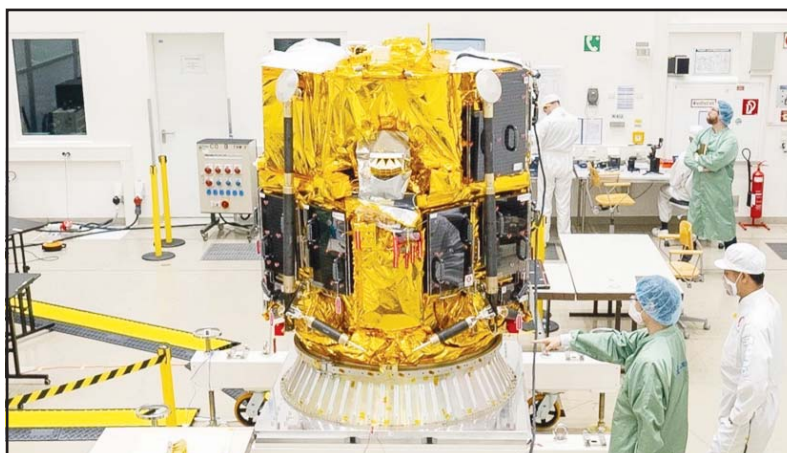
In this photo provided by ispace, engineers and affiliates work on the flight model of the HAKUTO-R Mission 1 Lunar Lander at the IABG Space Test Centre in Ottobrunn, Germany, in August 2022. A Tokyo company whose lunar lander slammed into the moon last month says inadequate software and a last-minute switch in the touchdown location led to the crash. Officials for the company ispace said Friday, May 26, that its spacecraft was originally supposed to land in a flat plain.

die-off was first observed in the eastern Mediterranean Sea in July and gradually spread. Researchers have since seen it spread south to the neighboring Red Sea, the scientists said.