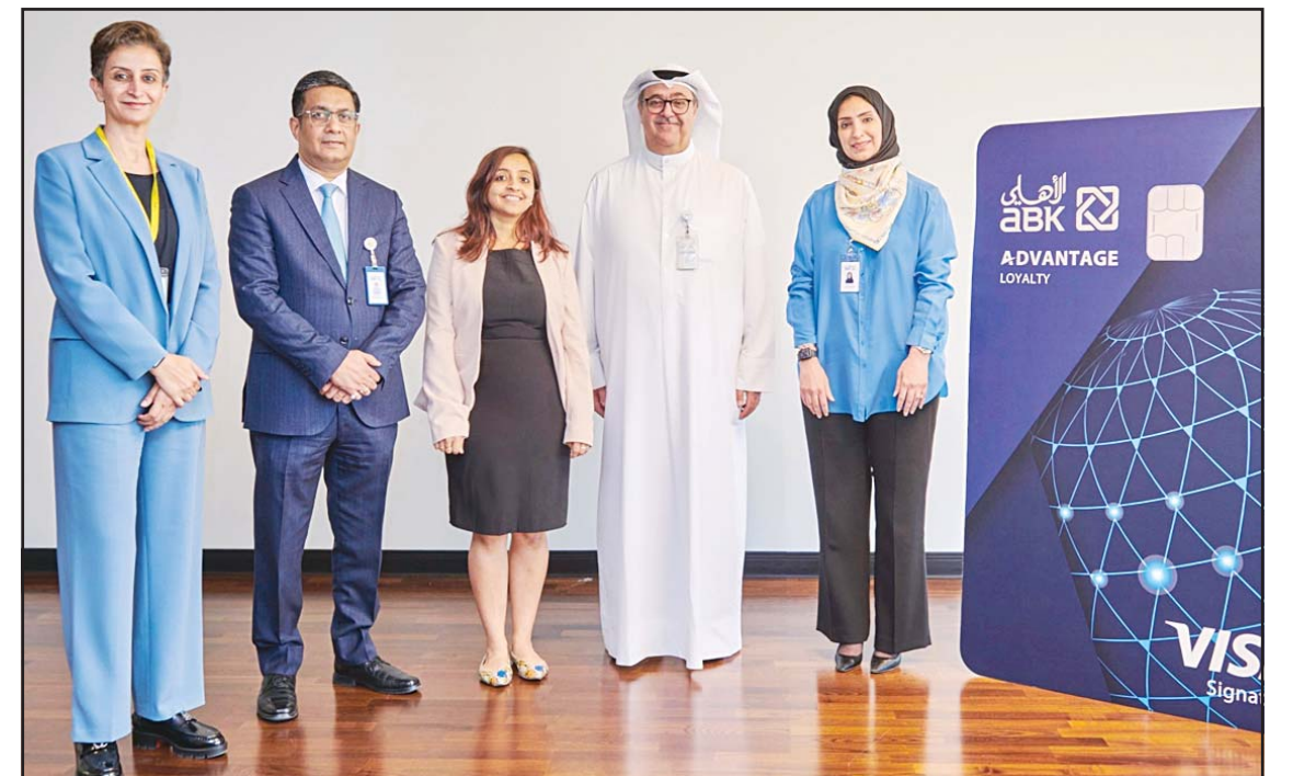
ABK launches ABK Advantage Rewards Program.