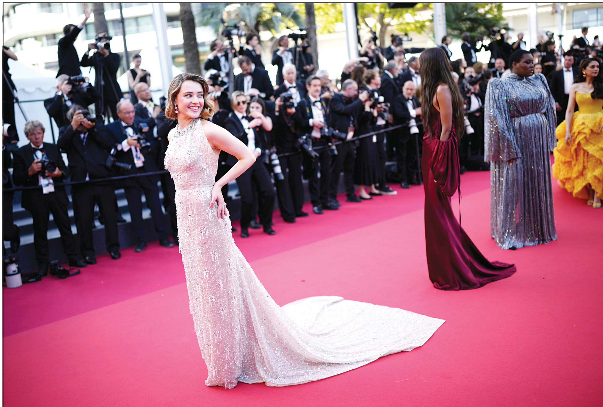
Katherine Langford poses for photographers upon arrival at the premiere of the film 'Last Summer' at the 76th international film festival, Cannes, southern France, Thursday, May 25.