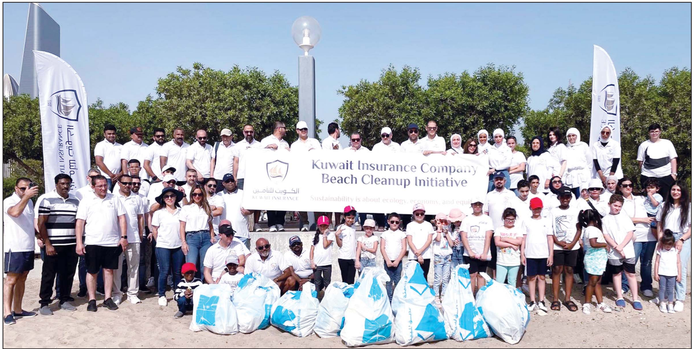
Kuwait Insurance Company employees and their children who participated in the beach clean-up campaign.