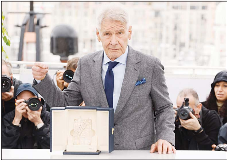
Harrison Ford poses for photographers with his honorary Palme d’Or at the photo call for the film ‘Indiana Jones and the Dial of Destiny’ at the 76th international film festival, Cannes, southern France, May 19. — Details Page 11

SANTA FE, NM: Attorneys for the weapons supervisor on the New Mexico film set where Alec Baldwin