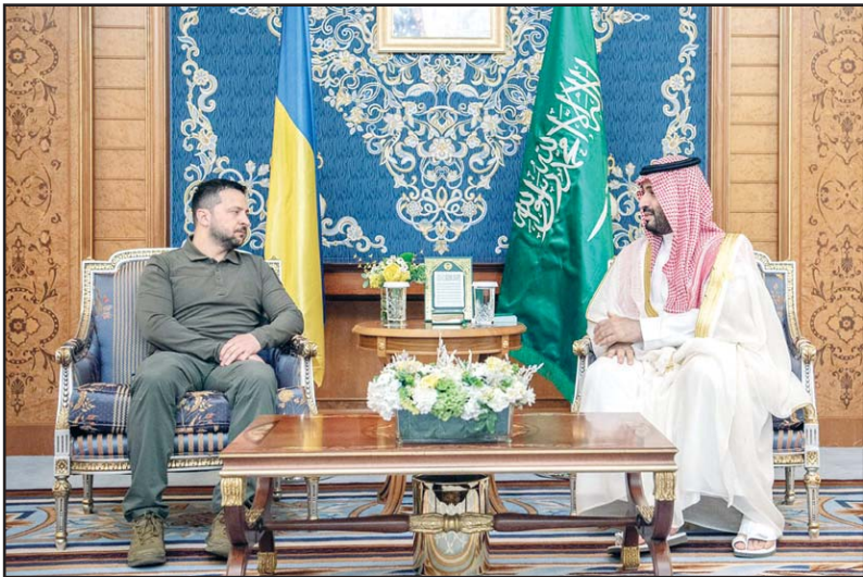
In this photo provided by Saudi Press Agency, SPA, Saudi Crown Prince Mohammed bin Salman meets with Ukraine's President Volodymyr Zelensky, during the Arab summit in Jeddah, Saudi Arabia, Friday, May 19, 2023.