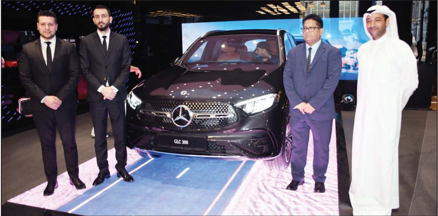
Al Mulla Automobiles Co. officials during the unveiling of new Mercedes-Benz GLC SUV in an exclusive press event at the Avenues Mall.

ics. Since the GLC SUV’s introduction and its direct predecessor, the GLK, Mercedes-Benz has sold more than 2.6 million examples worldwide. The GLC SUV presented now is the third generation, and seamlessly continues this success story. Exterior design: Expressive highlights One of the defining design highlights of the GLC SUV is the redesigned front end, with headlamps that connect directly to the radiator grille to emphasize the vehicle’s width. DIGITAL LIGHT headlamps with additional daytime driving light ellipses and new blue trim, plus active floor lighting, are available as optional extras. The typical Mercedes SUV radiator grille with redesigned cut-out has a chrome surround, this frames a sporty louvre in matt grey with chrome trim and the grille with vertical louvers in high-gloss black. From the AMG Line upwards, a radiator grille with Mercedes-Benz pattern is available: a three-dimensional star pattern with high-gloss chrome surfaces. The new simulated under guard in chrome at the front emphasizes the vehicle’s width and accentuates