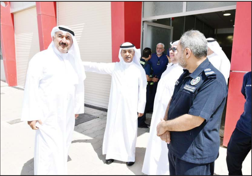
Officials during the opening of the Ambulance Center.