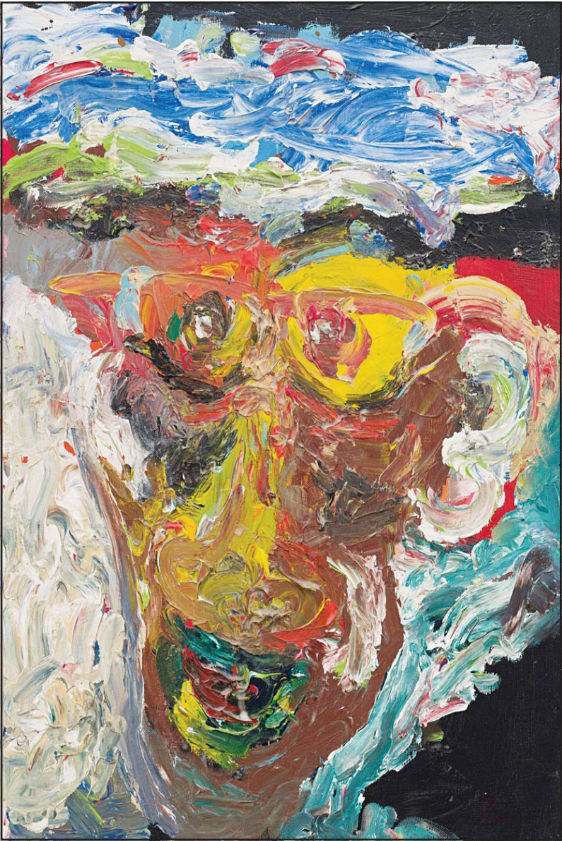
These images released courtesy of Pierce Brosnan show ‘So Many Dreams,’ (left) and ‘One Dark Night,’ (right) acrylic on canvas. The artworks are part of Brosnan’s first solo art exhibition running through May 21 in Los Angeles.