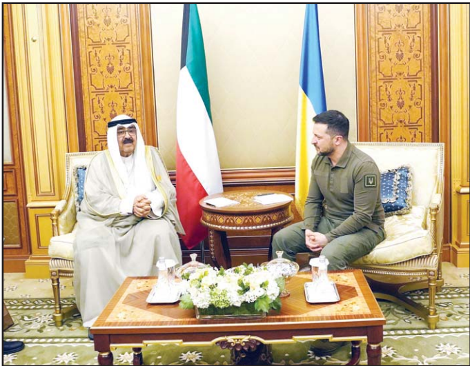
His Highness the Crown Prince Sheikh Mishal Al-Ahmad Al-Jaber Al-Sabah meets Ukrainian President Volodymyr Zelensky.