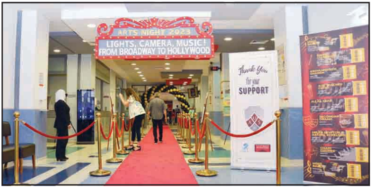
A photo from the event.