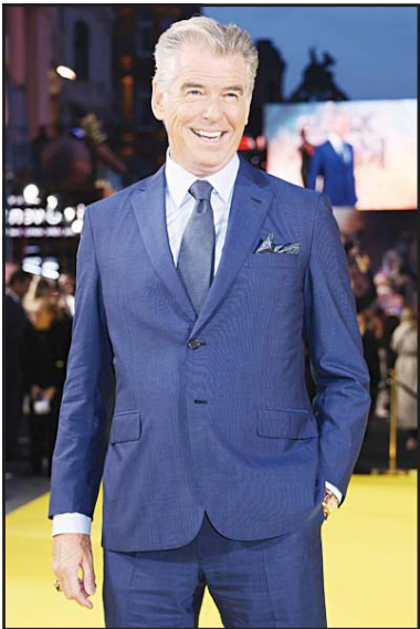
Pierce Brosnan appears at the premiere of ‘Black Adam’ in London on Oct. 18, 2022. Brosnan’s first solo art exhibition, titled, ‘So Many Dreams,’ runs through May 21 in Los Angeles.