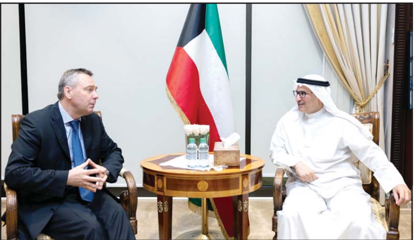
Deputy Foreign Minister, Ambassador Mansour Al-Otaibi, with the new Ambassador of the Russian Federation to the State of Kuwait.

"The agreement covers cooperation of medical staff at Dar Al Shifa Hospital and Bumrungrad Hospital in the areas of regenerative medicine, dermatology, regenerative surgeries, and trauma treatment." He concluded.