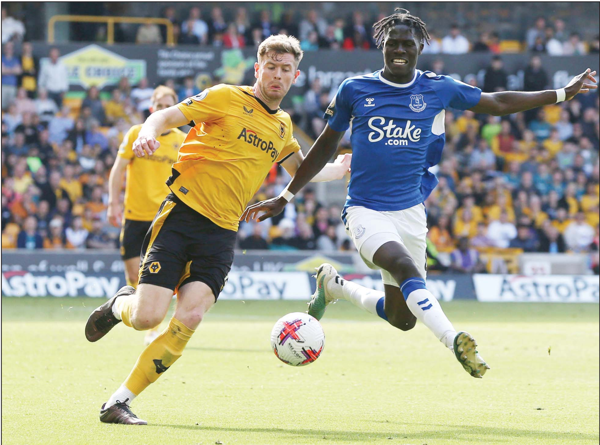
Wolverhampton Wanderers' Nathan Collins (left), and Everton's Amadou Onana battle for the ball during the English Premier League soccer match between Wolverhampton Wanderers and Everton at the Molineux Stadium, Wolverhampton.

Tottenham might now struggle to qualify for any European competition for next season, having come into the game in seventh place - the division's