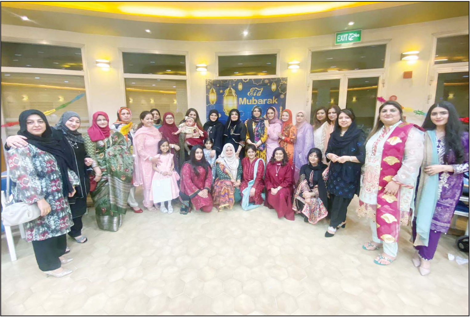
A photo from the event.

The event set in motion with the recitation of the verses from the Holy Quran along with a prayer song. It was followed by an apt thought for the day offering tribute to the institution with a great legacy. There was an excellent speech by the student about the foundation day, 64 years of making a difference, learning, a lifetime of success. A birthday is incomplete without a birthday song and they didn't miss the opportunity of singing it melodiously while also displaying the historical view of ICSK, in a short presentation the young ones dressed as heads of the institution of all the branches stole the show. The celebration dance following the birthday wishes was enjoyed by all. The energy and passion of the students was visible in the performances that they put up. The celebration was complete with the cake cutting ceremony. The staff members and students cherished the moments, and vowed to collaborate their efforts for the glorification of the school. Assembly concluded with the pledge and the singing of the Indian National Anthem.