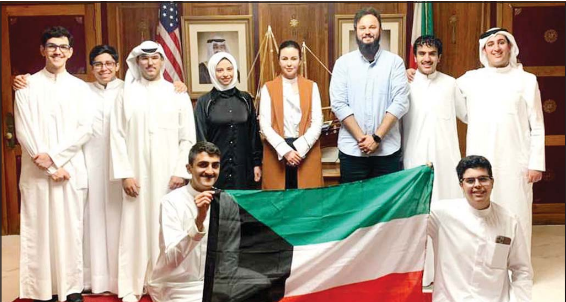
American Baccalaureate School team

The report expected that the Gulf economies would grow at a slower pace in 2023 compared to the previous year due to the decline in oil and gas revenues and the slowdown in global economic activity. Kuwait has the low-est economic growth among the GCC countries this year, and it records the third highest growth in the non-oil sec-tors after the UAE (4.8 percent) and Saudi Arabia (4.7 percent). The report predicted that the econ-omy of the Gulf countries would grow at a rate of 2.5 percent in 2023 and 3.2 percent in 2024. This comes in com-parison with the remarkable growth of the region’s gross domestic prod-uct, which amounted to 7.3 percent in 2022, due to the strong increase in oil production for most of this year. The reason for the poor perfor-mance is primarily due to the decline in the hydrocarbon gross domestic product, which is expected to contract by 1.3 percent by 2023 after the an-nouncement of the production cut in “OPEC Plus” last April and the global economic slowdown, but the strong growth in the non-oil sectors, which it is expected to reach 4.6 percent by 2023, which will reduce deficiencies in hydrocarbon activities. The World Bank attributed this pri-marily to private consumption, fixed