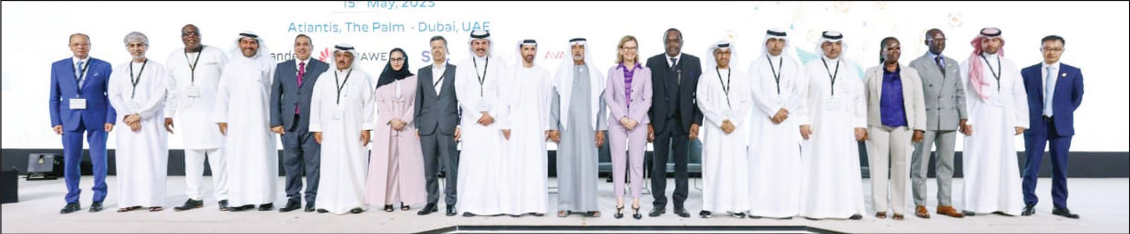
A group photo of industry leaders participating in the summit.