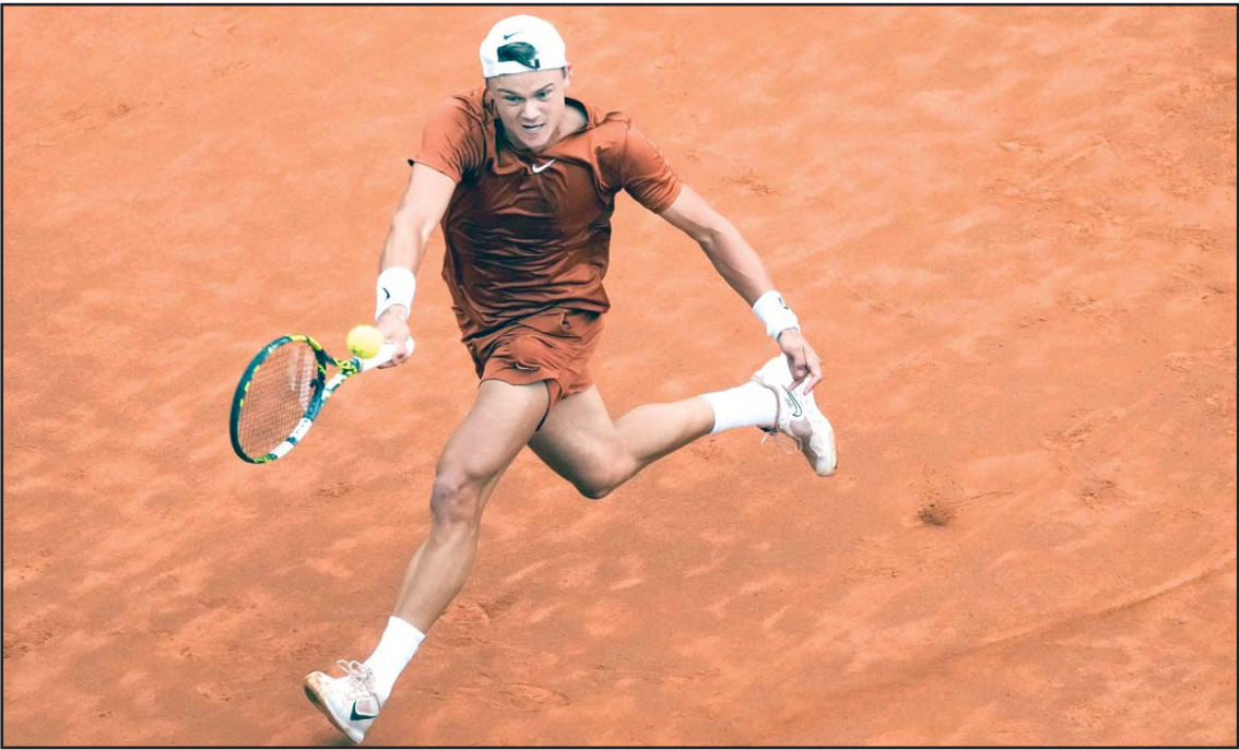
Denmark's Holger Rune returns the ball during a semi final match against Norway's Casper Ruud at the Italian Open tennis tournament in Rome, Italy.

Swiatek had to stop playing during the third set against Wimbledon champion Elena Rybakina in a match that started late Wednesday evening. "I felt pain in my right thigh. It was pretty sudden. At the beginning I didn't really know if it was serious or not," Swiatek said. "We did an examination with the physio afterwards. It shouldn't be anything serious, so I'm pretty positive that I'll be back soon." Swiatek will be aiming for a third French Open title - and second straight - when the clay-court Grand Slam begins in 10 days. "To be ready for Roland Garros I need to recover right now. I'm going to take couple of days off. ... Since Stuttgart I wasn't really able to recover with that tight schedule that we have on WTA," Swiatek said, referring to a tournament in Germany last month.