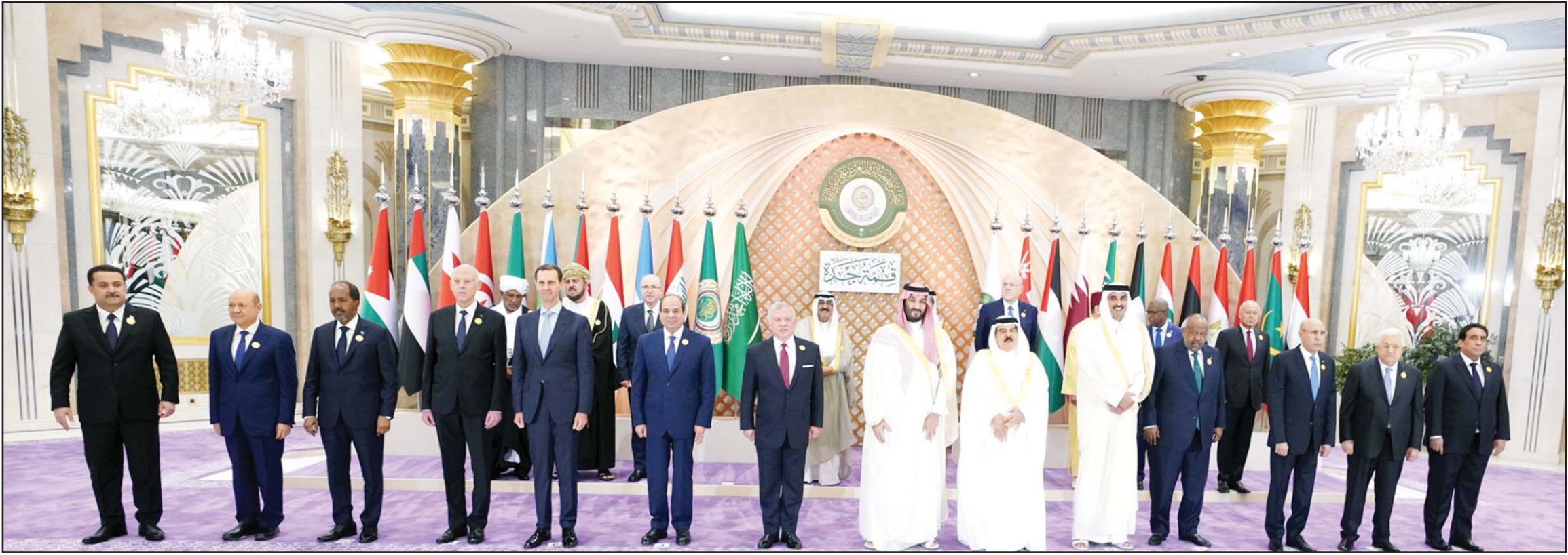
Leaders of Arab countries pose for a group picture ahead of the Arab summit in Jeddah, Saudi Arabia, Friday, May 19, 2023.