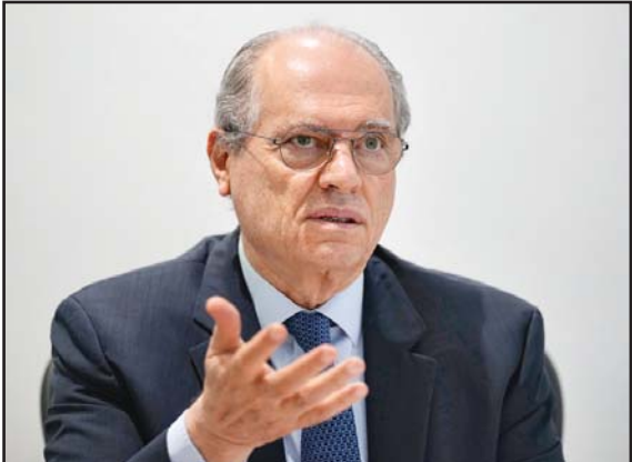
Lebanon's caretaker Deputy Prime Minister Saade Chami speaks during an interview with The Associated Press at his office in Beirut, Lebanon, Thursday, May 18, 2023.

The Lebanese official heading talks with the International Monetary Fund to bail out Lebanon's tanking economy called Thursday for the country's embattled central bank chief to resign, amid allegations of corruption and an international arrest warrant issued against him. Once seen as the guardian of Lebanon's financial stability, Central Bank Gov. Riad Salameh is now widely blamed for an economic meltdown that began in 2019. The Lebanese pound has since plummeted in value and wiped out much of the savings of ordinary Lebanese, plunging an estimated three-quarters of the population into poverty. Lebanon's caretaker deputy prime minister, Saade Chami, told The Associated Press in an interview that the allegations against the central bank chief put the government's credibility at risk and "could threaten the country's financial relations with the rest of the world," including with the IMF and other global financial institutions. Chami is the highest-ranking Lebanese official to call for Salameh's resignation to date. Salameh, 72, has held his post for almost 30 years. A European-led investigation into his personal wealth stashed abroad has raised questions about his tenure at the central bank and wider issues of corruption in Lebanon's financial and political system. A spokesperson for Salameh, who has denied allegations of corruption and mismanagement, did not immediately respond to a request for comment.