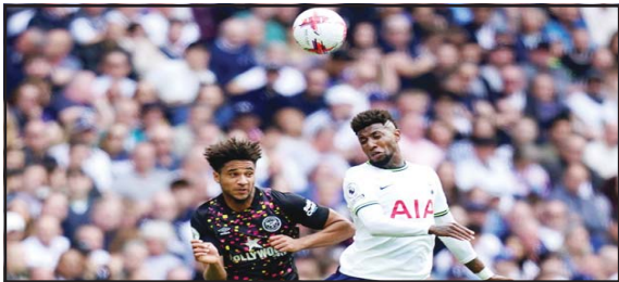
Brentford's Kevin Schade (left), and Tottenham Hotspur's Emerson Royal battle for the ball, during the English Premier League soccer match between Tottenham Hotspur and Brentford, at the Tottenham Hotspur Stadium, London.