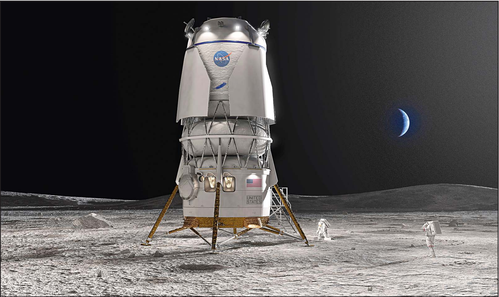
This image provided by Blue Origin shows the Blue Moon lander. Jeff Bezos’ Blue Origin received a $3.4 billion contract Friday, May 19, 2023, to develop a lunar lander named Blue Moon. It will be used to transport astronauts to the lunar surface as early as 2029. (AP)

GEUS said that seismic tremors were measured at a magnitude of 2.3.