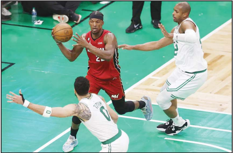
Miami Heat forward Jimmy Butler (top left), looks to pass between Boston Celtics forward Jayson Tatum (bottom left), and center Al Horford (right), during the second half of Game 2 of the NBA basketball playoffs Eastern Conference finals in Boston.

Jaylen Brown scored 16 points on 7-for-23 shooting; he went 1 for 5 with a turnover in the final quarter, when Miami outscored Boston 36-22.