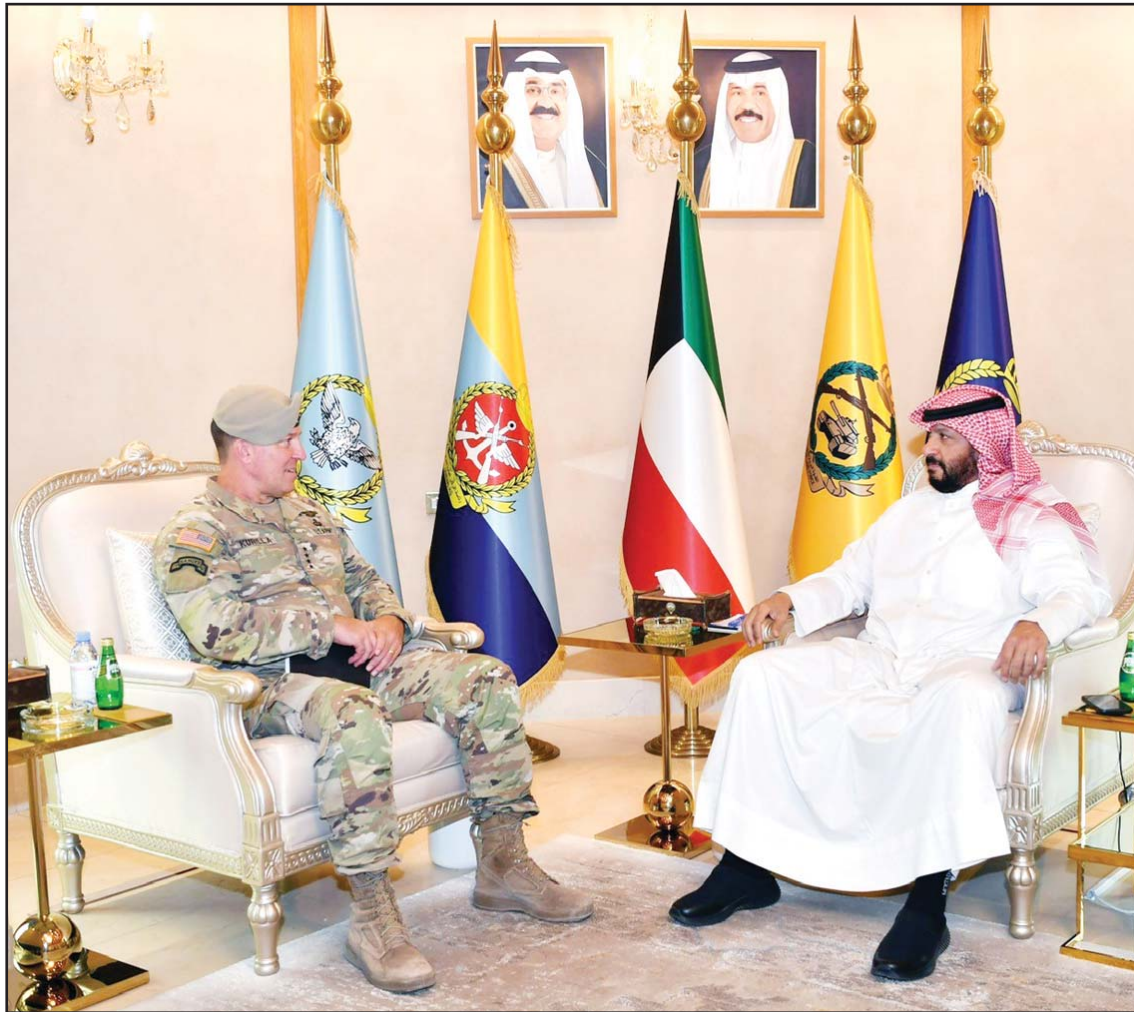
First Deputy Prime Minister, Minister of Interior and Acting Minister of Defense holds talks with the Commander of the US Central Command, Lieutenant General Michael Corella on his official visit to the country.