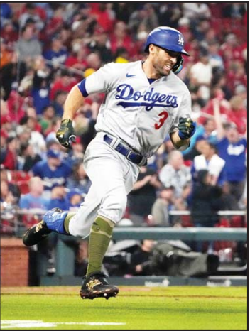
Los Angeles Dodgers' Chris Taylor rounds first on his way to an RBI double during the fifth inning of a baseball game against the St. Louis Cardinals in St. Louis.

as Los Angeles rallied to beat Minnesota after Angels starter Reid Detmers took a no-hitter into the sixth inning. Hunter Renfroe also had three hits for the Angels, who gave Mike Trout the day off after the team flew cross country Thursday after completing a four-game series in Baltimore. Detmers tied a career high with 12 strikeouts and allowed only three Twins to reach base via walks before Byron Buxton lined a base hit to left with two outs in the sixth to end the left-hander's bid for a second no-hitter. Carlos Correa's walk and Buxton's single started a three-run rally that allowed Minnesota to tie it. Detmers ended up allowing three runs and two hits. Willi Castro homered in the seventh inning for the Twins to give them a short-lived 4-3 lead. Moniak, who was playing Trout's usual spot in center field, was a home run shy of hitting for the cycle. His triple in the seventh inning drove in Zach Neto and tied it at 4. Braves 6, Mariners 2 In Atlanta, Orlando Arcia's single off the right-field wall drove in the go-ahead run in the seventh, Marcell Ozuna had three RBIs and Atlanta Braves overcame another strong start by Seattle rookie Bryce Miller. Miller, making only his fourth major league start, led 2-1 before fading and leaving the game in the seventh. Ozuna's bloop single off Trevor Gott drove in Eddie Rosario with the tying run. Arcia's 374-foot single off the bricks on the right-field wall drove in Ozzie Albies, who walked.