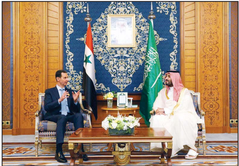
In this photo released by the Syrian official news agency SANA, shows Syrian President Bashar Assad, (left), meets with Saudi Crown Prince Mohammed bin Salman, during the Arab summit in Jeddah, Saudi Arabia, Friday, May 19, 2023.