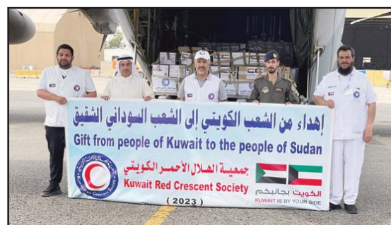
KRCS officials and volunteers during the dispatch of aid to Sudan.

The minister also stopped the enrollment of Kuwaiti students in the Bachelor in Electronics and Electrical Engineering program at the University of Central Lancashire and Bachelor in Pharmacy at the University of Brighton.