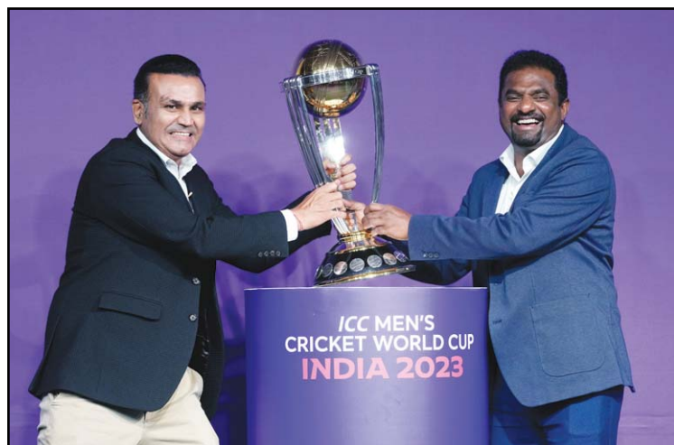
Former Indian cricketer Virender Sehwag (left) and Sri Lankan cricketer Muttiah Muralitharan pose with the International Cricket Council (ICC) men's cricket World Cup trophy during a press conference to release the tournament's match schedule in Mumbai, India.

"I wish all the teams the very best in their preparations and look forward to hosting what promises to be another exciting tournament."