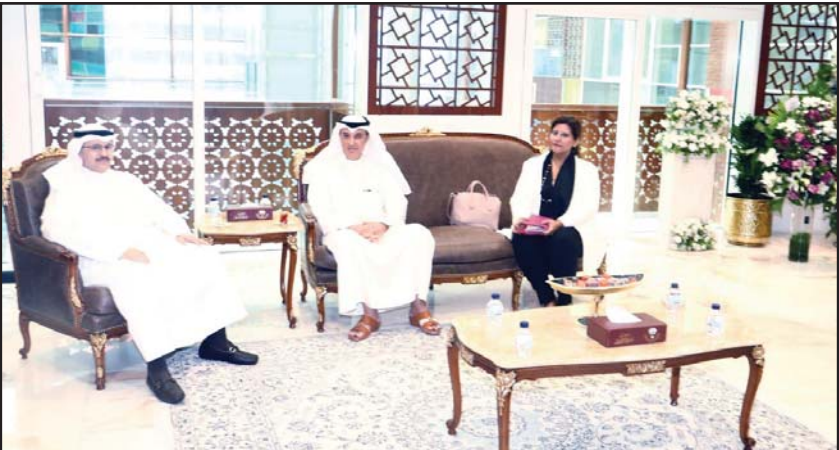
Minister of Social Affairs receives Foreign Ministry officials.