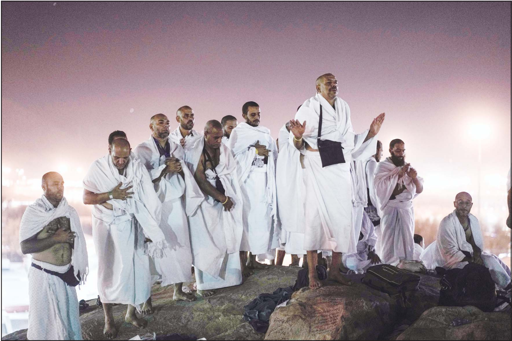
Muslim pilgrims pray on the rocky hill known as the Mountain of Mercy, on the Plain of Arafat, during the annual Hajj pilgrimage, near the holy city of Makkah, Saudi Arabia, Tuesday, June 27, 2023. Muslim pilgrims in Makkah circled the Ka'aba, Islam's holiest site, and then converged on a vast tent camp in the nearby desert, officially opening the annual Hajj pilgrimage on Monday, returning to its full capacity for the first time since the coronavirus pandemic.

KPC in new approach to energy transition