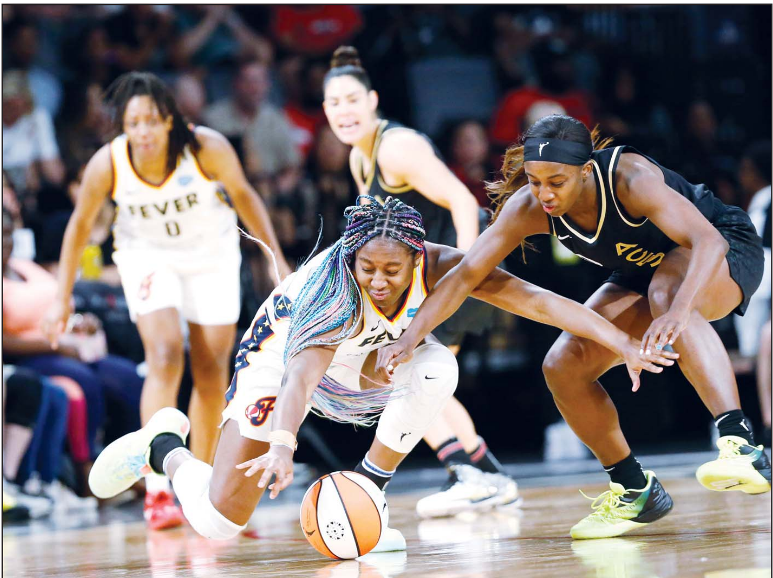
Indiana Fever forward Aliyah Boston (7) and Las Vegas Aces guard Jackie Young (0) go after the ball during the first half of a WNBA basketball game in Las Vegas.

Iowa basketball star Caitlin Clark was honored as the Collegiate Woman Athlete of the Year on Monday night. She received the Honda Cup in a ceremony at UCLA. It’s the second consecutive year that a women’s basketball player won the award as South Carolina’s Aliyah Boston was the recipient in 2022. Overall, 17 basketball players have won the Honda Cup - the most of any sport. Clark, the AP women’s basketball Player of the Year, helped Iowa reach the national championship game for the first time in school history this past April before the team lost to LSU. The junior became the first Division I women’s basketball player to have over 1,000 points and 300 assists in the same season. Other finalists for the award were Texas senior volleyball player Logan Eggleston and