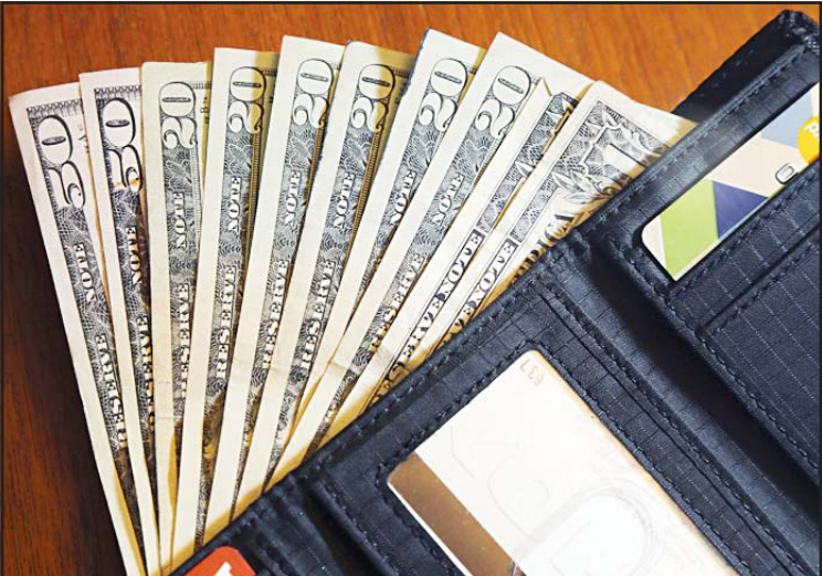
Cash is fanned out from a wallet in North Andover, Mass., June 15, 2018. Parenting comes with many responsibilities, and one is raising financially independent kids. Generally, it’s best to leave the money in your retirement accounts safely tucked away. Withdrawing money early can trigger taxes and a 10% penalty, plus it can cut into what you otherwise would’ve had for retirement.