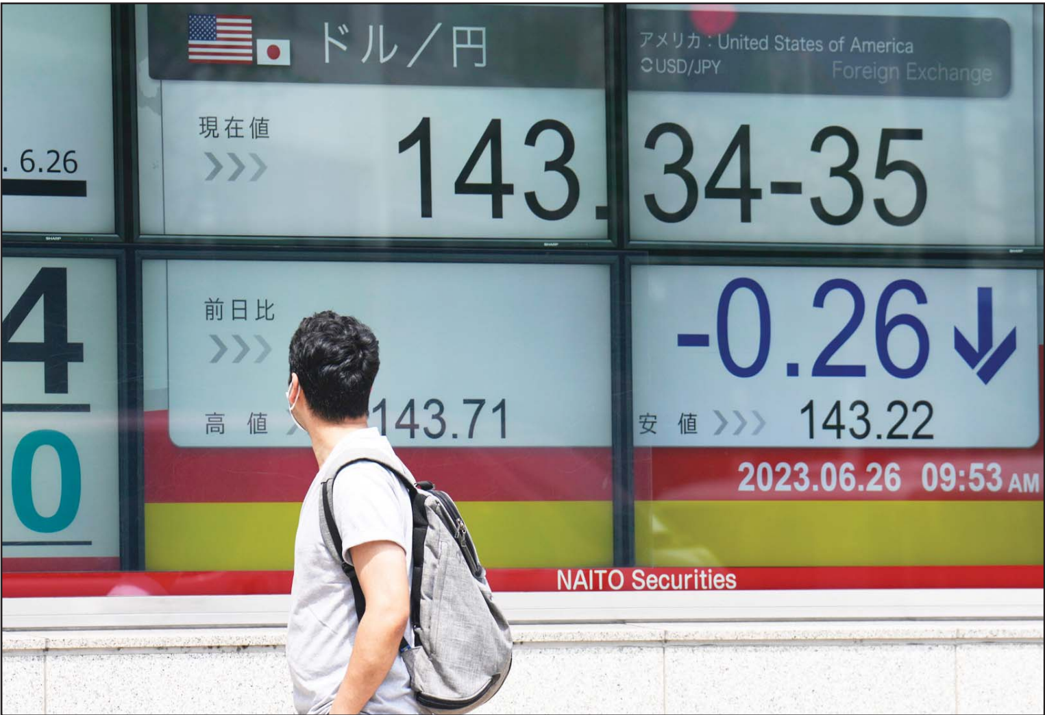
A man looks at monitors showing Japanese yen's foreign exchange rate against the U.S. dollar at a securities firm in Tokyo, Monday, June 26, 2023.