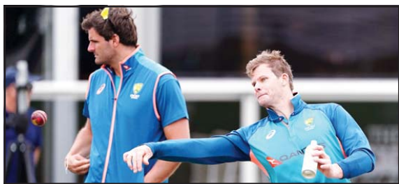
Australia's Steve Smith (right), attends a nets session at Lord's Cricket Ground, London, Tuesday, June 27, 2023, ahead of the second Ashes Test cricket match against England starting on Wednesday.