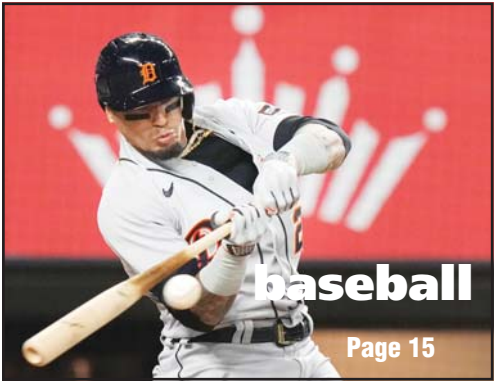
baseball Page 15