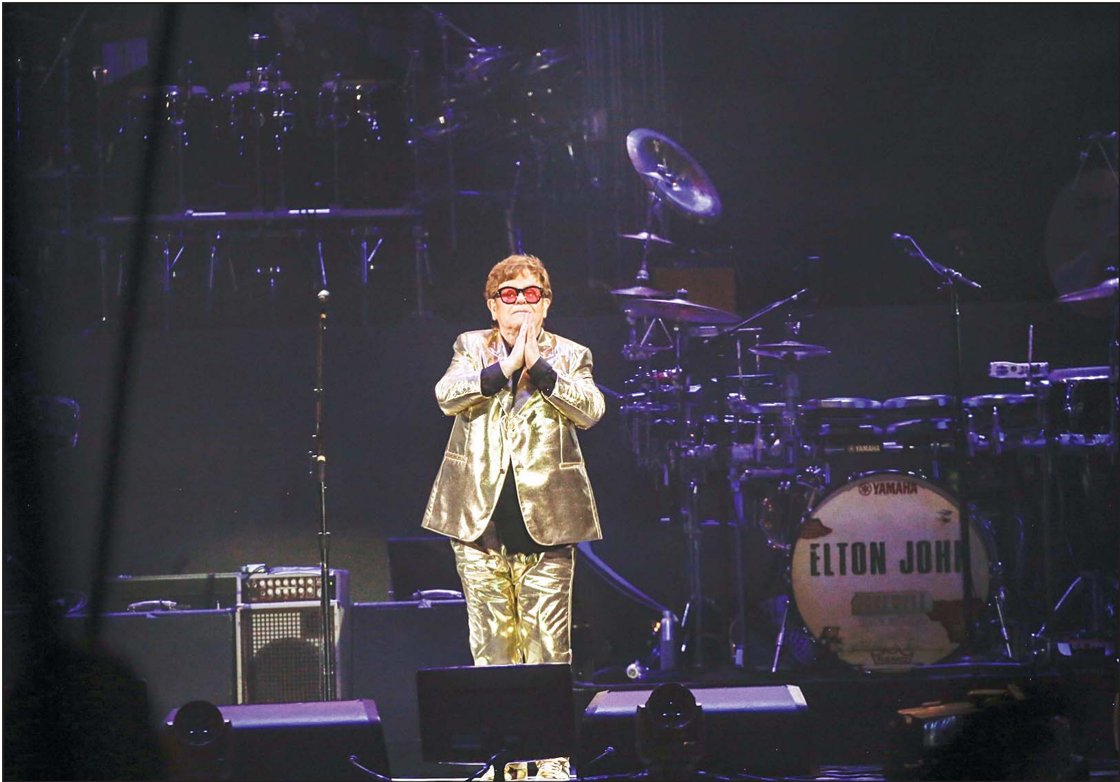
Elton John performs during Glastonbury Festival in Worthy Farm, Somerset, England, Sunday, June 25.