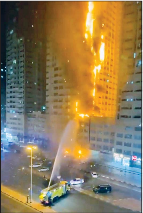
In this image made from the Ajman Police twitter, fire fighters try to extinguish a residential tower which caught fire early morning on Tuesday, June 27, 2023, in Ajman, United Arab Emirates. The fire tore through the high-rise residential building in the United Arab Emirates early Tuesday before being brought under control, according to videos circulating online. There were no immediate reports of injuries from the blaze in Ajman, one of the seven emirates that makes up the UAE, which also includes the futuristic cities of Dubai and Abu Dhabi. The footage showed a corner of the building engulfed in flames reaching from the ground level to the top, with debris falling to the street below. Ajman News, a local media outlet, later reported that the fire had been brought under control. (AP)

The public prosecution office said in a statement that the pair are suspected of sending about 5.5 million euros ($6 million) to bodies "related to the organization Hamas, which was sanctioned in 2003." (AP)