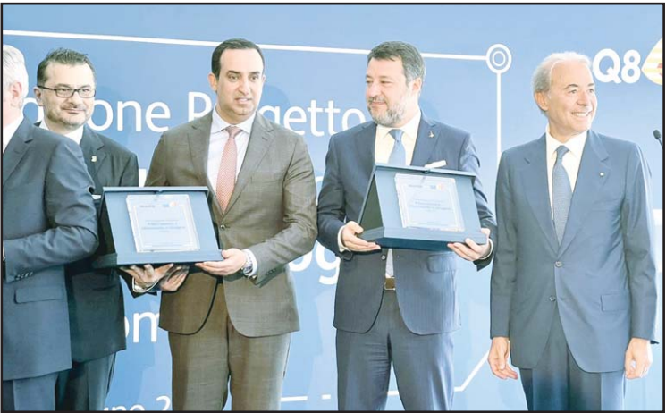
Kuwaiti Ambassador to Italy Nasser Al-Qahtani with Italian government officials. The Kuwait Petroleum International (Q8) announced Monday that it has started foundation of the first hydrogen refueling station in the Italian capital Rome.