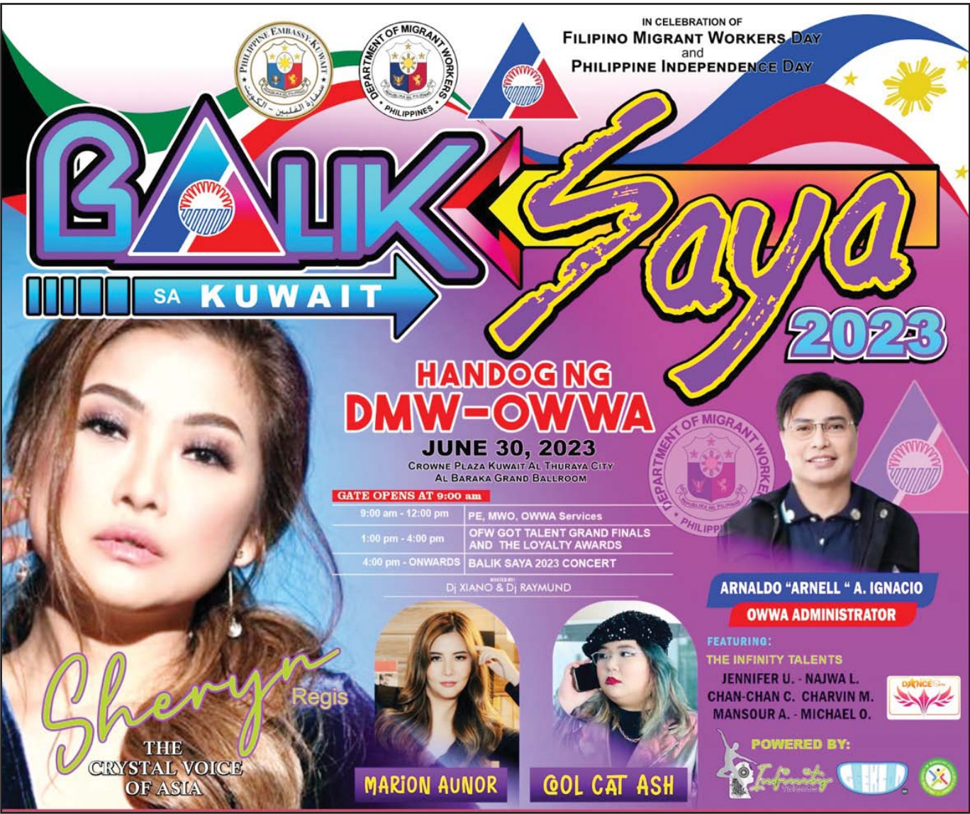
Balik Saya sa Kuwait 2023 Handog ng DMW-OWWA poster