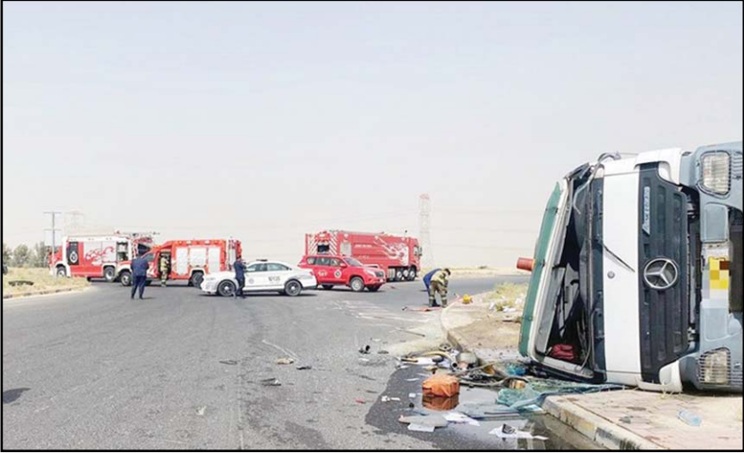
The Public Relations and Media Department of the Directorate-General of Fire Department (DGFD) said acting on information firemen rushed to the suburb of Sabah Al-Ahmad recently and closed one of the roads after a fuel tanker overturned and inflammable material started leaking from the tank, reports Al-Anba daily.