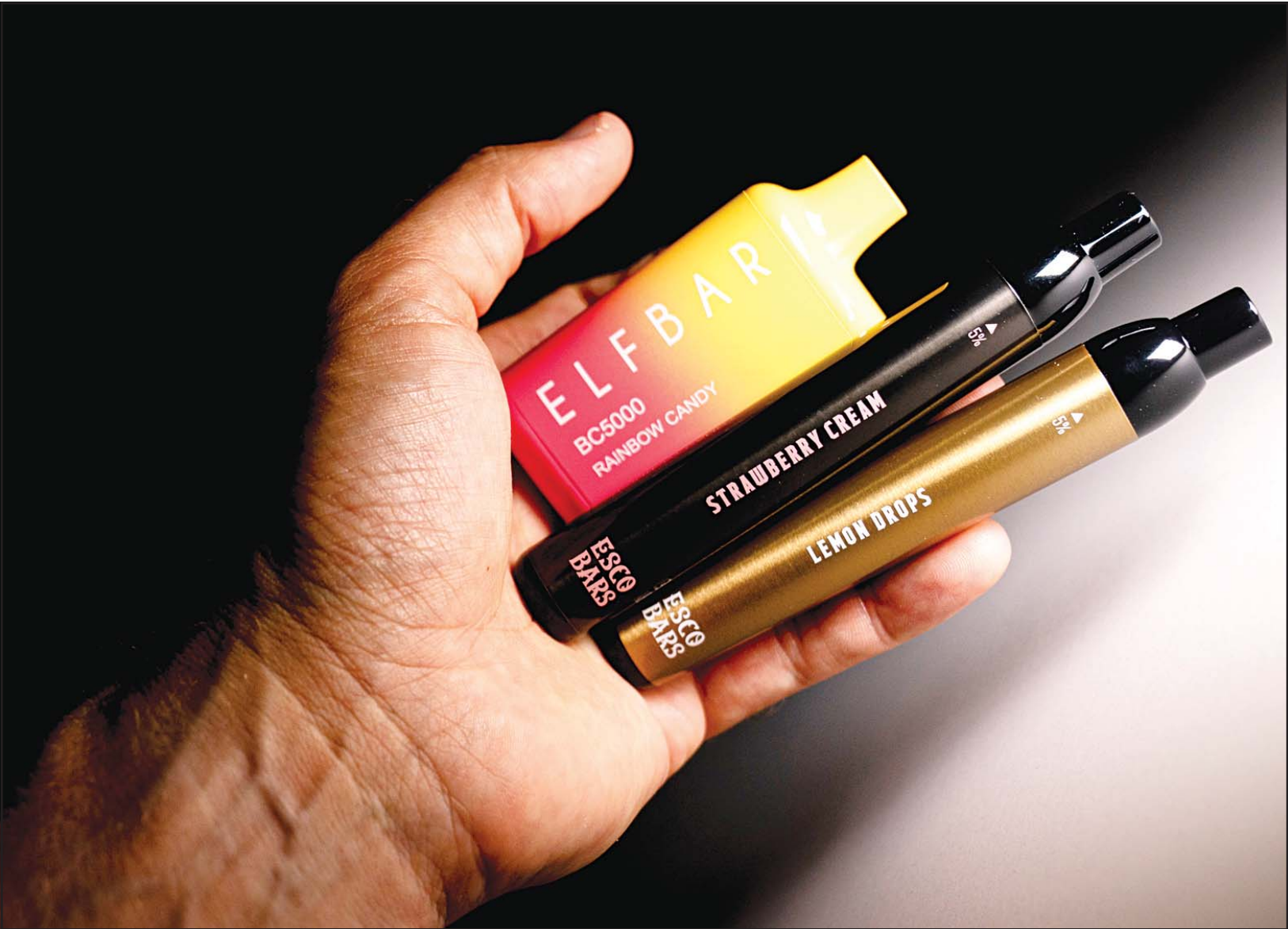
Elf Bar and Esco Bar disposable vaping devices are displayed, Monday, June 26, in Washington. The number of electronic cigarette devices sold in the US has nearly tripled since 2020, driven almost entirely by a wave of unauthorized disposable vapes from China, according to sales data obtained by The Associated Press. Recently US health regulators have begun trying to block imports of several of the biggest brands, including Elf Bar and Esco Bar.

The agency said that the people who were diagnosed received treatment and “are improving.”