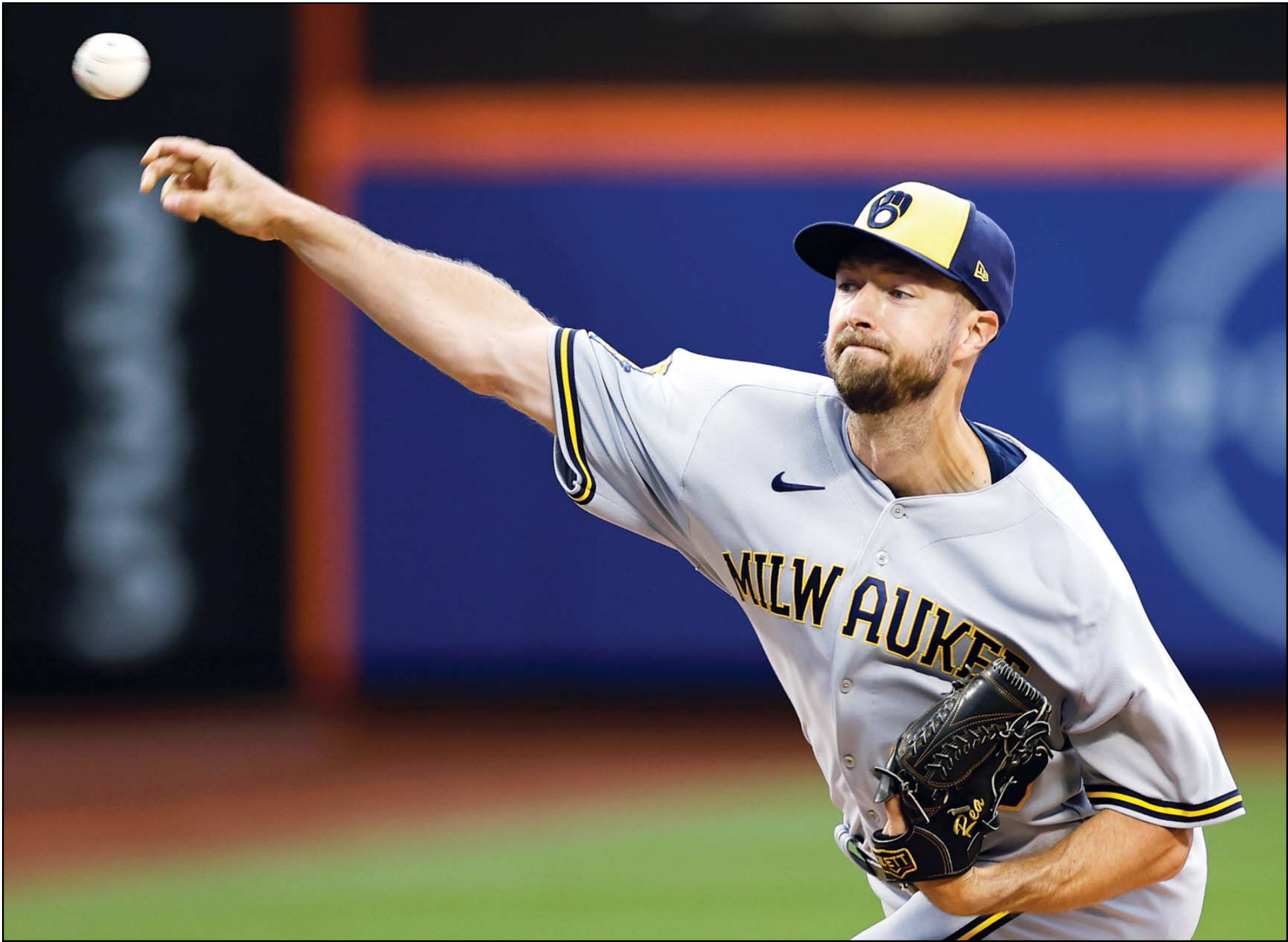
Milwaukee Brewers pitcher Colin Rea throws during the first inning of a baseball game against the New York Mets in New York.