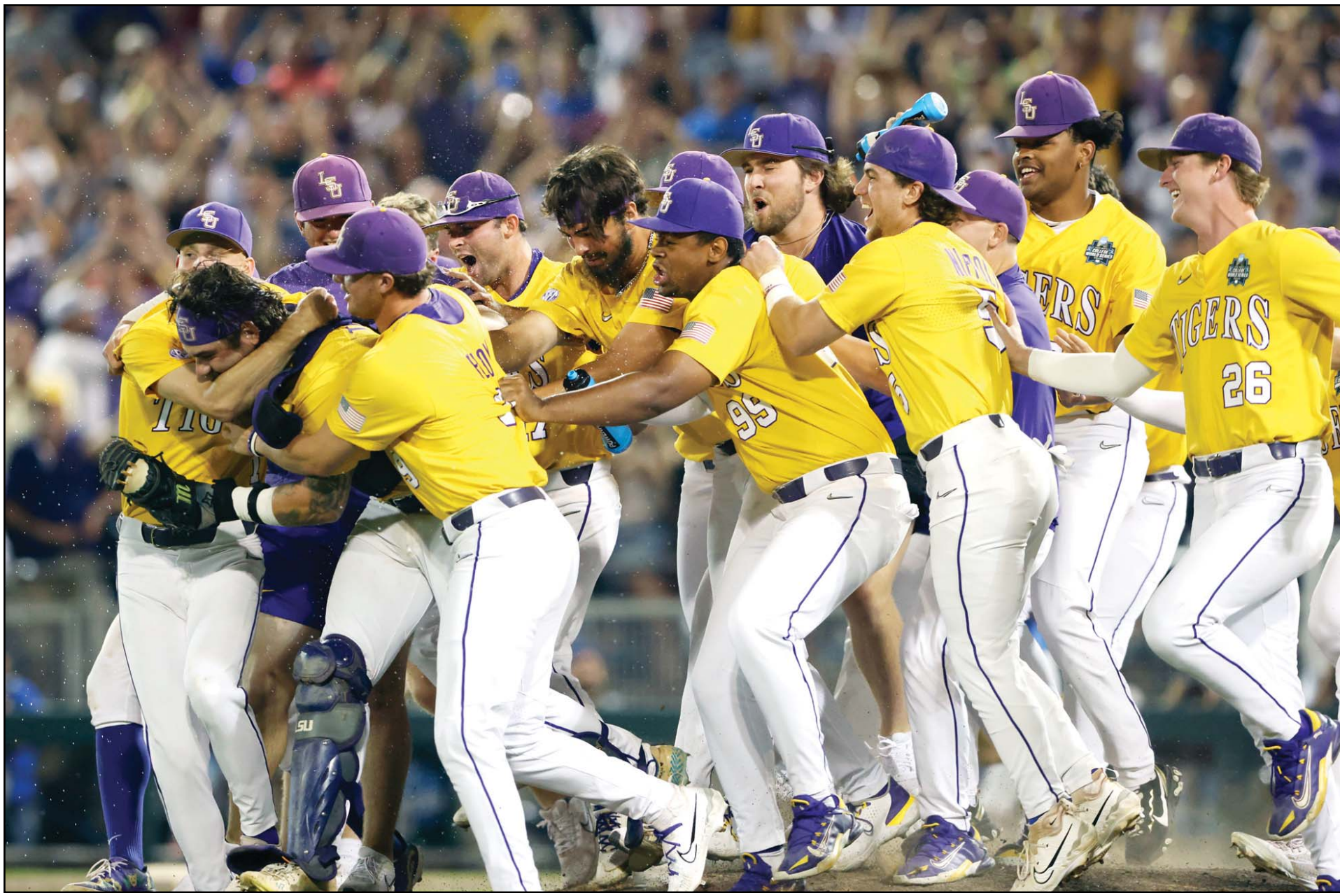
LSU celebrate after defeating Florida in Game 3 of the NCAA College World Series baseball finals in Omaha, Neb.

Florida (54-17) won the SEC regular-season title, was the No. 2 national seed and set school records for wins and home runs - the Gators hit 17 of the 35 homers by all teams in the CWS. But the Gators were unable to carry over the momentum from their record-setting production Sunday.