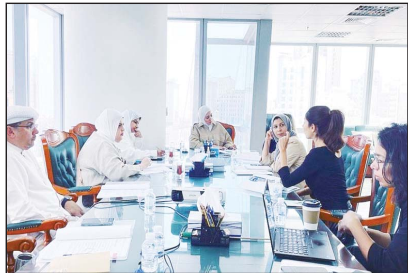
US Embassy staff hold talks with officials from the Education Ministry.