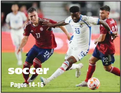
soccer Pages 14-16