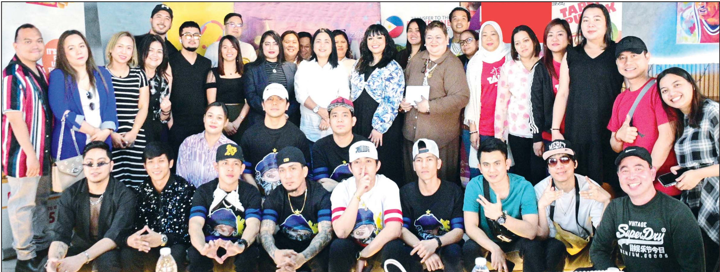
Group photo of Balik Saya sa Kuwait 2023 and OFW Got Talent organizers and some grand finalists.