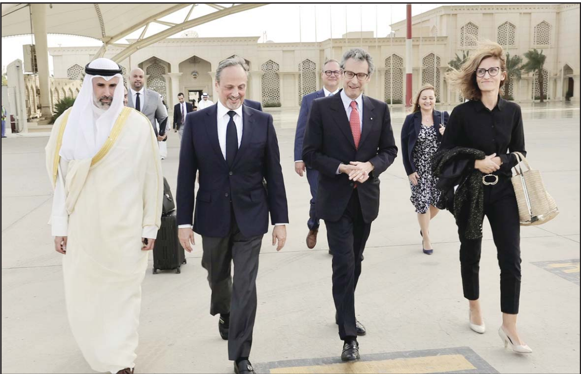
Minister of Foreign Affairs Sheikh Salem Abdullah Al-Jaber Al-Sabah heads to Europe in official visit.

They said the controls are not enforceable at the present time, but they will start being applied from the end of December, with the end of the grace period for reconciling conditions. The decision issued in May granted a six-month grace period to companies and institutions that provide sales and installment services. The sources affirmed that citizens and residents can currently purchase goods and services on installment basis according to the previous conditions and controls. Decision They explained that the decision issued by the Minister of Commerce and Industry Muhammad Othman Al-Aiban included new controls for credit facilities resulting from the installment sales of goods and services. It regulated the installment sales operations carried