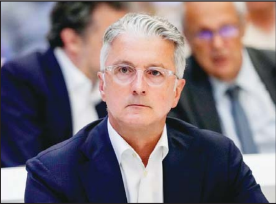
Rupert Stadler, former CEO of German car manufacturer Audi, sits in a regional court room and waits for the verdict in Munich, Germany, Tuesday, June 27, 2023.