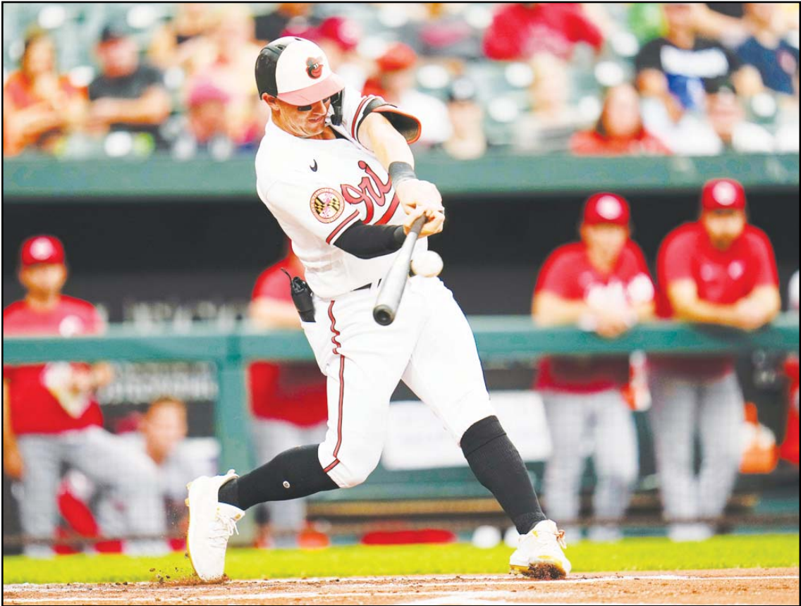
Baltimore Orioles’ Austin Hays flies out against the Cincinnati Reds during the first inning of a baseball game in Baltimore.

With Sethi out, the favored next chairman is a former holder of the office, Zaka Ashraf. Ashraf was a direct nominee of the prime minister.