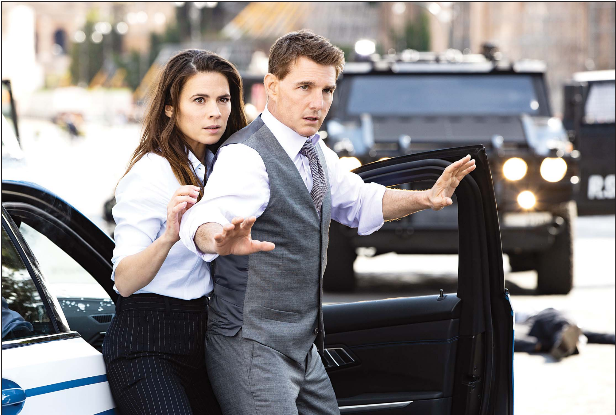
This image released by Paramount Pictures shows Hayley Atwell, (left), and Tom Cruise in ‘Mission: Impossible Dead Reckoning - Part One.’

Abu Dhabi rolls out red carpet to Hollywood megastar