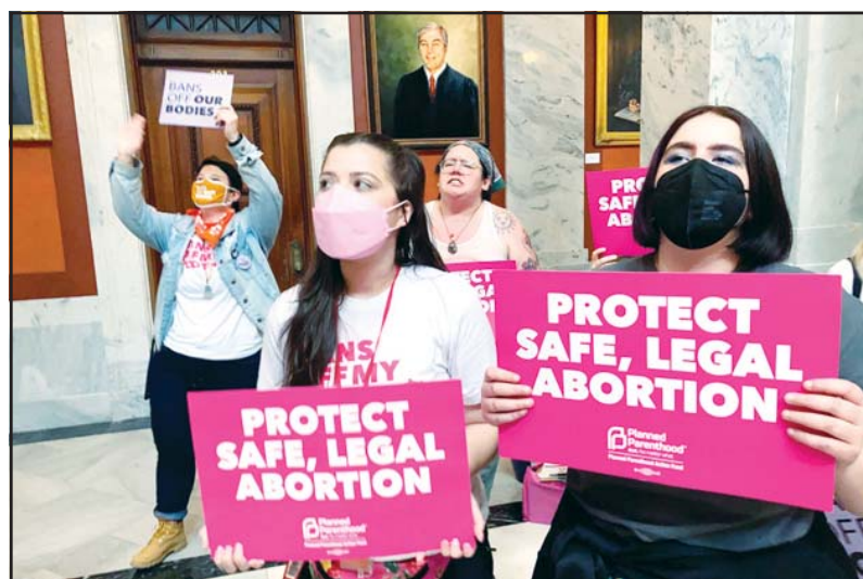
Abortion-rights supporters chant their objections at the Kentucky Capitol, April 13, 2022, in Frankfort, Ky. A pregnant woman in Kentucky who filed a lawsuit demanding the right to an abortion has learned her embryo no longer has cardiac activity, her attorneys said Tuesday, Dec 12, 2023. Her attorneys didn't immediately comment on what effect the development would have on the lawsuit filed last week in a state court in Louisville.