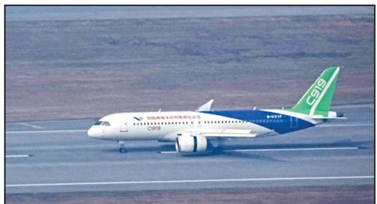
The Chinese-made C919 arrives at the Hong Kong International Airport in Hong Kong, on Tuesday, Dec. 12, 2023. The Chinese C919 commercial passenger jet has arrived in Hong Kong in the Chinese-made aircraft's first foray outside of mainland China. The C919 plane and another Chinese-made aircraft, an ARJ21, landed Tuesday and will be on display at Hong Kong's international airport until Sunday.

The narrow-bodied airliner was in development for 16 years and received certification in 2022. It has a maximum range of about 3,500 miles (5,630 kilometers) and is designed to carry 158-168 passengers.