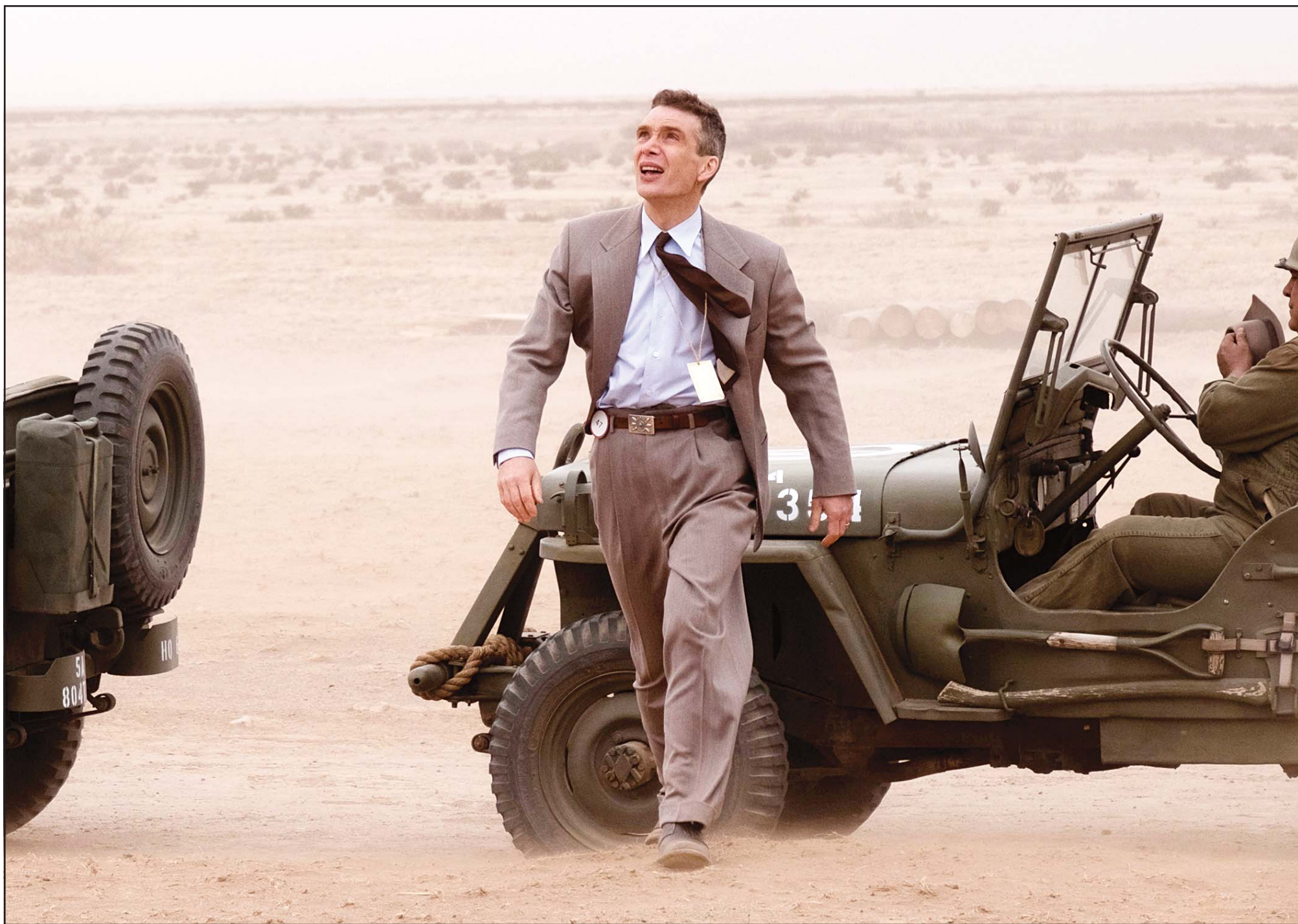
This image released by Universal Pictures shows Cillian Murphy in a scene from 'Oppenheimer.' (AP)