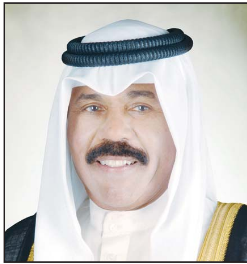
His Highness the Amir Sheikh Nawaf Al-Ahmad Al-Jaber Al-Sabah