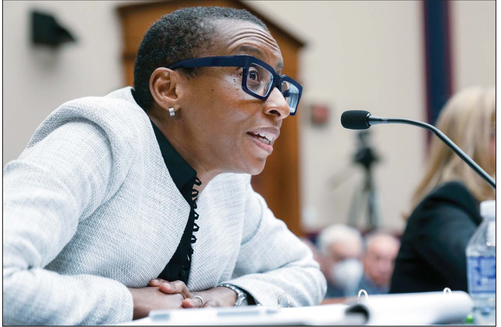
Harvard President Claudine Gay, left, speaks as University of Pennsylvania President Liz Magill listens during a hearing of the House Committee on Education on Capitol Hill, Tuesday, Dec 5, 2023 in Washington. Gay will remain leader of the prestigious Ivy League school following her comments last week at a congressional hearing on antisemitism, the university's highest governing body announced Tuesday, Dec 12.

Tusk said it hurts him to hear that Ukraine's President Volodymyr Zelenskyy has to keep trying to persuade world leaders about the need to continue supporting Kyiv's struggle against Russia. Ukraine's troubles are deepening as winter sets in and allies are growing tired of funding its defense.