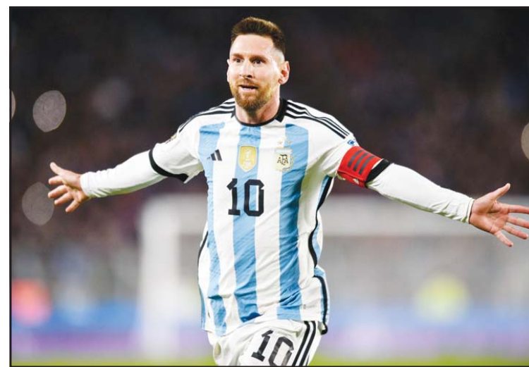
In this file photo, Argentina's Lionel Messi, celebrates scoring his side's first goal against Ecuador during a qualifying soccer match for the FIFA World Cup 2026, at Monumental stadium in Buenos Aires, Argentina.

In their respective matches, Al-Nasr triumphed over Al-Shabab with a 5-2 score, Al-Hilal secured a 3-0 victory against Al-Taawoun, and Al-Khaleej emerged successful with a 2-1 win over Abha.