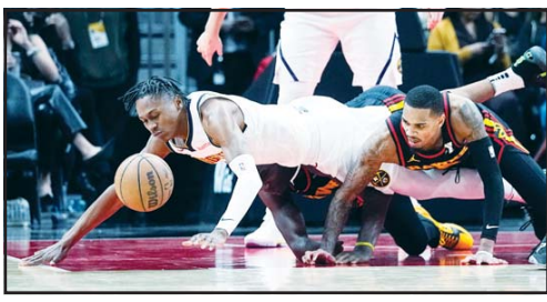
Denver Nuggets forward Peyton Watson (8) and Atlanta Hawks guard Dejounte Murray (5) dive for the ball during the second half of an NBA basketball game in Atlanta.