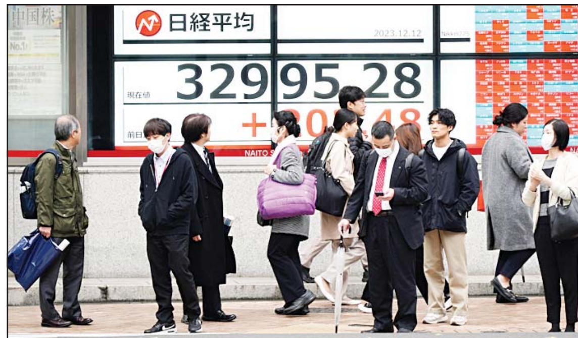
People walk in front of an electronic stock board showing Japan's Nikkei 225 index at a securities firm Tuesday, Dec. 12, 2023, in Tokyo. Asia markets opened higher following a positive close on Wall Street. Investors are eagerly awaiting a crucial U.S. inflation report later in the day, which will likely set the tone for the Federal Reserve's final meeting of the year on Wednesday.

Government officials said the investment in the BAE Systems' facility will ultimately save money for taxpayers. The money being paid out as the company hits benchmarks will help quadruple the plant's production capacity, helping to halve the price of making the chips and leading to net savings for the federal agencies buying the chips.