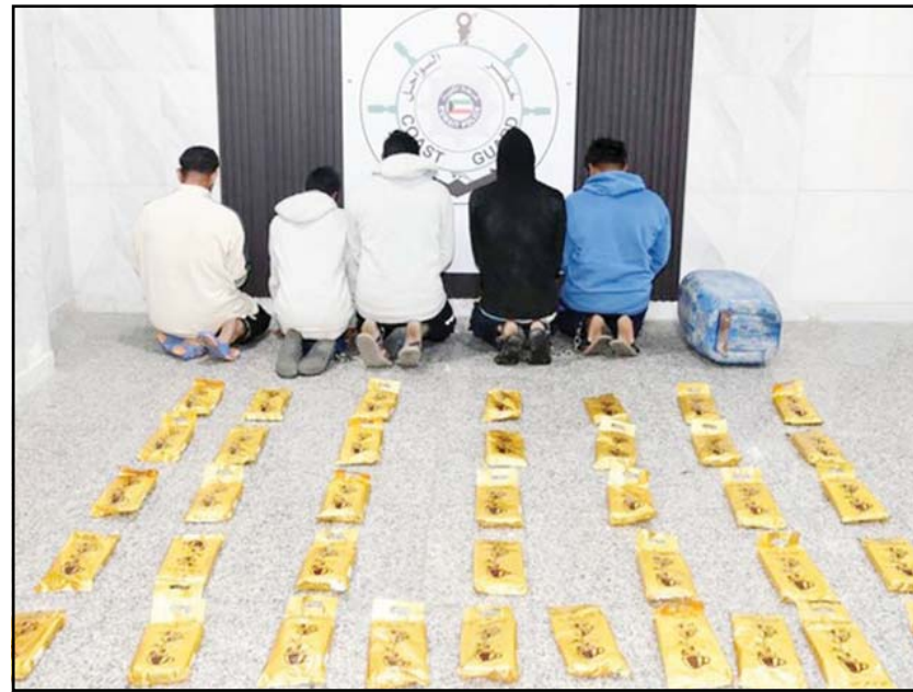
Some of those arrested recently for smuggling of drugs.

The two defendants began the activity under the name of a company and shifted the money between their personal accounts through a group of banking operations, after which the money was transferred via an exchange company to external entities, to cover and hide its illicit source.