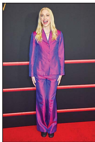
Chloe Cherry attends the premiere of 'The Iron Claw,' Monday, Dec. 11, at the DGA Theater in Los Angeles.