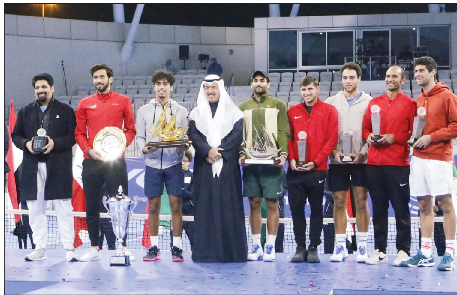
A file photo of Sheikh Ahmed Al Jaber with winners.