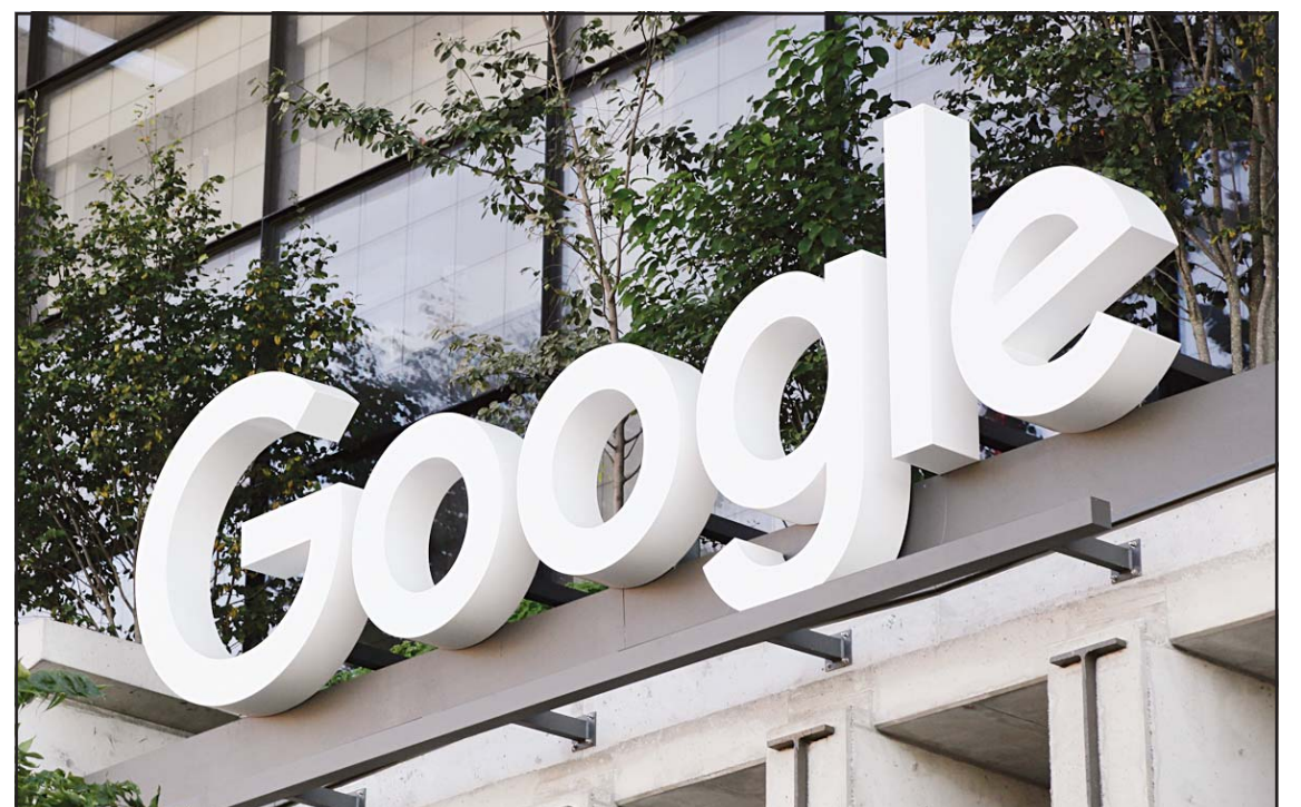
The Google sign is shown over an entrance to the company's new building in New York on Sept. 6, 2023. A federal court jury has decided that Google's Android app store has been protected by anticompetitive barriers that have damaged smartphone consumers and software developers, dealing a blow to a major pillar of a technology empire.