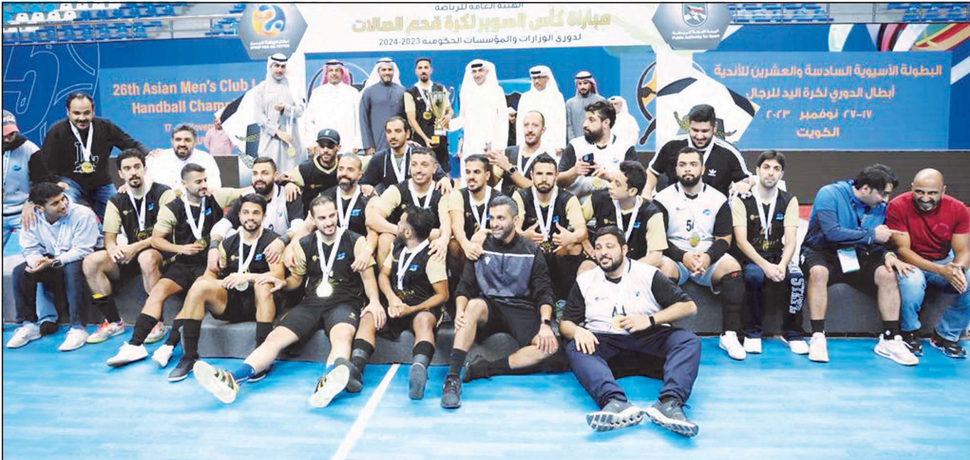
Men's Futsal Super Cup champion, Ministry of Electricity and Water celebrate with officials.