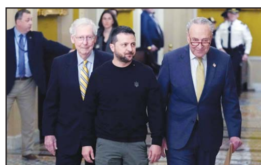
Ukrainian President Volodymyr Zelenskyy (center), walks with Senate Minority Leader Mitch McConnell of Ky. (left), and Senate Majority Leader Chuck Schumer of NY (right), during a visit to Capitol Hill in Washington, Dec 12, 2023. — See Page 6

The assault on the oil and chemical tanker Strinda expands a campaign by the Iranian-backed rebels targeting ships close to the Bab el-Mandeb Strait into apparently now striking those that have no clear ties to Israel. That potentially imperils cargo and energy shipments coming through the Suez Canal and further widens the international impact of the Israel-Hamas war now raging in the Gaza Strip.