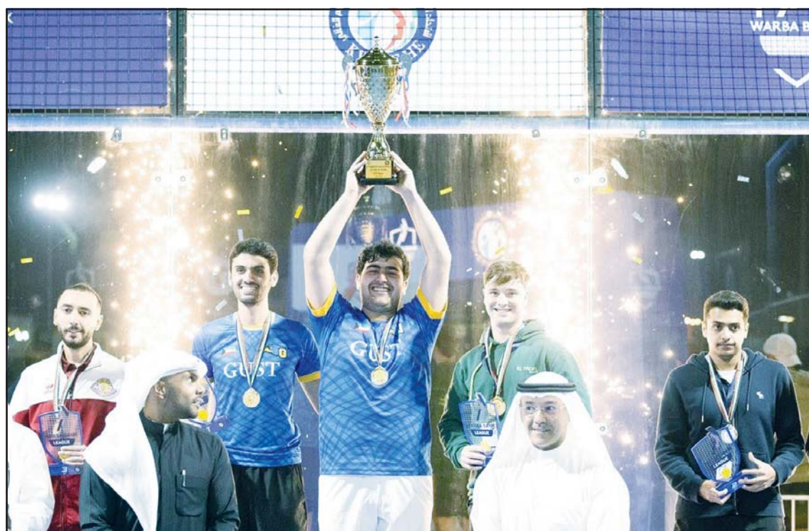
Gulf University for Science and Technology players raise the championship trophy.

Earlier this month, France's sports minister called for "a global and extraordinarily determined response" to violence in soccer after the death of a fan. Ameli Oudea-Castera said the measures could include routine bans on fans traveling to away matches that present a risk of violence.