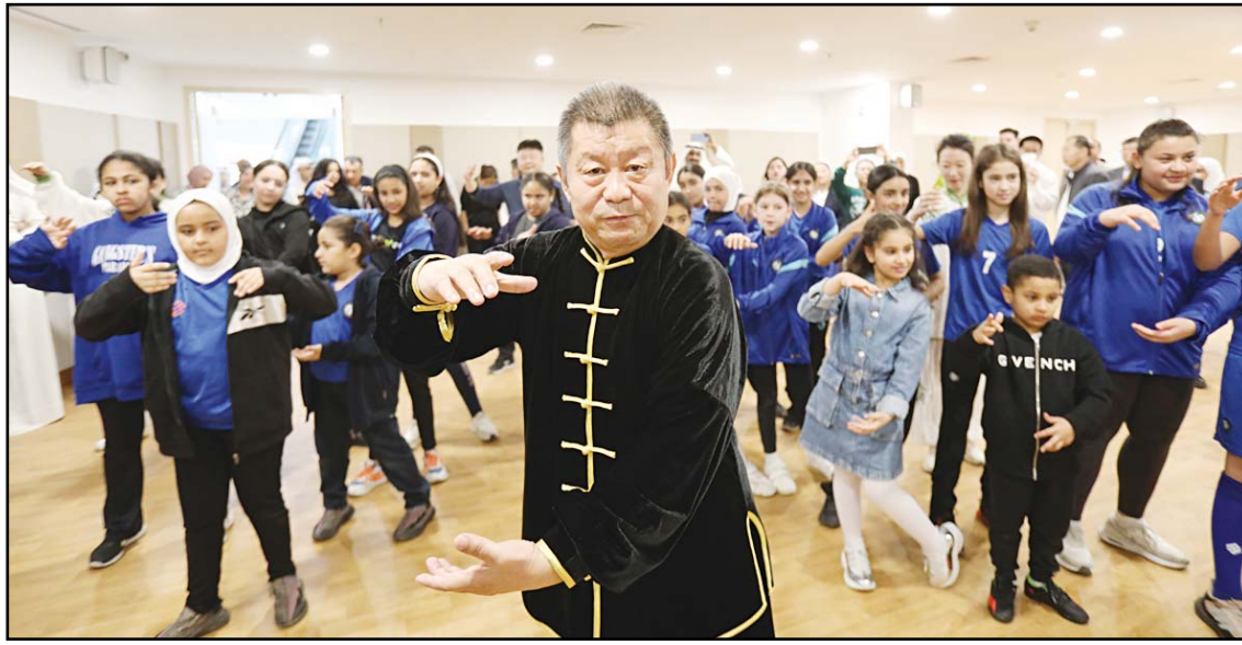
Above: Some photos from the 'shadow boxing' session.