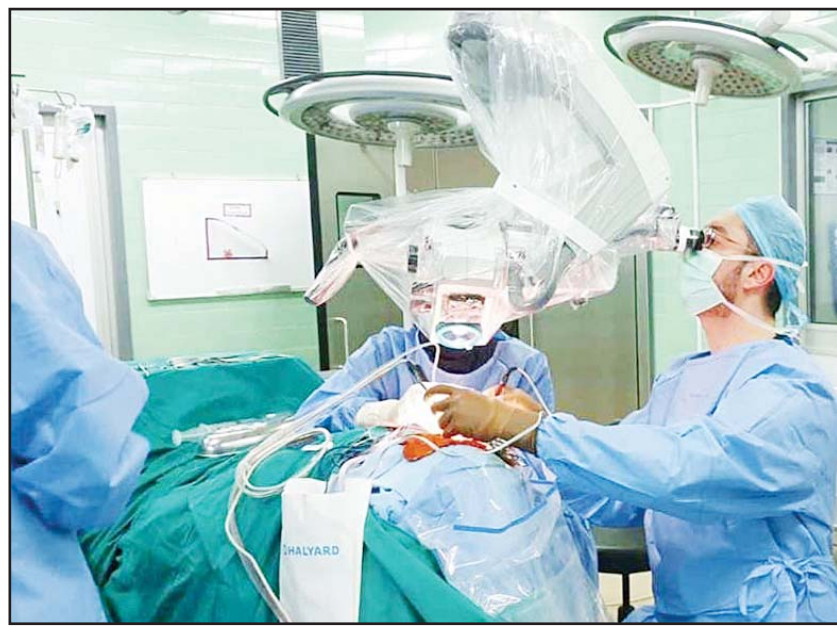
Organ transplant operation in progress.