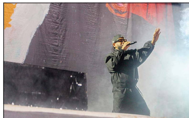
Grammy award-winning rapper Kendrick Lamar performs at the inaugural Hey Neighbour Festival in Pretoria, South Africa, Saturday, Dec. 9.

The decision comes nearly a year after Tate, his brother Tristan and two Romanian women were arrested near Bucharest. Romanian prosecutors formally indicted all four in June. They have denied the allegations.