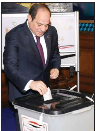
In this photo provided by Egypt's presidency media office, Egyptian President Abdel Fattah El-Sisi, casts his vote for the presidential elections at a polling station, in Cairo, Egypt, Dec. 10, 2023.