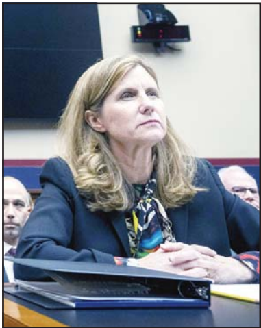
University of Pennsylvania President Liz Magill listens during a hearing of the House Committee on Education on Capitol Hill, Tuesday, Dec. 5, 2023 in Washington. The University of Pennsylvania’s president has resigned amid pressure from donors and criticism over testimony at a congressional hearing where she was unable to say under repeated questioning that calls on campus for the genocide of Jews would violate the school’s conduct policy.

Lankford declined to discuss specifics after the Thursday meeting, but said he was trying to “negotiate in good faith.” He said the historic number of migrants at the border could not be ignored.