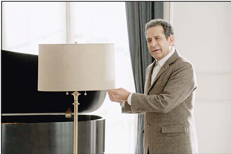
This image released by Peacock shows Tony Shalhoub as Adrian Monk in a scene from ‘Mr. Monk’s Last Case: A Monk Movie.’ — Details Page 11

Zephaniah died Thursday after being diagnosed with a brain tumor eight weeks