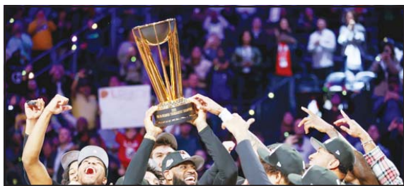
Los Angeles Lakers forward LeBron James (center), lifts the NBA Cup while celebrating with teammates after they defeated the Indiana Pacers 123-109 in the championship game in the NBA basketball In-Season Tournament in Las Vegas.