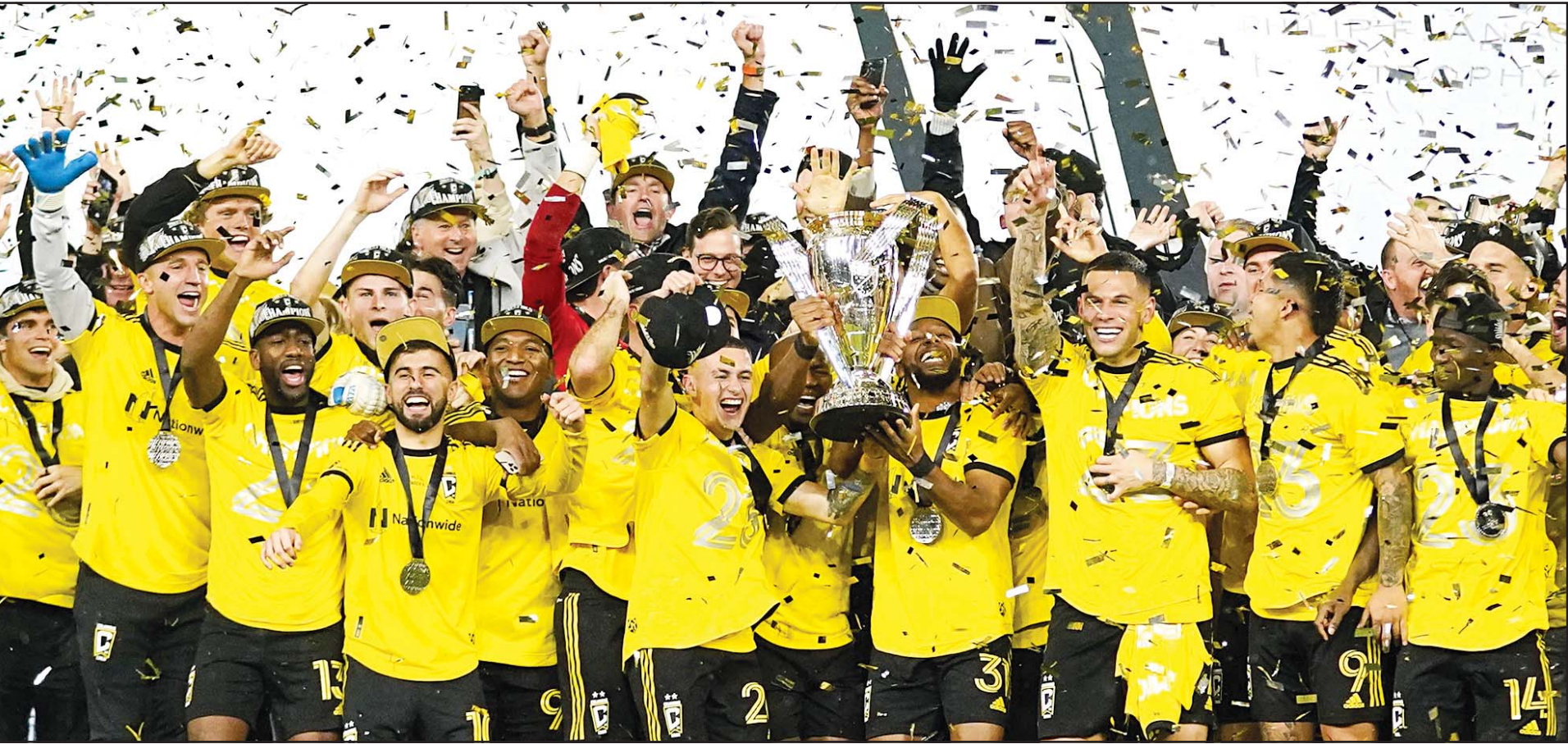
Columbus Crew players celebrate with the trophy after defeating Los Angeles FC to win the MLS soccer championship match in Columbus, Ohio.

"They played a fantastic game," Cherundolo said. "They played exactly how you need to play against LAFC. If you want to beat us, create enough mo-