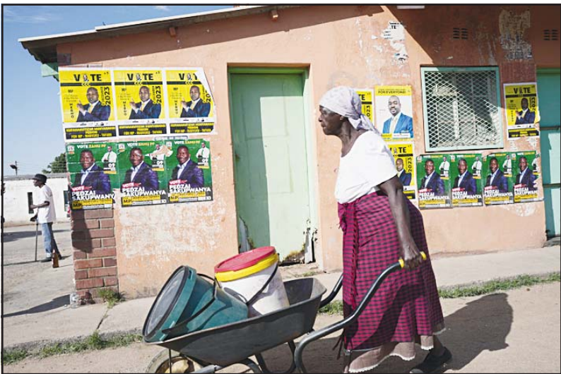
An elderly woman pushes a wheelbarrow past campaign posters in Mabvuku on the outskirts of Harare, Saturday, Dec. 9, 2023. Zimbabwe was holding by-elections Saturday for nine seats in Parliament after opposition lawmakers were removed from their positions and disqualified from standing again in what they have called an illegal push by the ruling ZANU-PF party to bolster its majority and have the power to change the constitution.

Another late-night court ruling Friday left the ZANU-PF candidate set to win one of the seats in the capital, Harare, uncontested.