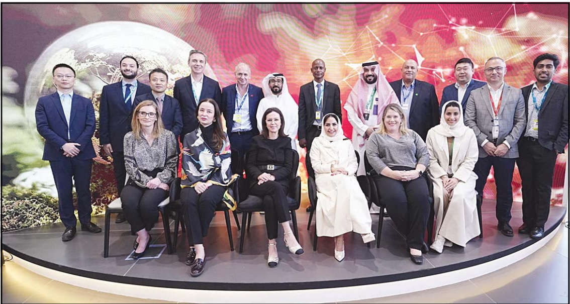
Zain Group and other GCC telco representatives during the alliance meeting.

totaling 19.334 billion dinars (approximately 62.7 billion dollars) on an annual basis by the end of the second quarter of 2023. Despite this annual increase, there was a decline compared to the first quarter of 2023, dropping by about 1.1 billion dinars or 5.4%, from 20.44 billion dinars to 19.334 billion dinars. The data also indicates fluctuations in Kuwait's external debt during the years 2022-2023, with amounts ranging from approximately 18.99 billion dinars in the second quarter of 2022 to 20.44 billion dinars in the first quarter of 2023. It's important to note that the total external debt encompasses both the general government's external debt balances and the private sector's external debt balances, covering various entities such as local banks, investment companies, exchange companies, insurance companies, and private non-financial companies.