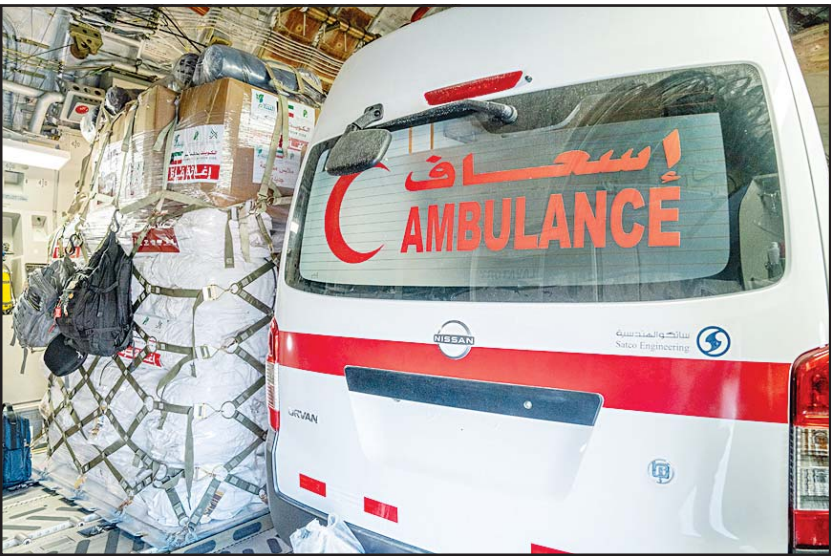
Three ambulances for the Palestinians in Gaza being sent.

There are work centers that require the presence of employees in the evening. There are currently research laboratories at the university with a severe shortage of workers, namely library management, deanship of Student Affairs, and College of Graduate Studies.