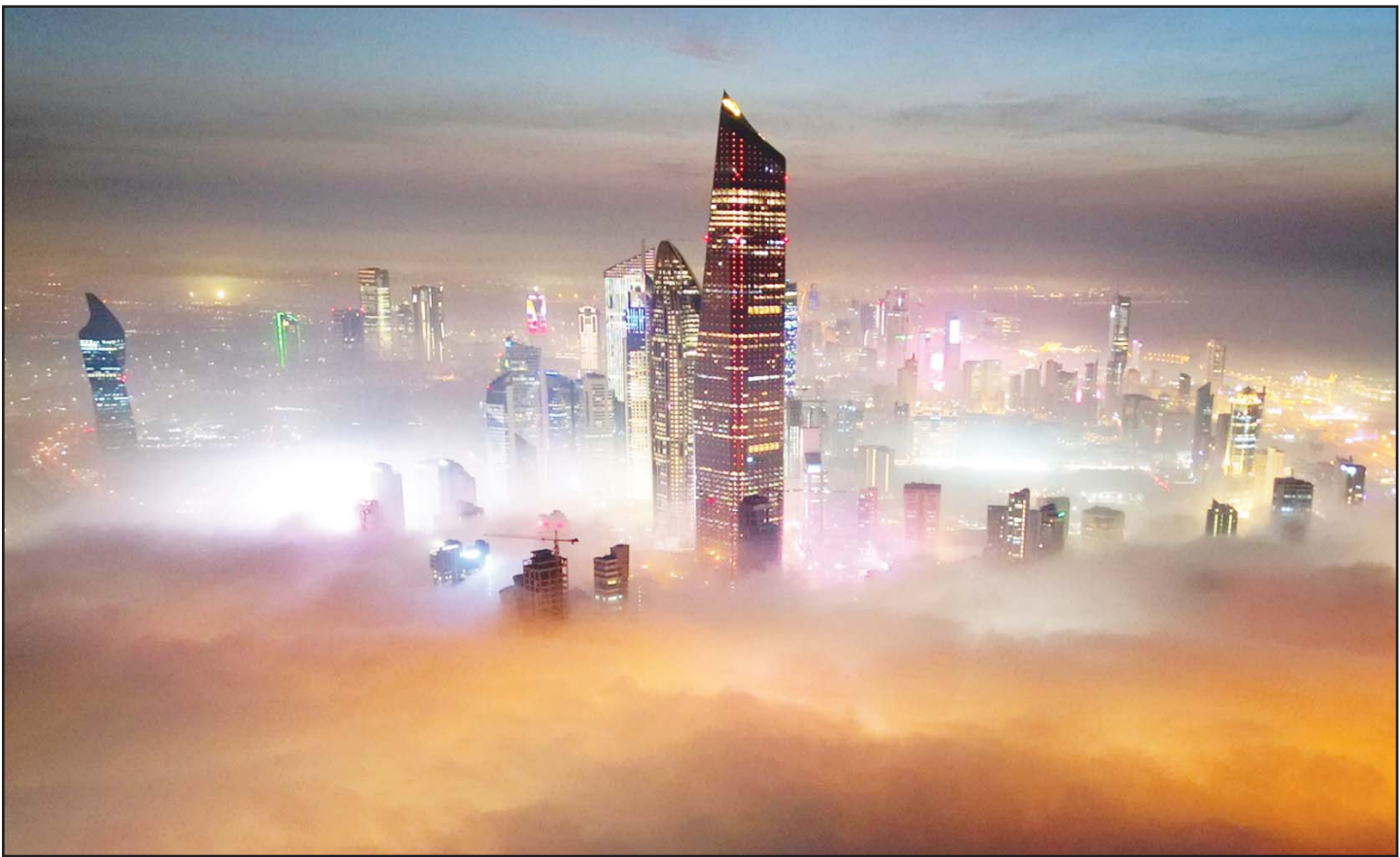
Kuwait blanketed in fog on Sunday as the Ministry of Interior urged motorists to navigate cautiously amidst reduced visibility. — See Page 3

DUBAI, Dec 10, (Agencies): Kuwait's pavilion at the Conference of the Parties (COP28), held in Dubai, displayed a rich cultural front that talks about the Kuwaiti efforts in supporting global environmental initiatives and its commitment to Gulf, regional and international resolutions of carbon neutrality in the oil field in 2050 and nationwide in 2060.