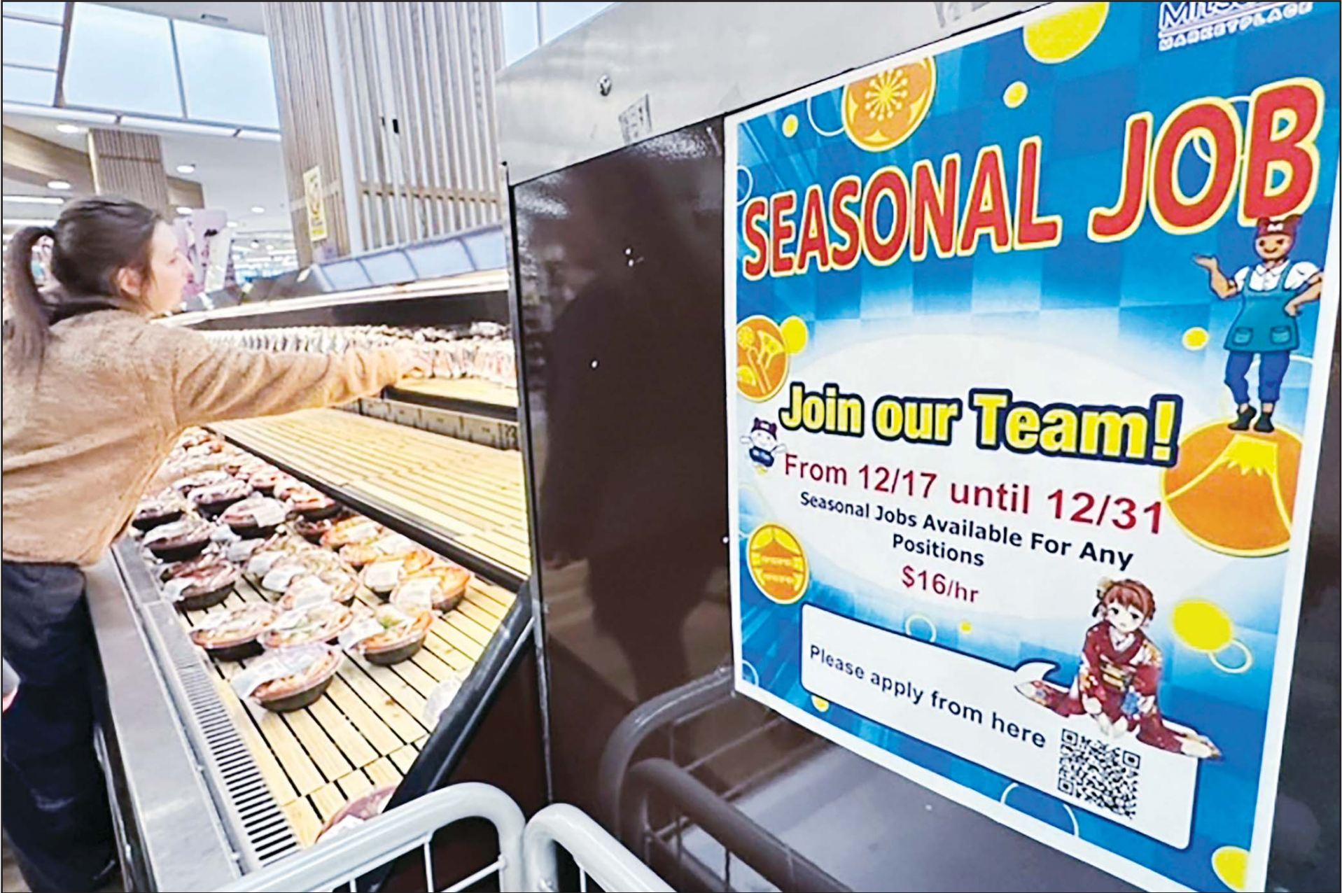
A hiring sign is displayed at a grocery store in Arlington Heights, Ill., Monday, Dec. 4, 2023.