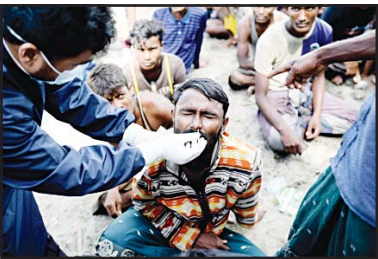
A paramedic performs a nasal swab test to an ethnic Rohingya man after he and his group landed in Pidie, Aceh province, Indonesia, Sunday, Dec. 10, 2023. Two boats carrying hundreds of Rohingya Muslims, including women and children, arrived at Indonesia’s northernmost province of Aceh on Sunday morning after being adrift for weeks.

The operations, which require approval from the U.N. Security Council to be extended, have gradually gone into retreat in Africa.