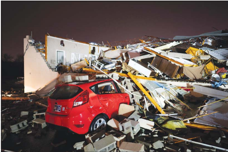
A car is buried under rubble on Main Street after a tornado hit Hendersonville, Tenn., Saturday, Dec 9, 2023. Severe storms that tore through central Tennessee killed six people Saturday and sent about two dozen to the hospital as homes and businesses were damaged in multiple cities.

Police said three victims in their 20s were pronounced dead at the scene and the fourth was transported to a hospital. The shooting victim who survived was “alert, conscious