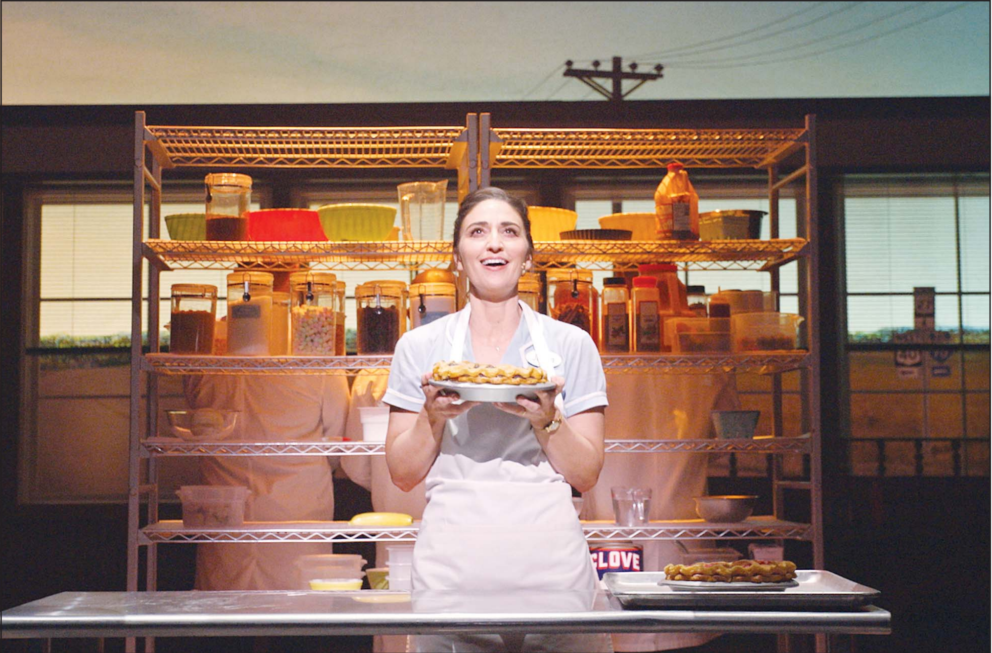
This image released by Bleecker Street shows Sara Bareilles in a scene from ‘Waitress: The Musical.’