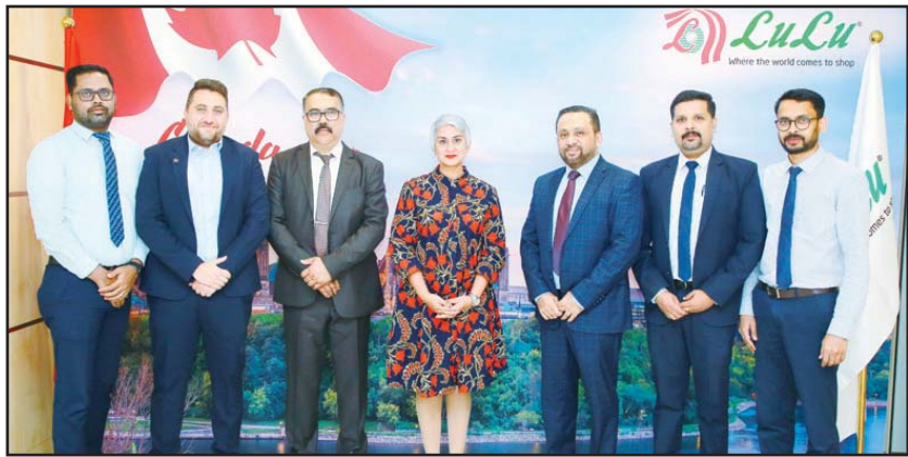
Top and above: Pictures taken at the meeting.