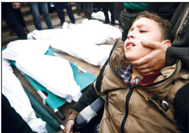
Palestinians mourn relatives killed in the Israeli bombardment of the Gaza Strip outside a morgue in Khan Younis on Dec. 10, 2023.