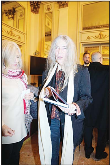
Patti Smith arrives to attend La Scala opera house’s gala season opener, Giuseppe Verdi’s opera ‘Don Carlo’ at the Milan La Scala theater, Italy, Thursday Dec. 7. The season-opener Thursday, held each year on the Milan feast day St. Ambrose, is considered one of the highlights of the European cultural calendar.

“So many times when you do a play, especially in New York, they’re like, ‘What’s this going to be? Go ahead, entertain me, move me.’ But with ‘Spamalot,’ it’s more like, ‘OK, don’t mess it up.’ It’s more like, ‘We’re with you, but you better bring it. You better bring out a rabbit or I’m not going to like it.’”