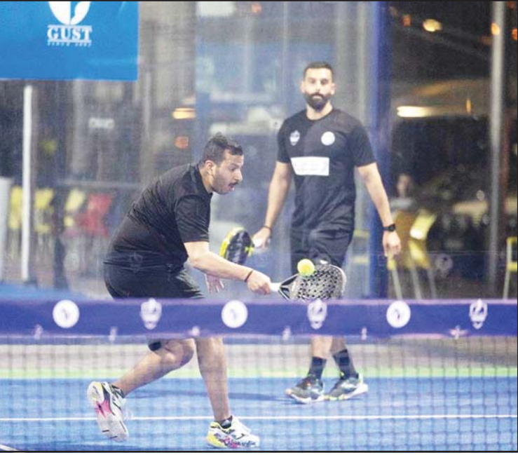
Some of the players in action.

Technical Committee of the Football League, highlighted the committee's commitment to addressing concerns from participating institutions regarding scheduling conflicts with the Private Universities League. He emphasized that adjustments were made to the league dates to accommodate teams that qualified for the semi-finals of the Private Universities League, ensuring a smooth and inclusive competition.