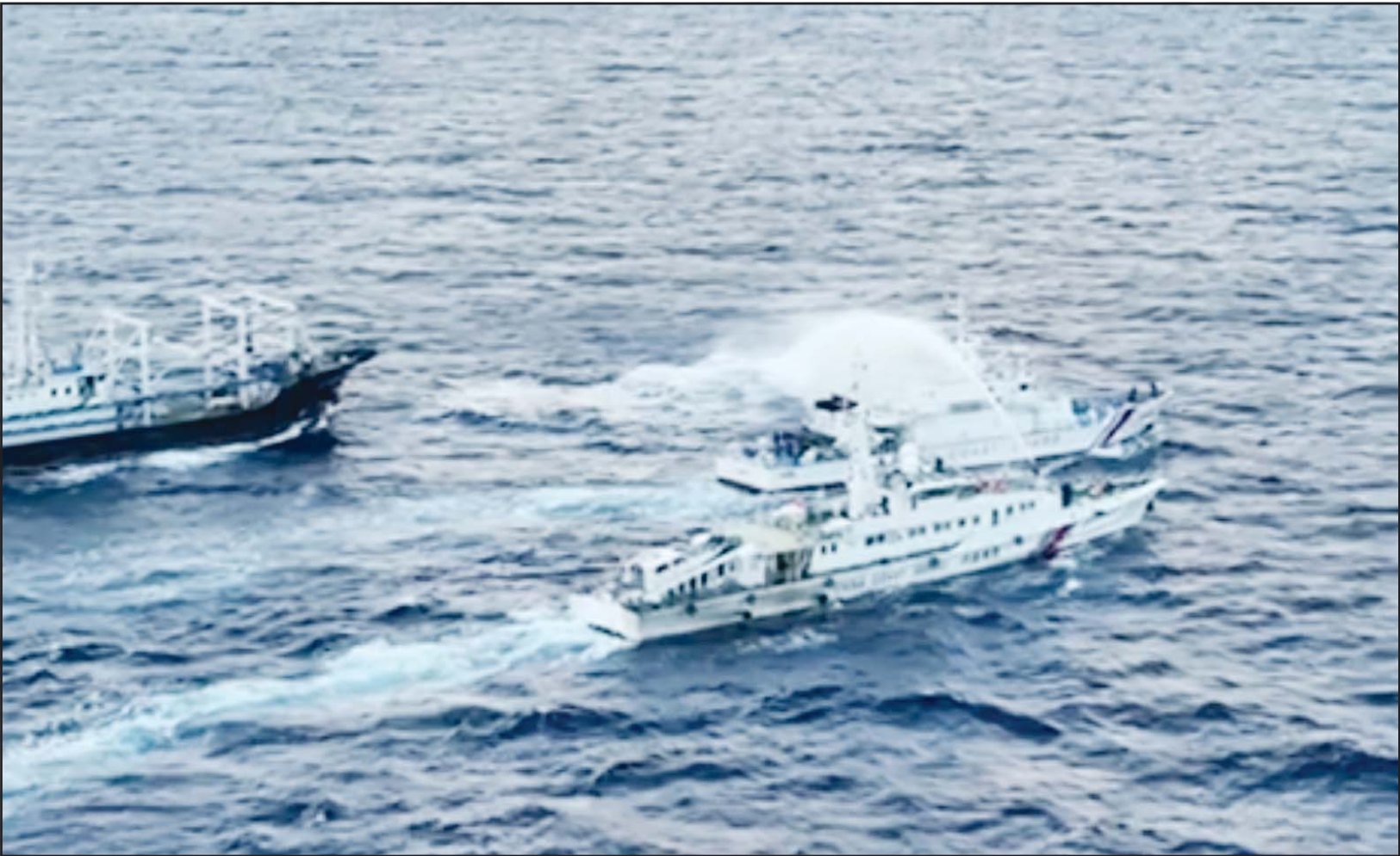
A Chinese Coast Guard ship, bottom, uses water cannon at Philippine coast guard patrol ship, BRP Cabra, center, as it approaches Second Thomas Shoal, locally known as Ayungin Shoal, in the disputed South China Sea on Sunday Dec. 10, 2023. The Chinese coast guard targeted Philippine vessels with water cannon blasts Sunday and rammed one of them, causing damage and endangering Filipino crew members off a disputed shoal in the South China Sea, just a day after similar hostilities at another contested shoal, Philippine officials said.

Argentines disillusioned with the economic status quo - triple-digit inflation, four in 10 people in poverty, a plunging currency - proved receptive to an outsider’s outlandish ideas to remedy their woes and transform the nation. He won the election’s Nov. 19 second round decisively - and sent packing the Peronist political force that dominated Argentina for decades.