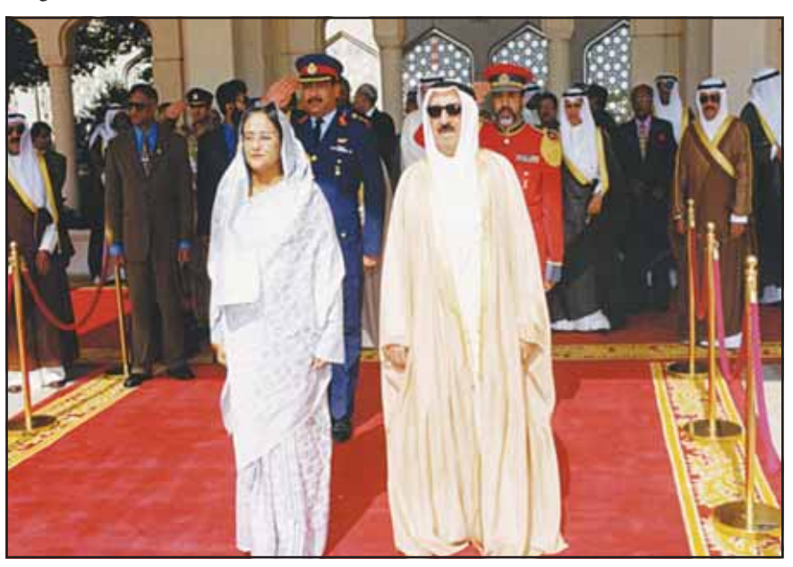
Former Amir of Kuwait His Highness Sheikh Sabah Al-Ahmad Al-Sabah and Her Excellency Sheikh Hasina, Hon'ble Prime Minister of Bangladesh during her visit to Kuwait in 2010.

One of the major objectives of Vision 2041 of Bangladesh is to reach to the status of developed country by 2041. In this aspect, State of Kuwait contributing significantly in particular by hosting around three hundred thousand Bangladeshi nationals. Our sincere thanks and respect to His Highness and His esteemed ministries and definitely the people of this great nation, Kuwait.