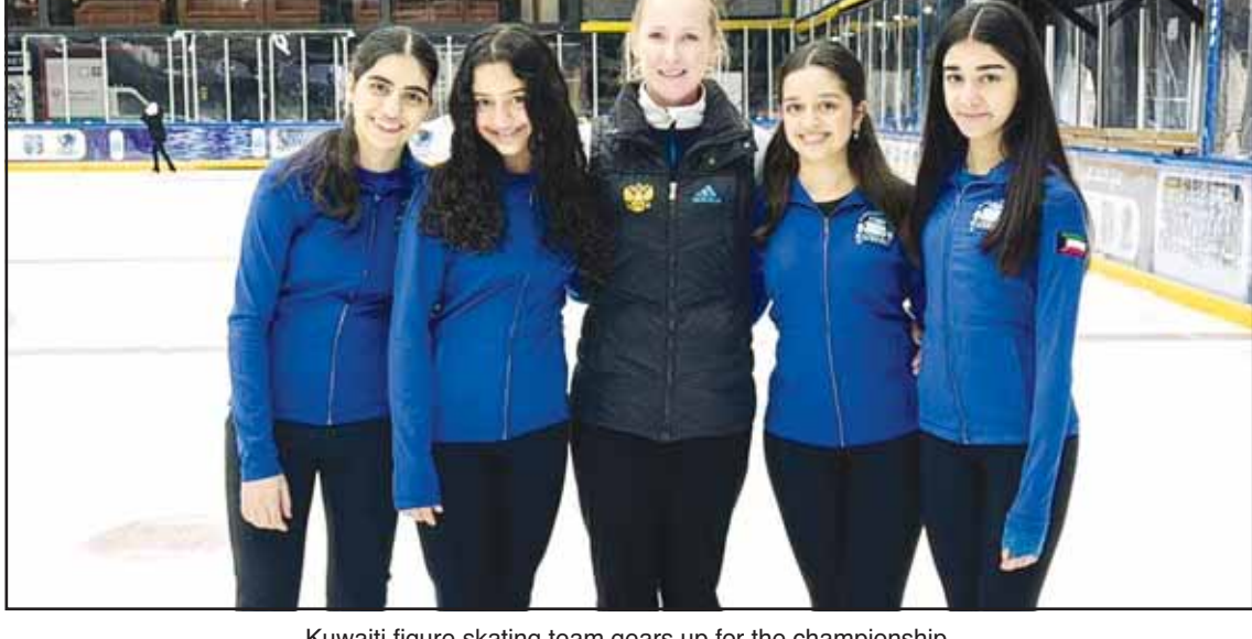
Kuwaiti figure skating team gears up for the championship.

The Zain Premier League will go on hiatus until April 27 to accommodate the participation of the Kuwaiti Under-23 Olympic team in the Asian Cup finals, scheduled to take place in Qatar