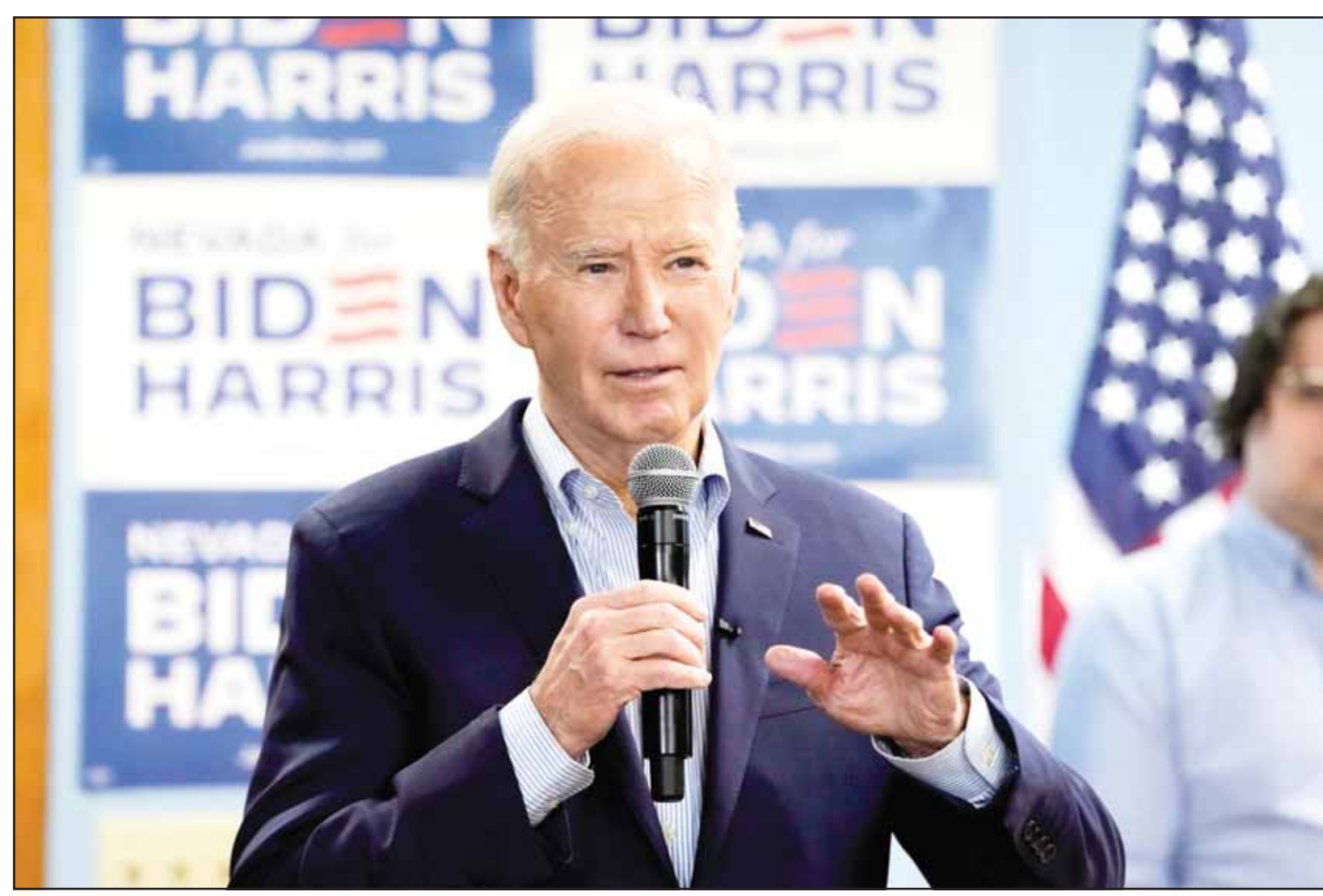
US President Joe Biden speaks at the Washoe Democratic Party Office in Reno, Nev., March 19, 2024. Biden has credited Latino voters as a key reason he defeated Republican Donald Trump in 2020 and is urging them to help him do it again in November.

blies. The exit polls have a small margin of error and final results are not expected until Monday. But they indicated that Law and Justice, the conservative party that governed Poland from 2015-2023, remains a political force to be reckoned with in the nation of 38 million