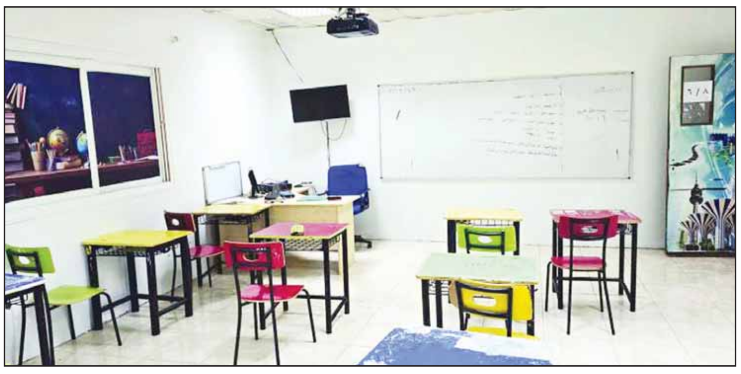
A classroom at one of the schools devoid of students.