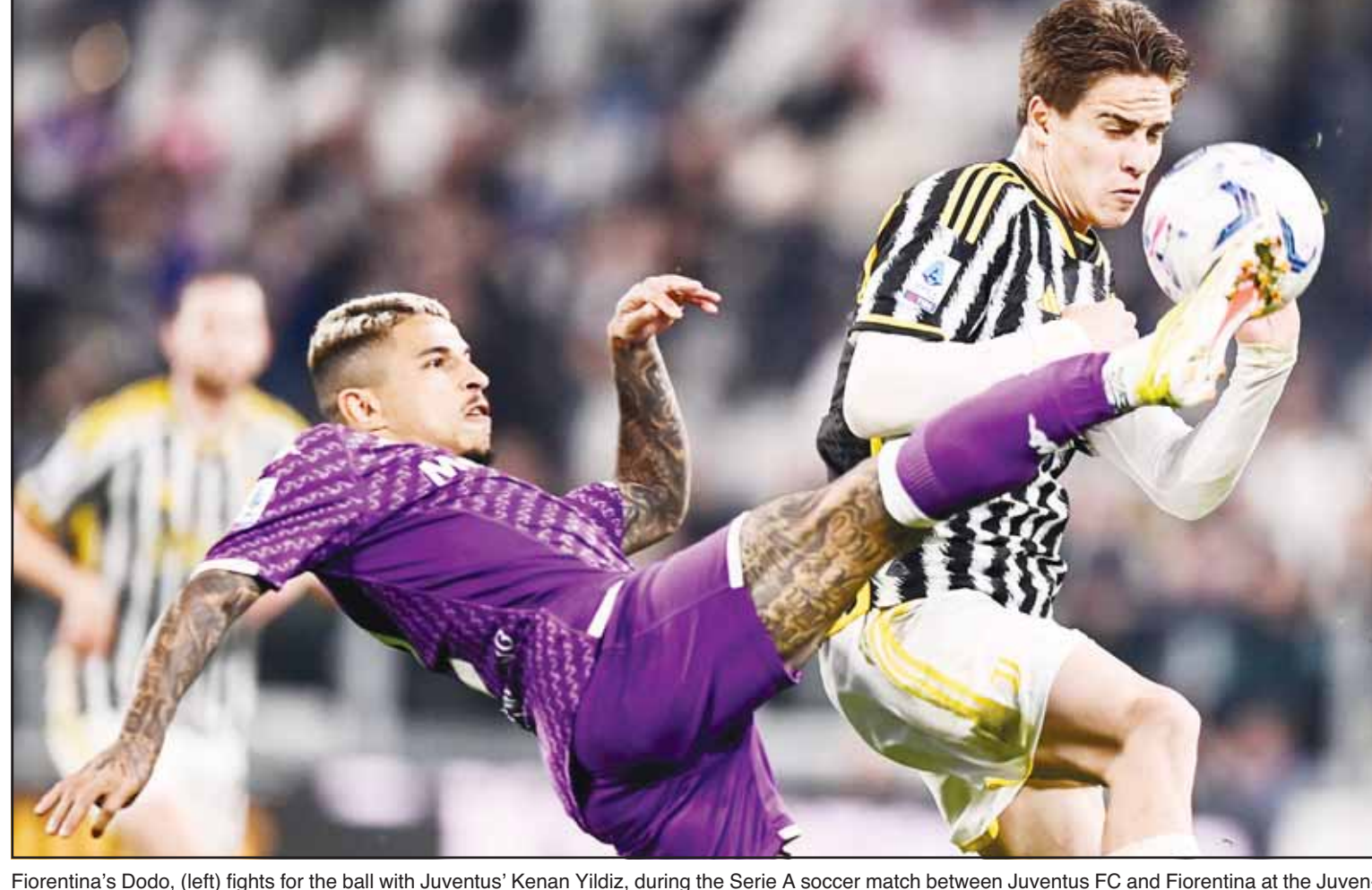
tus stadium in Turin, Italy.

Commonwealth Games Australia, said gross exaggeration of costs detailed by