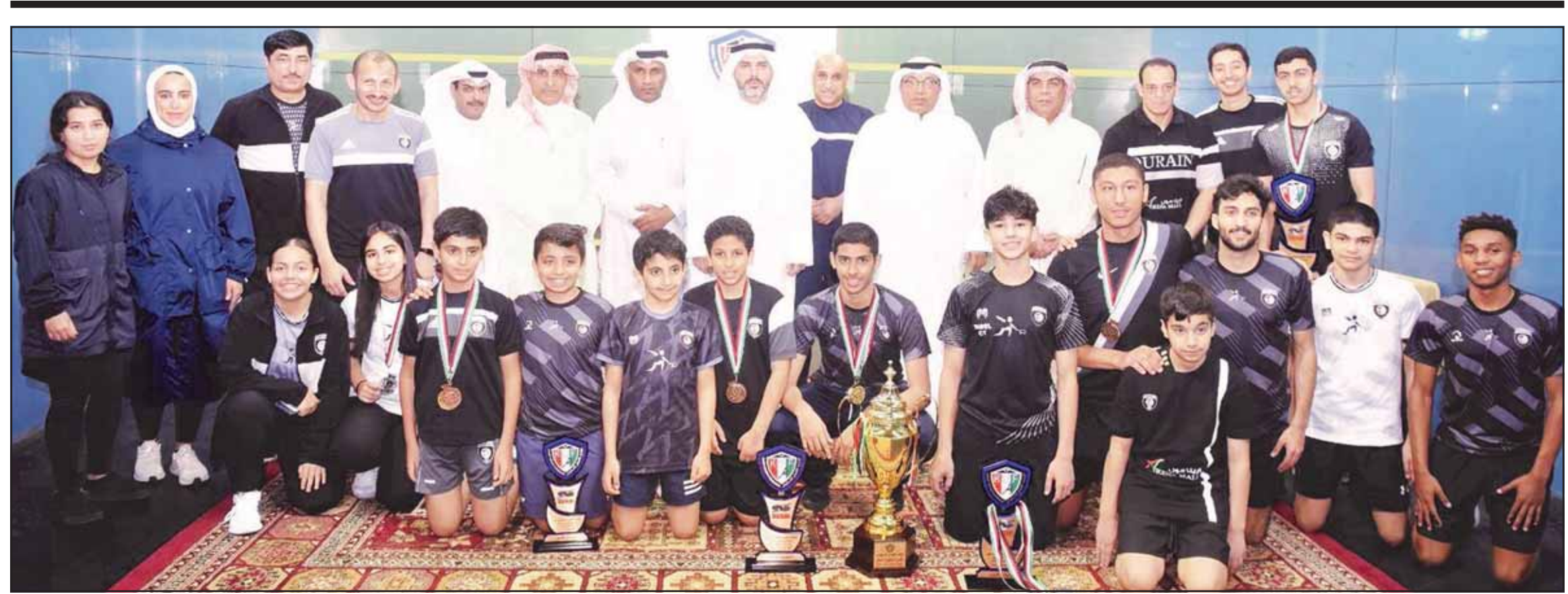
Al-Qurain squash players pose with officials at the end of the championship.