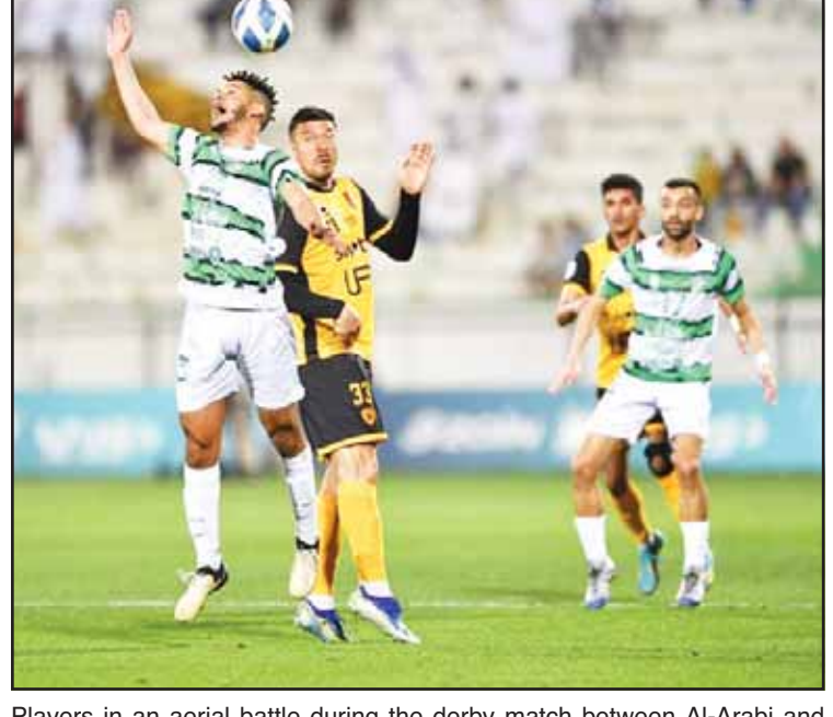
Players in an aerial battle during the derby match between Al-Arabi and

Both teams pushed for a winner but ultimately settled for a