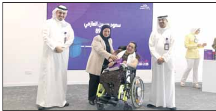
Honoring outstanding students from special education schools.