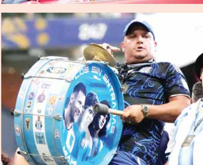
Tears of heartbreak, cheers of joy – the World Cup delivers unforgettable emotions during the round of 16 matches.