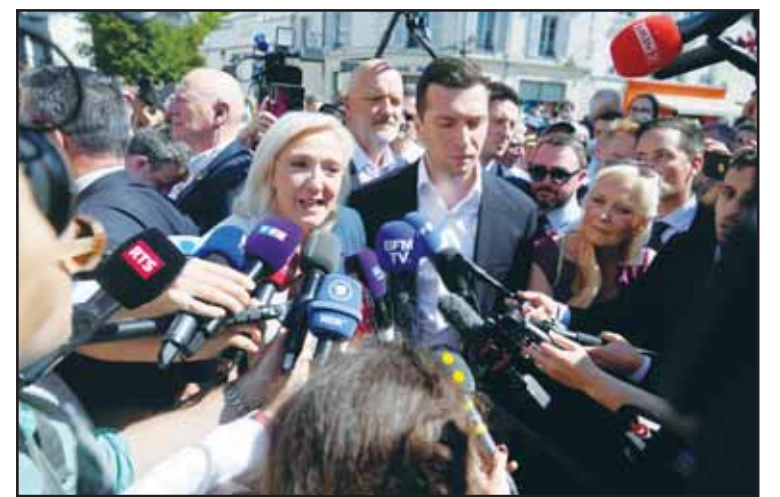
Far-right leader Marine Le Pen and far-right party National Rally president Jordan Bardella answer journalists as they arrive to visit a market in La Fleche, western France on July 8.

But after huddling for hours with other leading figures of her National