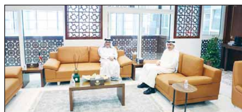
Minister of Commerce and Industry Osama Boodai receives Bahrain's Ambassador to Kuwait Salah Al-Maliki.