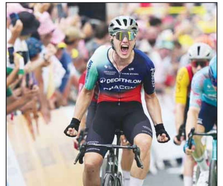
Netherlands' Olav Kooij celebrates as he crosses the finish line to win the fifth stage of the Tour de France cycling race with start in Lannemezan and finish in Pau, France.

Pogacar launched several devastating early attacks on the big climbs during a dominant Tour win last year, and Vingegaard could not follow his rival.