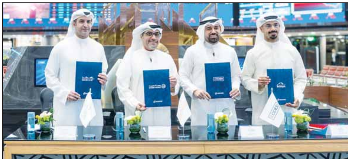
A national alliance integrating financial literacy with AI and fintech to empower 400 students and bridge the gap in the labor market.