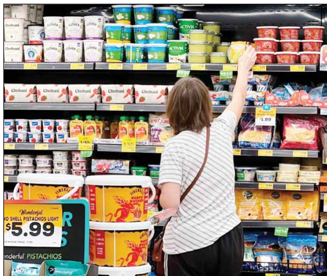
A customer looks at items at a Grocery Outlet store in Pleasanton, Calif on Sept 15, 2022.