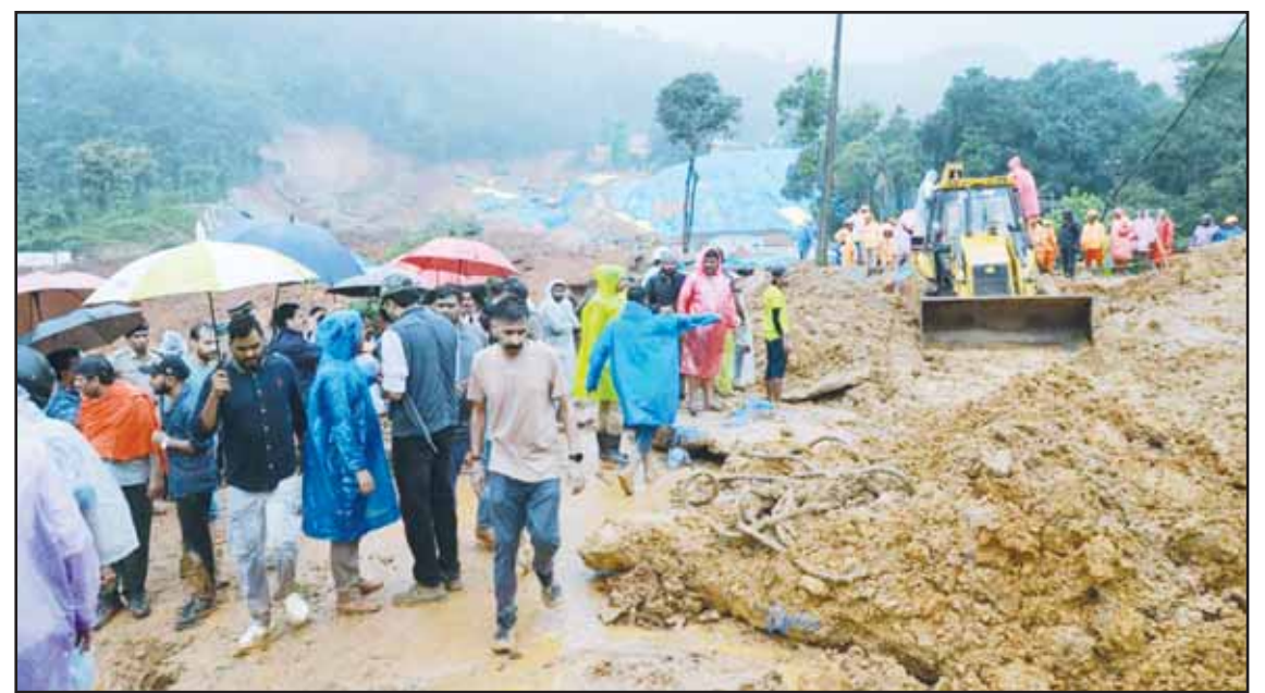
This photograph released by the Kerala Public Relations department shows rescue operations after a landslide near Meppadi tunnel project in Wayanad, in the southern state of Kerala, India on July 7.

After the runoff election, a European Union observer mission praised the transparency and efficiency of the vote-counting process. The Carter Center said the results management system was "reliable, transparent and fully traceable."