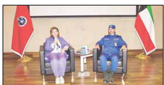
Director General of Kuwait Fire Force (KFF) Maj. Gen. Talal Al-Roumi and Assistant Foreign Minister for Human Rights Ambassador Sheikha Jawaher Al-Sabah, discuss several topics of mutual interest.

It added that eight shops were immediately closed, the seized items were confiscated, official violation reports were filed, and legal procedures were initiated against those responsible.