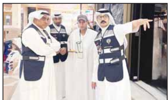
The Ministry of Commerce and Industry inspectors during the campaign.

And so, the young man was transformed from a thief into a devout worshipper.