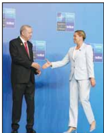
Denmark's Prime Minister Mette Frederiksen, center, is greeted by Turkish President Recep Tayyip Erdogan as she arrives for the NATO summit in Ankara, Turkey on July 8.

But Denmark's Prime Minister Mette Frederiksen said her country is "ready to defend every inch of NATO including our own territory" in the event of an attack, and would