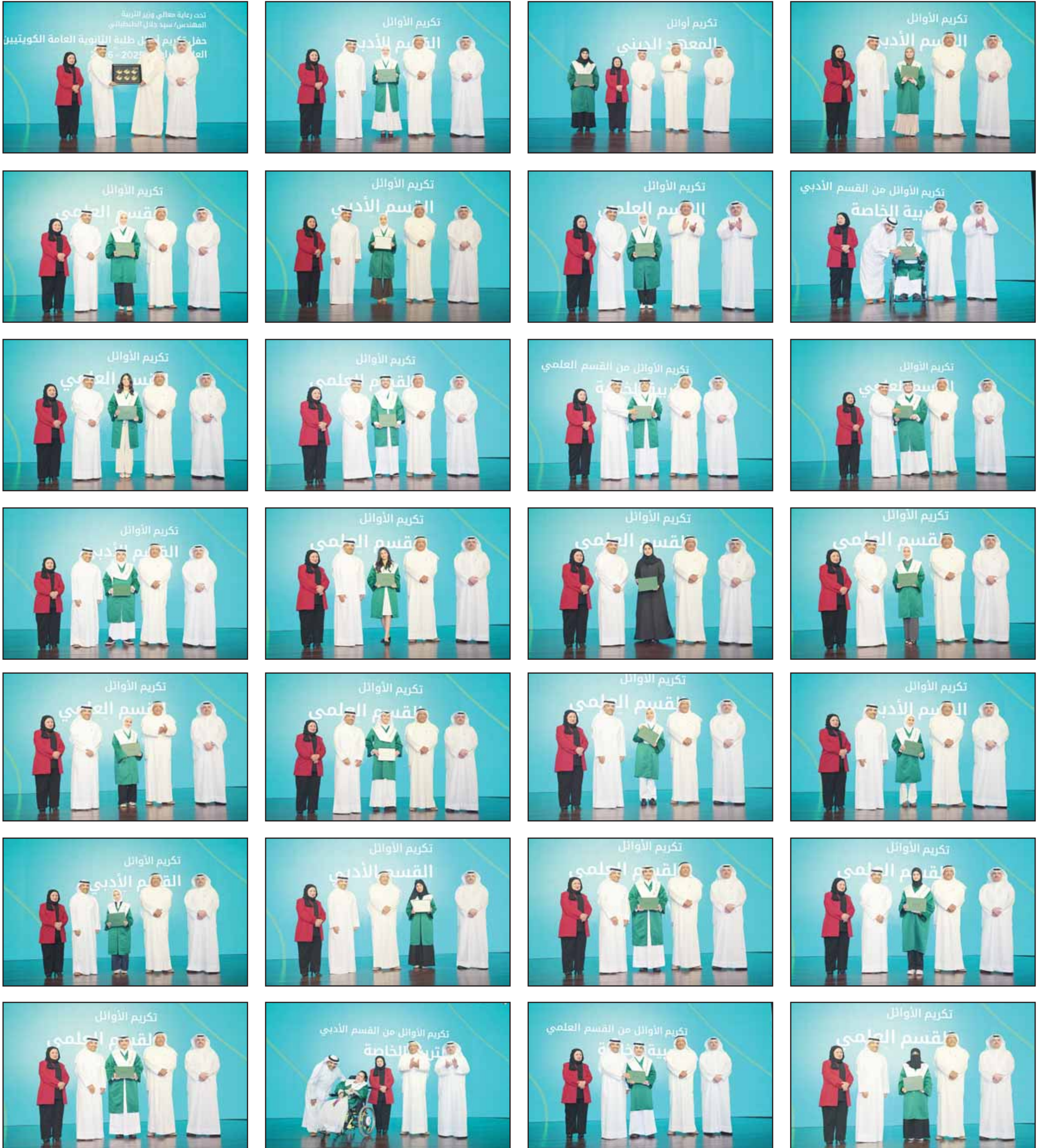
Photos during the event

He underscored KFH's distinguished track record in corporate social responsibility, citing its high-caliber initiatives that target diverse societal segments, bolster educational progress, and build national capabilities, further cementing the bank's position as a benchmark in sustainability and social responsibility.