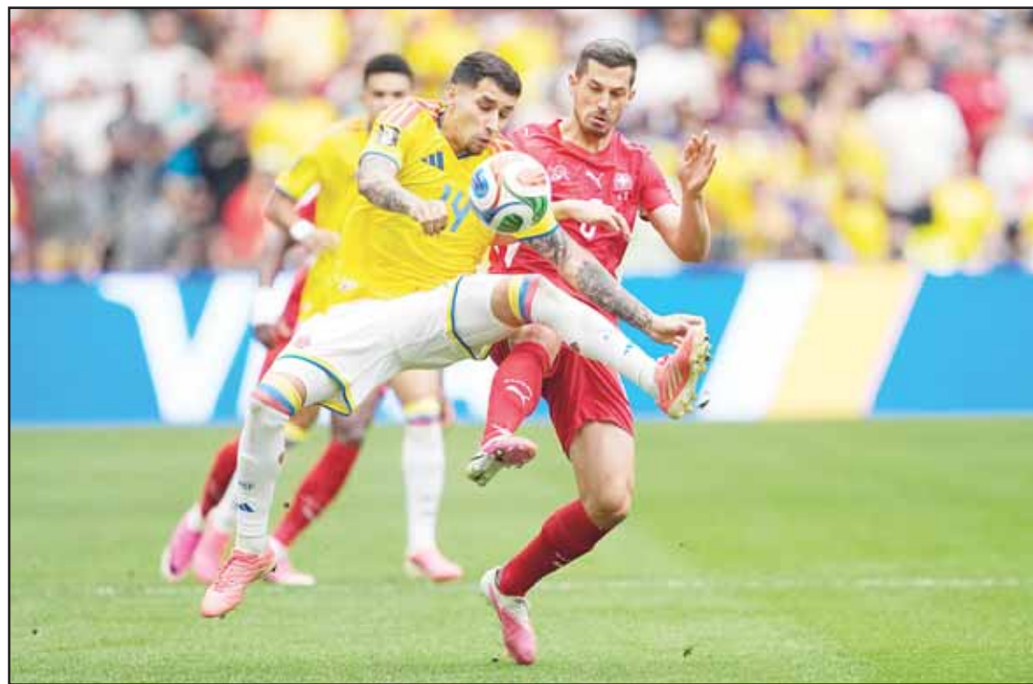
Colombia's Gustavo Puerta, left, and Switzerland's Remo Freuler battle for the ball during the World Cup round of 16 soccer match between Switzerland and Colombia in Vancouver, British Columbia.

"The dream was enormous," Colombia midfielder John Arias said. "The country showed us that it be-