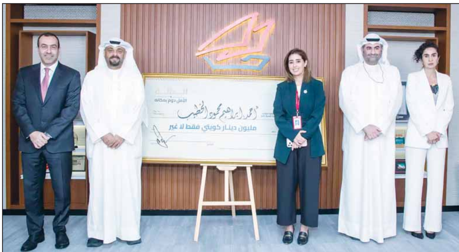
Gulf Bank officials at the conclusion of the AIDanah Millionaire draw.

He added that AIDanah account customers benefit from several distinctive advantages, including being part of the only account in Kuwait that carries forward winning chances from the previous year to the following year. This feature forms part of a customer loyalty programme designed to reward customers for their continued relationship with Gulf Bank.