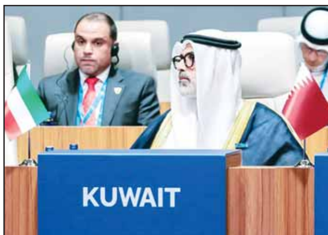
Minister of Foreign Affairs Sheikh Jarrah Jaber Al-Ahmad Al-Sabah addressing an ICI-NATO ministerial meeting.

The two ministers reviewed bilateral relations between Kuwait and Romania and discussed ways to further develop and strengthen cooperation across various fields. They also exchanged views on the latest regional and international developments.