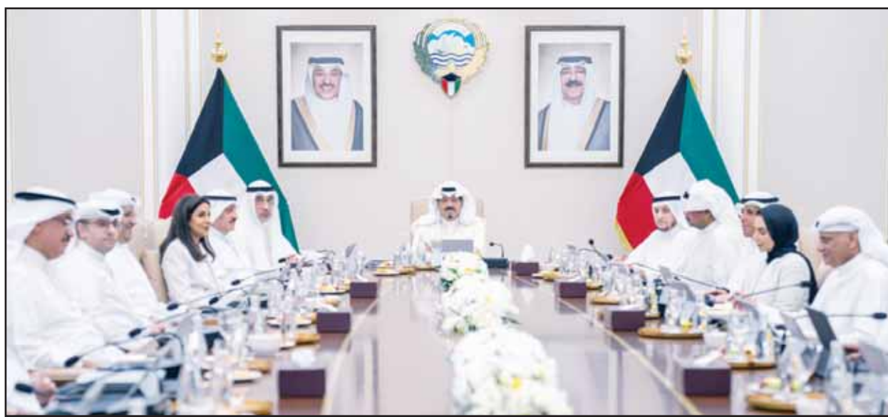
His Highness the Prime Minister chairs the weekly Cabinet meeting on Tuesday.

Kuwait dips into reserves to cover KD 7.14 bln gap