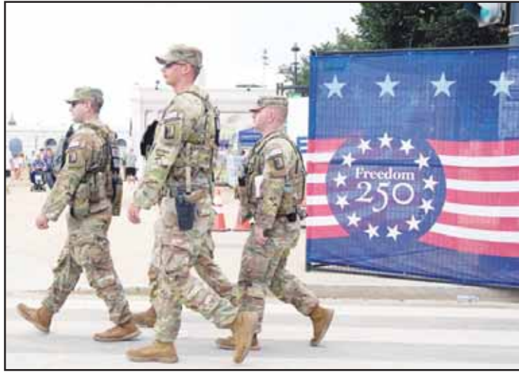
Soldiers from the Mississippi National Guard patrol along the Great American State Fair on the National Mall on July 6, in Washington.

Democratic-led states were part of that surge, and their troops were originally expected to remain for weeks. Michigan sent roughly 160 troops. Min-