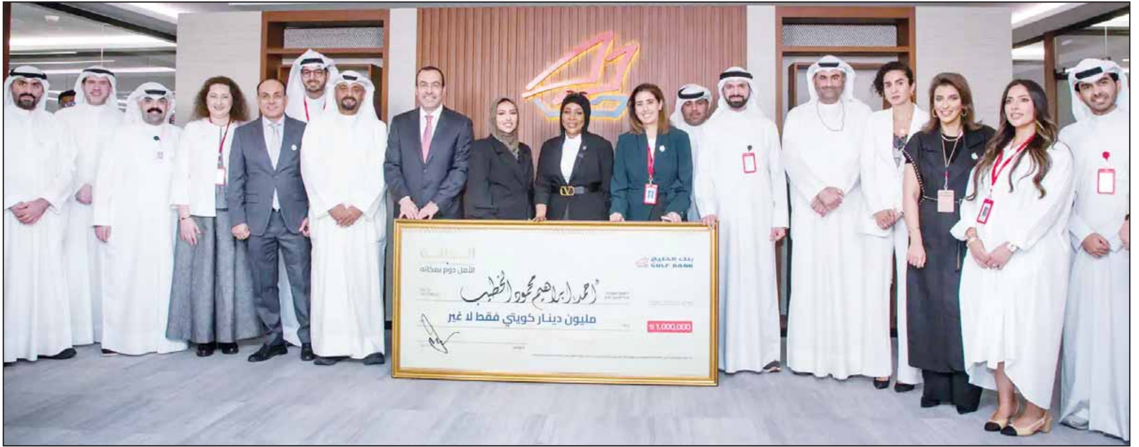
A group photo of Gulf Bank officials and employees.

Marking the 26th millionaire since the account's launch in 1998