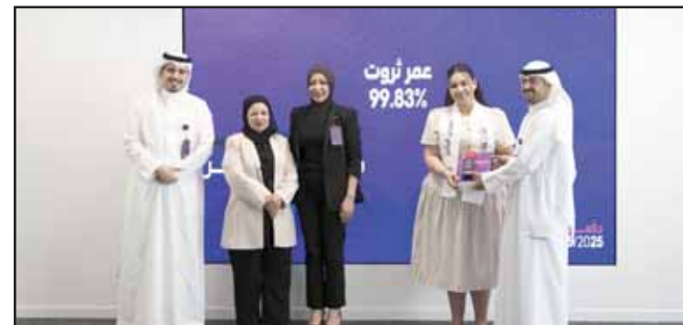
Honoring the outstanding children of employees.