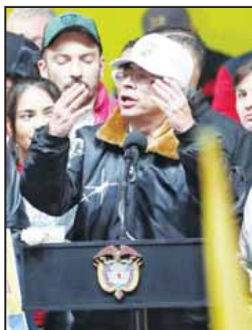
Colombian President Gustavo Petro addresses supporters at a rally he called to protest comments by U.S. President Donald Trump, in Bogota, Colombia on Jan. 7.