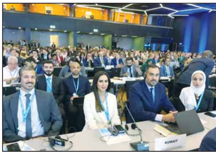
Kuwait's delegation to the first Global Dialogue on Artificial Intelligence (AI) Governance held in Geneva.

future of AI regulation and responsible use, he added, stressing the importance of Kuwait presence in such events to exchange expertise and contribute in shaping the future of technology.