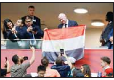
FIFA President Gianni Infantino holds an Egyptian flag before the World Cup round of 16 soccer match between Switzerland and Colombia in Vancouver, British Columbia.