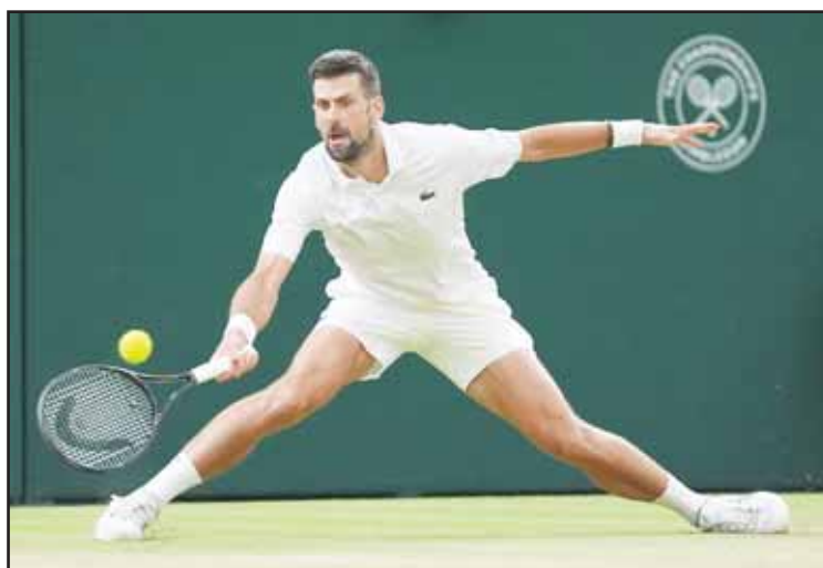
Novak Djokovic of Serbia returns the ball to Felix Auger-Aliassime of Canada in their quarter-final men's singles match at the Wimbledon Tennis Championships in London.

Kostyuk will be back on Centre Court on Thursday to face Linda Noskova for a spot in Saturday's final. Noskova beat Elise Mertens 6-3, 7-5 on No. 1 Court.