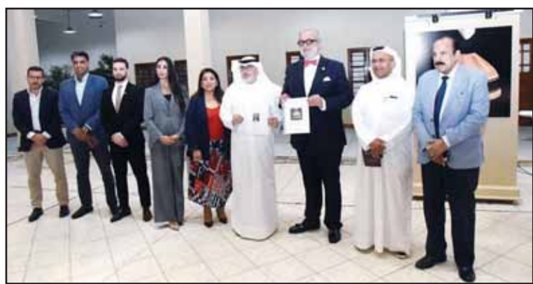
Officials and guests from Kuwait and Portugal during the presentation ceremony of two art pieces gifted to the Museum of Modern Art.