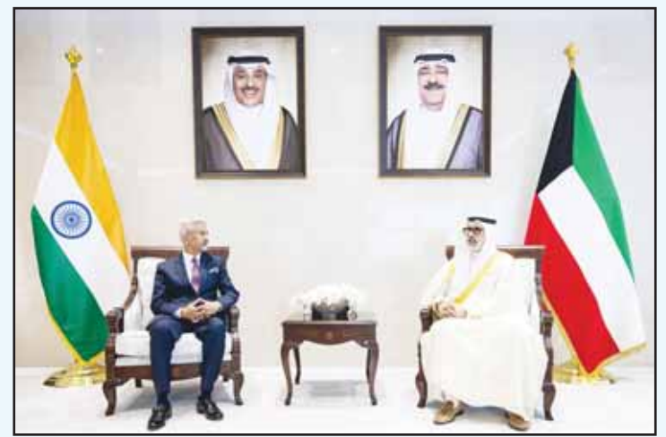
Kuwait's Foreign Minister Sheikh Jarrah Jaber Al-Ahmad Al-Sabah meets his Indian counterpart Dr. Subrahmanyam Jaishankar.