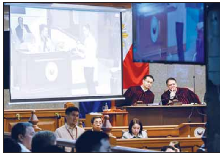
Philippine Senate President Sherwin Gatchalian, left, and Presiding Officer Senator Francis Escudero, right, look on at proceedings for the impeachment trial of Philippine Vice President Sara Duterte, at the Philippine Senate in Pasay City, Metro Manila, Philippines on July 8.

Duterte's supporters have accused Marcos and his key aides of politically