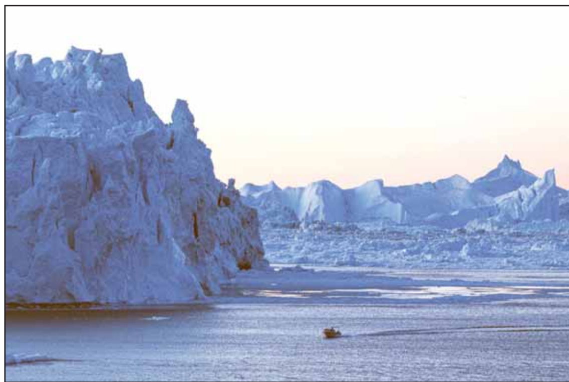
A boat rides in front of an iceberg at Disko Bay near Ilulissat, Greenland, on Jan 28.