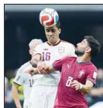
Spain's Rodri (16) and Portugal's Bruno Fernandes (8) challenge for the ball during the World Cup round of 16 soccer match between Portugal and Spain in Arlington, Texas, near Dallas.

tears following Portugal's exit in the round of 16, Laporte was all smiles after helping Spain book a place in the quarterfinals while extending one of the tournament's most remarkable defensive records.