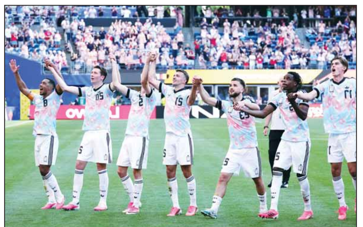
Belgium celebrates after defeating the United States in their World Cup round of 16 soccer match in Seattle.

Meanwhile, FIFA has defended the reputation of World Cup referee