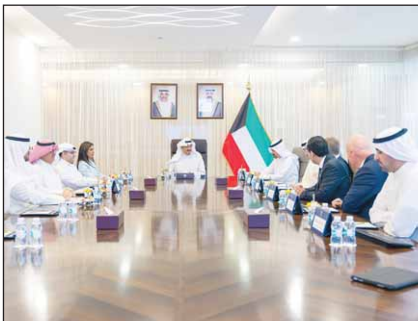
HH the Prime Minister Sheikh Ahmad Abdullah Al-Ahmad Al-Sabah receives the CEO of Brookfield Corporation Bruce Flatt and his accompanying delegation during his visit to the country.

The meeting reviewed "historic" bilateral relations and means to further them, as well as latest regional and international developments, read a ministry statement. A luncheon was held in honor of the Indian top diplomat.