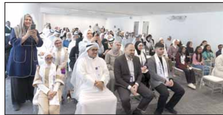
A glimpse of parents sharing in the joy of their student children.