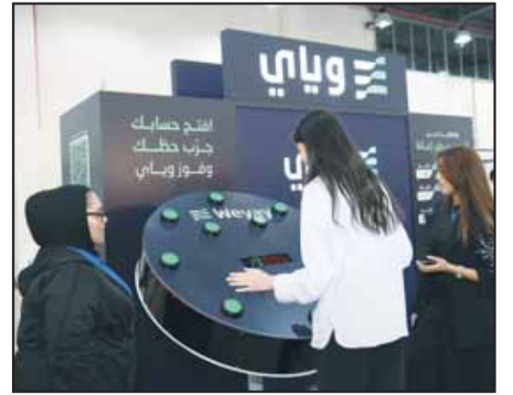
Weyay Bank supports students at Mishref Education Expo.

ments and career prospects associated with each discipline.