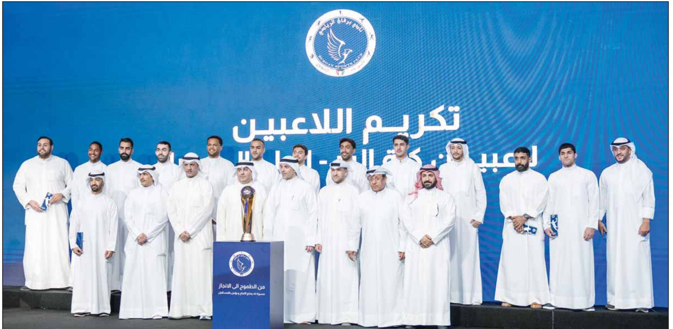
Burgan handball team celebrates its Asian championship victory with a group photo during the ceremony.