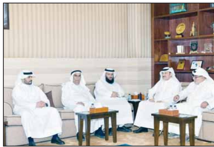
Mubarak Al-Kabeer Governorate photos

He explained that Kuwait Municipality regulations define the