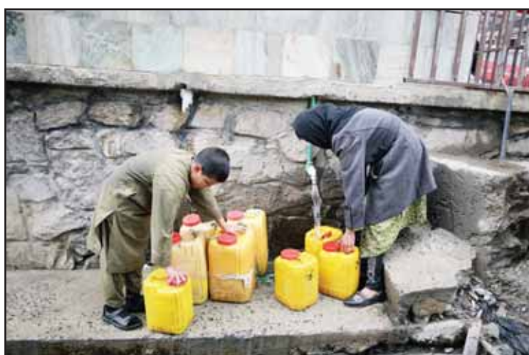
A boy and a girl collect water from a hose connected to a well at a mosque in Deh Mazang, Kabul, Afghanistan, April 2.

After four decades of conflict, the impoverished, aid-dependent country is now buffeted by multiple crises, from natural disasters and climate change to the largest influx of returning refugees the world has seen in decades.