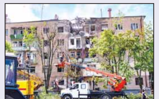
A rescue worker searches for victims after a Russian air attack in Kharkiv, Ukraine on July 8.

"I have done nothing wrong. I have not broken the law in any way at all. I have not misused public money," Farage, a prominent ally of U.S. President Donald Trump, said in a statement broadcast by his party. Media outlets were not allowed to attend the