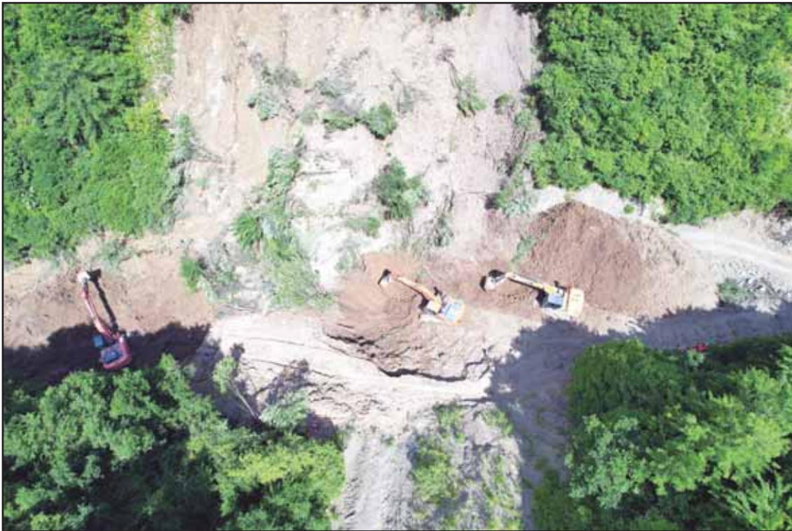
An aerial drone photo taken on July 7, 2026 shows rescuers working at the site of a landslide in a village in Nanhe Township, Tanchang County, Longnan City, northwest China's Gansu Province.