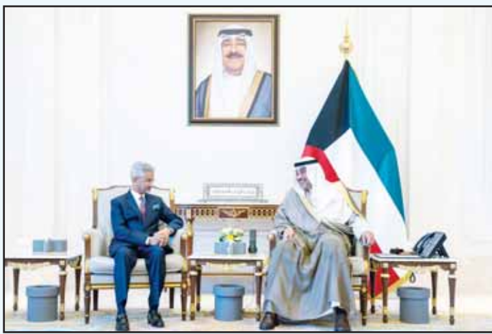
HH the Crown Prince Sheikh Sabah Khaled Al-Hamad Al-Sabah receives India's Minister of External Affairs, Dr. S. Jaishankar.

Fajr ..... 03:21 Asr ..... 15:27 Sunrise .. 04:55 Maghrib .. 18:51 Zohr ..... 11:53 Isha ..... 20:22