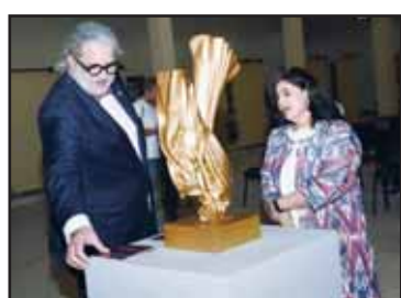
One of the art pieces gifted by Portugal.

The art pieces are considered a valuable addition to the collection of the museum, reaffirming that art is one of the most important bridges of communication among peoples and cultures.