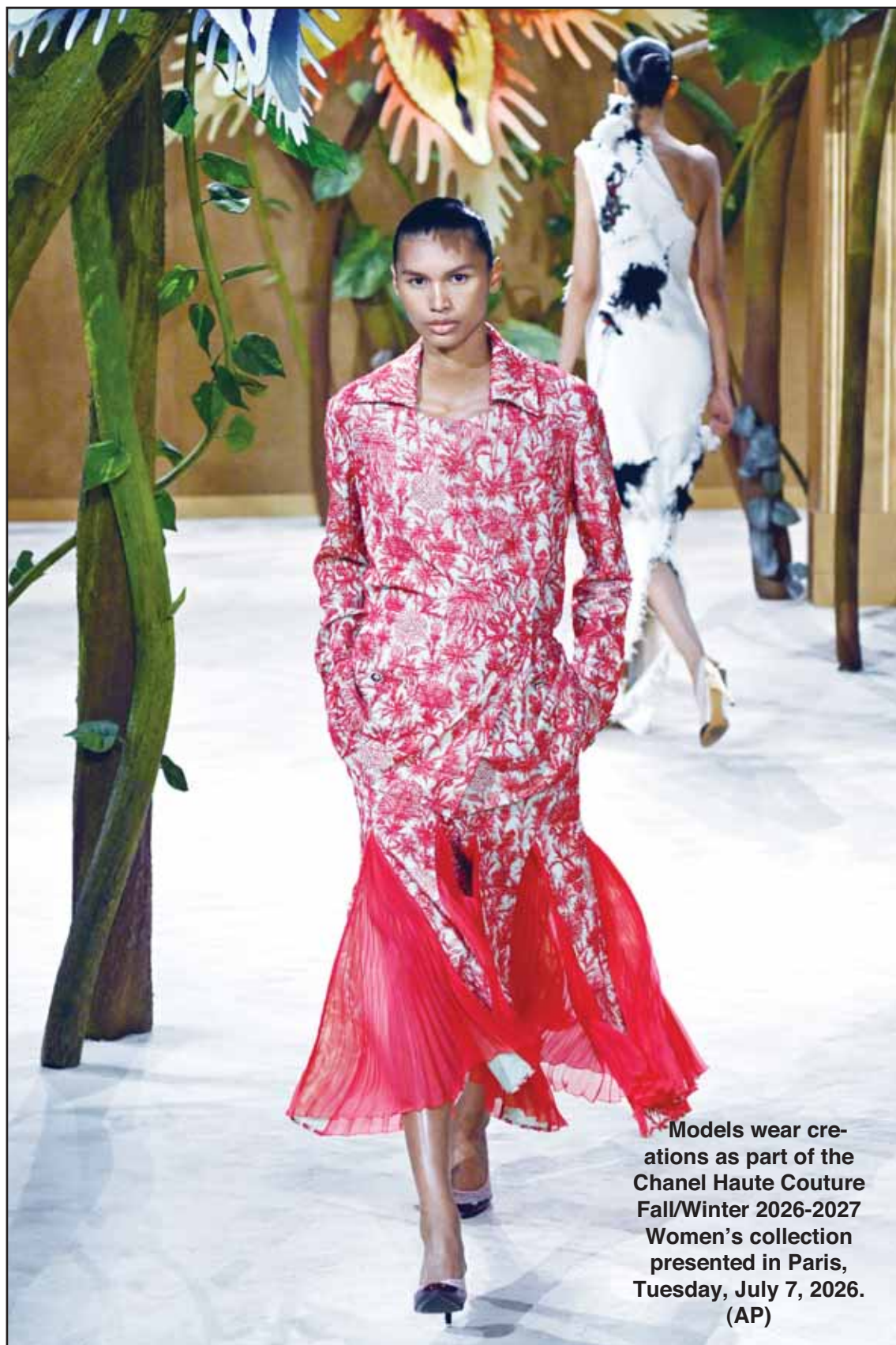
Models wear creations as part of the Chanel Haute Couture Fall/Winter 2026-2027 Women's collection presented in Paris, Tuesday, July 7, 2026.