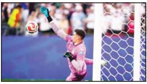
Paraguay goalkeeper Orlando Gill stops a penalty shot by Germany's Kai Havertz during the World Cup round of 32 soccer match between Germany and Paraguay in Foxborough, Mass., near Boston.