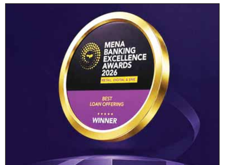
Weyay Bank achieves 'Best Loan Offering' award.

Through the app, customers can upload required documents, and sign contracts electronically via the Kuwait Mobile ID app using secure digital signature technology. For the