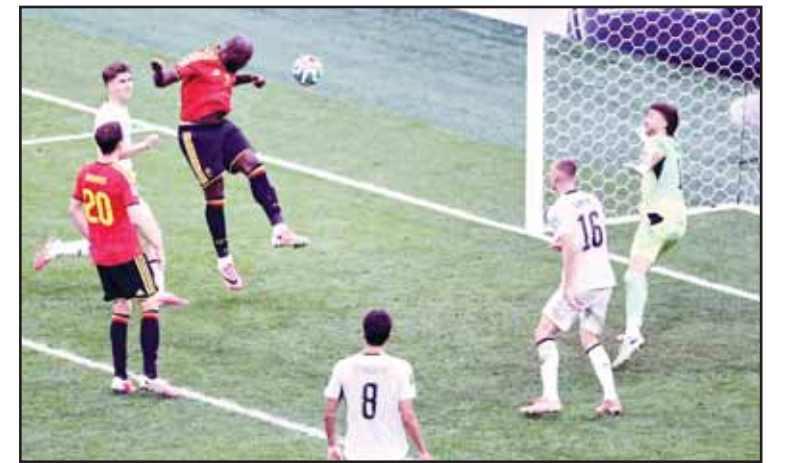
Belgium's Romelu Lukaku (9) heads the ball into the goal for his team's fourth goal during the World Cup Group G soccer match between New Zealand and Belgium in Vancouver, British Columbia.

Senegal, Belgium's looming opponent, finished third in Group I with three points and a plus-2 goal differential. The African team navigated one of the toughest groups in the tournament, one that featured favorite France and the Erling Haaland-led Norway.