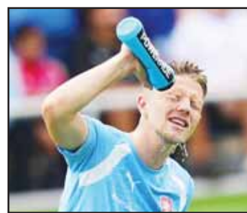
Lukas Cerv, of the Czechia men's national soccer team, refreshes himself while working out in hot Texas weather during a public training session in Mansfield, Texas, ahead of the World Cup soccer tournament.

An extreme heat warning is also in effect for Kansas City and other por-