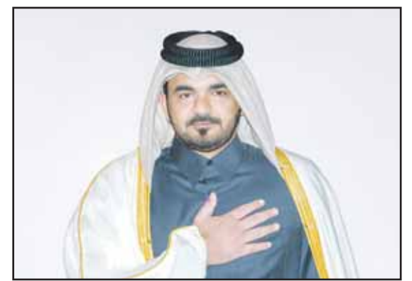
H.E. Sheikh Joaan bin Hamad Al Thani, candidate for President of the Olympic Council of Asia (OCA).

The next OCA General Assembly will be held in Doha, Qatar on January 27, 2027.