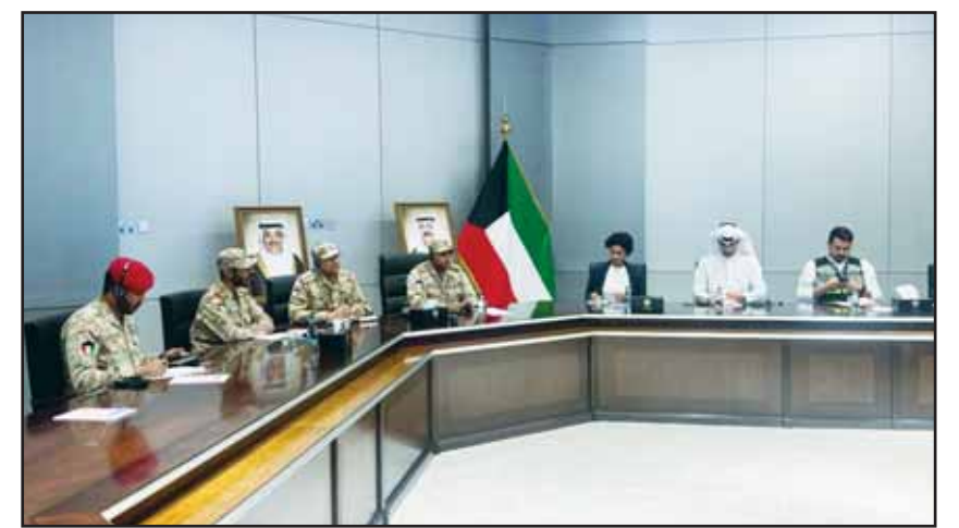
Kuwait's Aman task force team in a virtual meeting with North Atlantic Treaty Organization's (NATO) Euro-Atlantic Disaster Response Coordination Centre (EADRCC).

It added that the progress is the result of continuous efforts by its faculty and staff to align education, scientific research and community service with sustainable development requirements through the development of qualitative initiatives and programs, the enhancement of effective partnerships and the expansion of contributions to addressing priority development issues at both the national and international levels.