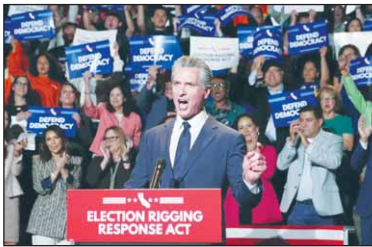
California Gov Gavin Newsom speaks during a news conference on Aug 14, 2025, in Los Angeles.

"The governor can claim he has a 'balanced' budget on his way out the