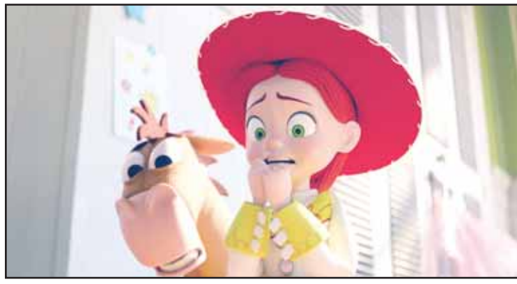
This image released by Disney shows characters Bullseye, left, and Jessie, voiced by Joan Cusack, in a scene from Disney and Pixar's "Toy Story 5."

The stumble for "Supergirl," which cost $170 million to make, comes as Warner