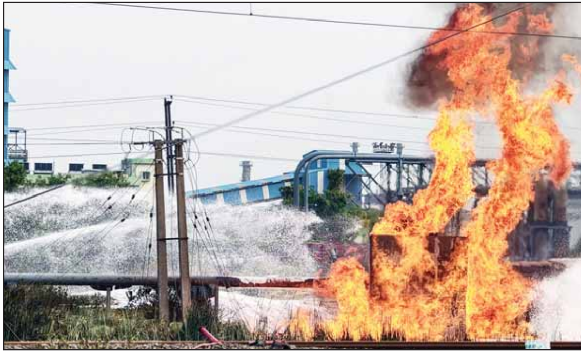
Firefighters spray water to extinguish a fire at a petrochemical plant in Purba Medinipur district, about 130 kilometers (80 miles) southwest of Kolkata, the capital of India's West Bengal state on June 30.