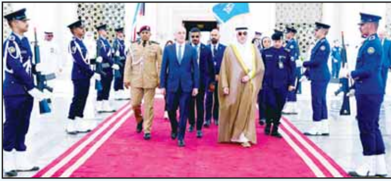
First Deputy Prime Minister and Minister of Interior Sheikh Fahad Yousef Saud Al-Sabah sees off the visiting Lebanese Minister of Interior and Municipalities Ahmad Al-Hajjar and the accompanying delegation.