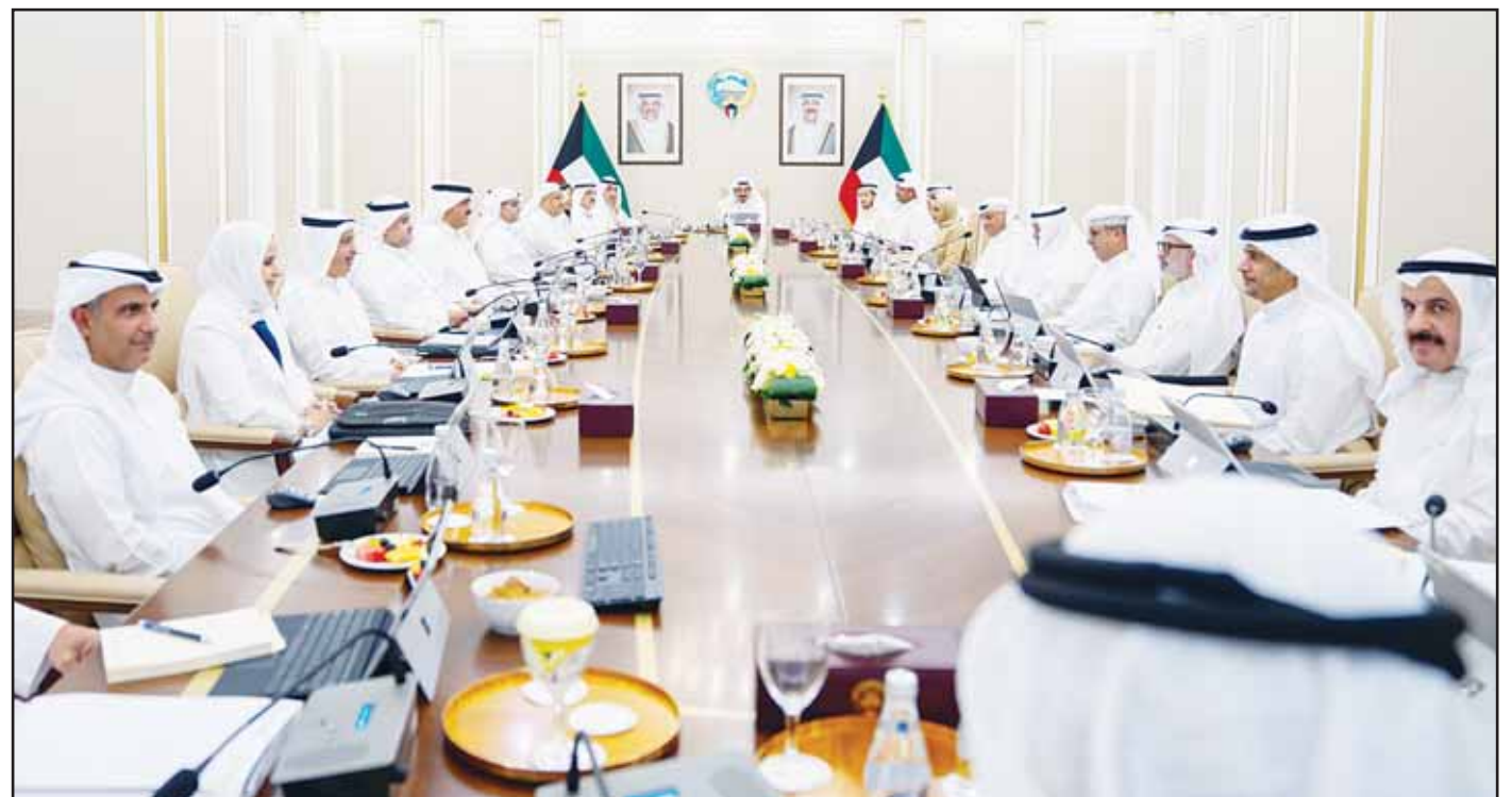
His Highness Prime Minister Sheikh Ahmad Abdullah Al-Ahmad Al-Sabah chairs the weekly Cabinet meeting on Tuesday.