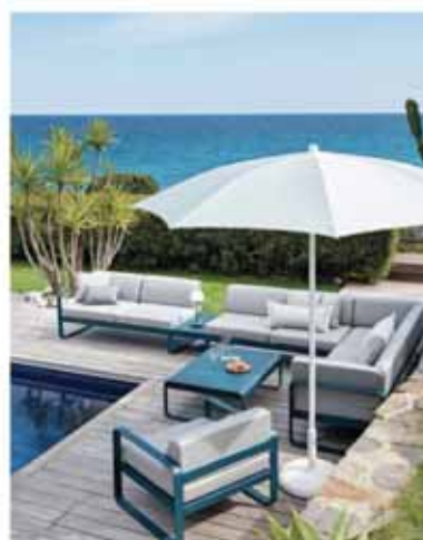
{Fermob's Bellevie Armchair}