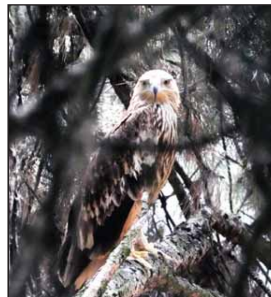
Feliks, an Eastern imperial eagle which flew from Serbia across North Macedonia, Greece, Turkey and Syria, where he fell victim to traffickers looks out from a cage at Palic Zoo after returning in Serbia on June 24.

The Africa Centers for Disease Control and Prevention (Africa CDC) said on that the continental Ebola outbreak response and preparedness plan requires 1.4 billion US dollars.