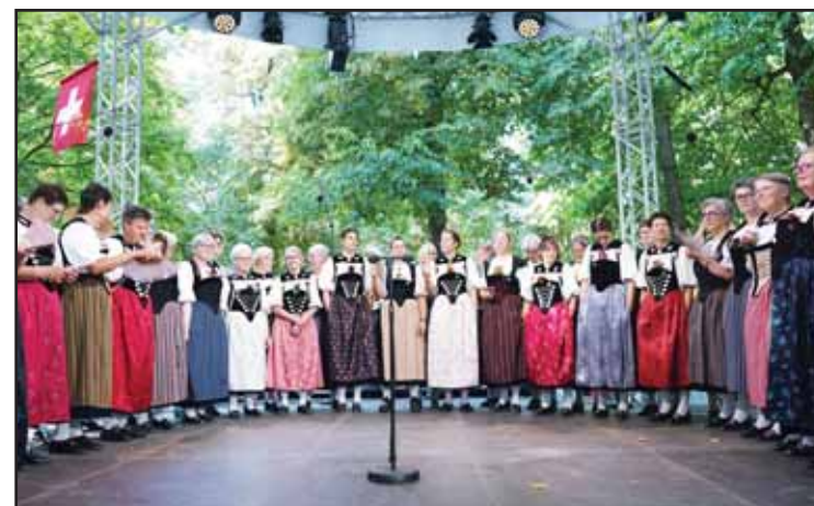
Yodelers prepare for TV broadcast on the main festival stage at Petersplatz in Basel, Switzerland, Saturday, June 27, 2026.

nearly 200,000 visitors traveled to Basel for the Eidgenössisches Jodlerfest, Switzerland's national yodeling festival. It was the first time the northwestern Swiss city hosted the event since 1924.