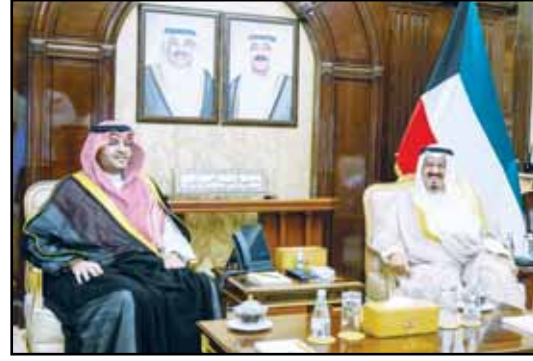
HH the Prime Minister Sheikh Ahmad Abdullah Al-Ahmad Al-Sabah receives the Saudi Prince.