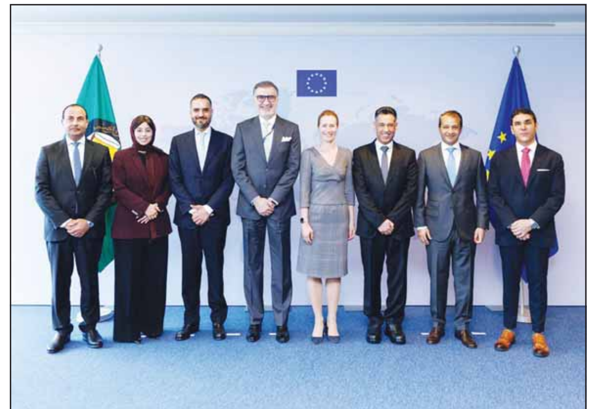
EU High Representative for Foreign Affairs and Security Policy and Vice-President of the European Commission, Kaja Kallas with ambassadors and representatives of the GCC member states to the European Union.

On the other hand, the fees for emergency and identity certificates remain at KD5 and KD16 respectively.