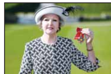
Dame Penelope Keith after she was made a Dame Commander for services to the Arts and to charity during an Investiture ceremony at Windsor Castle, England, July 3, 2014.