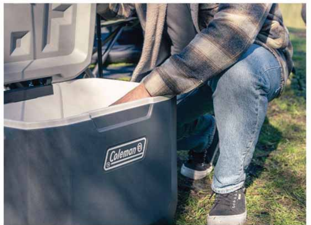
{Coleman 57L Wheeled Cooler}

Portable cooking equipment, such as the Campingaz Party Grill 600 Stove, offers a practical way to prepare meals outdoors, allowing hosts to cook wherever the setting is best. Paired with a quality utensil kit, it helps streamline everything from preparation to serving, creating a more effortless grilling experience.