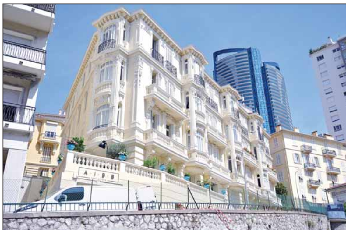
A view of the residential building where an explosive device seriously injured three people in Monaco on June 30.