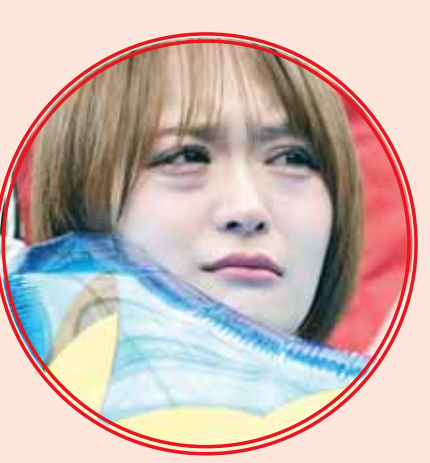
Fans celebrate and show their emotions during FIFA World Cup matches, creating a vibrant and unforgettable atmosphere in the stands.