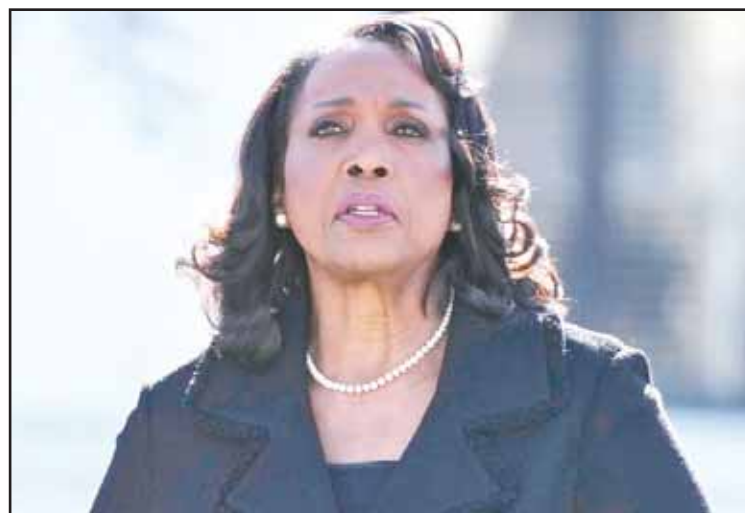
Federal Reserve Board of Governors member Lisa Cook leaves the Supreme Court in Washington, Jan. 21, 2026.

"The president, to be sure, emerges with more power than ever before.