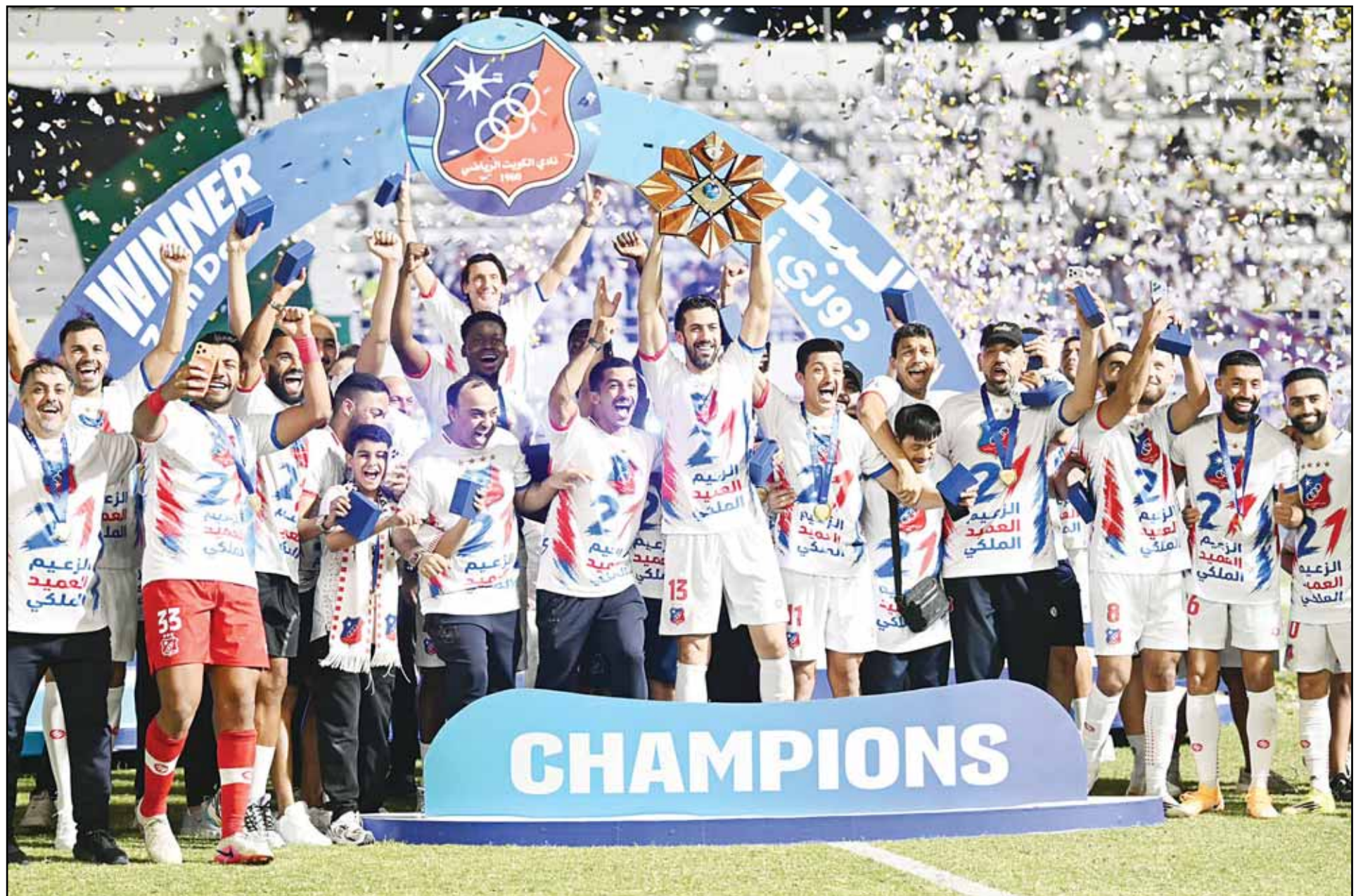
Kuwait Club players celebrate the 2025-2026 Zain Premier League title after an unbeaten season and a record 21st championship.