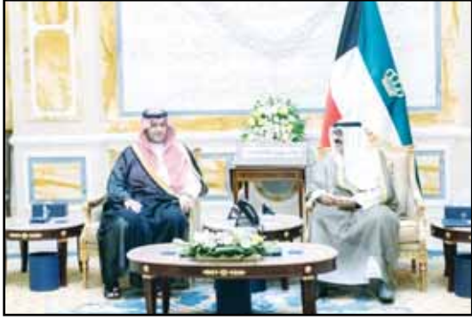
HH the Amir Sheikh Meshal Al-Ahmad Al-Jaber Al-Sabah receives the visiting Saudi Minister of State and Cabinet Member Prince Turki bin Mohammad Al Saud and his accompanying delegation.