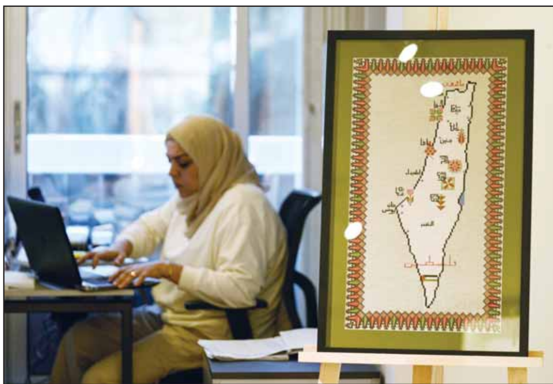
A hand-embroidered map of historic Palestine with names of cities and the words "Palestine" and "Returning" in Arabic is displayed at the Inaash Association embroidery workshop in Beirut, Tuesday, May 19, 2026.