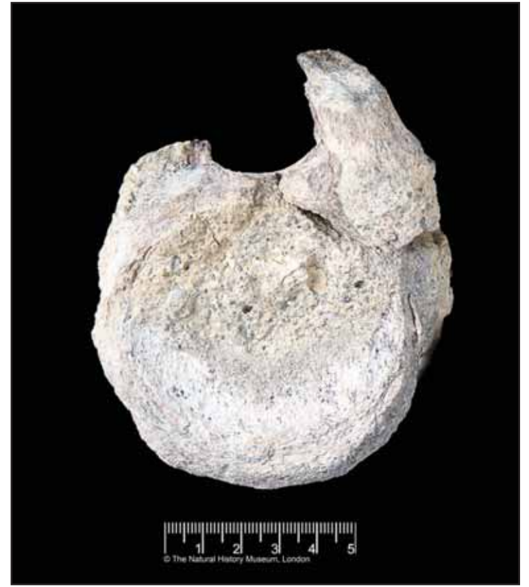
This image provided by the Natural History Museum shows a fossil found in Antarctica that belongs to a group of dinosaurs called titanosaurs.

Researchers said the work has also contributed to a better understanding of the ecological role of parasites in biodiversity. Although parasites are often viewed negatively, non-pathogenic species that pose no threat to humans or animals can form an important part of natural ecosystems.