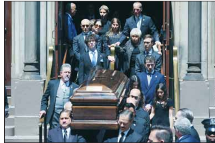
Family members walk out as pallbearers carry the casket of Clive Davis after funeral services at Central Synagogue in New York, Monday, June 29, 2026.