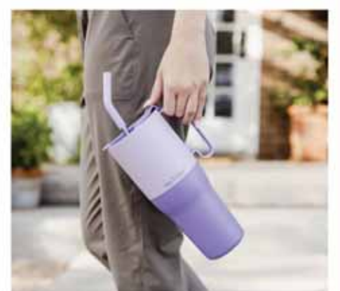
{Klean Kanteen Rise 36oz Tumbler}

Summer in Kuwait has a way of bringing people together, whether for relaxed afternoons by the sea or spontaneous gatherings with family and friends. In this case, having the right essentials, all of which can be found at AAW Kitchens, helps elevate every chalet experience.