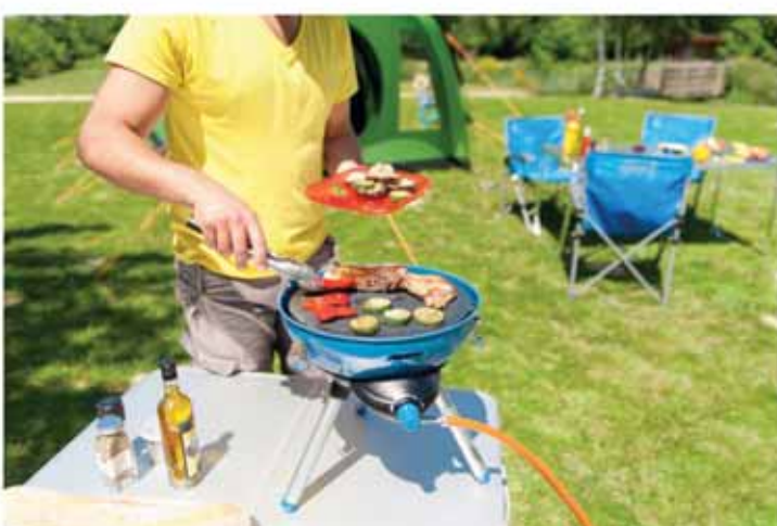
{Campingaz Party Grill 600 Stove}

Once the shade is in place, comfortable seating helps set the tone. Fermob's Bellevie Armchair brings a contemporary touch to chalet settings with its clean lines and versatile design, while the Fermob Sunlounger offers a comfortable spot to relax by the water. Paired with a matching parasol and base, it creates a stylish resort-inspired corner.