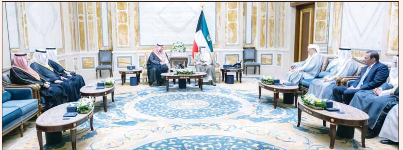
His Highness the Amir Sheikh Meshal Al-Ahmad Al-Jaber Al-Sabah receives Saudi Minister of State and Cabinet Member Prince Turki bin Mohammad Al Saud and his accompanying delegation on their official visit to Kuwait on Tuesday.