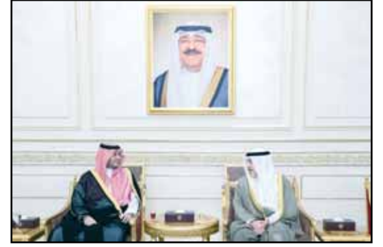
First Deputy Prime Minister and Minister of Interior Sheikh Fahad Yousef Saud Al-Sabah welcomes the Saudi Prince.

KUWAIT CITY, June 30, (KUNA): His Highness the Amir Sheikh Meshal Al-Ahmad Al-Jaber Al-Sabah, received on Tuesday, Saudi Minister of State and Cabinet Member Prince Turki bin Mohammad Al Saud and his accompanying delegation on their official visit to Kuwait.