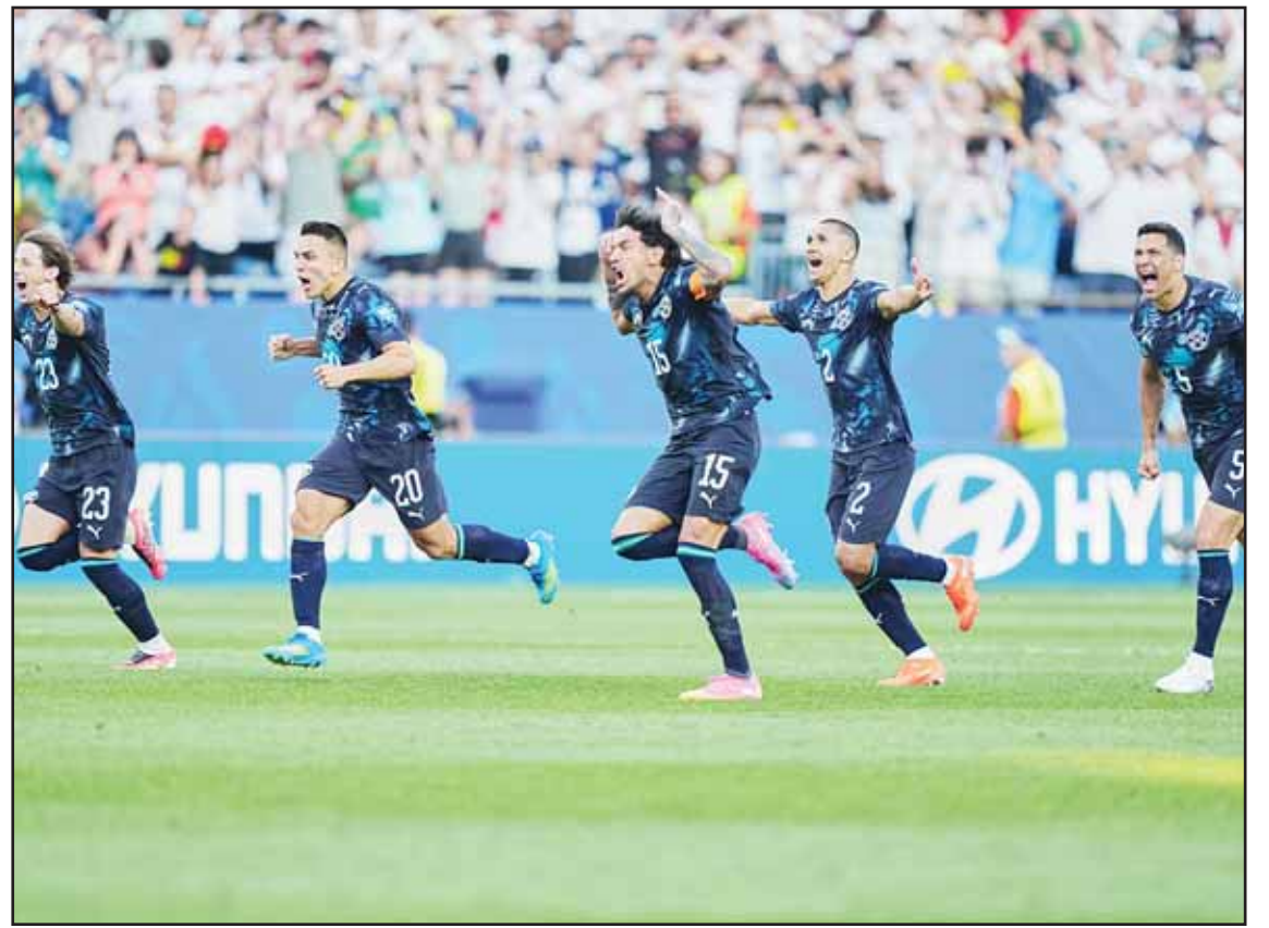
Paraguay's Matias Galarza (23), Braian Ojeda (20), Gustavo Gomez (15) and Gustavo Velazquez (2) celebrate a win during the World Cup round of 32 soccer match between Germany and Paraguay in Foxborough, Mass., near Boston.

Paraguay, which entered the match ranked 41st by FIFA, became the deepest betting long shot to win a match in this World Cup. Germany came in as the 10th-ranked team in the world.