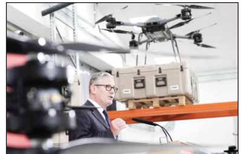
British Prime Minister Keir Starmer speaks on the occasion of the announcement of a defense plan, in Berkshire, England on June 30.

Healey accused the government of underspending on the military at a time of "rising threats," citing a British intelligence assessment that