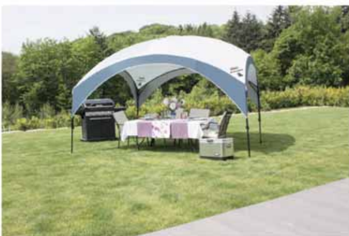
{Coleman Fast Pitch Shelter XL}{Fermob's Bellevie Armchair}

With summer in full swing, chalet season has officially arrived. Across Kuwait, weekends are spent by the sea, enjoying barbecues, gathering with family and friends, and making the most of the summer season. Whether you're hosting guests or creating a relaxing retreat, having the right essentials can make every chalet day more enjoyable.