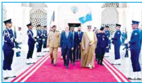
Lebanese Interior Minister departs Kuwait after visit