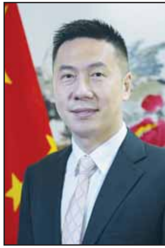
H.E. Ambassador Yang Xin

The CPC is a party dedicated to seeking happiness for the Chinese people and the rejuvenation for the Chinese nation. Over the past 105 years, the Chinese nation has achieved the great transformation from standing up and growing prosperous to becoming strong. Today, China has maintained rapid economic growth and lasting social stability, and built the world's largest education system, social security system and healthcare system. People all over China feel happier, safer and more