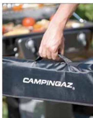
{Campingaz BBQ Utensil Kit}