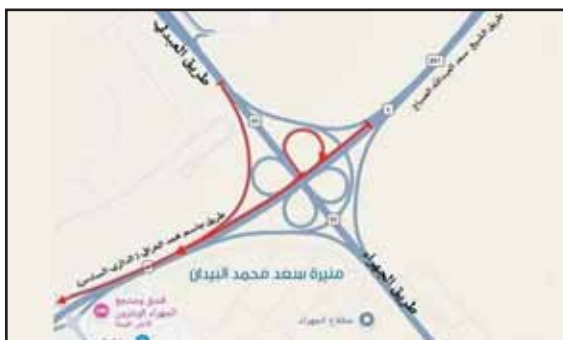
Map shows one of the road closures.

The Al-Dar Engineering Company officials expressed their appreciation for the commitment of the Governor to on-site project monitoring. They also affirmed the continuation of their work according to the approved plans and ensuring the timely completion of major maintenance projects with the best technical specifications.