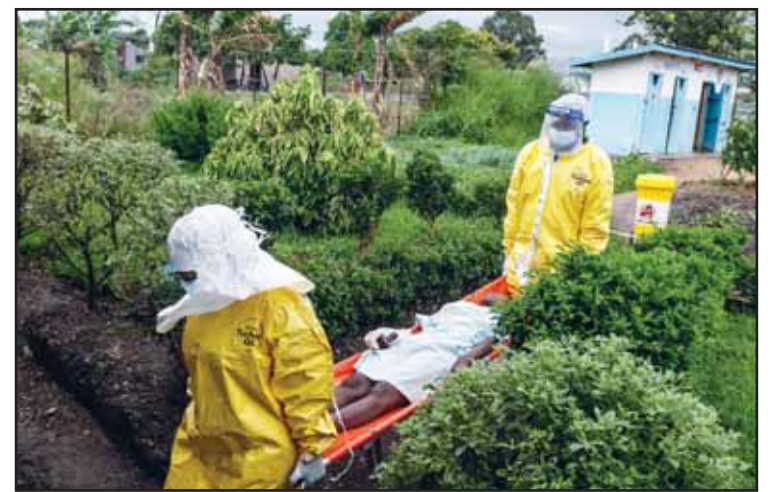
Medical staff carry an Ebola patient to a treatment center in Rwampara, Congo on May 21.

The report also highlighted persistent challenges in the response, including community resistance to post-mortem sampling, insufficient capacity at Ebola treatment centers, non-optimal contact tracing, short-