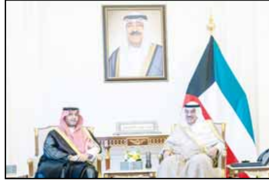
HH the Crown Prince Sheikh Sabah Khaled Al-Hamad Al-Sabah meets the Saudi guest.