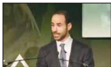
Lieutenant Colonel Sabah Al-Sabah of the Kuwait Armed Forces speaks at the RUSI Land Warfare Conference 2026.

"In the first month alone, our forces engaged 354 tactical ballistic missiles and 852 one-way attack salvos designed to overwhelm sensors and ex-