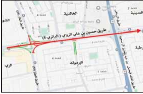
Map shows total closure of Fourth Ring Road opposite Yarmouk.

The ministry emphasized that regulations and bylaws will be applied impartially and fairly to all, without exception.