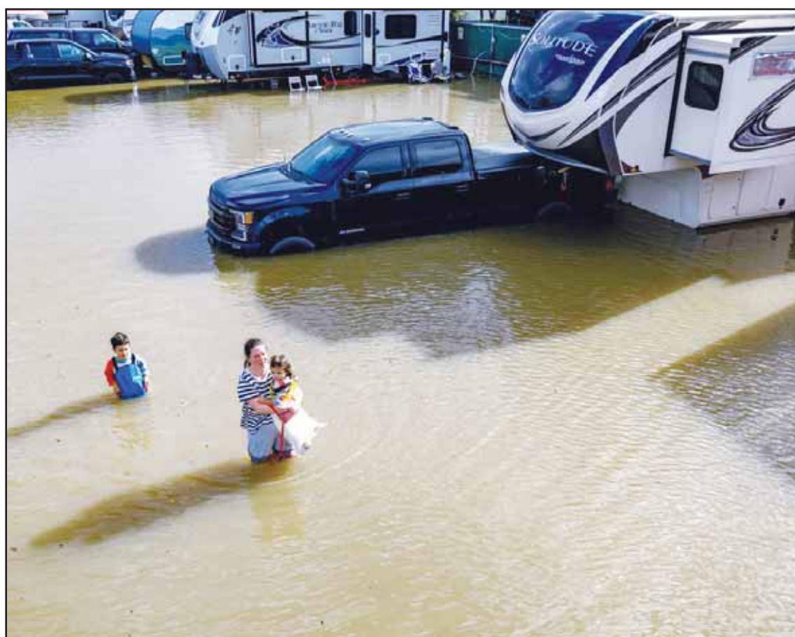
People wade through a recreational vehicle park flooded by a king tide on Jan. 3, 2026, near Corte Madera in Marin County, Calif.