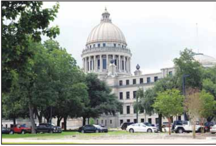
The Mississippi Capitol is seen in Jackson, Miss on July 6, 2020.

Democratic-led states generally have pushed back against Trump with new laws banning cooperative pacts with ICE, forbidding ICE tactics like wearing masks and restricting immigration enforcement actions in schools, hospitals