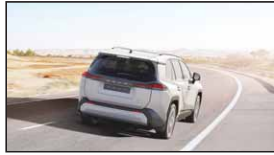
Top and above: A closer look at the Toyota RAV4's interior and exterior design.

generation, we focused on the values of 'Go anywhere' and 'Do anything.' Our goal was to ensure that customers feel comfort and peace of mind in both their ordinary and extraordinary lives, while also designing a vehicle that captures the spirit of adventure from within."