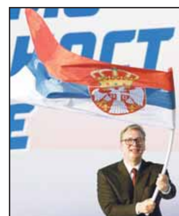
Serbian President Aleksandar Vucic waves a Serbian flag during a rally of the ruling Serbian Progressive Party (SNS) in Belgrade, Serbia on June 27, where he announced that he will resign in the coming weeks.

Vucic, who is currently serving his second term, cannot run again for president, according to Serbia's election law. Both regular presidential and parliamentary elections are due next year.