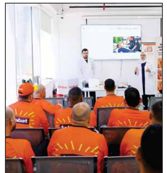
Snapshots from the First Aid training workshop for delivery riders.

KUWAIT CITY, June 28: As part of talabat's "Summer Together" campaign for riders and Al Salam Hospitals' ongoing commitment to community health and safety, talabat and Al Salam Hospitals hosted a comprehensive First Aid training workshop for delivery partners.