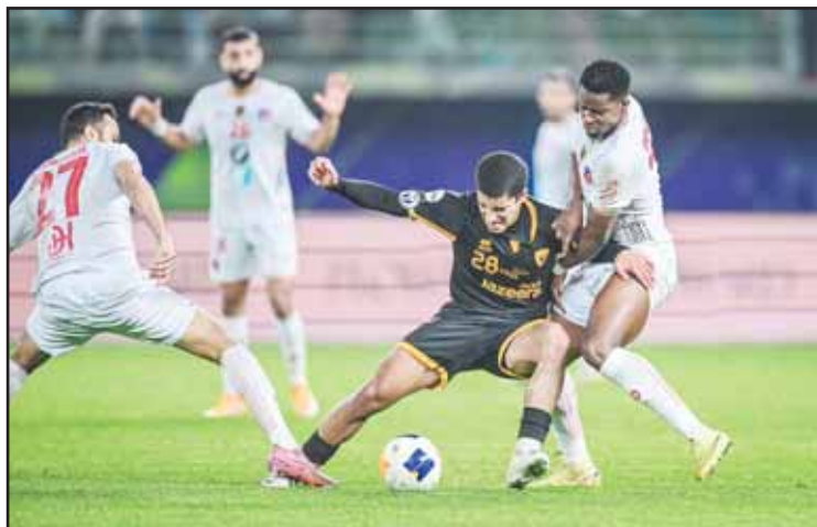
A tight soccer duel as a Qadsia player shields the ball from two Kuwait Club opponents under bright lights.

Qadsia has already guaranteed a top-four finish, securing qualification for an external competition next