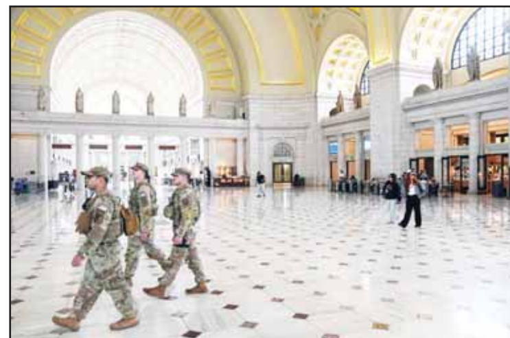
Members of the National Guard walking in the lobby of Union Station in Washington on May 27.

We start our tour at Union Station and Metro Center, the city's main transit hubs. Notice the Greco-Roman architecture of the former, the Brutalist design of the latter.