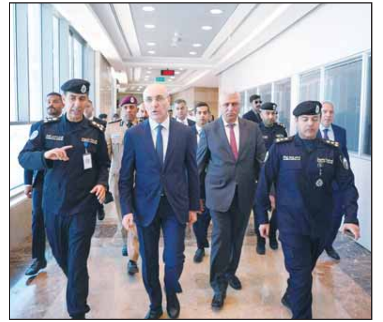
Lebanese Interior and Municipalities Minister Ahmad Al-Hajjar during a visit to security facilities in Kuwait.

The visit concluded with an exchange of commemorative shields, reaffirming the strong ties between the two countries and their commitment to expanding security cooperation.