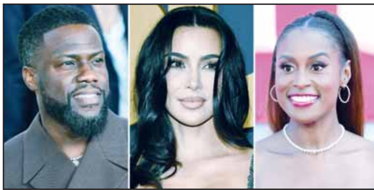
In this combination photo, Kevin Hart attends the "Lift" premiere in New York on Jan. 8, 2024, left, Kim Kardashian attends the SNL50: The Anniversary Special in New York on Feb. 16, 2025, center, and Issa Rae appears at the premiere of "Barbie" in London on July 12, 2023.