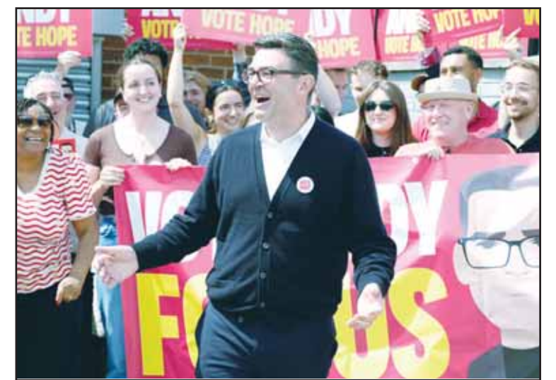
Labour candidate Andy Burnham gestures, surrounded by supporters at the Stubshaw Cross Community and Sports Club as voting is underway in the Makerfield by-election, in Ashton-in-Makerfield, England on June 18.

It's not entirely clear how he'll navigate those limits and bring his unique brand of politics to the revolving-door post that would make him the 7th prime minister in a decade. He'll lay out his economic vision in a speech next week.