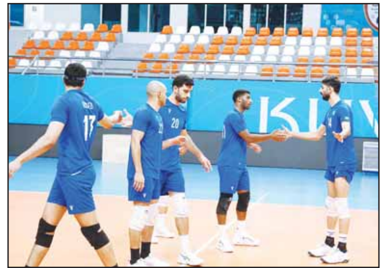
Kuwait national volleyball team in action at training camp.