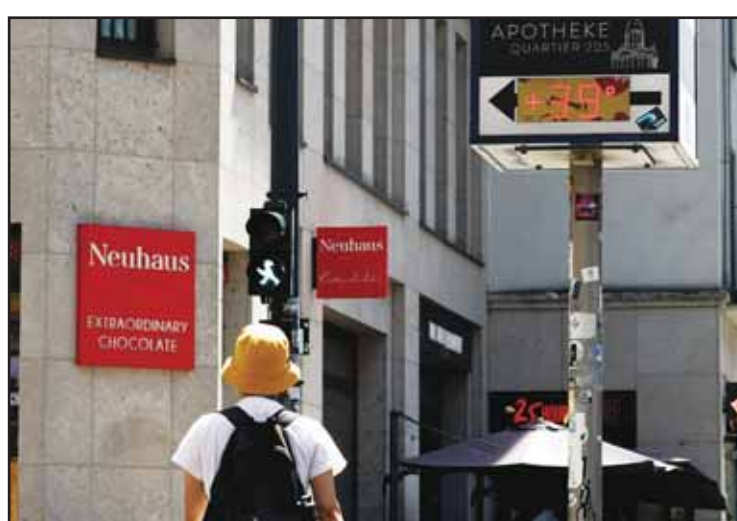
A view of a thermometer next to a pharmacy reading 39 degrees Celsius, in Berlin on June 27.

Ultimately, this marks the most severe heat wave to have ever been