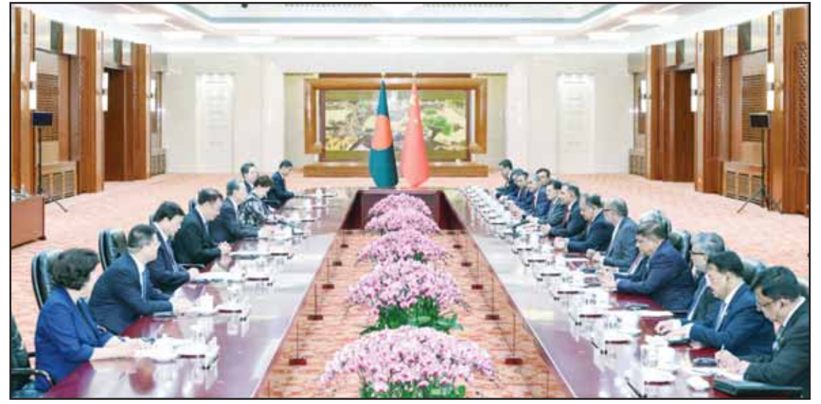
Zhao Leji, chairman of the National People's Congress (NPC) Standing Committee, meets with Bangladeshi Prime Minister Tarique Rahman in Beijing, capital of China, June 26. (Xinhua)

Flooding, slips and road closures have been reported, particularly in Lower Hutt of northeast Wellington. Motorists have been advised to avoid non-essential travel. (Xinhua)