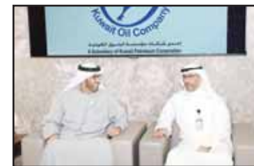
KPC CEO Sheikh Nawaf Saud Al-Nasser Al-Sabah during his meeting with UAE Minister of Industry and Advanced Technology Dr. Sultan Al-Jaber

enhance bilateral cooperation in support of Gulf integration in the energy sector.