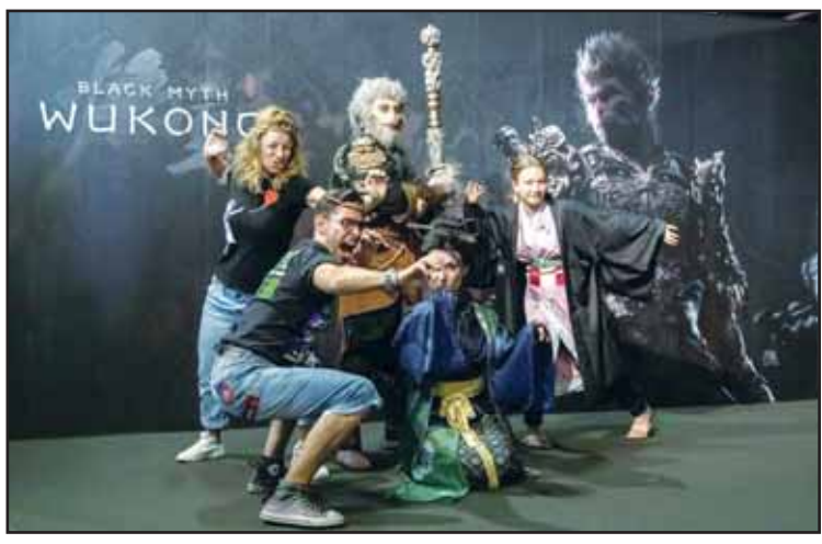
People pose for photos at the photo area of "Black Myth: Wukong" during Gamescom 2024 in Cologne, Germany. (Xinhua)

WARSAW, June 28, (Xinhua): From the global success of Black Myth: Wukong to the enduring popularity of Genshin Impact, Chinese-developed video games are reaching wider international audiences than ever before, reflecting the growing global appeal of the country's gaming industry.