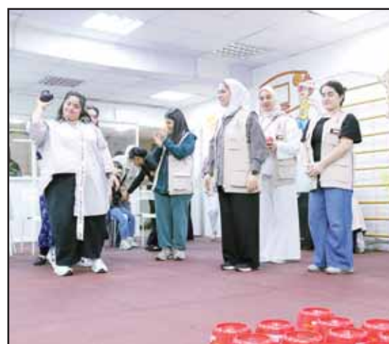
Top and above: Some pictures taken at the ceremony.