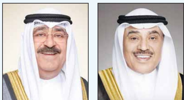
HH the Amir