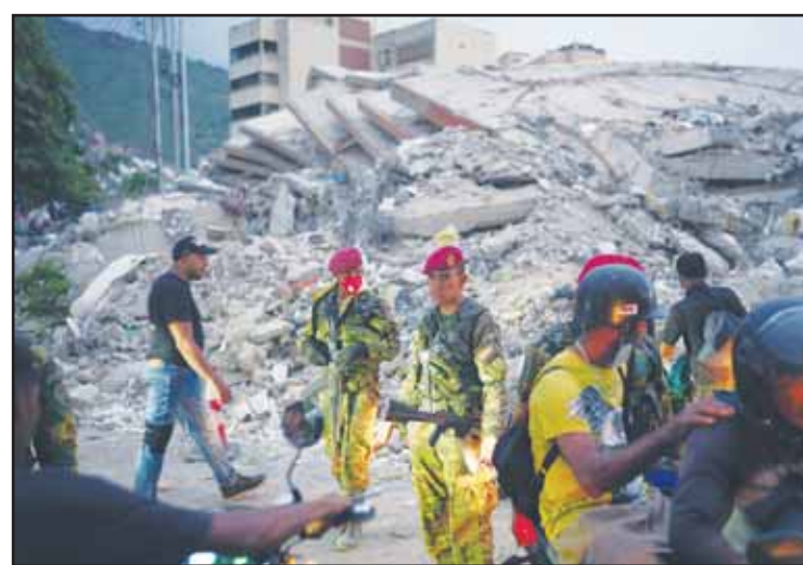
Soldiers guard an area damaged by the earthquakes in La Guaira, Venezuela, on June 27.

Without hard hats or other gear, rescuers and civilians instead wore motorcycle helmets as they searched piles of debris that were once people's belongings: Eddie Murphy and