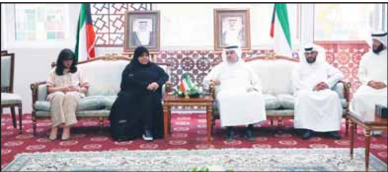
Minister of Justice Counselor Nasser Yousef Al-Sumait during a meeting with six working groups tasked with reviewing debtors' files.

The two officials praised the ambassador's efforts to strengthen cooperation between the two countries and wished him success in his future duties.