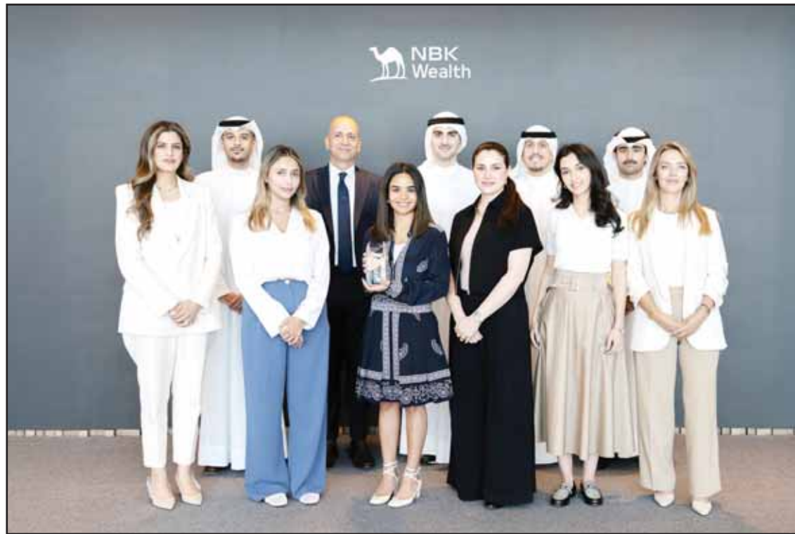
The Group aspires to be the partner of choice in wealth management, empowering clients to build and preserve lasting legacies for generations to come.

This recognition reflects the Group's exceptional performance and unwavering commitment to delivering innovative personalized banking services and