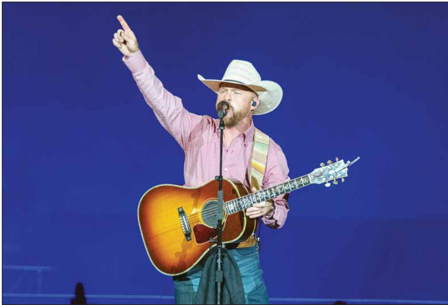
Cody Johnson performs at the Braves Country Fest in Atlanta on June 13, 2026.

It hasn't been an easy road. Last fall, Johnson had to cancel a bunch of tour dates after upper respiratory and sinus infections caused a burst eardrum that required surgery - an intimidating medical procedure for anyone, but especially nerve-wracking for a musician. "I was scared," he said simply. But "in a roundabout