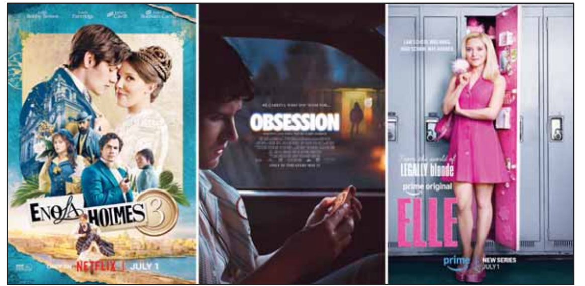
This combination of images shows promotional art for the film, "Enola Holmes 3," left, the film "Obsession," center, and the series "Elle."

■ Madge hath returned. "Confessions II," the sequel to Madonna's beloved 2005 album "Confessions on a Dance Floor," arrives Friday - 21 years after the original. The original has been widely regarded as a return to the top of her pop powers. The critically acclaimed release, which produced such hits as "Hung Up," "Sorry," "Get Together" and "Jump," was dance-pop disco for a new era of clubgoers. So, what will this new era bring? Judging by the previously released "Confessions II" tracks, the breathy "I Feel So Free," the house rhythms of "Love