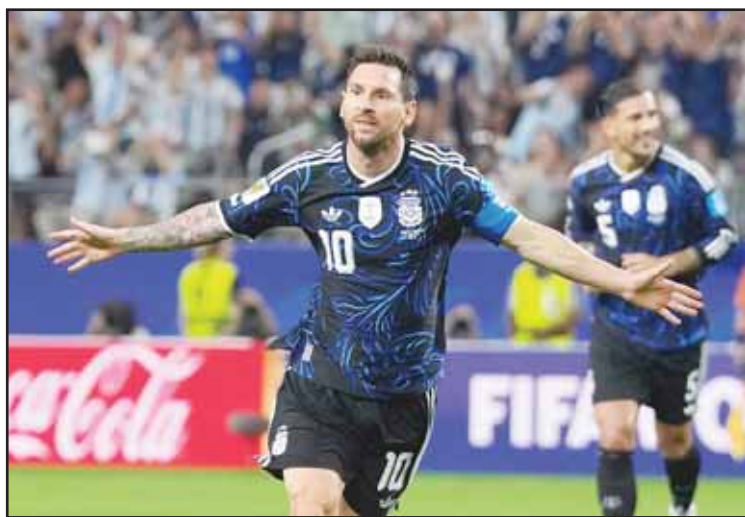
Argentina's Lionel Messi (10) celebrates scoring his side's 3rd goal during the World Cup Group J soccer match between Jordan and Argentina in Arlington, Texas, near Dallas.

"What you're seeing, I'm seeing the same thing," coach Lionel Scaloni said through a translator. "It's a little bit of an uncomfortable situa-