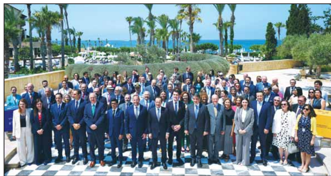
Cyprus' President Nikos Christodoulides, center, Malta's Prime Minister Robert Abela, (center left), pose for a family photo during the high-level conference 'Strengthening Islands and Coastal Communities of the European Union' in the southwestern coastal city of Paphos on the eastern Mediterranean island of Cyprus on June 26.