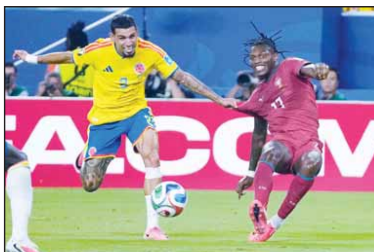
Colombia's Daniel Muñoz (2) challenges Portugal's Rafael Leão (17) during the World Cup Group K soccer match between Colombia and Portugal in Miami Gardens, Fla.

Colombia opens the knockouts on July 3 against Ghana, which entered with one of the lowest FIFA rankings but also played England to a scoreless tie during the group stage. Portugal will face Croatia, which beat Ghana 2-1 earlier Saturday, on July 2 as the Group K runner-up - potentially needing to go through Spain to reach the quarterfinals.