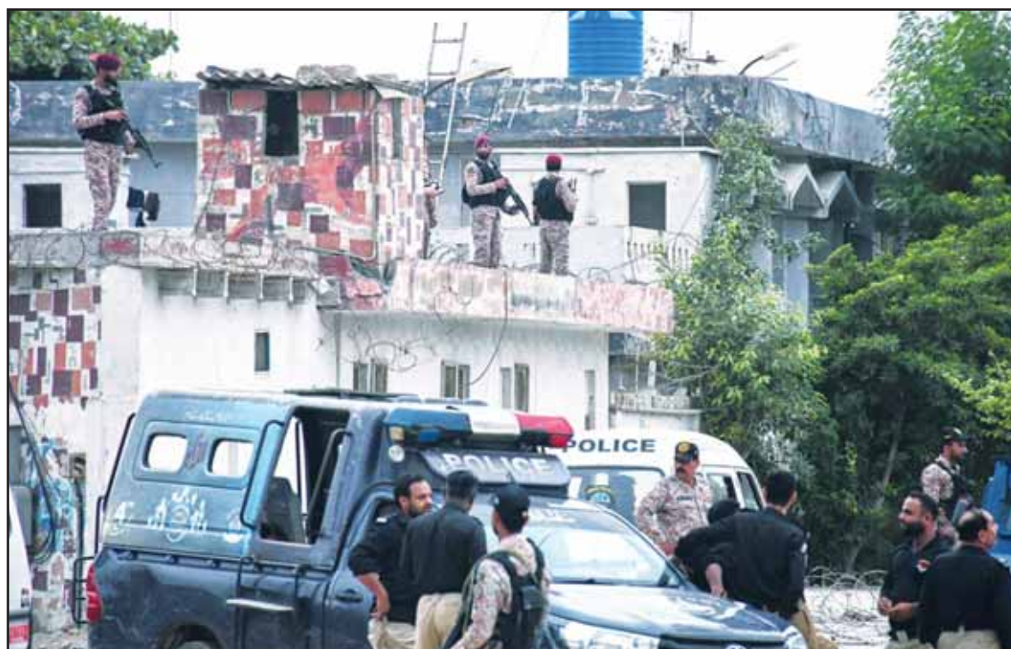
Paramilitary soldiers examine a damaged area after a militant attack at the provincial headquarters of the paramilitary Pakistan Rangers in Karachi, Pakistan on June 28.