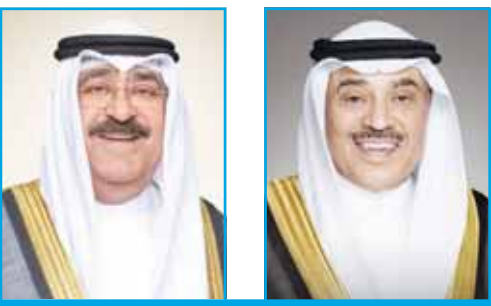
Amir receives Crown Prince, Premier & senior ministers Page 2