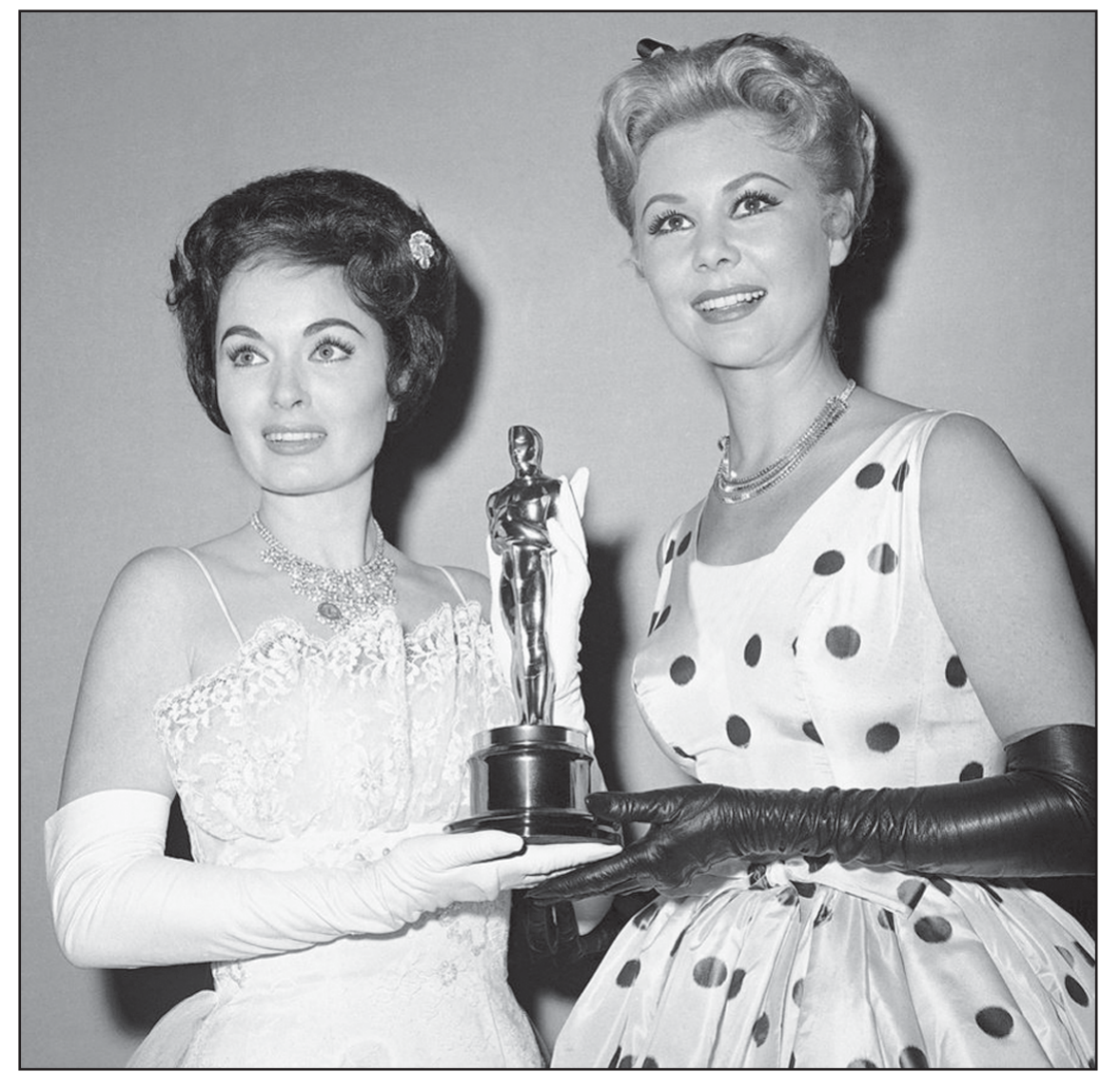
Ann Blyth, left, and Mitzi Gaynor hold an Oscar presented by the Motion Picture Academy for the best short subjects documentary, in Hollywood, Calif., April 4, 1960.

Directed by Michael Curtiz of "Casablanca" fame, "Mildred Pierce" was a memorable piece of film noir that took place mostly at night. For Blyth it was a major change from the cheery musicals she had been known for. It was also a stretch for an actor who was the subject of magazine articles entitled