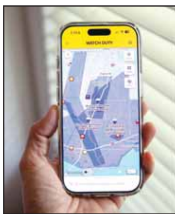
A person uses the Watch Duty app to track floods on June 18, in San Diego, Calif.