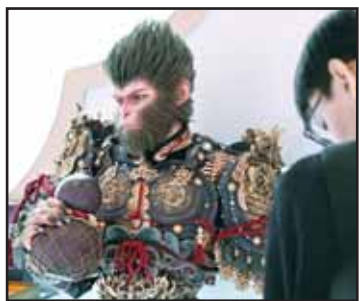
An exhibit of video game "Black Myth: Wukong" is pictured at the tenth China International Copyright Expo in Qingdao, east China's Shandong Province, Oct. 16, 2025.

Reviewing Black Myth: Wukong, international media outlets said the game featured "state-of-the-art graphics" and praised its visual ambition.