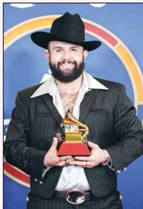
Carín León, winner of the award for best contemporary Mexican music album for "Palabra De To's," poses in the press room during the 2025 Latin Grammys on Thursday, Nov. 13, 2025, at MGM Grand in Las Vegas.

Among the most successful is Kountry Wayne, who transitioned from the comedy sketches that made him famous to a universe of interconnected relationship dramas after noting those had a longer shelf life.