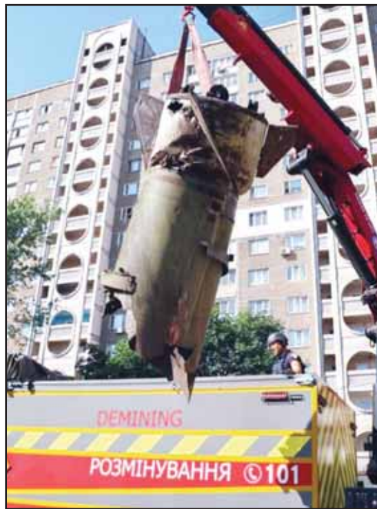
In this photo provided by the Ukrainian Emergency Service, sappers remove a fragment of the Russian missile in a residential neighbourhood following an air attack in Kyiv, Ukraine on June 28. (AP)

The Slavyansk site is one of southern Russia's major refineries, processing close to 4 million tons of crude per year, according to its operator's website.