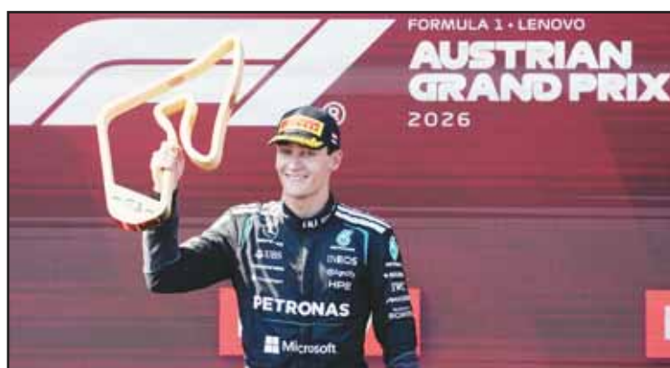
Mercedes driver George Russell of Britain celebrates on the podium after winning the Austrian F1 Grand Prix, in Spielberg, Austria.

Verstappen took the fight to Mercedes with his upgraded Red Bull car at the team's home race, but couldn't get close enough for a shot at Russell and finished up on the defensive against