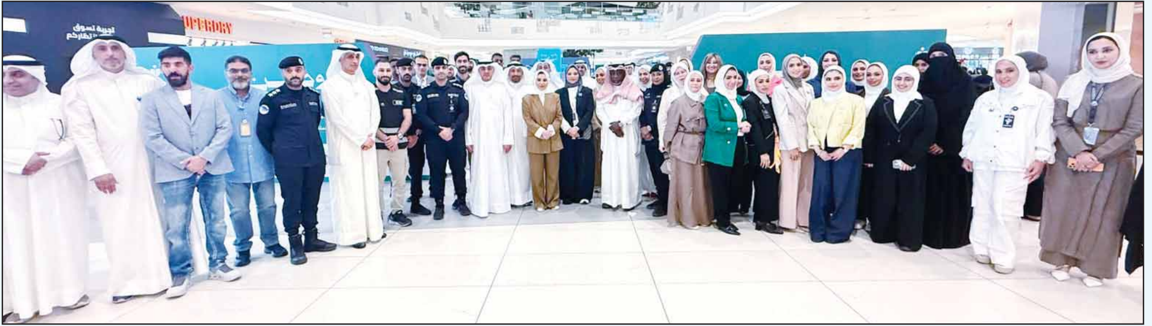
Kuwaiti Minister of Social Affairs, Family, and Childhood Affairs Dr. Amthal Al-Huwailah announces the conclusion of the awareness exhibition for the comprehensive national anti-drug campaign, "A Homeland That Protects You", held at The Avenues Mall.

KUWAIT CITY, June 28, (KUNA) : Kuwaiti Minister of Social Affairs, Family, and Childhood Affairs Dr. Amthal Al-Huwailah announced Saturday the conclusion of the awareness exhibition for the comprehensive national anti-drug campaign, "A Homeland That Protects You", held at The Avenues Mall.