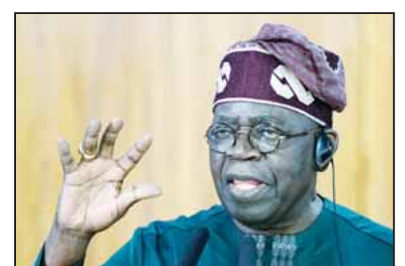
Nigeria's President Bola Tinubu gives a joint statement with Brazil's President Luiz Inacio Lula da Silva, in Brasilia, Brazil, Monday, Aug. 25, 2025.

An insurgency in northern Nigeria has killed thousands