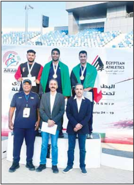
Kuwaiti athletes celebrated on the podium with officials after winning medals at the Arab Athletics Championships in Egypt.