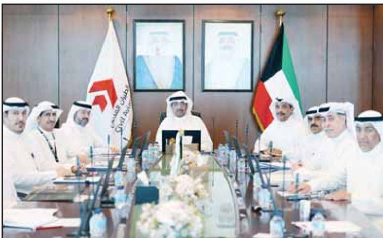
PACA photo Kuwait's Minister of Defense during a meeting with PACA officials on aviation projects and upgrades.

KUWAIT CITY, June 25, (KUNA): Minister of Defense Sheikh Abdullah Ali Abdullah Al-Salem Al-Sabah on Thursday stressed the importance of continuing efforts to develop the civil aviation system and enhance its readiness in accordance with the highest standards of security, safety and operational efficiency.