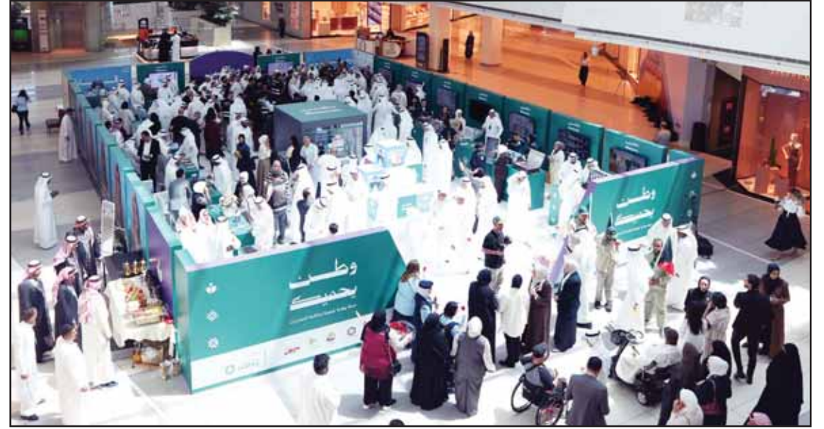
Campaign wing at The Avenues Mall.