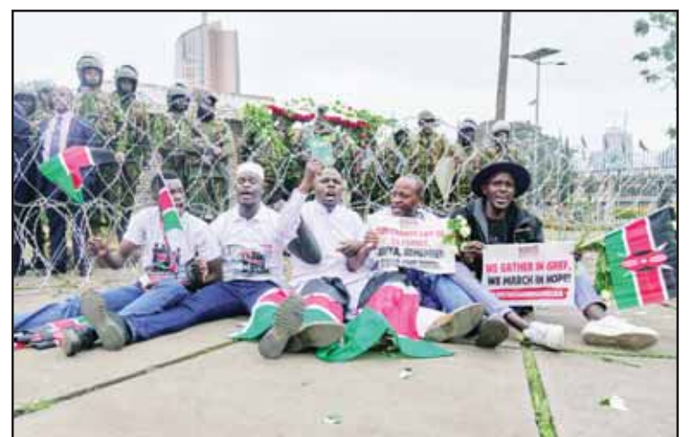
Protesters sing and wave Kenyan flags near parliament during a demonstration to mark two years since more than 60 people died in anti-government demonstrations that resulted in the storming of the parliament, as police officers stand behind a razor-wire barricade in Nairobi, Kenya on June 25.

Opposition leaders have backed the protests, calling for transparency