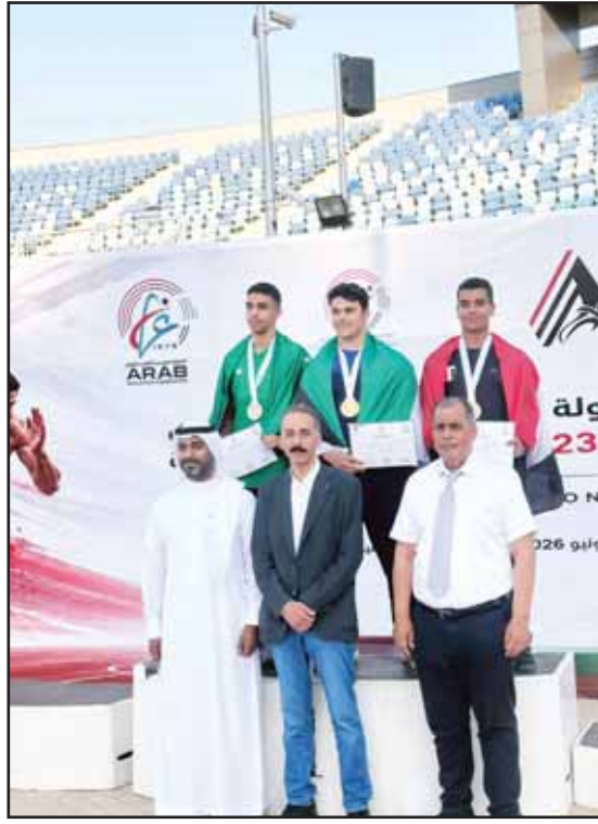
Kuwaiti athletes celebrated victory on the podium with officials at the recently concluded Arab Athletics Championships in Egypt.