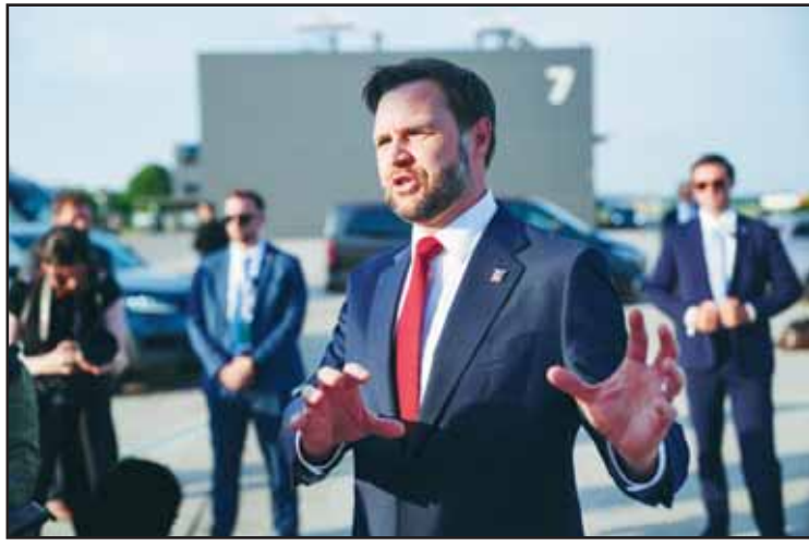
US Vice President JD Vance speaks to members of the media before boarding Air Force Two at Emmen Military Air Base, Emmen, Switzerland on June 22, after the US and Iran held high-level talks at the Lake Lucerne Summit.

Defense Secretary Pete Hegseth returned to Capitol Hill on Wednesday briefing House GOP lawmakers from the conservative Republican