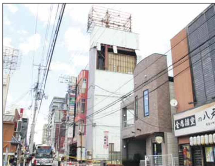
The wall of a building is seen partly damaged following an earthquake in Hachinohe, Aomori prefecture northern Japan on June 25.

The East Japan Railway Co., which operates trains in northeastern regions, said some bullet trains and other local lines have been suspended for safety checks.