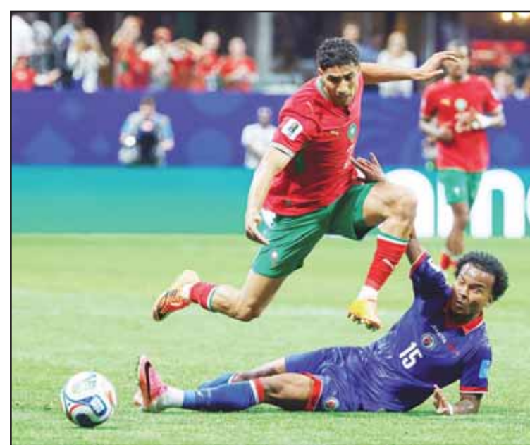
Morocco's Achraf Hakimi (2) gets past Haiti's Ruben Providence (15) to control the ball during the World Cup Group C soccer match between Morocco and Haiti in Atlanta.