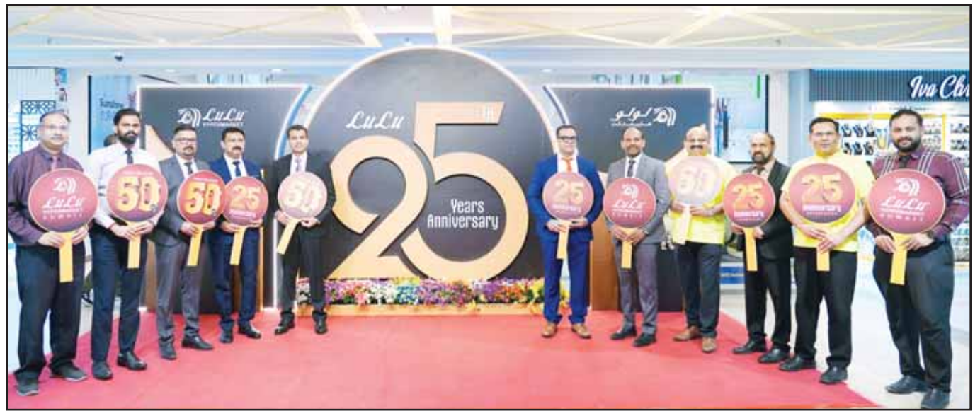
LuLu Kuwait marks 25 years with up to 50% discounts.

The program provides several key redemption options, including shopping through an innovative online marketplace, the first of its kind in banking, where customers can purchase a wide range of products using Gulf Points. The program also allows customers to share points with family and friends as flexible digital gifts, convert points into cash credit added directly to the selected credit card, and use points to book flights, hotels, and car rentals around the world.