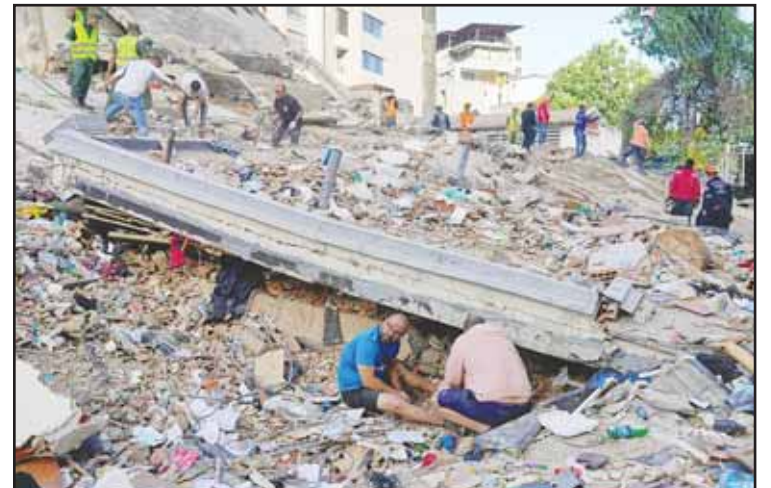
Left: A woman walks past a building damaged during an earthquake in La Guaira, Venezuela on Thursday. Center: Rescue workers search through the rubble of a collapsed building after earthquake in Caracas, Venezuela on Wednesday. Right: Residents and rescue workers search through the rubble of a building that collapsed in earthquakes that struck the previous day in Caracas, Venezuela, Thursday, June 25, 2026.