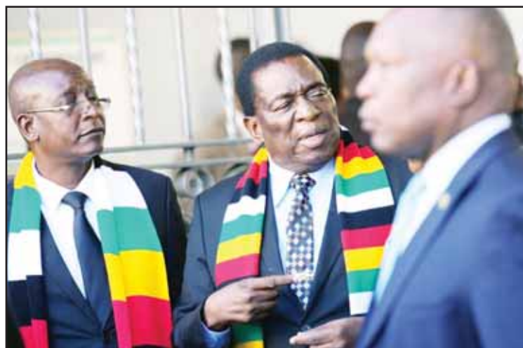
Zimbabwean President Emmerson Mnangagwa, (center), stands next to his chief election agent and Justice Minister Ziyambi Ziyambi, (left), outside the nomination court in Harare, Zimbabwe on June 21, 2023.

The proposed amendments have heightened political tensions in Zimbabwe. Critics of the bill have faced arrest and detention, while others have alleged harassment and intimi-