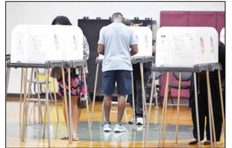
People cast their votes at the Upper Marlboro Community Center on June 23, in Upper Marlboro, Md.

Among other proposed changes, Trump's order would have required people to provide documentary proof of citizenship when registering to vote,