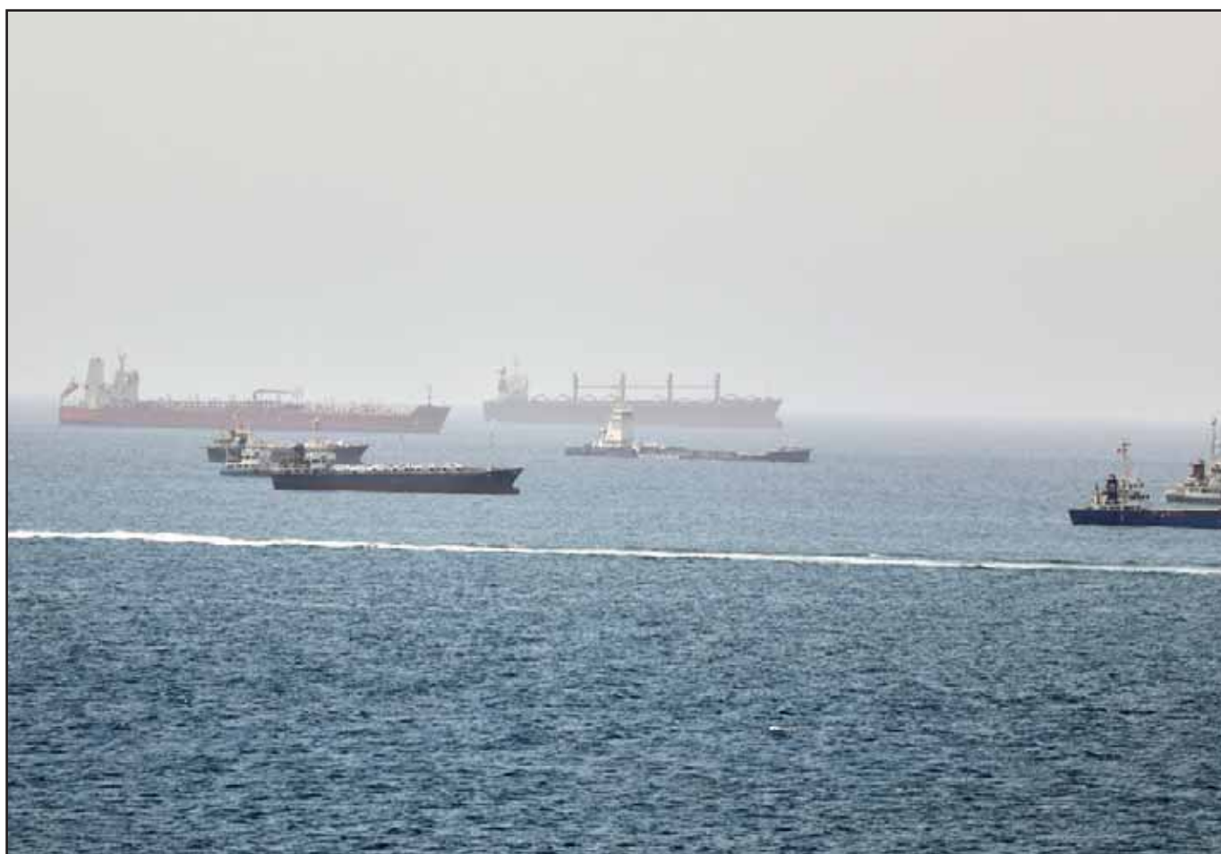
Tankers and cargo vessels are seen in the Gulf of Oman, along shipping routes linking the Strait of Hormuz and the Arabian Sea, Tuesday, June 16, 2026.

The oil tankers, led by the Stoic Warrior vessel, sailed along the coast of the United Arab Emirates and then Oman early Thursday, passing by Oman's Musandam Peninsula fairly close to the shore. The route was laid out by Oman and the International Maritime Organization, a U.N. agency.