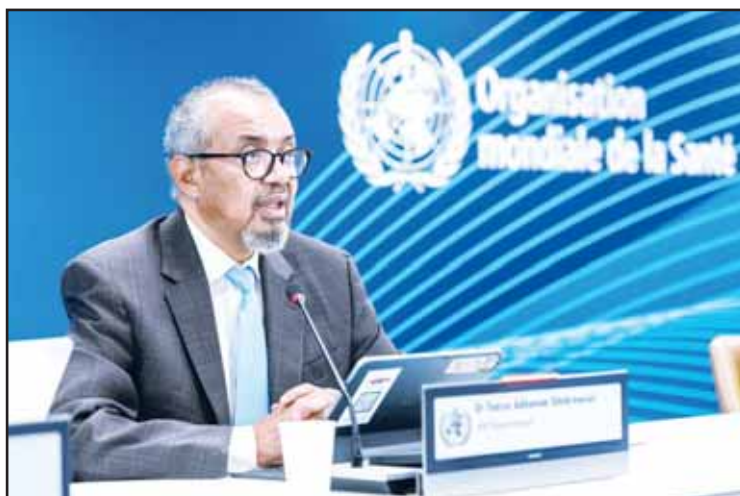
Tedros Adhanom Ghebreyesus, Director General of the World Health Organization (WHO), speaks to the media regarding the epidemic of Ebola and global health issues during a press conference, at the World Health Organization (WHO) headquarters in Geneva, Switzerland on June 24.

According to the minister, the patient is an "experienced doctor returning