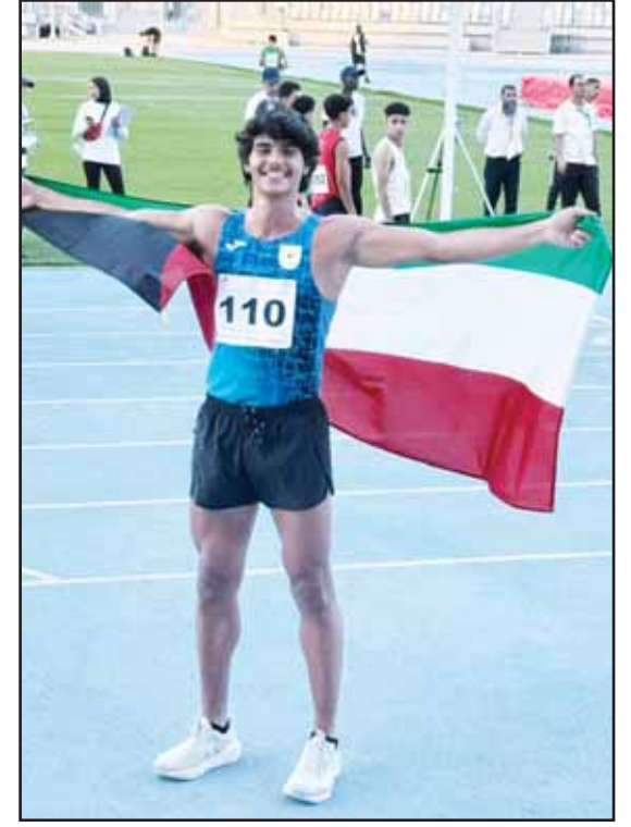
Sultan Al-Rais, bronze medalist, celebrated his win with the Kuwaiti flag at the Arab Athletics Championships in Egypt.