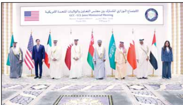
Officials pose for a group photo during the GCC-US ministerial meeting in Manama, bringing together GCC foreign ministers and US Secretary of State Marco Rubio to discuss regional security and cooperation.