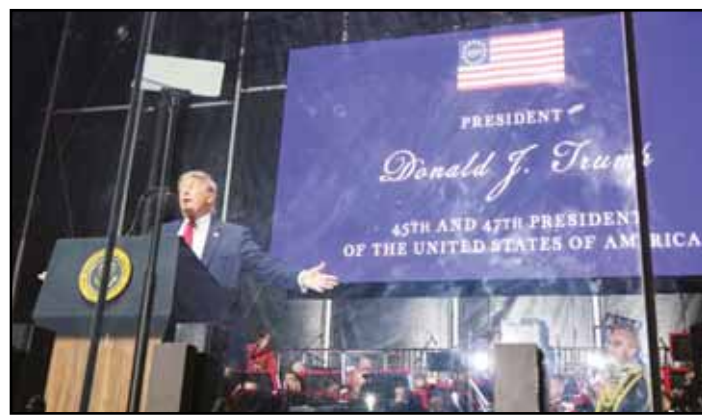
US President Donald Trump speaks at the opening of the Great American State Fair on June 24, on the National Mall in Washington.

his tumultuous effort to revamp the Reflecting Pool near the Lincoln Memorial and build a ballroom at the White House.