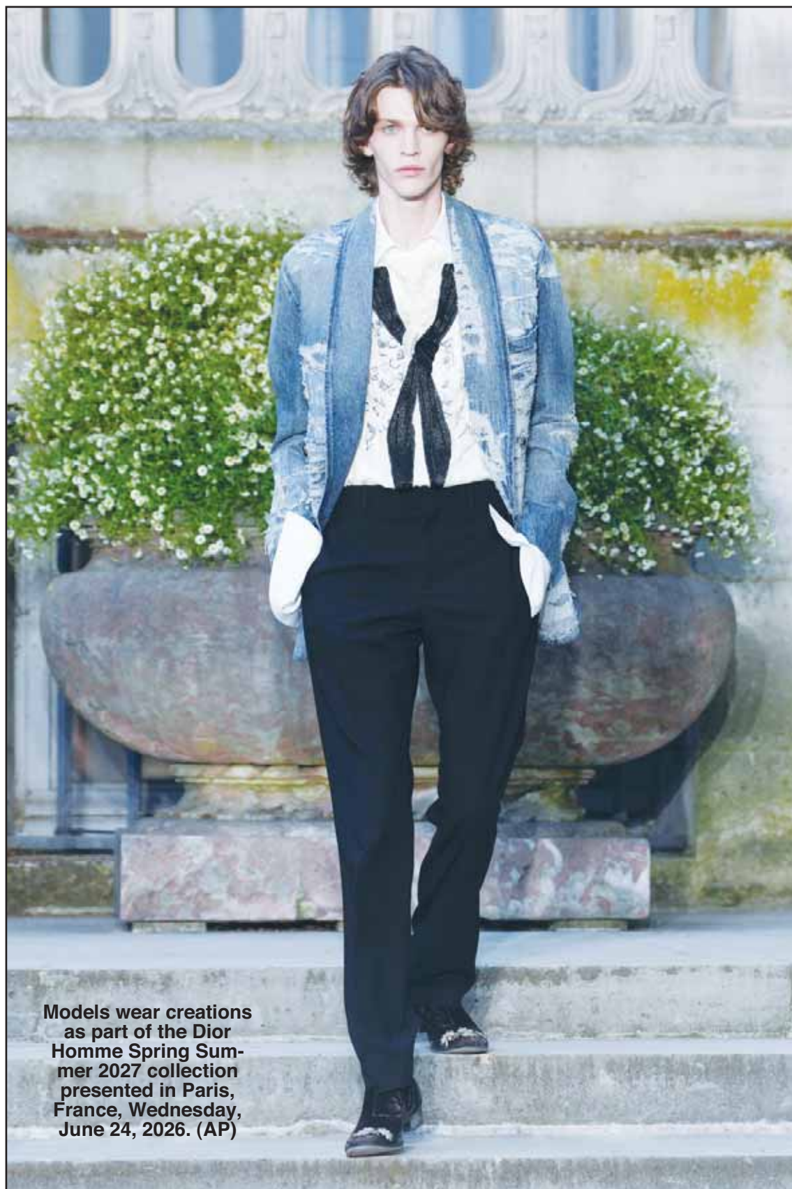
Models wear creations as part of the Dior Homme Spring Summer 2027 collection presented in Paris, France, Wednesday, June 24, 2026.