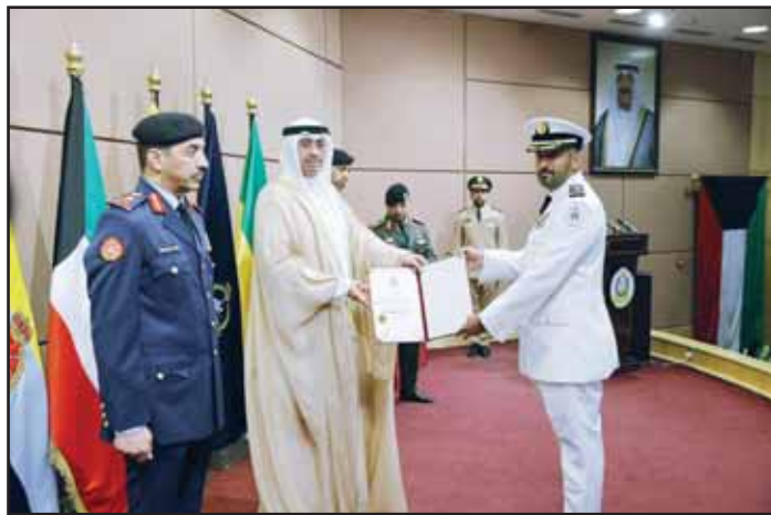
Minister of Defense Sheikh Abdullah Ali Abdullah Al-Salem Al-Sabah honoring the graduates of Joint Command and Staff Course.

He expressed pride in the graduates' achievements and distinguished performance throughout