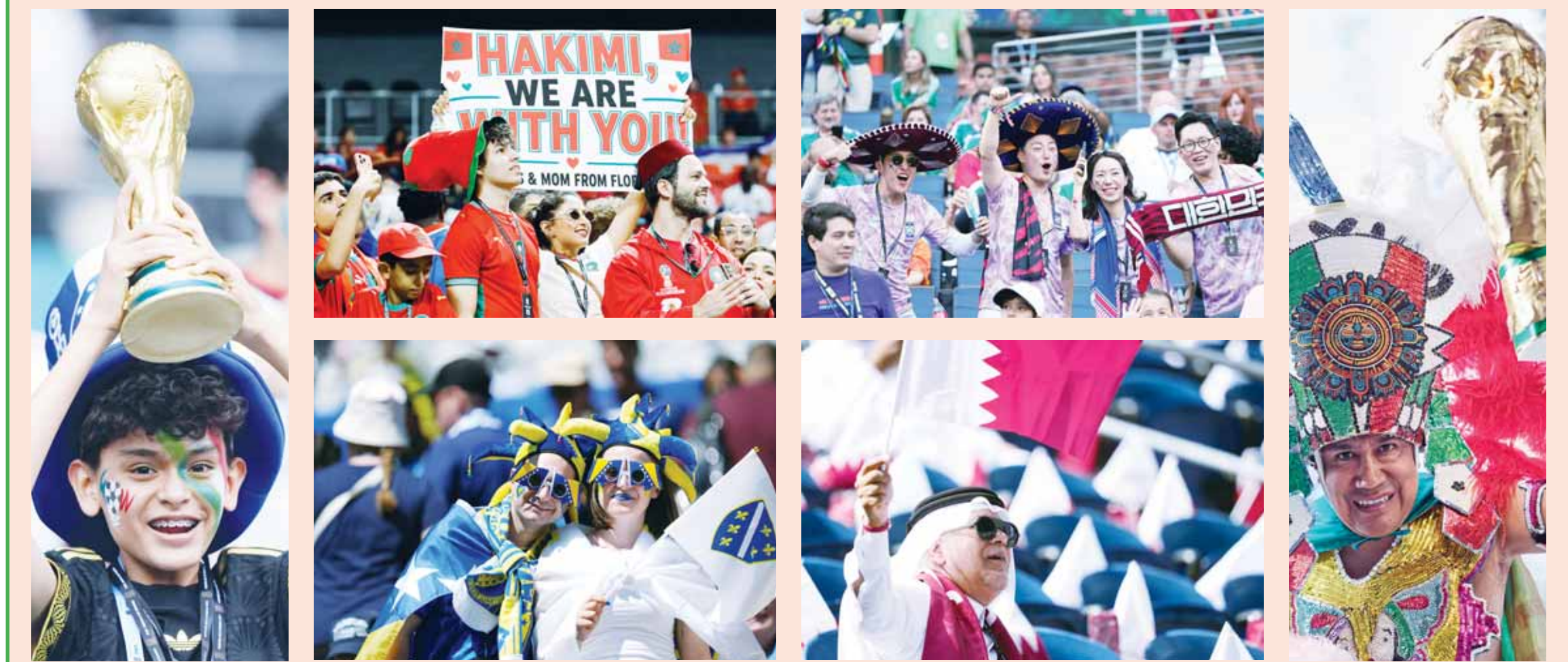
Fans create a festive atmosphere during FIFA World Cup group-stage matches across host cities in Canada, Mexico and the United States.