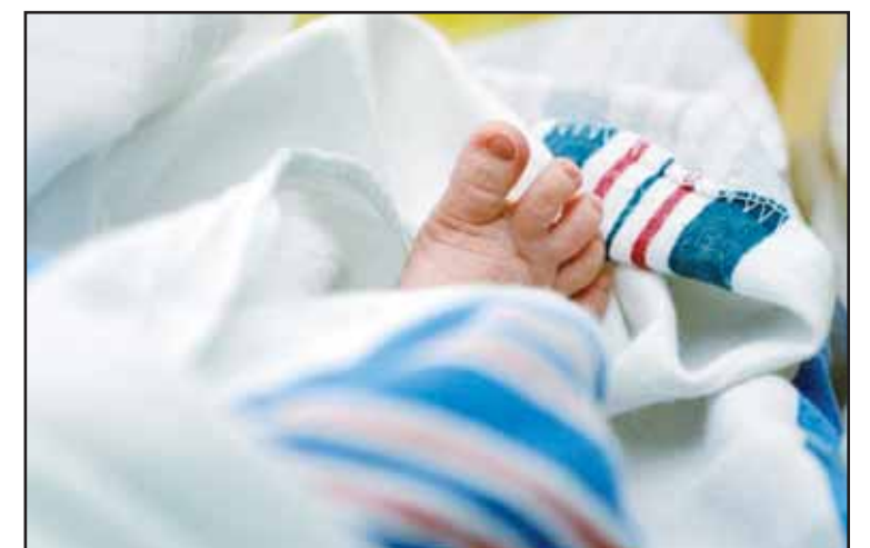
The toes of a baby peek out of a blanket at a hospital in McAllen, Texas on July 29, 2020.

other high-income countries, which experts have attributed to poverty, inadequate prenatal care and other problems. A study published last year found the US infant mortality rate in 2022 - when the rate rose - was nearly twice as high as what was seen in several other high-income democratic nations, including Italy, Japan, Spain and Sweden.