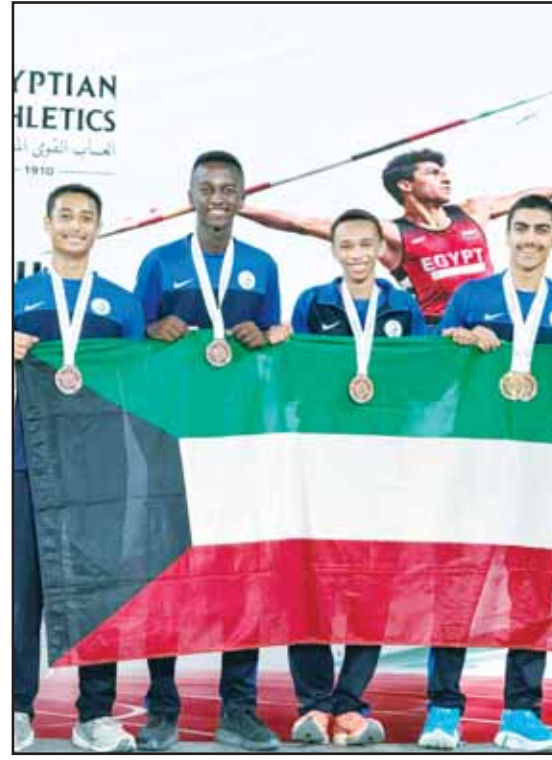
Kuwaiti athletes celebrated victory on the podium with officials at the recently concluded Arab Athletics Championships in Egypt.