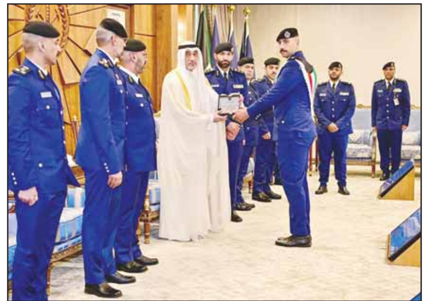
First Deputy Prime Minister and Minister of Interior Sheikh Fahad Yousef Saud Al-Sabah presents certificates of appreciation to fire-fighters.

The statement noted that the 30th Joint Command and Staff Course included 118 participants, comprising 59 officers from the Kuwaiti Army, seven officers from the Ministry of Interior, 10 officers from the National Guard, and 42 officers from the armed forces of brotherly and friendly countries. The course also marked the graduation of the first female officer from the Ministry of Interior to complete the program.