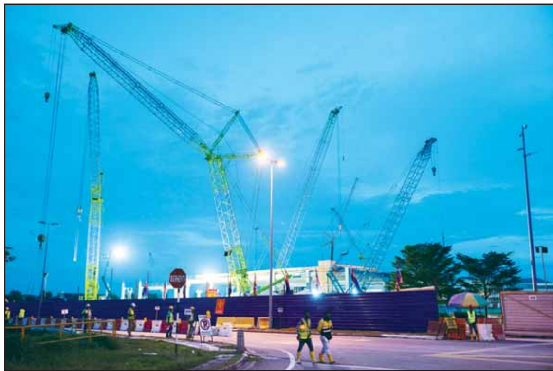
Workers walk outside a data center building under construction in Johor Bahru town at Johor state on Sept 28, 2024.

"The successful conclusion of this response demonstrates the strength of a coordinated response to infectious disease threats that occur outside of our borders," said CDC Acting Director Jay Bhattacharya.