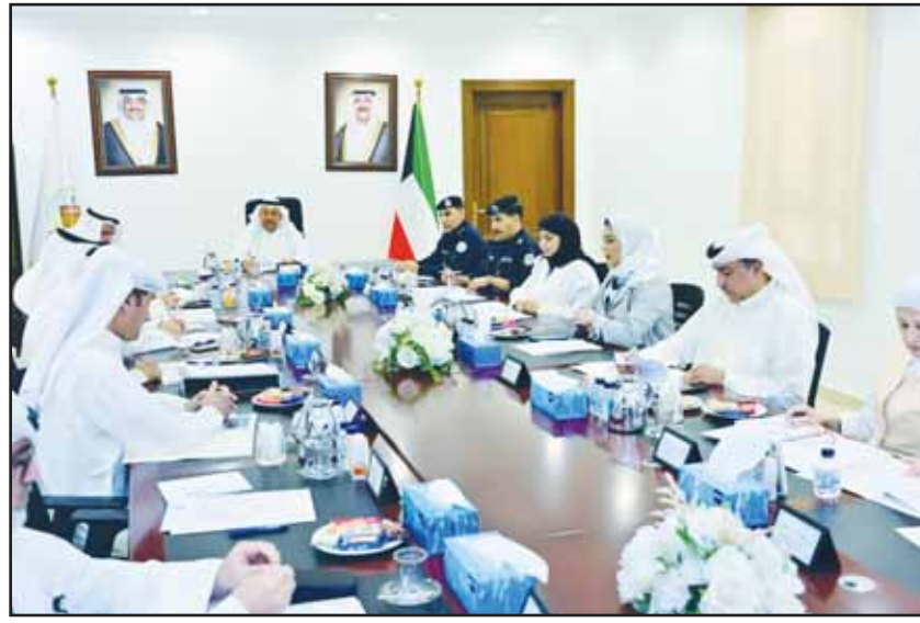
Farwaniya Governor Sheikh Athbi Nasser Al-Athbi Al-Sabah chairs the meeting.