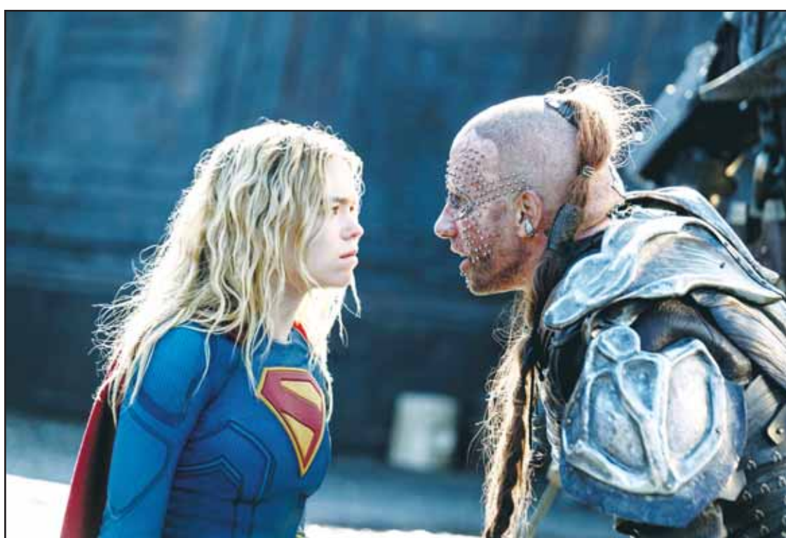
This image released by Warner Bros. Pictures shows Milly Alcock, left, and Matthias Schoenaerts in a scene from "Supergirl."

And much of "Supergirl" is winning. It resides almost entirely in space, touching down only mo-