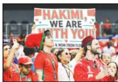
Morocco fans watch warmups before the World Cup Group C soccer match between Morocco and Haiti in Atlanta.