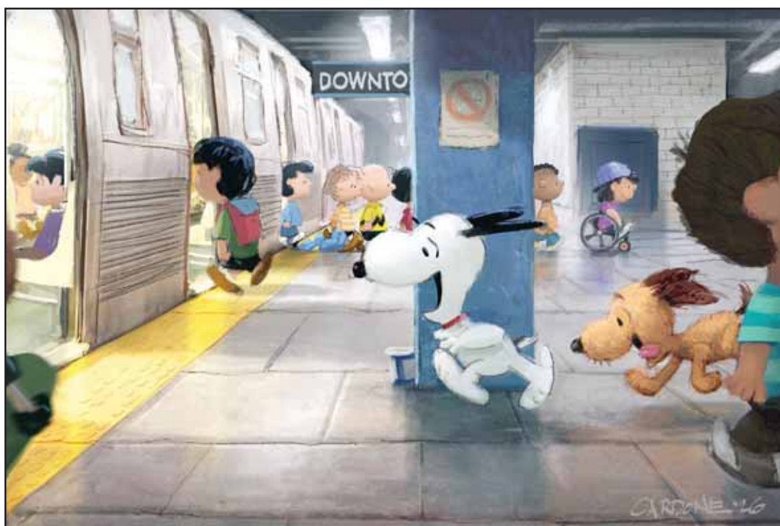
This image released by Apple TV shows "Peanuts" characters, including Snoopy, center, in a scene from the animated movie "Snoopy Unleashed" coming to Apple TV in 2027.

They landed on London as Mia's home since that elevated the stakes.