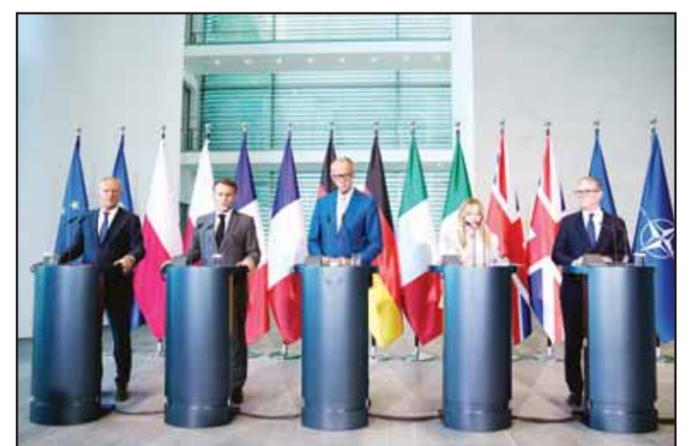
Poland's Prime Minister Donald Tusk, French President Emmanuel Macron, German Chancellor Friedrich Merz, Italian Prime Minister Giorgia Meloni and Britain's Prime Minister Keir Starmer attend a press conference at the E5 NATO Summit in Berlin, Germany on June 24.

"This is your president, but also the leader of the free world, taking