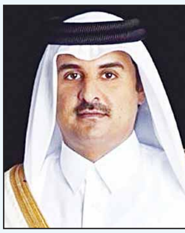
Amir of Qatar