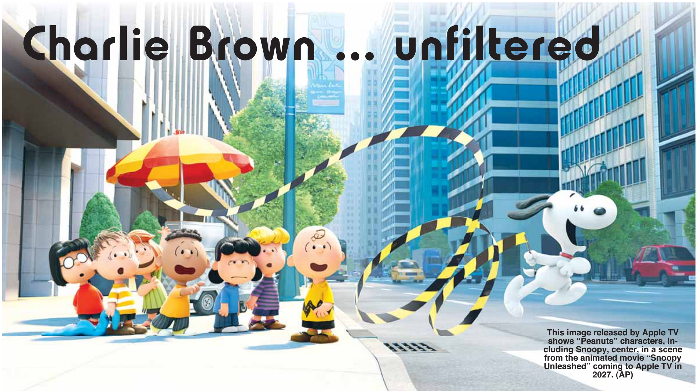
This image released by Apple TV shows "Peanuts" characters, including Snoopy, center, in a scene from the animated movie "Snoopy Unleashed" coming to Apple TV in 2027. (AP)