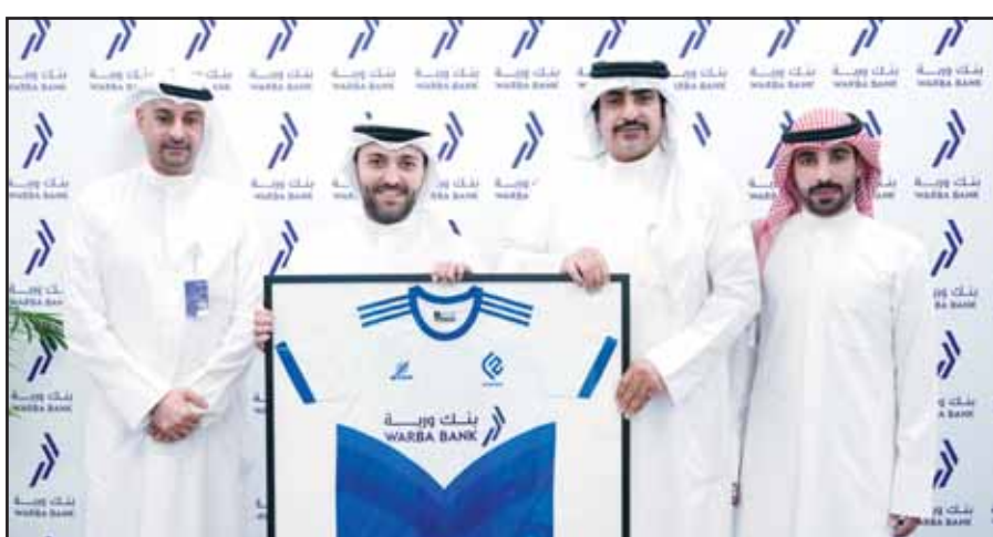
Warba Bank backs youth sports with FZ Academy tie-up.

Warba Bank is a leading Islamic bank in Kuwait with a strong focus on Sharia-compliant digital banking. With one of the largest shareholder bases in the country, the bank delivers innovative financial products and services, reinforcing its position as a digital-focused financial institution.