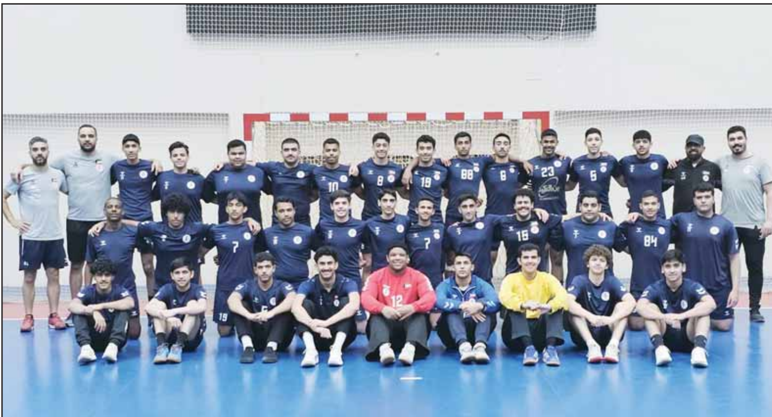
Kuwait handball national teams pose for a group photo with coaches ahead of the match.