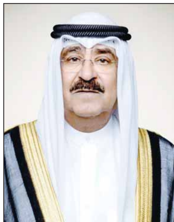
His Highness the Amir

Trump says Tehran will 'pay the price' for stalled talks