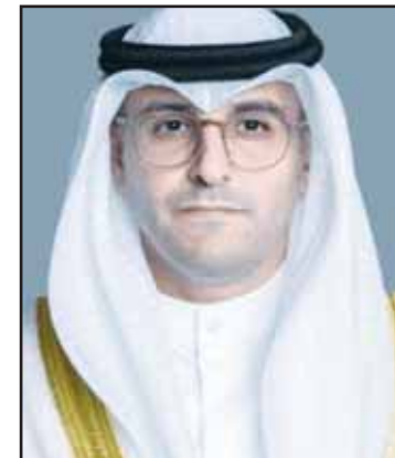
H.E. Eng. Abdul Latif Hamad Al-Mishari, Minister of State for Municipal Affairs and Minister of State for Housing Affairs.

Al-Salman further stated that the forum will discuss the proposed real estate developer model and mortgage financing system, expressing optimism that these initiatives can