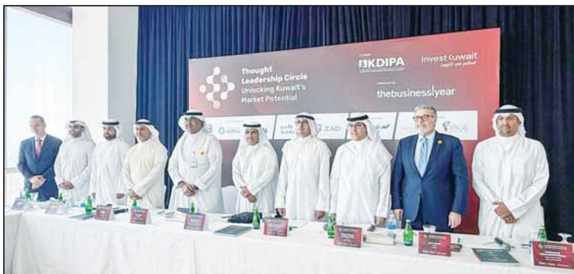
Group photo of the panel.