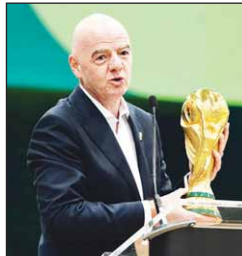
FIFA President Gianni Infantino holds the World Cup trophy as he makes comments during the opening ceremony of the International Broadcast Center in Dallas.

Brazil remains the most successful nation in World Cup history with five titles, followed by Germany and Italy with four each, Argentina with three, and France and Uruguay with two apiece.