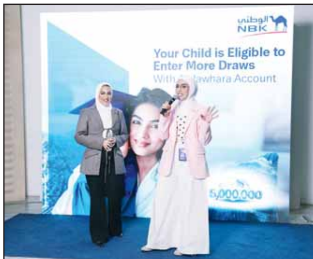
NBK awards Al-Jawhara Prize.