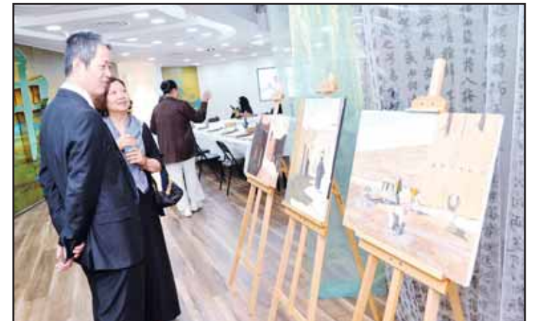
Guests take a closer look at one of the artworks.

Exhibition blends Arabic and Chinese calligraphy, highlighting cultural exchange and mutual understanding