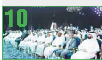
Kuwait Finance House celebrates over 100 employees under the Injaz program