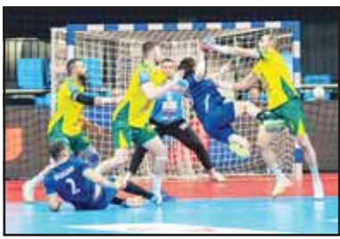
Burgan player is sandwiched between two Al-Khaleej players as he goes for a shot during the Asian Men's Club League Handball Championship in Kuwait.