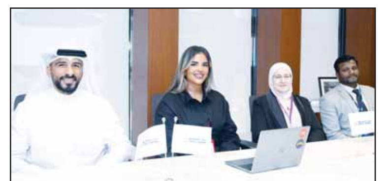
Gulf Bank awards 10 AIDanah prize winners.

The account also offers full flexibility in deposits and withdrawals at any time, while maintaining the customer's eligibility to enter the draws. The "AIDanah Millionaire" account is more than just a savings account; it is an integrated savings experience that combines financial discipline with winning opportunities, reflecting Gulf Bank's commitment to empowering its customers to achieve their financial goals with confidence and sustainability.