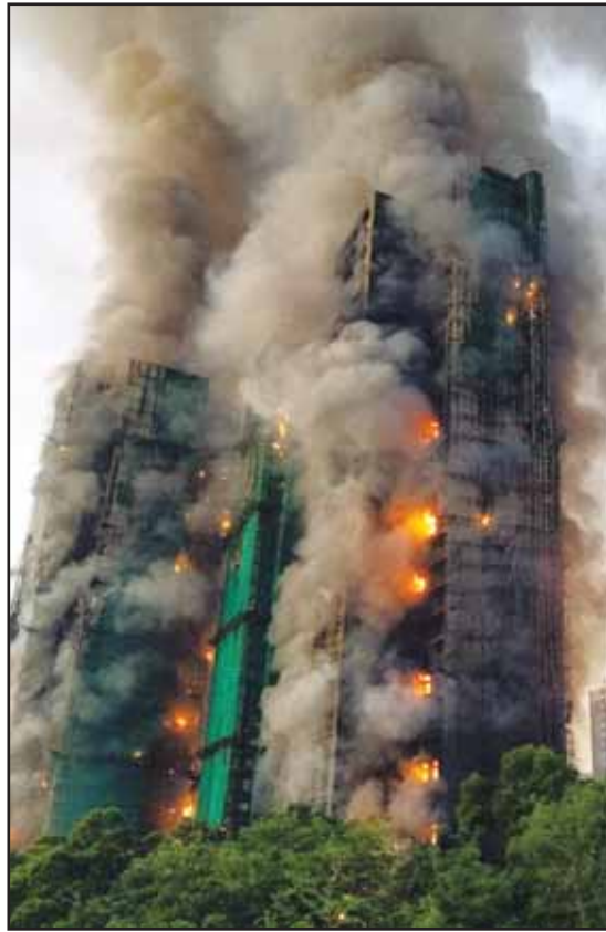
Smoke rises after a fire broke out at Wang Fuk Court, a residential estate in the Tai Po district of Hong Kong's New Territories on Nov 26, 2025.