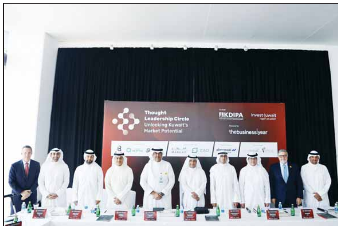
Stakeholders discuss Kuwait's evolving market landscape.

The event was made possible through the support of sponsors and partners including Beyout Holding, KFH, Zain, Markaz, Zad Fintech, AlMowazi Capital, Miceminds, and Apache Photography.