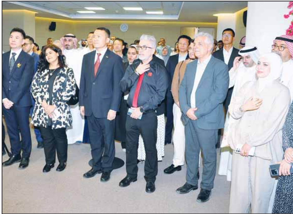
Attendees and dignitaries observe proceedings during a cultural event marking the International Day for Dialogue among Civilizations in Kuwait.