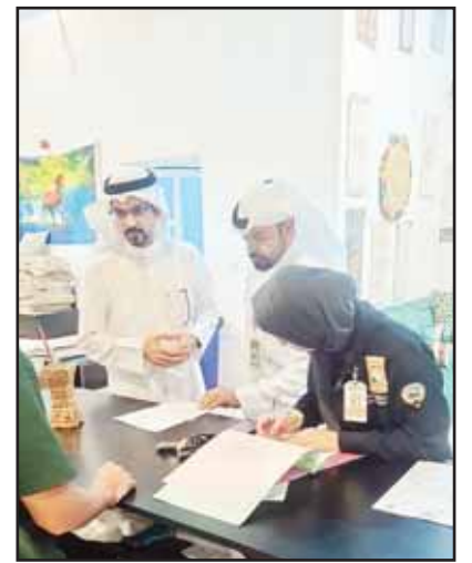
Municipality employees issue warnings to violators.

Similar inspection tours will be carried out across Kuwait's governorates to clamp down on any violations, added the official.