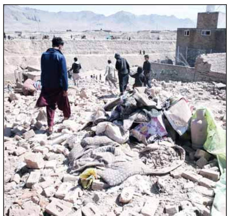
Residents inspect the site of a strike in Kabul, Afghanistan on March 13, 2026.