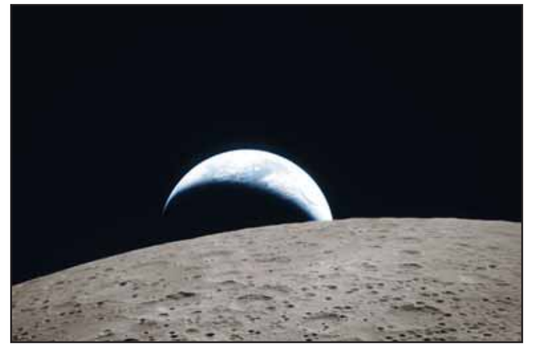
In this image provided by NASA, the Artemis II crew captured this view of an Earthset from April 6, as they flew around the moon. (AP)

Elon Musk's SpaceX and Jeff Bezos' Blue Origin are racing to deliver the lunar landers. The two-week demo is targeted for 2027. Blue Origin suffered a recent setback when its massive rocket exploded during an engine-firing test on the launch pad in Florida, shaking nearby homes and illuminat-