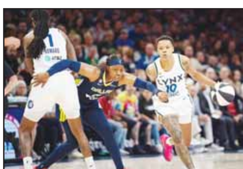
Minnesota Lynx guard Courtney Williams (10) drives past Dallas Wings guard Arike Ogunbowale (24) in the first half of a WNBA basketball game in Minneapolis.