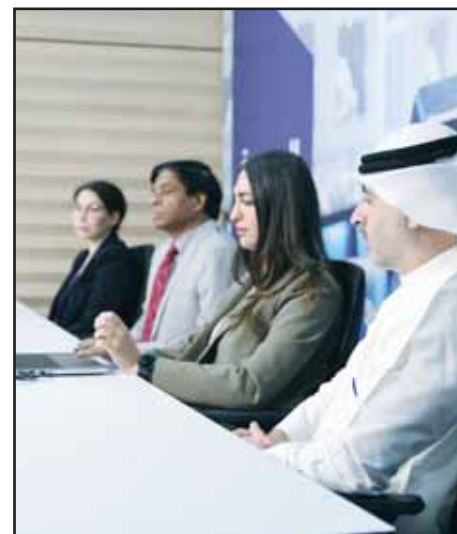
Representatives of the auditing firms Deloitte and Grant Thornton during the draw.

and equal opportunity by subjecting all draws to the oversight of independent global audit firms, alongside implementing rigorous mechanisms designed to maxi-