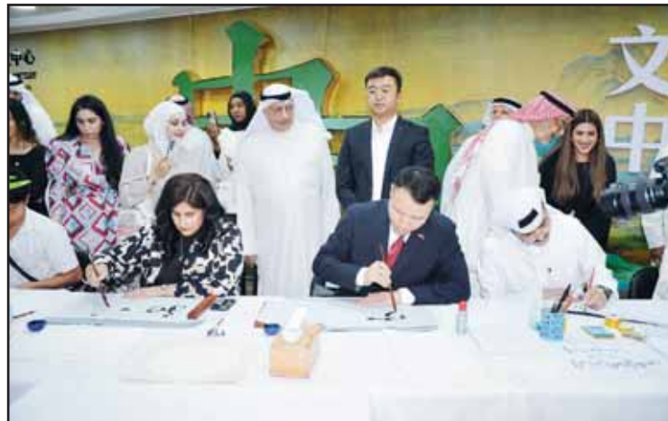
Dignitaries and guests attend the 'Arabic and Chinese Calligraphy'.