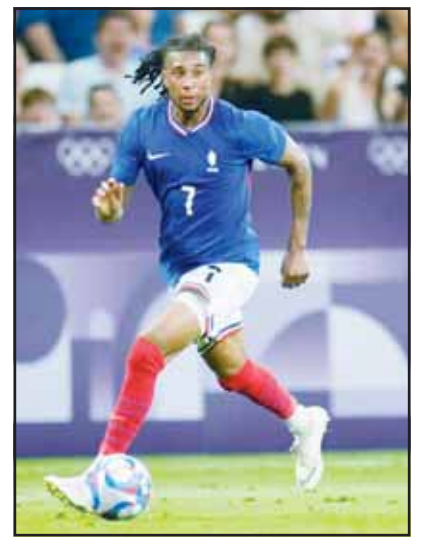
In this file photo, France's Michael Olise runs with the ball during a men's Group A soccer match between Guinea and France at Nice Stadium at the 2024 Summer Olympics in Nice, France.

Olise's first international goal came on his sixth appearance, and it showcased his ability as he bent a free kick into the