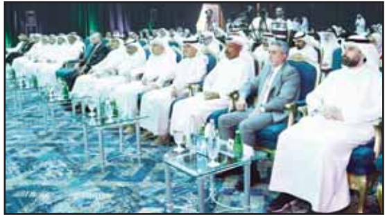
The executive management was at the forefront of those present.