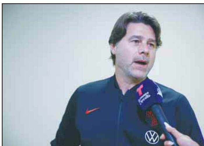
United States' head coach Mauricio Pochettino talks with members of the media as he arrives with his teammates for the World Cup soccer tournament in Santa Ana, Calif.

"We want to do this for ourselves. We want to do this for