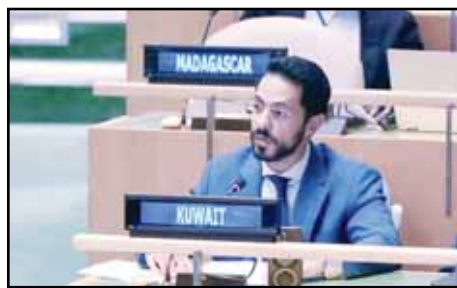
Fahad Al-Ajmi, First Secretary of the Permanent Mission of Kuwait to the United Nations.

"Programs include accessible healthcare, vocational training, and inclusive education to support independence and integration," Al-