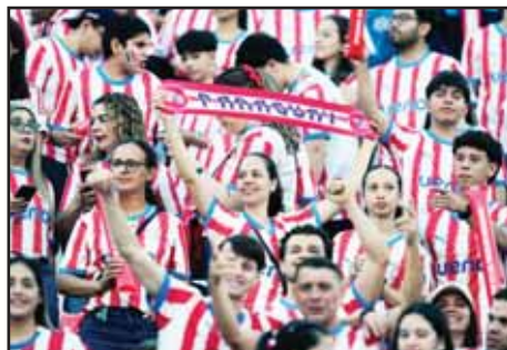
Paraguay's fans cheer prior to an international friendly soccer match against Nicaragua in Asuncion, Paraguay.

"It's going to be something beautiful in that moment, not just for me, but also for my family and for all the Paraguayan fans, and for anyone who's been with us through all the tough moments," Almirón said recently, thinking ahead to the first match. "There are going to be a lot of emotions at that moment. We take it on with responsibility, because we know so many people are depending on us."