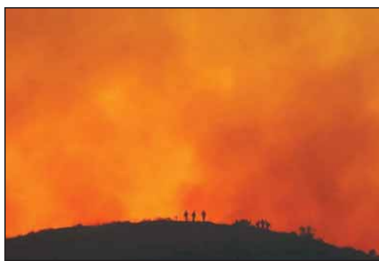
Firefighters are silhouetted amid an operation to control the Sandy Fire on May 19, 2026, in Simi Valley, Calif. (AP)

EPA figures show the national ozone level since 2015 has vacillated around the same mark, going up