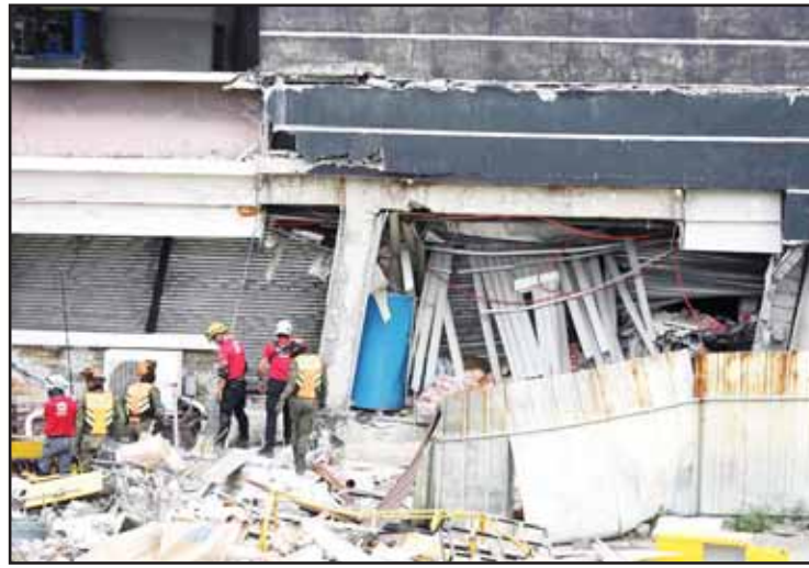
Rescuers conduct a search operation at a damaged building following an earthquake in General Santos, Philippines on June 10.

Monday's quake was one of the most powerful to hit the Philippines in