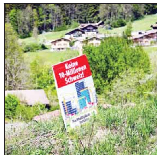
An electoral poster for the right-wing Swiss People's Party (SVP) popular initiative 'No 10-million-Switzerland' is pictured on a field, near Zweisimmen, Switzerland on May 2.

The Police Service of Northern Ireland said there is no information to suggest the attack is terrorism-related and they are not seeking other suspects.