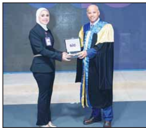
During the stc's recognition for sponsoring the graduation ceremony.