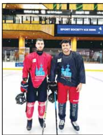
Players pose for the camera before training session.

He expressed confidence in the squad's ability to produce strong performances and achieve positive results in the upcoming tournament, while praising the continued