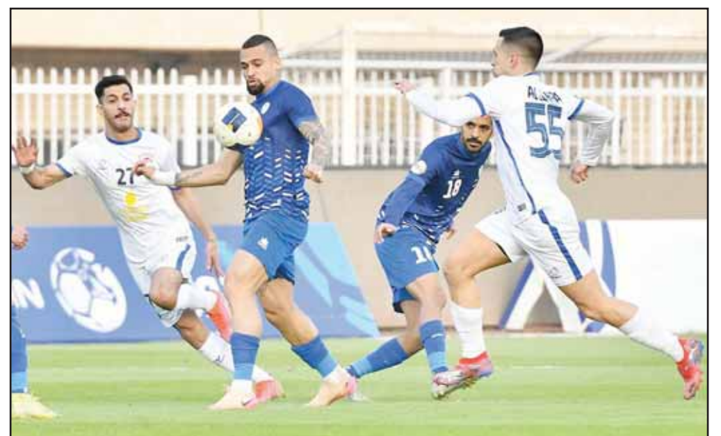
Players battling for the ball during Zain Premier League match.

came against Al-Jahra earlier in the season, after which it endured six defeats and two draws. A positive result would also boost its chances of climbing back to seventh place after slipping to ninth following a disappointing run of form.