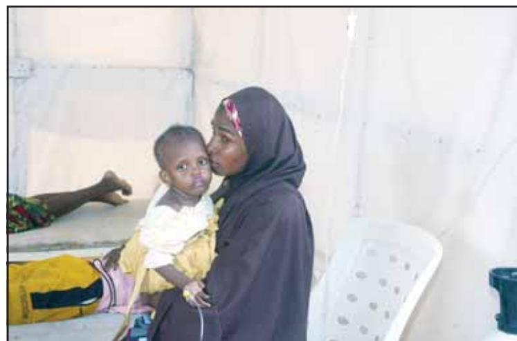
A mother holds her child suffering from cholera at the MSF treatment centre in Maiduguri, Nigeria on June 8.