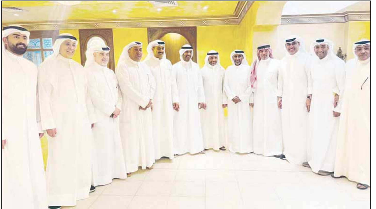
Special luncheon for visiting delegations.

Guests praised the warm hospitality, high organizational standards, and welcoming environment provided by Kuwait Club and the organizing committee, emphasizing that the positive atmosphere surrounding the tournament