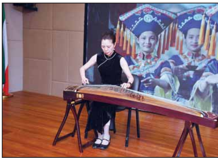
Artists showcase their talents during the event.

Xiang noted that several Chinese cities recently hosted art exhibitions