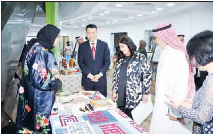
Officials gather around an exhibition table at the cultural event.