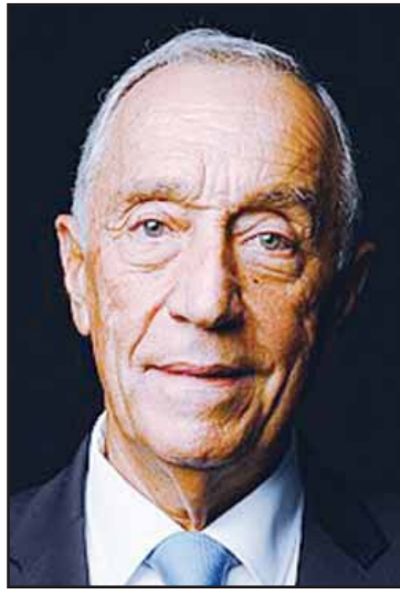
Marcelo Rebelo de Sousa