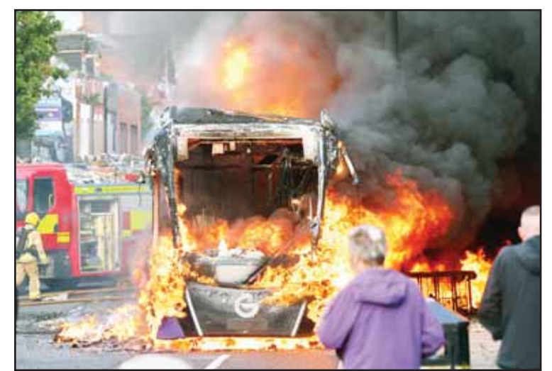
People watch as firemen arrive to put out vehicle that was set alight during a protest in East Belfast following a stabbing incident in Belfast on June 9.

Northern Ireland's power-sharing government condemned the violence. First Minister Michelle O'Neill of Irish nationalist party Sinn Fein said it was "thuggery."