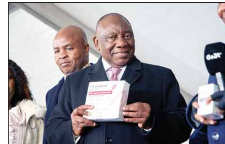
South African President, Cyril Ramaphosa holds a box of Lenacapavir during the official launch of the drug's rollout programme in Secunda, South Africa on June 5.

South Africa has over 8 million people living with the virus. It is hoped that lenacapavir will help curb new infections in the country, which range from 140,000 to 170,000 annually.