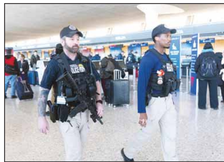
Department of Homeland Security, Transportation Security Administration, Federal Air Marshals, patrol around Washington Dulles International Airport, in Chantilly, Va., on March 24.