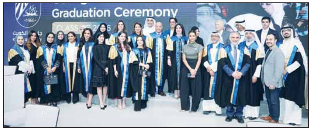
Group photo of the graduates

KUWAIT CITY, June 10: Kuwait Telecommunications Company - stc, a world-class digital leader providing innovative services and platforms to customers, enabling the digital transformation in Kuwait, sponsored the Graduation Ceremony of the College of Dentistry at Kuwait University for the 2025-2026 academic year. The sponsorship reflects stc's support toward the educational system in Kuwait, while empowering the youth through its educational 'upgrade' initiative, which aims to contribute to the development of future generations and equip them with the tools needed to succeed in an evolving digital world.