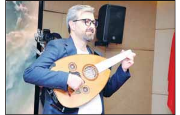
A performer delivers a live artistic performance, adding to the event's cultural atmosphere.