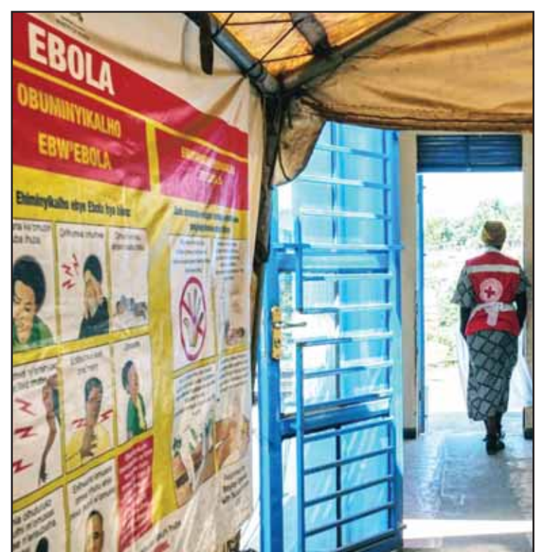
A health worker stands at a temporary health clinic at the Mpondwe border crossing linking Uganda and the Democratic Republic of the Congo on June 4.

The health minister has said Gilead committed to granting a voluntary manufacturing license to a South African company following the granting of six licenses to other countries last year.