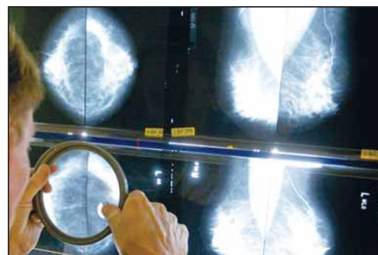
A radiologist uses a magnifying glass to examine mammograms for breast cancer in Los Angeles, May 6, 2010.

More than 320,000 women in the U.S. will be diagnosed with breast cancer this year, according to the American Cancer Society. Death rates have been