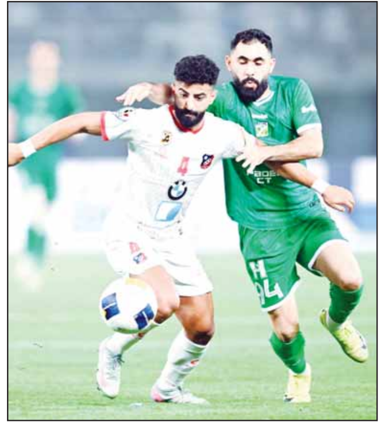
In this file photo, Al-Arabi player holds back Kuwait Club player during a league match.