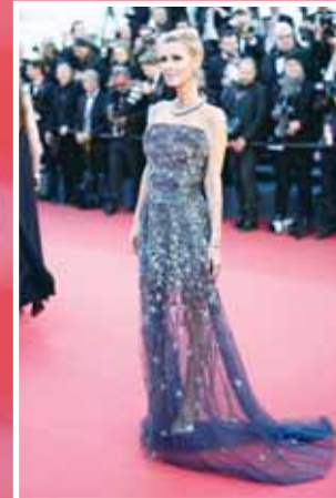
Nicky Hilton Rothschild.