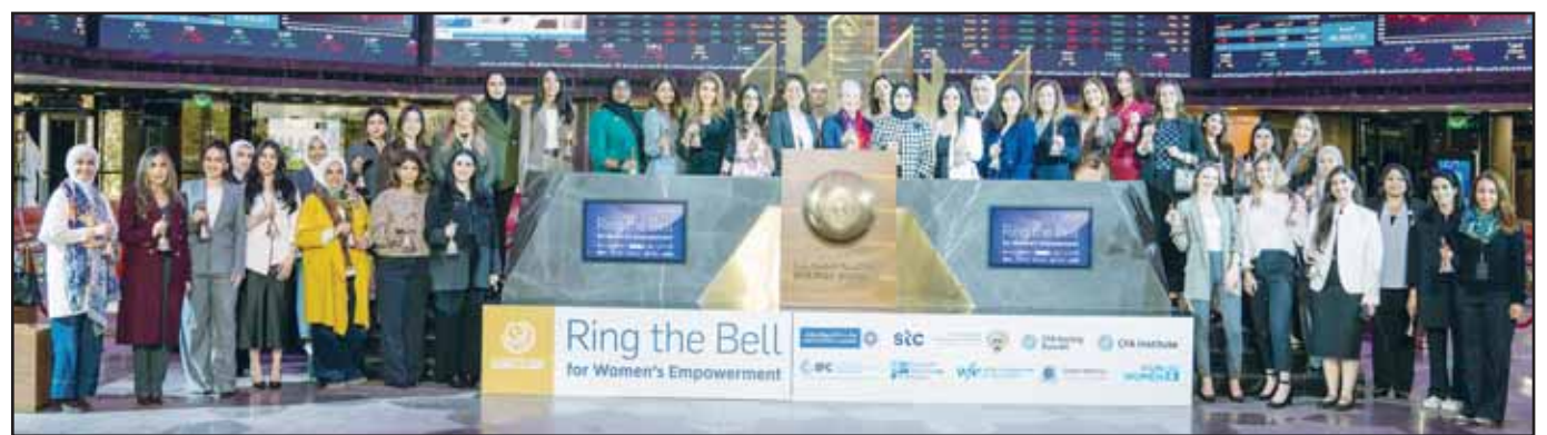
Female leaders in the Kuwaiti capital market highlight its features and discuss the role of inclusivity in enhancing the efficacy of investment decisions.

KUWAIT CITY, May 17: Reaffirming its commitment to women's empowerment and to strengthening inclusivity and equality within the Kuwaiti capital market and the broader economic landscape, Boursa Kuwait rang the bell in commemoration of women's empowerment for the ninth consecutive year, in collaboration with the World Federation of Exchanges (WFE), UN Women, the United Nations Global Compact, the United Nations Sustainable Stock Exchanges Initiative, and the International Finance Corporation (IFC).