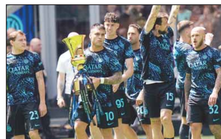
Inter Milan's Lautaro Martinez holds the trophy of the Italy's cup prior to the start of a Serie A soccer match between Inter Milan and Hellas Verona, in Milan, Italy.

Inter Milan won the Serie A title with three rounds remaining and will celebrate after its match against Hellas Verona later, its final home game