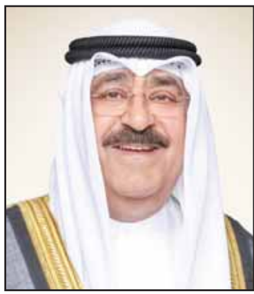
HH Amir Sheikh Meshal

Fajr ..... 03:24 Asr ..... 15:20 Sunrise .. 04:54 Maghrib .. 18:35 Zohr ..... 11:44 Isha ..... 20:02