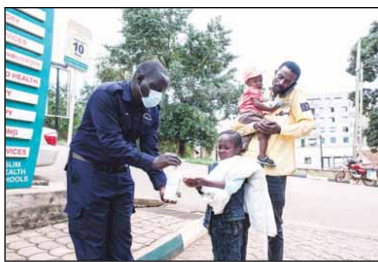
A girl sanitises her hands in front of Kibui Muslim Hospital in Kampala, Uganda on May 16.