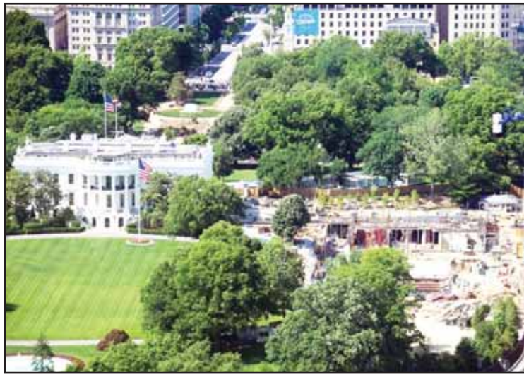
Work continues on the construction of the ballroom at the White House on May 16, in Washington, where the East Wing once stood.

Senate Minority Leader Chuck Schumer, D-N.Y., took credit for the ruling after Democrats argued to the parliamentarian that the security money doesn't belong in the bill.