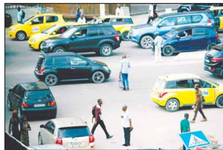
Pedestrians slalom between traffic to cross the road in Kinshasa, Congo on Jan 8, 2019.

"What would one do in a completely unknown place, without a place to live and without knowing what to do?" she