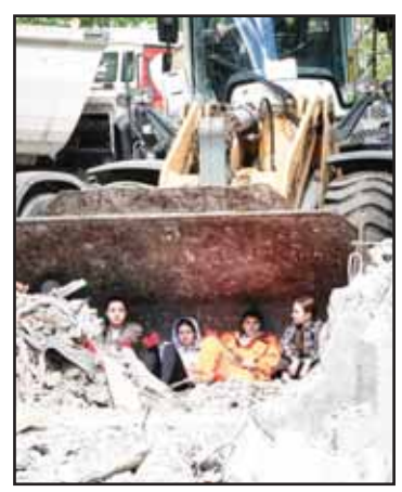
Schoolchildren hold flowers as they sit in an excavator bucket at the site of Thursday's Russian missile strike that hit a residential building in Kyiv, Ukraine on May 15.

Russian defenses shot down 81 drones headed for Moscow overnight, state agency Tass reported, citing So-