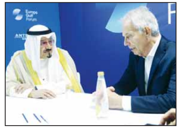
Representative of His Highness the Amir Sheikh Meshal Al-Ahmad Al-Jaber Al-Sabah, His Highness the Prime Minister, Sheikh Ahmad Abdullah Al-Ahmad Al-Sabah meets former British prime minister Tony Blair.