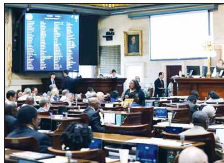
US State Rep Angie Nixon, D-Fla., speaks loudly on the House floor as the House voted on HB1D, a redistricting bill, during a special session of the Florida Legislature, on April 29, 2026, in Tallahassee, Fla.

The Florida Legislature approved a new House map on April 29 - the same day the U.S. Supreme Court weakened federal Voting Rights Act protections for minorities while striking down a majority-Black