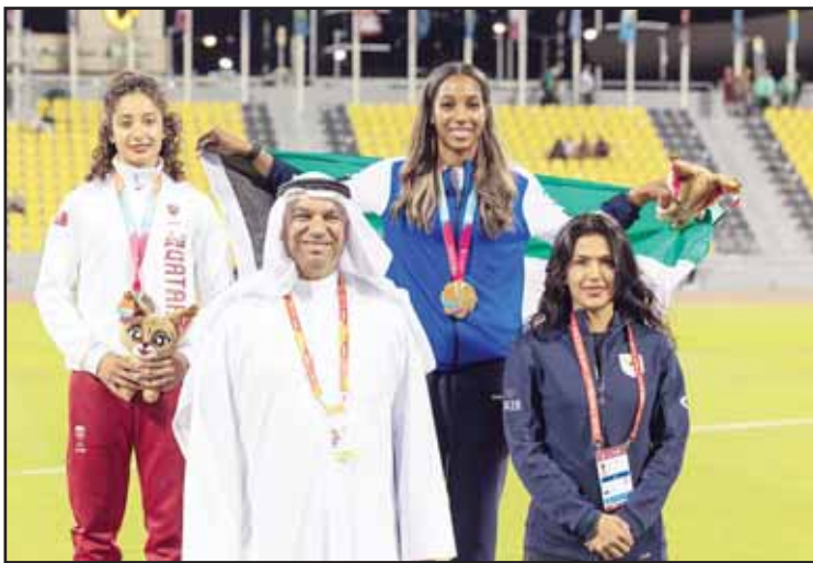
Women's triple jump gold medalist Aisha Al-Khader