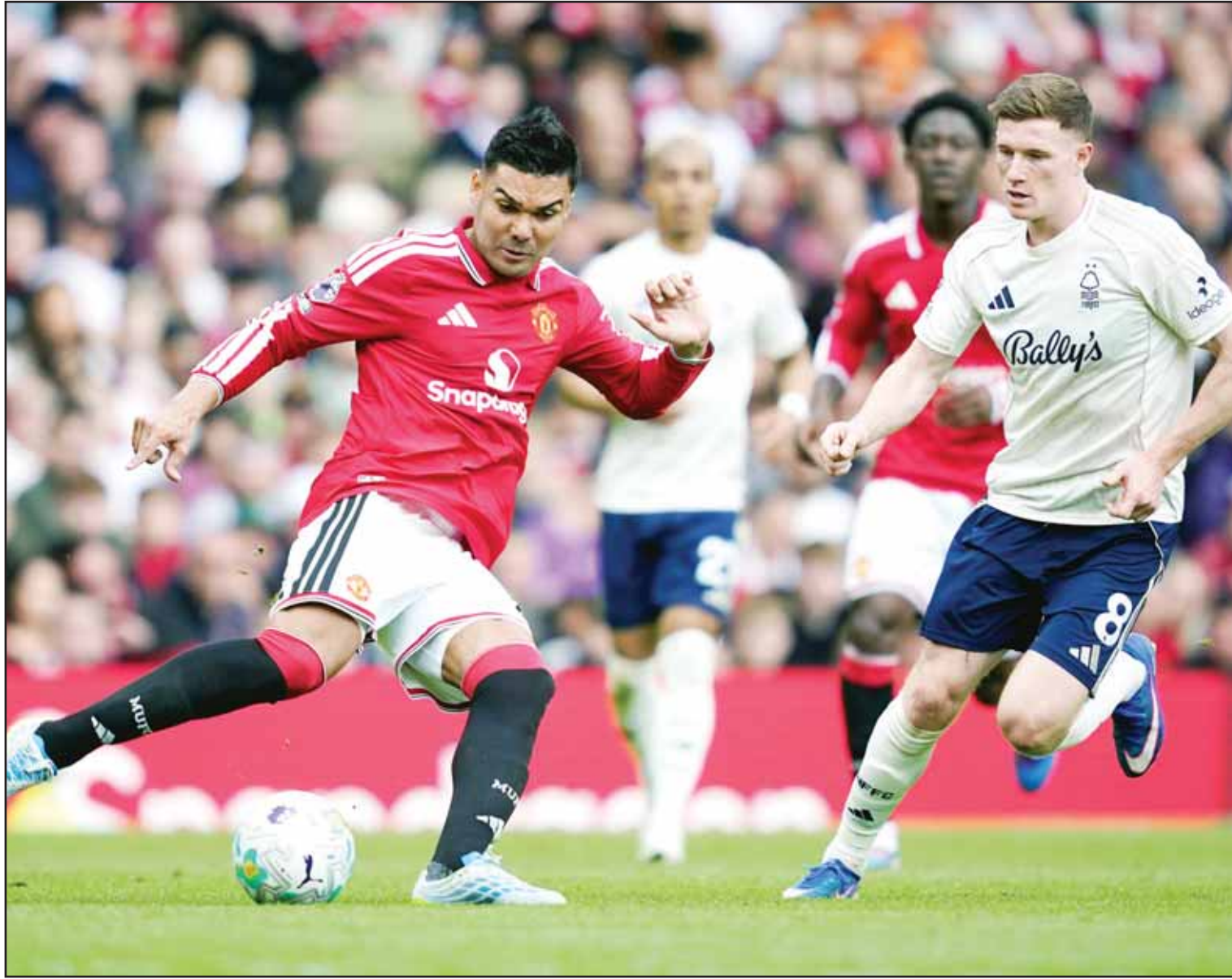
Manchester United's Casemiro, left, challenges for the ball with Nottingham Forest's Elliot Anderson during the English Premier League soccer match between Manchester United and Nottingham Forest in Manchester, England.