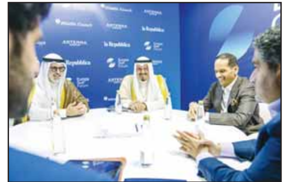
Representative of His Highness the Amir Sheikh Meshal Al-Ahmad Al-Jaber Al-Sabah, His Highness the Prime Minister, Sheikh Ahmad Abdullah Al-Ahmad Al-Sabah, receives the Qatari Premier and Foreign Minister Sheikh Mohammad bin Abdurrahman Al-Thani.

Kuwait's Minister of Foreign Affairs Sheikh Jarrah Jaber Al-Ahmad Al-Sabah was present.