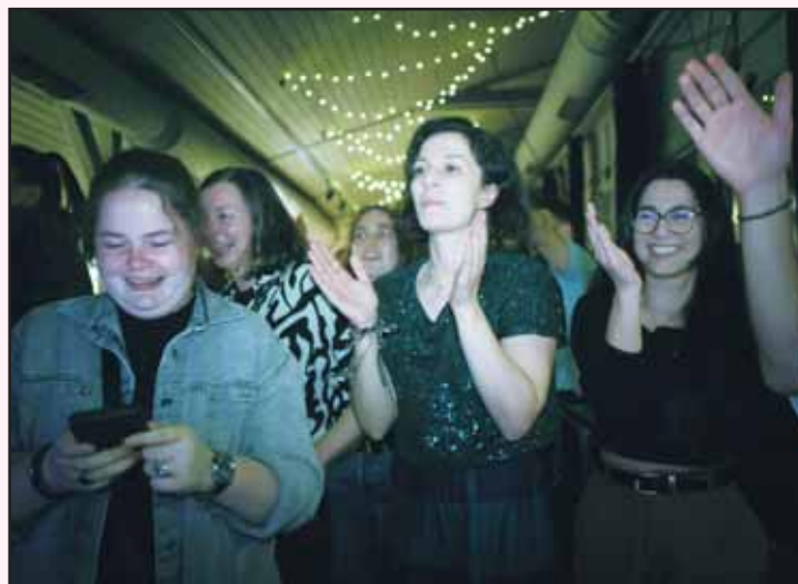
Eurovision fans celebrate the Bulgaria's historic first Eurovision victory with Dara's song 'Bangaranga' in Sofia, Sunday, May 17, 2026.