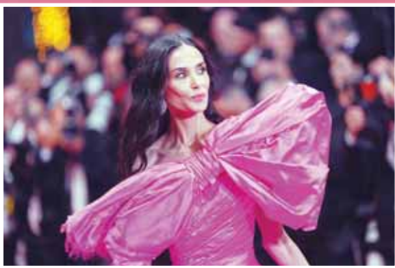
Jury member Demi Moore.