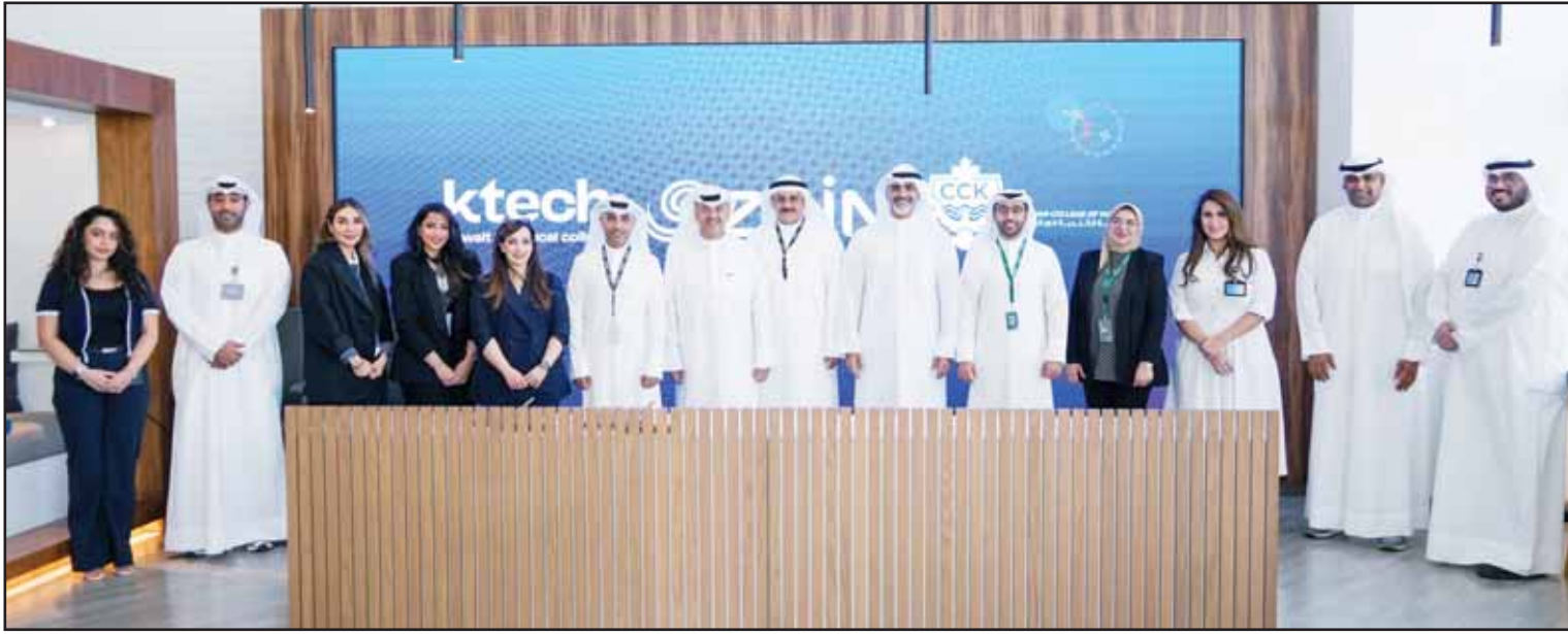
A group photo of officials from Zain, ktech, and CCK.