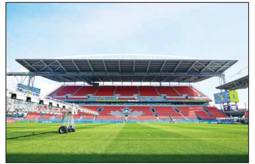
In this file photo, BMO Field is pictured as the City of Toronto and MLSE complete the first phase of upgrades in transforming the space into the 2026 World Cup ready Toronto Stadium in Toronto.

Toronto Stadium is the smallest venue for the 2026 FIFA World Cup. The stadium is where Major League Soccer's Toronto FC and the Canadian Football League's Toronto Argonauts play. The facility underwent a $100 million-plus renovation that added about 17,000 temporary seats. That will bring the capacity to the FIFA minimum of 45,000.