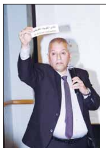
An official picks Kuwait Club during the draw.