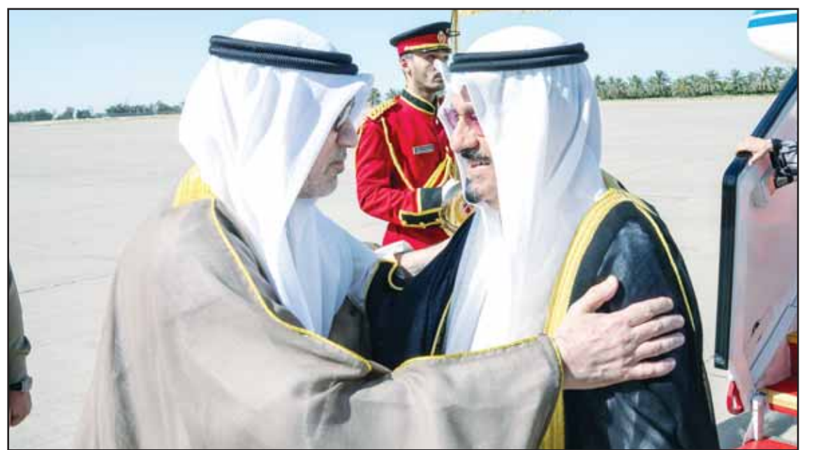
PM Diwan photo