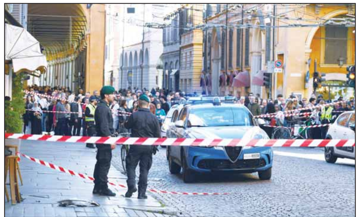
Financial Police patrol a scene after a car incident in a street of Modena, Italy on May 16.

According to Ukraine's estate emergency service, the strikes injured 8 people in Ukraine's central Dnipropetrovsk region: three in the regional capital of Dnipro, four in President Volodymyr Zelenskyy's hometown of Kryvyi Rih, and one in the district of Synelkove.