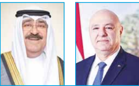
Amir, Lebanese President pledge to promote peace Page 2