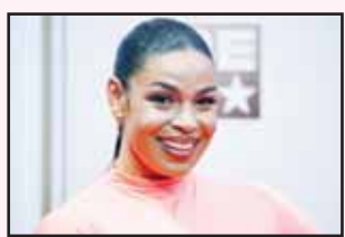
Jordin Sparks arrives at the BET Awards on June 9, 2025, at the Peacock Theater in Los Angeles.