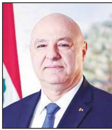
President Joseph Aoun