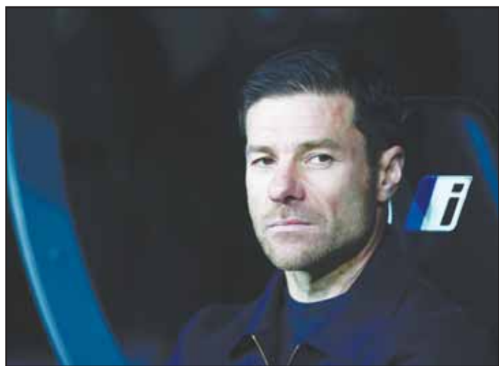
In this file photo, Real Madrid's head coach Xabi Alonso looks on before the Spanish La Liga soccer match between Real Madrid and Real Betis Sevilla in Madrid.

"There is great talent in the squad and huge potential at this football club and it will be my great honor to lead it," he said. "Now the focus is on hard work, building the right culture and winning trophies."