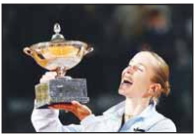
Ukraine's Elina Svitolina kisses the trophy after winning against United States' Coco Gauff at the end of the women's final match at the Italian Open tennis tournament in Rome.