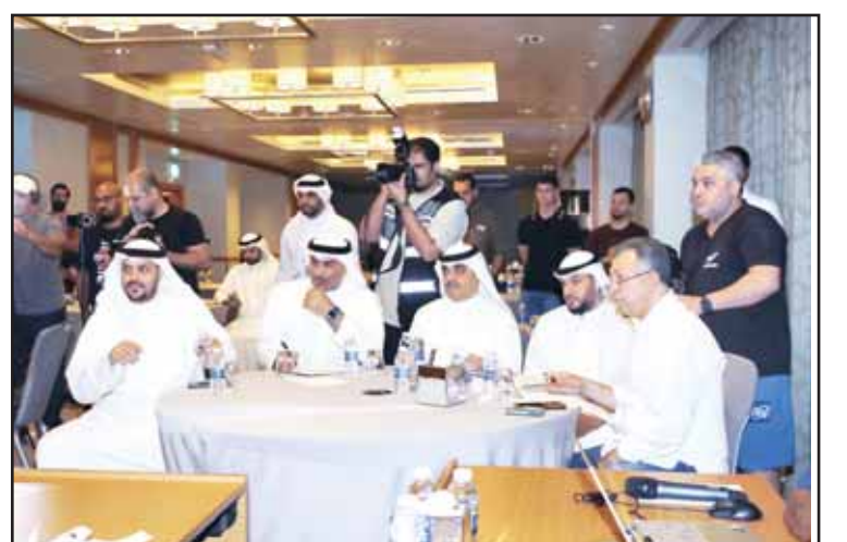
The press closely monitors the proceedings.

features two groups of four teams, with the top teams advancing to the quarterfinals in a crossover knock-