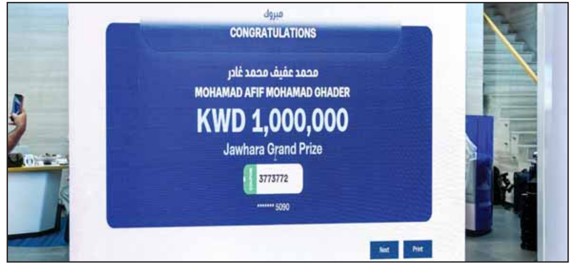
Special Celebration hosted by the Bank's Grand Plaza – The Avenues Branch.

KUWAIT CITY, May 17: In an exceptional event with media and public attendance, National Bank of Kuwait held a special four-hour event last Thursday at its branch in Grand Plaza – The Avenues, during which the names of 14 new winners in the Al Jawhara and Al Jawhara Junior draws were announced.