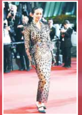
Jury member Chloé Zhao.