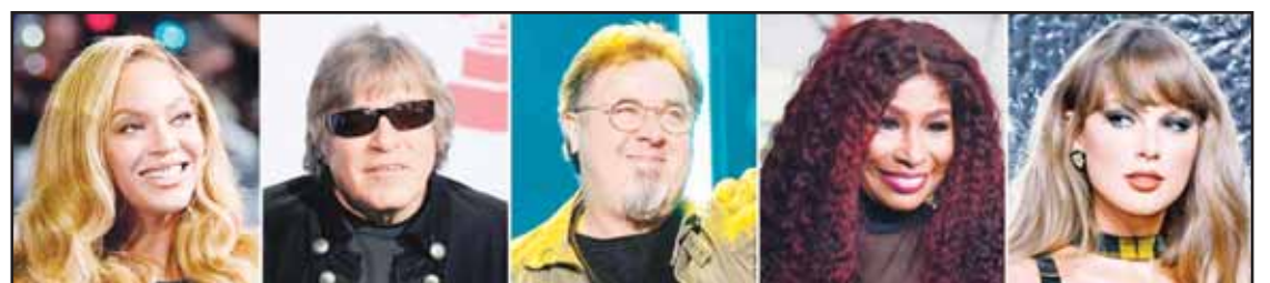
This combination of images show, from left, Beyoncé, Jose Feliciano, Vince Gill, Chaka Khan and Taylor Swift.

Other recordings entering the registry include Ray Charles' groundbreaking country crossover album