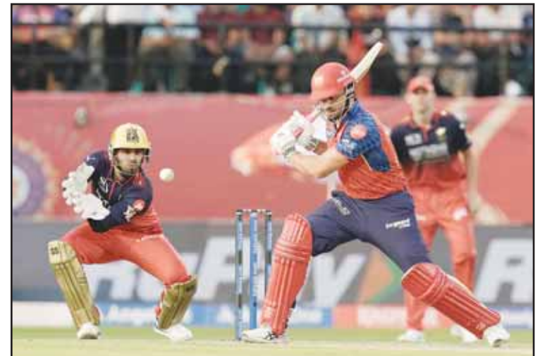
Punjab Kings' Marcus Stoinis plays a shot during the Indian Premier League cricket match between Punjab Kings and Royal Challengers Bengaluru in Dharamshala, India.

Singh (56 off 27) overcame his poor run to score 50 off 22 balls, and Azmatullah Omarzai contributed 14. Both fell in the final over.