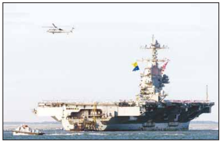
The USS Gerald R. Ford heads toward port at Naval Station Norfolk, as seen from Fort Monroe, Va., on May 16.

Americans shouldn't spend "a single dime" on Trump's "Louis XIV-style ballroom and throw tens of billions more at two lawless agencies," Merkley said.