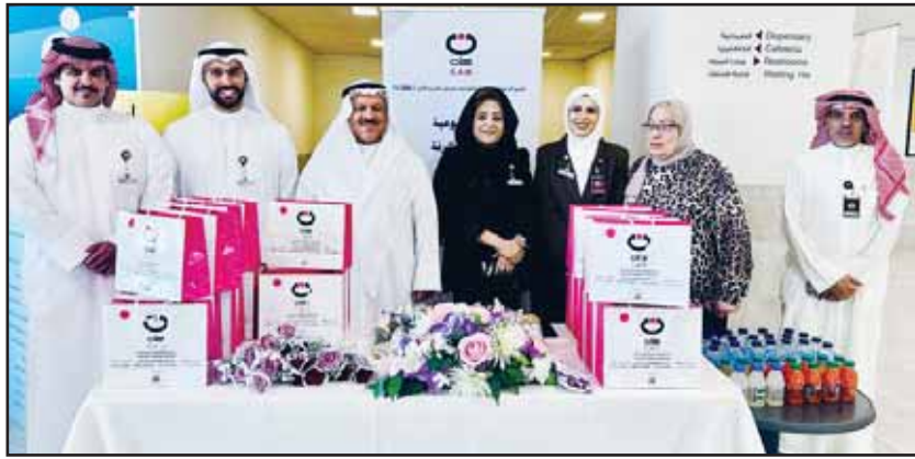
CAN launches annual lung cancer campaign to raise public awareness.