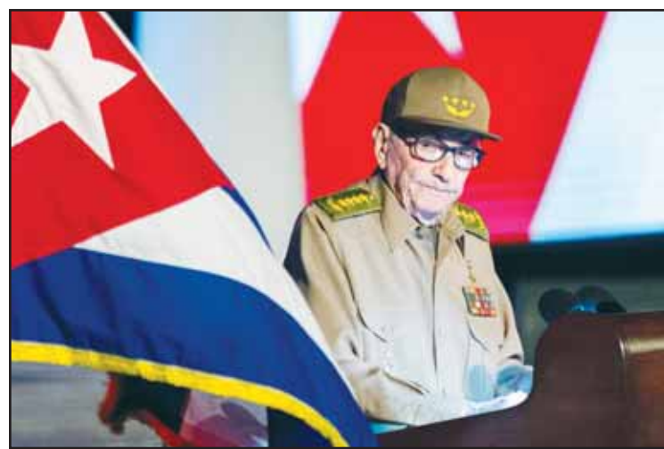
Former Cuban president Raul Castro looks at the Cuban flag during his speech at the event celebrating the 65th anniversary of the triumph of the revolution in Santiago, Cuba, Jan 1, 2024.

The AP reported in March that the US Attorney in Miami had created a special working group of prosecutors and federal law enforcement to build cases against top Cuban of-