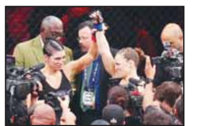
Ronda Rousey, of the United States, right, celebrates after defeating Gina Carano, of the United States, left, in their featherweight mixed martial arts fight Saturday in Inglewood, Calif.

Carano, who hadn't fought in 17 years, was all smiles even after the swift end to one of the longest layoffs in pro sports history. Rousey and Carano hugged and shared warm words after the finish, raising