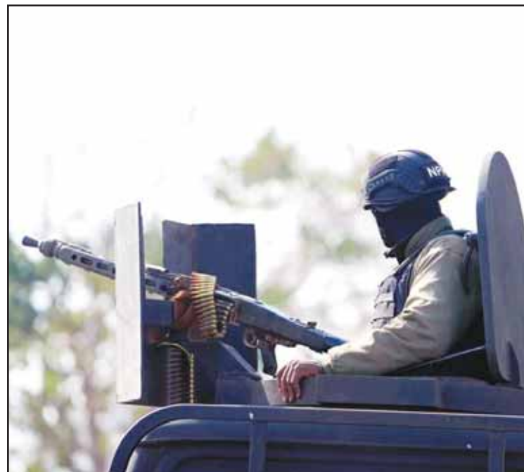
A Nigerian police officer stands guard during an event in Minna, Nigeria on Dec 22, 2025.

Police didn't say if they were searching for more suspects.