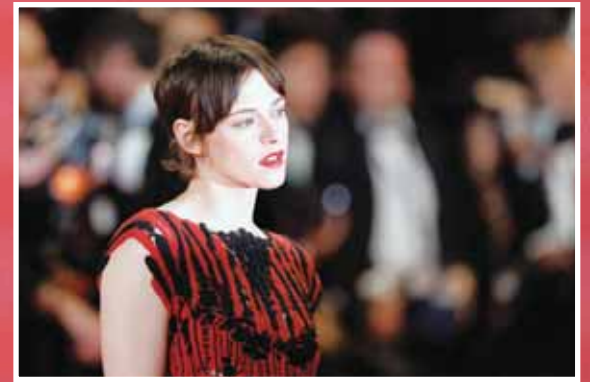
Kristen Stewart.