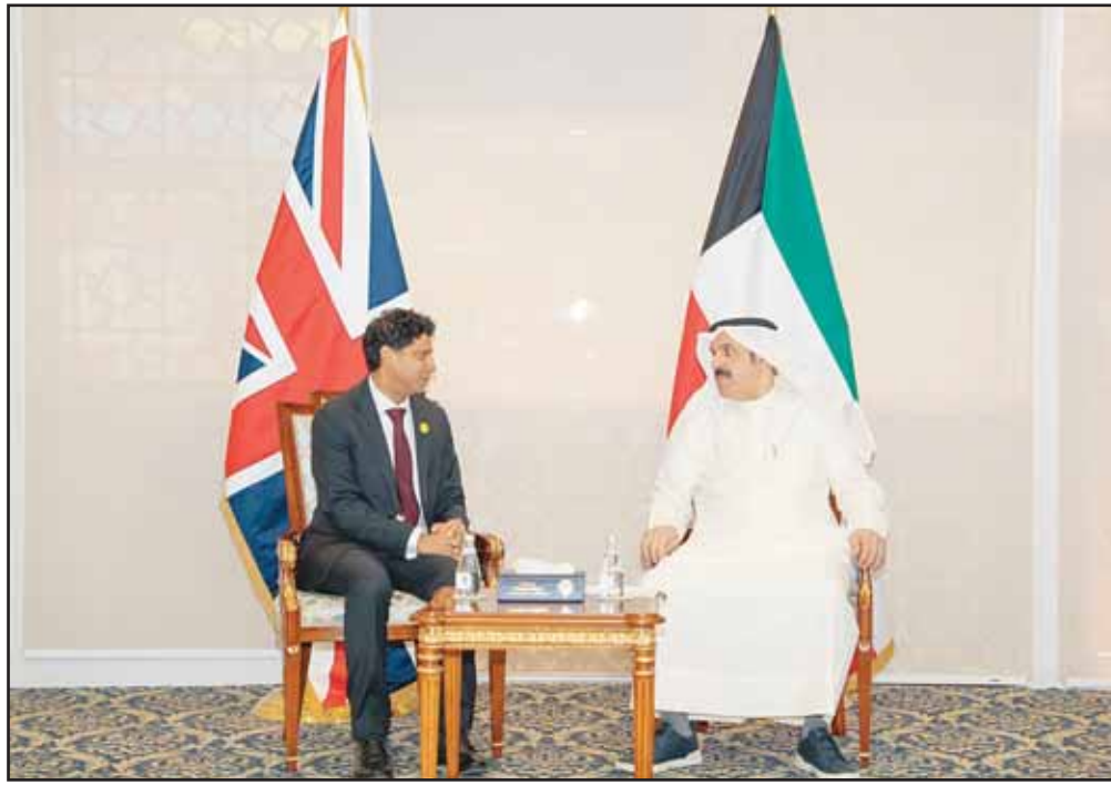
Kuwait, UK reaffirm strong strategic ties.