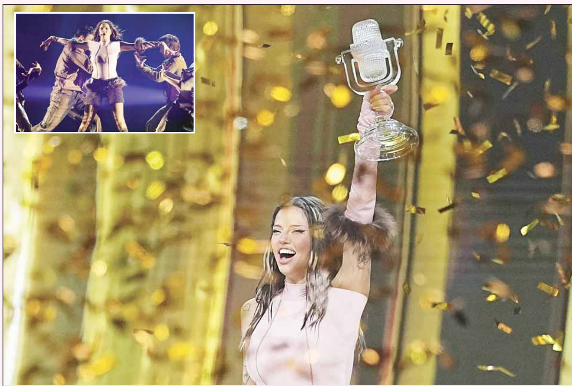
Dara from Bulgaria holds up the trophy after winning the Grand Final of the 70th Eurovision Song Contest in Vienna, Austria, Sunday, May 17, 2026. Inset: Dara from Bulgaria performs the song 'Bangaranga' during the Grand Final of the 70th Eurovision Song Contest in Vienna, Austria, Saturday, May 16, 2026.

ten becomes entangled in politics. The contest has been clouded for a third year by calls for Israel to be excluded over its conflicts in Gaza and elsewhere, with five longtime participants - Spain, the Netherlands, Ireland, Iceland and Slovenia - boycotting in protest.