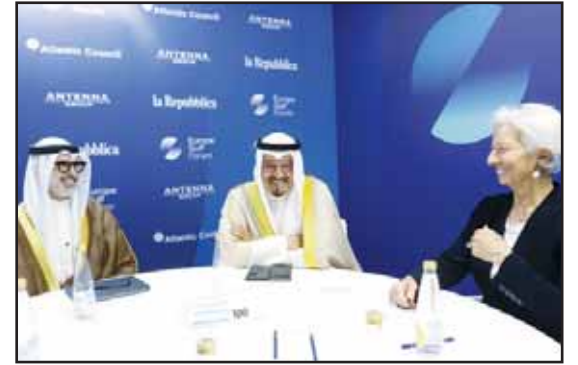
Representative of His Highness the Amir Sheikh Meshal Al-Ahmad Al-Jaber Al-Sabah, His Highness the Prime Minister, Sheikh Ahmad Abdullah Al-Ahmad Al-Sabah meets President of the European Central Bank (ECB) Christine Lagarde.