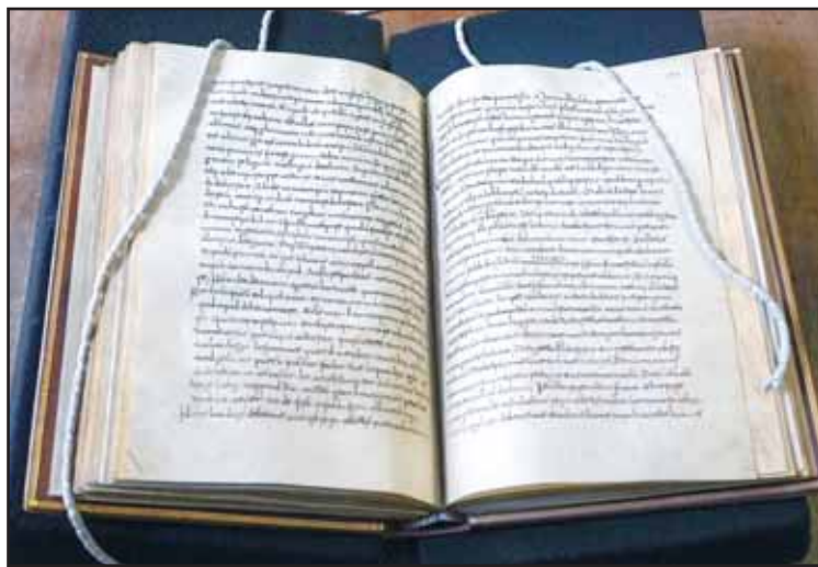
A rare, long-lost copy of Caedmon's Hymn - the first poem ever written down in Old English - is visible in the five lines above the final line of the left page from an 8th-century manuscript copy of the Venerable Bede's Ecclesiastical History of the English People, at Rome's National Library.

The discovery sheds light on the English language's wide diffu-