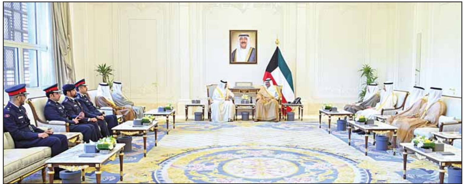
Crown Prince Diwan photo