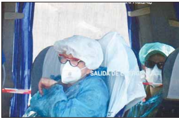
Passengers sit inside a bus after being disembarked from the hantavirus-stricken cruise ship MV Hondius at the port of Granadilla in Tenerife, Canary Islands, Spain, on May 10.

The hantavirus outbreak is "a sentinel event" that speaks to "how well the country is prepared for a disease