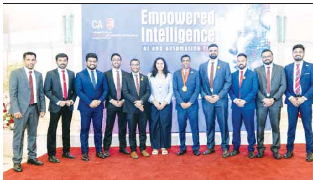
Executive Committee for 2026/27