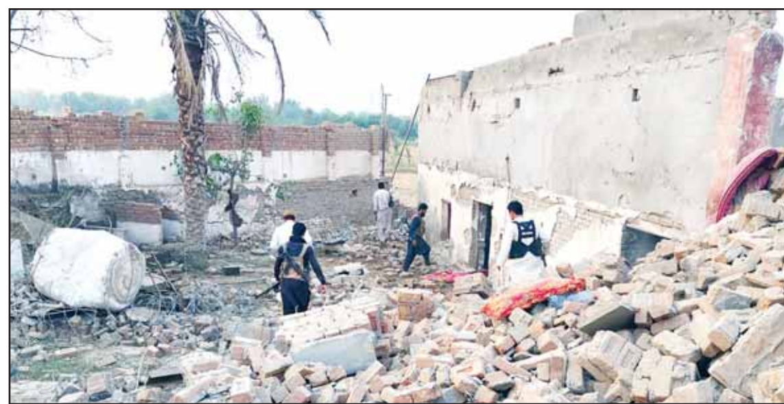
Police officers examine the site of overnight suicide bombing at a security post in Fatah Khel, in Bannu, a district in Pakistan's Khyber Pakhtunkhwa province bordering Afghanistan on May 10.