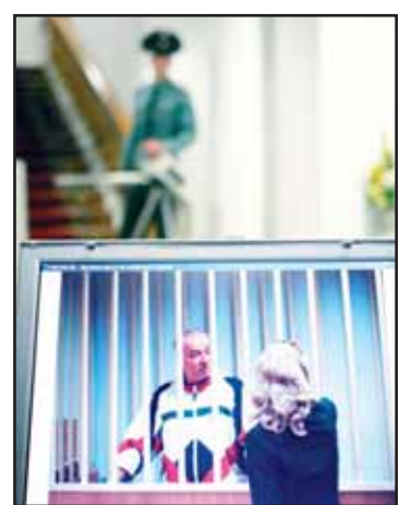
Sergei Skripal, (left), is seen on a screen speaking to his lawyer from behind bars in Moscow on Aug 9, 2006.

been accused of silencing the country's enemies abroad, three Western intelligence officials from different countries told AP that a campaign of targeted killings has ramped up since President Vladimir Putin's 2022 invasion of Ukraine.