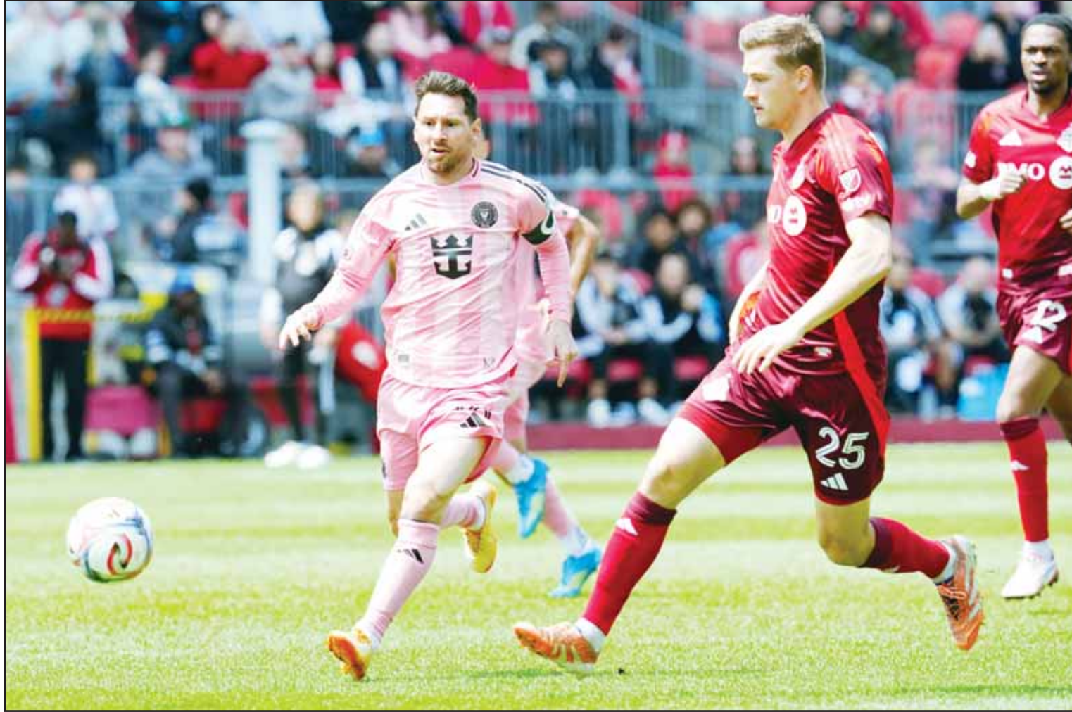
Inter Miami CF midfielder Lionel Messi (10) and Toronto FC defender Walker Zimmerman (25) chase the ball during first half MLS soccer in Toronto.

San Jose & Vancouver share spoils in battle for summit