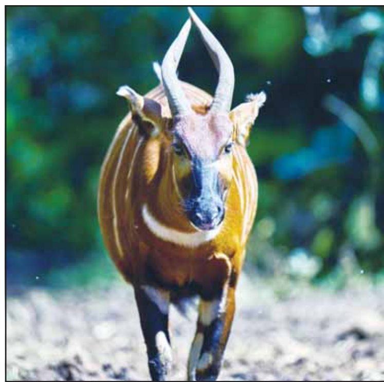
A solitary critically endangered mountain bongo emerges from the forested landscape of Mount Kenya, Africa's second-highest mountain, in Nanyuki, Laikipia County, Kenya on May 8.

When the future of plants is unstable, "it can also affect human food security and access to basic materials," Scherson and Luebert wrote in a review of the two studies. "Maintaining the current conditions that support human life requires urgent action."