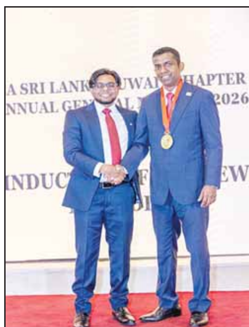
Induction of the New President

CA Sri Lanka, the parent body of the Chapter is the apex body of accounting in Sri Lanka, providing continuous professional development for the accounting and finance professions. Members of CA Sri Lanka are globally recognized as a distinctive and versatile cadre of professionals, equipped to guide organizations across diverse industries toward sustained success. To date, CA Sri Lanka has produced over 8,000 members, distinguished by their professional integrity, strong technical and analytical expertise, financial discipline, and innovative thinking, qualities that enable them to consistently add strategic value to their organizations.