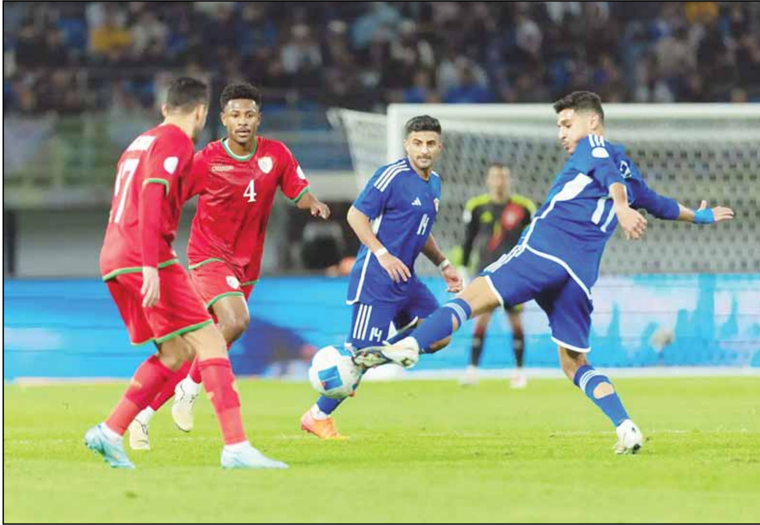
A file photo of Kuwait and Oman players battling for the ball.