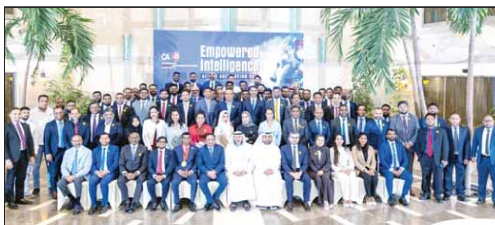
CA Sri Lanka Kuwait Chapter AGM 2026