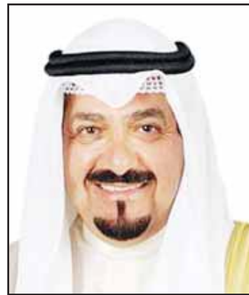
His Highness the Prime Minister Sheikh Ahmad Abdullah Al-Ahmad Al-Sabah

mad Al-Sabah. His Highness the Crown Prince also received First Deputy Prime