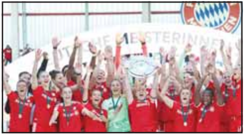
Bayern Munich players celebrate after winning the German women's soccer championship after the Bundesliga match between Bayern Munich and Eintracht Frankfurt in Munich, Germany.