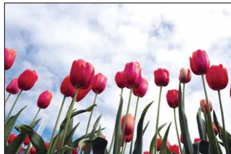
Tulips stand at the Wooden Shoe Tulip Farm in Woodburn, Ore on April 11.