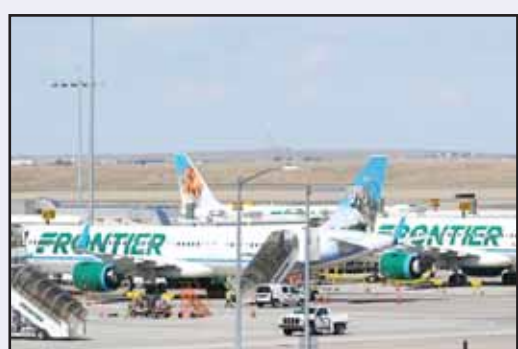
Frontier Airlines jetliners sit on the tarmac outside the concourse of Denver International Airport Saturday on May 9, in Denver.

The plane, on route from Denver to Los Angeles International Airport, "reported striking a pedestrian during takeoff at DEN at approximately 11:19 p.m. on Friday," according to a post on the airport's official X account.