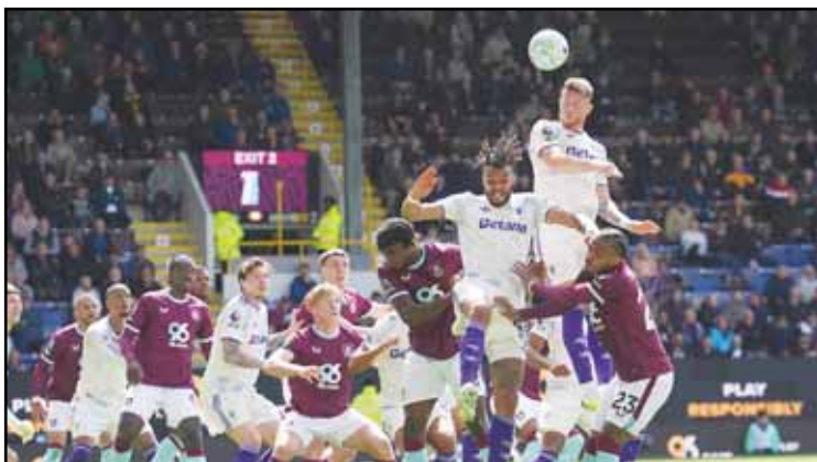
Aston Villa's Ross Barkley, top, heads the ball during the English Premier League soccer match between Burnley and Aston Villa in Burnley, England.