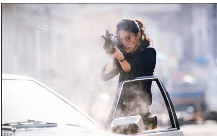
This image released by Neon shows Hoyeon in a scene from 'Hope.'

Though not initially announced as part of the festival competition slate, James Gray's latest Queens-set drama was subsequently added. And it instantly became one of the