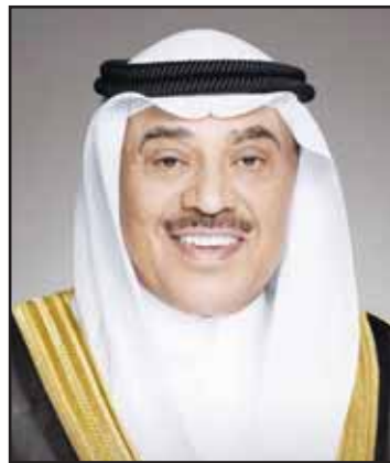
His Highness the Crown Prince Sheikh Sabah Khaled Al-Hamad Al-Sabah