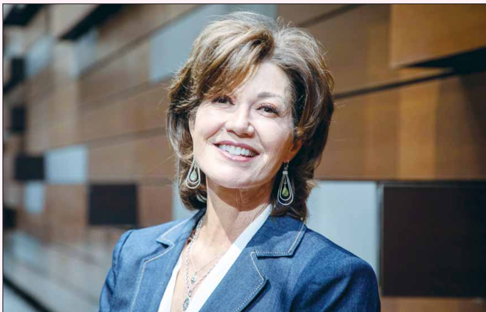
Singer Amy Grant poses for a portrait in New York on Thursday, April 16, 2026.