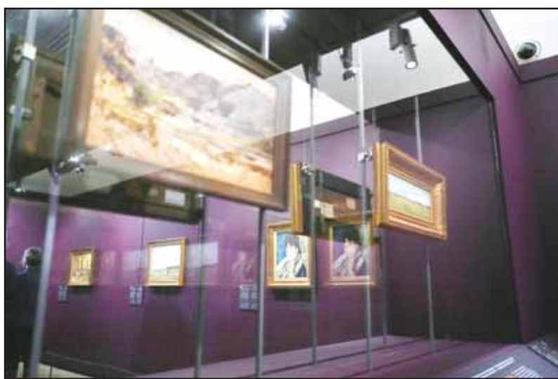
French painter Pierre-Auguste Renoir's painting titled Madame Alphonse Daudet, center, is on exhibit in the Musée d'Orsay museum's new permanent gallery dedicated to so-called MNR artworks, pieces recovered after World War II whose ownership remains uncertain, in Paris, Monday.

Starting in the late 1960s, documentaries and historians began naming what France had done under the Vichy government that cooperated with the Nazis, including helping to send 80,000 Jews from France to their deaths and presiding over a Paris art market that grew rich on the