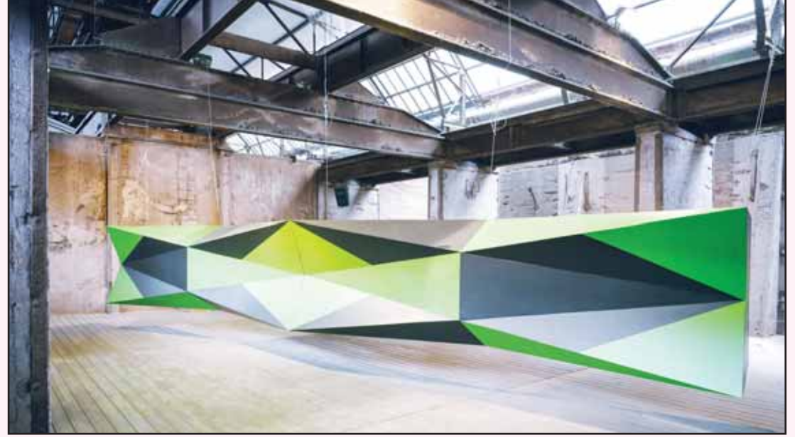
The installation 'One Beam' by artist Boris Tellegen, is on display at the former ironworks Voelklinger Huette, World Cultural Heritage Site, as part of the exhibition Urban Art Biennale 2026 in Voelklingen, Germany.

sive green-and-black wooden sculpture that lights up the interior of the ironworks. French-based collective Vortex-X, who recycle salvaged material, stretched rays of white industrial fabric across one of the building's halls in a work titled "Memory in transit."