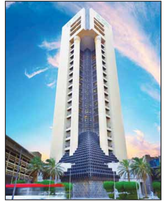
KFH head office

This achievement is underpinned by the strength of KFH's business model and its ability to deliver sustained growth, recording the highest net profit in Kuwait's banking sector. It reflects the bank's excellence in embracing technology and digital transformation across its banking and operational functions, while embedding sustainability at the core of its operations. KFH's ongoing commitment to advancing its banking services has broadened its customer base, kept pace with evolving customer expectations, and reinforced their trust, all while driving greater synergy across the Group's operations spanning approximately 10 countries and a network of over 600 branches worldwide.