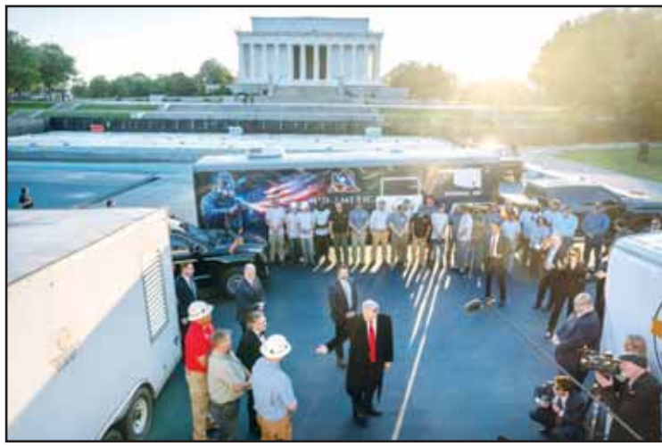
US President Donald Trump talks as he visits the Lincoln Memorial Reflecting Pool to see the new blue protective coating being applied as part of a renovation project, on May 7 in Washington.

Trump is guaranteeing himself a lasting imprint on a city where he won just 6.5% of the vote in 2024. He is flexing extraordinary executive power and offering fresh insight into how he spends his time, perhaps a president's most valuable asset.