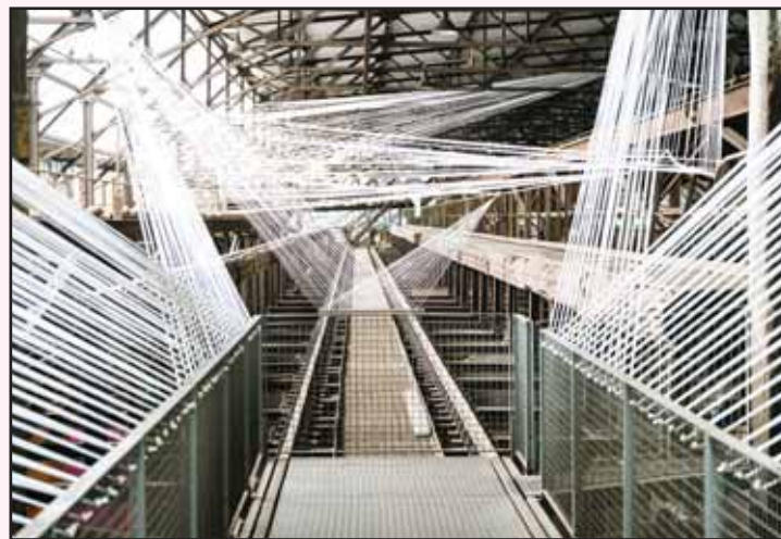
The installation 'Transit der Erinnerung,' Transit of Memory, by artist Vortex-X is on display at the former ironworks Voelklinger Huette, World Cultural Heritage Site, as part of the exhibition Urban Art Biennale 2026 in Voelklingen, Germany. (AP)

The ironworks spreads over a 6-hectare (nearly 15-acre) site, a maze of chimneys and furnaces in which visitors still encounter ominous industrial-era signs warning of risks such as a "danger of crushing." They dominate the town of Völklingen, near Germany's border with France.