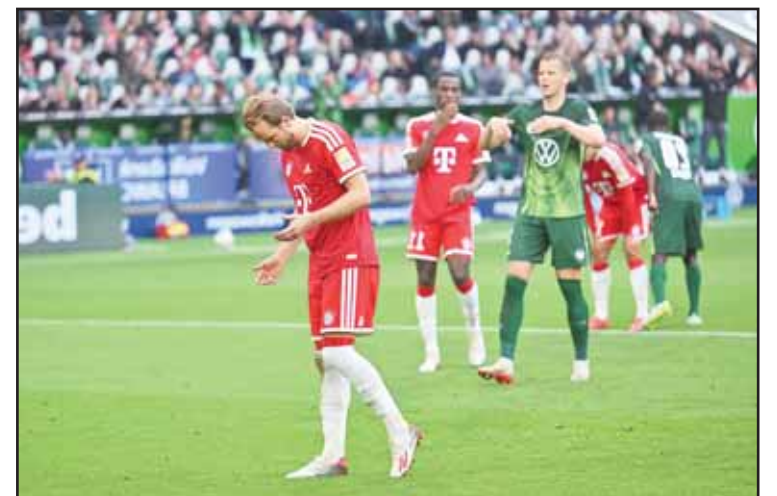
Bayern Munich's Harry Kane reacts after missing a penalty during a Bundesliga soccer match between Wolfsburg and Bayern Munich, in Wolfsburg, Germany.

Bayern holds off Wolfsburg as Kane's miss ends penalty run