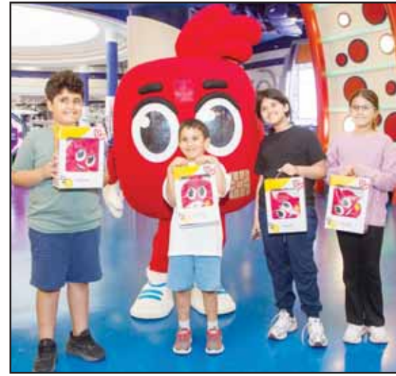
Children enjoying the event with the neo account mascot.