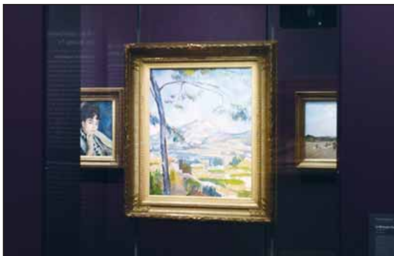
French painter Pierre-Auguste Renoir's painting, 'Madame Alphonse Daudet,' left, is seen at the Musée d'Orsay museum's new permanent gallery dedicated to artworks recovered after World War II whose ownership remains uncertain, in Paris on Monday, May 4, 2026.