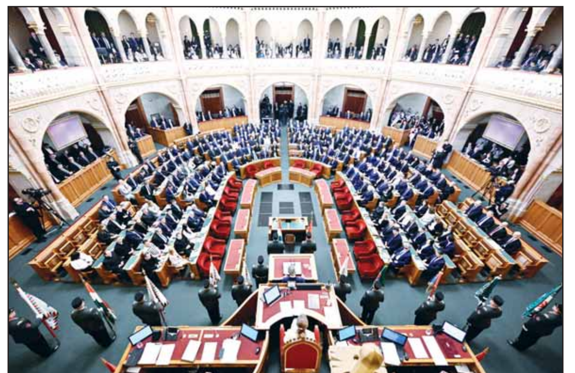
Hungary's new Prime Minister Peter Magyar delivers a speech after the inaugural session in Budapest, Hungary, Saturday, May 9, 2026.

The AP spoke to three of the people targeted: Osechkin; Lithuanian activist Valdas Bartkevicius; and Ruslan Gabbasov, who advocates for independence for the Russian region of Bashkortostan.