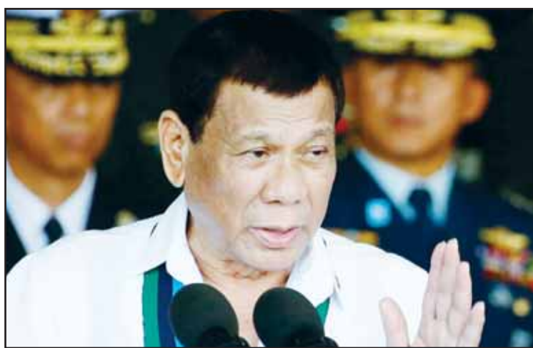
Philippine President Rodrigo Duterte addresses the troops during the 82nd anniversary celebration of the Armed Forces of the Philippines in suburban Quezon City northeast of Manila, Philippines on Dec 20, 2017.

officials have denied authorizing the killings of drug suspects, who, they said, were shot dead after allegedly threatening law enforcers. Duterte openly and repeatedly threatened drug suspects with death while in office.