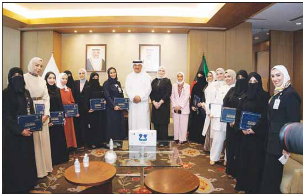
Minister of Education Sayed Jalal Al-Tabtabai during his honoring of the winners of the top prizes in the 'A Child Reads' initiative, part of the Arab Reading Challenge.

He went on to acknowledge the efforts of nursery teachers and their role towards "instilling" a culture of reading and knowledge in young children, hailing the scope of participation that the contest had garnered, in addition to the diverse categories it featured to support early childhood learning.