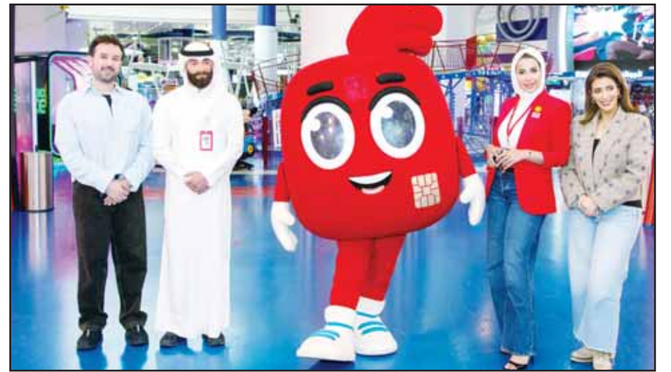
Group photo of the Gulf Bank team.

KUWAIT CITY, May 10: As part of its ongoing efforts to reward its customers and promote financial awareness among younger generations, Gulf Bank organized a special entertainment day for children who are neo account customers, in collaboration with Funtiki, one of the largest entertainment centers in Kuwait.