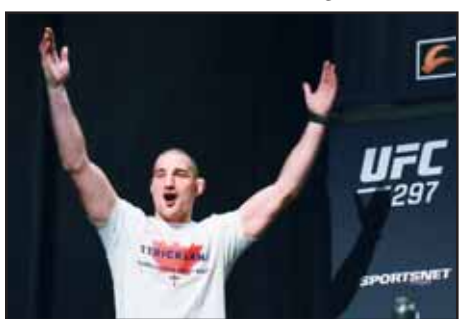
In this file photo, Sean Strickland, UFC middleweight champion, arrives on stage to face off with Dricus Du Plessis during a mixed martial arts news conference ahead of UFC 297 in Toronto.

Van dominated with elite boxing and won via