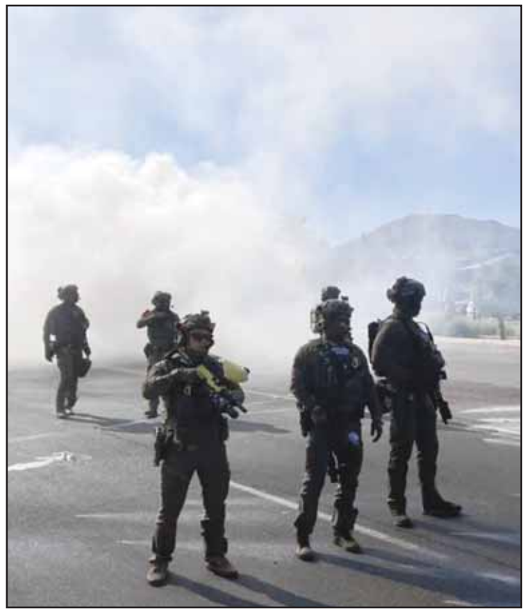
Federal agents block Grande Avenue on Dec 5, 2025, in Tucson, Ariz.

White House spokeswoman Taylor Rogers said Trump is "laser-focused on lowering costs for working families, deporting illegal criminals, keeping our cities safe, beautifying our nation's capital, and protecting our national security by ensuring Iran can never possess a nuclear weapon all at the same time."