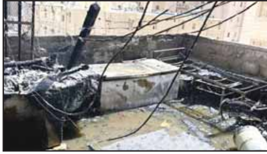
Damage caused by the fire on the roof of the building.

Furthermore, the decree promotes 17 members of the Court of Cassation effective and 13 members of the Public Prosecution to the ranks of Chief Prosecutor (Grades A and B), effective March 31, 2026.