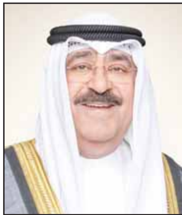
His Highness the Amir Sheikh Meshal Al-Ahmad Al-Jaber Al-Sabah

His Highness the Crown Prince Sheikh Sabah Khaled Al-Hamad Al-Sabah received on Sunday His Highness the Prime Minister Sheikh Ahmad Abdullah Al-Ah-