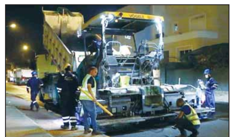
Major road maintenance work continues in Mubarak Al-Kabeer Governorate as part of the development plan.