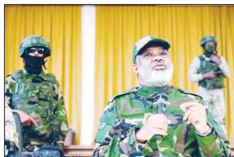
Rebel leader of group of Alliance Fleuve Congo (AFC) including M23, Corneille Nangaa, addresses a news conference in Goma, Democratic Republic of the Congo on Jan 30, 2025.

At the time, US President Donald Trump praised the leaders of the two nations - Presidents Felix Tshisekedi of Congo and Paul Kagame