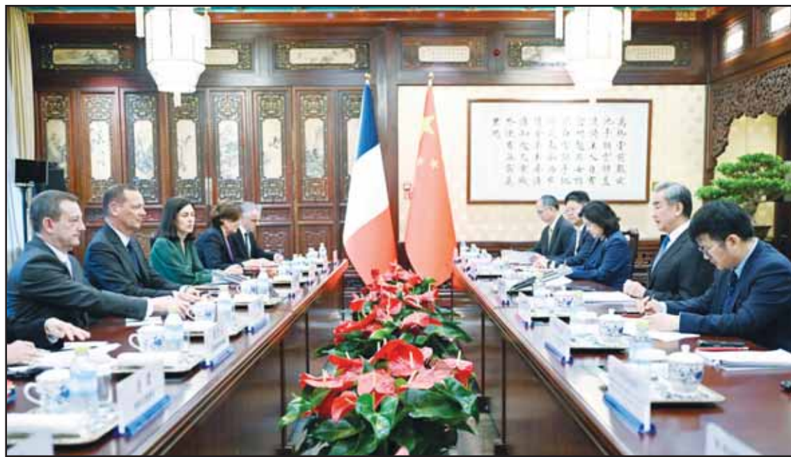
Wang Yi, a member of the Political Bureau of the Communist Party of China Central Committee and director of the Office of the Central Commission for Foreign Affairs, holds talks with Emmanuel Bonne, diplomatic adviser to the French president, in Beijing, capital of China on May 8.

Police arrived at the scene promptly after receiving report of the accident and have helped send the injured to the hospital. The driver has been cleared of drunk driving, and the accident is under further investigation.