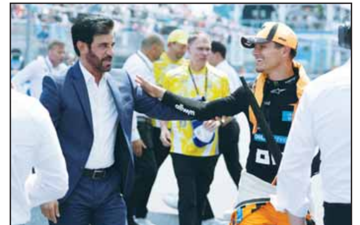
FIA president Mohammed Ben Sulayem, left, greets McLaren driver Lando Norris before a sprint auto race at the Miami Formula One Grand Prix in Miami Gardens, Fla.

The F1 world has long appealed to automakers by promising innovation relevant to their road cars but now the FIA seems less keen for F1 cars to resemble daily drivers. The boom in F1's popularity around the world over the last decade could give it more leverage.