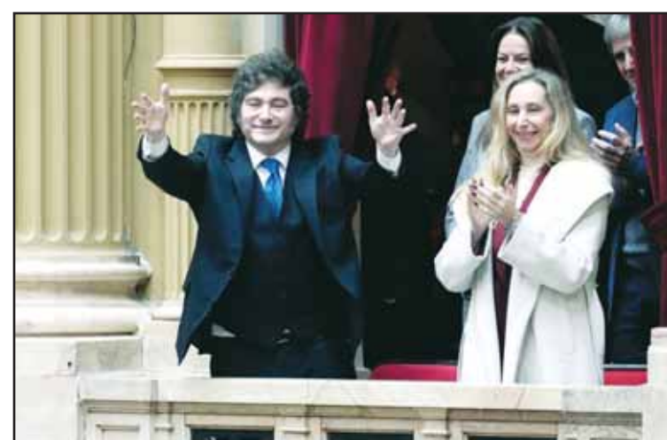
Argentina's President Javier Milei, (left), and his sister, General Secretary of the Presidency Karina Milei, arrive to Congress to attend a session in which Chief of Staff Manuel Adorni will present his report to the Chamber of Deputies in Buenos Aires, Argentina on April 29.

Last month's closure of the press room used for decades by reporters with credentials to cover the president added to a list of attacks and reprisals against news organizations by Milei, whose hostility toward the press mirrors the aggressive approach of his ally and powerful