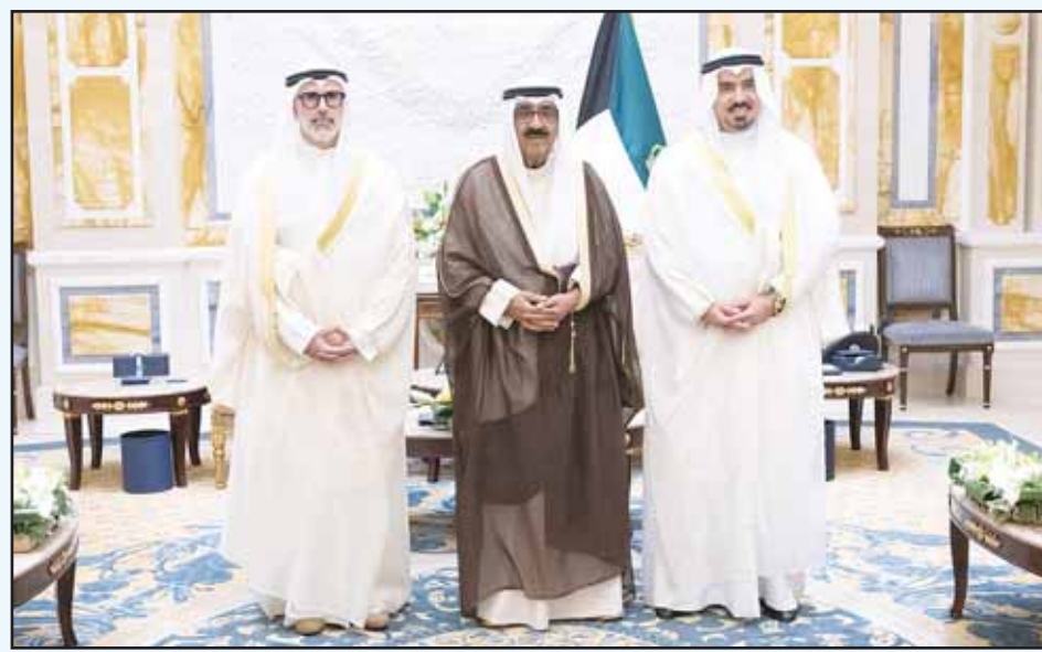
HH the Amir poses with the Minister of Foreign Affairs and the newly appointed Ambassador of Kuwait to the Czech Republic.