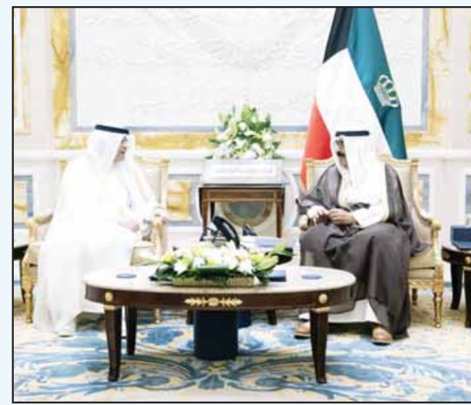
HH the Amir receives GCC Secretary General.

The ambassador took the constitutional oath before His Highness on the occasion of assuming his new post.