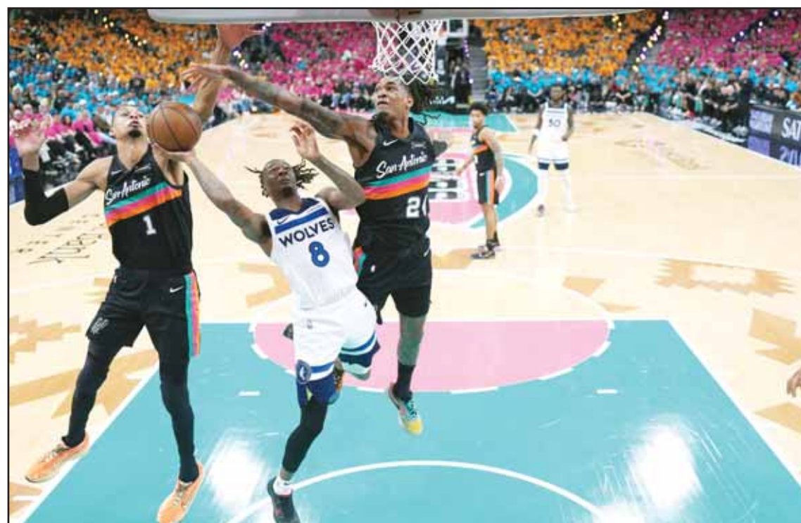
Minnesota Timberwolves guard Bones Hyland (8) shoots while defended by San Antonio Spurs forward Victor Wembanyama (1) and guard Devin Vassell (24) during the second half in Game 1 of a second-round NBA playoffs basketball series in San Antonio. (AP)