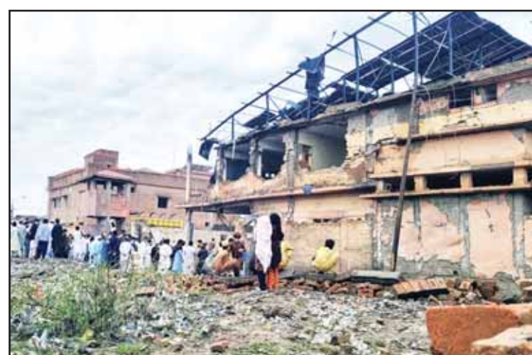
Local residents look at a damaged area of a police station after an overnight deadly bombing in the Bannu district of northwestern Pakistan on April 3.

It said Bajaur attacks "exposed the Afghan regime's reckless and shameful actions." The ministry also argued that images circulated with the latest Afghan claim show