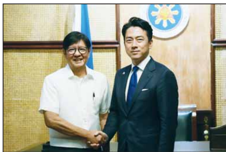
Philippine President Ferdinand Marcos Jr (left), greets Japan's Defense Minister Shinjiro Koizumi at the Malacanang presidential palace in Manila, Philippines on May 5.

Japan has bolstered its offensive capability with long-range missiles to attack enemy targets from a dis-