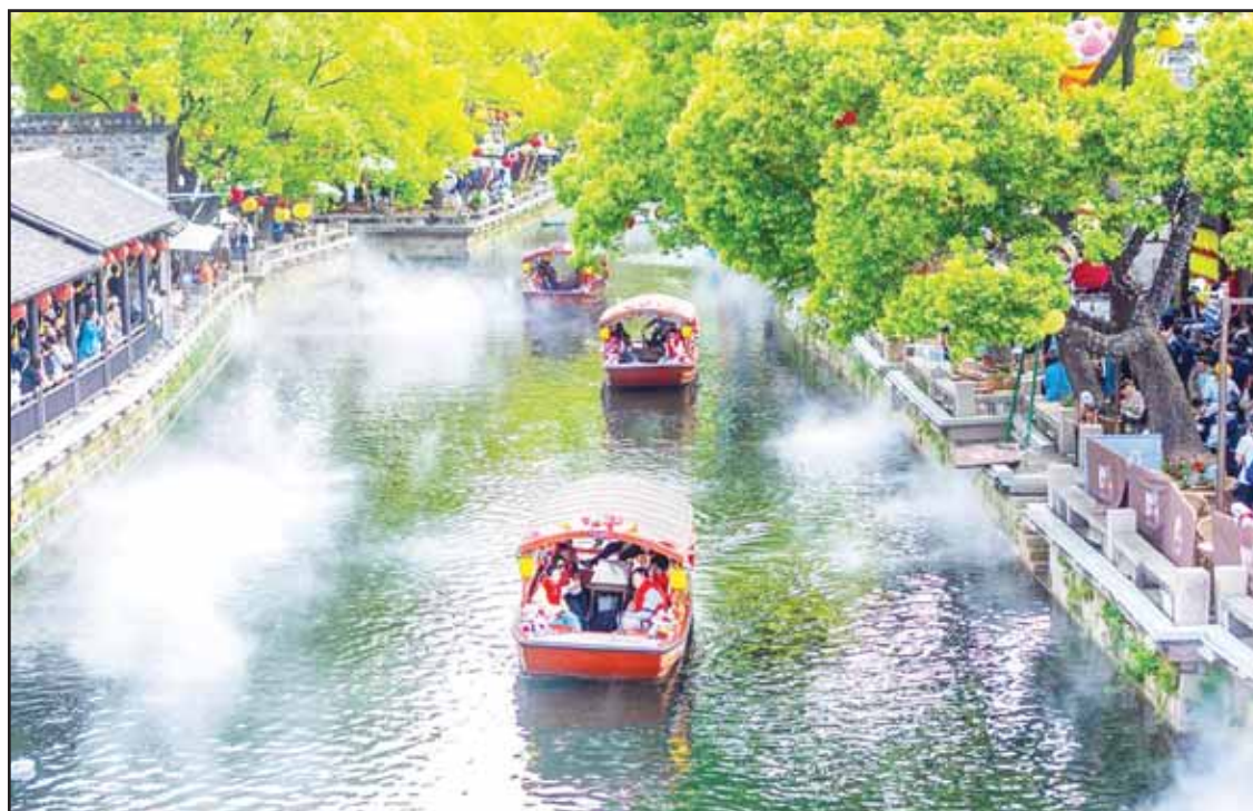
This drone photo shows tourists visiting Huishan ancient town in Wuxi City, east China's Jiangsu Province May 3, 2026.