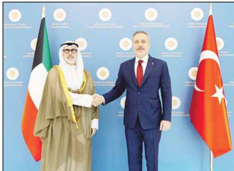
Kuwait's Foreign Minister Sheikh Jarrah Jaber Al-Ahmad Al-Sabah with Turkish Foreign Minister Hakan Fidan.

KUWAIT CITY, May 5, (KUNA): Kuwait's Foreign Minister Sheikh Jarrah Jaber Al-Ahmad Al-Sabah met Monday with Turkish Foreign Minister Hakan Fidan during his official visit to the Turkish capital, the Ministry of Foreign Affairs said.