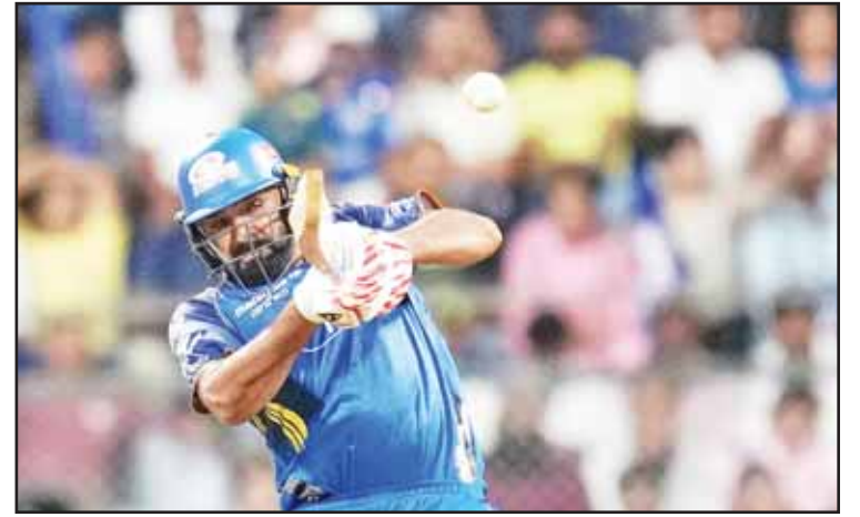
Mumbai Indians' Rohit Sharma plays a shot during the Indian Premier League cricket match between Mumbai Indians and Lucknow Super Giants in Mumbai, India.

Mumbai stayed in ninth place while Lucknow remained 10th and last.