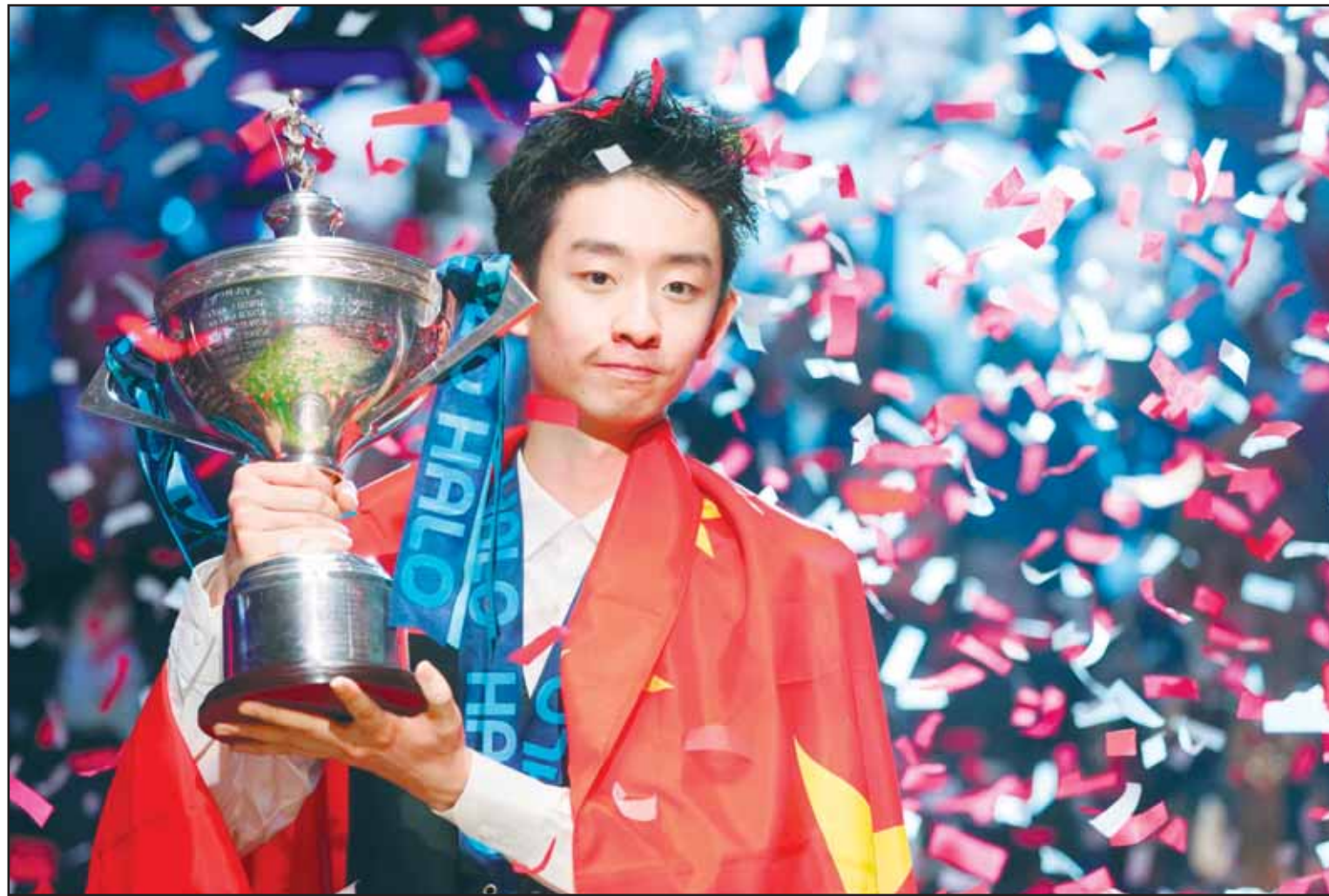
China's Wu Yize poses for the media with the trophy and wearing the Chinese national flag, after winning the World Snooker Championship defeating England's Shaun Murphy in Sheffield, England.