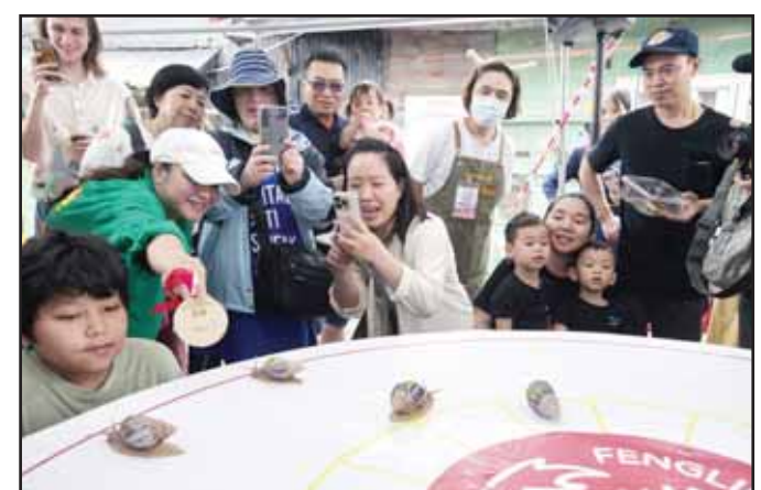
People cheer during a snail race in Fenglin town, Hualien County, eastern Taiwan, Saturday, May 2, 2026.

Once the race started, it and nine other snails were placed near the center of a round table covered with a thin vinyl sheet. The first to reach the edge of the table was crowned the winner.