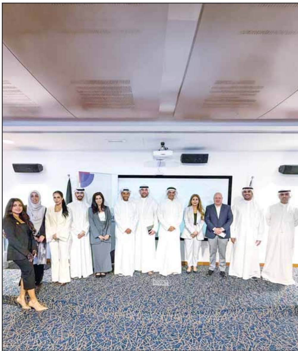
Markaz delivers joint seminar on MREF with InvestGB.