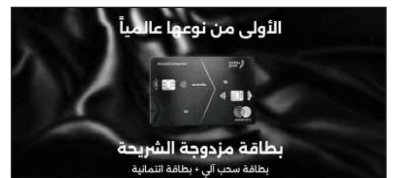
Dual Chip Contactless World Elite Mastercard

In contrast, the Main 50 Index recorded gains, rising 13.20 points, or 0.14 percent, to 9,413.23 points. The index saw 300.2 million shares traded through 14,206 transactions, with a total value of KD 41.5 million (approximately USD 135.6 million).