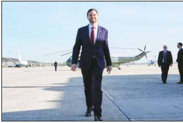
US Vice President JD Vance walks with the Press before boarding Air Force Two on April 10, at Joint Base Andrews, Md., for expected departure to Pakistan, for talks on Iran.