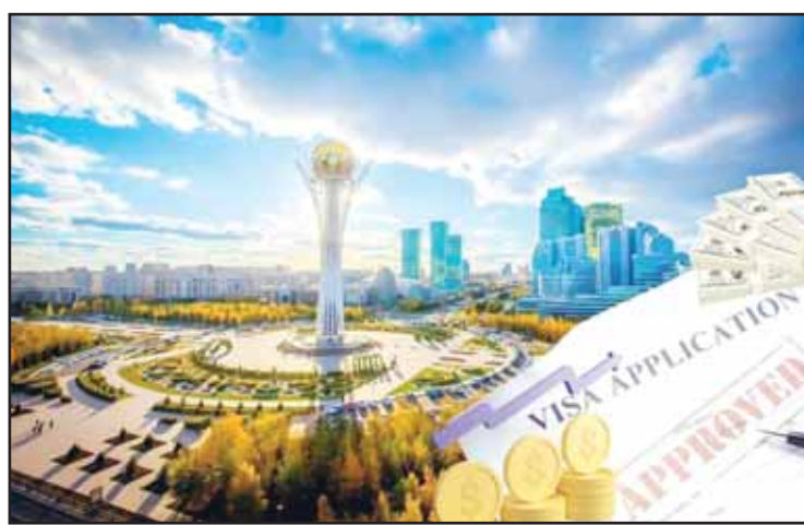
Astana skyline blends modern architecture with open green spaces, showcasing Kazakhstan's dynamic growth and urban vision.

■ Creation of the QazETA unified digital platform for foreign nationals ■ Introduction of an e-Residency module allowing remote applications ■ A "one-stop-shop" system for immigration processing ■ Reduced bureaucracy and faster onboarding for foreign residents