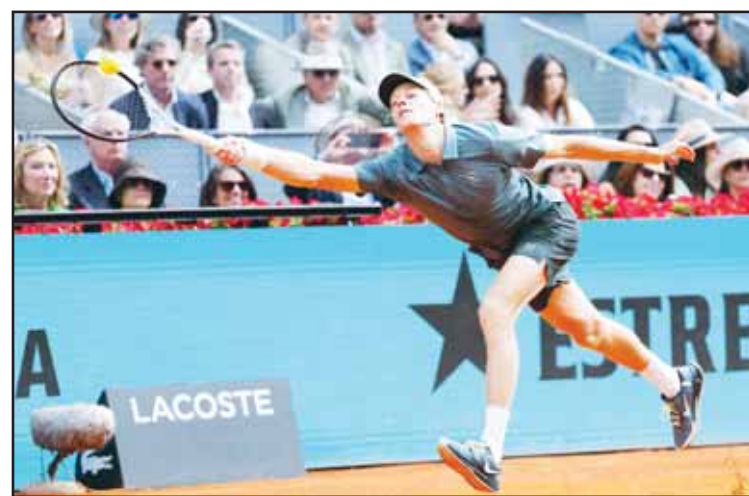
Jannik Sinner, of Italy, returns the ball to Alexander Zverev, of Germany, during their men's singles tennis final match at the Madrid Open tennis tournament in Madrid, Spain.