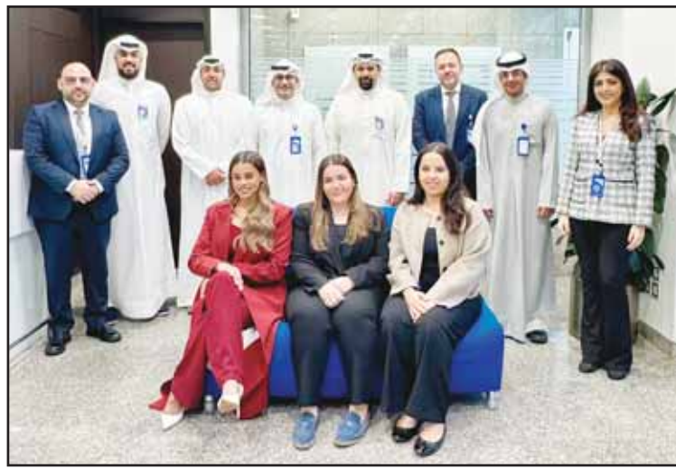
Abdullah Al-Salem Branch Team