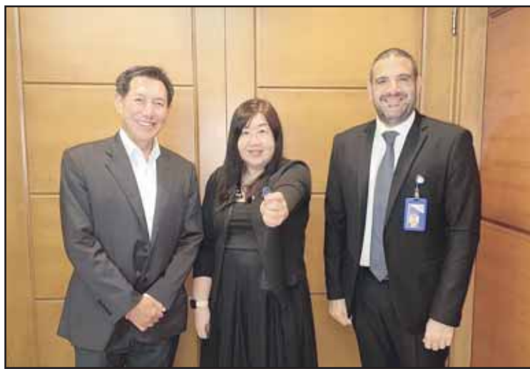
Recognition of one of the outstanding employees at the National Bank of Kuwait branch in Singapore.

Additionally, "I am NBK" embodies the deeply rooted values upon which the Bank is founded. Its role extends beyond simply recognizing