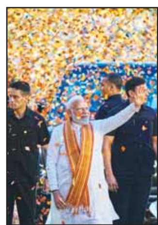
Confetti is sprayed as Indian Prime Minister Narendra Modi, (center), arrives at the Bharatiya Janata Party (BJP) headquarters to celebrate victory in the recently held state assembly elections in New Delhi, India on May 4.

Opposition parties have sharply criticized the polls in West Bengal after the Election Commission removed millions of voters from electoral rolls. Governments were ousted in two other states and Modi's party retained power in another that held elections in April.