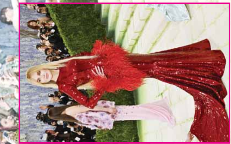
Nicole Kidman.

Met Gala guests from Beyoncé and Naomi Osaka to Emma Chamberlain did not play it safe this year for the Met Gala, delivering custom works of art in honor of the dress code "Fashion is art."