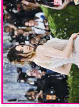
Eileen Gu.

While her "The Devil Wears Prada 2" castmates kept it classic in black, Anne Hathaway made a statement in her custom Michael Kors Grecian-inspired strapless dress, which was hand-painted with a dove of peace.