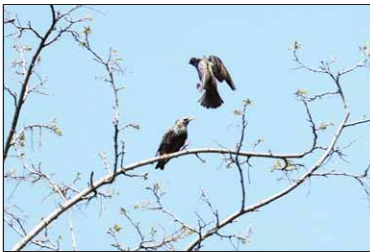
Common starlings are seen on a tree in a small forest dubbed the Nightingale's Forest near the village of Plandiste, in the flat, farming region of Serbia on April 16.

Authorities have pledged to boost environmental care as part of the country's European Union membership bid, but protection