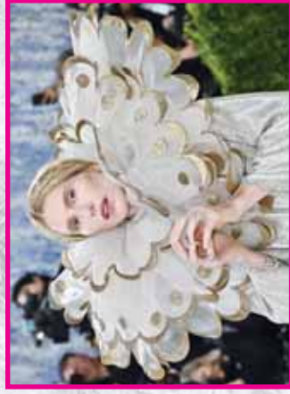
Dree Hemingway.

"She is the goddess of peace," Kors told Vogue.