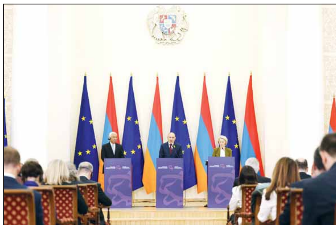
From left: European Council President Antonio Costa, Armenia's Prime Minister Nikol Pashinyan and European Commission President Ursula von der Leyen participate in a media conference during the EU-Armenia summit at the Presidential Palace in Yerevan, Armenia on May 5.

Russian forces fired 11 Iskander-M ballistic missiles and 164 strike drones at Ukraine overnight from Monday to Tuesday, including a jet-powered Shahed drone variant, the Ukrainian Air Force said.