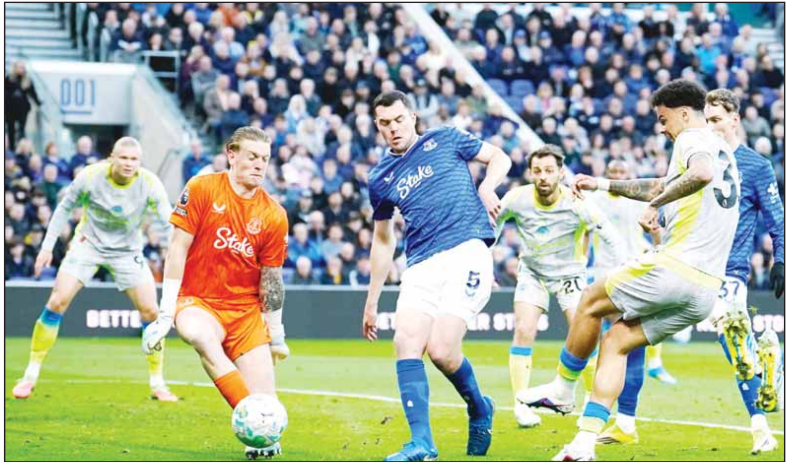
Everton's goalkeeper Jordan Pickford saves shot by Manchester City's Ruben Dias during the Premier League soccer match between Manchester City and Everton in Liverpool, England.

"But at halftime we'd have taken this result because we were hugely outplayed in the first half. Getting a point against Manchester City's not a bad result but when you're 3-1