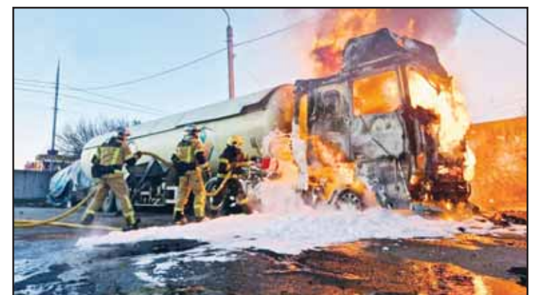
In this photo, provided by the Ukrainian Emergency Service, emergency services personnel work to extinguish a fire at a vehicle following a Russian drone attack in Kyiv region, Ukraine on May 5. (AP)

The truce proposal follows a familiar pattern of Russia declaring short unilateral ceasefires during the war timed to various holidays - most recently Orthodox Easter - that don't produce any tangible results amid deep mistrust between Moscow and Kyiv more than four years after Russia launched an all-out invasion of its