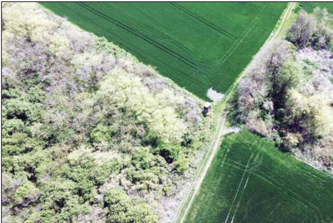
A small forest dubbed the Nightingale's Forest is seen near the village of Plandiste, in the flat, farming region of Serbia on April 16.