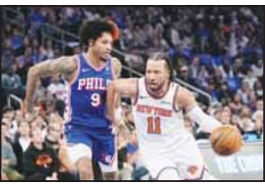
New York Knicks' Jalen Brunson, right, drives past Philadelphia 76ers' Kelly Oubre Jr. during the first half of Game 1 in a second-round NBA basketball playoffs series in New York. - See Page 15