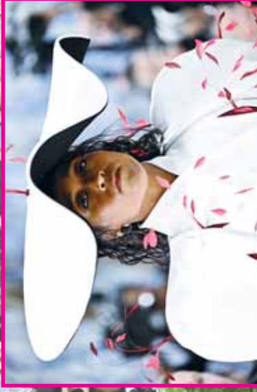
Naomi Osaka.

In typical fashion, singer and fashion powerhouse Rihanna shut down the carpet as the final guest to arrive, much earlier than in years past. Dressed in a metallic jewel-encrusted cocoon-like dress, Rihanna emerged onto the carpet with her partner ASAP Rocky. "I feel like a pearl out of an oyster," Rihanna said to reporters on the carpet.