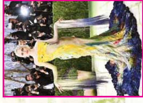
Emma Chamberlain.