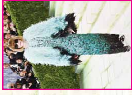
Anna Wintour.