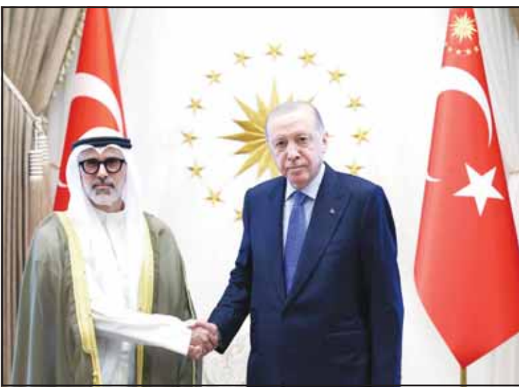
Foreign Minister Sheikh Jarrah Jaber Al-Ahmad Al-Sabah meets the Turkish President Tayyip Erdogan. The Foreign Minister delivered the letter during an official visit to Ankara.

Fajr ..... 03:35 Asr ..... 15:20 Sunrise .. 05:02 Maghrib .. 18:27 Zohr ..... 11:45 Isha ..... 19:52