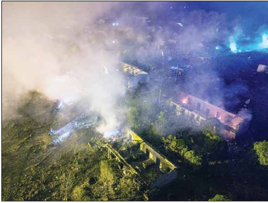
In this photo released by Xinhua News Agency, this aerial drone photo taken in the early hours of May 5, 2026, rescuers work on site after an explosion at a fireworks plant in Guandu Town of Liuyang, central China's Hunan Province. (AP)