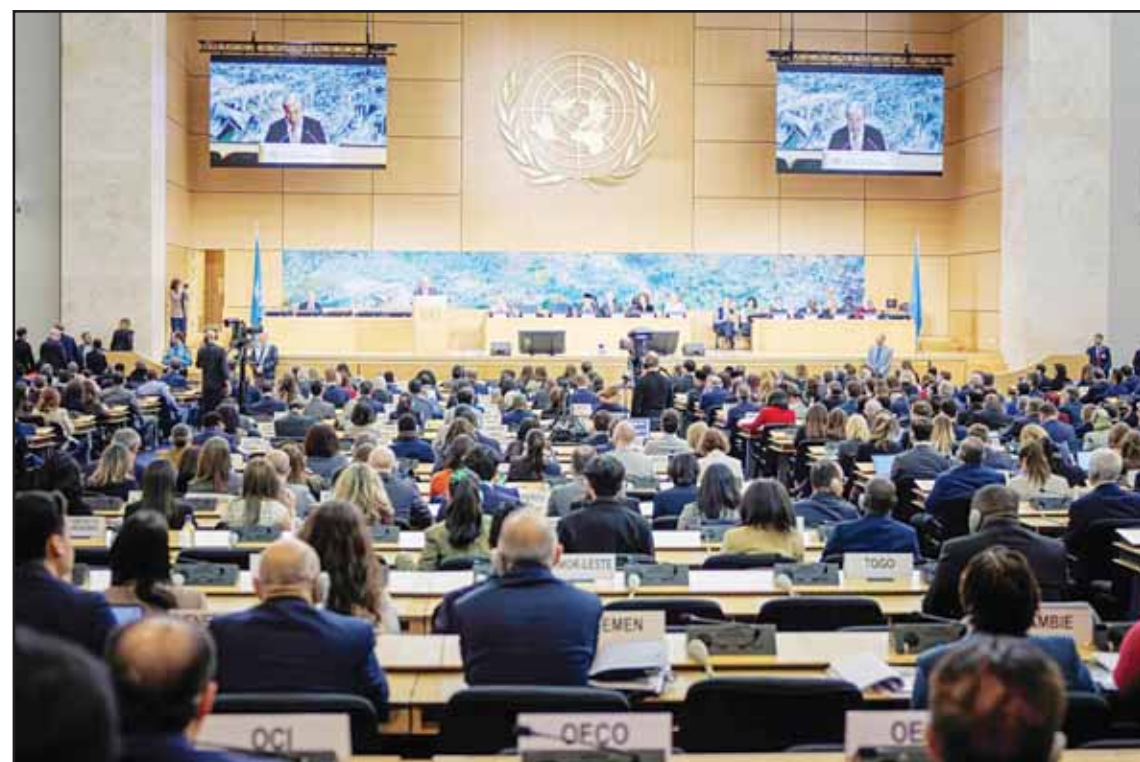
UN Secretary-General Antonio Guterres speaks during the opening of the 61st session of the United Nations Human Rights Council at the European headquarters of the United Nations in Geneva on Feb 23.

ror. "The fact that I wasn't told when I said to Parliament that due process had been followed is unforgivable."