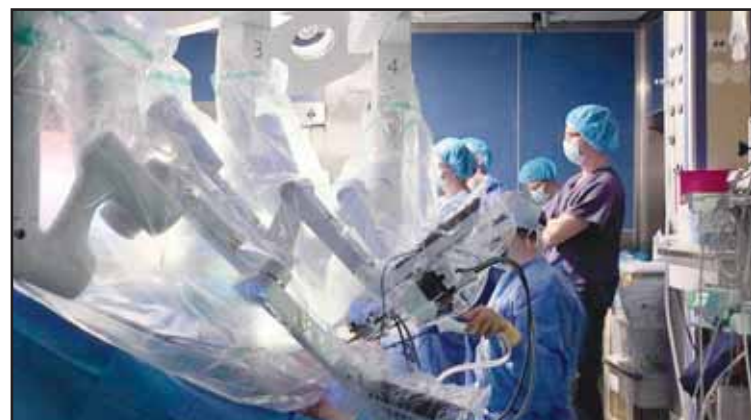
This photo taken on April 15, 2026, shows the operating arms of a surgical robot developed by Chinese surgical robotics company Edge Medical during a surgery in Warsaw, Poland.

The PIs from Inocras and the Broad Institute will jointly present data highlights and discuss future initiatives during the Exhibitor Spotlight session "TCGA and Beyond: Whole-Genome Data Powering the Next Era of Cancer Intelligence" on Monday, April 20th.