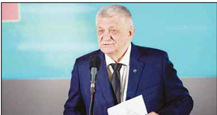
Russian film director Aleksandr Sokurov holds an envelope with a letter to Russian director and Chairman of the Union of Cinematographers of the Russian Federation Nikita Mikhalkov, while speaking prior to the screening of his movie 'Director's Diary' on the sidelines of the 48th Moscow International Film Festival in Moscow, on Sunday, April 19.

"That took some time," Pronger said. "That was a challenge just in watching the games. You still think you can play. I had to realize first and foremost, this is not happening. I'm not physically able to do it."