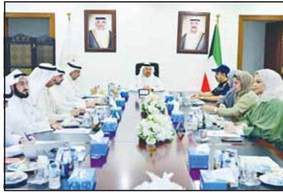
Farwaniya Governorate photo showing Farwaniya Governor Sheikh Athbi Nasser Al-Athbi Al-Sabah chairs the meeting.

The Public Relations Department of Kuwait Municipality affirmed that field teams from the Public Hygiene Departments are continuing their inspection tours to monitor and remove violations of cleanliness and road occupancy regulations across various governorates.