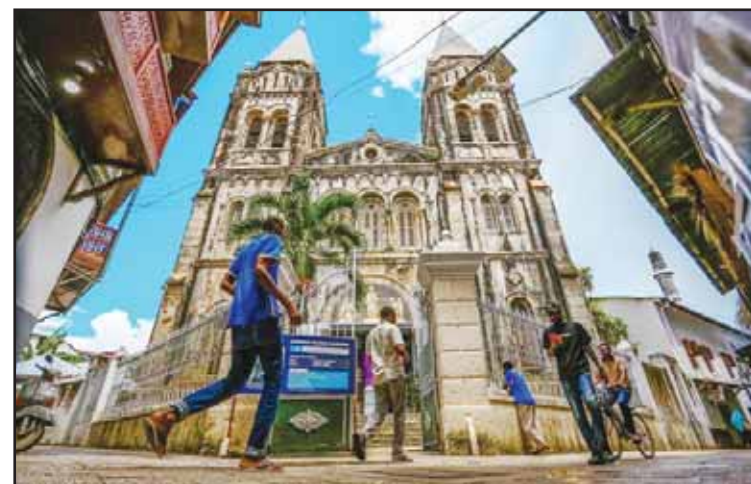
Pedestrians walk past the Catholic Museum Zanzibar in Stone Town, Zanzibar, Tanzania, March 24, 2026.

For example, key structural elements for the House of Wonders, such as cast iron columns and beams, have had to be sourced from abroad, with shipping timelines of up to six or seven months. Alawi said that even traditional materials like mangrove poles can be difficult to procure consistently.