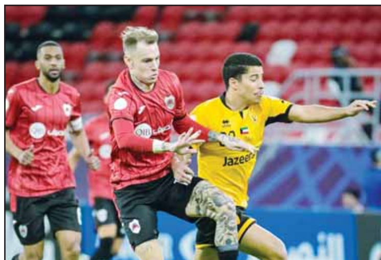
Qadsia and Al-Rayyan players battling for the ball (not seen) during the Gulf Champions League match.