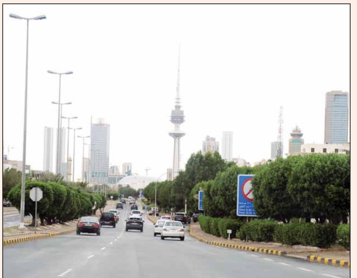
Kuwait wakes under a leaden Monday sky, where fits of drizzle dampen the roads and commuters inch toward the capital, as the Liberation Tower stands resolute against a smothering, overcast skyline.