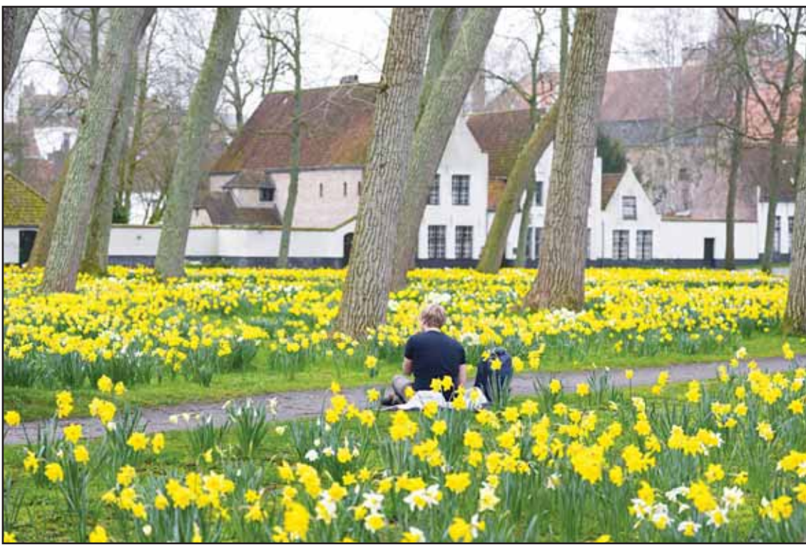
A visitor sits among the daffodils in the courtyard of the Beguinage Ten Wijngaerde of Bruges, Belgium, Tuesday March 10, 2026.