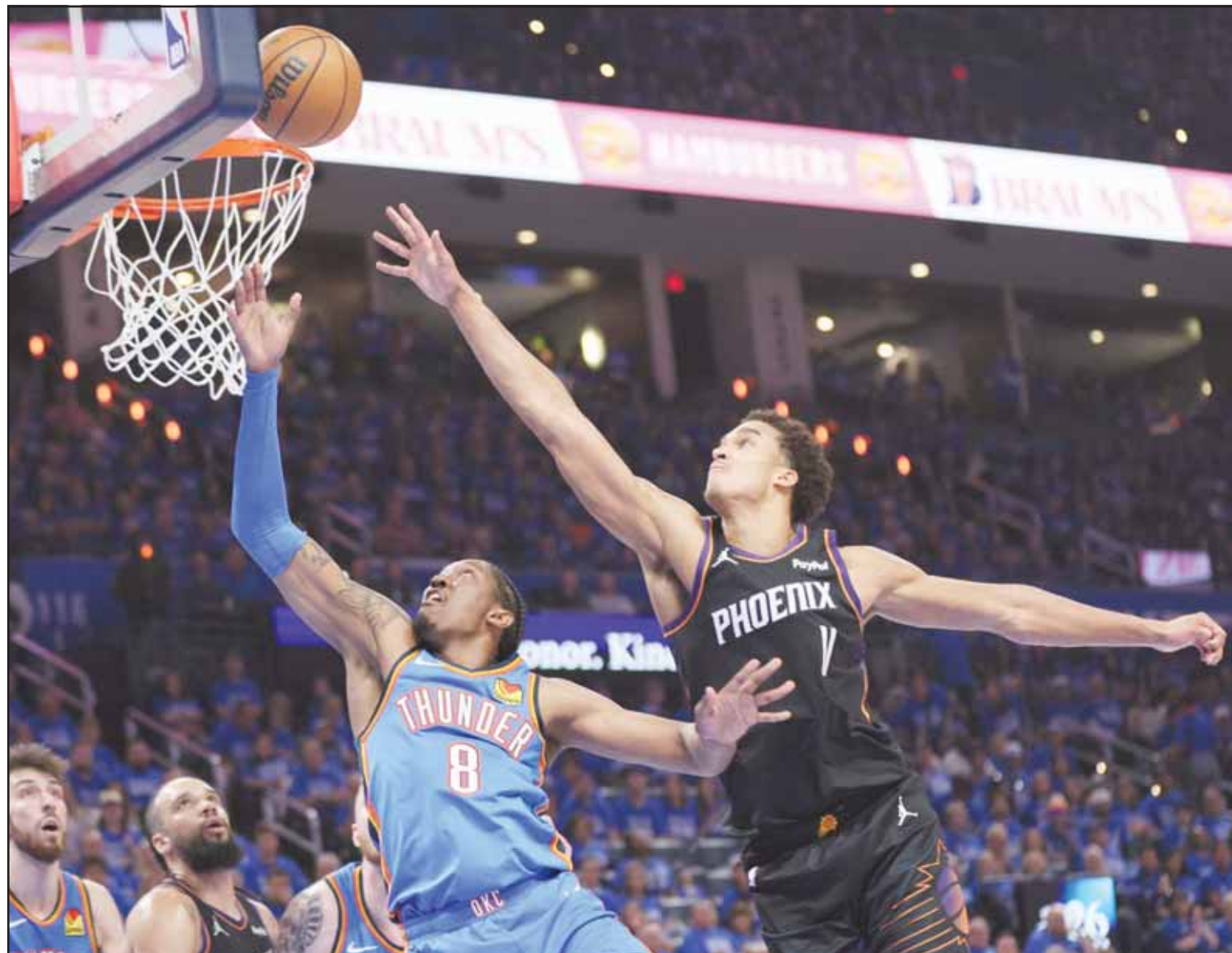
Oklahoma City Thunder guard Jalen Williams (8) shoots in front of Phoenix Suns forward Oso Ighodaro, right, during the second half in Game 1 of a first-round NBA playoffs basketball series in Oklahoma City.

Game 2 is Tuesday night in Boston. Tyrese Maxey had 21 points and eight assists for the 76ers, who played