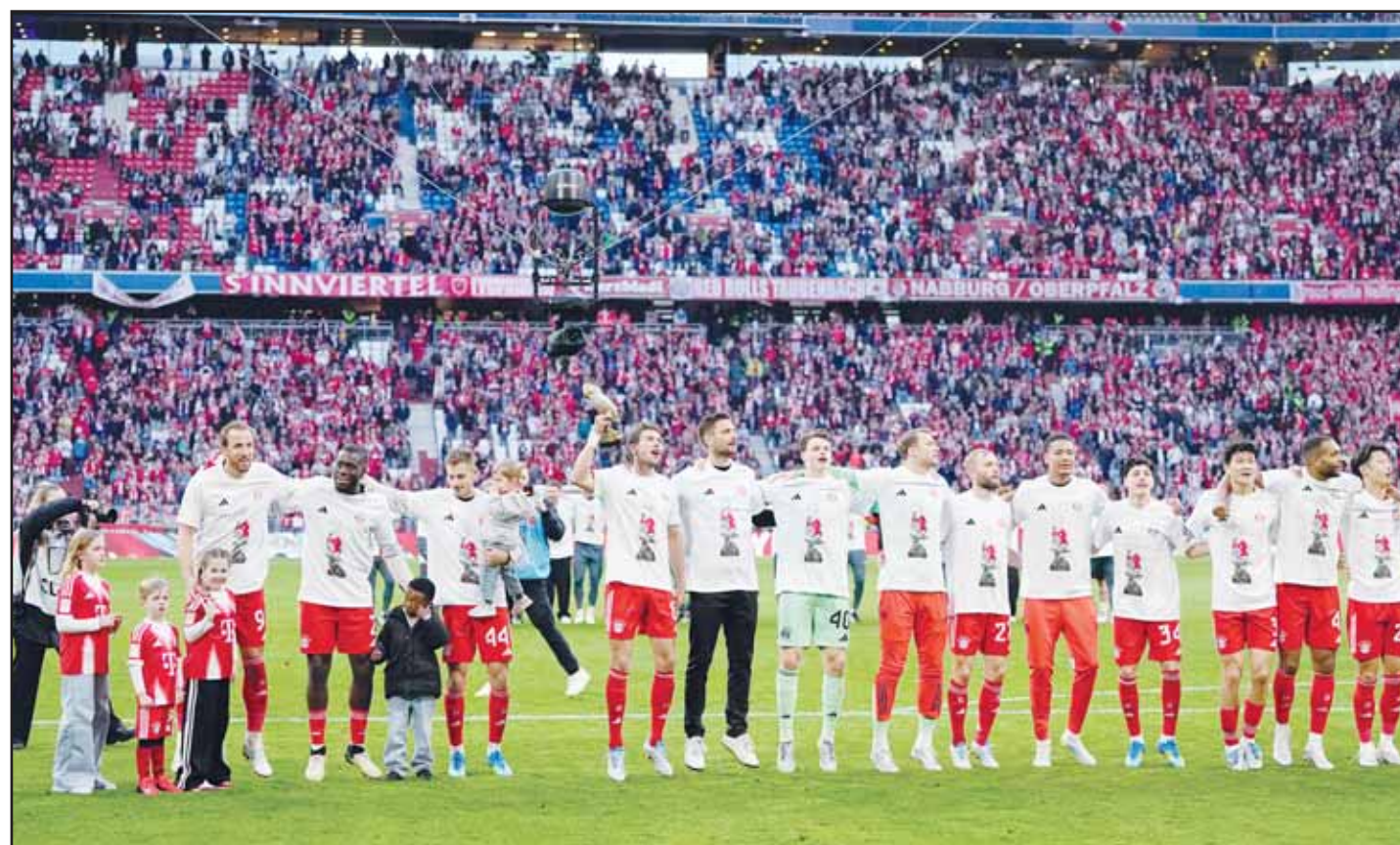
Bayern players celebrate after their team clinched the German league title after a Bundesliga soccer match between Bayern and Stuttgart in Munich, Germany.