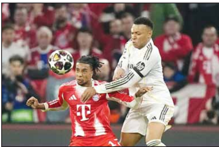
In this file photo, Bayern's Michael Olise, left, challenges for the ball with Real Madrid's Kylian Mbappe during the Champions League quarterfinal second leg soccer match between Bayern Munich and Real Madrid in Munich, Germany.

The 20-year-old Doué has three years left on his PSG contract and is valued at around 115 million euros compared to 100 million euros for Dembélé, who has two years left to run at PSG and is eight years older.