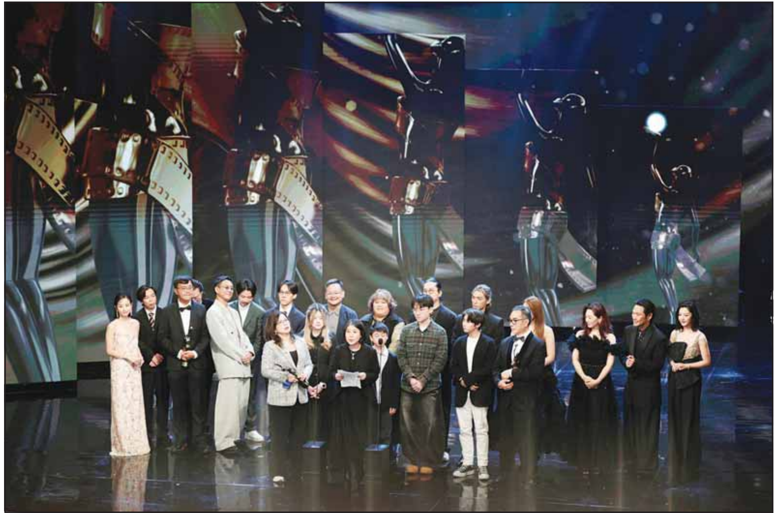
Cast and crew of the movie 'Ciao UFO' celebrate on stage after winning the Best Film award at the 44th Hong Kong Film Awards in Hong Kong on Sunday, April 19.