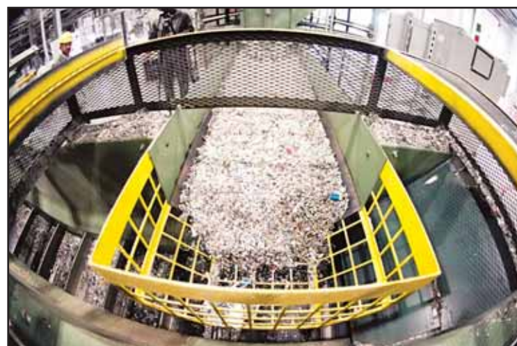
Ground up plastics that Alterra Energy receives from recycling facilities, move along a conveyor at the start of their process that transforms the material into a liquid that is then used in the manufacturing of plastic in Akron, Ohio, Sept. 8, 2022.

EPA said it's taking public comment for a potential rule that could recognize pyrolysis as manufacturing