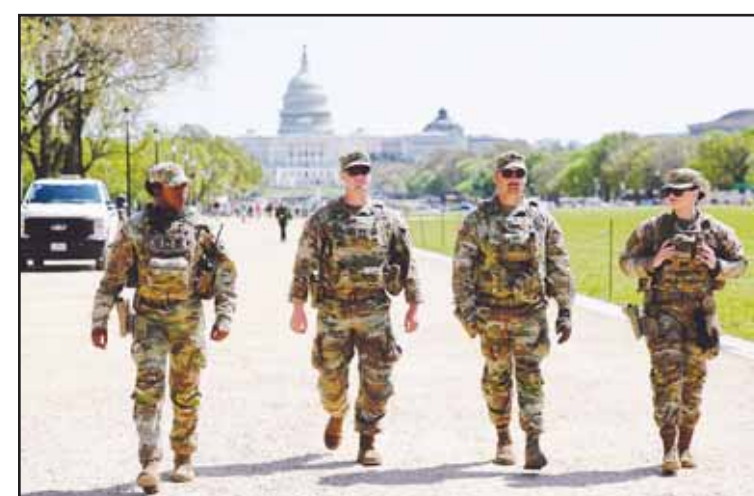
National Guard patrol the Washington Mall, with the US Capitol in the background on April 7, in Washington.

ecutive order in August to deal with what he called a crime emergency. The order brought the guard in, along with hundreds of additional federal law enforcement officers.