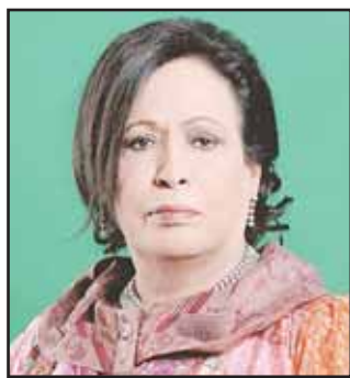
Kuwaiti actress, Hayat Al-Fahad back in ICU following sudden setback.

He disclosed that prominent figures in the artistic community, including Suad Abdullah,