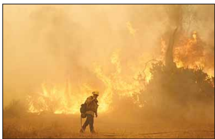
A firefighter battles the Canyon Fire on Aug. 7, 2025, in Hasley Canyon, Calif.

It's not just the clock that is getting extended. The calendar is too. The number