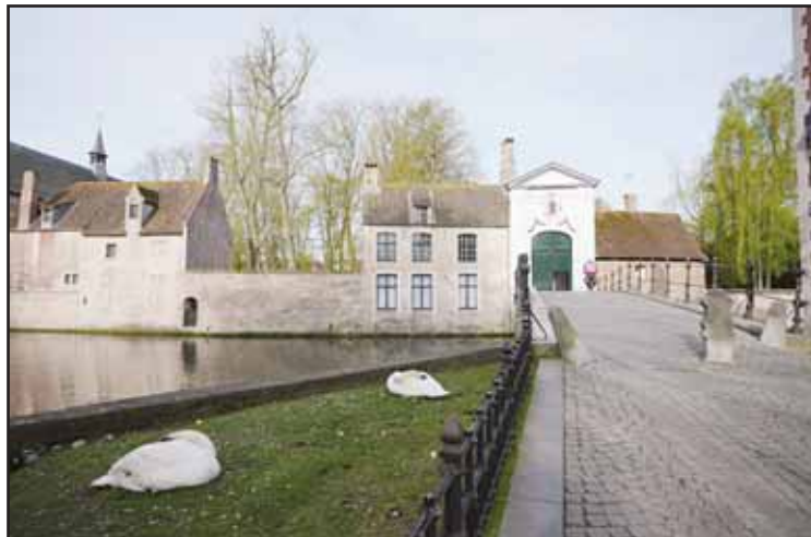
Swans sleep outside the gate of the Beguinage Ten Wijngaerde in Bruges.

designed for like-minded women to live in comfort, quiet and safety, with small gardens tucked into either easily accessible alleys or around a main square with houses facing a common courtyard. The heart of the community was almost always a chapel or church.