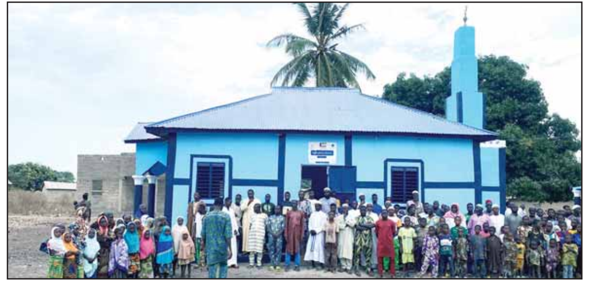
Building mosques in needy areas.