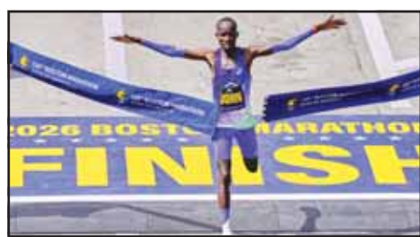
John Korir, of Kenya, breaks the tape to win the Boston Marathon in Boston. Korir broke the Boston Marathon course record on Monday, riding a tailwind to outrun the fastest field in event history and win in an unofficial 2 hours, 1 minute, 52 seconds for his second straight victory.