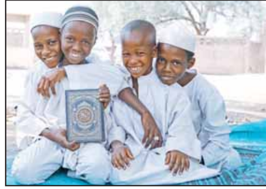
The Al-Othman Zakat Committee announces the continuation of its efforts within sustainable care programs by sponsoring 1,539 orphans in 16 countries.

He emphasized that the sponsorship program goes beyond financial aid, providing a comprehensive system of educational, health, social, and psychological care to help raise the orphans properly and empower them to become active members of their communities.