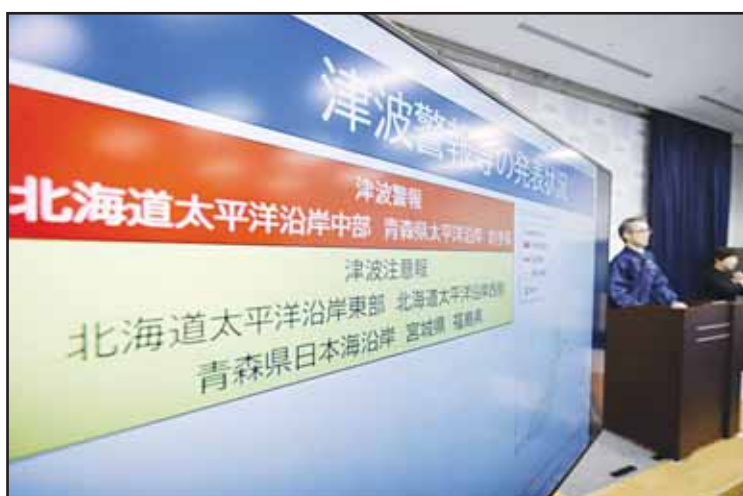
An official of the Japan Meteorological Agency speaks near a monitor showing a tsunami alert during a news conference at the agency in Tokyo on April 20 after an earthquake that struck off the northern Japanese coast.

A tsunami of about 80 centimeters (2.6 feet) was detected at the Kuji port in the Iwate prefecture within one hour of the quake, and a smaller tsunami of 40 centimeters (1.3 feet) was recorded at another port in the prefecture, the agency said.