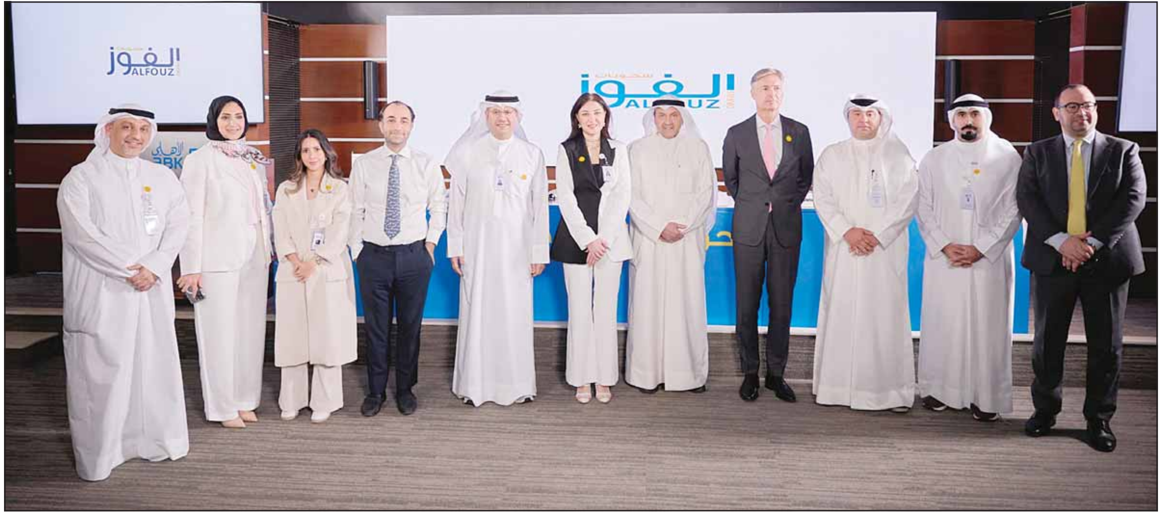
A group photo taken on the sidelines of the raffle.