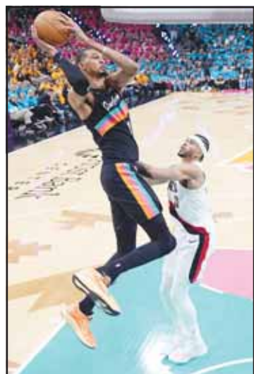
San Antonio Spurs forward Victor Wembanyama (1) drives to the basket over Portland Trail Blazers forward Toumani Camara (33) during the second half in Game 1 of a first-round NBA playoffs basketball series in San Antonio.

Phoenix broke out to a 5-0 lead as the Thunder started cold following a