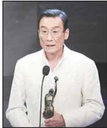
Left: Patrick Leung Pak Kin with the Best Director award for the movie 'Ciao UFO.' Right: Tony Leung Ka Fai reacts after receiving the Best Actor award for 'The Shadow's Edge.'