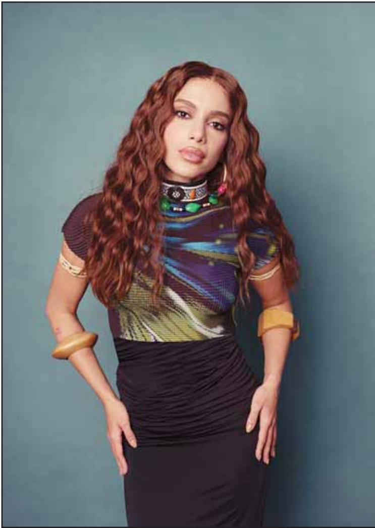
Anitta poses for a portrait in New York on Thursday, April 9

If she sounds self-actualized, that's because it is her ambition for the album. "I think the main message is, like, we are all one. We live in a planet, Mother Earth. It's our home. We're supposed to just live in harmony with each other, respect each other's flavors, decisions, ways of communicating. We should be just, like, admiring our differences," she says.