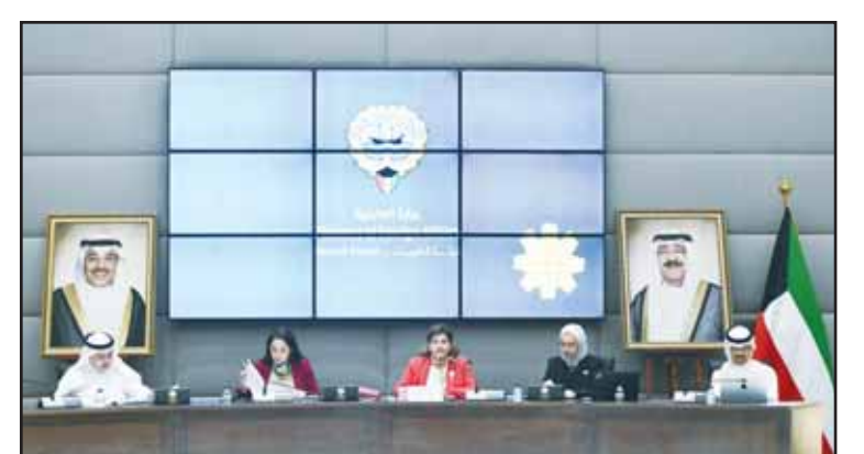
Assistant Foreign Minister for Human Rights Ambassador Sheikh Jawaher Al-Sabah chairs the third coordination meeting of the National Standing Committee at the Ministry of Foreign Affairs.