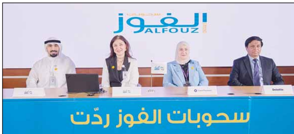
ABK representatives and external auditing firms during withdrawals.