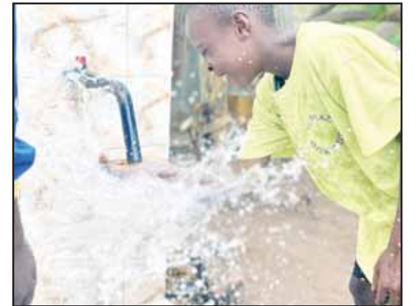
Namaa Charity photos The projects contribute to improving public health and preserving human dignity in Benin.

He emphasized that Kuwaiti charitable work continues its humanitarian mission worldwide, supported by generous donors, reflecting Kuwait's bright image and pioneering role in helping those in need.