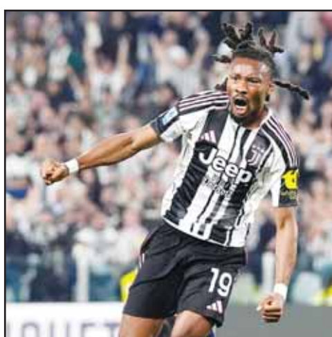
Juventus' Khephren Thuram celebrates after scoring a goal during the Serie A soccer match between Juventus FC and Bologna, in Turin, Italy.

had doubled Milan's lead in the 74th but it was ruled out for an offside earlier in the move.