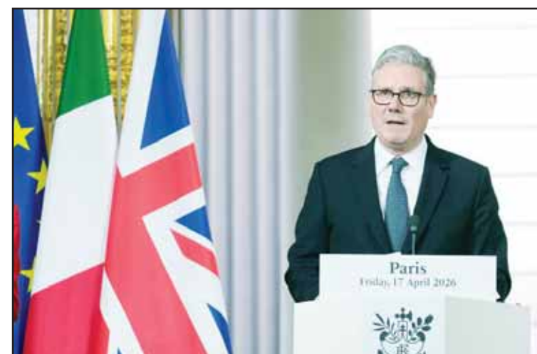
Britain's Prime Minister Keir Starmer gives a statement after an international summit to push forward efforts to reopen the Strait of Hormuz, at the Elysee Palace, in Paris, France on April 17.

ter Mandelson had failed his security vetting when he was appointed is astonishing," Starmer told the Daily Mir-