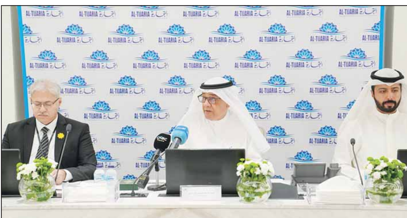
Al Tijaria General Assembly meeting.

Al-Tijaria had previously announced that the financial results for the fiscal year ended December 31, 2025, resulted a net profit of KD 16,314,480 (Sixteen Million three hundred fourteen thousand four hundred eighty Kuwaiti Dinars), with a growth of 4.6%, the EPS was 9.01 fils with growth of 6% compared to 2024. The results also witnessed an improvement in all financial indicators, with growth in return on shareholders' equity, total assets, and company capital by 3.4%, 1.3%, and 1.6%, respectively, compared to the previ-