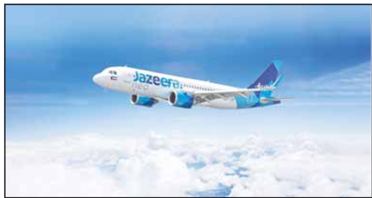
Jazeera Airways aircraft

■ "Strong financial expertise & clear understanding of KIPCO's strategic priorities ensure continuity" says Group CEO