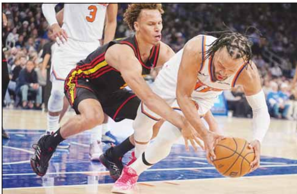
Atlanta Hawks' Dyson Daniels, left, fights for control of the ball with New York Knicks' Jalen Brunson during the second half in Game 1 of a first-round NBA playoffs basketball series in New York.