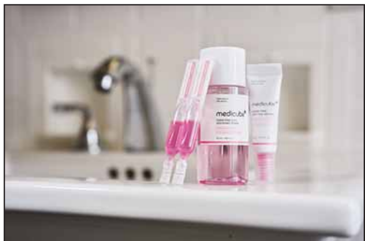
Skincare products made from salmon DNA are displayed Friday, March 6, 2026, in Cincinnati.