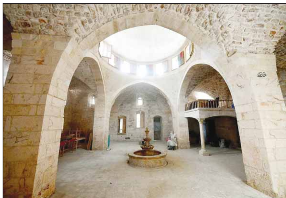
A worker carries out restoration work in the al-Madina Souq, the world's largest covered historic market, in Aleppo, Syria, on March 6, 2022.

Russia has moved to formalize control over seized collections. In 2023, it amended legislation to incorporate 77 Ukrainian museums in the occupied Donetsk, Luhansk, Kherson and Zaporizhzhia regions into its national catalog, a step critics say effectively prohibits the return of looted works.