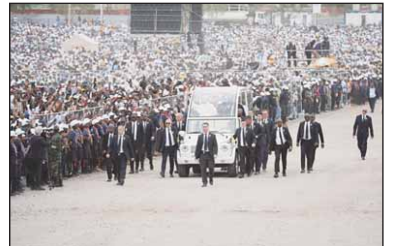
Pope Leo XIV arrives in Kilamba, some 30 kilometers south of Luanda, Angola, to preside over Sunday Mass on April 19 on the seventh day of an 11-day apostolic journey to Africa.

"I desire to meet you in the spirit born of peace and to affirm that your people possess treasures that cannot be bought or stolen," he said. "There dwells within you a joy that not even the most adverse circumstances have been able to extinguish."