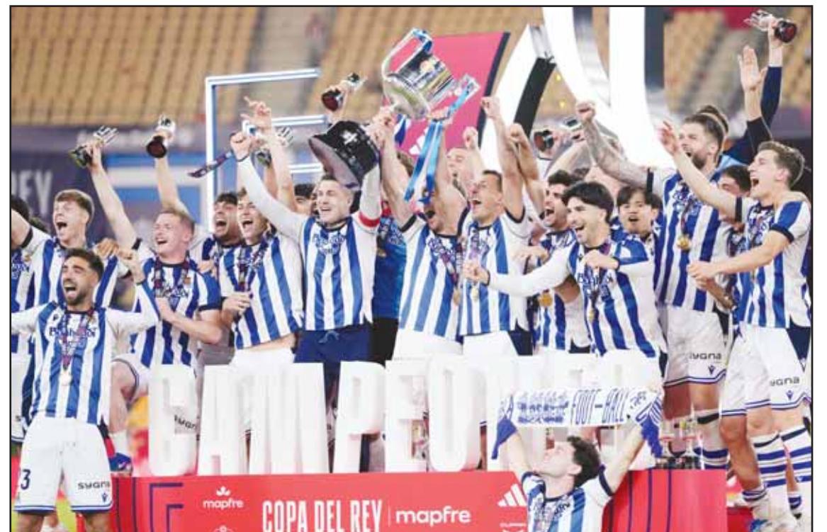
Real Sociedad's team players celebrate with the trophy after the Copa del Rey final soccer match between Atletico Madrid and Real Sociedad in Seville, Spain.

SEVILLE, Spain, April 19, Real Sociedad beat Atletico Madrid on penalties to win the Copa del Rey title, giving American coach Pellegrino Matarazzo his first career title after he moved to Spain this season.