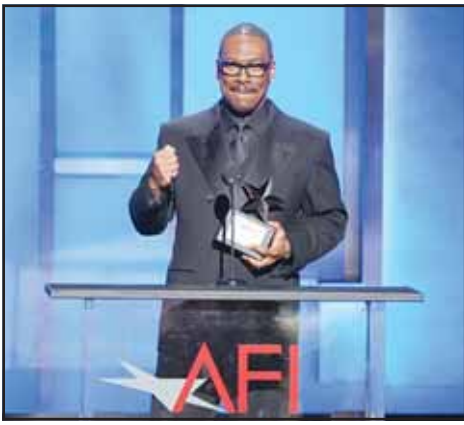
Eddie Murphy accepts the 51st AFI Life Achievement Award during a tribute to him on Saturday, April 18, at the Dolby Theatre in Los Angeles.