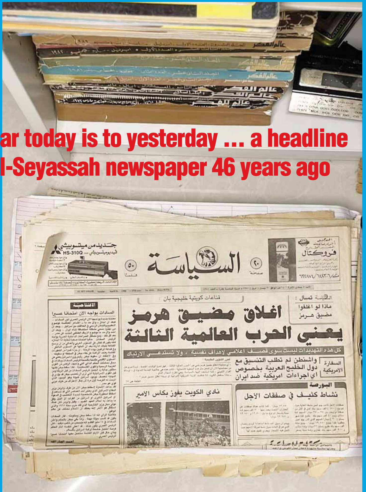
An archival glimpse of Al-Seyassah newspaper editions, capturing a historic front page preserved through decades – where past headlines continue to echo the present.

This sentiment brings to mind a poignant verse by the illustrious poet Al-Jawahiri: "A fool is he who, despite his intellect, fails to let the lessons of the past illuminate his path for tomorrow."