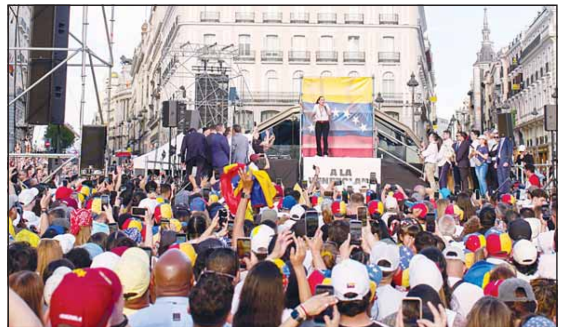
Venezuela's opposition leader Maria Corina Machado delivers a speech on stage in front of supporters at Madrid's Puerta del Sol, in Madrid, Spain on April 18.

The minister said the gunman had a valid weapon's permit.