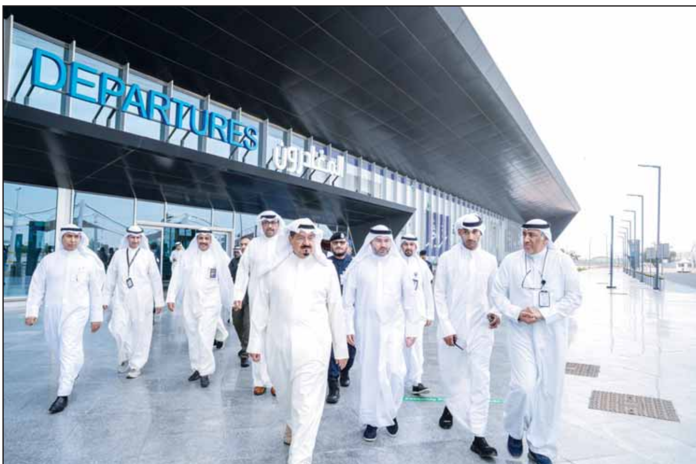
PM Diwan photo His Highness the Prime Minister Sheikh Ahmad Abdullah Al-Ahmad Al-Sabah visits the Kuwait International Airport, accompanied by Minister of Defense Sheikh Abdullah Ali Abdullah Al-Salem Al-Sabah and President of the Directorate General of Civil Aviation Sheikh Humoud Mubarak Al-Humoud Al-Sabah.

He commended the significant efforts of national and technical personnel in preparing the airport and ensuring the resumption of air traffic following the suspension imposed by exceptional circumstances.