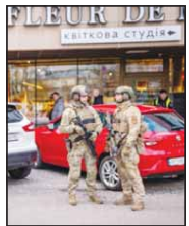
Police officers are seen at the site where a gunman killed at least six people in the streets before being shot dead by police, in Kyiv, Ukraine on April 18.

An Associated Press reporter at the scene saw victims' bodies in the street covered with emergency blankets before they were taken away.