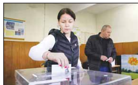
People cast their ballots at a polling station in Sofia, Bulgaria on April 19, during early parliamentary elections.

The front-runner, Bulgaria's former President Rumen Radev,