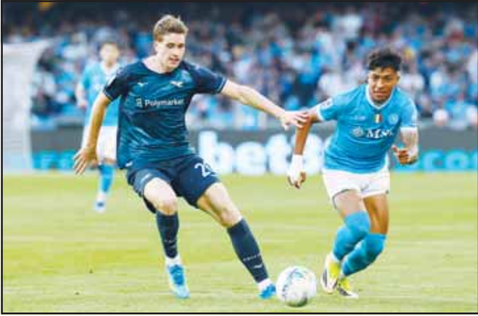
Napoli's Alisson Santos, right, and Lazio's Toma Basic battle for the ball during the Italian Serie A soccer match between Napoli and Lazio in Naples, Italy.

Lazio could have doubled its lead in the 31st minute after Tjijani Noslin was bundled over by Stanislav Lobotka in the area but