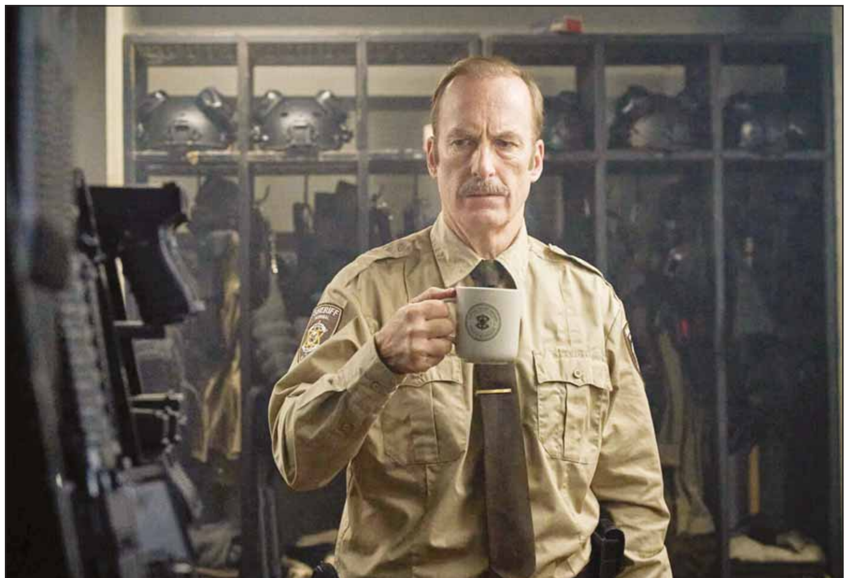
This image released by Magnolia Pictures shows Bob Odenkirk in a scene from 'Normal.'