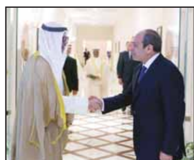
Ministry of Foreign Affairs photo Egyptian President Abdel Fattah el-Sisi receives Kuwait's Minister of Foreign Affairs Sheikh Jarrah Jaber Al-Ahmad Al-Sabah.

In other news, Egyptian President Abdel Fattah El-Sisi discussed on Sunday with Kuwait's Minister of Foreign Affairs Sheikh Jarrah Jaber Al-Ahmad Al-Sabah the latest regional developments and efforts exerted in this regard.