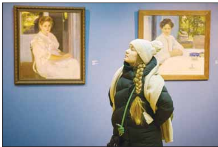
A visitor at Ukraine's National Art Museum is bundled up due to power outages caused by Russian air attacks on the country's energy system, affecting the museum's temperature during winter in Kyiv, Ukraine, on Feb. 6, 2026.

Ukraine is again raising its voice over the looting as Russia seeks to return to the world's cultural stage. Next month's Venice Biennale plans to allow Russian representatives to take part for the first time since 2022. Ukraine has said the event "must not become a stage for whitewashing the war crimes that Russia commits daily against the Ukrainian people and our cultural heritage."