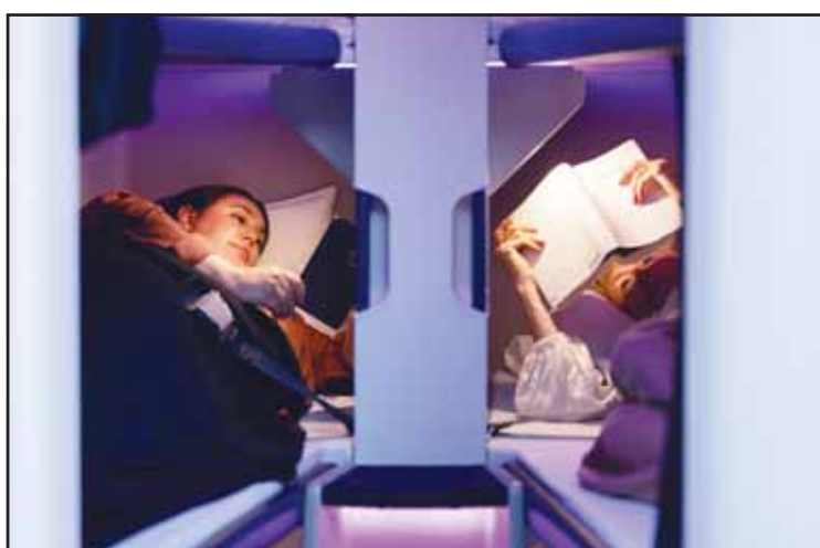
This photo provided by Air New Zealand shows sleeping pods in a mock-up of a plane cabin in Auckland, New Zealand. (AP)

"That means solo snoozes only please, no musical nests or tag-teaming," Air New Zealand's website says. For those worried about cleanliness, the airline assures travelers that the pillows, blankets and sheets supplied "are all refreshed" between four-hour naps.