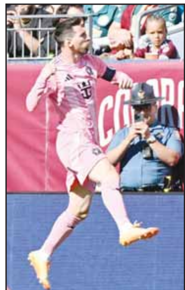
Inter Miami forward Lionel Messi jumps after scoring in the second half of an MLS soccer game against the Colorado Rapids in Denver.

Messi, who opened the scoring when he converted a penalty kick in the 13th minute, scored the go-ahead goal in 79th minute. After a Colorado turnover near midfield, Messi cut back near the right corner of the penalty box and flicked a rising shot that split a pair of defenders and slipped