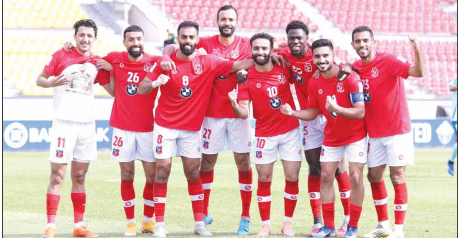
Kuwait Club players celebrate after advancing to Challenge League semifinals.