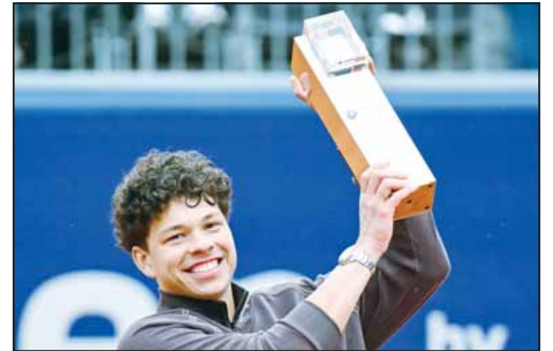
Ben Shelton of the US celebrates with the trophy after winning the men's singles final match against Italy's Flavio Cobolli at the ATP Tour in Munich, Germany.

MUNICH, April 19, - Ben Shelton bounced back from disappointment last year by defeating Flavio Cobolli 6-2, 7-5 to win the Munich Open.