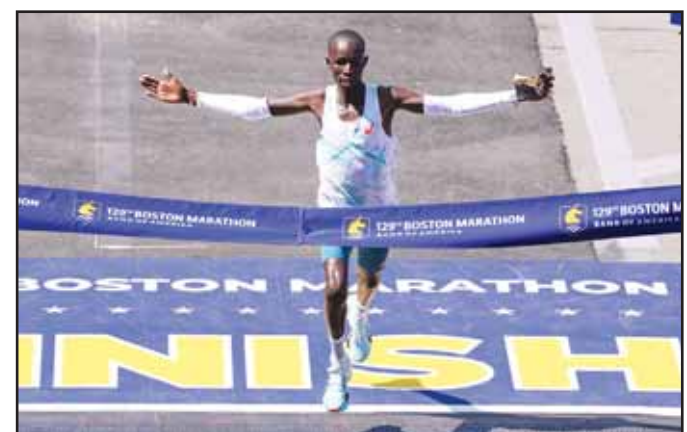
In this file photo, John Korir, of Kenya, breaks the tape to win the Boston Marathon in Boston.

Several of the law enforcement officials at the pre-race security briefing said they are already planning for the other high-profile events scheduled for the Boston area this year, including soccer's World Cup, the Sail Boston tall ships display and the United States' 250th anniversary celebration.