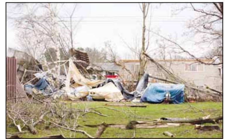
Debris and fallen tree limbs cover the ground after a severe storm that tore through the Upper Midwest on April 17, in Rochester, Minn.