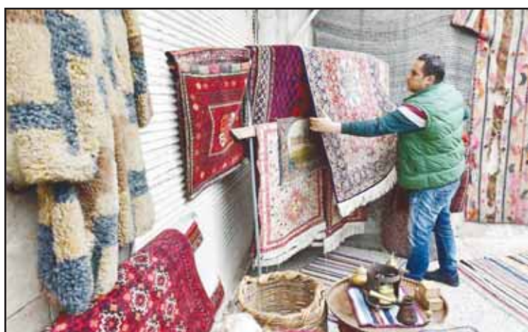
A carpet weaver works at his workshop in Aleppo, Syria, on March 8, 2022.