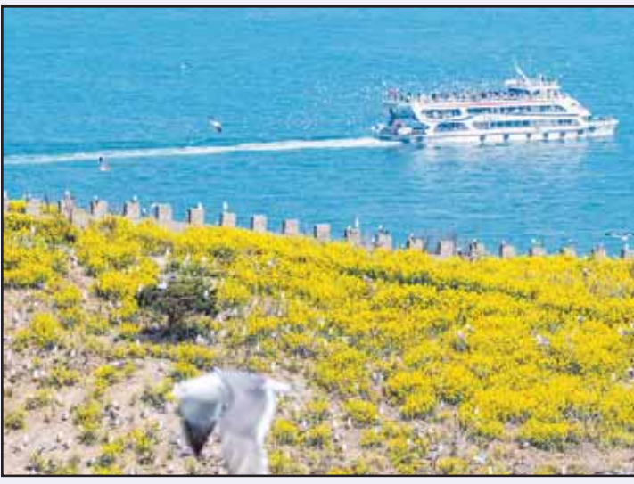
A drone photo taken on April 15, 2026 shows tourists taking a cruise ship for sightseeing in Rongcheng City, east China's Shandong Province.

1 dead after car ploughs into crowd in Melbourne Showgrounds: A car