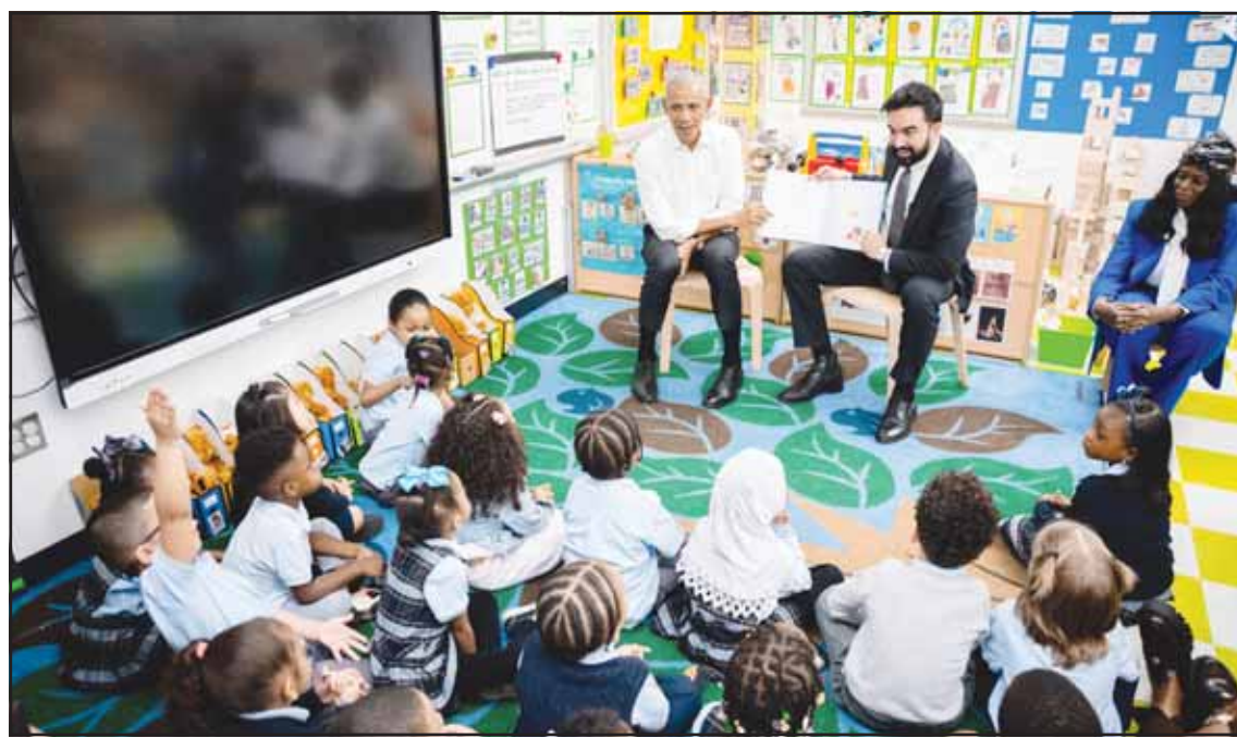
Former US President Barack Obama and Mayor Zohran Mamdani take part in a shared reading event at Learning Through Play Pre-K in the Bronx in New York on April 18.