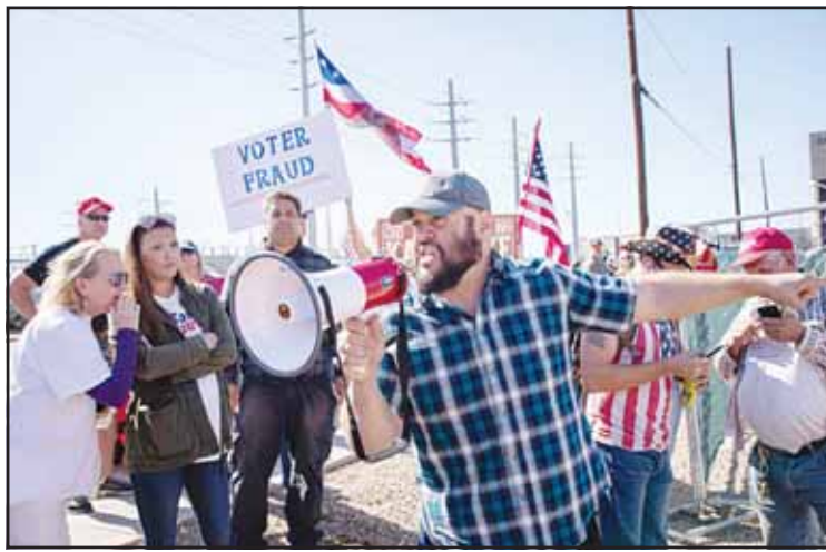
Republican supporters stand outside the Maricopa County Recorder's Office to protest what they allege is an unfair election in Phoenix on Nov. 12, 2022.

and he hasn't had any help from outside groups.