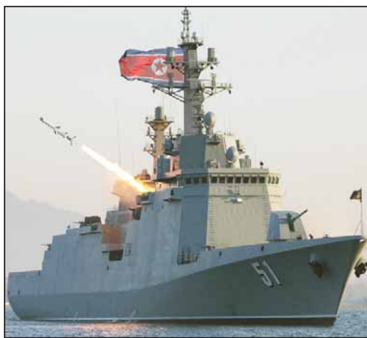
This photo provided by the North Korean government, shows what it says a test launch of a missile at an undisclosed place in North Korea on April 12. (AP)

South Korea's military was analyzing whether the latest launches were made from a submarine, a land-based launcher or both platforms, according to South Korean media. Asked about where the missiles were launched, Japan's Deputy Minister of Defense Masahisa Miyazaki told reporters that Japan was analyzing launch details in coordina-