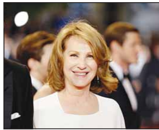
Actress Nathalie Baye poses for photographers upon arrival at the screening of the film Juste la Fin du Monde (It's Only the End Of The World) at the 69th international film festival, Cannes, southern France, May 19, 2016.

screen mother in Steven Spielberg's "Catch Me If You Can," won both popular and critical ac-