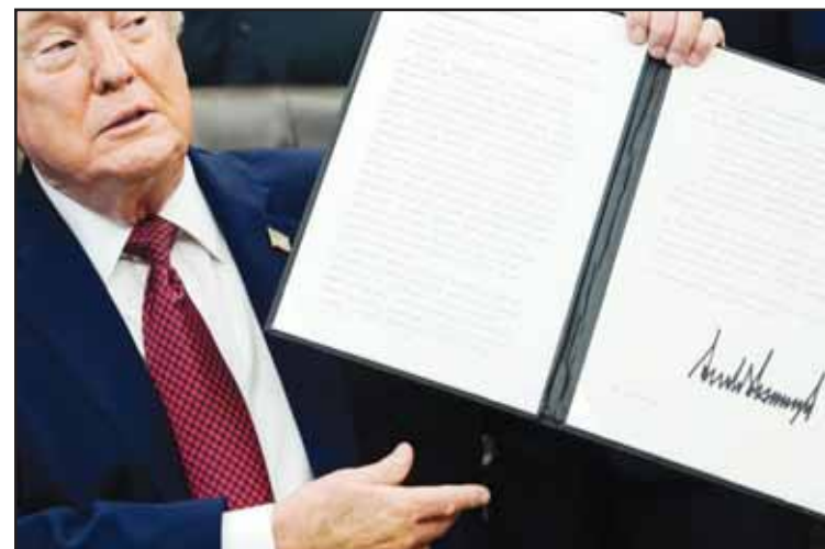
President Donald Trump holds up a signed executive order in the Oval Office of the White House, Saturday, April 18, in Washington.

The FDA is also taking steps to clear the way for the first-ever human trials