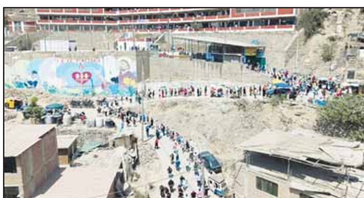
Voters line up outside a polling station during general elections in Lima, Peru on April 12.

Peruvians voted for president on Sunday. No candidate received enough support to win outright, and electoral authorities have not yet announced the two candidates who will advance to the runoff contest as they continue to count votes.