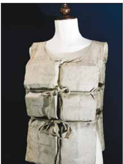
A Titanic life-preserver, belong to a survivor is shown, London, Wednesday, May 16, 2007.

The record auction price for a piece of Titanic memorabilia is 1.56 million pounds (almost $2 million at the time) paid in 2024 by a gold pocket watch given to the captain of RMS Carpathia, the ship that rescued 700 Titanic survivors.