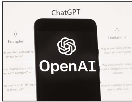
The OpenAI logo is seen on a mobile phone in front of a computer screen which displays the ChatGPT home screen, March 17, 2023, in Boston.

The Gallup survey found about 7 in 10 US adults who have used AI for health research in the past 30 days say they wanted quick answers, additional information or were simply curious. Majorities used it for research before seeing a