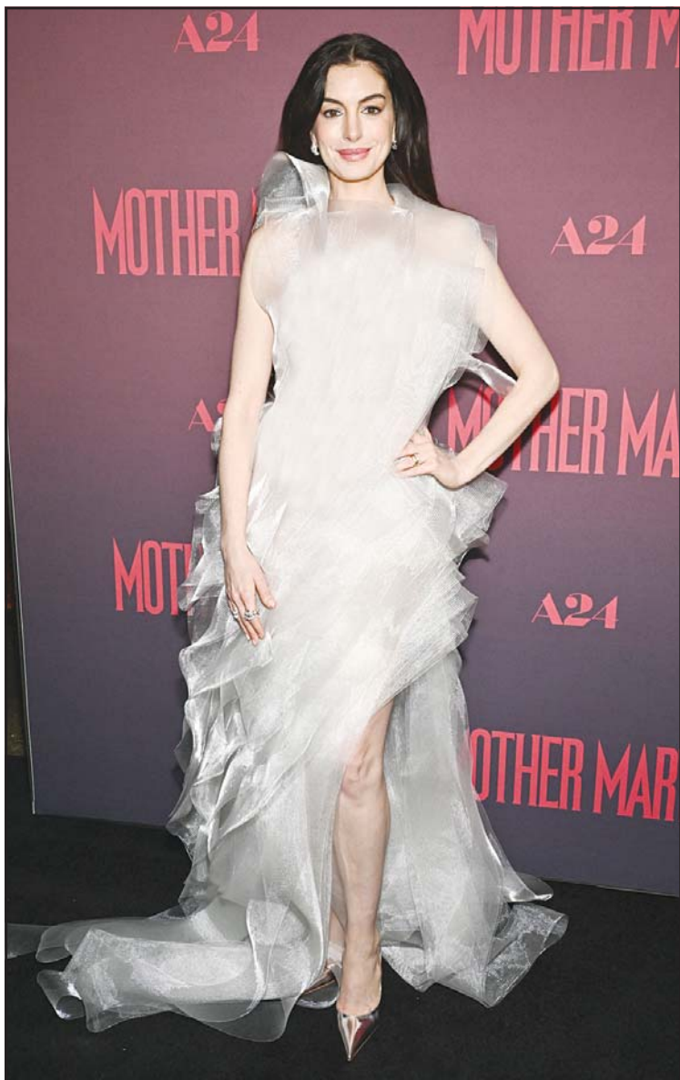
Anne Hathaway attends the special screening of 'Mother Mary' at Metrograph on Monday, April 13, in New York.