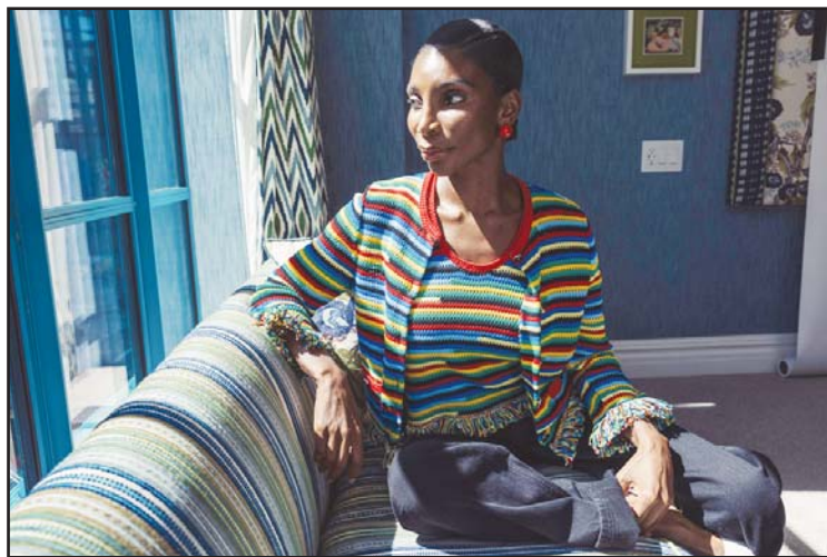
Michaela Coel poses for a portrait to promote 'The Christophers.'

ences might be glaring, the two quickly found common ground.