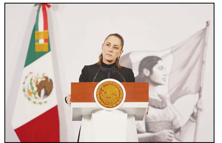
Mexican President Claudia Sheinbaum gives her daily, morning news conference at the National Palace in Mexico City on Feb 23.