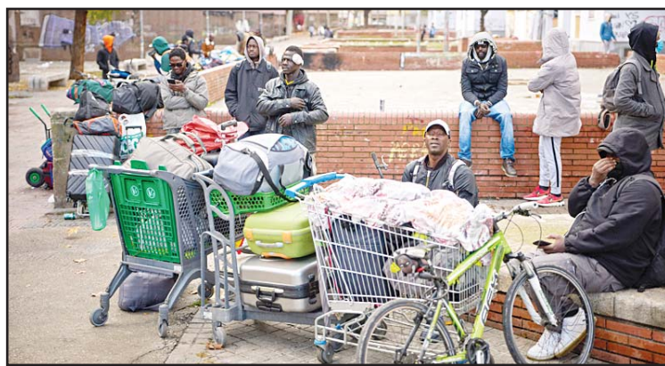
Migrants sit together with their belongings after being evicted by police from an abandoned school where they had been living in Badalona, near Barcelona, Spain, on Dec 17, 2025.

An estimated half-million people living in Spain without authorization