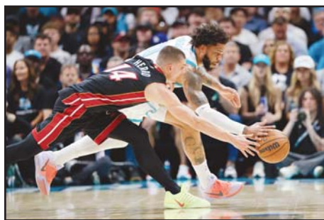
Charlotte Hornets forward Miles Bridges, back, and Miami Heat guard Tyler Herro (14) battle for a loose ball during the first half of an NBA play-in tournament basketball game in Charlotte, N.C.

Avdija and the rest of the young Blazers kept their cool during a physical game that featured