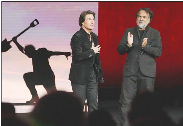
Left photo: Cast member Tom Cruise, (left), and director Alejandro González Iñárritu of the upcoming film 'Digger' speak at the Warner Bros. presentation. Right photo: Cast members Milly Alcock, left, and Jason Momoa of the upcoming film 'Supergirl' speak during the Warner Bros. presentation at CinemaCon on Tuesday, April 14, at Caesars Palace in Las Vegas.

"I know David quite well. And I know that he really cares about movies. And he's a natural born storyteller and thinks like almost an old school entrepreneurial producer that was a storyteller that loves storytelling and loved putting on spectacular shows," Cameron said. "He's the right man for the job to run a major studio, and now it looks like he's going to have two of them, you know, swept under his leadership, which doesn't bother me at all."