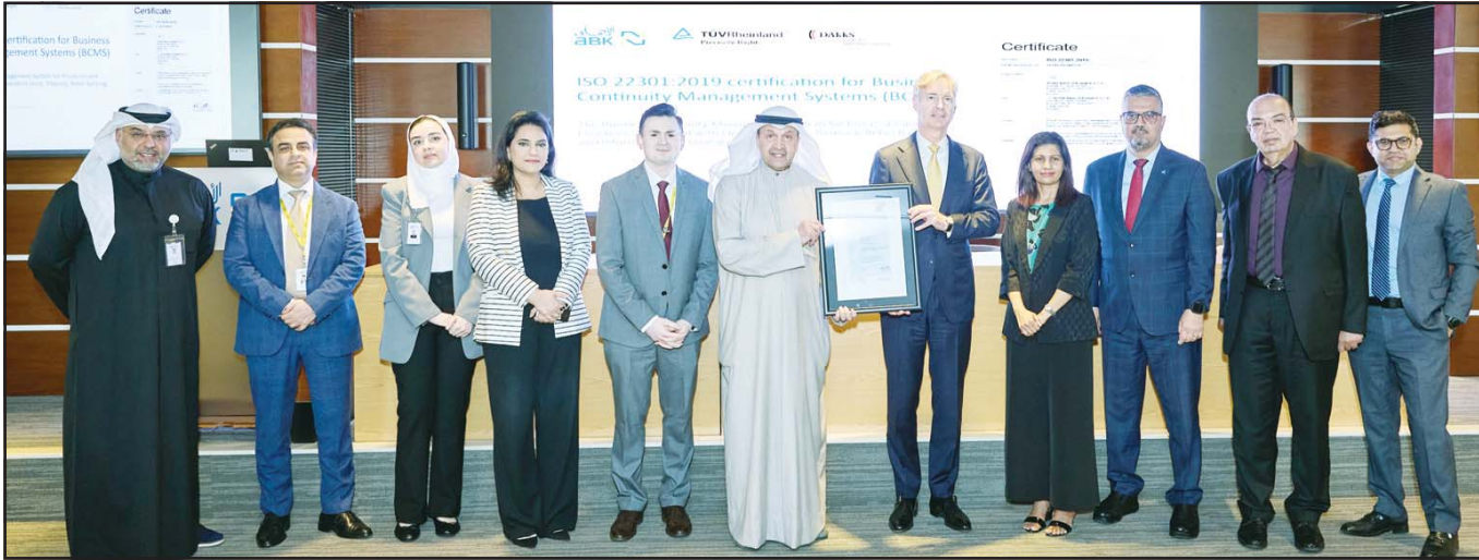
ABK team receiving the certificate.