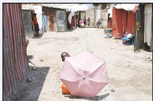
A youth using an umbrella to shade himself plays at a shelter for families displaced by gang violence in Port-au-Prince, Haiti on April 13. (AP)

Danneau said the victims were young men who worked alongside police and gathered information for them to help protect the population. (AP)