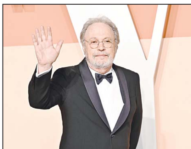
Billy Crystal arrives at the Vanity Fair Oscar Party on March 2, 2025, at the Wallis Annenberg Center for the Performing Arts in Beverly Hills, Calif.

Crystal made a name for himself first in comedy, from stand-up to TV's "Soap" to the films "When Harry Met Sally" and "City Slickers." Then in 1992, he got serious with the movie "Mr. Saturday Night," which he directed, co-wrote and starred in.