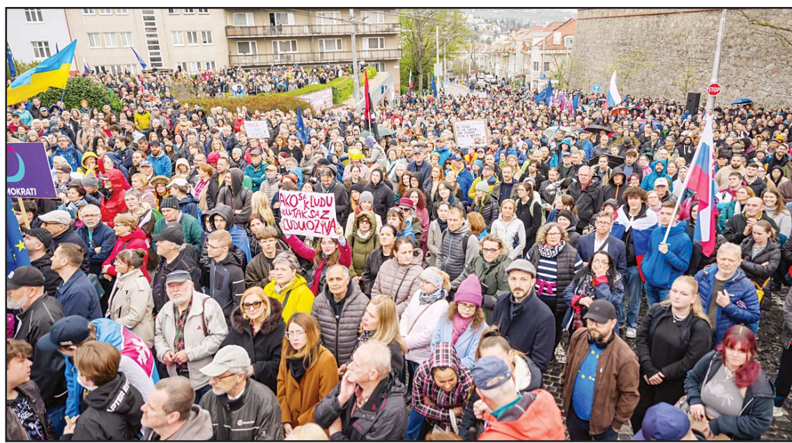
People attend a protest organised by Progressive Slovakia in front of the Parliament in Bratislava, Slovakia on April 14.

Zelenskyy said he is asking European countries to keep adding money to a fund that allows the purchase from the United States of American-made weapons for Ukraine, especially the Patriot air defense system that can stop the Russian cruise and ballistic missiles hitting civilian areas.