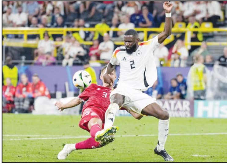
In this file photo, Germany's Antonio Rudiger, foreground, stops Denmark's Jannik Vestergaard during a round of sixteen match between Germany and Denmark at the Euro 2024 soccer tournament in Dortmund, Germany.

He was replaced by Fred Rutten, a former coach at FC Twente, PSV and