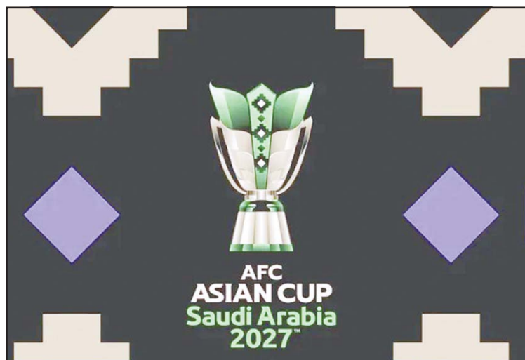
The official logo of the 2027 Asian Cup in Saudi Arabia.

The draw will place the 24 qualified teams into six groups of four, setting the pathway for the tournament, which Saudi Arabia will host for the first time from January 7 to February 5, 2027.