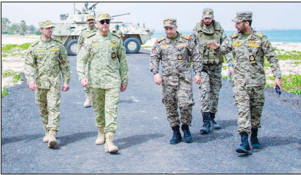
Deputy Chief of the Kuwait National Guard (KNG) Lieutenant General Hamad Al-Barjas during an inspection visit to several duty sites on Wednesday.

Scan QR code to visit the website: aljarallah.com