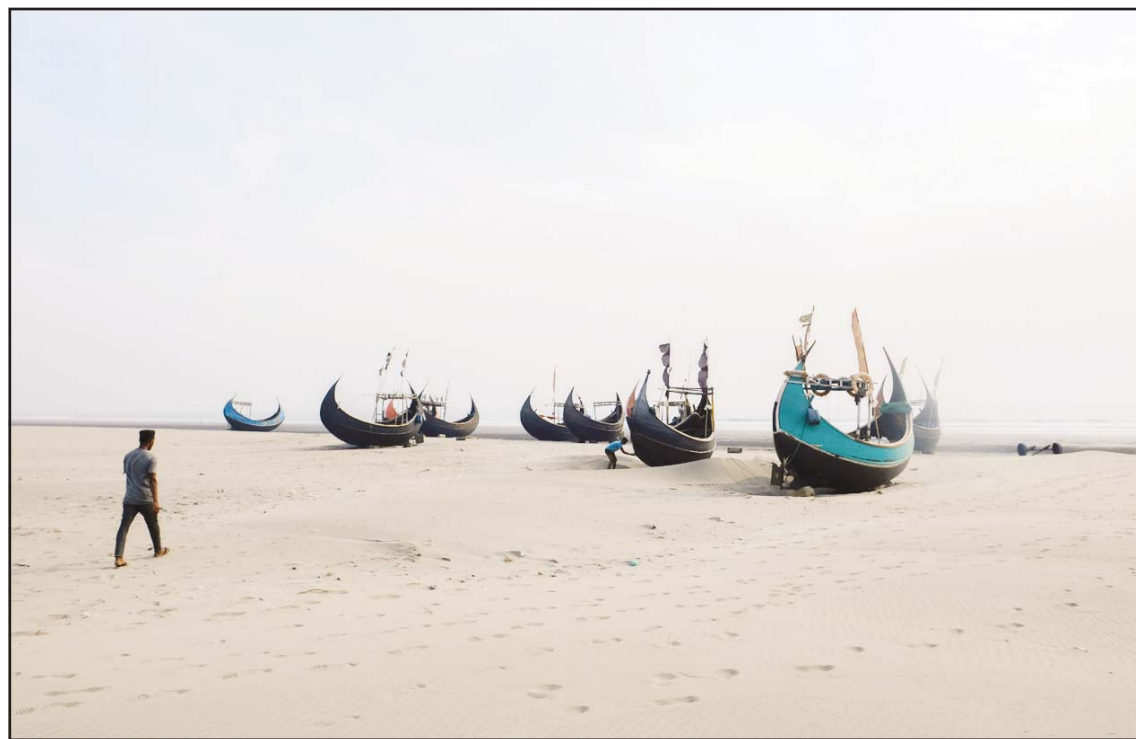
Fishing boats sit on a beach in Teknaf, Bangladesh, on March 9, 2023.

"We are going to defend Mexicans at every level," Sheinbaum said, adding that "there are many Mexicans whose only crime is not having papers."