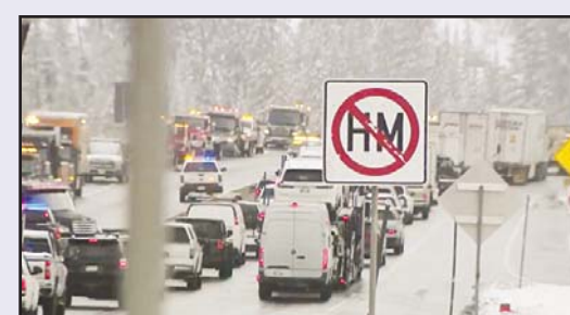
This grab from video shows traffic backed up after a multi-vehicle pile up on a section of a snowy highway in Clear Creek County, Colorado on April 14. (AP)

It was not immediately clear what caused the pileup. (AP)