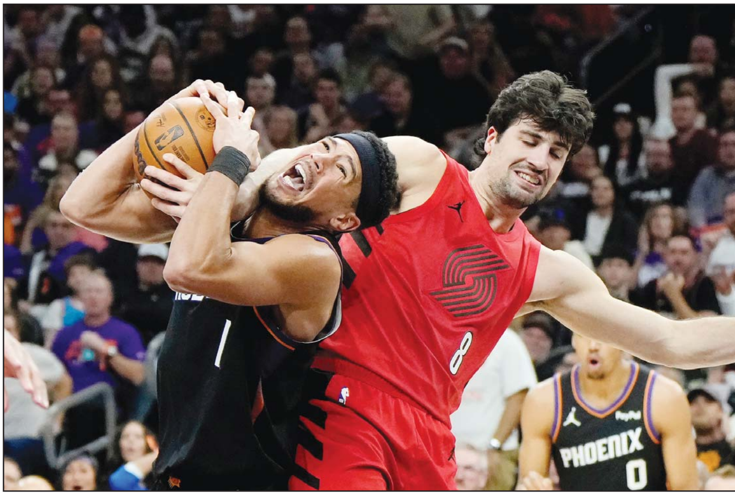
Phoenix Suns guard Devin Booker (1) gets fouled by Portland Trail Blazers forward Deni Avdija (8) during the second half of an NBA playoff tournament basketball game in Phoenix.

Bridges' block at buzzer gives Hornets win over Heat