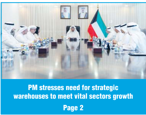
PM stresses need for strategic warehouses to meet vital sectors growth Page 2