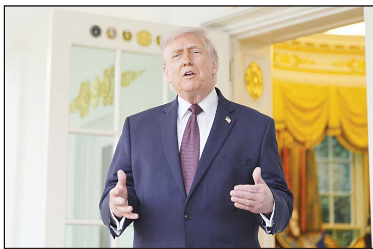
US President Donald Trump speaks outside the Oval Office of the White House on April 13, in Washington.

Despite bipartisan criticism, the chances of significant reforms dropped when Trump announced his support for the program's renewal, saying it had proven its worth in supplying information vital to recent U.S. actions