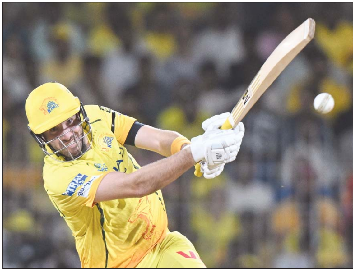
Chennai Super Kings' Jamie Overton plays a shot during the Indian Premier League cricket match between Chennai Super Kings and Kolkata Knight Riders in Chennai, India.

Ahmad then ran through the middle-order with the wickets of Rahane