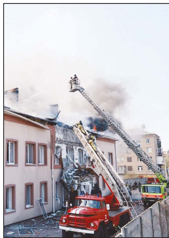
Rescue workers try to put out a fire of a building burning after a Russian drone attack on Zaporizhzhia, Ukraine on April 13.