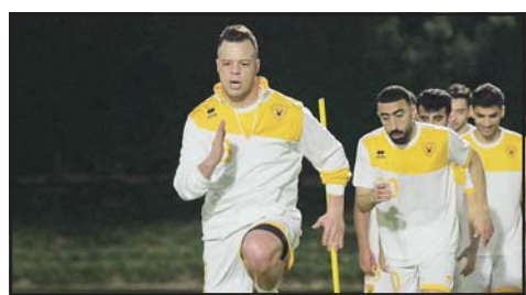
Qadsia team holds training session as part of Gulf Champions League preparations.