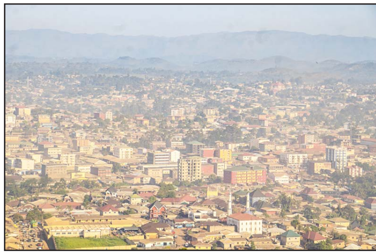
A general view of Bamenda, Cameroon on April 14.

minute change to the program, the Vatican said Wednesday. Biya, and not the prime minister, will now deliver a speech before Leo addresses government authorities and the encounter will occur in the presidential palace, not a conference center.