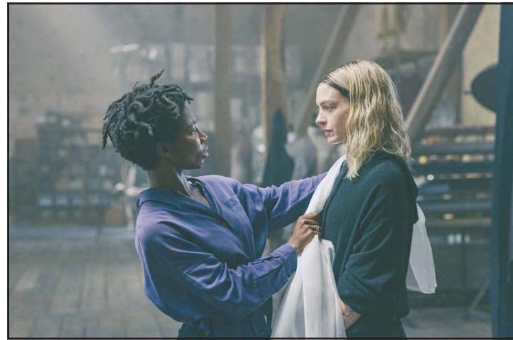
This image released by A24 shows Michaela Coel, (left), and Anne Hathaway in a scene from 'Mother Mary.'

It is, at the least, the first movie that could be called an earnest attempt to meld Taylor Swift's Eras Tour with "A Christmas Carol." Yet Lowery, whose previous films include "A Ghost Story," "The Green Knight" and "Ain't Them Bodies Saints," took real inspiration from Swift in fashioning Mother Mary, an arena-playing star whose faithful following has spiritual dimensions made explicit by her trademark halo. (The devil may wear Prada but Mother Mary doesn't.) Her songs in the film - written by Charli xcx, Jack Antonoff, and FKA twigs, who also