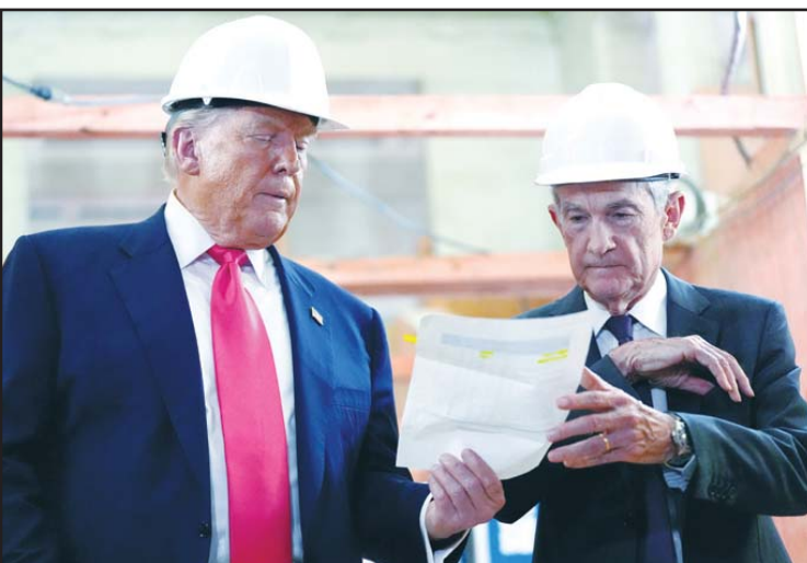
Federal Reserve Chairman Jerome Powell, right, and President Donald Trump look over a document of cost figures during a visit to the Federal Reserve, Thursday, July 24, 2025, in Washington.

On Monday, Goldman Sachs reported first-quarter net earnings of $5.6 billion, or $17.55 per share, on net revenue of $17.2 billion, as strength in its trading and investment banking businesses also lifted its results.