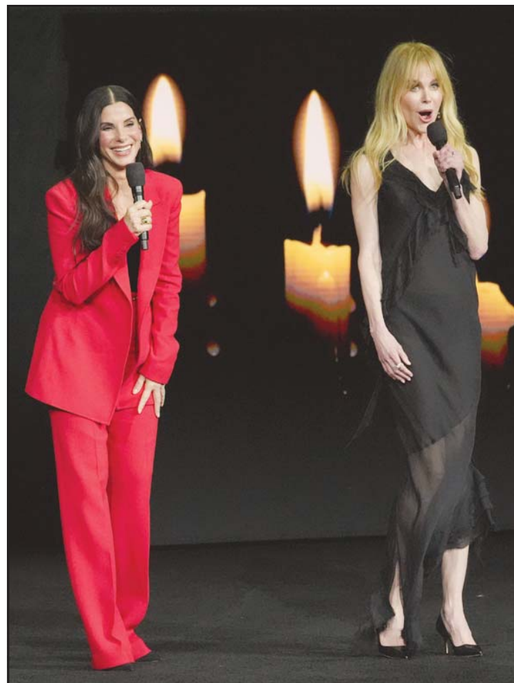
Cast members Sandra Bullock, (left), and Nicole Kidman of the upcoming film 'Practical Magic 2' speak during the Warner Bros. presentation at CinemaCon on April 14, at Caesars Palace in Las Vegas.