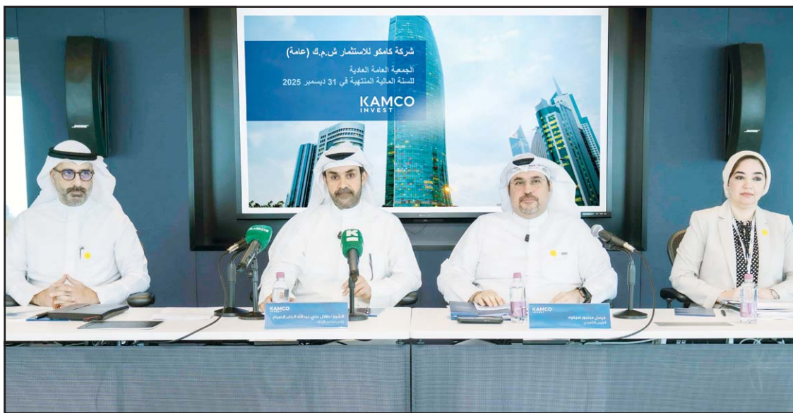
Kamco Invest's annual general meeting.