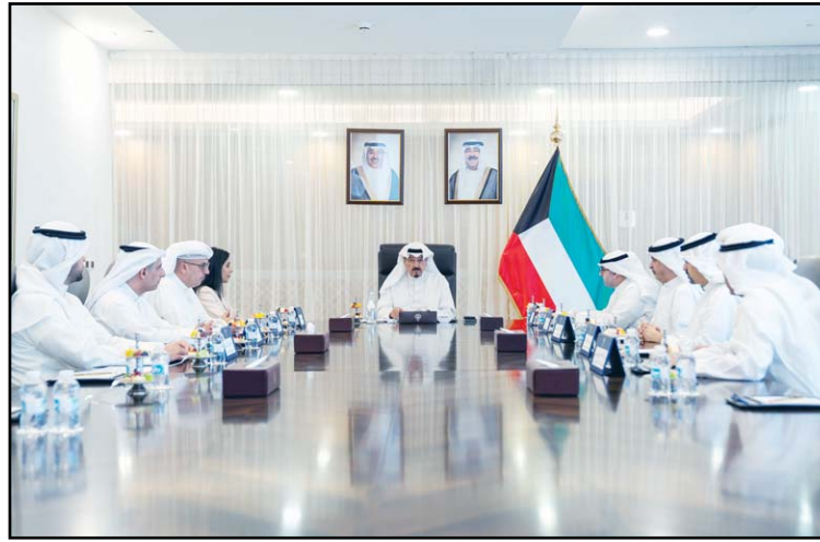
His Highness the Prime Minister Sheikh Ahmed Abdullah Al-Ahmed Al-Sabah chairs the meeting.