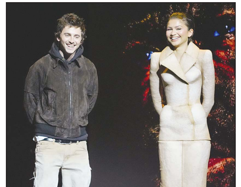
Cast members Timothée Chalamet, (left), and Zendaya of the upcoming film 'Dune: Part Three' speak during the Warner Bros. presentation at CinemaCon.

There was also a breakneck video rundown of their 2027 releases, with stars and filmmakers getting about 30 seconds each, often from set, to tease their films: Margot Robbie on her "Ocean's" prequel set in 1962; Keanu Reeves, floating in the wa-