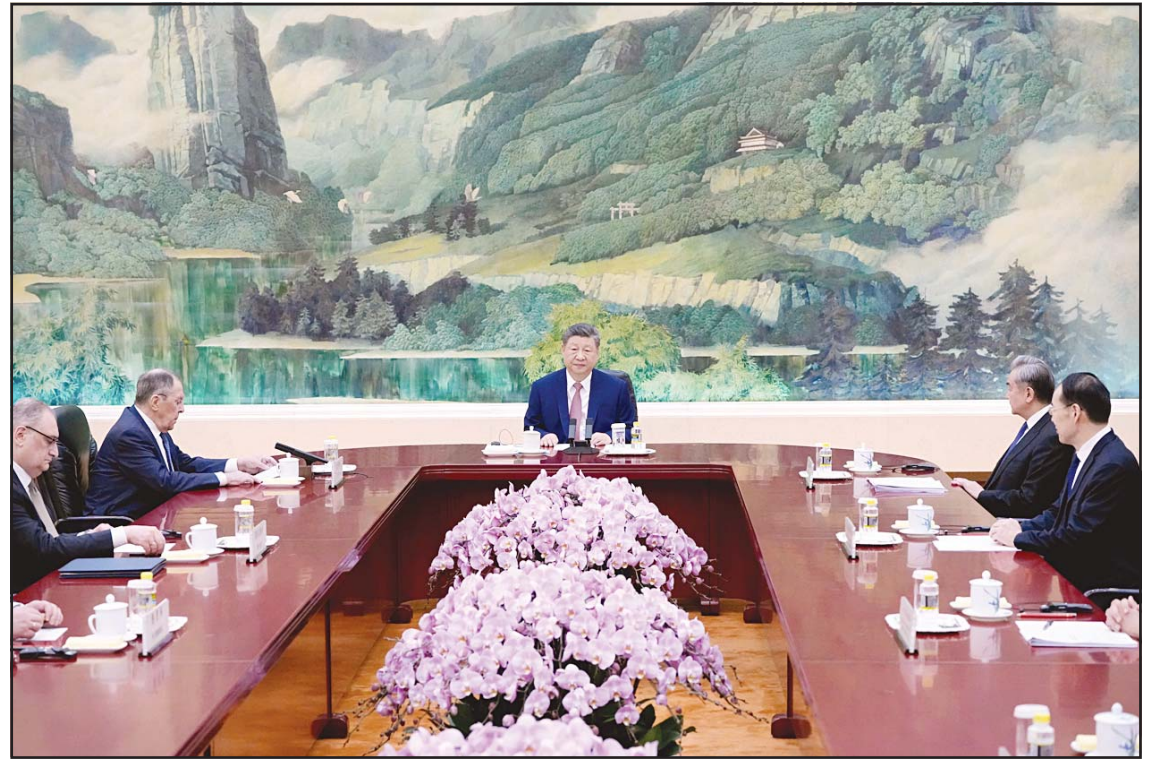
Russia's Foreign Minister Sergey Lavrov, second left, and China's President Xi Jinping, center, hold a talk at the Great Hall of the People in Beijing, China on April 15.

He said Russia is willing to work with China to uphold international fairness and justice, push their ties to achieve greater development and make greater contributions to world peace, among other goals, CCTV said.