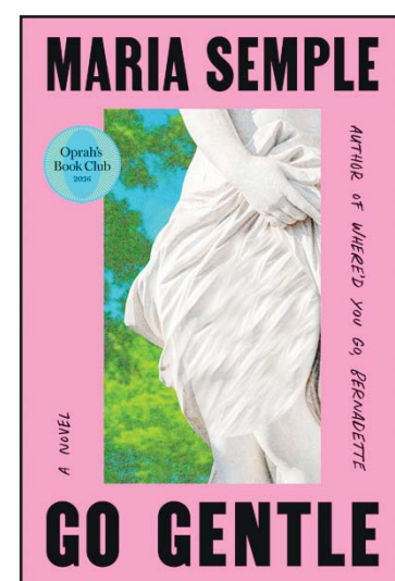
This cover image released by G.P. Putnam's Sons shows 'Go Gentle' by Maria Semple.

Semple, whose new book was published this week, is best known for such bestsellers as "Today