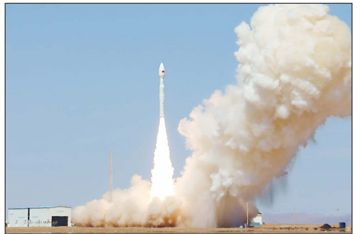
A Lijian-1 Y12 carrier rocket carrying eight satellites blasts off from the Dongfeng commercial space innovation pilot zone in northwest China, April 14.