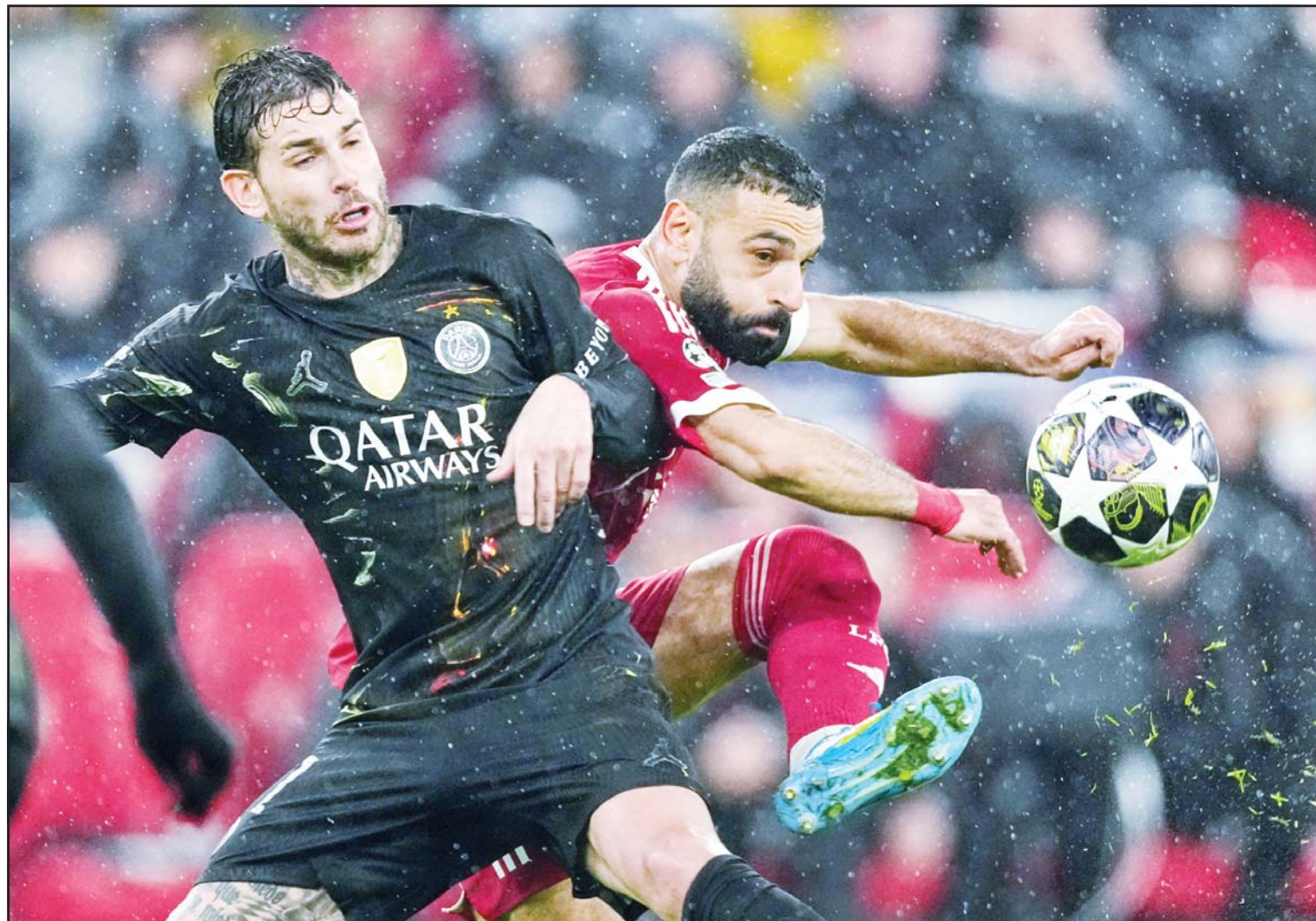
PSG's Lucas Hernandez, left, and Liverpool's Mohamed Salah battle for the ball during the Champions League quarterfinal second leg soccer match between Liverpool and Paris Saint-Germain in Liverpool, England.

The Catalan club played a man down from the 79th after defender Eric Garcia was shown a red card for fouling Alexander Sorloth to stop a breakaway.