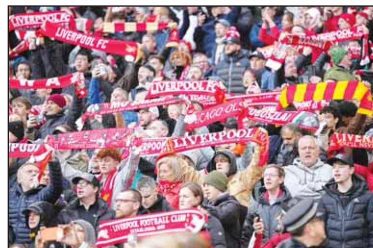
Liverpool fans cheer their team ahead of the English Premier League soccer match between Liverpool and Fulham in Liverpool, England.

Six-time champion Liverpool will be relying on the famous Anfield crowd to try to inspire another famous comeback in the fashion of its 4-0 win against Barcelona in 2019 after losing the first leg 3-0.