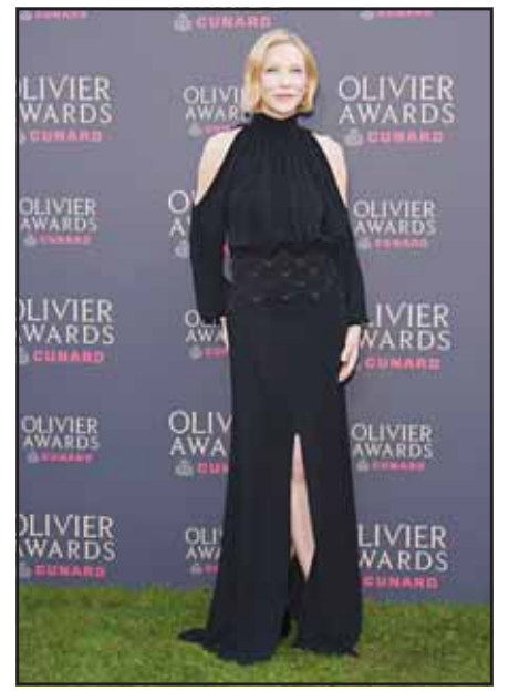
From left: Rosamund Pike, Monica Barbaro, Hayley Squires, Emilia Fox and Cate Blanchett pose for photographers upon arrival at the Olivier Awards in London, England, Sunday, April 12.