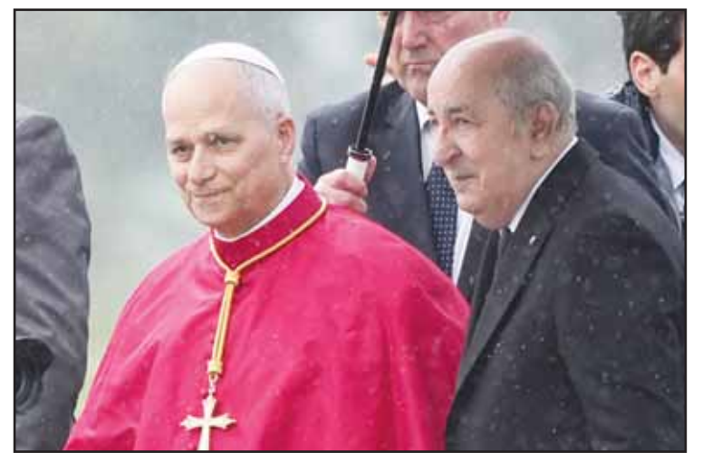
Pope Leo XIV is welcomed by Algerian President Abdelmadjid Tebboune, (right), upon his arrival at Algiers' Houari Boumediene International Airport on April 13 at the start of an 11-day apostolic journey to Africa.

Later Monday, Leo was to address Algerian authorities and visit the city's