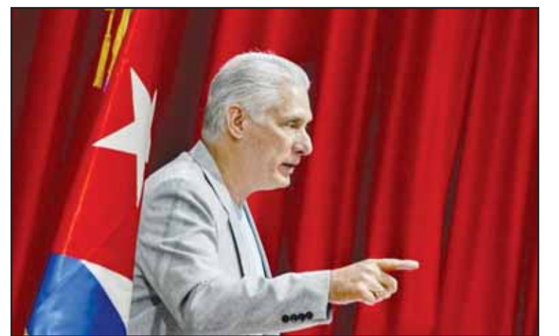
Cuban President Miguel Diaz-Canel delivers a welcome speech to participants of the 'Nuestra America' or 'Our America Convoy' at the Convention Palace in Havana, Cuba, on March 20.

Cuba blames a US energy blockade for its deepening woes, with a lack of petroleum affecting the island's health