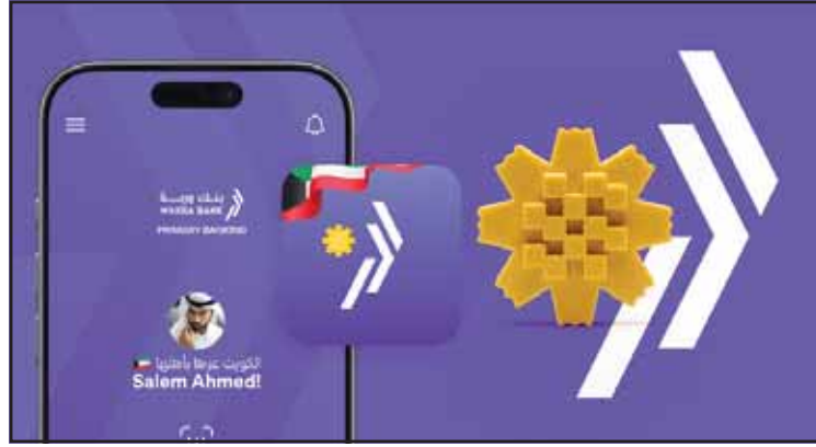
Primary Banking Al Arfaj flower