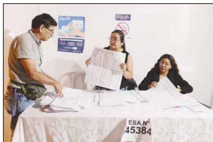
Election officials count ballots during general elections in Lima, Peru on April 12.

Trump on Sunday said the US Navy would begin a blockade of ships entering or leaving the Strait of Hormuz, after US-Iran ceasefire talks in Pakistan ended without an agreement. Trump wants to weaken Iran's key leverage in the war after demanding that it reopen the crucial waterway through which 20% of global oil normally passes. US Central Command said the blockade would involve Iranian ports.