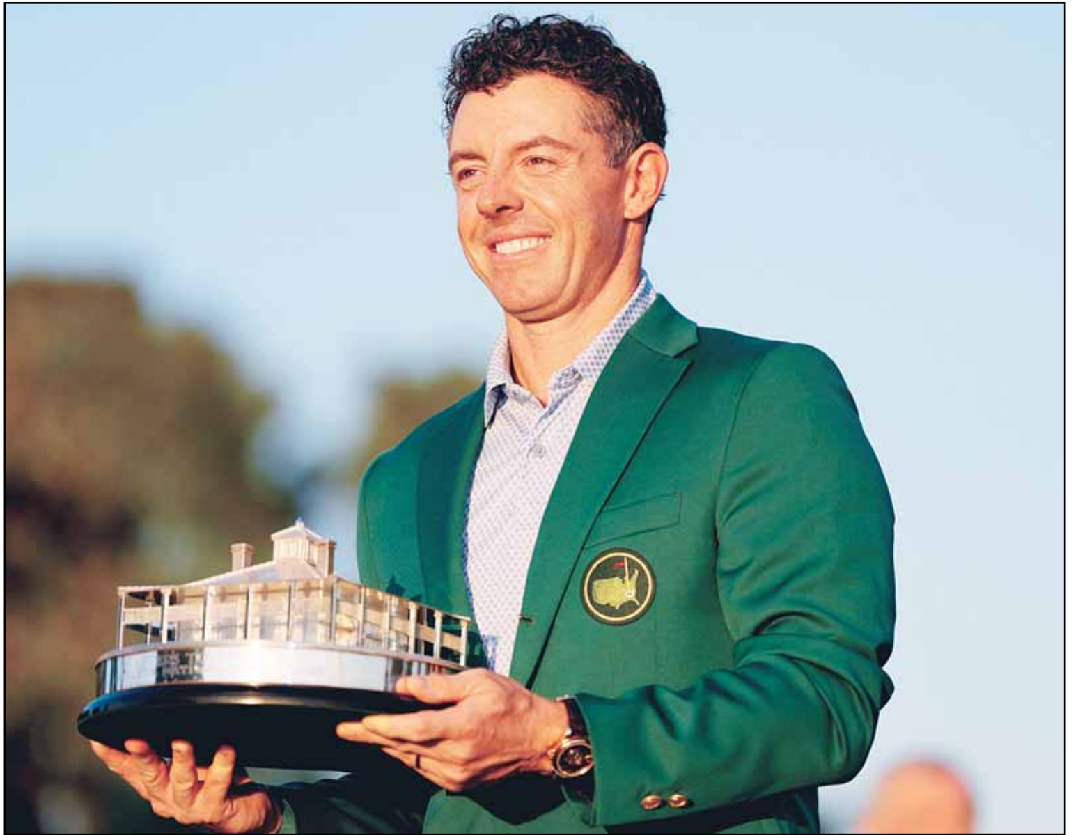
Rory McIlroy, of Northern Ireland, holds the trophy after winning the Masters golf tournament at the Augusta National Golf Club in Augusta, Ga.

As for Scheffler, the world's No. 1 player was in position to shatter the Masters record with the largest 36-hole comeback in history. He was 12 behind going into the weekend. He was two shots behind as he approached the turn. But he ran off 11 straight pars, and that wasn't going to cut it during a final round with accessible pins to create excitement.