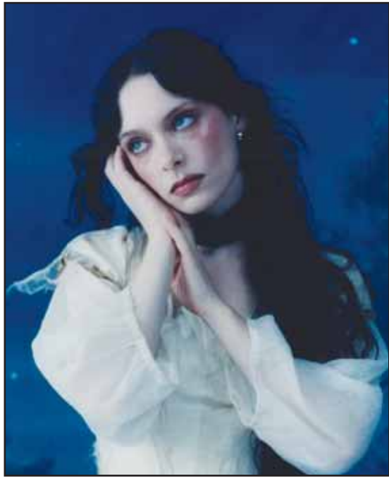
This cover image released by Polydor shows 'Cruel World.' (AP)