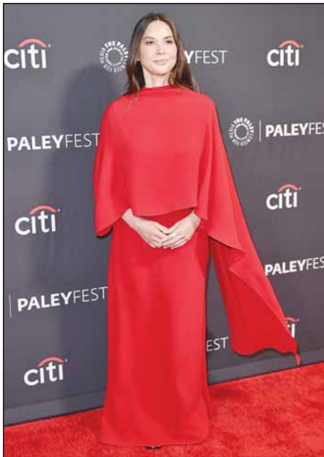
Olivia Munn arrives at a PaleyFest screening of 'Your Friends and Neighbors' on Saturday, April 11, at Dolby Theatre in Los Angeles.