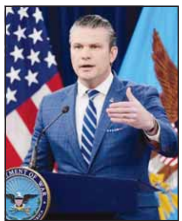
Defense Secretary Pete Hegseth speaks to members of the media during a press briefing at the Pentagon in Washington on April 8.

US Southern Command stated on X that it notified the US Coast Guard