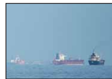
Oil tankers and cargo ships line up in the Strait of Hormuz as seen from Khor Fakkan, United Arab Emirates, Wednesday, March 11, 2026.

He added that the armed forces are closely monitoring regional developments within the framework