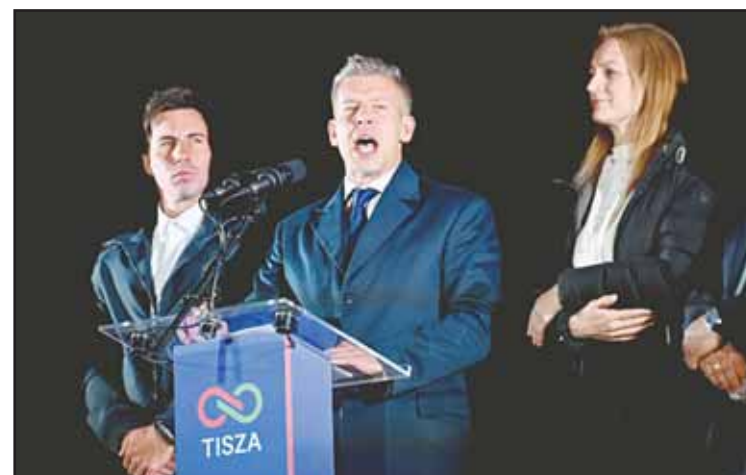
Peter Magyar, leader of the opposition Tisza party, speaks to his supporters following the announcement of the partial results of the parliamentary election, in Budapest, Hungary on April 12.

"All Hungarians know that this is a shared victory. Our homeland made up