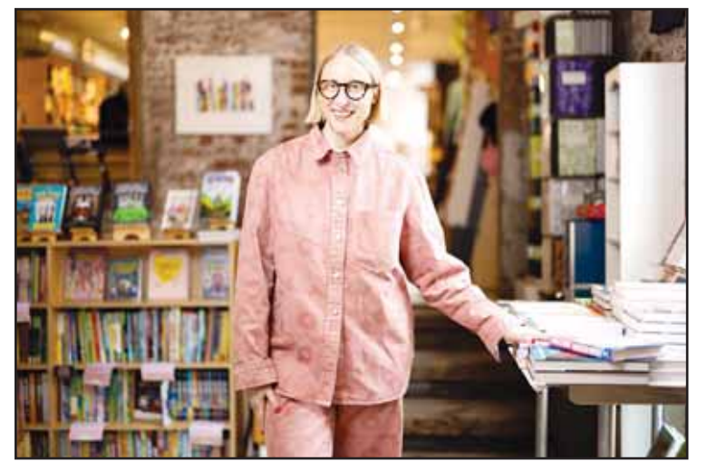
Author Emma Straub poses for a portrait in New York on Monday, March 23, 2026.

AP: What did you think when you got there?