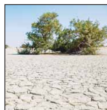
Amid a drought, a lake that should be full now, remains dry Thursday, Jan. 8, 2026, outside Afcadde, Ethiopia.

perfumes it helps to create, which are marketed by well-known fashion brands like Tom Ford, Comme des Garçons and Jo Malone, and sold at prices as high as $500 a bottle.