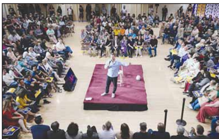
California gubernatorial candidate Rep. Eric Swalwell, D-Calif., speaks at a town hall meeting in Sacramento, Calif on April 7.

Billionaire hedge fund manager-turned-liberal activist Tom Steyer said he secured the support of Rep. Jared