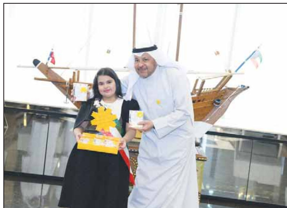
A girl student presents a model of the 'Al-Arfaj flower' to Farwaniya Governor Sheikh Athbi Nasser Al-Athbi Al-Sabah.

The sources emphasized that some calls may seem ordinary, but they could be the beginning of an organized cyber fraud operation.