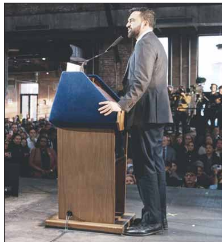
New York City Mayor Zohran Mamdani speaks during an address marking his first 100 days in office at the Knockdown Center on April 12 in New York.

Still, Sliwa, who hammered Mamdani during the campaign but recently appeared in a comedy skit with the mayor during the City Hall press corps' annual roast, appeared to give Mamdani some credit, even if it came with a caveat.