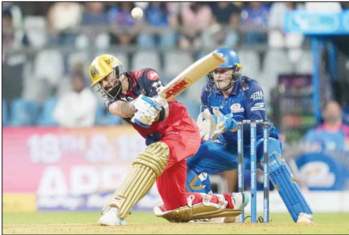
Royal Challengers Bengaluru's Virat Kohli plays a shot during the Indian Premier League cricket match between Mumbai Indians and Royal Challengers Bengaluru, in Mumbai, India.

Kohli hits 50 as Bengaluru outpowers Mumbai