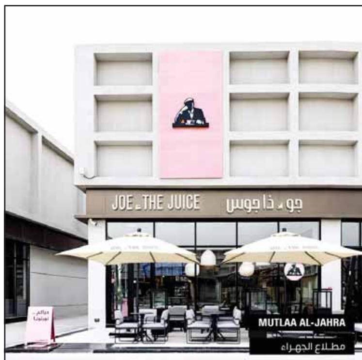
AAW Light Food launches new Joe & The Juice in Jahra.

The Jahra location joins a network of Joe & The Juice stores across Kuwait, including Argania Complex in Shuwaikh, Argan Square in Salmiya, The Walk Mall in Ardiya, Al Andalus Complex in Hawally, The Warehouse in South Sabahiya, Sahara Golf Resort next to the Hunting and Equestrian Club, the GUST campus in West Mishref, Al Khiran Mall, Arraya Centre in Kuwait City, Kuwait International Airport Terminal 1 – Arrivals, Murouj near the Hunting and Equestrian Club, Vibes Complex in Abu Al Hasaniya, Bnaider Resort, which operates 24 hours a day from Thursday to Saturday, 360 Mall, Mishref, Al Shaheed Park, and Hessah Hub in the Hessah Al Mubarak District.