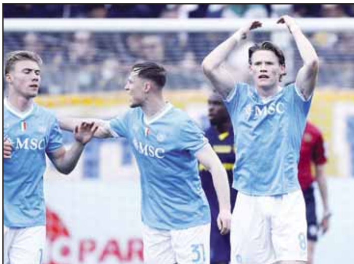
Napoli's Scott McTominay, right, celebrates after scoring the equalizing goal during the Serie A soccer match between Parma and Napoli, in Parma, Italy.

In other game, Nice drew 1-1 at home to fellow struggler Le Havre. Both sides are hovering just above the relegation zone.