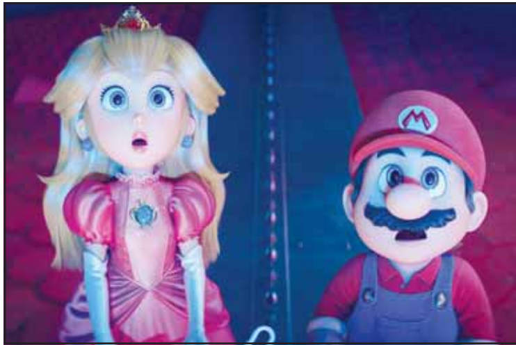
This image released by Universal Pictures shows Princess Peach, voiced by Anya Taylor-Joy, (left), and Mario, voiced by Chris Pratt, in a scene from 'The Super Mario Galaxy Movie.'