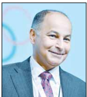
World Aquatics President Husain Al Musallam

Its decision applies only to its own events like the world championships but could add momentum within the Olympic world for a full return of