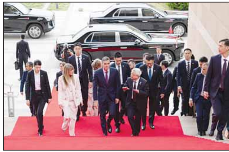
Spanish Prime Minister Pedro Sanchez, center left, and his wife Begona Gomez arrive at the University of Chinese Academy of Sciences in Beijing on April 13.

Spain says it wants to diversify its political relations with the world's large powers, including Beijing. Spanish officials have said the gov-