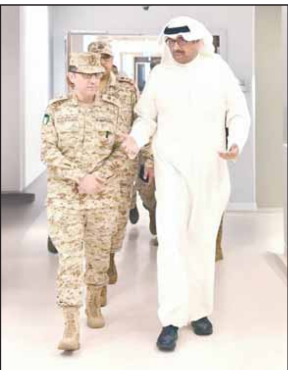
Ministry of Defense photos show Kuwait's Defense Minister visiting an injured service member.