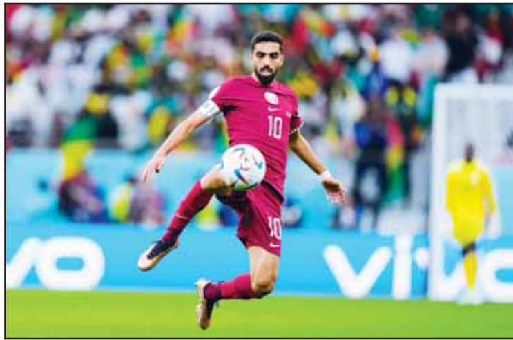
In this file photo, Qatar's Hassan Al-Haydos controls the ball during a World Cup Group A soccer match against Senegal at the Al Thumama Stadium in Doha, Qatar.

"I've just tried to bring a style of football that accesses and exposes their raw abilities and commitment at the highest level of how to play the game, and I think that they've enjoyed it, I've enjoyed it, and I think people watching the team have enjoyed it," Marsch said.