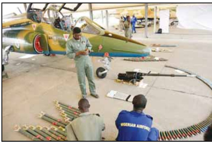
In this photo taken on April 22, 2017, Nigerian Air Force officers display ammunition next to a fighter jet during an event in Makurdi, Nigeria.

geria, where the military often conducts air raids to battle armed groups who control vast forest enclaves. At least 500 civilians have died since 2017 in such misfires, according to an AP tally of reported deaths. Security analysts point to loopholes in intelligence gathering as well as insufficient coordination between ground troops, air assets and stakeholders.