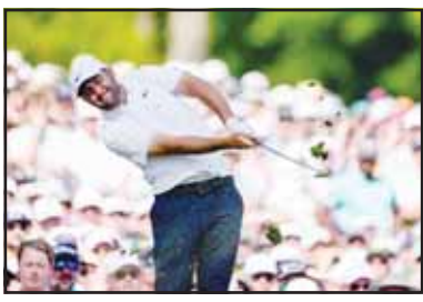
Scottie Scheffler hits his tee shot on the 12th hole during the final round of the Masters golf tournament at the Augusta National Golf Club in Augusta, Ga.