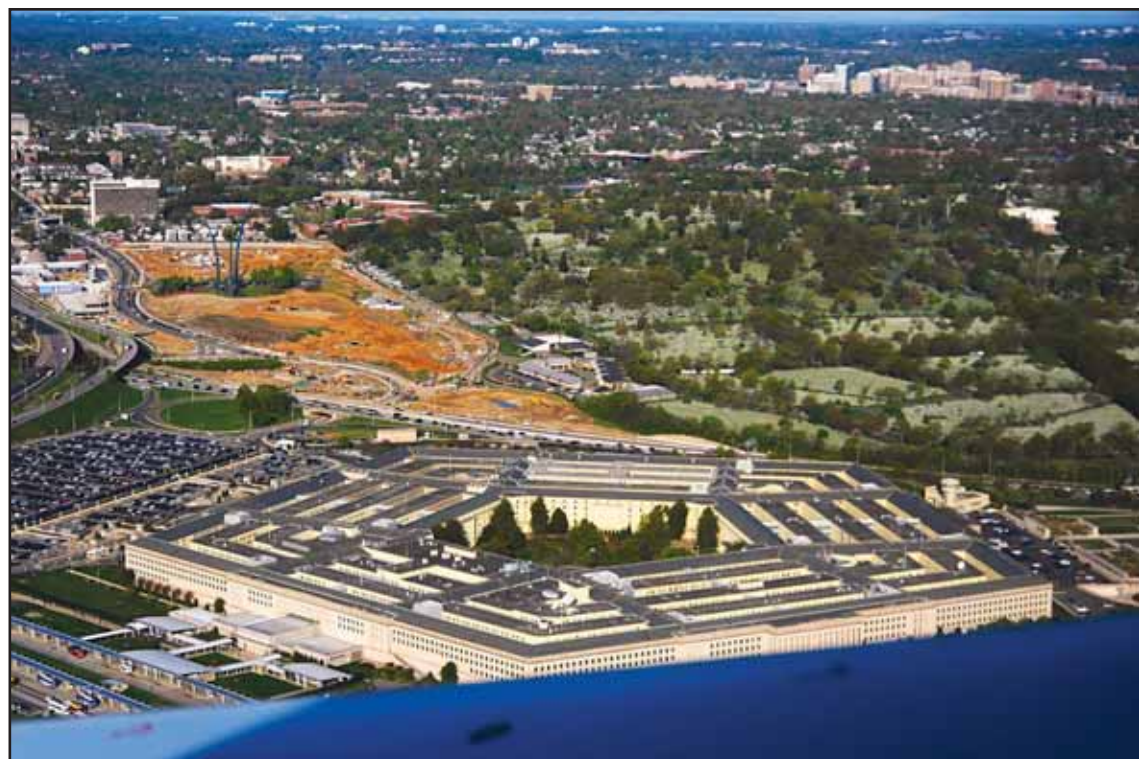
The Pentagon is seen from an airplane on April 7, in Washington.

"You hear that Cuba is next, that Cuba is going to be next, that there are, there's a way out, that they're going to take over Cuba," he said. "So, from the position of responsibility within the leadership of the country, that is a warning. And we need to responsibly protect our people, protect our project and protect our country."