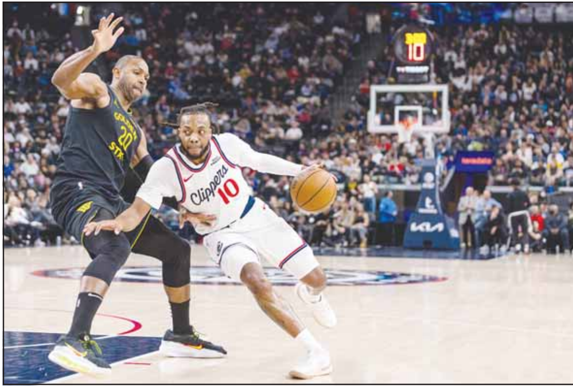
Los Angeles Clippers guard Darius Garland (10) drives against Golden State Warriors center Al Horford (20) during the first half of an NBA basketball game in Inglewood, Calif.