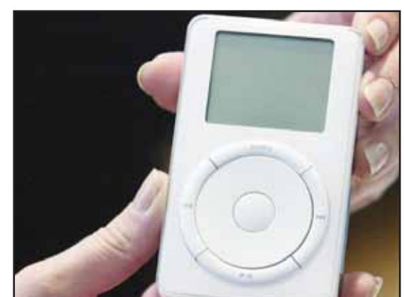
An iPod is displayed after its introduction by Apple CEO Steve Jobs during a news conference, Oct. 23, 2001, in Cupertino, Calif.

If charging doesn't revive it, the battery might need re-