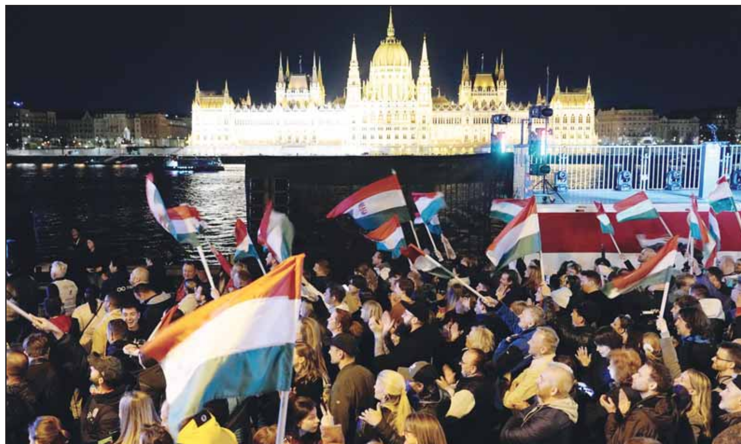
Supporters of Peter Magyar, the leader of the opposition Tisza party celebrate after a parliamentary election in Budapest, Hungary on April 12.