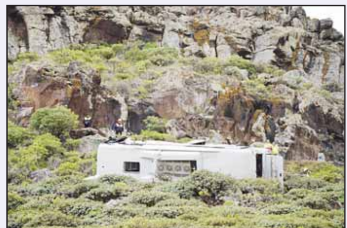
Rescuers work at the scene of a bus crash near San Sebastian de La Gomera, in Spain's Canary Islands on April 10.

"Diego Garcia is a key strategic military asset for both the UK and the US," the British government said in a statement. "Ensuring its long-term operational security is and will continue to be our priority - it is the entire reason for the deal.