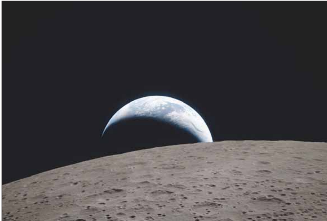
The Artemis II crew captured this view of an Earthset on Monday, April 6, as they flew around the Moon.

Myrrh harvesting is threatened. While adult trees are generally healthy, they are producing less resin. And fewer young trees are surviving.