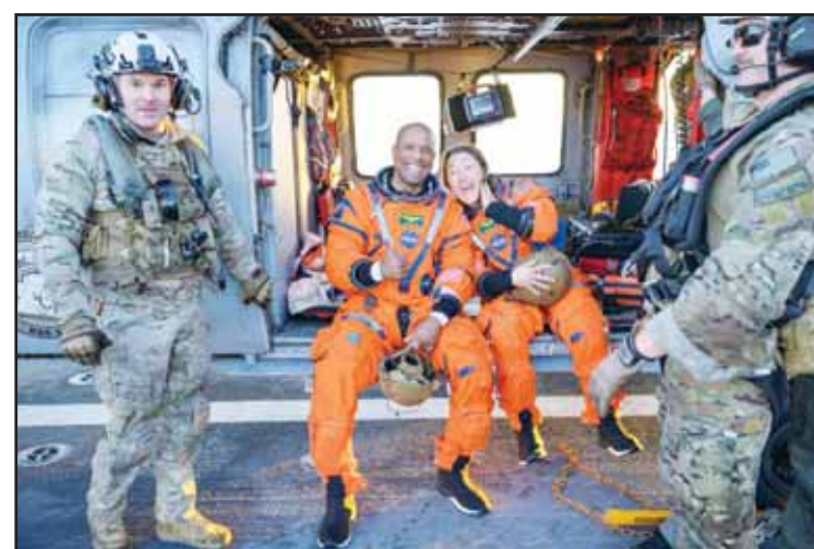
In this photo provided by NASA, its astronauts Victor Glover, Artemis II pilot, (left), and Christina Koch, Artemis II mission specialist, sit on a Navy MH-60 Seahawk on the flight deck of USS John P. Murtha after they and fellow crewmates were extracted from their Orion spacecraft after splashdown, Friday, April 10, in the Pacific Ocean off the coast of California.

Watching the drama unfold nearly 2,000 miles (3,200 kilometers) away, the astronauts' families huddled in Mission