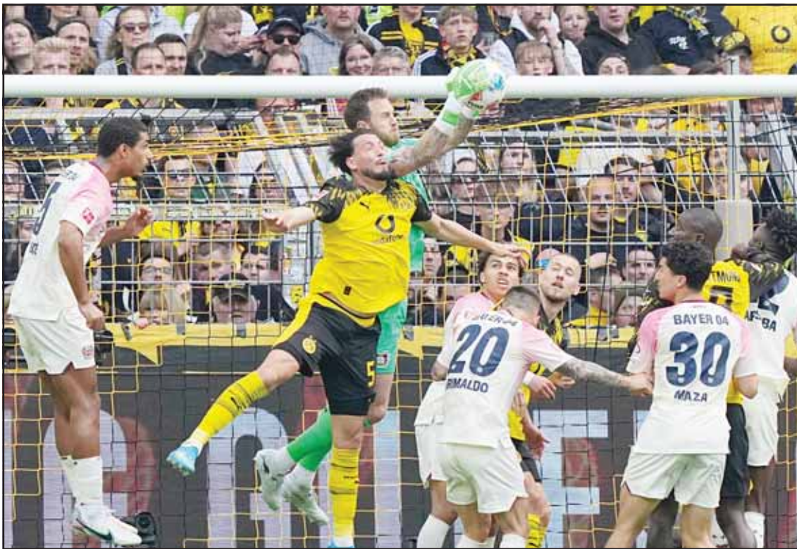
Leverkusen's goalkeeper Mark Flekken catches the ball as he challenges with Dortmund's Ramy Bensebaini during the German Bundesliga soccer match between Borussia Dortmund and Bayer Leverkusen in Dortmund, Germany.

Leverkusen edges Dortmund to boost top-4 push