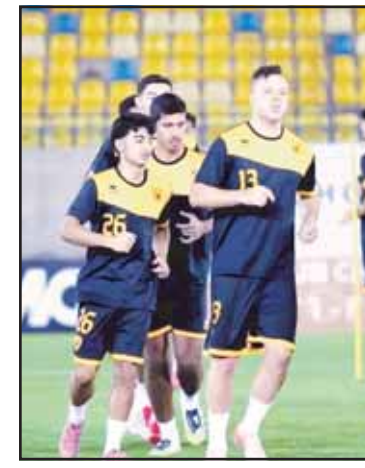
Al-Qadsia players intensify training in Doha.

Al-Qadsia's departure was delayed due to visa issues affecting several members of the technical staff and foreign players, shortening the team's preparation window. As a result, the coaching staff, led by Nabil Maaloul, has requested just one friendly match