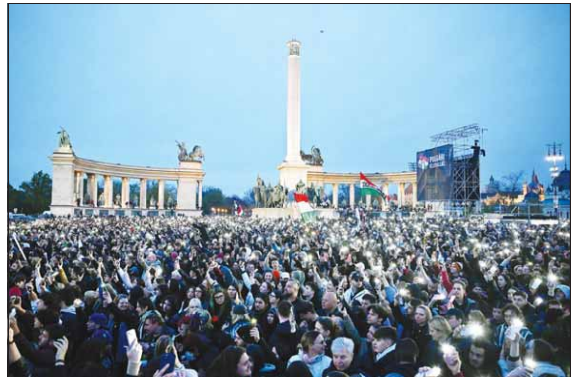
People hold up their lit phones during an anti-government concert featuring dozens of the country's most popular performers in Budapest, Hungary on April 10.

An emergency response team has been set up at the site, and an investigation is underway, local authorities said.