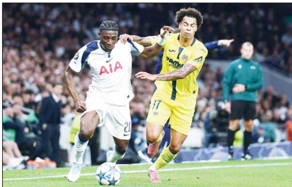
In this file photo, Tottenham's Mohammed Kudus, left, and Villarreal's Tajon Buchanan fight for the ball during the Champions League soccer match between Tottenham and Villarreal in London.

A new permanent coach will most likely be decided after Gravina's replacement is appointed, with elections called for June 22. Napoli coach Antonio Conte, who already led Italy at the European Championship a decade ago, is favored to return. Others being mentioned are Roberto Mancini, Simone Inzaghi and Massimiliano Allegri.