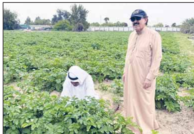
Editor-in-Chief of Arab Times and Al-Seyassah Ahmed Al-Jarallah having a tour of a vegetable garden.

The dialogue between the farmers of Wafra and Al-Jarallah was focused on the importance of utilizing Kuwait's winter rains, as well as the water discharged from desalination plants. Many Al-Wafra farmers are currently forced to rely on this water for irrigation due to increased groundwater salinity and insufficient pumping capacity of treated water.