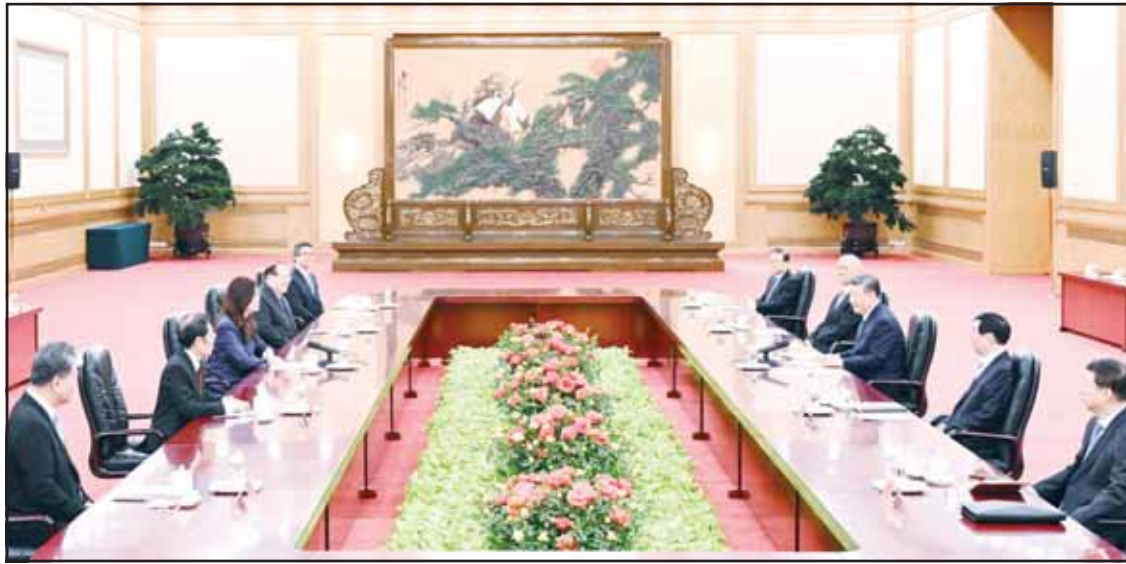
Xi Jinping, General Secretary of the Communist Party of China (CPC) Central Committee, meets with a delegation of the Chinese Kuomintang (KMT) party led by its Chairwoman Cheng Li-wun in Beijing, capital of China on April 10.

Sihamoni's father, King Norodom Sihanouk, who also received Chinese medical care, was diagnosed with prostate cancer as early as 1993, but lived until 2012, when he died at age 89 in Beijing.