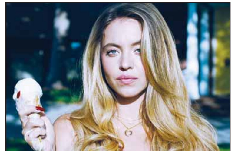
This image released by HBO shows Sydney Sweeney from the series 'Euphoria.'