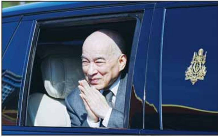
Cambodia's King Norodom Sihamoni greets from a vehicle after the King presided over the country's 72nd Independence Day ceremony at the Independence Monument in Phnom Penh Cambodia, Nov 9, 2025.