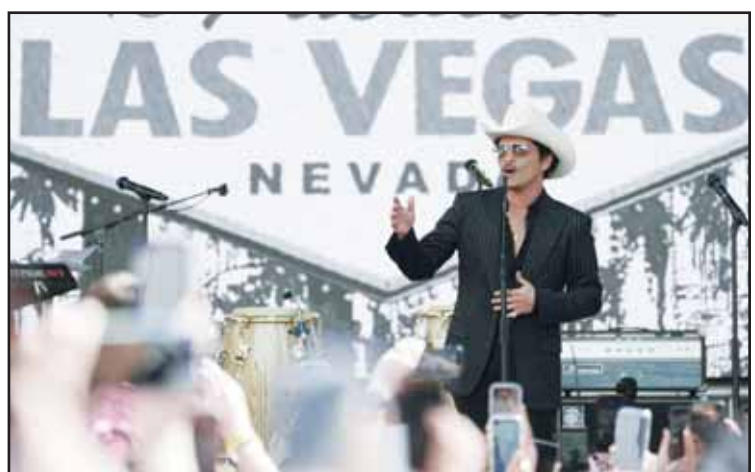
Bruno Mars performs on Bruno Mars Day on Friday, April 10, in Las Vegas.

The singer pledged to donate $1 million to the Las Vegas Children's Hospital, with MGM Grand, his partner, matching his donation. The celebration ended with a brief performance by him and his band "The Hooligans," a taste of what fans can expect at Allegiant Stadium later that night.