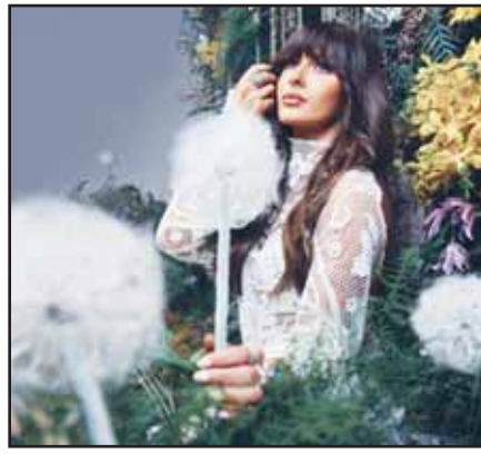
This cover image released by SAWGOD/Columbia shows 'Dandelion' by Ella Langley. (AP)

It's not just "Choosin' Texas," though it