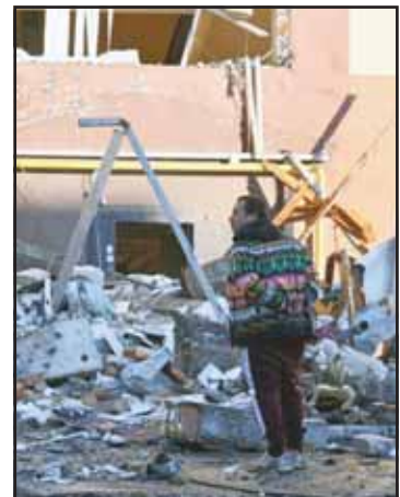
A local man stands in front of a residential building which was heavily damaged after a Russian strike in Odesa, Ukraine on April 6.

Previous ceasefire attempts have had little impact, with both sides accusing each other of violations.