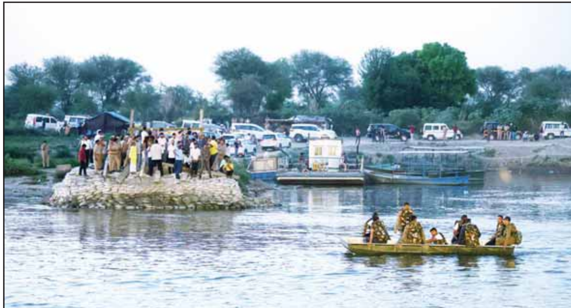
Rescuers search the site where a boat carrying pilgrims capsized in the Yamuna river in Vrindavan, India on April 10.

The relationship between North Korea and China has often been described as being "as close as lips and teeth," but their ties have been questioned in recent years.