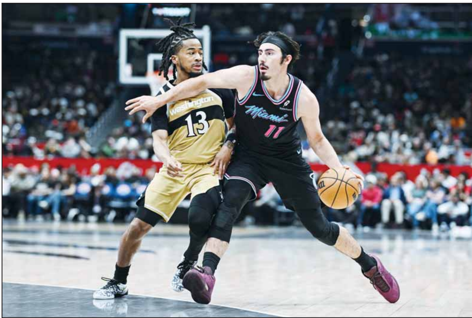
Miami Heat forward Jaime Jaquez Jr. (11) handles the ball as Washington Wizards guard Sharife Cooper (13) defends during the second half of an NBA basketball game in Washington.

The Celtics' 29 3s equal their total from Oct. 22, 2024 against the Knicks. The Memphis Grizzlies (April 6 vs. Cleveland) and Milwaukee Bucks (Dec. 29, 2020 at Miami)