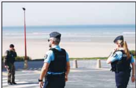
Policemen stand guard after a migrant taxi-boat accident, in Equihen-Plage, northern France on April 9.

Belarus detains 52 at architectural firm: Belarusian authorities detained more than 50 employees of an architectural firm in the country's largest single raid this year, human rights activists said Friday, as part of what they described as a new escalation of repression under