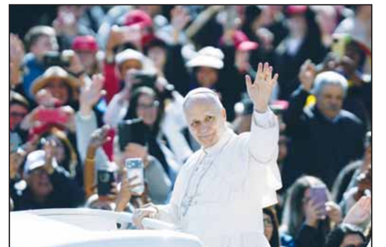
Pope Leo XIV arrives for his weekly general audience in St. Peter's Square, at the Vatican on April 8.

Leaders have used religion to justify their actions in the war. US officials and especially Defense Secretary Pete Hegseth have invoked their Christian faith to justify the conflict and cast the