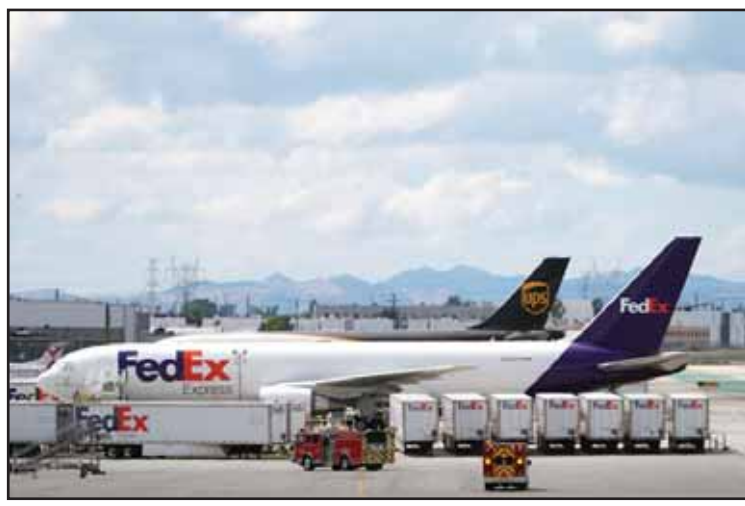
Federal Express and UPS cargo planes are parked at Hollywood Burbank Airport in Burbank, California, Friday, April 10, 2026.

Both United and American are also moving beyond add-ons to adjust pricing. United said last week it is bringing the "pay for what you