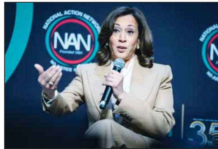
Kamala Harris, former US vice president and 2024 presidential candidate, speaks during the National Action Network (NAN) Convention in New York on April 10.

Harris, the nation's first Black female vice president and the Democrats' presidential nominee in 2024, earned the only standing ovation and the largest crowd of any other 2028