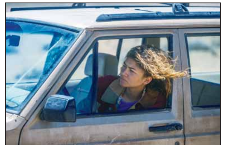
This image released by HBO shows Zendaya from the series 'Euphoria.'

Before her breakout "Euphoria" role, for which she earned an Emmy