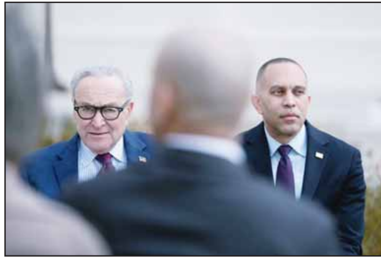
US Sen Chuck Schumer, D-NY, and Rep Hakeem Jeffries, D-NY, attend an event marking the installation of a plaque commemorating Jan 6 at the US Capitol on March 25 in Washington.

House Democrats plan to use a brief session of the House on Thursday to call for the quick passage of the war powers legislation, but Republican leadership is expected to quash that attempt.