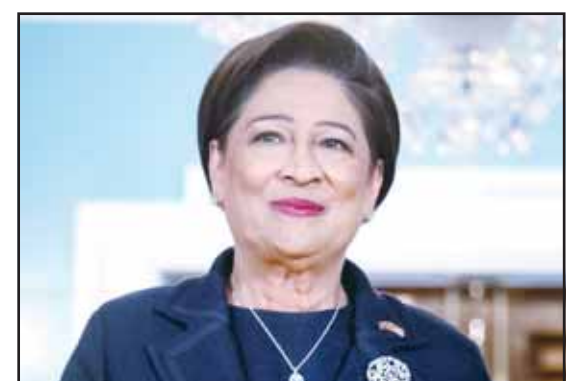
Trinidad and Tobago Prime Minister Kamla Persad-Bissessar stands at the State Department in Washington on Sept 30, 2025.

Persad-Bissessar has repeatedly expressed her administration's deep dissatisfaction with the bloc's current operations, saying she remains puzzled why the region aligned with Venezuela and Maduro rather than supporting the US position.