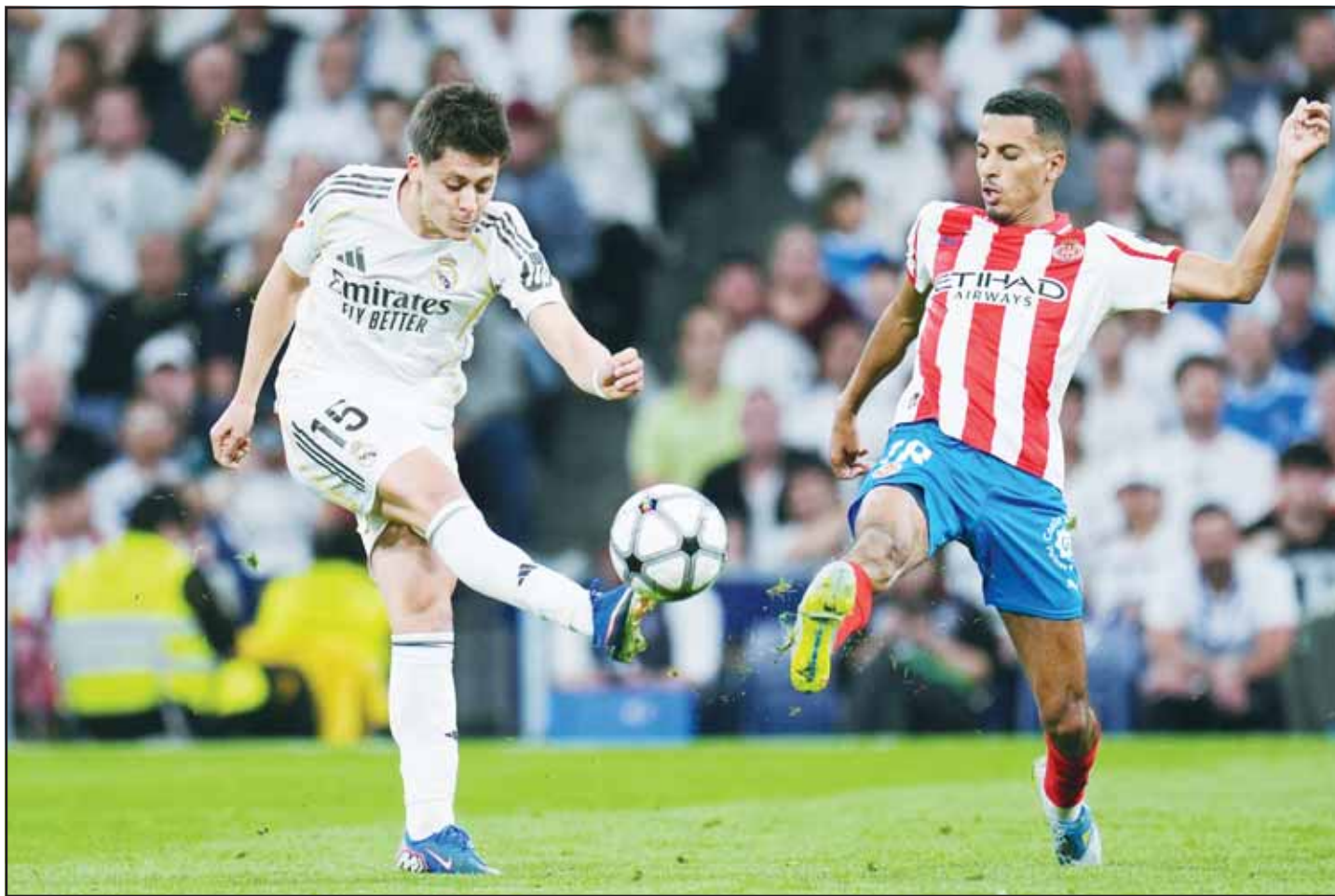
Real Madrid's Arda Guler, left, fights for the ball with Girona's Azzedine Ounahi during a Spanish La Liga soccer match between Real Madrid and Girona in Madrid, Spain.