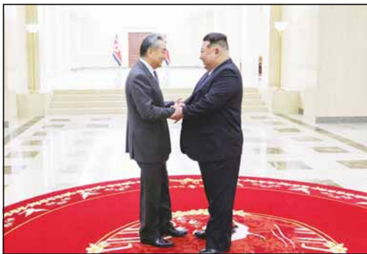
In this photo provided by the North Korean government, leader Kim Jong Un, (right), meets Chinese Foreign Minister Wang Yi in Pyongyang, North Korea on April 10.

Kim joined Russian President Vladimir Putin at a World War II ceremony in Beijing in September and held his first summit with Xi Jinping in six years, moves that supported his efforts to portray North Korea as