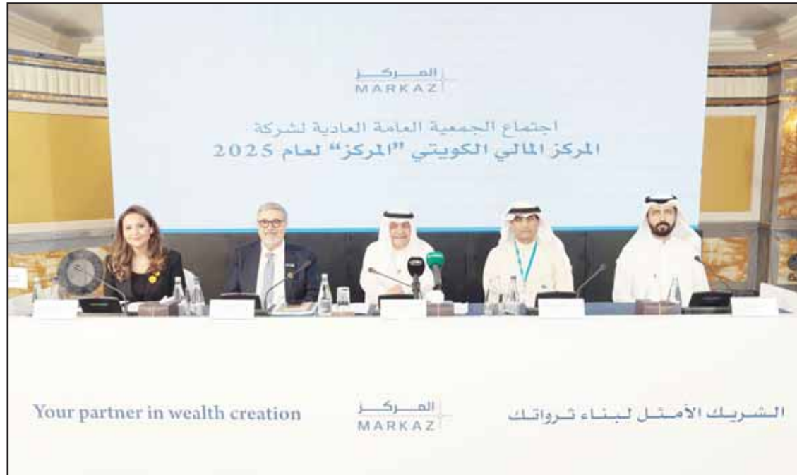
Markaz's Ordinary Annual General Assembly.

The Chairman stated: "Drawing on more than five decades of experience and innovation, Markaz continues to strengthen its core business lines across asset management, investment banking, and real estate as part of its growth strategy. Markaz also continues to broaden its investment product offering, enabling investors to access global opportunities across public and private asset classes. Among these initiatives is the launch of the Private Real Assets Strategy for qualified and professional investors. During 2025, Markaz continued to enhance its digital platforms, improving operational quality, efficiency, and client experience. Furthermore, sustainability principles remain integral to Markaz values and during the year, Markaz further strengthened its corporate social responsibility initiatives, reinforcing its commitment to lasting community impact in Kuwait and beyond."