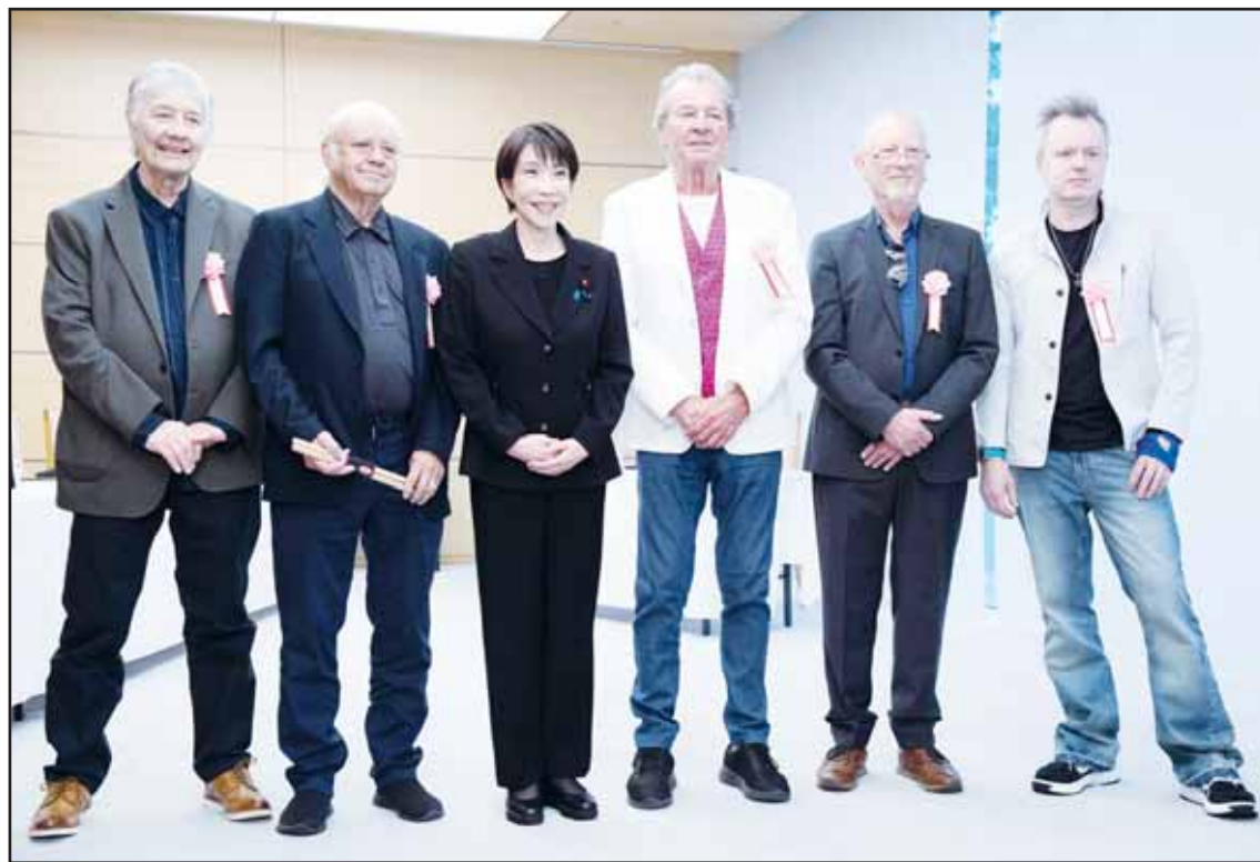
Japan's Prime Minister Sanae Takaichi, (third left), poses with members of British rock band Deep Purple, Don Airey, (left), Ian Paice, (second left), Ian Gillan, (fourth left), Roger Glover, (second right) and Simon McBrideat, (right), during their meeting at the Prime Minister's Office in Tokyo, Friday, April 10.

Two prominent American directors will debut documentaries in special screenings: Steven Soderbergh with "John Lennon: The Last Interview" and Ron Howard with "Avedon," about the photographer Richard Avedon.