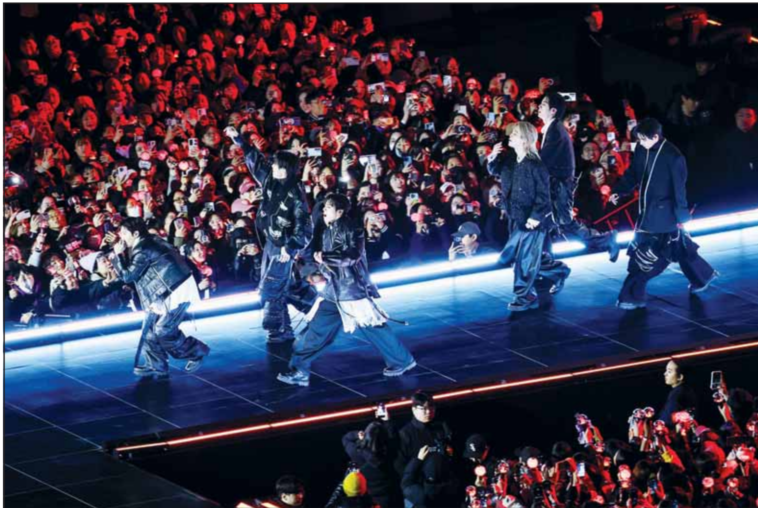
K-pop group BTS perform during 'BTS The Comeback Live Arirang' concert in central Seoul, South Korea, March 21, 2026.