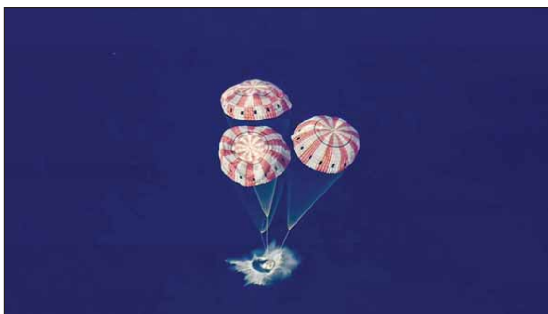
In this image from video provided by NASA, the Artemis II Orion capsule splashes down in the Pacific Ocean, on Friday, April 10. (AP)

Finally, one of our loftier goals is to genetically engineer eye-colonizing bacteria to act as long-term delivery vehicles to the surface of the eye. In the gut, genetically modified bacteria have been shown to alleviate diseases like colitis. (AP)