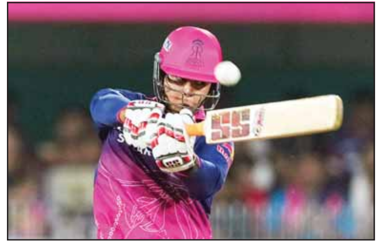
Rajasthan Royals' Vaibhav Sooryavanshi plays a shot during the Indian Premier League cricket match between Royal Challengers Bengaluru and Rajasthan Royals in Guwahati, India.

"The way we started in the powerplay, to get to 200 is a positive sign for us," Patidar said. "The way their batters, especially Vaibhav, batted in the powerplay, it made the difference."