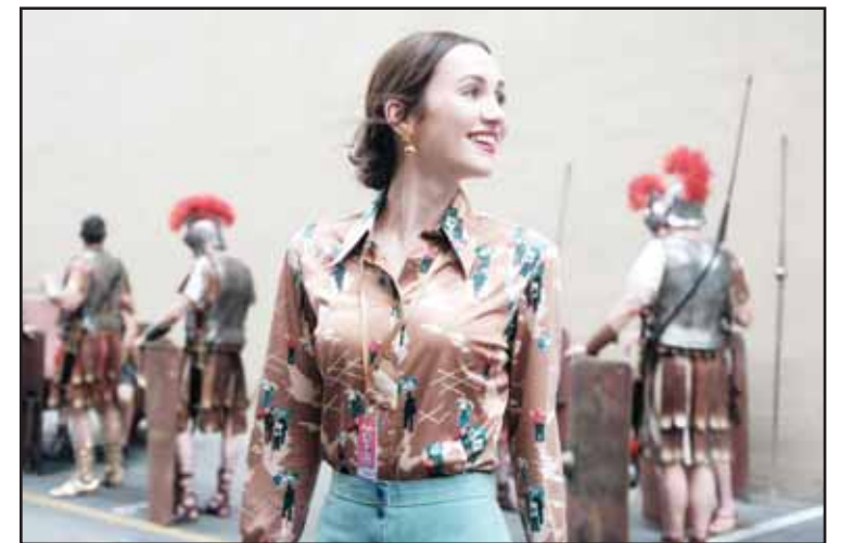
This image released by HBO shows Maude Apatow from the series 'Euphoria.'