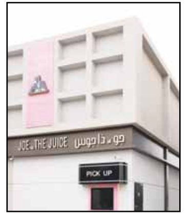
Joe & The Juice adds 20th+ Kuwait location.

KUWAIT CITY, April 11: Ali Abdulwahab Al Mutawa Light Food, a subsidiary of Ali Abdulwahab Al Mutawa Commercial Company (AAW), announced the opening of a new Joe & The Juice store at Hessah Hub in Hessa Al Mubarak District, further expanding the brand's presence within one of Kuwait's newest lifestyle destinations.