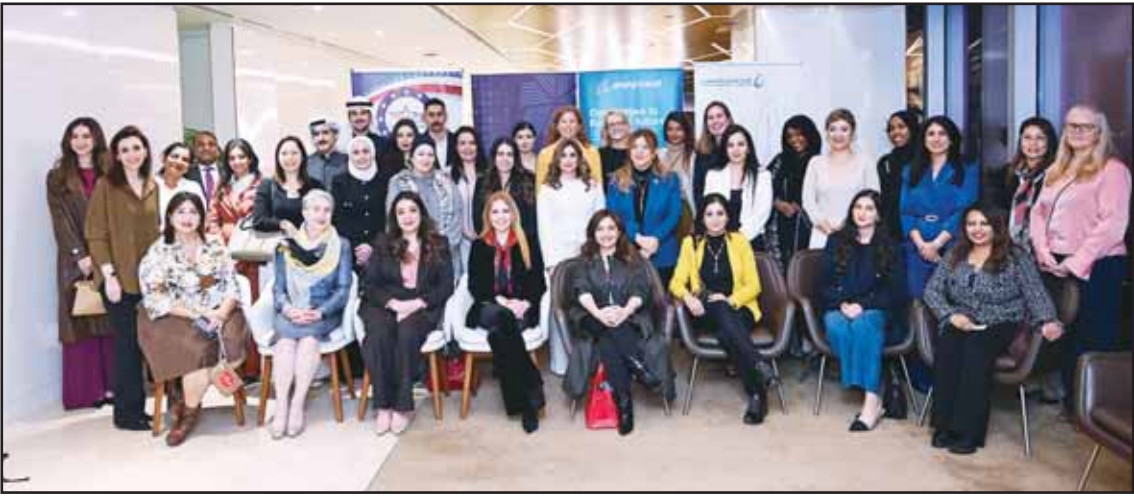
Photo during the event.

Throughout the session, speakers highlighted the growing