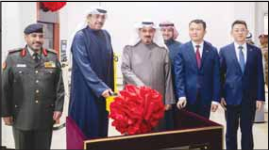
His Highness the Prime Minister Sheikh Ahmed Abdullah Al-Ahmed Al-Sabah sponsors and attends the opening ceremony of the Nayef Light Ammunition Factory.

He praised the national cadres who contributed to the completion of the project and expressed confidence in their ability to operate and manage it efficiently, affirming that it marks a new step toward safeguarding the nation's security and stability under the leadership of His Highness the Amir Sheikh Meshal Al-Ahmad Al-Jaber Al-Sabah and His Highness the Crown Prince Sheikh Sabah Khaled Al-Hamad Al-Sabah.