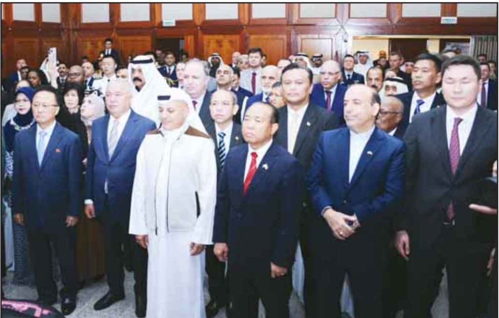
Ambassadors and members of the diplomatic corps from multiple countries attend the event.

By Fares Ghaleb Al-Seyassah/Arab Times Staff