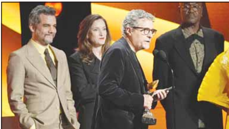
Wagner Moura, (from left), Emilie Lesclaux, and Kleber Mendonça Filho accept the award for best international film for 'The Secret Agent.'