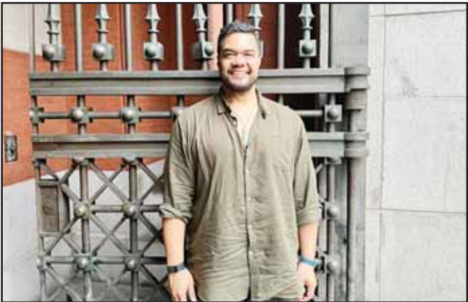
Samoan tenor Pene Pati poses outside of the Park Avenue Armory in New York on Sept. 25, 2025.

has created a valuable platform for exchanges between Chinese and international filmmakers. According to Jiao Hongfen, chairman of the China Film Producers’ Association, as China’s economy develops, global audiences are increasingly interested in seeing China on screen. Chinese filmmakers are bringing their stories to international viewers, fostering closer exchanges between Chinese and foreign cinema, Jiao said. As China has become the world’s second-largest film market, it is important not only to tell China’s stories to the world, but also to welcome outstanding films from across the globe into China, promoting mutual engagement and win-win results, he added.