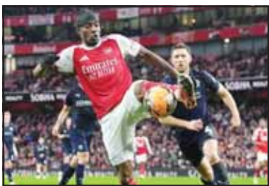
Arsenal's Noni Madueke controls the ball during the English FA Cup soccer match between Arsenal and Wigan Athletic in London. Arsenal won 4-0.