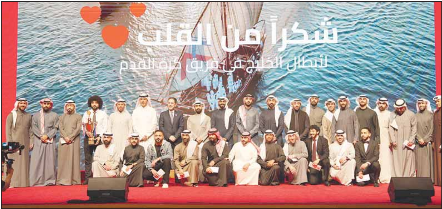
Gulf Bank celebrates the success of its Football Team winning the Banks Cup Championship for the tenth time.