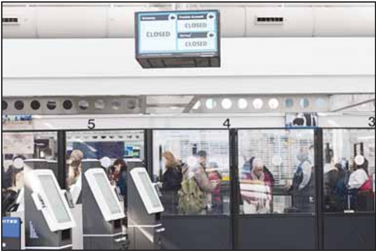
An information screen is displayed in Terminal 1 at O'Hare International Airport, in Chicago on Feb 15.

Democrats also want to require immigration agents to wear body cameras and mandate judicial warrants for arrests on private property.