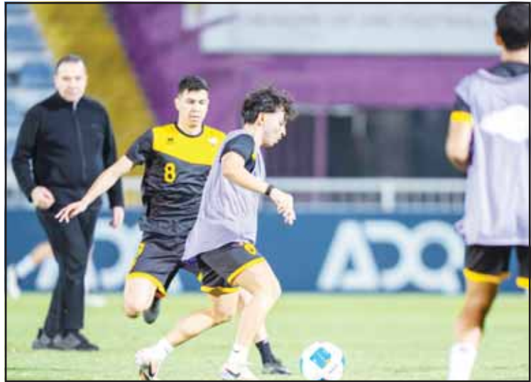
Qadsia players intensify training for the decider.