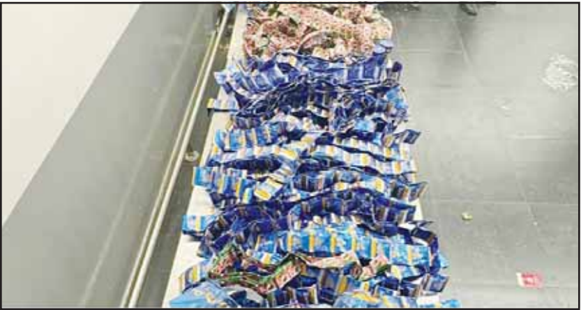
Customs seizes tobacco sachets found on an Asian coming from his home country.