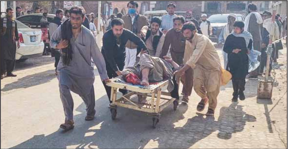
Volunteers transport an injured victim of a bomb explosion upon arrival at a hospital in Bannu, northwestern Pakistan on Feb 16.

On Feb 13, President Hassan met with Angolan President João Lourenço to discuss cooperation in trade, investment, and industrial development. Lourenço agreed to pay a state visit to Tanzania and serve as the guest of honor at the 50th Dar es Salaam International Trade Fair (DITF) in 2026.