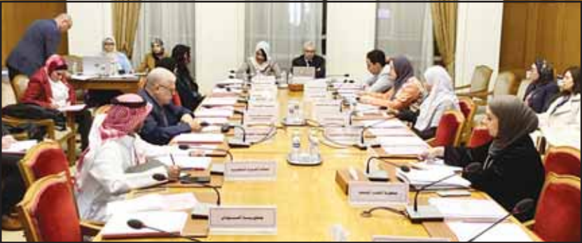
Proceedings of the 16th meeting of the Technical Committee on Intellectual Property at the League of Arab States.