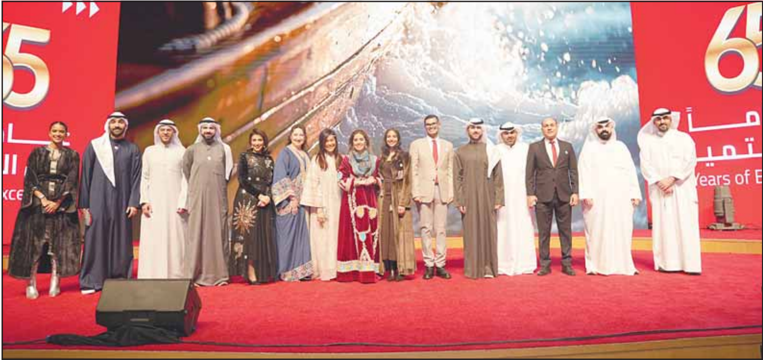
A group photo of the marketing and human resources teams.