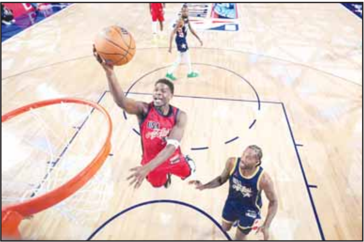
USA Stars guard Anthony Edwards drives past USA Stripes forward Kawhi Leonard in the NBA All-Star basketball game in Inglewood, Calif.

crowd with a 31-point barrage for the Stripes in the final round-robin game, but he managed just one point in the final. Tyrese Maxey led the Stars with nine points in the clincher. Scottie Barnes won the opening 12-minute game for the Stars with a game-ending 3-pointer in overtime, beating the World 37-36 after Edwards forced OT. After Fox's dagger in the second game, Leonard utterly dominated the third game before hitting a tiebreaking 3-pointer with 3.5 seconds left in the Stripes' 48-45 victory. The World team was loaded with talent, but NBA scoring leader Luka Doncic and three-time MVP Nikola Jokic both sat out its second game, likely to preserve the health of two