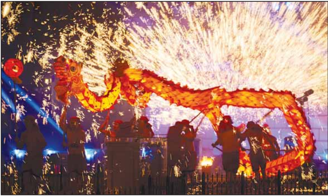
Fire performers carry a dragon during a molten iron fireworks performance known as 'fire dragon steel flowers' ahead of Lunar New Year celebrations at an amusement park on the outskirts of Beijing on Feb 14.

The injured have been sent to the hospital for treatment, and the cause of the accident is still under investigation. The passengers on the vehicle said that the driver might have been driving under fatigue. (Xinhua)