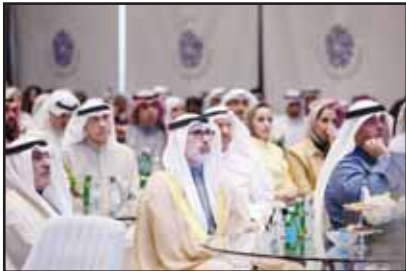
Minister of Foreign Affairs and Chairman of KFAED Board of Directors, Sheikh Jarrah Jaber Al-Ahmad Al-Sabah, at the Fund's annual ceremony.

The establishment of the Fund in 1961, only months after Kuwait's independence,