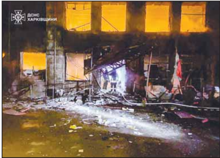
emergency services personnel work to extinguish a fire at a house following a Russian air attack in Barvinkove, Kharkiv region, Ukraine on Feb 11.

Ukrainian defenders remain locked in a war of attrition with Russia’s bigger army along the roughly 1,250-kilometer (750-mile) front line. Ukrainian civilians endure Russian aerial barages that repeatedly knock out power and smash homes, while Ukraine has developed drones that can fly deep into Russian territory and strike oil refineries and arms depots.