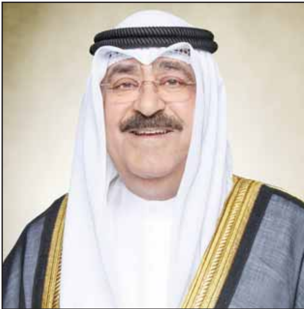
His Highness the Amir Sheikh Meshal Al-Ahmad Al-Jaber Al-Sabah

KUWAIT CITY, Feb 16, (KUNA): The Amiri Diwan on Monday conveyed congratulations of His Highness the Amir Sheikh Meshal Al-Ahmad Al-Jaber Al-Sabah to the citizens and residents of Kuwait on advent of the fasting month of Ramadan.