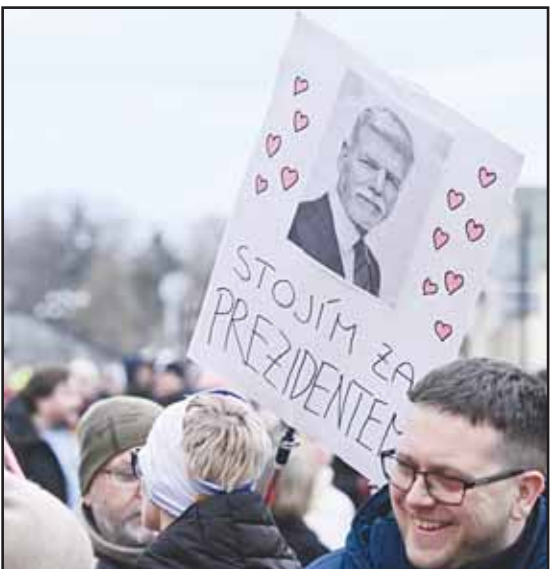
People demonstrate in support of Czech President Petr Pavel in Pardubice, East Bohemia, Czech Republic on Feb 15.

Macinka accused the president of violating the country’s constitution and threatened him with consequences if he fails to appoint his controversial associate. Pavel accused Macinka of blackmailing him.