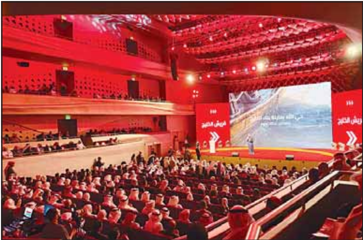
Part of the audience.