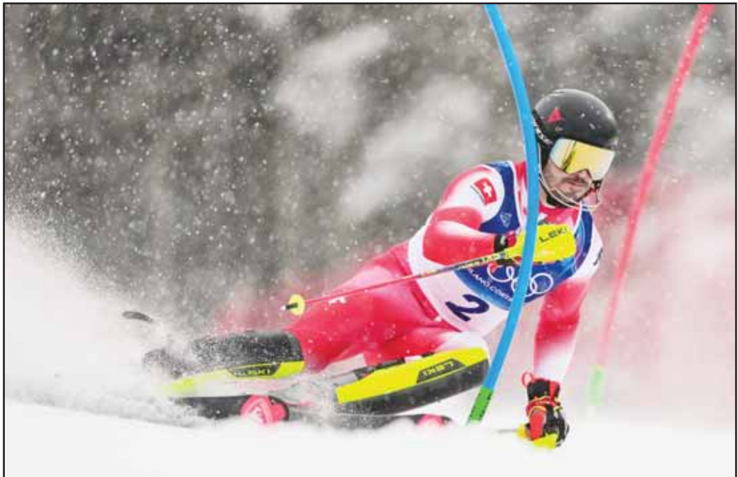
Switzerland’s Loic Meillard speeds down the course, during an alpine ski, men’s slalom race, at the 2026 Winter Olympics, in Bormio, Italy.

The event closes out the men’s Alpine program at the Milan Cortina Games. Meillard adds gold to a silver he won in the team combined and bronze from the giant slalom. Meillard finished in a two-run combined time of 1 minute, 53.61 seconds. He edged Fabio Gstrein of Austria by 0.35 seconds, while Henrik Kristofersen of Norway took bronze. It was quite a contrast of runs, too, with snow and fog in the morning and the sun peeking out for the afternoon. Norway’s Atle Lie McGrath, the first-run leader, straddled a gate and was out. He was so irate that he threw his ski poles over the netting on one side. He then went outside the netting on the other side, trudging along the snow. He sat down and then fell back, breathing heavily. McGrath has been racing with a heavy heart, with his grandfather dying the day of the opening ceremony. McGrath wore an armband as a tribute. Pinheiro Braathen made history by winning the giant slalom Saturday, becoming the first athlete from South America to win a medal at a Winter Olympics. But his ski slipped out on a fast first run and his bid for another medal was over. Pinheiro Braathen represented Norway before switching to Brazil, his