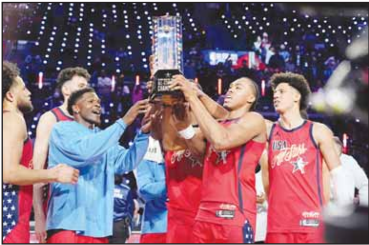
USA Stars lift the championship trophy after a win over USA Stripes in the NBA All-Star basketball game in Inglewood, Calif.

the event generally appeared to be played at a higher level of competitiveness than most All-Star Games in recent years, suggesting the league might have finally cracked the code on the long-standing question of how to make this midseason showcase more entertaining. "It was a pretty good display of basketball," Wembanyama said. "Better than last year, in my opinion. It was fun. ... I think being honest with ourselves is good. It's a game we love, it's a game I personally cherish, so being competitive is the least I can do." NBA Commissioner Adam Silver thanked the All-Stars for playing hard when he presented the championship trophy to the Stars. Kawhi Leonard thrilled his home