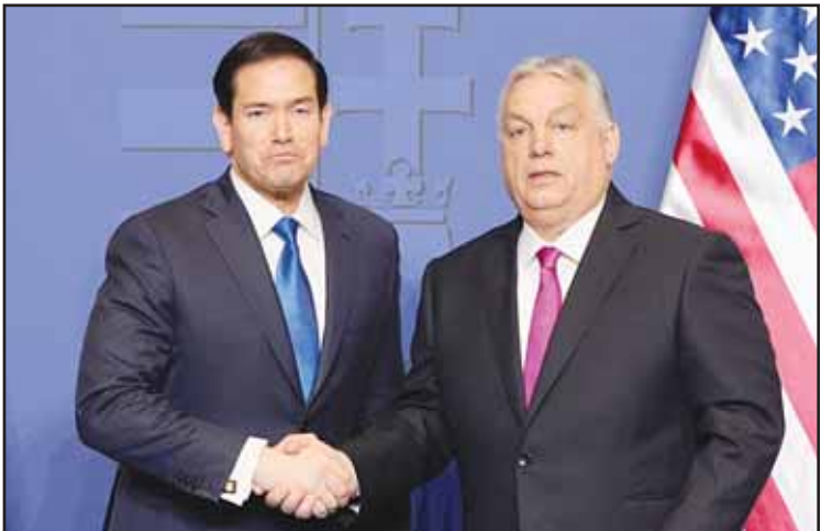
US Secretary of State Marco Rubio, (left), and Hungary’s Prime Minister Viktor Orbán shake hands after a news conference in Budapest, Hungary on Feb 16.

“I’m going to be very blunt with you,” Rubio said. “The prime minister and the president have a very, very close personal relationship and working relationship, and I think it has been beneficial to our two countries.”