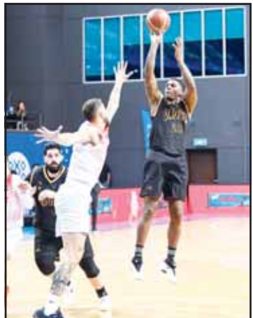
Qadsia player shoots over Kuwait Club defender.