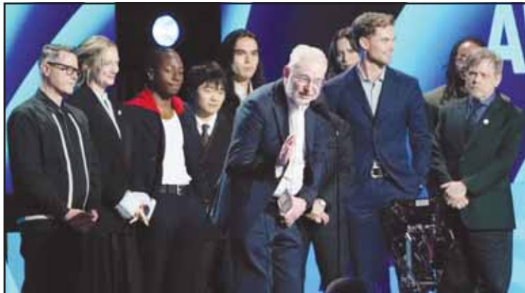
The cast of 'The Long Walk' accept the Robert Altman Award during the Film Independent Spirit Awards on Sunday, Feb. 15, at the Hollywood Palladium in Los Angeles.