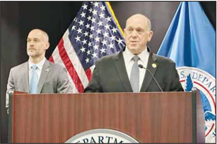
White House border czar Tom Homan holds a news conference at the Bishop Whipple Federal building on Feb 12, in Minneapolis.

Protests became common. A network of residents worked to help immigrants, warn of approaching agents