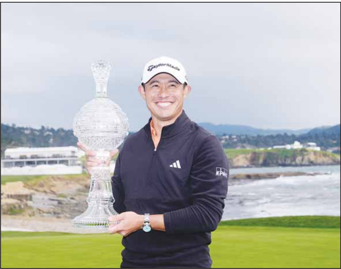
Collin Morikawa celebrates at Pebble Beach Golf Links after winning the AT&T Pebble Beach Pro-Am golf tournament in Pebble Beach, Calif.

for his first victory in nearly 16 years. Kim vanished from the game in 2012 and went through struggles with drugs and alcoholism. LIV Golf brought him in as a wild card in 2024, and he made it through qualifying to stay in the league for this season. He started five shots behind Jon Rahm and Bryson DeChambeau, who have combined to win four majors since 2020. The 40-year-old American surged past both of them to win by three shots and collect $4 million. Kim's last win had been the 2010 Houston Open. David Toms made a 25-foot par putt to stay in the game and finished with a tap-in birdie on the par-5 18th for a 1-over 73 and a one-shot vic-