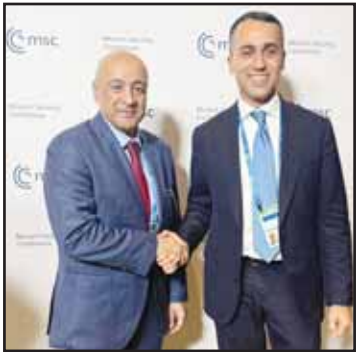
Secretary General of the Gulf Cooperation Council, Jassem Al-Budaiwi, with the European Union's Special Envoy for the Gulf, Luigi Di Maio.

Both sides emphasised the significance of strengthening coordina-