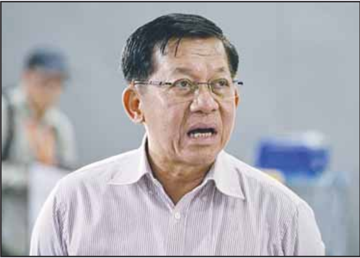
Myanmar military leader Senior Gen Min Aung Hlaing visits a polling station during the final round of general election in Mandalay, central Myanmar, on Jan 25.

Bondi terror attack suspect appears in court: A man accused of killing 15 people in a mass shooting at a festival on Sydney's Bondi Beach appeared in court Monday for the first time since his release from the hospital.