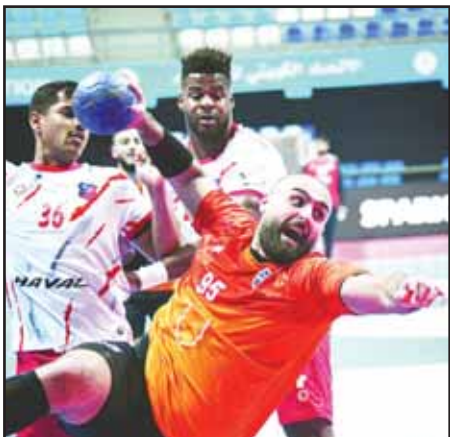
Kazma player goes for a goal against Kuwait Club.