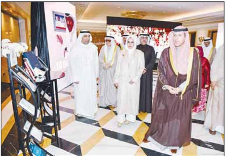
A scene from the Minister of Awqaf and Islamic Affairs’ visit to the exhibition accompanying the Waqf Forum.

Representing His Highness the Amir, the minister conveyed His Highness’ greetings and sincere wishes for the forum’s success in serving Kuwait and further advancing the noble mission of endowment