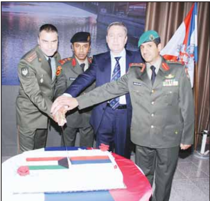
Kuwaiti Commander of the Land Forces Artillery Brigadier General Faisal Al-Ajl, military officials, Russian ambassador during the cake-cutting ceremony.