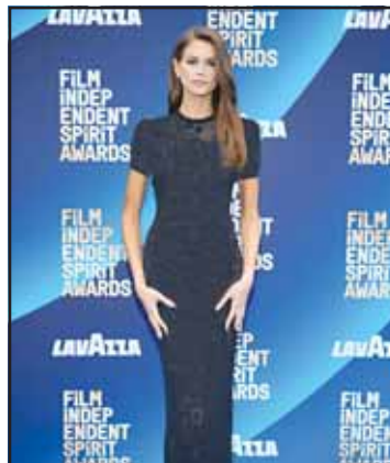
Kaia Gerber arrives at the Film Independent Spirit Awards.