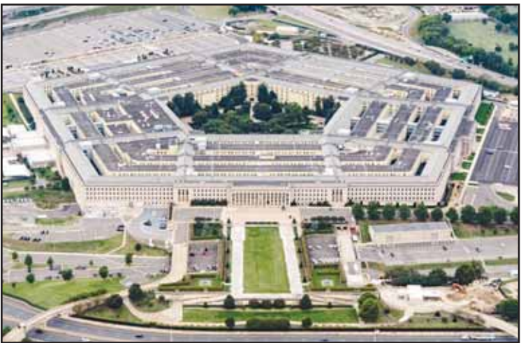
The Pentagon, the headquarters for the US Department of Defense, is seen from the air on Sept 20, 2025, in Arlington, Va.

what he described as a "total and complete blockade" of all US-sanctioned oil tankers entering or leaving Venezuela in December. The blockade has continued following the US raid and capture of Venezuelan President Nicolas Maduro on Jan 3.