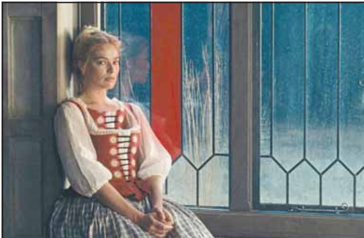
This image released by Warner Bros. Pictures shows Margot Robbie in a scene from 'Wuthering Heights.'

Fennell's version of "Wuthering Heights," which takes many liberties with Emily Brontë's novel, largely divided critics. It's currently sitting at a mixed 63% on Rotten Tomatoes. While that didn't dissuade audiences from buying tickets, only 51% of the opening weekend audience said that they would "definitely recommend" the film to friends. Moviegoers also gave it a less-than-stellar B CinemaScore.