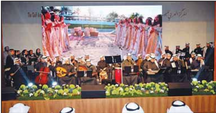
Kuwaiti musicians and singers perform at the ‘From Kuwait ... Peace’ concert, celebrating the nation’s values of harmony, cultural openness, and artistic expression during the national holidays.

He praised the role of ABEGS in advancing joint Gulf educational initiatives and strengthening cooperation in the fields of education, culture and human resource development. He pointed out that events of this nature exemplify the importance of institutional partnerships in consolidating shared values and fostering meaningful cultural dialogue.