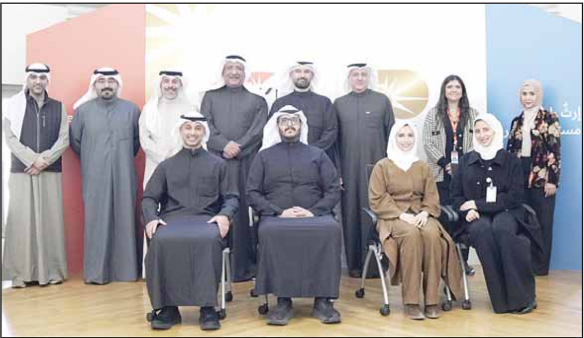
Officials from Kuwait Finance House and the Kuwait Foundation for the Advancement of Sciences with the trainees.