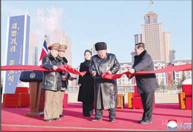
In this photo provided by the North Korean government, North Korean leader Kim Jong Un, (second right), attends a completion ceremony of the new street, called Saeppyol Street in Pyongyang, North Korea on Feb 15.

After a tape-cutting ceremony marking the completion of the housing project, the DPRK leader, along with other