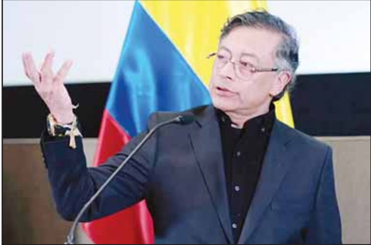
Colombia's President Gustavo Petro speaks during a news conference at the Colombian embassy in Washington on Feb 3.

Colombia's president has long accused the rebels of profiting from the