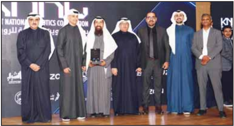
Photo during the event.

The championship features four main contests: VEX IQ Robotics Competition, VEX V5 Robotics Competition, Drones Competition, and Seaperch Competition. These categories provide students with opportunities to expand their skills in engineering, programming, and teamwork while tackling challenges that mirror real-world applications of technology. Throughout the competition stu-