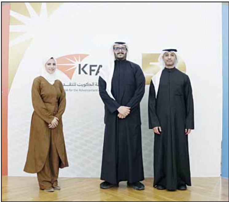
Participants from Kuwait Finance House.