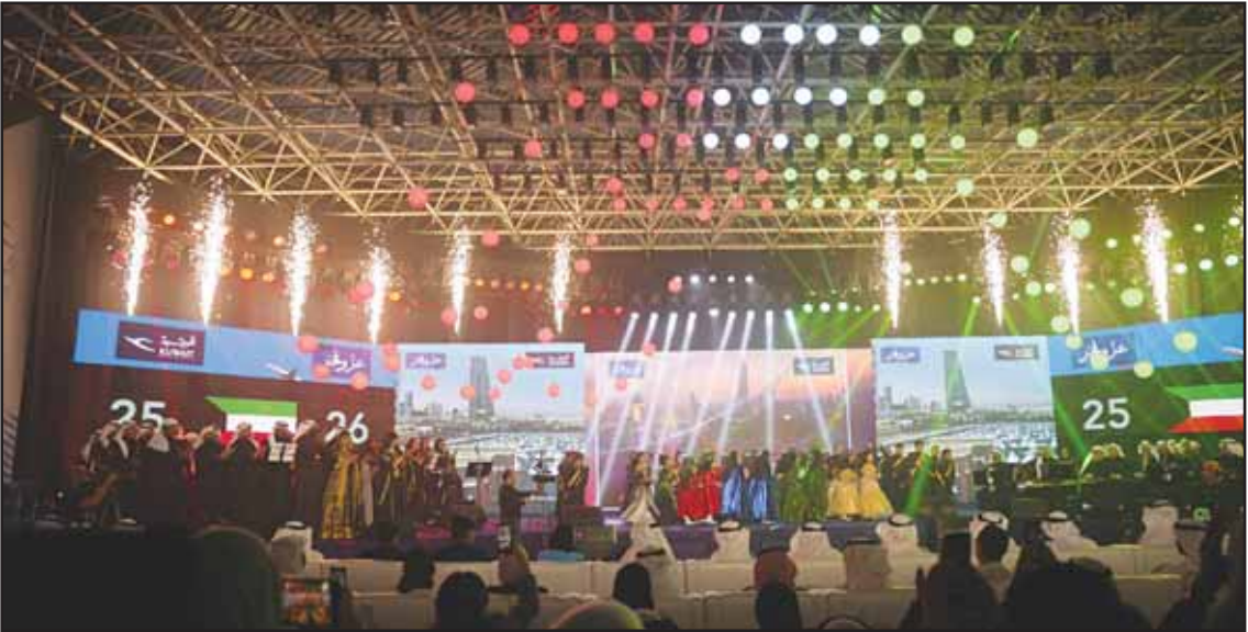
Glimpse of the event.