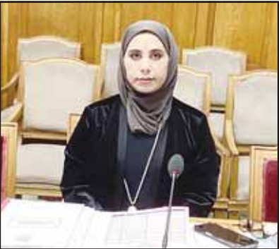
Representative of the State of Kuwait at the 16th meeting of the Technical Committee on Intellectual Property in Cairo.

She added that the League, in cooperation with national IP offices, are working to support the inclusion of new languages within international IP systems, to facilitate access, and reduce costs. She explained that the meeting agenda includes several key items, notably the cooperation agreement on the Arab Electronic IP Register project, promot-