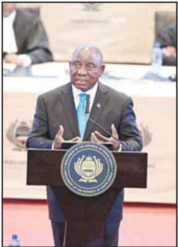
South African President Cyril Ramaphosa gives his State of the Nation address in Cape Town, South Africa, on Feb 12.

long struggled to prevent gangs of miners from entering some of the 6,000 closed or abandoned mines in the gold-rich nation to search for remaining reserves. The government claims that the miners, referred to as