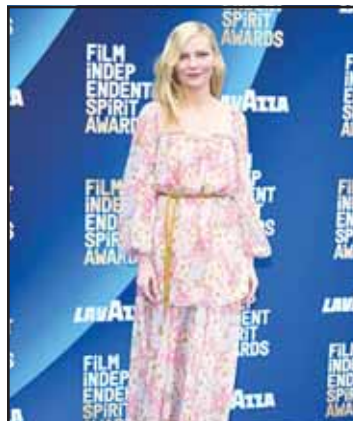
Kirsten Dunst arrives at the Film Independent Spirit Awards.