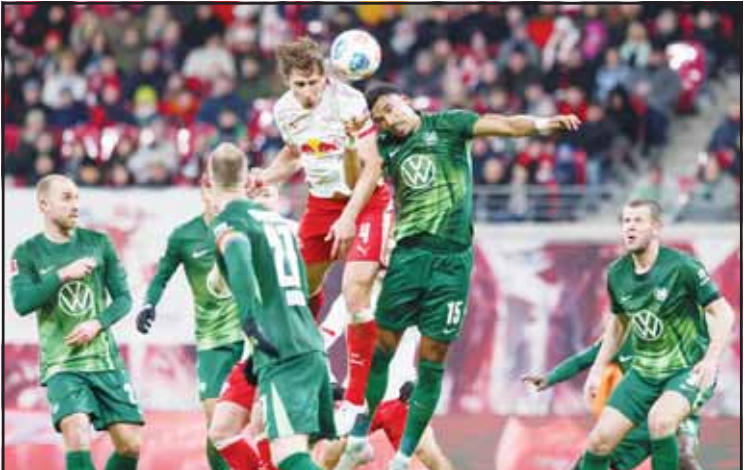
Leipzig's Willi Orban, top left, and Wolfsburg's Moritz Jenz in action during the Bundesliga soccer match between RB Leipzig and VfL Wolfsburg in Leipzig, Germany.

winner. Jaylen Brown led the Stripes with 11 points, and James scored eight to begin his record 21st All-Star appearance. Edwards and Cade Cunningham scored 11 points apiece for the Stars. "Old heads 1-0," James said with a laugh. "We've got a lot of guys that have played a lot of basketball, so no matter what's going on, we know how to keep our composure and execute." A few hours beforehand, the top scorer in NBA history said the game's presence in the Los Angeles area meant "nothing, because this is not our building. This is a road game." Indeed, the Clippers fans in Intuit Dome booed James and Doncic whenever they touched the ball in the first two games. Leonard thrilled his home crowd with a dynamic effort, going 11 of 13 and 6 of 7 from beyond the arc. The seven-time All-Star made his first seven shots with five 3-pointers amid raucous cheers from the extra-steep supporters' section called The Wall behind one basket at this futuristic 18-month-old arena. He was unstoppable despite a reasonable defensive effort from the World team led by Wembanyama, who scored 19 points before missing a tying 3-pointer attempt at the buzzer. James put the Stripes ahead with 31 seconds left on a putback dunk, but Wembanyama hit two free throws to tie it before Leonard called game. Jokic and Doncic didn't play, leaving the World with just seven players. The All-Star weekend stays out West in February 2027 when Phoenix hosts for the fourth time.