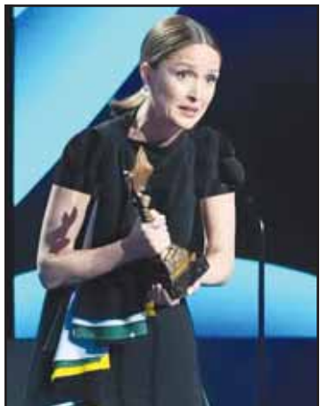
Rose Byrne accepts best lead performance award for 'If I Had Legs I'd Kick You.'