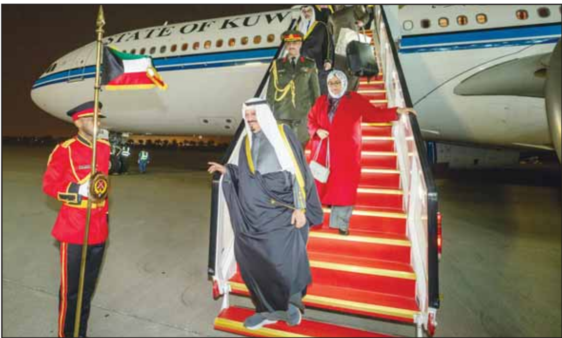
PM Diwan photo His Highness Sheikh Ahmad Abdullah Al-Ahmad Al-Sabah, Prime Minister, and his accompanying delegation returned to the country Sunday after heading the State of Kuwait’s delegation participating in the 62nd Munich Security Conference.

State Marco Rubio reaffirmed that US-European ties remain “inseparable,” while expressing doubts about Russia’s willingness to end the Ukraine war and criticizing the United Nations’ performance in conflict resolution. Chinese Foreign Minister Wang Yi responded by defending the UN as an essential platform for international co-operation and reiterated Beijing’s firm stance on Taiwan. The Ukraine war featured promi-