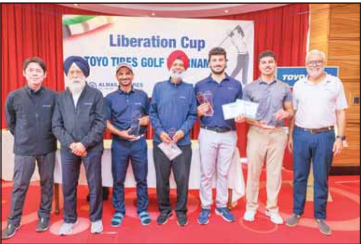
Winners of the Toyo Golf Tournament.