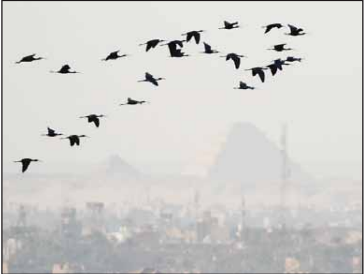
Migratory birds fly above Giza, Egypt, on Feb. 13.

Meanwhile, archaeologists have been undertaking restoration work on the upper section of the early 10th century Baksei Chamkrong temple in Cambodia’s renowned Angkor Archaeological Park, the APSARA National Authority (ANA) said in a news