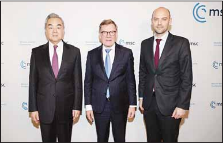
Chinese Foreign Minister Wang Yi, also a member of the Political Bureau of the Communist Party of China Central Committee, holds a trilateral meeting with German Foreign Minister Johann Wadepuhl and French Foreign Minister Jean-Noel Barrot in Munich, Germany on Feb 13. work with Germany to prepare for the next stage of high-level exchanges, strengthen pragmatic cooperation in