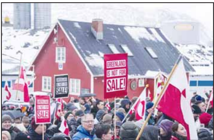
People protest against US President Donald Trump's policy towards Greenland in front of US consulate in Nuuk, Greenland on Jan 17.

Concerns about a possible US armed seizure of Greenland have eased as Trump ruled out taking Greenland by military force in talks