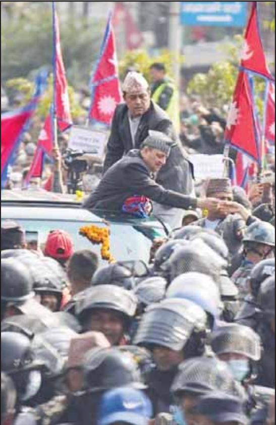
Former King Gyanendra Shah receives flowers from supporters upon his arrival at Tribhuvan International Airport in Kathmandu, Nepal on Feb 13.

The show of support for the monarchy comes ahead of crucial parliament elections next month. Pro-Gyanendra groups, which won about 5% of seats in the last election, are hoping to win seats.