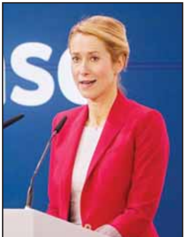
European Union foreign policy chief Kaja Kallas speaks during the Munich Security Conference in Munich, Germany on Feb 15.

Kallas alluded to criticism in the US national security strategy released in December, which asserted that economic stagnation in Europe "is eclipsed by the real and more stark prospect of civilizational erasure."