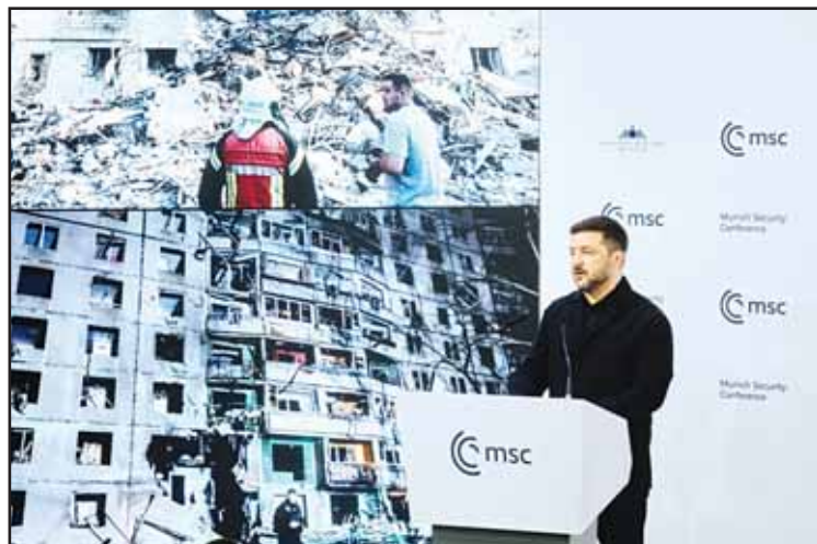
Ukraine's President Volodymyr Zelenskyy addresses the audience during a session at the Munich Security Conference in Munich, Germany on Feb 14.

The attacks came ahead of another round of US-brokered talks between envoys from Russia and Ukraine on Tuesday and Wednesday in Geneva, just before the fourth anniversary of the all-out Russian invasion of its neighbor on Feb 22.