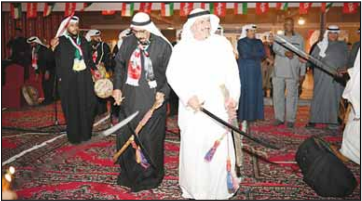
The Governor of Jahra performing the Ardha dance.