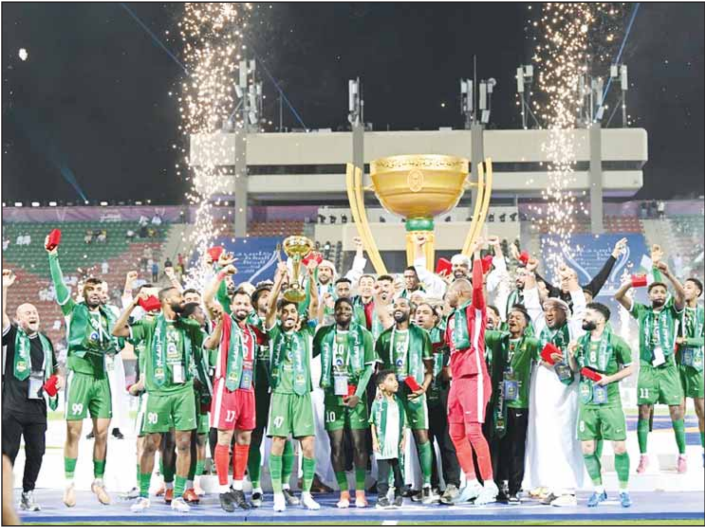
Al-Nahda Club celebrates with the Sultan Qaboos Cup.

MUSCAT, Feb 15: Al-Nahda Club secured the 2025-2026 Sultan Qaboos Cup title, defeating Oman Club 2-0 in a thrilling final. This triumph marks Al-Nahda's second victory in the competition after six previous attempts, where they had reached the final and finished as runners-up. The final was held at the Sultan Qaboos Sports Complex in Muscat, attended by the Sultan's representative, Minister of State and Governor of Muscat, Belarab bin Haitham. Oman Club dominated the early stages of the match, controlling possession in the first half. However, the game turned in the 35th minute when referee issued a red card to Oman player Mohammed