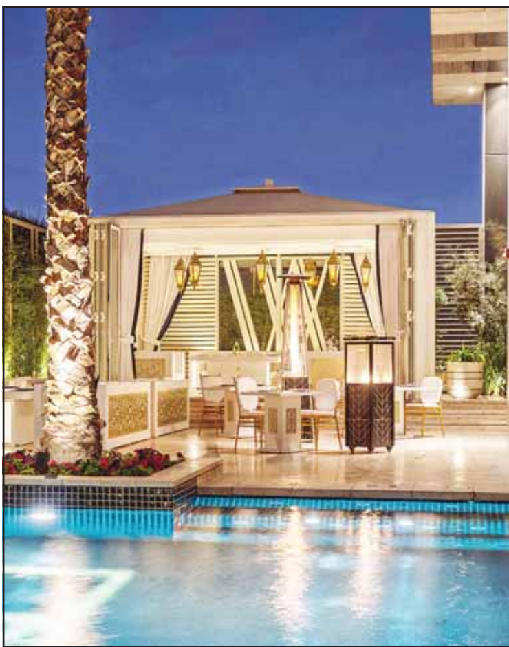
Waldorf Astoria Kuwait

In alignment with the goals of Hilton's Travel with Purpose 2030