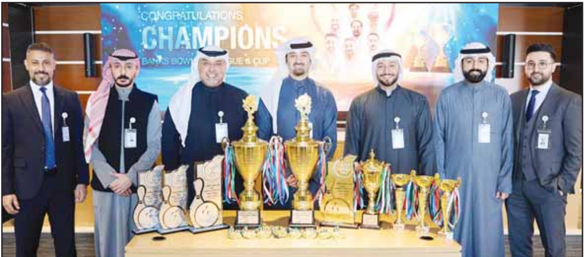
ABK bowling team.

KUWAIT CITY, Feb 15: At the conclusion of the Banks Bowling Championship for the 2025–2026 season, Ahli Bank of Kuwait (ABK) proudly announced the outstanding performance of its bowling team, which achieved remarkable success by winning both the League Championship and the Cup Championship, further reinforcing ABK's strong sporting presence within the Kuwait Banks Club. The ABK bowling team secured the Team League Champion (gold prize), in addition to the Team Cup Champion (gold prize), the Singles High Game award, and Perfect Game performance. In the Masters Event, ABK secured the gold and silver, as well as the silver prize in the Doubles Event, and the bronze prize in the Trio Event.