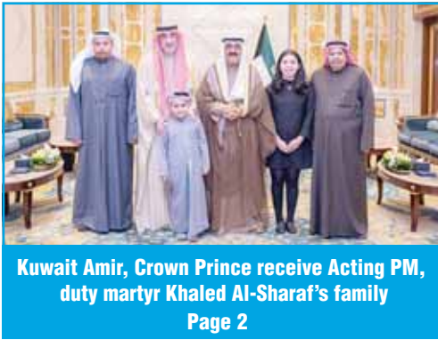
Kuwait Amir, Crown Prince receive Acting PM, duty martyr Khaled Al-Sharaf's family Page 2