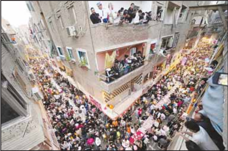
Residents of Ezbet Hamada in Cairo’s El Matareya district peer from their balconies to celebrate a mass break-fast, ‘iftar’ during the holy fasting month of Ramadan in Cairo, March 15, 2025.

Muslims are ethnically and racially diverse and not all Ramadan traditions are rooted in religion. Some customs may transcend borders, while others can differ across cultures.