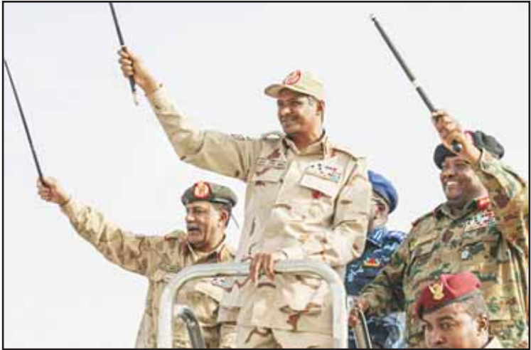
Gen Mohammed Hamdan Dagalo, (center) greets the crowd during a military-backed tribes' rally in the Nile River State of Sudan, on July 13, 2019.

The 29-page U.N. report detailed a set of atrocities that ranged from mass killings and summary executions, sexual violence, abductions for ransom, torture and ill-treatment to detention and disappearances. In many cases, the attacks were ethnicity-motivated,