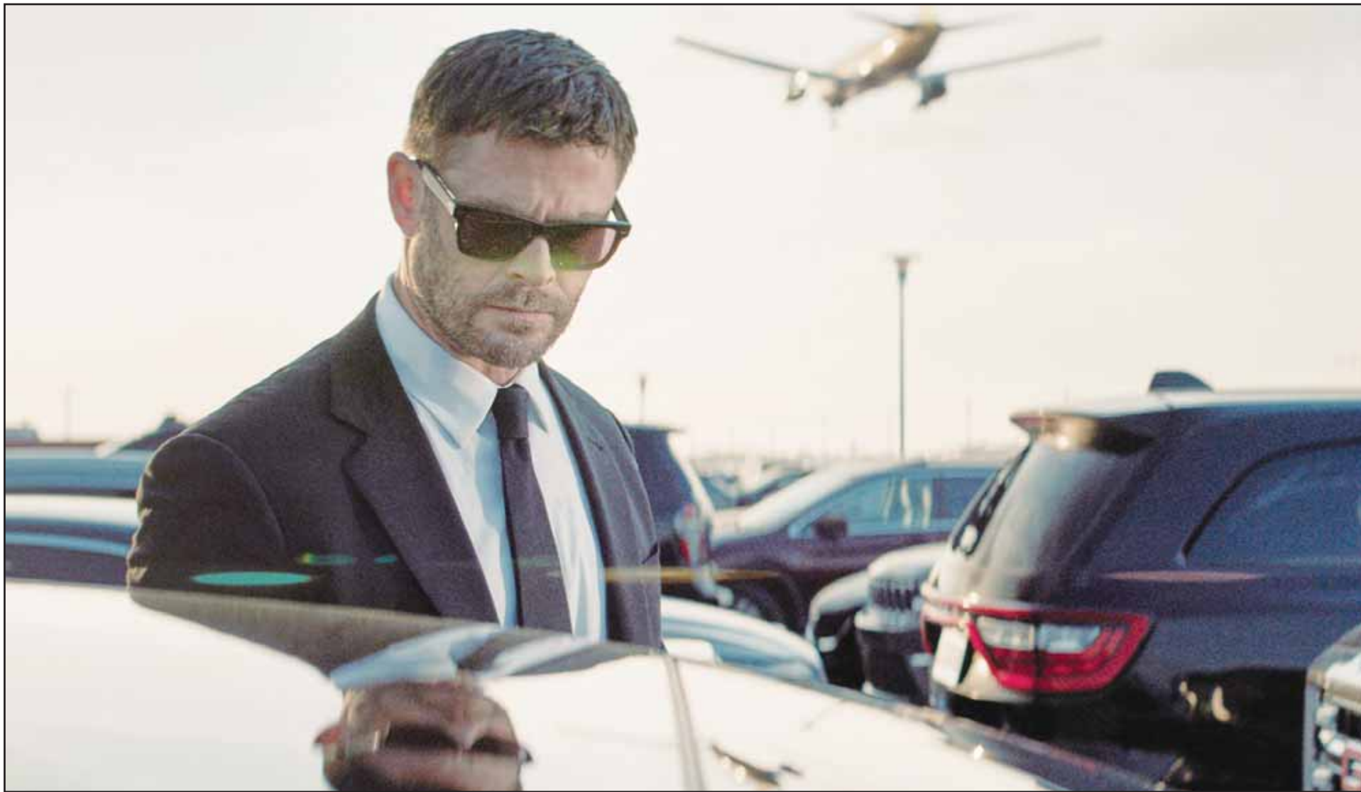
This image released by Amazon MGM Studios shows Chris Hemsworth in a scene from ‘Crime 101.’