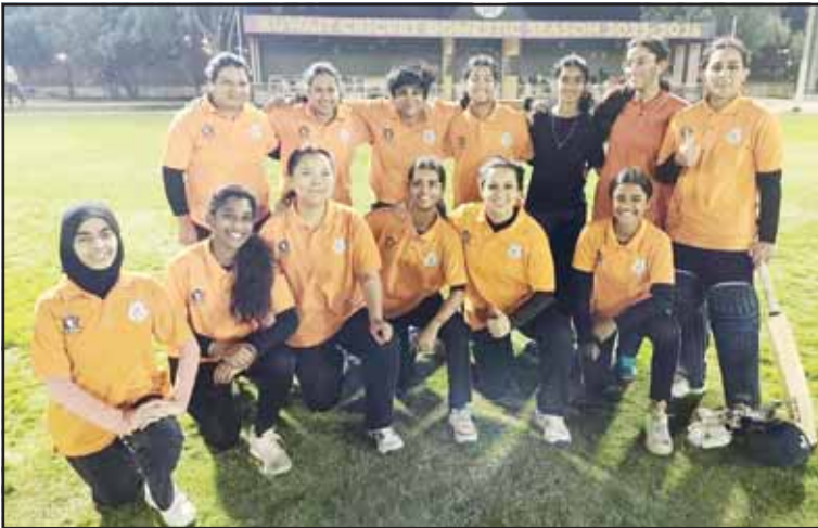
Runners up Dolphins.