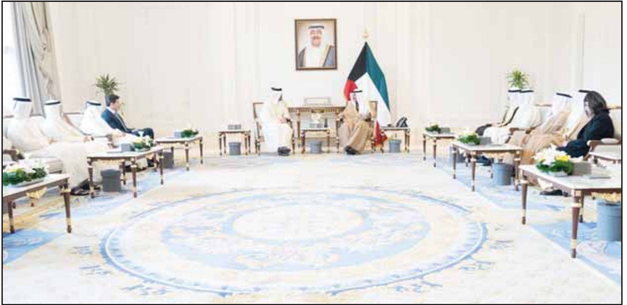
HH the Crown Prince receives President of the Olympic Council of Asia (OCA).

KUWAIT CITY, Feb 15, (KUNA): His Highness the Amir Sheikh Meshal Al-Ahmad Al-Jaber Al-Sabah received at Bayan Palace Sunday President of the Olympic Council of Asia (OCA) and Qatar Olympic Committee Head Sheikh Joaan bin Hamad Al-Thani and his accompanying delegation.