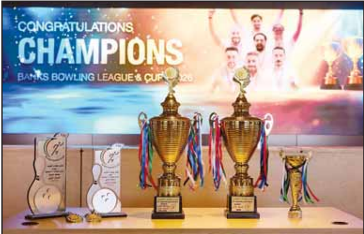
Trophies and medals of the 2025–2026 sports season.