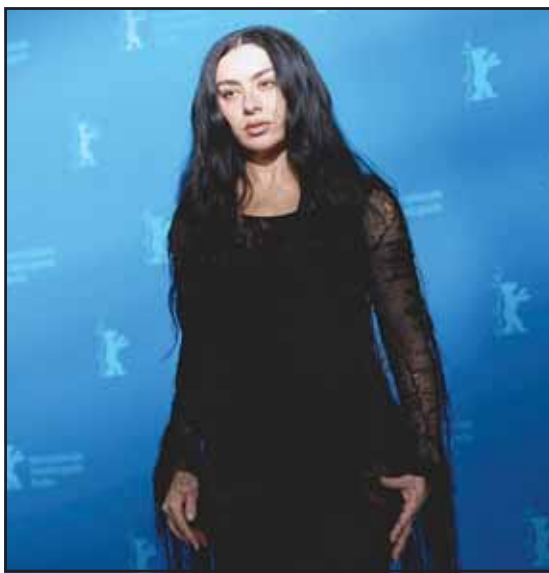
Charli xcx poses for photographers at the photo call for the film ‘The Moment’ during the International Film Festival, Berlinale, in Berlin, Saturday, Feb. 14.

In whole, “Wuthering Heights” does function as an album as much as it does a soundtrack - but that’s mostly the benefit of having a single artist realize their single vision, a privilege rarely afforded. Charli xcx does not waste it here.