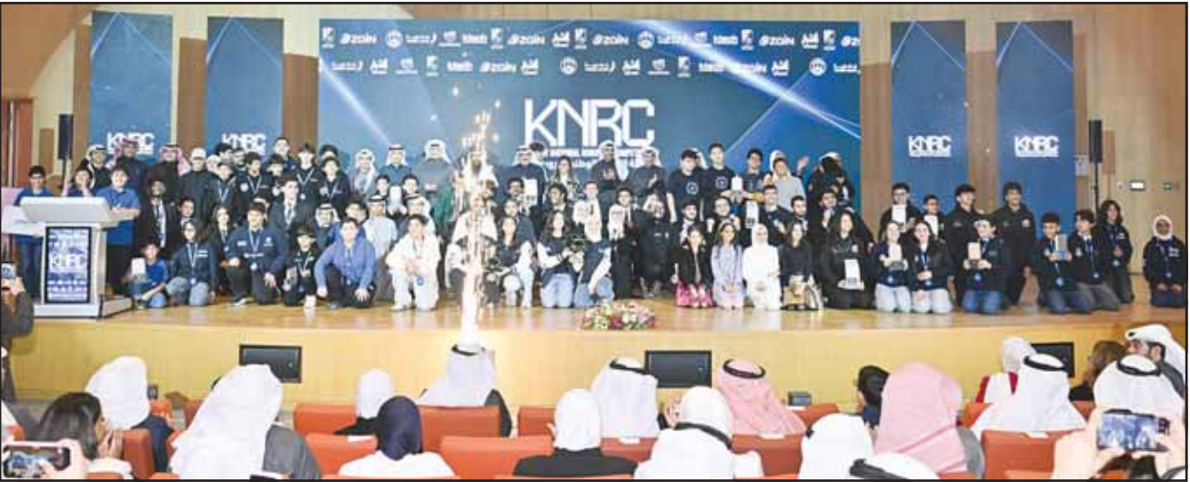
A group photo of the organizers and winners.