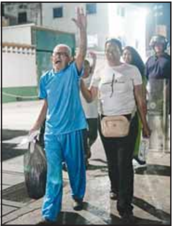
Lawmakers vote on an amnesty bill at the National Assembly in Caracas, Venezuela on Feb 12.

The National Assembly, which is still controlled by the ruling party, on Thursday debated a measure that could free hundreds of opposition members,