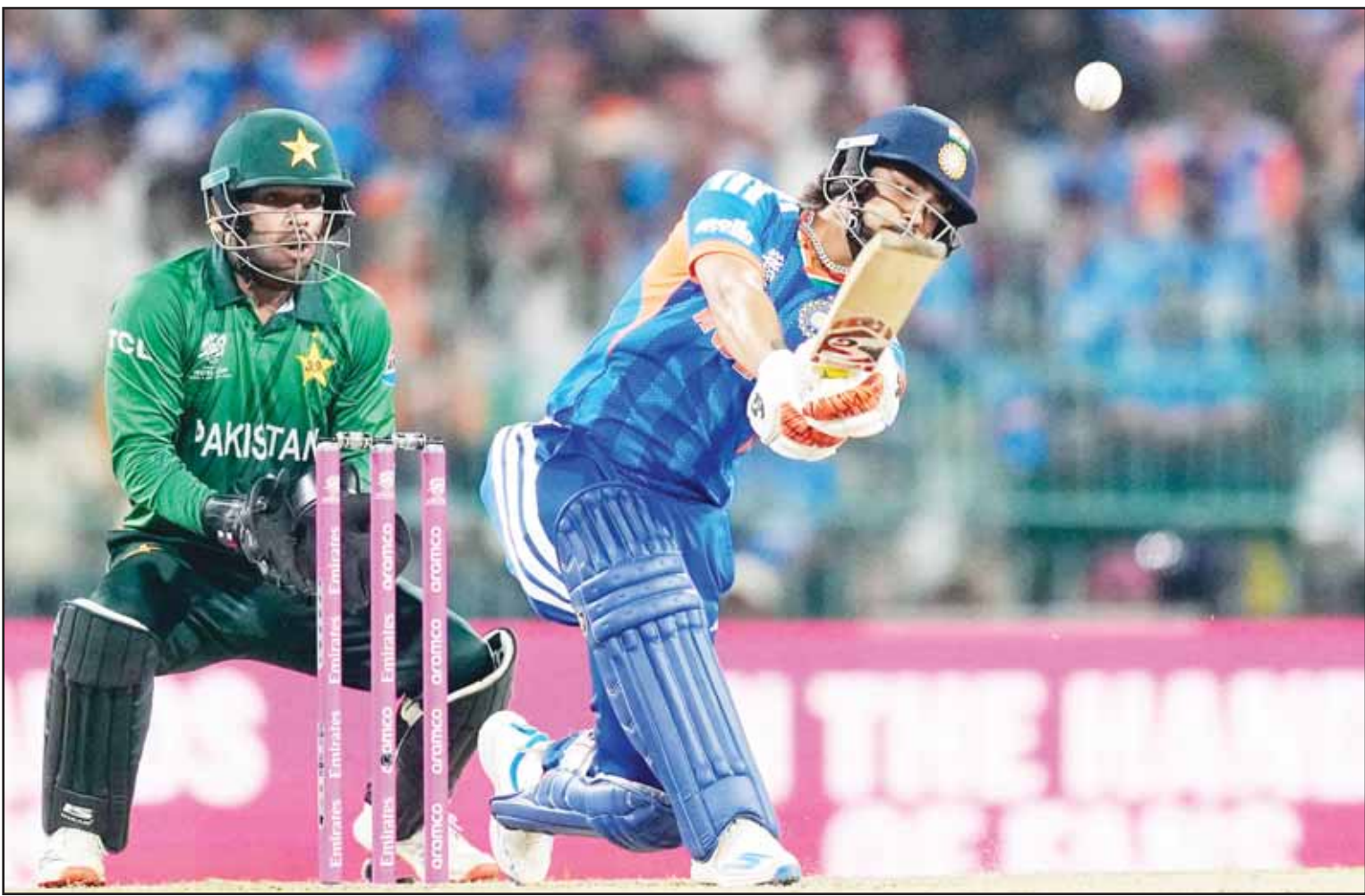
India's Ishan Kishan plays a shot during the T20 World Cup cricket match between India and Pakistan in Colombo, Sri Lanka.

COLOMBO, Sri Lanka, Feb 15, (Agencies): India delivered a commanding performance to defeat Pakistan by 61 runs, extending its dominance in T20 World Cup history and becoming the first team to secure a spot in the Super 8 stage.