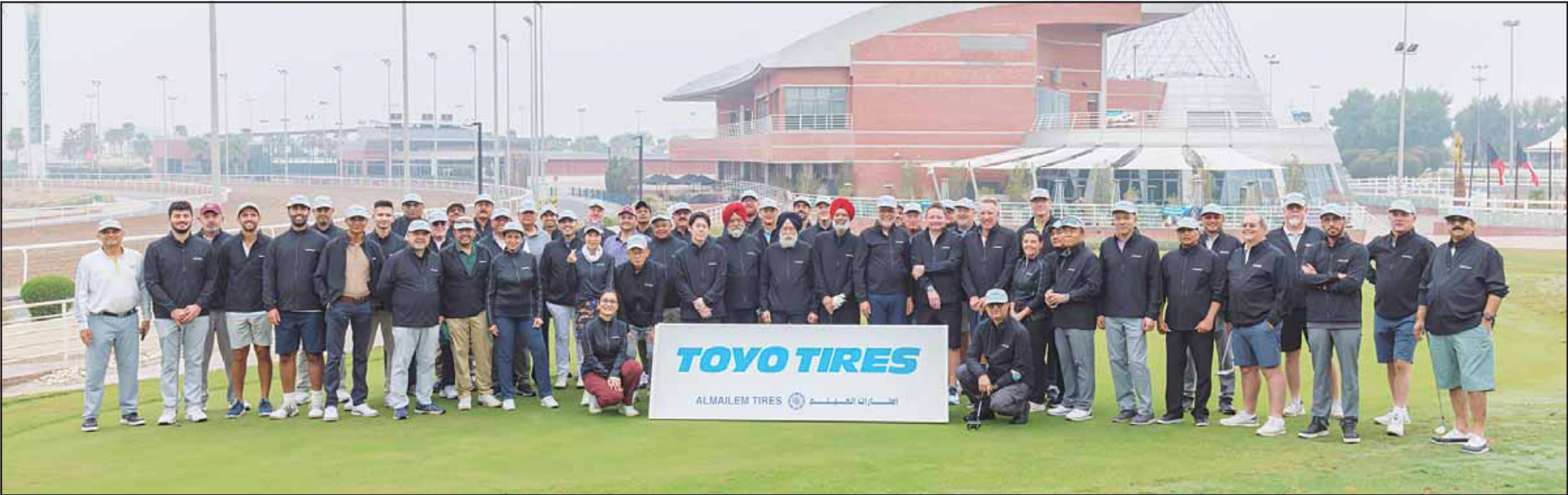
Participants of the Toyo Golf Tournament pose for a group photo.