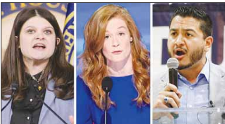
This combination of photos shows Rep Haley Stevens, on Feb 6, 2025, in Washington, (left), Michigan state Sen. Mallory McMorrow, on Aug 19, 2024, in Chicago, (center), and Abdul El-Sayed in Detroit on July 28, 2018.

ager at UA Local 85, said that the "far left" and the "far right" are failing to improve things in politics, a complaint that dovetailed with Stevens' efforts to pitch herself as a moderate.