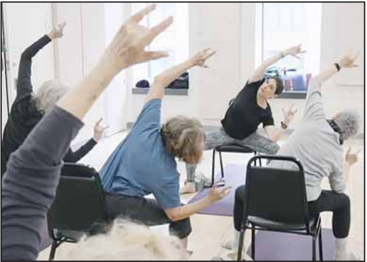
A chair yoga class is conducted at the Marlene Meyerson JCC Manhattan in New York, March 28, 2025.