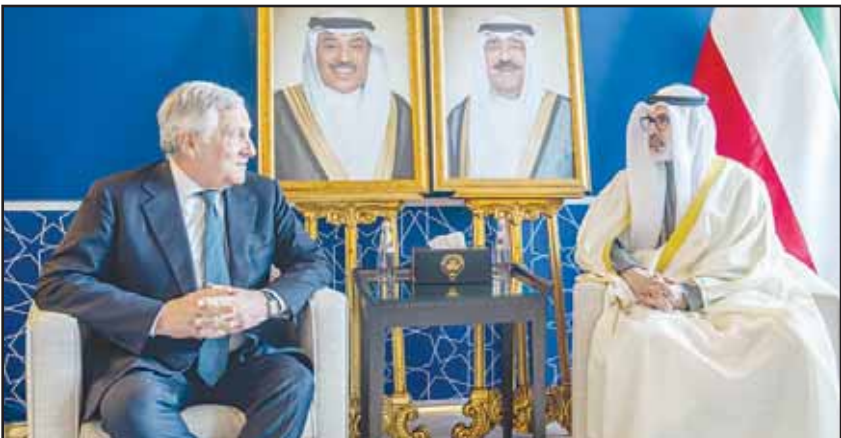
Minister of Foreign Affairs Sheikh Jarrah Jaber Al-Ahmad Al-Sabah in talks with the Italian Deputy Premier and Foreign Minister Antonio Tajani.

Kuwait attaches special importance to the implementation of Security Council Resolution 1325, underscoring the necessity of women's full and equal participation in peace and security efforts, conflict prevention and resolution, and peacebuilding.