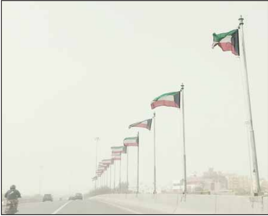
Amid swirling dust and gusty winds, Kuwait's flags stand tall along the bridge, a symbol of resilience and pride.

It called on anyone who might see the Ramadan crescent to come forward and present his testimony. On this auspicious occasion, the Authority extended its heartfelt congratulations and best wishes to the leadership -- His Highness the Amir Sheikh Meshal Al-Ahmad Al-Jaber Al-Sabah, His Highness the Crown Prince Sheikh Sabah Khaled Al-Hamad Al-Sabah and His Highness the Prime Minister Sheikh Ahmad Abdullah Al-Ahmad Al-Sabah, as well as the citizens and expatriates.