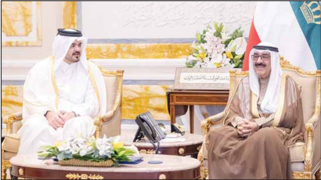
HH the Amir receives President of the Olympic Council of Asia (OCA).