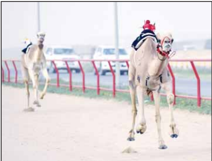
Camels compete in Kuwait International Camel Racing Championship.