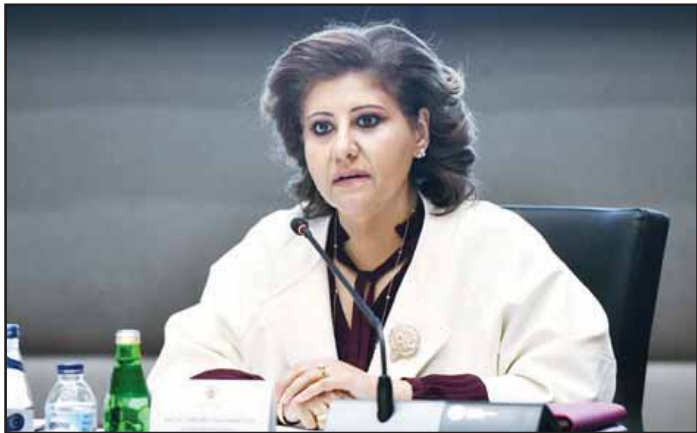
Sheikha Jawaher Al-Sabah

The remarks came in a statement to KUNA following a co-ordination meeting of the National Committee implementing UN Security Council Resolution 1325, titled "Women, Peace and Security," chaired by the Ministry of Foreign Affairs, represented by the Human Rights Affairs