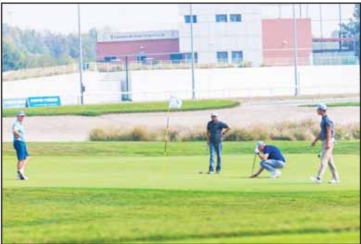
Players in action.