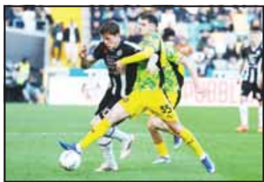
Udinese's Nicolò Zaniolo, left, fights for the ball with Sassuolo's Luca Lipani during the Serie A soccer match between Udinese and Sassuolo in Udine, Italy.