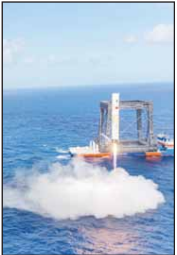
The first stage of the Long March-10 carrier rocket safely splashes down in the predetermined sea area in a controlled manner as planned, Feb. 11. (Xinhua)

HANGZHOU, Feb 15, (Xinhua): China has taken a major step toward building an AI-powered space infrastructure, with a satellite constellation deploying 10 AI models in orbit and establishing inter-satellite networking. The deployment demonstrates AI applications in deep space exploration, smart city development and natural resource surveys, according to Zhejiang Lab, which developed the constellation with global partners. China placed 12 satellites, the first group of the space computing constellation called "Three-Body Computing Constellation," into orbit in May 2025. After nearly nine months of in-orbit testing, the constellation has demonstrated core capabilities including networking, computing, model deployment and scientific payload verification.