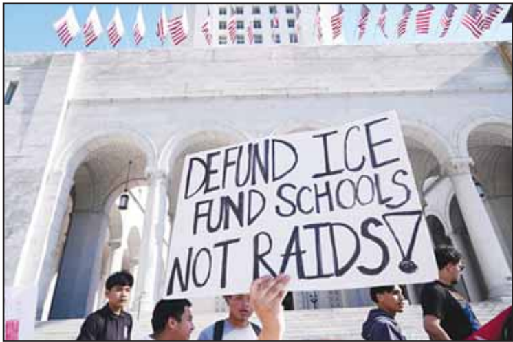
High school students who walked out of class to protest against US Immigration and Customs Enforcement (ICE) hold a rally outside Los Angeles City Hall as part of the nationwide Spring Surge to Melt ICE! on Feb 13.

geles public school system, told Xinhua she joined the protest to honor her parents, who migrated from Mexico before she was born.