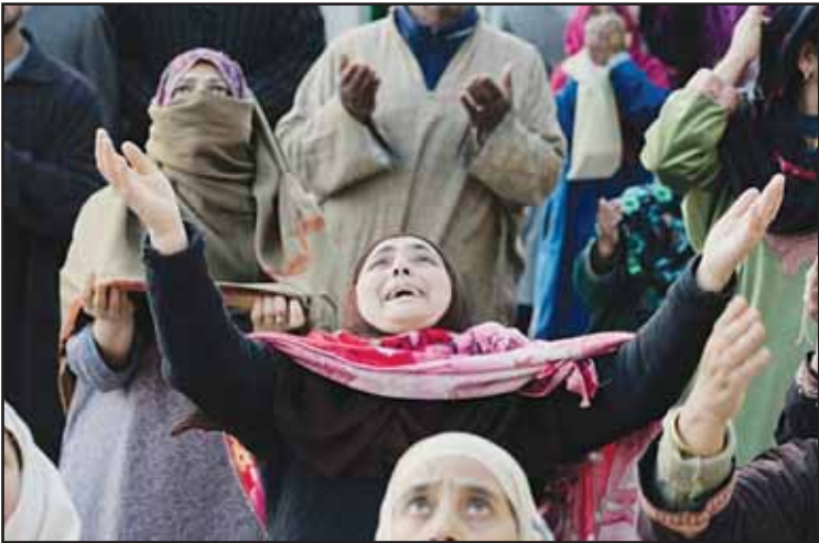
Muslim devotees pray as the head priest displays a holy relic believed to be a hair from the beard of the Prophet Muhammad (PBUH) during special prayers at Hazratbal shrine in Srinagar, Indian controlled Kashmir, March 22, 2025.

Many social rituals center on gathering and socializing after the daily fast. Some Muslims decorate their homes, put out Ramadan-themed tableware and centerpieces or throng to markets and Ramadan bazaars.