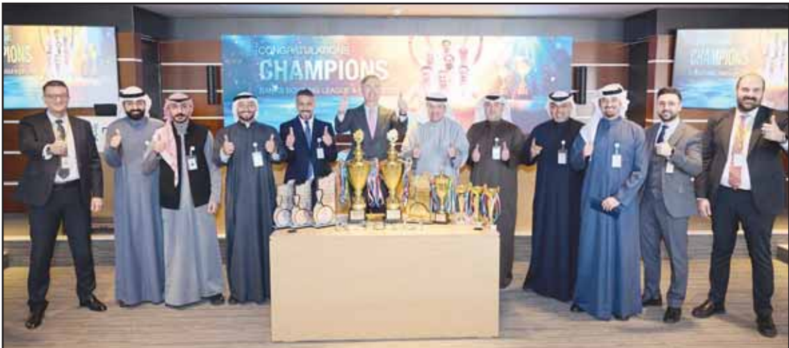
Celebrating the team's achievements during the sports season.