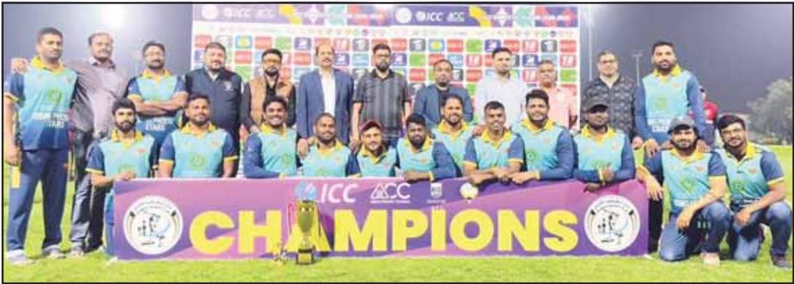
KCC Oasis Classic Cup champions, Rising Phoenix Stars.

KUWAIT CITY, Feb 15: The KCC Oasis Premier Cup, concluded with a gripping finale as Al Mulla Exchange edged Gujarat CC by five runs in a high-intensity contest. Vishal Kumar starred with a blistering 61 off 28 deliveries and returned figures of 0/29 in three overs to earn Player of the Match honours. Arun Raj of Cochin Hurricanes topped the run charts with