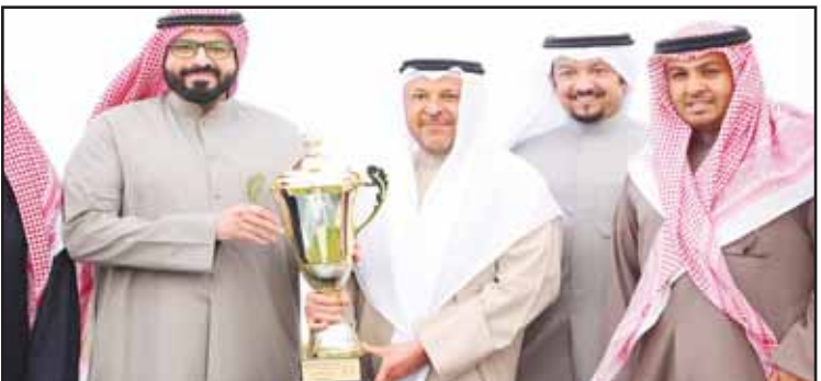
Farwaniya Governor Sheikh Athbi Nasser Al-Athbi Al-Sabah honors a winner.

pillar of the Kuwaiti national identity and a living extension of the heritage of the forefathers. The Governor also lauded the vital role played by the Hunting and Equestrian Club in preserving this longstanding sport and strengthening its presence in Kuwait’s sporting and cultural arena. Club officials presented a commemorative plaque to the Governor in appreciation of his patronage and attendance, asserting that his support is in line with the commitment of the State to champion heritage sports and its dedication to reinforcing their status in Kuwaiti society