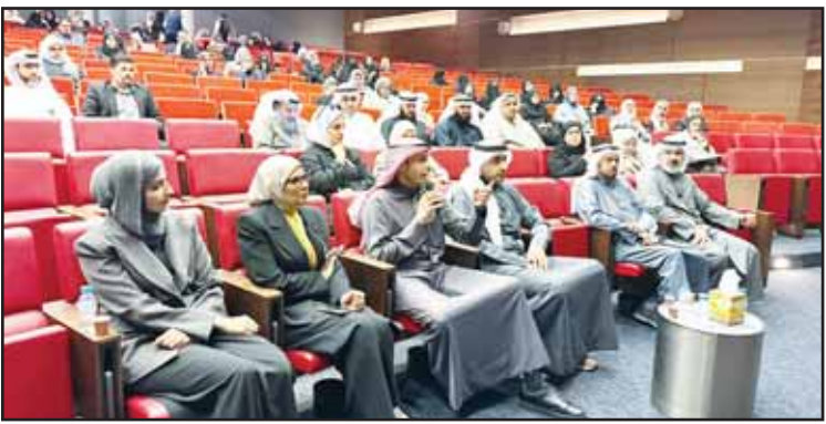
Part of the 'AI Tools in Education Project' event, organized in collaboration with Google.