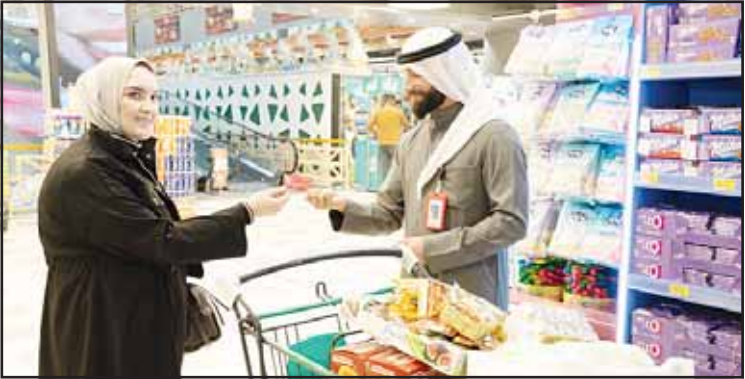
Gulf Bank congratulates a citizen on the arrival of the holy month and presents her with a Ramadan gift basket.