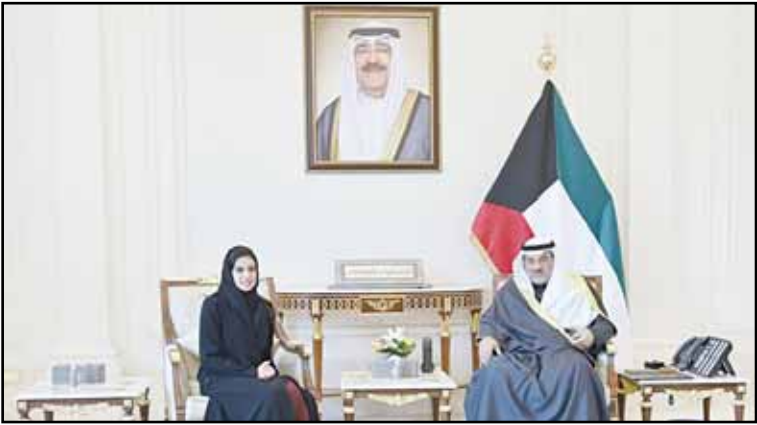
His Highness the Crown Prince Sheikh Sabah Khaled Al-Hamad Al-Sabah receives Secretary-General of UN Tourism (UNWTO) Shaikha Al-Nowais.