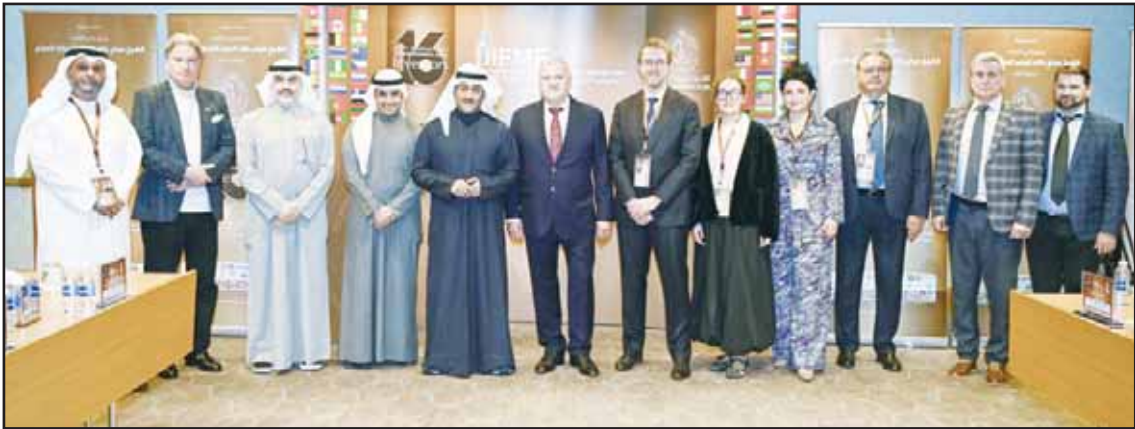
Delegates from Kuwait Science Club and the Russian Federal Service for Intellectual Property (Rospatent) pose for a group photo during their meeting at the 16th International Invention Fair.

link to facilitate cooperation between participating entities and relevant bodies in Kuwait, in support of the scientific ecosystem. For its part, the Russian delegation reviewed Rospatent's role in the digital transformation of IP systems, and its work as an International Searching and Preliminary Examining Authority under the Patent Cooperation Treaty (PCT). The delegation also highlighted the Federal Institute of Industrial Property (FIPS), including patent analytics capabilities, noting its cooperation with international partners in technical examination and research. At the end of the meeting, the delegation extended an invitation to KSClub to participate in the 8th International Rospatent Conference "ERA IP," scheduled to be held in Moscow on April 21, focusing on digital transformation and developing IP ecosystems.