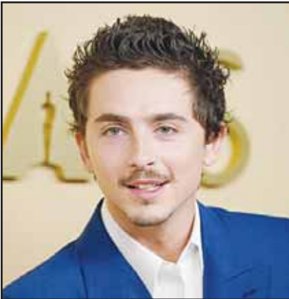
From left: Leonardo DiCaprio, Emma Stone, (left), and Yorgos Lanthimos and Timothée Chalamet arrive at the 98th Academy Awards Oscar nominees luncheon on Tuesday, Feb. 10, at the Beverly Hilton Hotel in Beverly Hills, Calif.