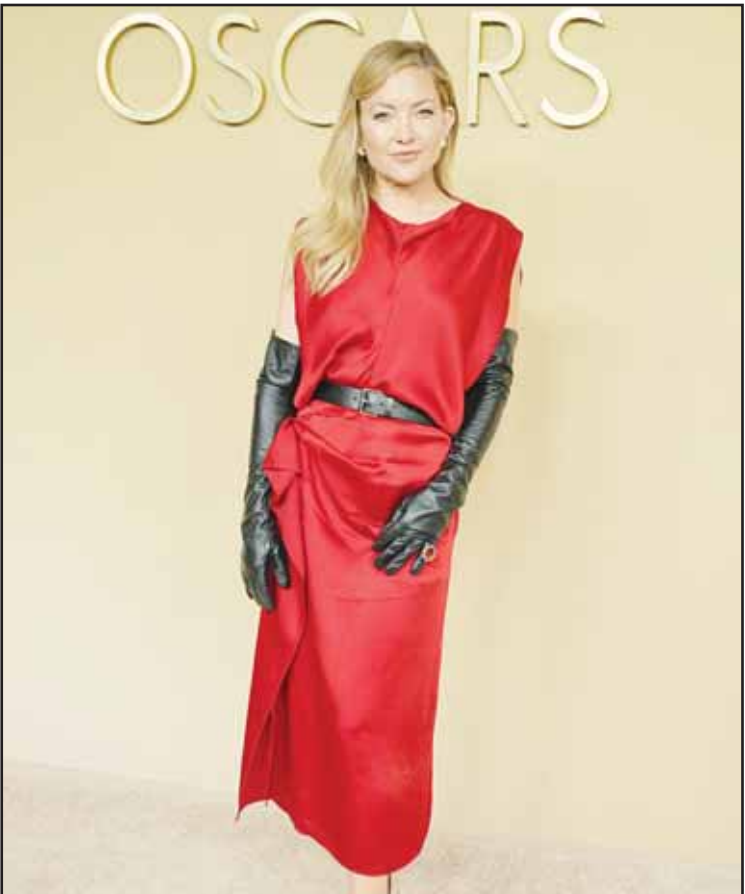
Kate Hudson arrives at the 98th Academy Awards Oscar nominees luncheon on Tuesday, Feb. 10, at the Beverly Hilton Hotel in Beverly Hills, Calif.