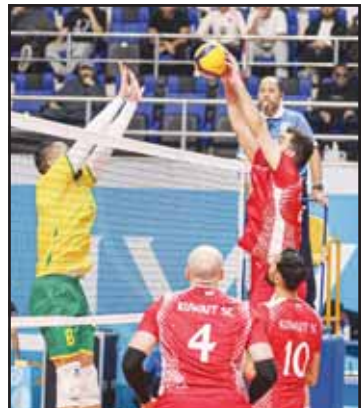
Players vie for the ball during the West Asia Volleyball Championship.

In the first semifinal at 3:00 p.m., hosts Kuwait Club will face defending champion Al-Rayyan of Qatar. The second semifinal, at 6:00 p.m., features a Bahraini derby on Kuwaiti soil between Dar Kulaib and Al-Ahli.