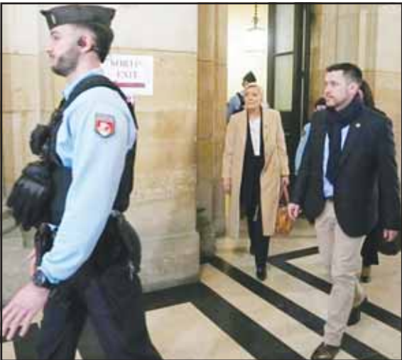
Far-right leader Marine Le Pen, (center), arrives for her appeal trial, in Paris, France on Feb 11.

tural producer and is home to Silicon Valley and Hollywood. The state budget tallies nearly $350 billion in annual spending, an amount roughly equal to the market value of Netflix. With Democratic Gov Gavin Newsom barred by law from seeking a third term, it’s the most wide-open contest for governor in a generation. Dozens of people have filed paperwork to run, from a college student to a billionaire. Among them are at least nine Democrats with the name recognition and fundraising machinery to seriously compete.