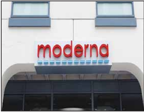
A sign marks an entrance to a Moderna building in Cambridge, Mass., May 18, 2020.