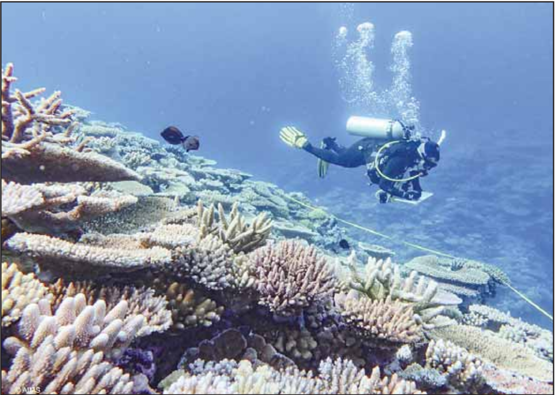
A diver inspects coral at the Great Barrier Reef in Far North Queensland, Australia, on Sept. 23, 2024.

well as involving maritime recovery tasks. The rocket and spaceship were both in their prototype configurations. The products used in the tests have been modified to meet the requirements and procedures for reuses, the CMSA noted. The tests also marked several historic firsts for China’s space program: the first ignition and flight of the Long March-10 rocket in its prototype configuration; the first maximum dynamic pressure abort flight test of a crewed spaceship; the first maritime splashdown of a crewed spaceship’s return capsule and a rocket’s first stage; and the first flight test conducted via a newly built launch pad at the Wenchang Spacecraft Launch Site. The success of the tests has provided valuable flight data and engineering experience for the crewed lunar exploration, the CMSA said. Previously, China conducted two static fire tests of the rocket, zero-altitude abort flight tests of the spaceship’s return capsule, and landing and takeoff tests of the moon lander.