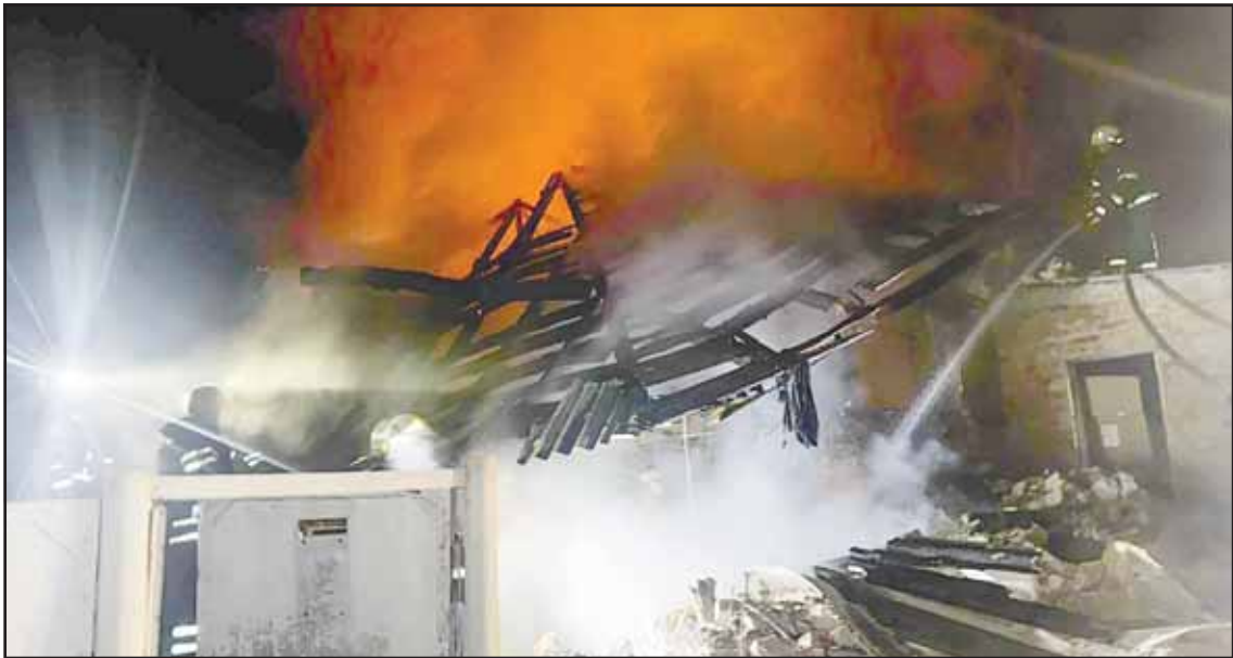
In this photo provided by the Ukrainian Emergency Service, emergency services personnel work to extinguish a fire at a private house following a Russian air attack in Bohodukhiv, Kharkiv region, Ukraine on Feb 11. (AP)