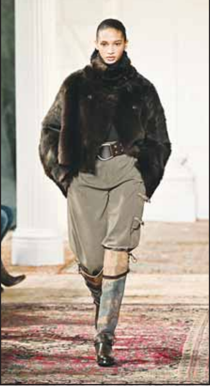
Models walk the runway during the Ralph Lauren Fall/Winter 2026 fashion show.