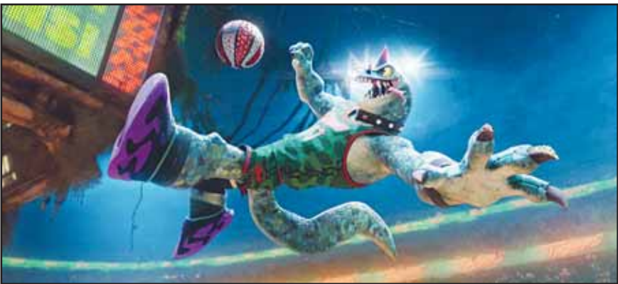
This image released by Sony Pictures shows the character Modo, voiced by Nick Kroll, in a scene from the animated film 'GOAT.' (AP)