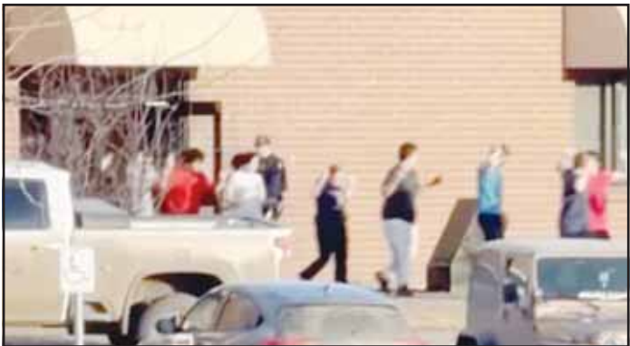
This grab from video shows students exiting the Tumbler Ridge school after deadly shootings, in British Columbia, Canada on Feb 10. (AP)

VANCOUVER, British Columbia, Feb 11, (AP): A shooting at a school in British Columbia left seven people dead, while two more were found dead at a nearby home, Canadian authorities said Tuesday. A woman who police believe to be the shooter also was killed. The Royal Canadian Mounted Police said more than 25 people are injured, including two who were airlifted to hospital with life-threatening injuries, after the shooting at Tumbler Ridge Secondary School. School shootings are rare in Canada. The town of Tumbler Ridge in the Canadian Rockies is more than 1,000 kilometers (600 miles) north of Vancouver, near the border with Alberta. The provincial government website lists Tumbler Ridge Secondary School as having 175 students from Grades 7 to 12. British Columbia Premier David Eby told reporters that police officers reached the school within two minutes. A video showed students walking out of the school with their hands raised as police vehicles surrounded the building and a helicopter circled overhead. Police found six people dead, a statement said. A suspect appeared to have died of a “self-inflicted injury.” An eighth person died while being transported to a hospital,