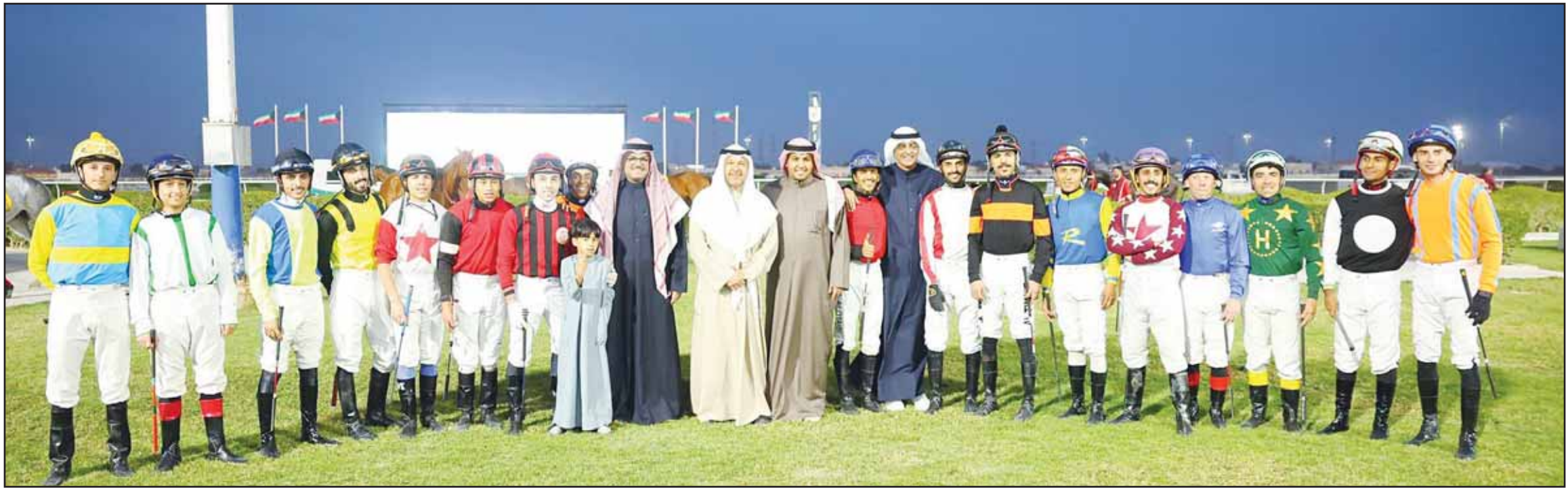
Farwaniya Governor poses with participants.