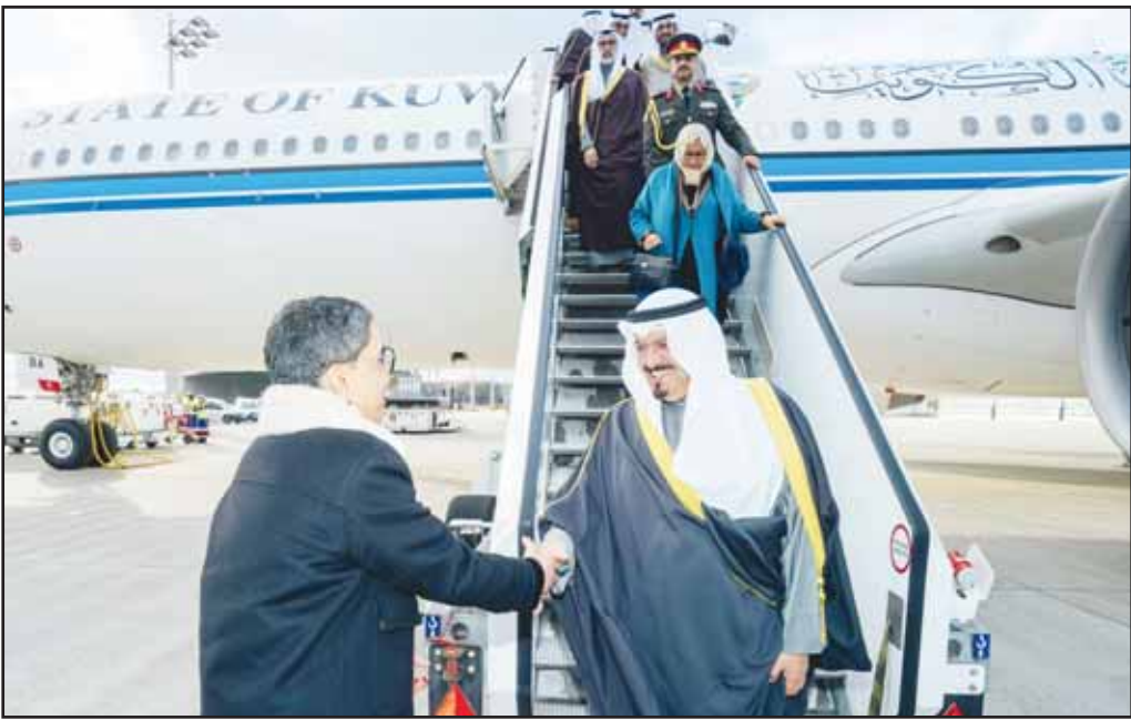
PM Diwan photo

Al-Refaei clarified that FY 2026-2027 budget is based on a conservative oil price assumption of USD 57 per barrel. The Minister, however, noted that Kuwait fiscal break-even price -- the valuation required to balance the budget -- is significantly higher at USD 90.5 per barrel.