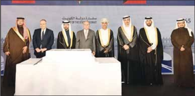
Ambassadors of the GCC countries in Lebanon at the Kuwaiti Embassy's celebration of the national holidays.