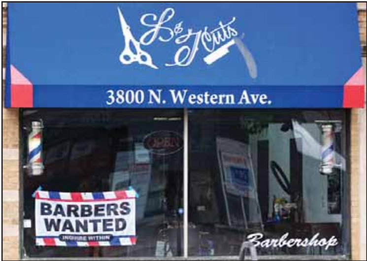
Hiring sign is displayed at a barbershop in Chicago, Thursday, Feb. 5, 2026.

Payroll processor ADP reported last week that private employers added 22,000 jobs in January, far fewer than economists had forecast. And the outplacement firm Challenger, Gray & Christmas reported that companies slashed more than 108,000 jobs last month, the most since October and the worst January for job cuts since 2009.