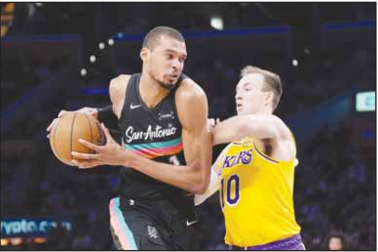
San Antonio Spurs forward Victor Wembanyama (1) is defended by Los Angeles Lakers guard Luke Kennard (10) during the first half of an NBA basketball game in Los Angeles.

Cooper Flagg finished with 27 for Dallas, which hasn’t won since beating Golden State at home on Jan. 22. It’s the Mavericks’ longest skid since also losing eight in a row in 2016. Phoenix nearly led the entire game, taking a 2-1 lead on Booker’s turnaround jumper with 10:01 left in the first quarter and never trailing again. The Suns led by as many as 31 points at 61-30 on their way to what appeared would be a blowout win - until the Mavericks made a game of it late.