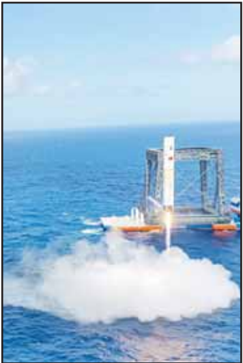
The first stage of the Long March-10 carrier rocket safely splashes down in the predetermined sea area in a controlled manner as planned, Feb. 11. (Xinhua)

WENCHANG, Hainan, Feb. 11, (Xinhua): China on Wednesday successfully conducted a low-altitude demonstration and verification flight test of its Long March-10 carrier rocket and a maximum dynamic pressure abort flight test of its new-generation crewed spacecraft Mengzhou. Carried out at the coastal Wenchang Spacecraft Launch Site in the southern island province of Hainan, these tests marked major breakthroughs in the country’s crewed lunar exploration program, the China Manned Space Agency (CMSA) said. China aims to land its astronauts on the moon before 2030. The Mengzhou, which means “dream vessel” in Chinese, is designed mainly for the mission. The Long March-10 rocket blasted off at 11:00 a.m. (Beijing Time). Upon reaching the conditions for abort at maximum dynamic pressure, the Mengzhou received command from the rocket and successfully executed separation and abort maneuvers. The rocket’s first stage and the spaceship’s return capsule splashed down separately in the