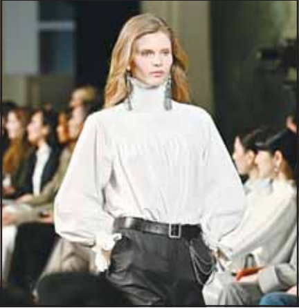
Models walk the runway during the Ralph Lauren Fall/Winter 2026 fashion show as part of New York Fashion Week, Feb. 10, in New York.