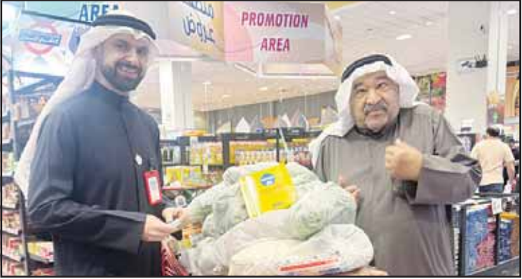
Gulf Bank donates food to a citizen in Alzaha Cooperative Society.

PRESS RELEASE: Global Finance Names The World’s Best Private Banks 2026 | Global Finance Magazine