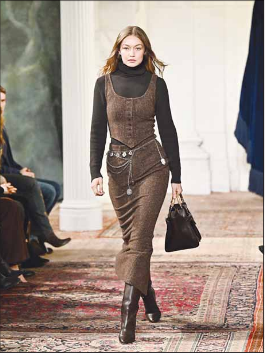
Model Gigi Hadid walks the runway during the Ralph Lauren Fall/Winter 2026 fashion show as part of New York Fashion Week, Tuesday, Feb. 10, in New York.