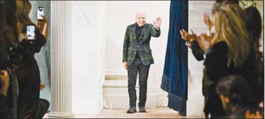
Designer Ralph Lauren takes a bow after the Ralph Lauren Fall/Winter 2026 fashion show.