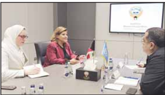
Assistant Foreign Minister for Human Rights Affairs, Ambassador Sheikh Jawaher Al-Sabah, during her meeting with a delegation from the Office of the High Commissioner for Human Rights.

KUWAIT CITY, Feb 11, (KUNA): Representatives of the Office of the High Commissioner for Human Rights (OHCHR) concluded an exploratory visit to Kuwait held from February 8 to 10, organized in coordination with the Ministry of Foreign Affairs. The Foreign Ministry said in a statement Wednesday that the visit came at Kuwait's invitation within its strategic partnership with the UN and in implementation of international human rights commitments undertaken during its 2024-2026 Human Rights Council membership. It added that the visit included meetings and field tours with government bodies and national institutions, as well as civil society organizations, including the ministries of justice, interior, defense, social affairs and information, the Public Prosecution and specialized institutes. The ministry noted the visit aimed to brief OHCHR representatives on Kuwait's human rights framework, legislation and policies, contributing to assessing existing efforts, identifying development areas and strengthening