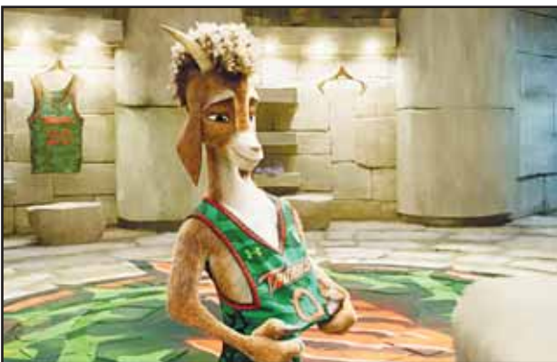
This image shows the character Will, voiced by Caleb McLaughlin, in a scene from 'GOAT.'

Animated basketball film falls short despite vibrant world