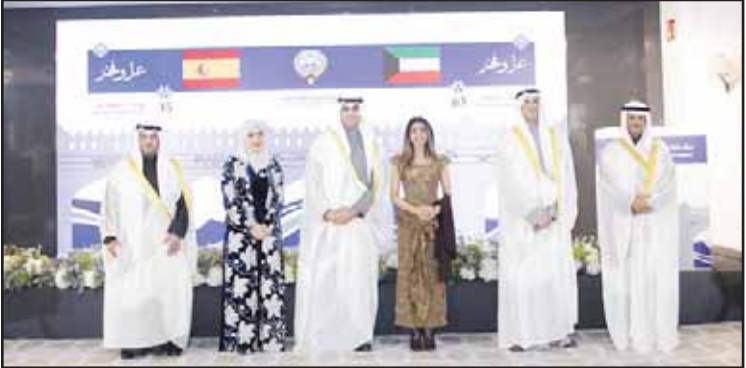
The Kuwaiti Embassy in Madrid celebrates national holidays.