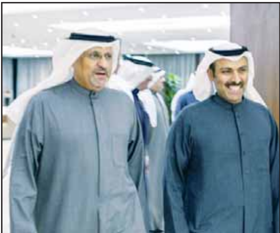
Minister of State for Communications and Information Technology and Acting Minister of Information and Culture, Omar Al-Omar, during his meeting with Bahraini Minister of Information, Dr. Ramzan Al-Nuaimi.

KUWAIT CITY, Feb 11, (KUNA): Acting Minister of Information and Culture Omar Al-Omar received on Tuesday Bahraini Minister of Information Dr. Ramzan Al-Nuaimi upon his arrival in Kuwait. Dr. Al-Nuaimi is visiting to participate in the Executive Bureau meeting of the Council of Arab Information Ministers, which Kuwait will host on Wednesday. In a statement to KUNA, Minister Al-Omar, also serves as Minister of State for Communications and Information Technology, emphasized the depth and strength of the fraternal relations between Kuwait and Bahrain. He commended the high-level of bilateral cooperation in various fields, particularly in media and culture, which reflects the historical ties between the two nations. He underscored the importance of developing mechanisms for joint Arab media work and enhancing coordination among Arab media institutions to serve Arab causes. Minister Al-Omar also stressed the need to keep pace with the rapid changes in the media sector and deliver professional and responsible news coverage. He noted Kuwait's keenness to support all efforts that would strengthen joint Arab media cooperation and intensify coordination among Arab ministries of information. He stressed the importance of unifying efforts to confront current challenges and present a balanced Arab media discourse that reflects shared values, preserves Arab