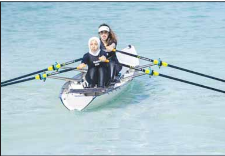
The Kuwaiti rowers in action at the 8th Arab Women's Clubs Games.