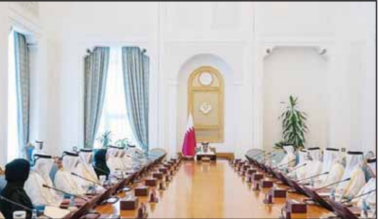
During the regular meeting of the Qatari Cabinet, chaired by Prime Minister and Minister of Foreign Affairs Sheikh Mohammad bin Abdulrahman, held at the Council's headquarters.

DOHA, Feb 11, (KUNA): The Qatari Cabinet welcomed the results of the seventh session of the Joint Higher Committee for Cooperation between the State of Qatar and the State of Kuwait. This came during the regular meeting of the Qatari Cabinet, chaired by Prime Minister and Minister of Foreign Affairs Sheikh Mohammad bin Abdulrahman, held at the Council's headquarters at the Amiri Diwan. The Cabinet said that it welcomed the results of the seventh session of the Joint Higher Committee for Cooperation between the State of Qatar and the State of Kuwait, which was held in Kuwait last Sunday. The session constituted a further step toward strengthening cooperation and integration between the two brotherly countries.