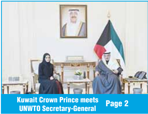
Kuwait Crown Prince meets UNWTO Secretary-General Page 2