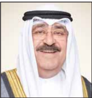
His Highness the Amir Sheikh Meshal Al-Ahmad Al-Jaber Al-Sabah

KUWAIT CITY, Feb 11, (KUNA): His Highness the Amir Sheikh Meshal Al-Ahmad Al-Jaber Al-Sabah sent a congratulatory cable on Wednesday to the Iranian President Dr. Masoud Pezeshkian, on his country's national day. In the cable, His Highness the Amir wished good health to the president and further progress and prosperity for his country and the people. His Highness the Crown Prince Sheikh Sabah Khaled Al-Hamad Al-Sabah sent a congratulatory cable on Wednesday to the Iranian President Dr. Masoud Pezeshkian, on his country's national day. In the cable, His Highness the Crown Prince wished good health to the president and further progress and prosperity for his country and the people.