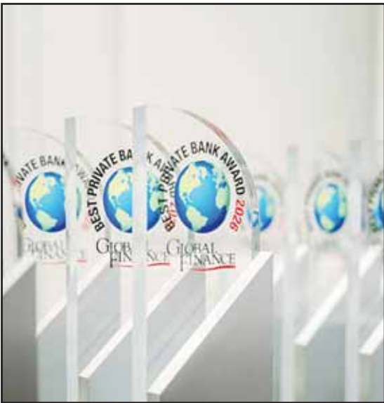
Global Finance Awards

NBK Wealth, a leading local and one of the largest wealth management institutions regionally, is a key pillar of NBK Group, one of the largest financial institutions in the Middle East. This gives it a strong foundation and extensive experience in local, regional, and global markets, as well as a broad geographical footprint spanning 9 cities in 5 different countries through which comprehensive experi-