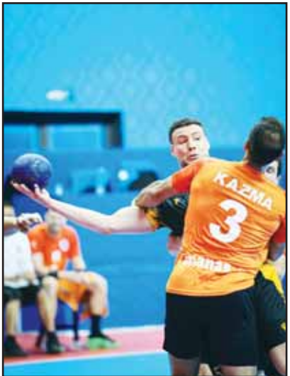
Qadsia and Kazma players fighting for the ball.

KUWAIT CITY, Feb 11: Al-Qadsia Club regained its momentum after a recent setback, narrowly defeating Kazma 21-20 in a tough match in the 10th round of the Handball Premier League at the Sheikh Saad Al-Abdullah Sports Complex Hall. In the same round, defending champions Kuwait Club overcame Al-Salmiya 35-27. Following these results, Al-Qadsia moved up to fourth place with 10 points, tied on goal difference with third-placed Burgan. Meanwhile, Kuwait Club maintained its position at the top of the Premier Handball League standings with a perfect 20 points. Kazma remains second with 13 points, while Al-Salmiya dropped to seventh place with six points. The 11th round begins next Saturday, with Al-Nasr facing Al-Salmiya and Al-Qadsia taking on Al-Arabi. On Sunday, Al-Sulaibikhat will meet Burgan, while Kuwait Club faces Kazma. In the First Division Handball League, Yarmouk will play Qurain at 5:00 p.m., followed by Fahaheel against Khaitan at 7:00 p.m. Khaitan leads the First Division standings