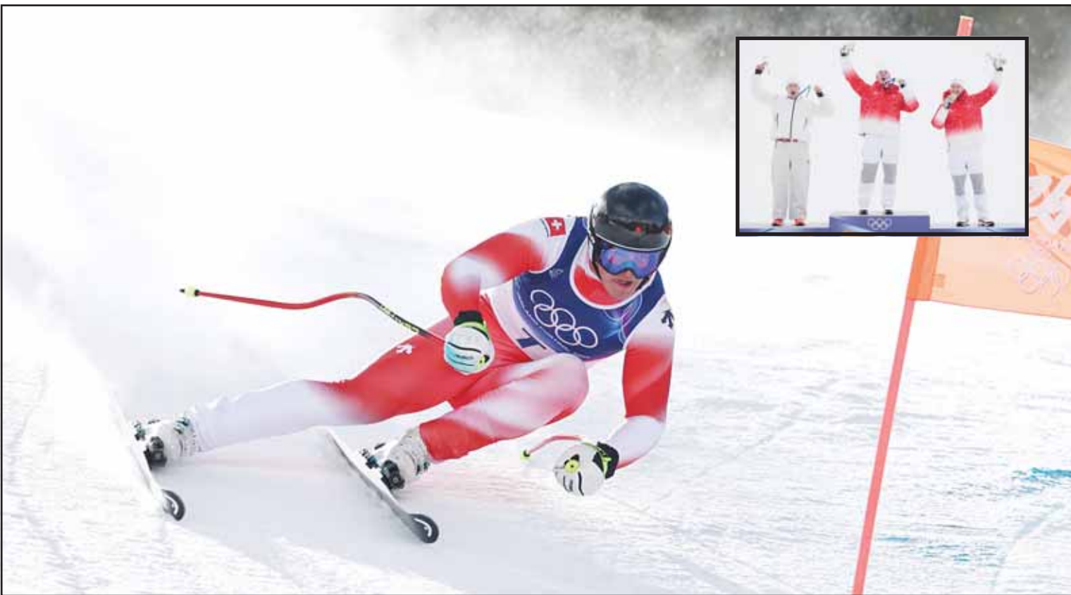
Switzerland's Franjo von Allmen speeds down the course during an alpine ski, men's super-G race, at the 2026 Winter Olympics, in Bormio, Italy. Inset: Von Allmen, gold medalist in an alpine ski, men's super-G race, center, celebrates on the podium with silver medalist United States' Ryan Cochran Siegle, left, and bronze medalist Switzerland's Marco Odermatt.

Perrine Laffont of France, the 2018 gold medalist, took bronze.