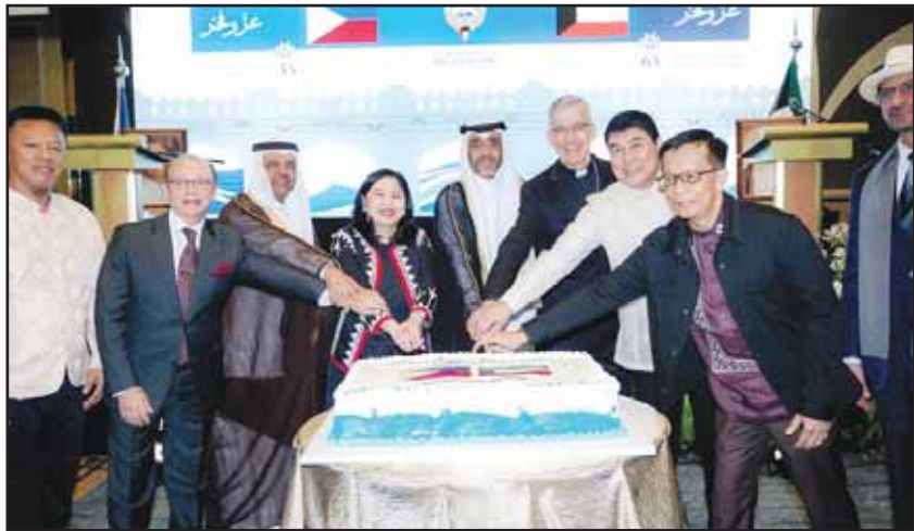
Kuwait Embassy staff and guests in Manila during the cake-cutting ceremony.