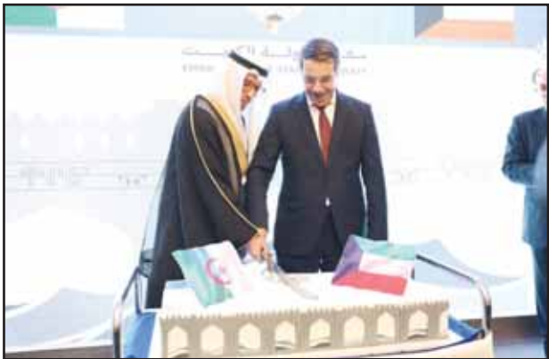
The Kuwaiti Embassy in Algeria, celebrates national holidays.