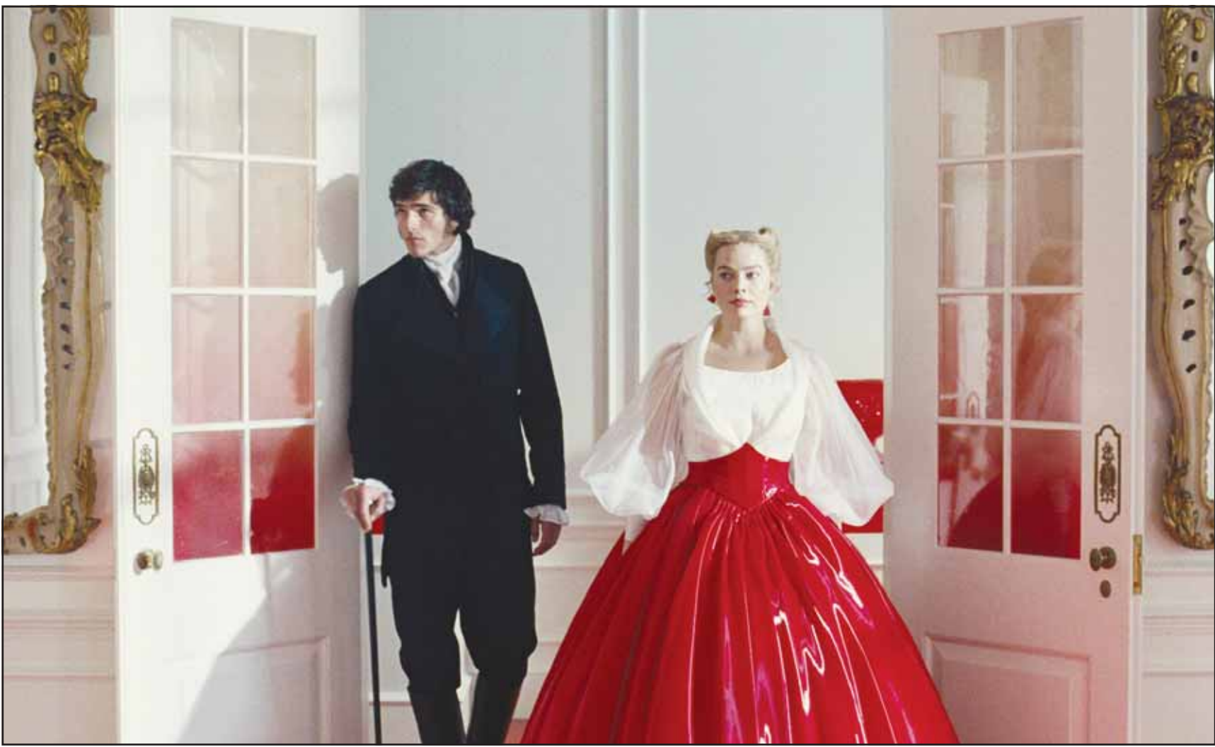
This image released by Warner Bros. Pictures shows Jacob Elordi and Margot Robbie in a scene from 'Wuthering Heights.'