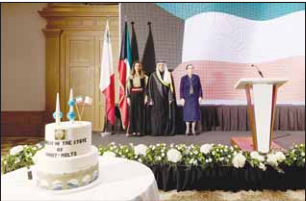
The Kuwaiti Embassy in Malta, celebrates national holidays.