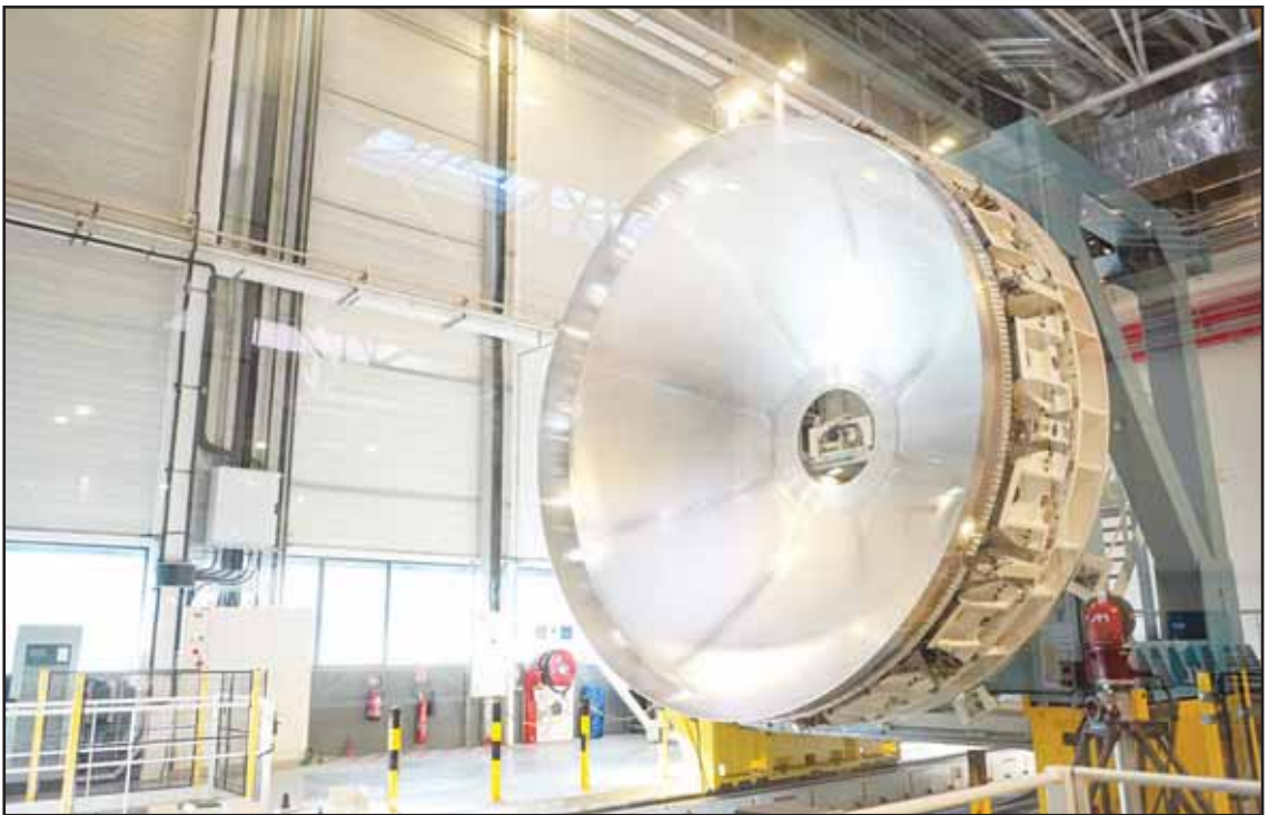
A partial view of assembly line of the Ariane 64 rocket, in Les Mureaux, west of Paris, Wednesday, Feb. 4.

In view of this, the NCCD advised parents to protect their children from a potentially severe disease by getting them two doses of the measles vaccine.