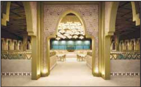
Four Seasons Kuwait celebrates Ramadan in opulent style.

Specially crafted banqueting menus rotate weekly and highlight a vast array of regional and international flavours: mezze and salads; sushi, Ouzi, and pasta; live tandoori sta-