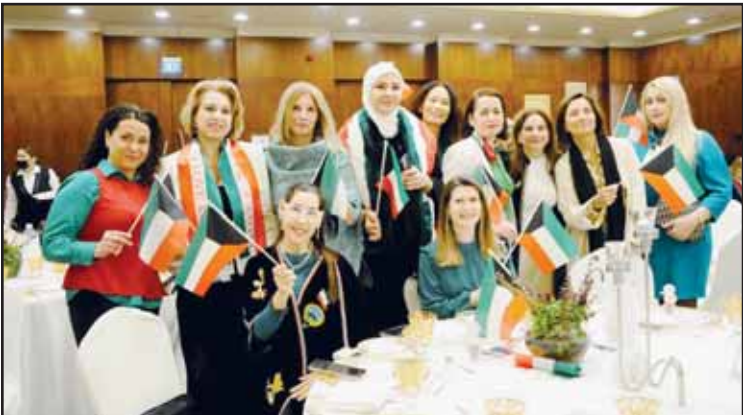
Attendees show their national pride, waving Kuwaiti flags during the festive 65th Independence and 35th Liberation anniversary celebrations.