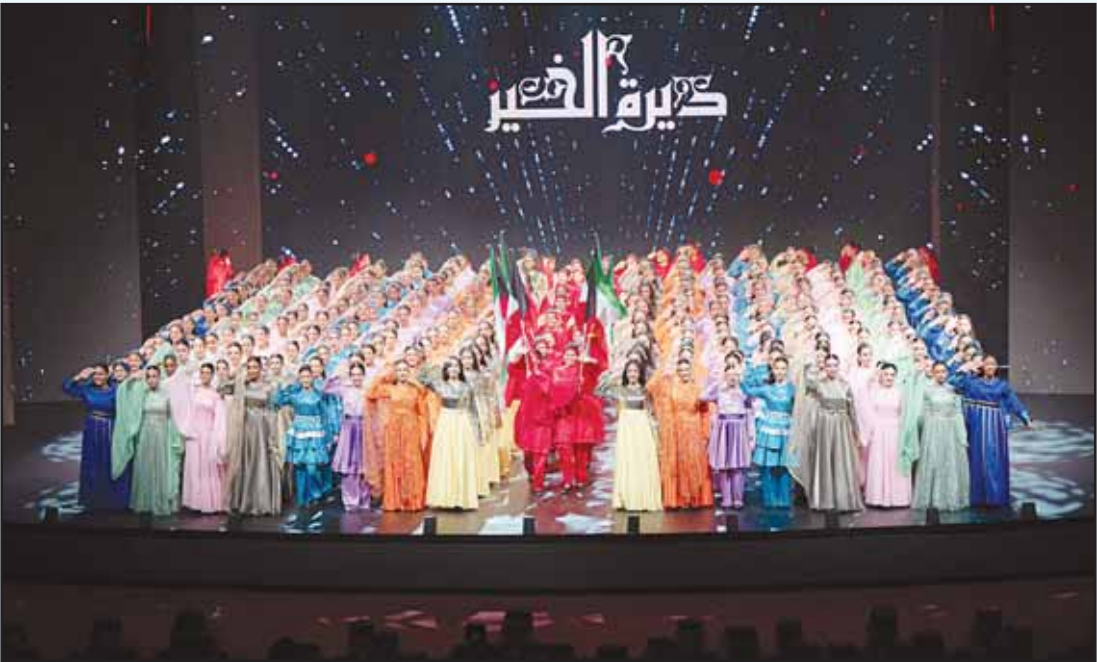
Photos during ‘Deerat Al-Khair’ National Operetta held on Tuesday at Bayan Palace Theater.