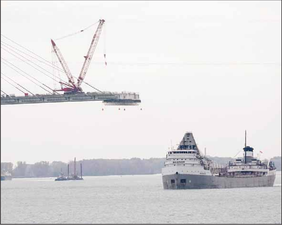
The Saginaw passes construction on the Gordie Howe International Bridge connecting Windsor, Ontario and Detroit on Oct 25, 2023.