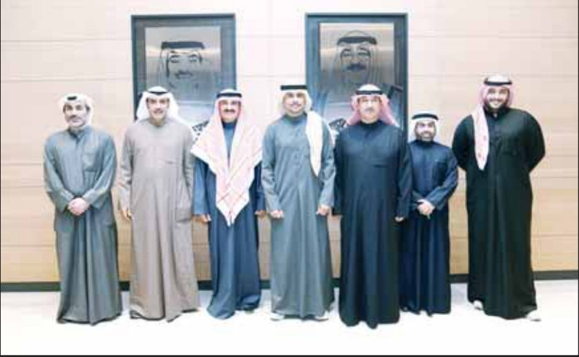
Chairman and board members welcome the Minister.

KUWAIT CITY, Feb 10: Dr. Tareq Al-Jalahma, Minister of State for Youth and Sports, paid a visit to the Kuwait Tennis Federation at the International Tennis Complex. He was welcomed by the Chairman and board members of the federation, who gave him a tour of the facilities, including the Rafa Nadal Tennis Academy Kuwait, highlighting the federation’s full range of tennis infrastructure. During the visit, the Minister praised the federation’s efforts and encouraged the board to continue striving for development, emphasizing the goal of placing Kuwaiti players at a distinguished level regionally, continentally, and internationally. He noted