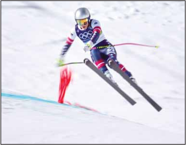
In this image taken from video provided by Olympic Broadcasting Services, OBS, United States' Lindsey Vonn crashes during an alpine ski women's downhill race, at the 2026 Winter Olympics, in Cortina d'Ampezzo, Italy.

Decision to race injured rests with the athlete, says president of FIS