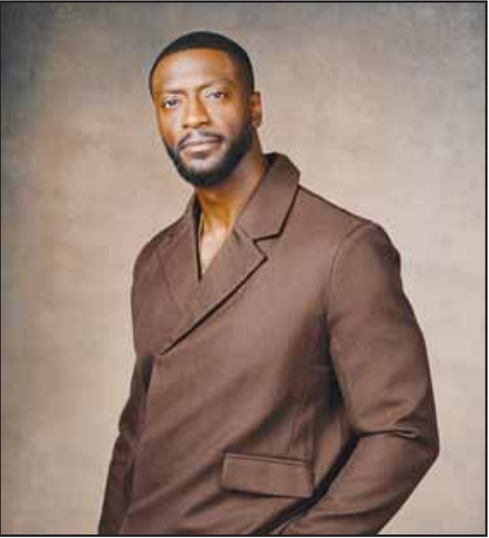
Aldis Hodge poses for a portrait in Los Angeles on Oct. 28, 2024.

AP: There’s an excellent running scene. Do you have to