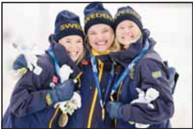
Gold medalist Linn Svahn, center, silver medalist Jonna Sundling, left, and bronze medalist Maja Dahlqvist, all three of Sweden, pose after the cross-country skiing women's sprint classic at the 2026 Winter Olympics, in Tesero, Italy. — See Page 15