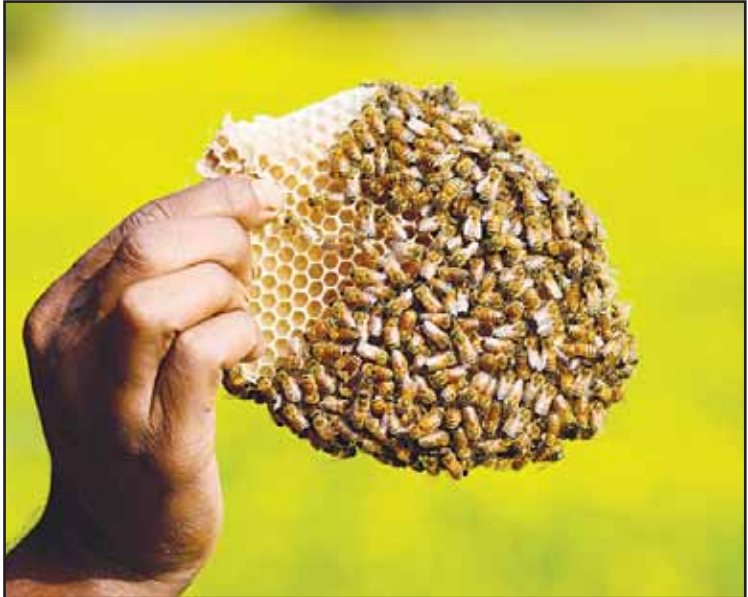
A migratory beekeeper holds a piece of a beehive in the Binnabari village in Baksa district of Assam, India, Friday, Jan. 16, 2026.