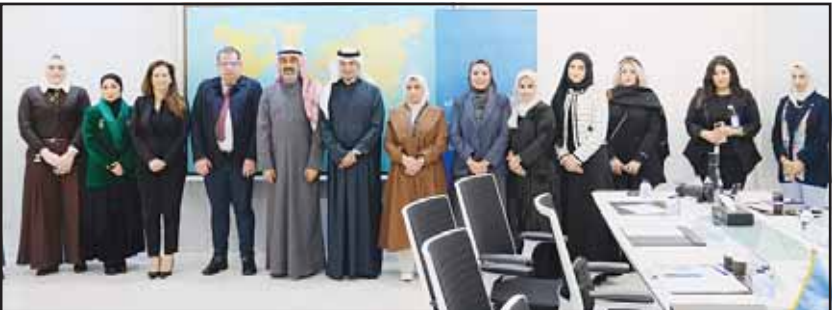
Kuwait’s National Diwan for Human Rights (NDHR) meet delegation from the Office of the UN High Commissioner for Human Rights (OHCHR) for Middle East and North Africa to discuss ways to strengthen technical cooperation and exchange expertise.

Kuwaiti innovators put country strongly on global map