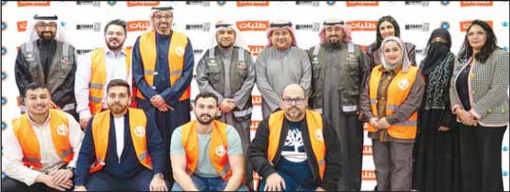
talabat - Ramadan Food Basket