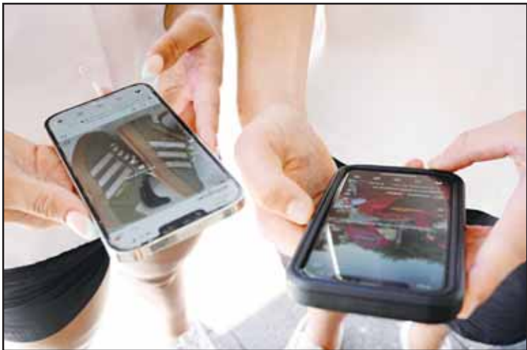
Young people use their phones to view social media in Sydney, Nov. 8, 2024.