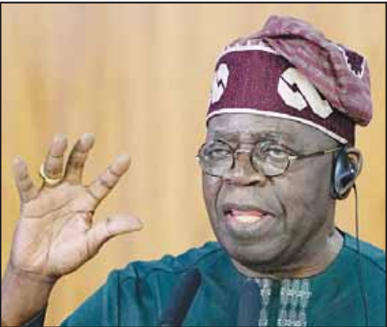
Nigeria’s President Bola Tinubu gives a joint statement with Brazil’s President Luiz Inacio Lula da Silva, at the Planalto presidential palace, in Brasilia, Brazil on Aug 25, 2025.

ABUJA, Feb 10, (Xinhua): Nigerian President Bola Tinubu said on Monday that the West African country would defeat terrorism and banditry, describing the threats as “unacceptable” and alien to core values. Insecurity remained a major hindrance to economic growth and development, requiring urgent collective action, Tinubu said while opening the country’s high-level second National Economic Council (NEC) Conference in the capital, Abuja. According to him, insecurity had kept all citizens sleepless at night. He assured the citizens that all would soon come to an end, citing his earlier promises. “We will overcome this unacceptable terrorism and banditry. It is not part of our culture. It is foreign to us.” Tinubu tasked NEC, statutorily comprising the vice president and all governors of the country’s 36 states and the Federal Capital Territory, to drive inclusive growth, stressing the need for the effective implementation of the Renewed Hope National Development Plan 2026-2030. Themed “Delivering Inclusive Growth and Sustainable National Development: The Renewed Hope National Development Plan 2026-2030,” the two-day conference is attended by state governors, ministers, members of the National Assembly, development partners, and private sector leaders. Describing the Renewed Hope National Development Plan 2026-2030 as “evidence-based, realistic and anchored on inclusive and sustainable growth,” the Nigerian president said it was also designed to deepen grass-