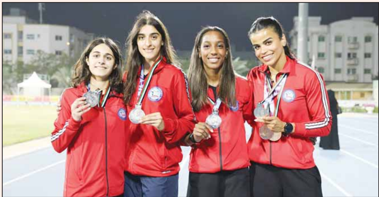
Salwa Al-Sabah Club players with their medals.

SHARJAH, Feb 10: Salwa Al-Sabah Club secured four medals at the 8th Arab Women's Club Games, currently underway in the Emirate of Sharjah.