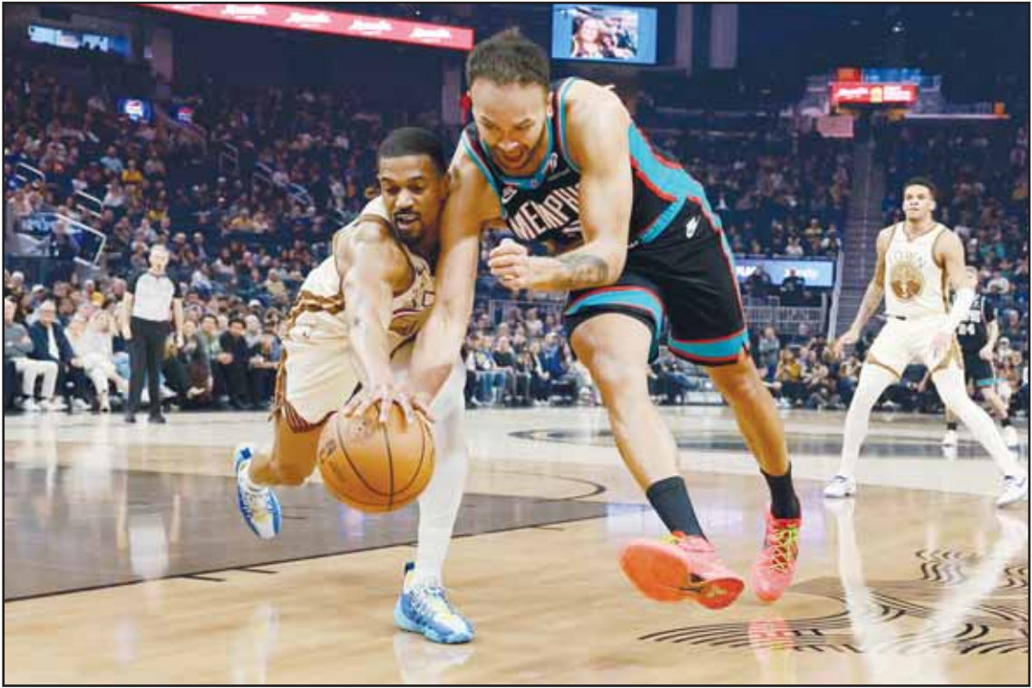
Memphis Grizzlies forward Kyle Anderson, right, and Golden State Warriors guard De'Anthony Melton, left, reach for a loose ball during the first half of an NBA basketball game in San Francisco.

In Orlando,Anthony Black scored 26 points, Desmond Bane added 25 and Orlando beat Milwaukee to snap the Bucks' season-long three-game