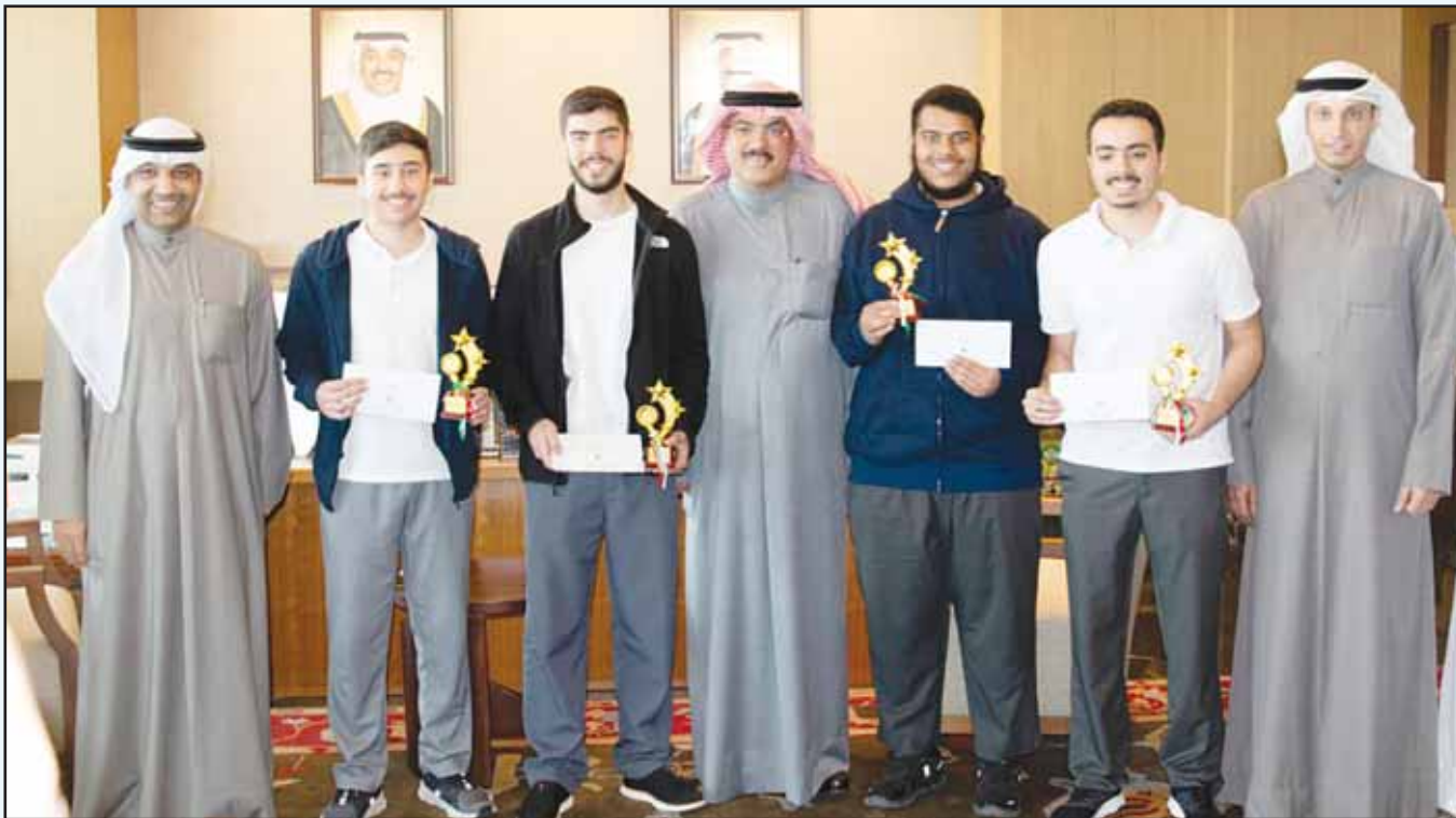
Minister of Education Eng. Sayed Jalal Al-Tabtabaie poses with students who won HH Amir's Cup.