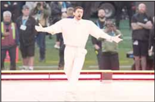
Bad Bunny performs during halftime of the NFL Super Bowl 60 football game between the Seattle Seahawks and the New England Patriots, Sunday, Feb. 8, in Santa Clara, Calif.

Several of the charting songs marked notable returns. Six of the 23 tracks re-entered the daily Top 100 Global for the first time since at least February 2025. His collaboration on the song "I Like It" with Cardi B and J Balvin re-entered the chart for the first time since January 2020.