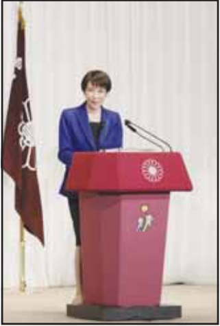
Japan’s Prime Minister Sanae Takaichi, leader of the ruling Liberal Democratic Party (LDP), speaks during her press conference on Feb 9 in Tokyo.

TOKYO, Feb 10, (Xinhua): Japan will convene a special parliamentary session on Feb. 18 to choose the prime minister following Sunday’s House of Representatives election, local media reported Tuesday. According to Jiji Press, the Japanese Constitution stipulates that an extraordinary Diet session must be convened within 30 days after a House of Representatives election to designate a prime minister. On the opening day of the session, the incumbent cabinet will collectively resign. The newly elected House of Representatives and the current House of Councillors will then vote separately to designate a new prime minister, who will subsequently form a new cabinet. In the prime ministerial designation election, a candidate who secures a majority in the first round of voting in each chamber wins outright. If no candidate obtains a majority, the top two vote-getters advance to a runoff, with the winner decided by a simple majority. If the two chambers designate different candidates and fail to agree after consultations, the Constitution stipulates that the decision of the powerful House of Representatives shall prevail. Given that the Liberal Democratic Party (LDP) currently holds more than two-thirds of the seats in the lower house, Japanese media believe that LDP President and Prime Minister Sanae Takaichi is all but assured of victory in the