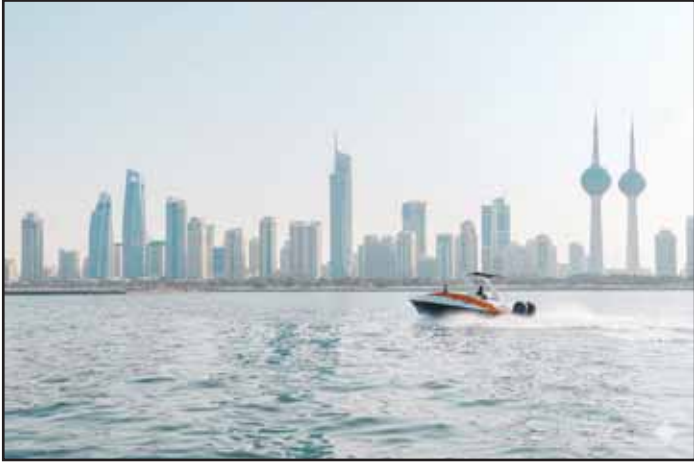
Participants in action.

KUWAIT CITY, Feb 10: The Captain’s Club, the region’s largest boat club, has officially announced its launch in the State of Kuwait in partnership with Al Boom Marine, and with the support of Joan Alkuwait Marine Services and Logistics Company, marking a strategic milestone in the club’s regional expansion. The launch forms part of The Captain’s Club’s broader growth strategy as a company owned by Easy Lease, a subsidiary of IHC, one of the region’s largest investment groups – further strengthening the club’s long-term vision and operational scale. Founded in 2014 in the UAE, The Captain’s Club now operates a fleet of over 250 boats across