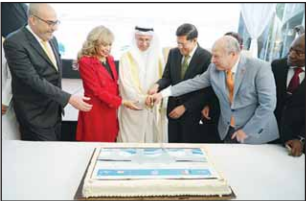
The Kuwaiti Embassy in Mexico, celebrates national holidays.