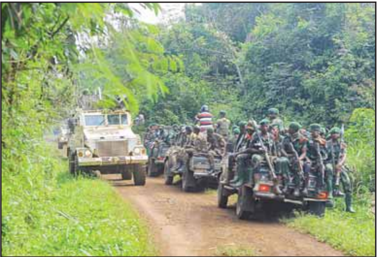
Congolese Defense Forces soldiers and United Nations forces patrol the area of an attack near the town of Oicha, 30 kms (20 miles) from Beni, Democratic Republic of Congo on July 23, 2021.