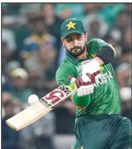
Pakistan's Shahbaz Farhan hits a six during the T20 World Cup cricket match between Pakistan and the United States in Colombo, Sri Lanka.

"We are deeply moved by Pakistan's efforts to go above and beyond in supporting Bangladesh during this period," Islam said. "Long may