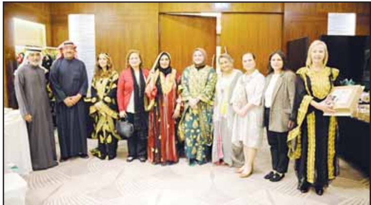
Members of the International Women's Group and distinguished guests gather to celebrate Kuwait's National and Liberation Days.