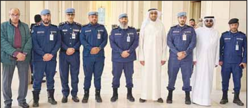
Kuwait Fire Force officials during their visit to the Grand Mosque in Kuwait City.