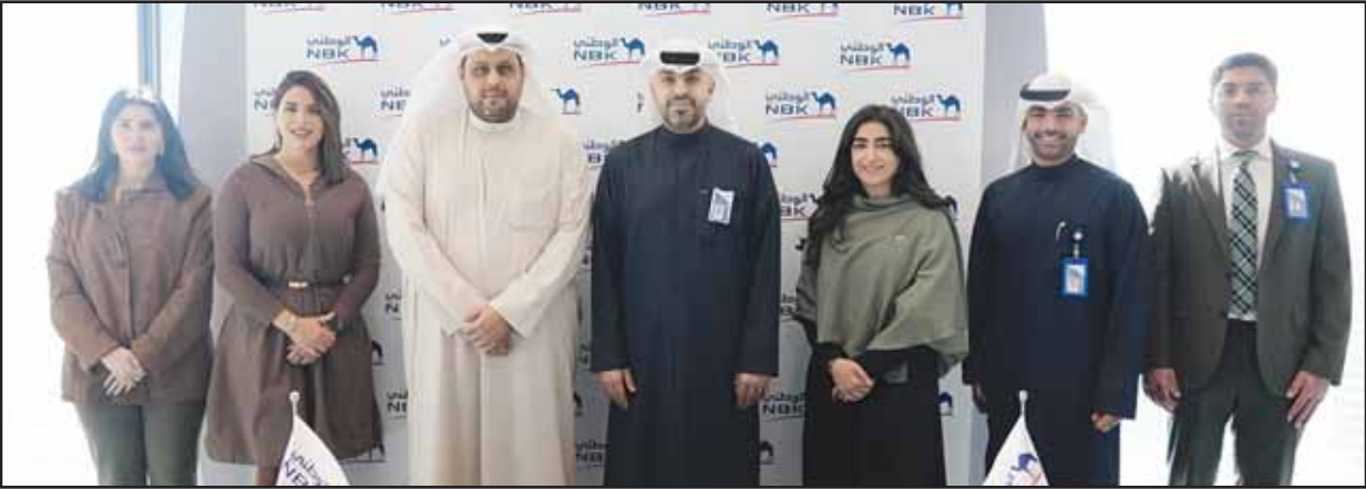
NBK partners with Ghmza for Arab Content Creators Forum 2026.

Finally, Al-Rushaid emphasized that through this partnership, NBK seeks to enhance its community role and expand the scope of its initiatives aimed at empowering youth and developing digital skills, in line with its vision of supporting innovation and sponsoring national talents.