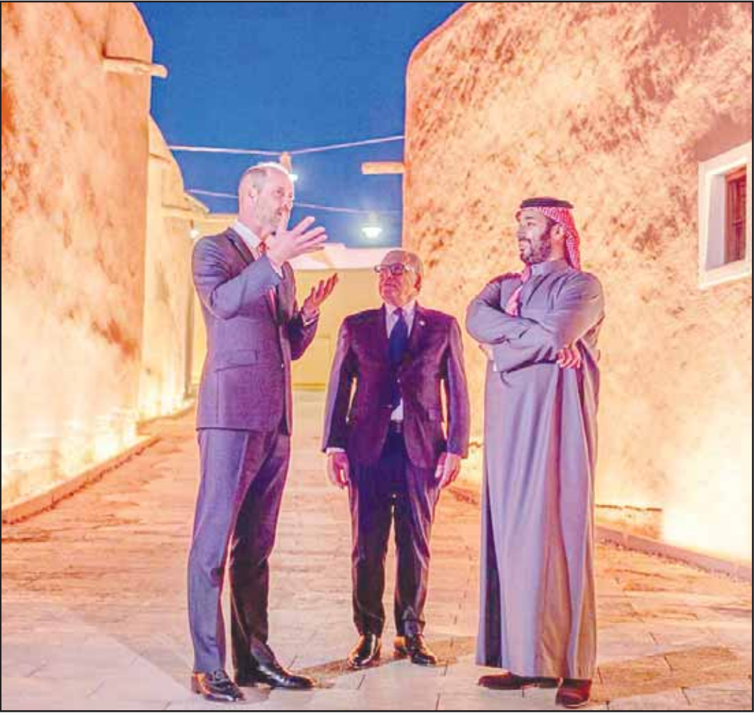
In this photo provided by the Saudi Media Ministry, Prince William of Wales, speaks to Saudi Crown Prince Mohammed bin Salman, during his visit to UNESCO World Heritage Site, At-Turaif in Riyadh, Saudi Arabia, Monday, Feb. 9. (AP)

In addition, more than 40 state attorneys general have filed lawsuits against Meta, claiming it is harming young people and contributing to the youth mental health crisis by deliberately designing features on Instagram and Facebook that addict children to its platforms. The majority of cases filed their lawsuits in federal court, but some sued in their respective states.