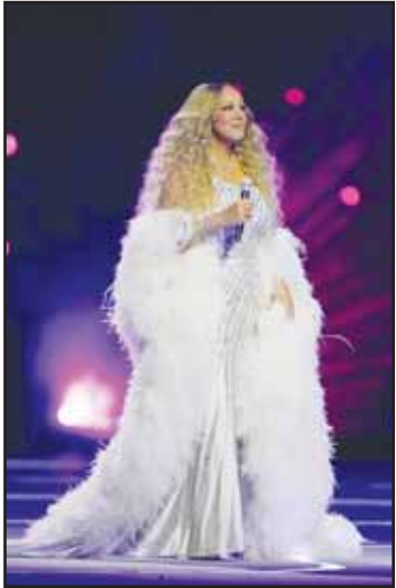
Singer Mariah Carey performs during the Olympic opening ceremony at the 2026 Winter Olympics, in Milan, Italy, Friday, Feb. 6.

“The show continues with Mariah Carey,” he said as the camera locked onto Italian actress Matilda De Angelis, who is known throughout the