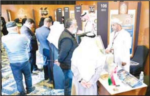
A view of the exhibition.

He expressed his pride in their significant volunteer contributions and their continuous support throughout the year in providing the Club and inventors with the necessary scientific and technical consultations.