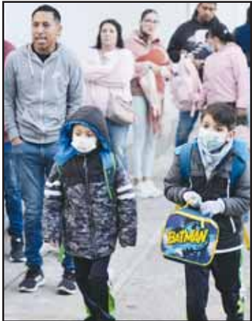
Students arrive to school wearing face masks due to a measles outbreak in Guadalajara, Mexico, Friday, Feb. 6.

Measles cases began surging last year in the northern border state of Chihuahua. Officials traced that