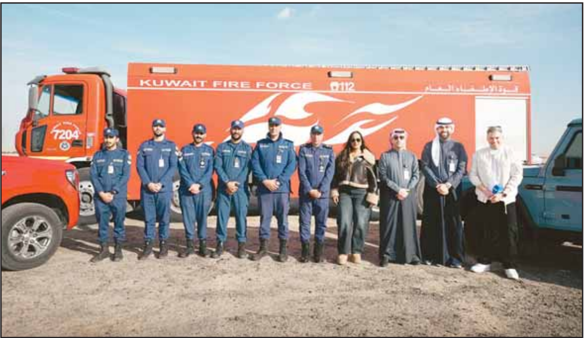
Burgan Bank team with Kuwait Fire Force personnel in a group photo during the awareness campaign.