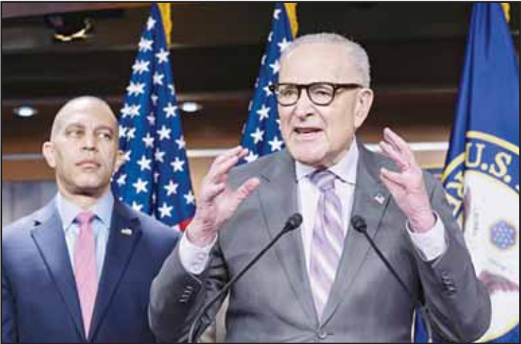
US Senate Minority Leader Chuck Schumer (center), speaks during a news conference as House Minority Leader Hakeem Jeffries listens, at the Capitol in Washington on Feb 4.

ous about Immigration and Customs Enforcement’s aggressive crackdown have said they won’t vote for another penny of Homeland Security funding until en-