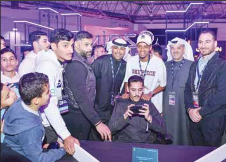
Engaging gameplay moments at Zain’s interactive zone.