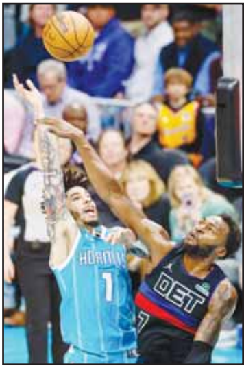
Charlotte Hornets guard LaMelo Ball (1) shoots against Detroit Pistons forward Paul Reed, right, during the second half of an NBA basketball game in Charlotte, N.C.

In Los Angeles, Jalen Williams scored 15 of his 23 points in the sec-