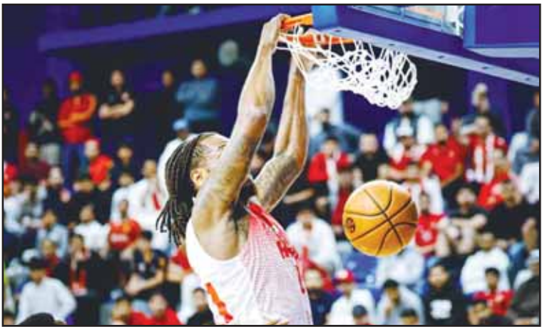
Kuwait Club player dunks over an opponent.