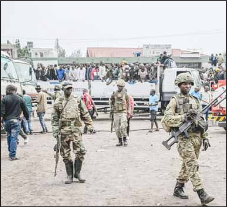
M23 rebels escort government soldiers and police who surrendered to an undisclosed location in Goma, Democratic republic of the Congo, Jan 30, 2025.