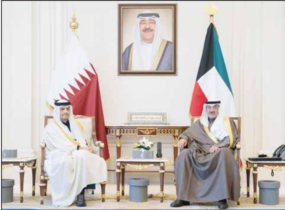
Crown Prince Diwan photo HH the Crown Prince receives Qatari Prime Minister and Minister of Foreign Affairs.

KUWAIT CITY, Feb 8, (KUNA): His Highness the Amir Sheikh Meshal Al-Ahmad Al-Jaber Al-Sabah received on Sunday at Bayan Palace His Highness the Crown Prince Sheikh Sabah Khaled Al-Hamad Al-Sabah.