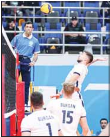
Burgan player goes for a shot against Dar Kulaib as teammates and officials look on.

KUWAIT CITY, Feb 8: Burgan Club's first volleyball team suffered a second consecutive defeat after losing to Bahrain's Dar Kulaib in Group C of the preliminary round of the 4th West Asia Volleyball Championship, currently being held at the Federa-