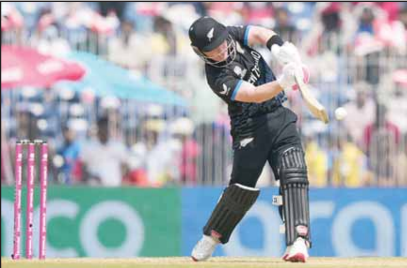
New Zealand’s Tim Seifert plays a shot during the T20 World Cup cricket match between Afghanistan and New Zealand in Chennai, India.