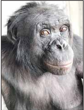
This undated photo provided by the Ape Initiative shows Kanzi, a bonobo who learned to communicate with humans, in Des Moines, Iowa.

Researchers adapted the playbook for studying young children to stage a juice party for Kanzi. They poured imaginary juice from a pitcher into two cups, then pretended to empty just one. They asked Kanzi which cup he wanted and he pointed to the cup still containing pretend juice 68% of the time.