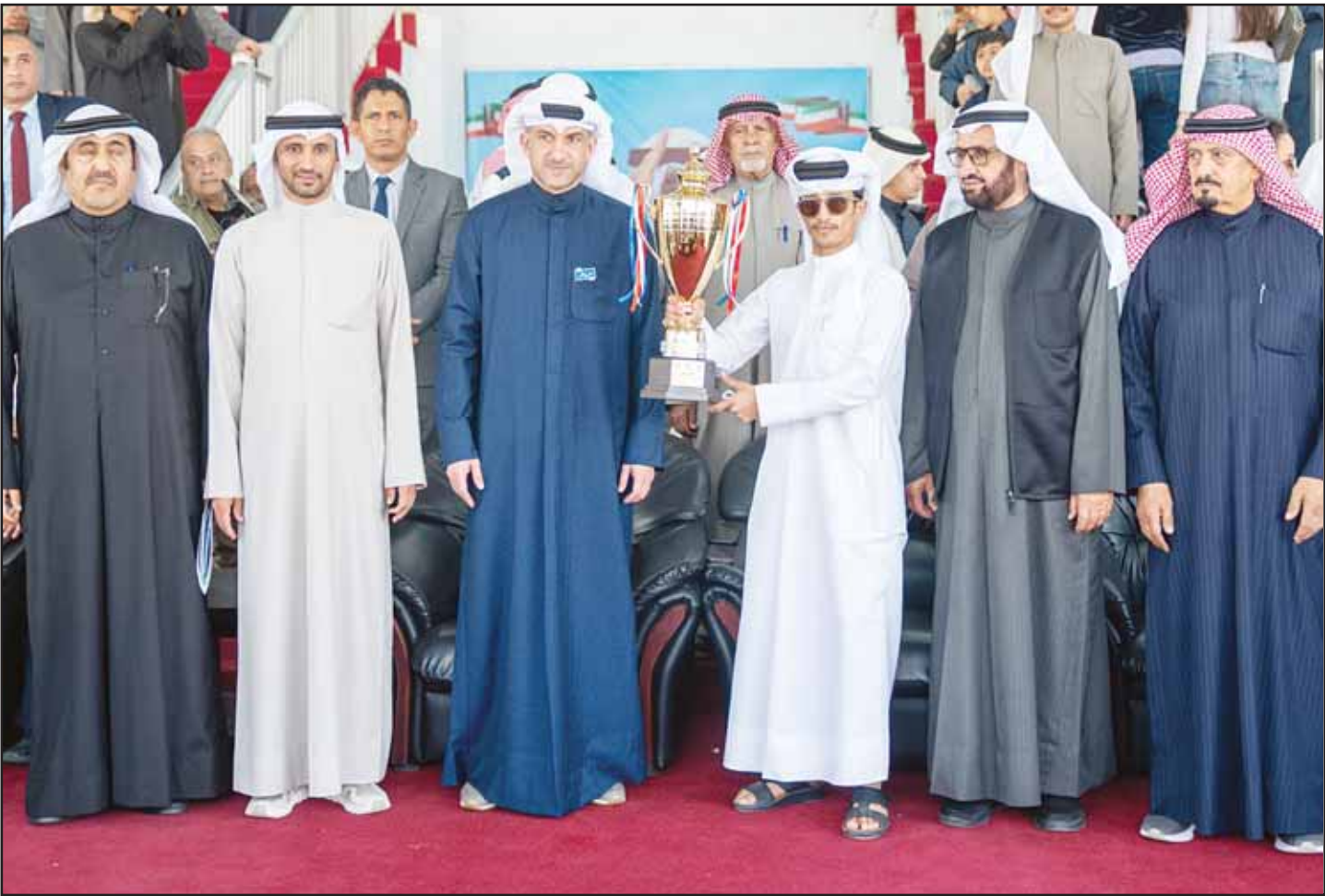
A winner hoists trophy as officials look on.