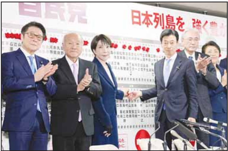
Sanae Takaichi, (center), Japan’s prime minister and president of the ruling Liberal Democratic Party (LDP), with other lawmakers put pins marking the names of candidates who won lower house elections at the LDP headquarters on Feb 8, in Tokyo. (AP)

TOKYO, Feb 8, (AP): Japanese Prime Minister Sanae Takaichi’s governing party is almost certain to win a single-party majority in a key parliamentary election Sunday, NHK public television and other major networks say, citing their exit polls. NHK says Takaichi’s governing coalition led by her Liberal Democratic Party could also win more than two-thirds of the 465-seat lower house, the more powerful of the country’s two-chamber parliament. That’s a level that would allow the governing bloc to dominate house committee chairs to steer policy and budget bills. NHK, citing results of early vote counts, said the LDP alone secured 244 seats, surpassing a majority at 233. The huge jump from the pre-election share may allow Takaichi to make progress on a right-wing agenda that aims to boost Japan’s economy and military capabilities as tensions grow with China and she tries to nurture ties with the United States. Takaichi is hugely popular, but the governing LDP, which has ruled Japan for most of the last seven decades, has struggled with funding and religious scandals in recent years. She called Sunday’s early election only after three months in office, hoping to turn that around while her popularity is high. The ultraconservative Takaichi, who took office as Japan’s first female leader in October, pledged to “work, work,