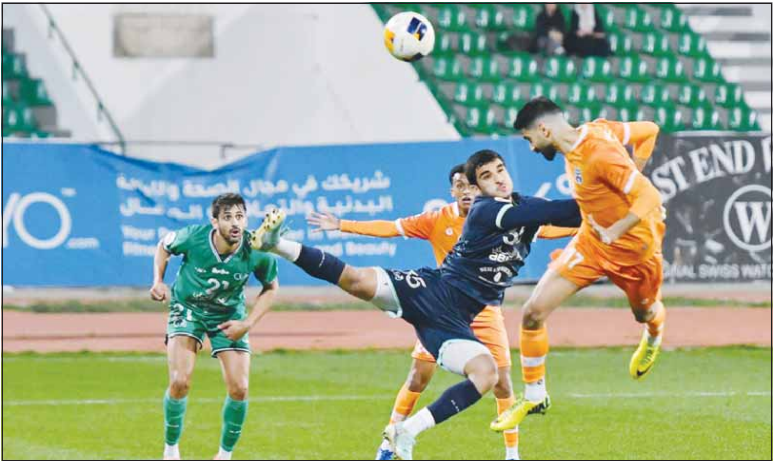
Kazma player heads the ball past Al-Arabi goalkeeper during the Zain Premier League match.