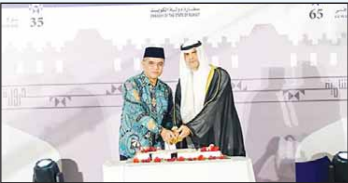
Cake-cutting ceremony in Indonesia.