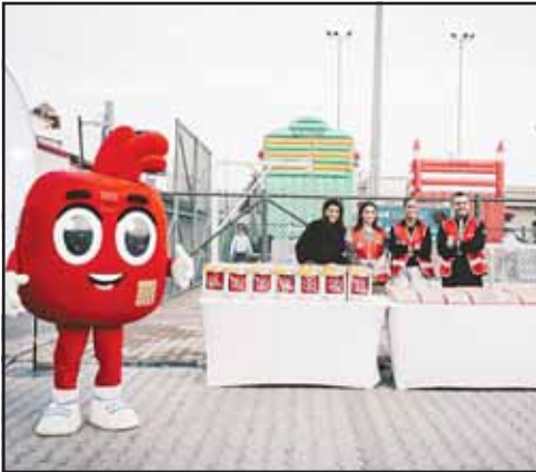
Group photo of the Gulf Bank team.