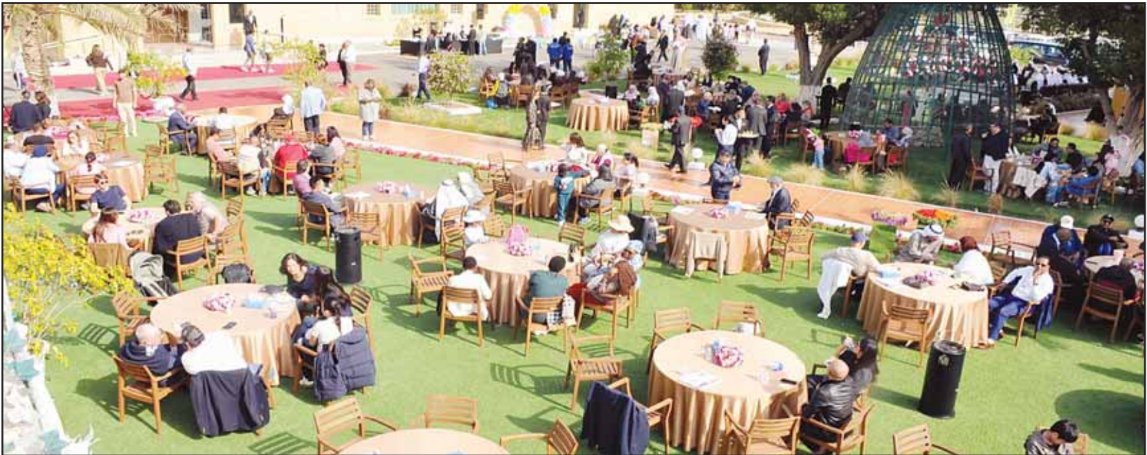
During the annual Diplomatic Day gathering at Azayez farm.