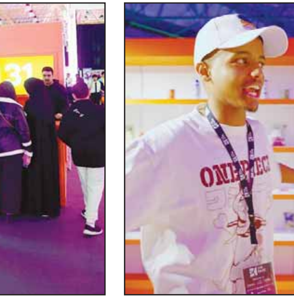
talabat x Base Game

Director at talabat Kuwait. “With digital innovation at the heart of our future-ready culture and the country’s momentous cross-sectoral development, it is important to recognize the varied opportunities sprouting across the landscape, such as investing in the mega esports industry and the role it