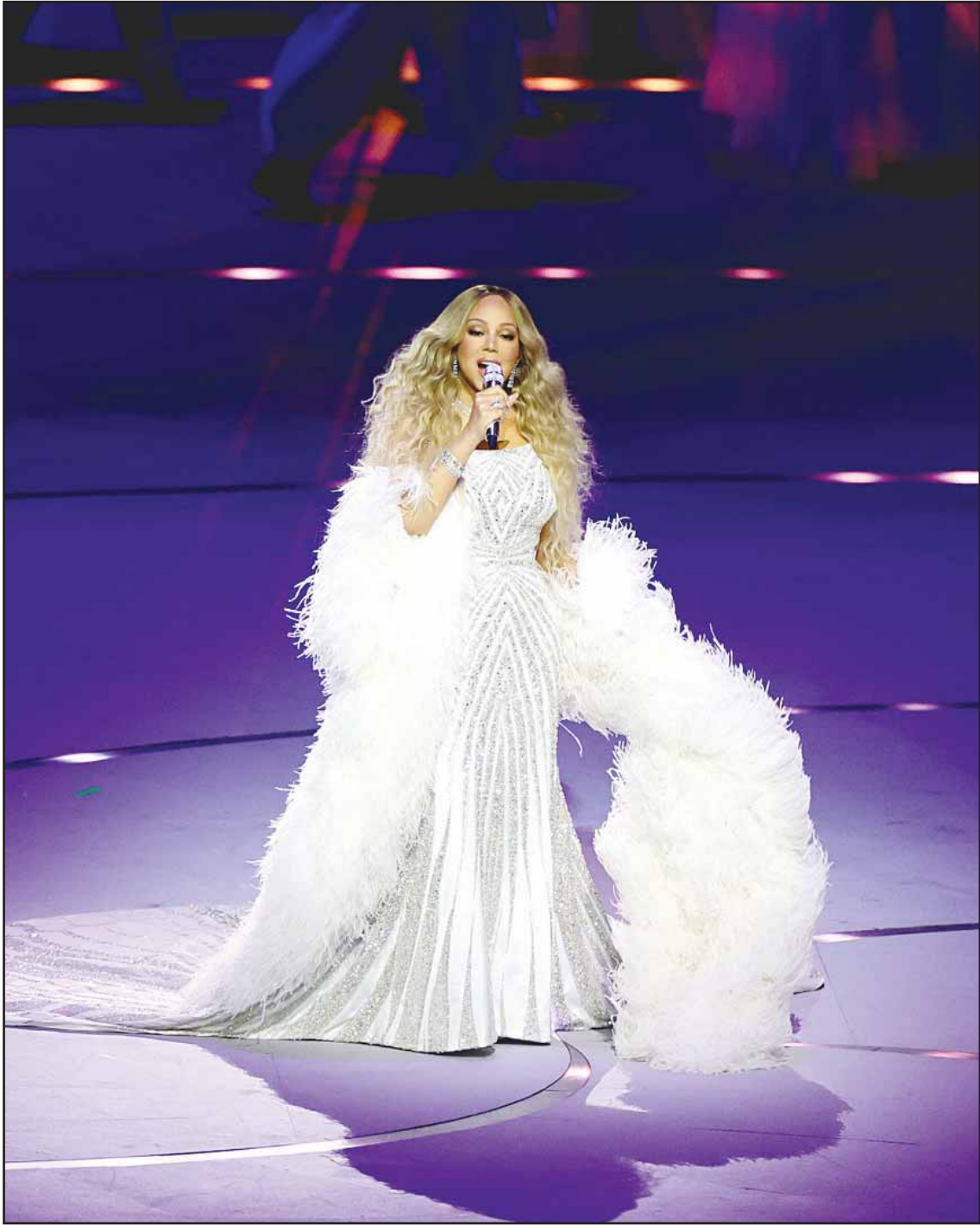
Mariah Carey performs at the Olympic opening ceremony at the 2026 Winter Olympics, in Milan, Italy, Friday, Feb. 6.

MILAN, Feb 8, The performance by pop star Mariah Carey at the Milan Cortina Winter Olympics opening ceremony was the talk of the town - but it also raised a few questions. The rendition by the American singer of Italian classic “Nel Blu Dipinto di Blu” - better known as “Volare” - was a showstopping highlight in the 3½-hour spectacle that kicked off the Games. “Such a dream come true to perform (in Italian!) at the Milano Cortina 2026 Olympic Winter Games Opening Ceremony,” she later wrote in an Instagram post. She received rave reviews from many, who called her marvelous and touted her high notes. But her performance Friday also prompted a good deal of criticism online, where commenters were confused why an Italian singer wasn’t given the honor. Some noted a large teleprompter with a phonetic breakdown of the song’s Italian lyrics, while others wondered if she was lip-syncing. Three reporters - including The Associated Press - asked the International Olympic Committee and local organizers about her during their daily news conference Saturday to address the teleprompter and doubts about lip-syncing. Carey was born in New York to an Irish American mother, who was an opera singer, and a Black father with Venezuelan roots. Despite her non-Italian background, the local organizing