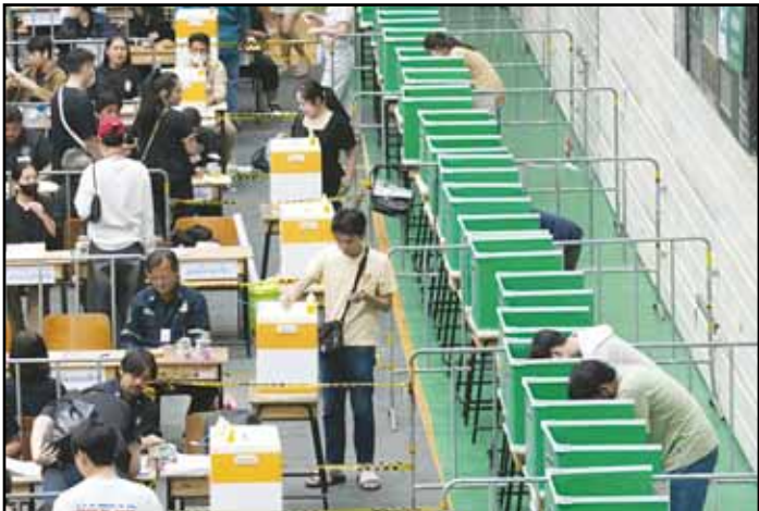
Voters cast their ballot at a polling station during a general election in Bangkok on Feb 8. (AP)

BANGKOK, Feb 8, (AP): Vote counting was underway in Thailand’s early general election on Sunday, seen as a three-way race among competing visions of progressive, populist and old-fashioned patronage politics. The battle for support from 53 million registered voters came against a backdrop of slow economic growth and heightened nationalist sentiment. While more than 50 parties contested the polls, only three – the People’s Party, Bhumjaithai, and Pheu Thai – have the nationwide organization and popularity to gain a winning mandate. A simple majority of the 500 elected lawmakers selects the next prime minister. Local polls consistently project that no single party will gain a majority, necessitating the formation of a coalition government. Although the progressive People’s Party is seen as favored to win a plurality, its reformist politics aren’t shared by its leading rivals, which may freeze it out by joining forces to form a government. The People’s Party, led by Natthaphong Ruengpanyawut, is the successor to the Move Forward Party, which won the most seats in the House of Representatives in 2023, but was blocked from forming a government by conservative lawmakers and then forced to dissolve. “I think we will get the mandate