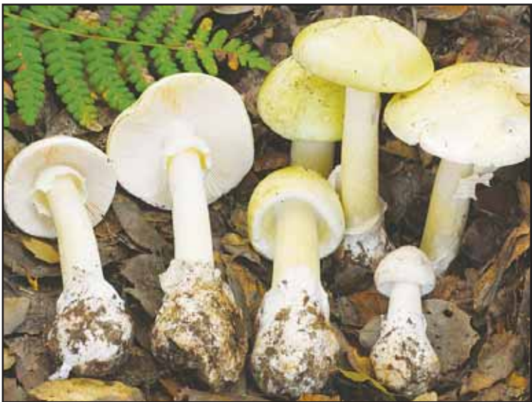
This photo provided by the California Department of Public Health shows Death Cap mushrooms. (AP)

Common complications include fever, dry cough, runny nose, sore throat and inflamed eyes. The disease can be prevented by immunization.