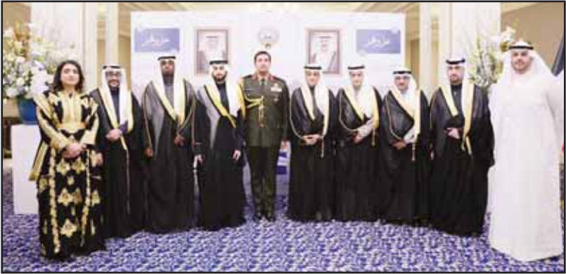
Kuwaiti embassy staff in Belgium mark National Day and Liberation Day.

KUWAIT CITY, Feb 8, (KUNA): The embassies of Kuwait in Belgium, Mongolia, Czech and Jakarta organized receptions to mark Kuwait's 65th anniversary of the National Day and the 35th anniversary of the Liberation Day, drawing several officials and diplomats.