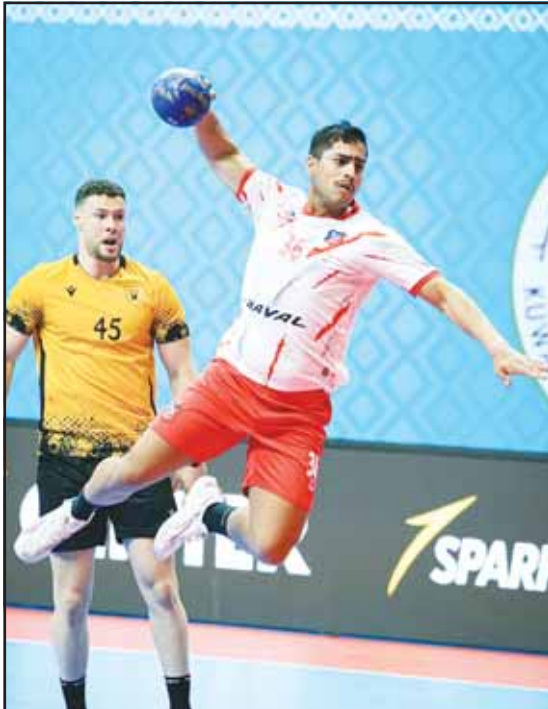
Kuwait Club player is unmarked as he makes a goal attempt.

The tenth round of the second phase is scheduled for tomorrow and the day after, with Kazma facing Al-Qadsia, Al-Salmiya taking on Kuwait Club, Burgan playing Al-Nasr, and Al-Sulaibikhat clashing with Al-Arabi to close the round.