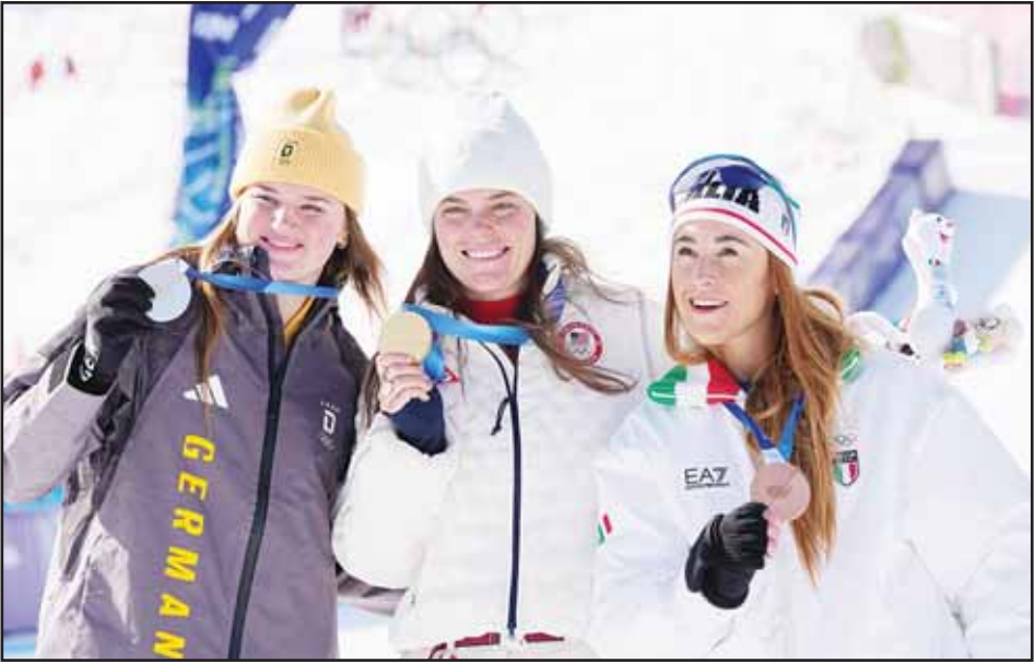
United States’ Breezy Johnson, center, gold medal in an alpine ski women’s downhill race, silver medalist Germany’s Emma Aicher, left, and bronze medalist Italy’s Sofia Goggia, show their medals, at the 2026 Winter Olympics, in Cortina d’Ampezzo, Italy.

CORTINA D’AMPEZZO, Italy, Feb 8, American ski racer Breezy Johnson won the Olympic downhill Sunday with a hard-charging run on a day marred by teammate Lindsey Vonn’s crash that saw her being taken off the mountain in a helicopter. Johnson was the sixth racer and found speed with a risk-taking trip along the iconic Olympia delle Tofana course on a sunny day in Cortina. She was in the leader’s box when Vonn, the No. 13 racer, cut a corner too close and was spun around before crashing. The race was put on hold for more than 20 minutes. The 30-year-old Johnson joins Vonn, 41, as the only American women to win the Olympic downhill. Johnson finished in 1 minute, 36.10 seconds to hold off Emma Aicher of Germany by just.04 seconds, securing the first medal for the United States of these Winter Games in the process. Italy’s Sofia Goggia, the 2018 Olympic downhill winner and 2022 silver medalist, finished with the bronze. Now, she’s an Olympic downhill gold medalist. Teammate Jacqueline Wiles finished just.27 seconds away from a medal in a tie for fourth place.