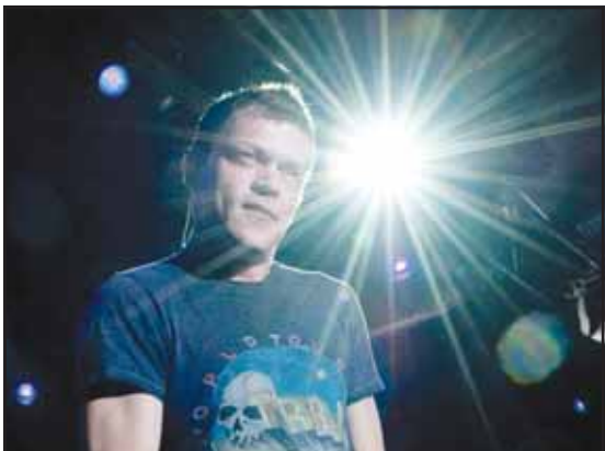
Singer Brad Arnold of the U.S. rock band 3 Doors Down takes to the stage at the opening concert of their German tour in the Columbiashalle in Berlin, on Feb. 21, 2012.