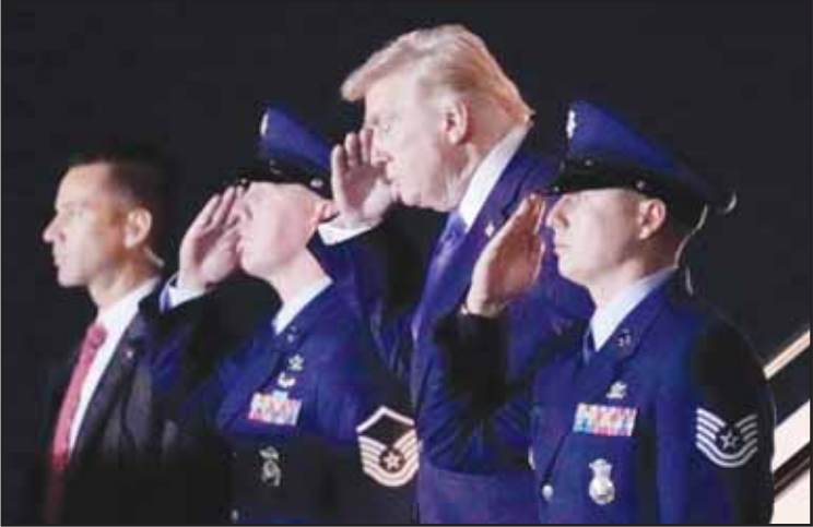
US President Donald Trump arrives on Air Force One on Feb 6, at Palm Beach International Airport in West Palm Beach, Fla.