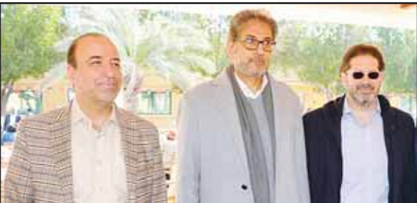
Iranian Ambassador with Libyan and Syrian Ambassadors.