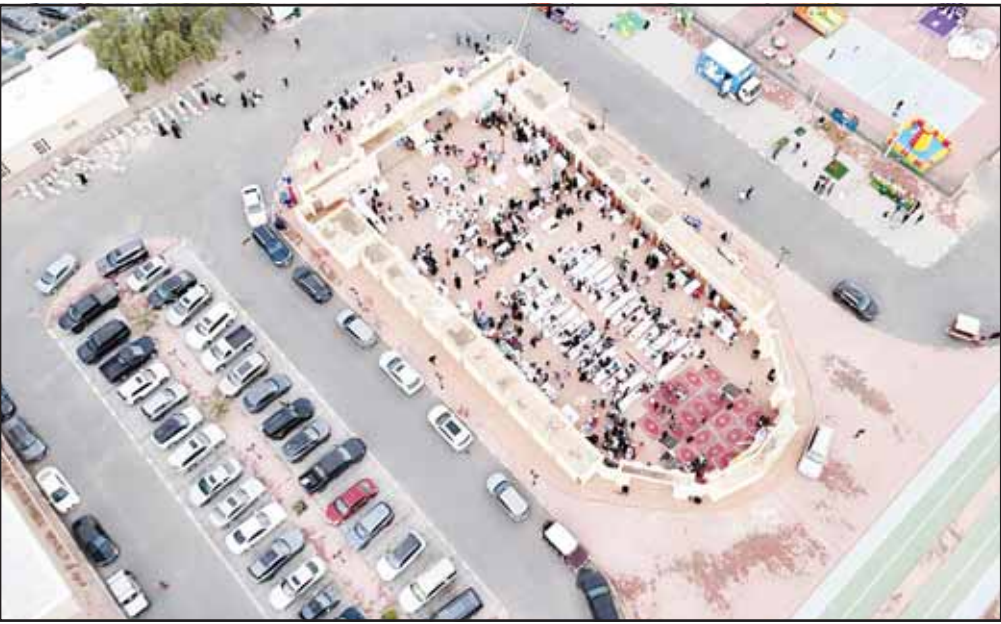
Part of the events.

In line with Kuwait Vision 2035, “New Kuwait,” and its commitment to collaboration with national stakeholders, Gulf Bank continues to advance sustainability across environmental, social, and governance (ESG) dimensions.