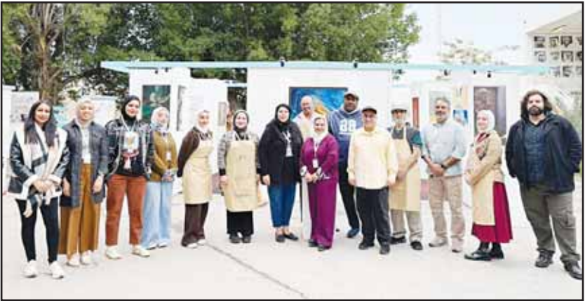
A group photo of the Kuwaiti artists participating in the exhibition.

overseen by the Communications and Information Technology Regulatory Authority. In December, the Authority entered a land lease agreement with Google for the establishment of data centers for cloud computing services. The objective of this agreement is to strengthen the nation’s digital infrastructure and propel digital transformation in the public and private sectors by delivering advanced and secure cloud solutions. The cloud centers are slated for construction in Sulaibiya, North Saad Al-Abdullah City and Mutlaa, while the total budget for the three main substations is KD22 million.