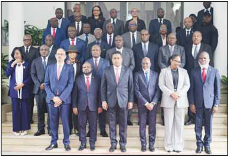
Haiti’s Prime Minister Alix Didier Fils-Aimé, front row, left, and his cabinet pose for a group photo with members of the presidential council at a ceremony marking the end of their almost two-year rule, in Port-au-Prince on Feb 7. (AP)

PORT-AU-PRINCE, Haiti, Feb 8, (AP): Haiti’s presidential council stepped down on Saturday after almost two years of tumultuous rule alongside a US-backed prime minister, who is expected to remain in power as the country prepares for the first general elections in a decade. Days before the nine-member council was dissolved, the U.S. deployed a warship and two U.S. Coast Guard boats to waters near Haiti’s capital, where gangs control 90% of Port-au-Prince. “The naval presence appears to provide the latest proof of Washington’s willingness to use the threat of force to shape politics in the Western Hemisphere,” said Diego Da Rin, an analyst with the International Crisis Group. In late January, two of the council’s most influential members announced that a majority had voted to oust Prime Minister Alix Didier Fils-Aimé, defying calls from the U.S. government to uphold the country’s fragile political stability. Days later, the U.S. government announced visa revocations for four unidentified council members and a Cabinet minister. The council’s plan to oust Fils-Aimé for reasons not made public appeared to fall to the wayside as it stepped down