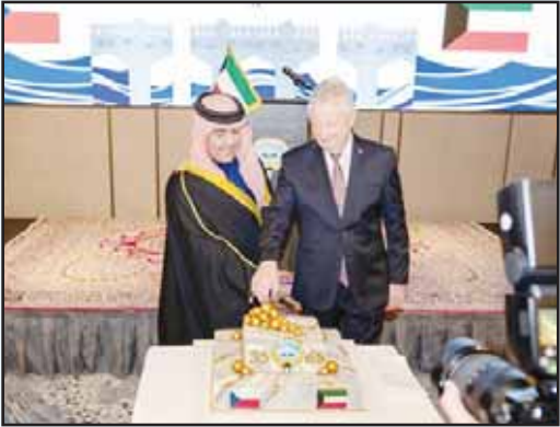
Cake-cutting ceremony in Czech