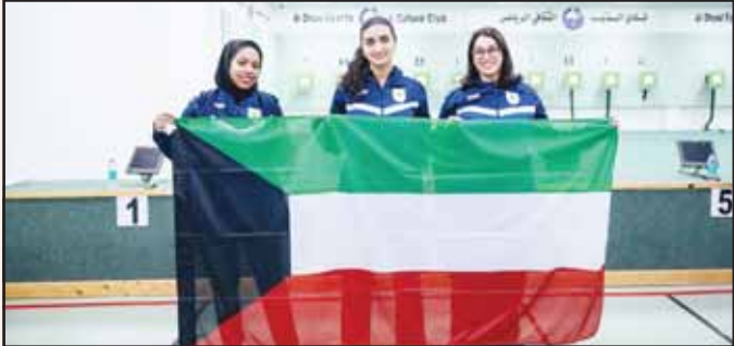
The shooting team celebrates with the national flag.