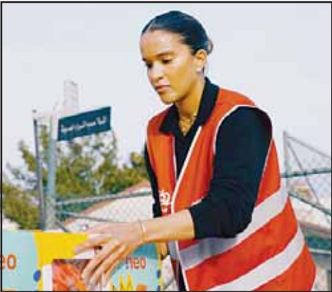
A bank employee distributes gifts to children.