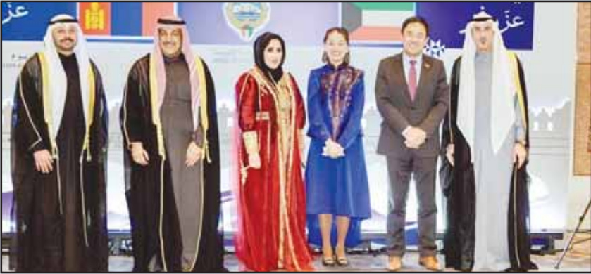
Kuwait Embassy staff in Mongolia.

In Mongolia, the Kuwaiti Embassy held a reception to celebrate the country's national festivals in the presence of Mongolian Minister of Food, Agriculture and Light Industries Enkhbayar Jadamba, Minister of Industry and Mineral Resources Damdinnyam Gongor and a number of businessmen, diplo-