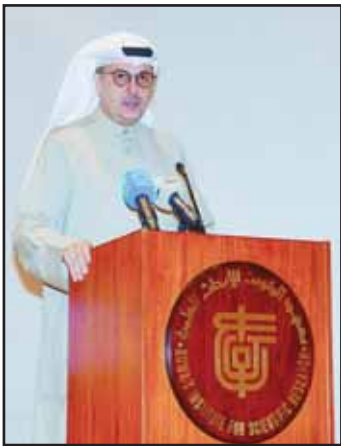
Minister of Electricity, Water and Renewable Energy Dr. Subaih Al-Mukhaizeem

Al-Mukhaizeem made the statement at the opening of the 'European Union-Kuwait Green Transition Forum', which was organized by Kuwait Institute for Scientific Research (KISR) in coordination with the EU-GCC Cooperation Project on the Green Transition and under the sponsorship of the Supreme Energy Committee.