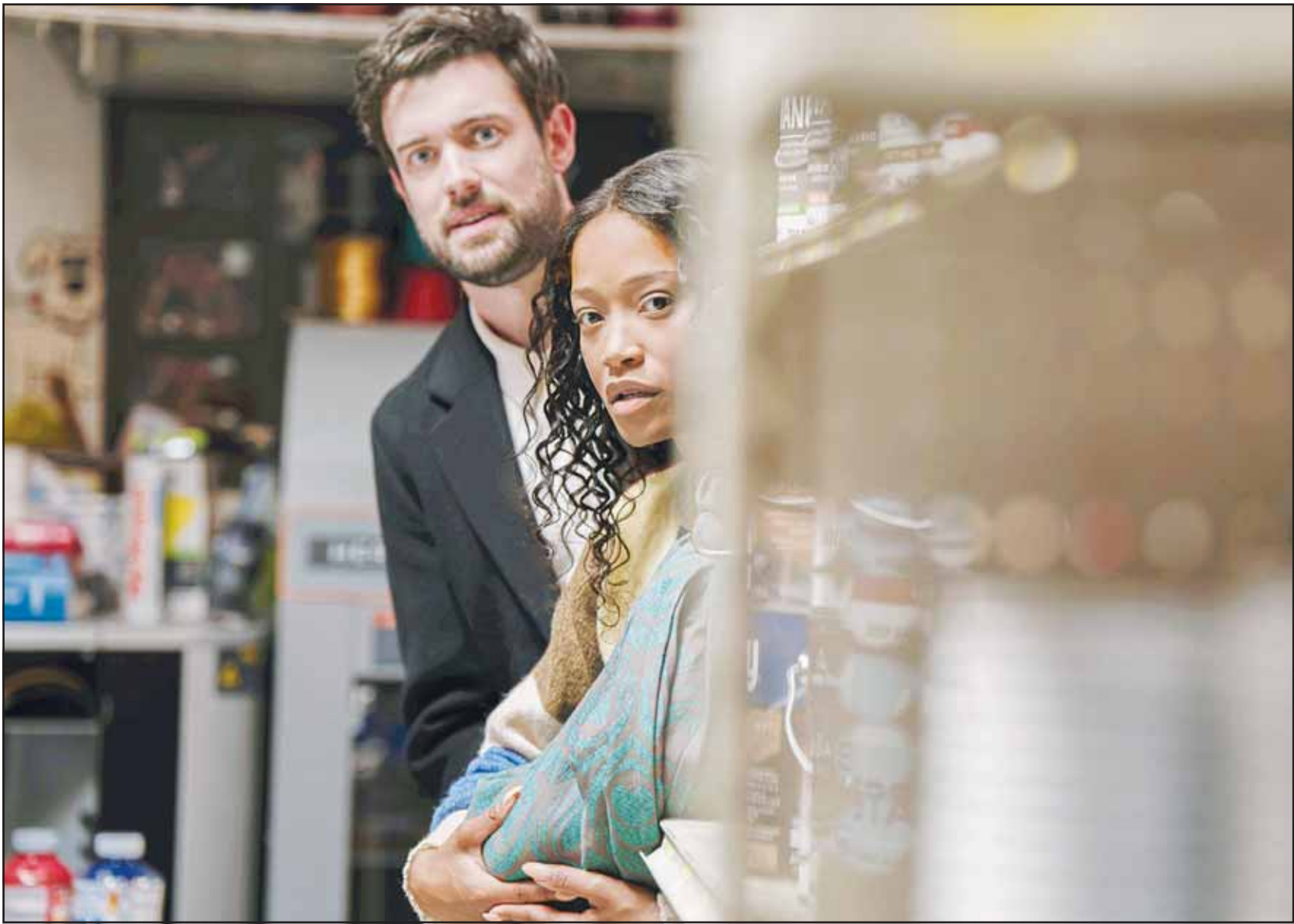
This image released by Peacock shows Jack Whitehall, (left), and Keke Palmer in a scene from 'The 'Burbs.'