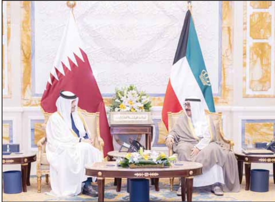
HH the Amir receives Qatari Prime Minister and Minister of Foreign Affairs.