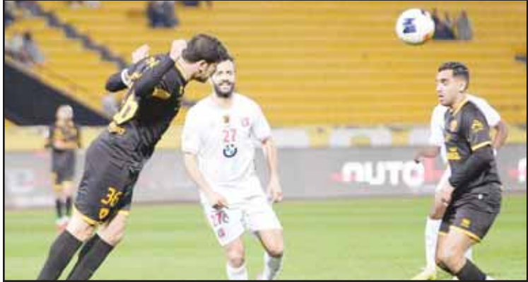
Al-Qadsia attempts to score during a league match against Kuwait Club.