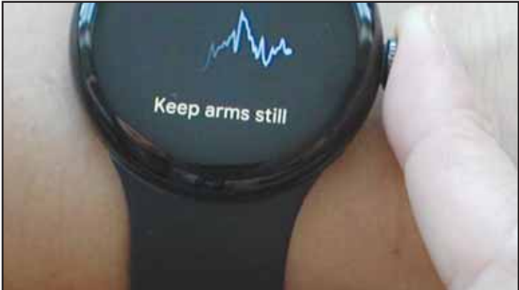
Experts say smartwatches and other devices that can detect erratic heartbeats are one reason A-fib diagnoses are increasing.

In 2024, the FDA said that GLP-1 drugs were no longer in a shortage, which was expected to put an end to the compounding.